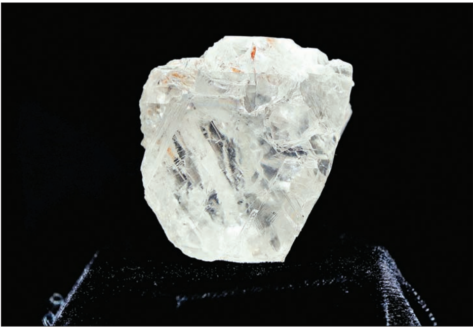
The 1109 carat "Lesedi La Rona" diamond is displayed in a case at Sotheby's in the Manhattan borough of New York, US on 4 May, 2016.

The price paid was an "improvement" on the highest bid received for the diamond at a Sotheby's