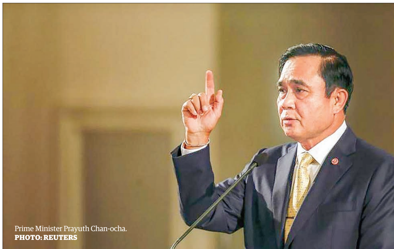
Prime Minister Prayuth Chan-ocha.

for corruption. Thai authorities investigating how she escaped said last week they have questioned three police officers who admitted to helping Yingluck flee.-- Reuters ■