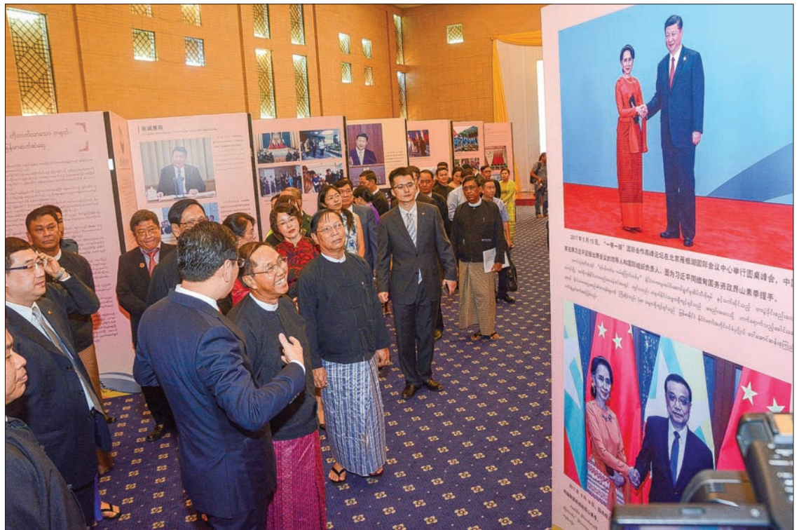
Vice President U Myint Swe looks at documentary photos at the grand reception to mark the 68th Anniversary of the Founding of the People's Republic of China.

tended by Deputy Commander-in-Chief of Defence Services Commander-in-Chief (Army)