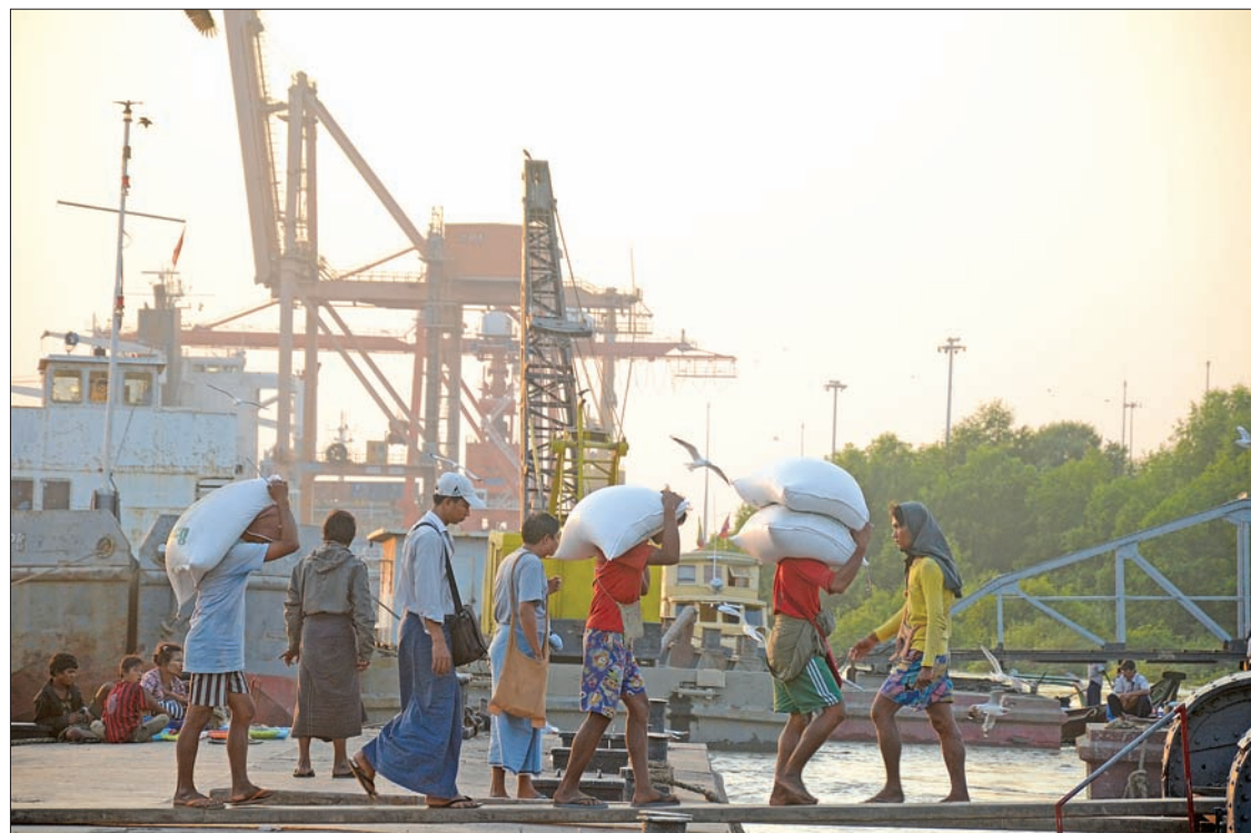
Workers unloading sacks of rice from a ship at a jetty in Yangon.

New shipments of low-quality rice to local mar-