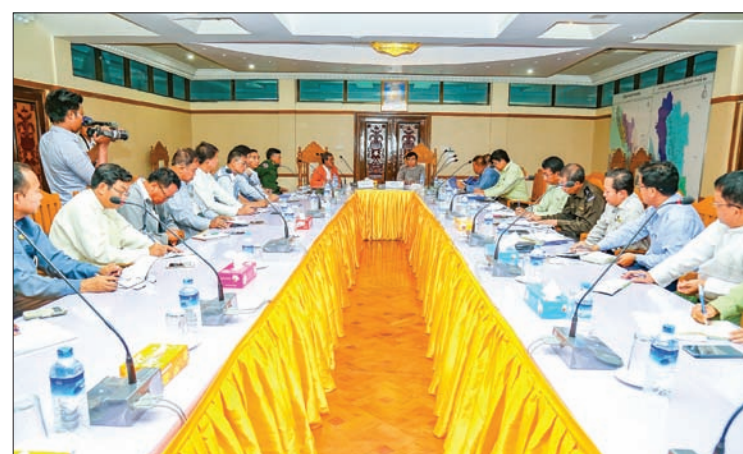
Union Minister Dr Win Myat Aye and Rakhine State Chief Minister U Nyi Pu attend the meeting on effective implementation by Red Cross Movement in Sittway, Rakhine State.

In the coordination meeting, a draft on the Standard Operation Procedure (SOP) of the Red Cross Movement was discussed.—Myanmar News Agency ■