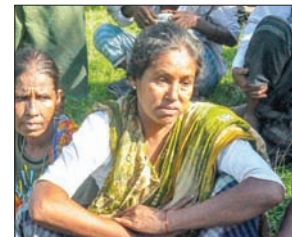
Mardoori, Khamaungseik Village (south).