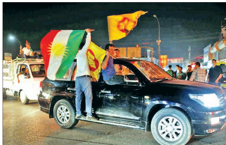
Kurds celebrate to show their support for the independence referendum in Erbil, Iraq on 25 September, 2017.