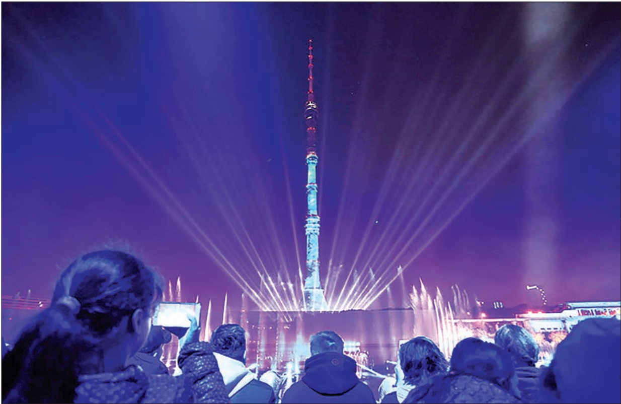
Ostankino TV Tower seen during the 2017 Circle of Light International Festival.

The meeting is one of the four high-level dialogues established during the Mar-a-Lago meeting between Chinese President Xi Jinping and US President Donald Trump in Florida in April. At that meeting, the two sides agreed to establish high-level dialogue mechanisms, including the diplomatic and security dialogue, the comprehensive economic dialogue, the law enforcement and cybersecurity dialogue, and the social and people-to-people dialogue.—Xinhua ■