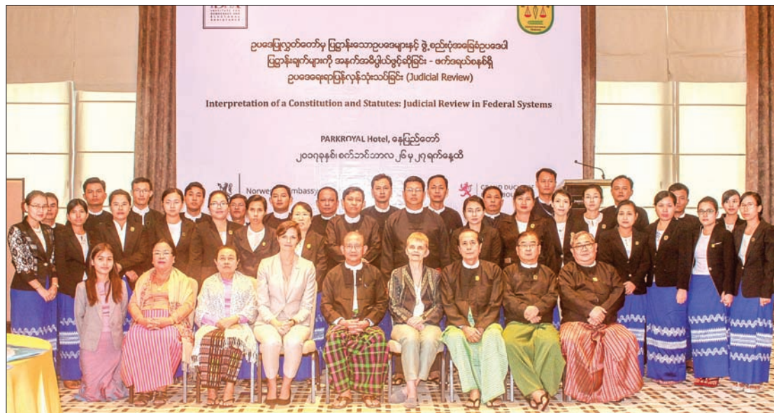
Members of Constitutional Tribunal of the Union and participants pose for a documentary photo after the discussion on Judicial Review in Federal System in Nay Pyi Taw.

The Constitutional Tribunal of the Union and International Institute for Democracy and Electoral Assistance (IDEA) conducted "Interpretation of a Constitution and Statutes: Judicial Review in Federal System" at Park Royal Hotel, Nay Pyi Taw yesterday.