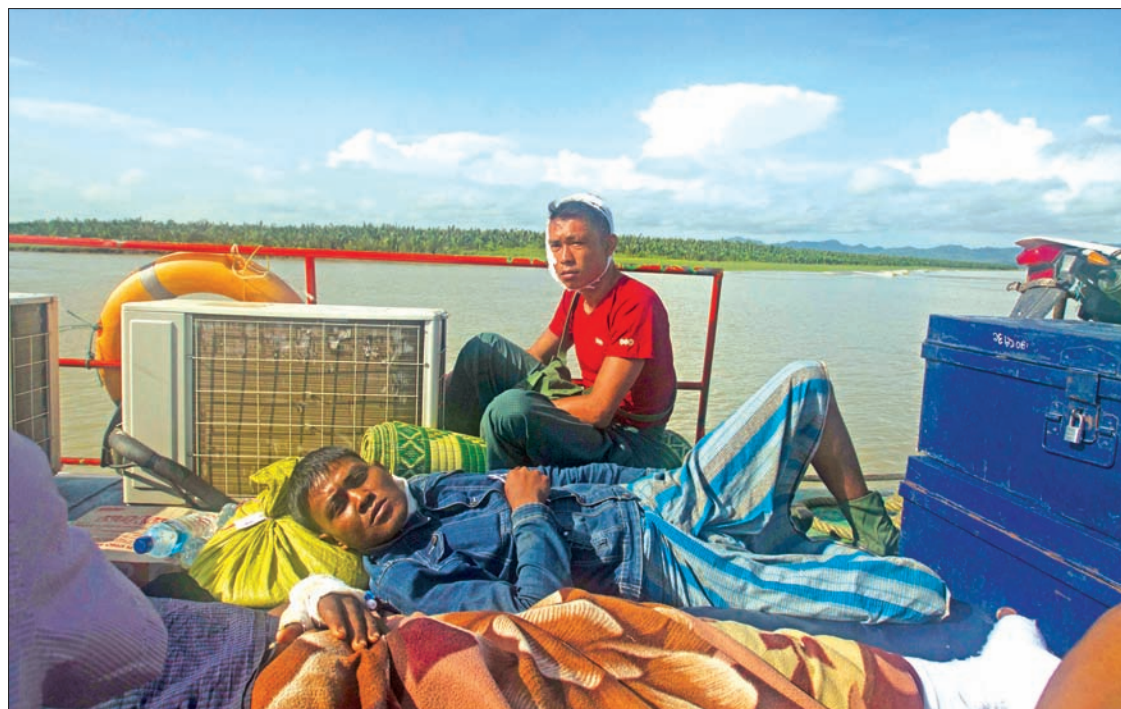
Villagers injured in terrorist attacks in northern Rakhine are seen on their way to Sittway for medical treatment.

The shock and disbelief that such a devastating situation has occurred, and the hopes and wishes that it would