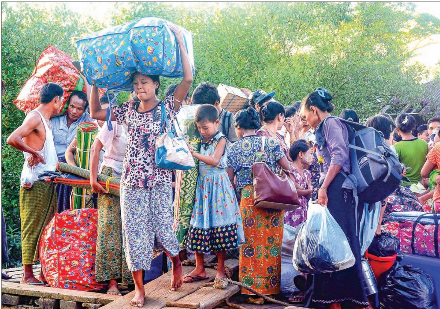
Ethnic Rakhine begin the journey back to their villages yesterday from Sittway after violence in northern Rakhine subsided.