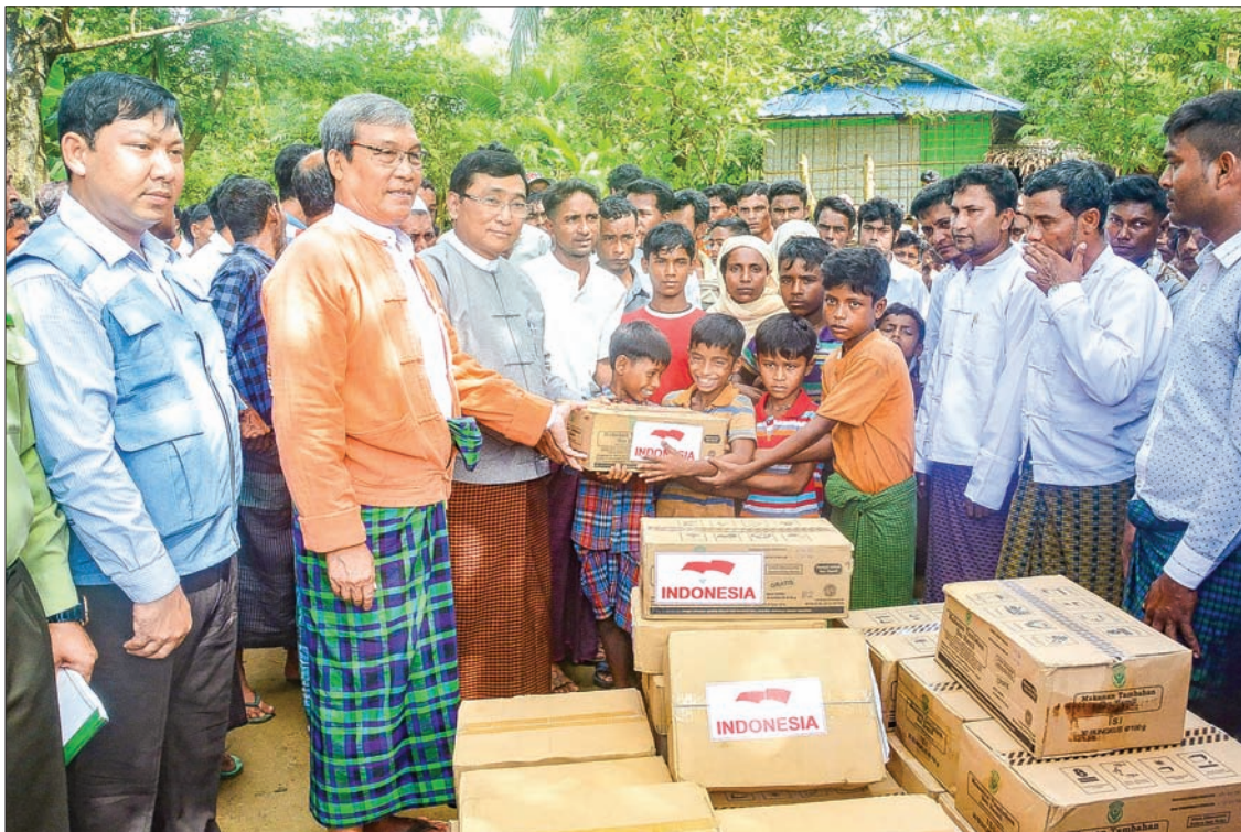
Union Minister Dr Win Myat Aye and Rakhine State Chief Minister U Nyi Pu present foods and cash donated from Indonesia in Yathedaung Township on 26 September.

Foods and aid donated by Indonesia delivered to people in Zaytipyin, Thayagone and Anautpyin villages in Yathedaung Township yesterday.