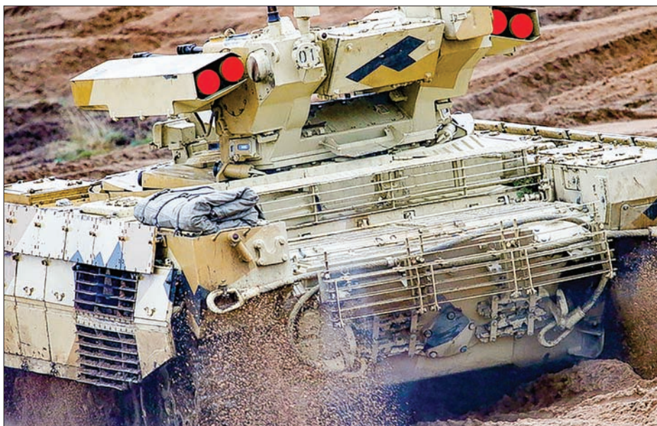
The vehicle is equipped with two 30mm-caliber 2A42 autocannons and a 7.62mm-caliber PKTM twin-mount machine gun.