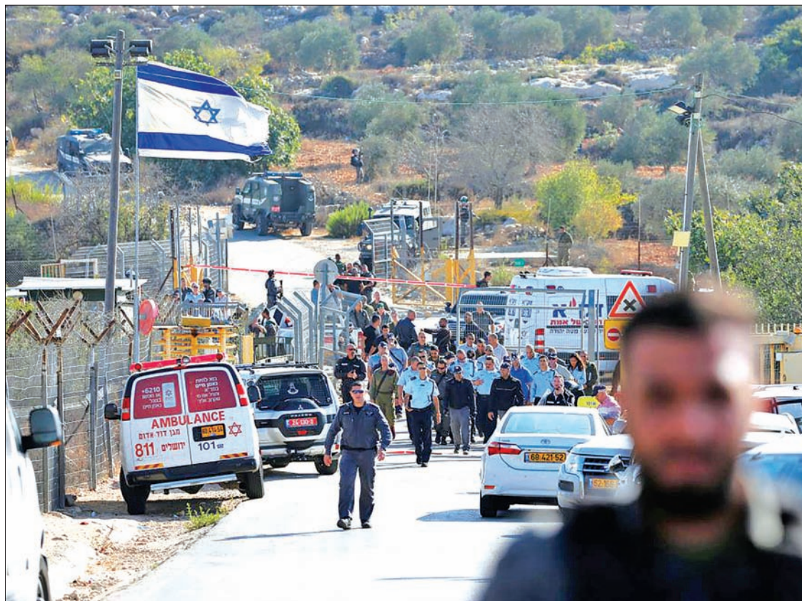
Israeli security personnel work at the scene where a policewoman said a Palestinian gunman killed three Israeli guards and wounded a fourth in an attack on a Jewish settlement in the occupied West Bank before himself shooting dead on 26 September, 2017.

The man lived in the nearby Palestinian village of Beit Suriq, the police said. Prime Minister Benjamin Netanyahu said in public remarks to his cabinet that the man’s house would be demolished and any work permits issued to his relatives would be revoked. —Reuters ■