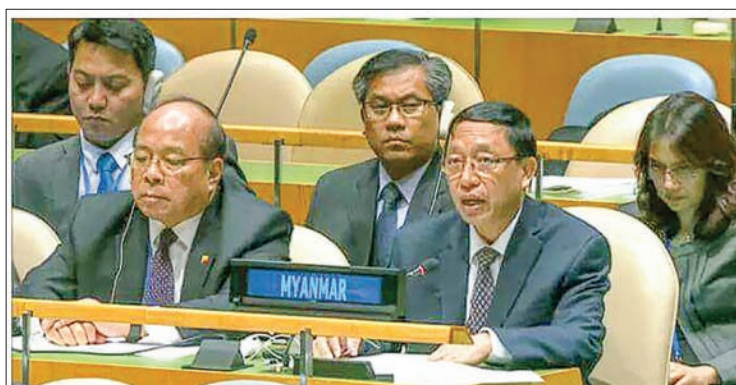
Ambassador U Hau Do Suan, Permanent Representative of Myanmar to UN speaks at the UN General Assembly in New York.

The International Criminal Court defines crimes against humanity as acts including murder, torture, rape and deportation "when committed as part of a widespread or systematic attack directed against any civilian population, with knowledge of the