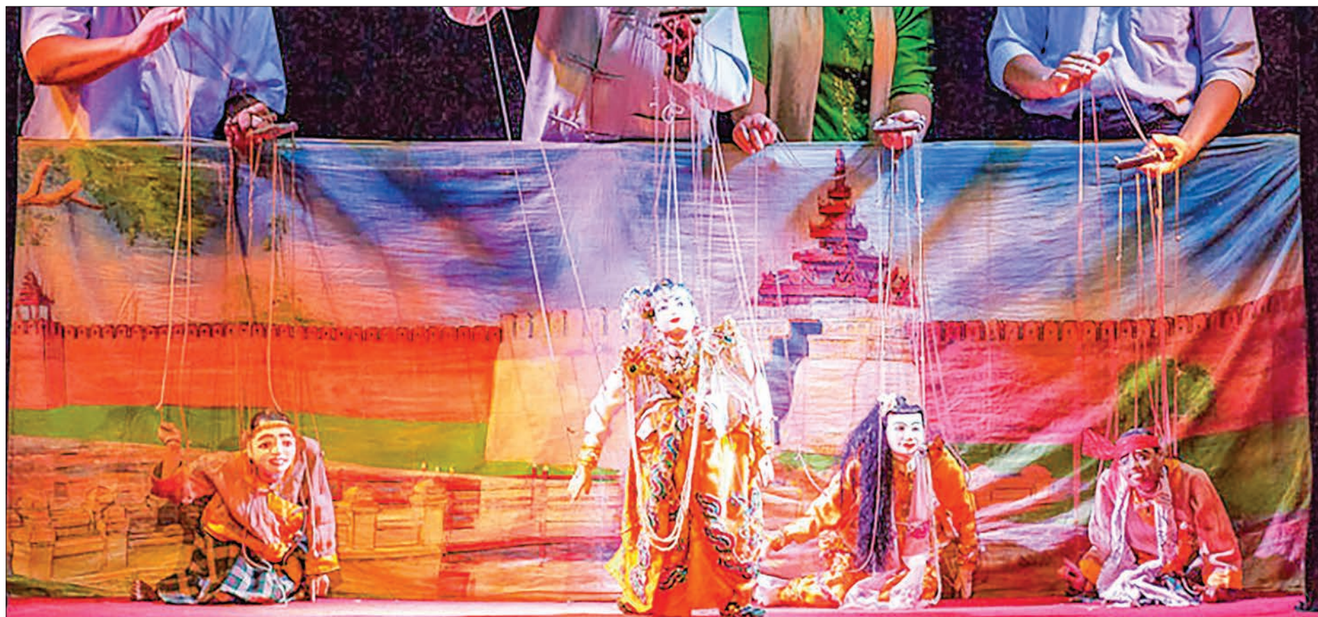
A Myanmar puppet performance in Mandalay.

Provided that genuine Myanmar arts are to be exhibited in the international sphere, Myanmar Orchestra and Puppet will occupy the top place on the totem pole of Myanmar traditional arts. Globe trotters are more interested in genuine Myanmar classical songs rather than Myanmar modern music which are mostly exotic versions. Among them, they like most Myanmar