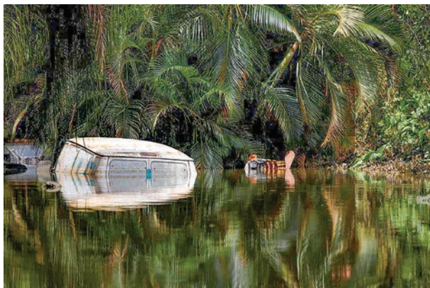
A car submerged in flood waters is seen close to the dam of the Guajataca lake after the area was hit by Hurricane Maria in Guajataca, Puerto Rico, on 23 September 2017.