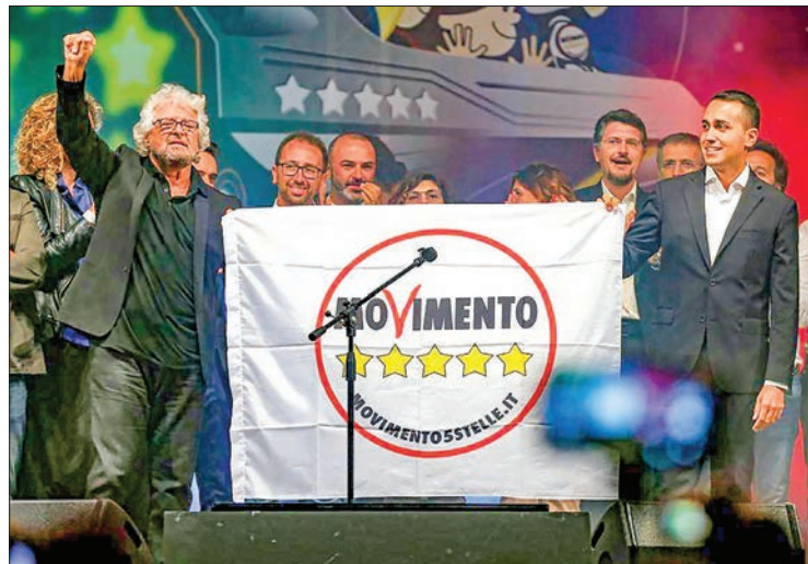
5-Star movement founder Beppe Grillo (L) and Luigi Di Maio hold the banner of the movement during a gathering in Rimini, Italy, on 23 September 2017.

Grillo, who has so far acted as 5-Star's de facto chief, is now