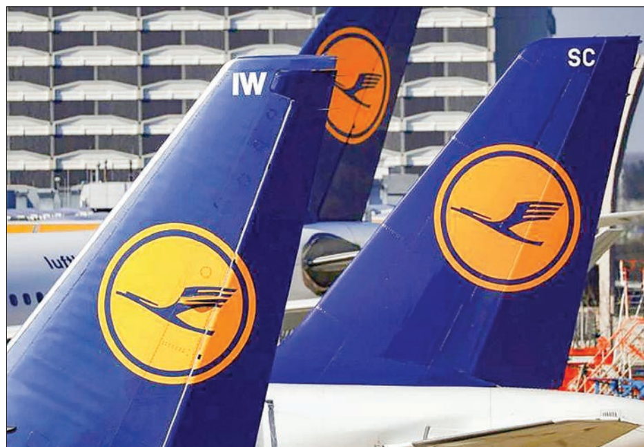
Planes of the Lufthansa airline stand on the tarmac in Frankfurt airport, Germany, in 2016.

Severe flooding, structural damage to homes and virtually no electric power were three of the most pressing problems facing Puerto Ricans, said New York Governor Andrew Cuomo during a tour of the island. "It's a terrible immediate situation that requires assistance from the federal government — not just financial assistance," said Cuomo, whose state is home to millions of people of Puerto Rican descent. "It is a dangerous situation today and it's going to be a long-term reconstruction issue for months," Cuomo, a Democrat and potential 2020 presidential candidate, told CNN. —Reuters ■