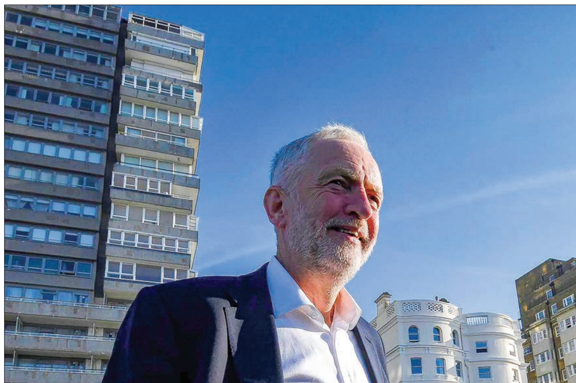
Britain's opposition Labour party leader Jeremy Corbyn arrives at a television studio to appear on the BBC Andrew Marr politics programme during the Labour party Conference in Brighton, Britain, on 24 September 2017.

"We have watched with dismay as the government has used a narrow referendum result to justify an extreme approach to