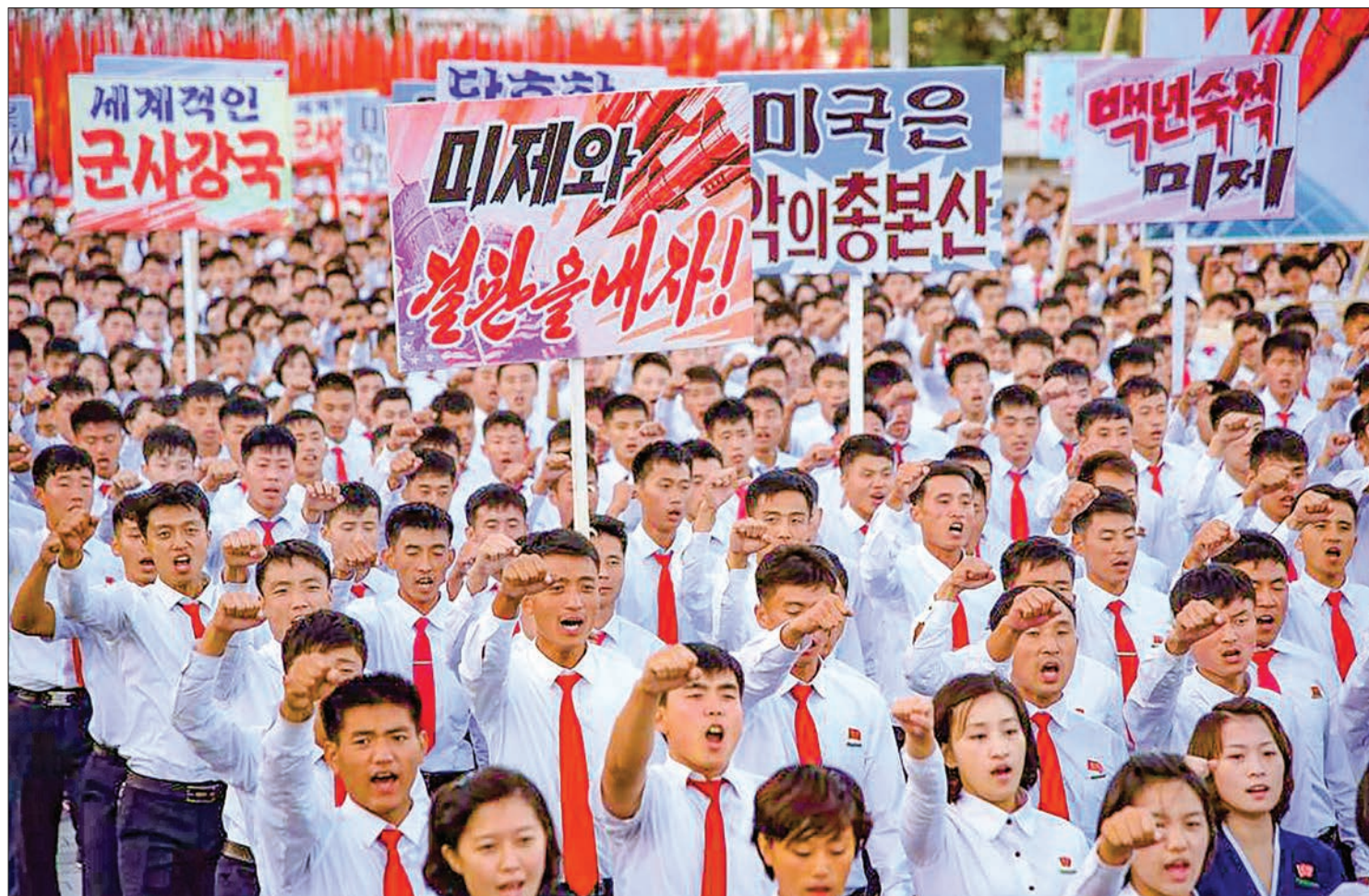
An anti-US rally at Kim Il Sung Square is seen in this 23 September 2017 photo released by North Korea's Korean Central News Agency (KCNA) in Pyongyang, on 24 September 2017.