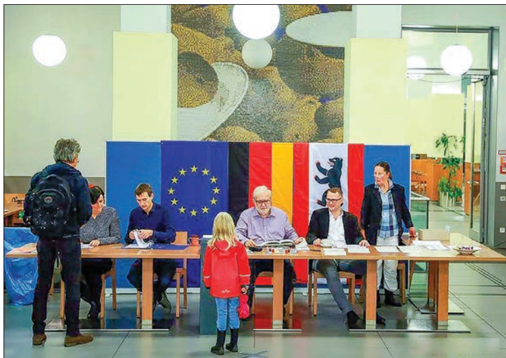
Working staff help voters to cast ballot at a polling station in Berlin, Germany, on 24 September 2017.

"We work too long. We have to retire at 67 years old to get our pensions," a voter said anonymously to Xinhua. — Xinhua ■