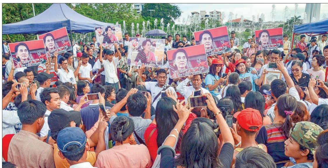
A large number of people showing the solidarity with State Counsellor Daw Aung San Suu Kyi in Yangon.