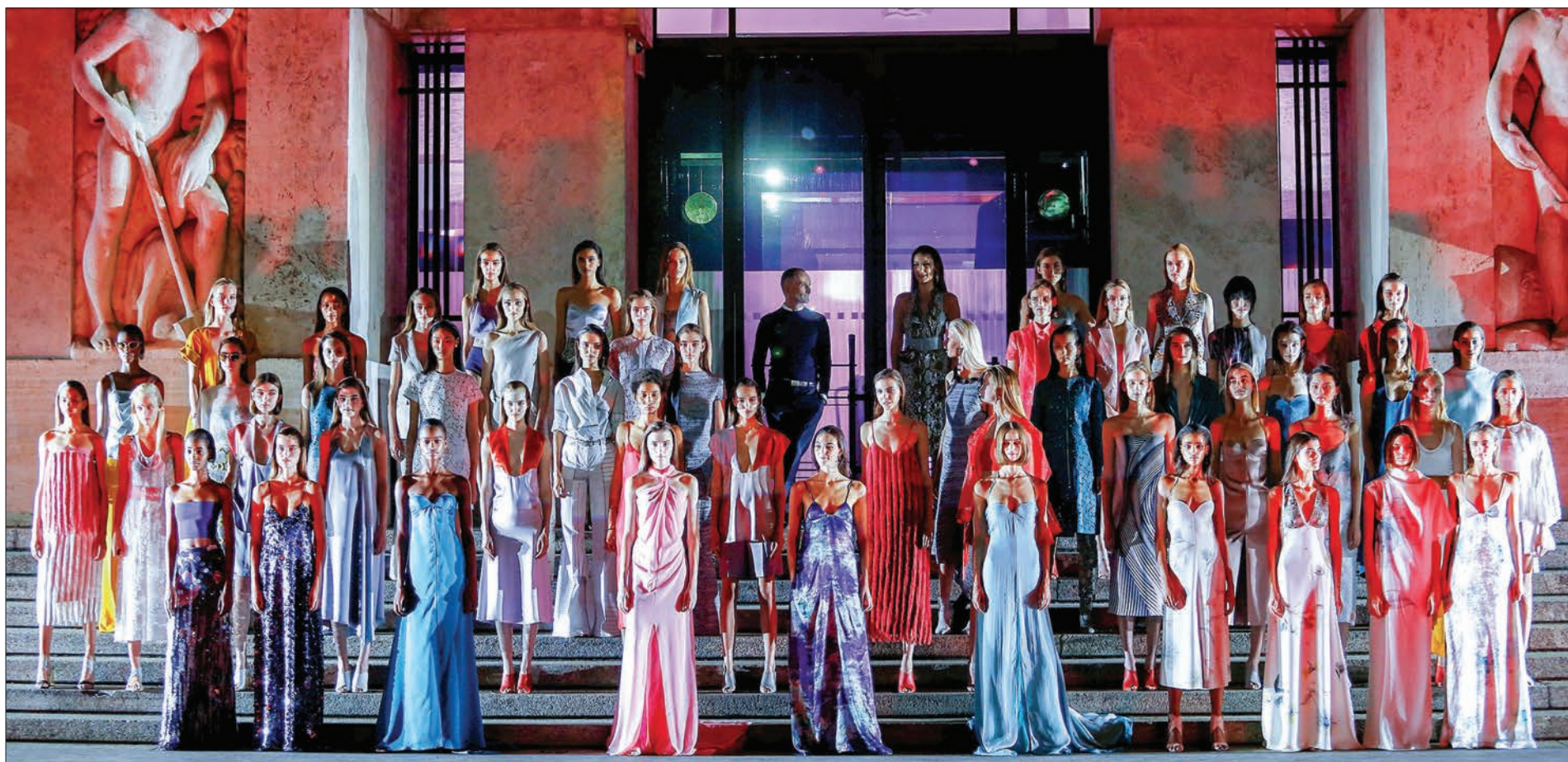
Models parade in front of Milan's stock exchange at the end of the Salvatore Ferragamo Spring/Summer 2018 show at the Milan Fashion Week in Milan, Italy, on 23 September, 2017.