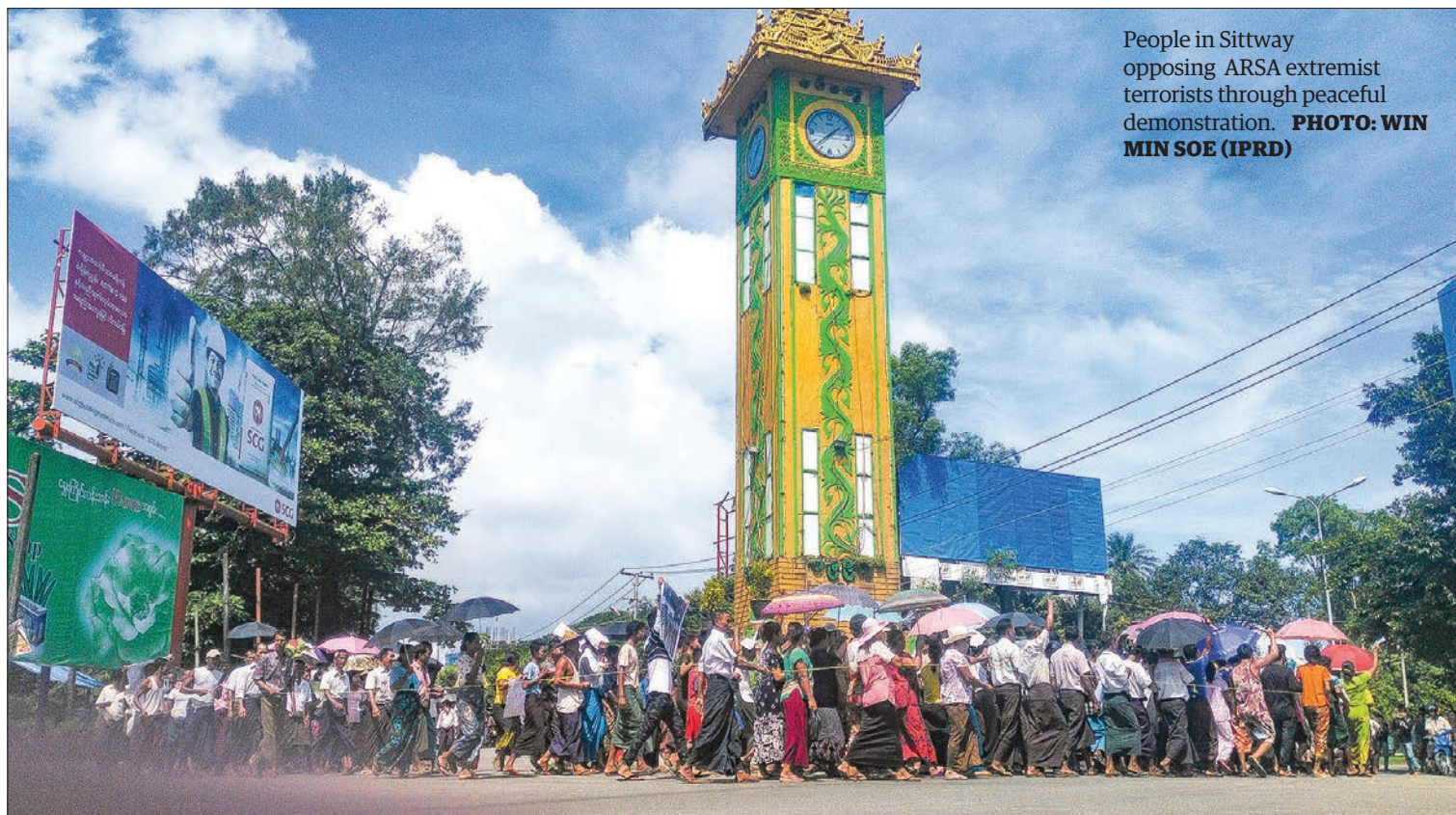
People in Sittway opposing ARSA extremist terrorists through peaceful demonstration.

Holding vinyl signboards and slogans condemning the terrorist activities, the demonstrators walked peacefully along Kyaung Tet street, U Uttama street, main road, clock tower circle, merchant street, Setyonesu street in Sittway and dispersed at 2:30 pm after arriving back to the starting place. ■