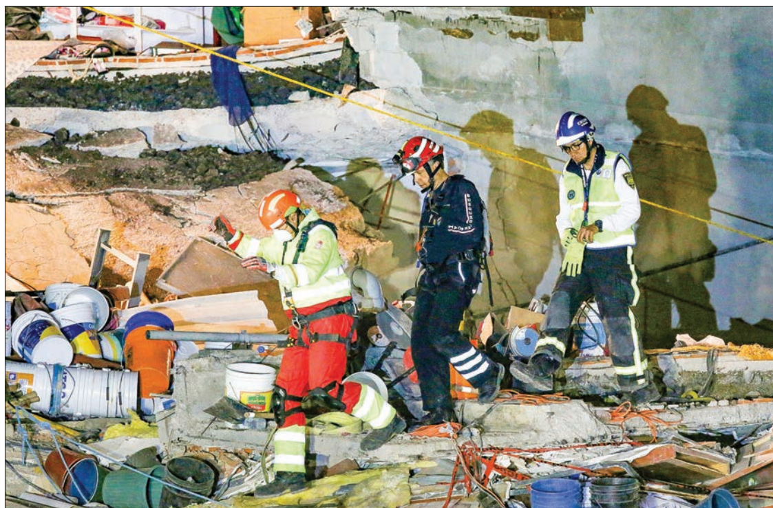
Members of rescue teams search for survivors in the rubble of a collapsed building after an earthquake in Mexico City, Mexico, on 24 September 2017.

Frustration has grown among the thousands left homeless by Tuesday's quake with critics saying the government reaction pales in comparison to an outpouring of volunteer support, from rescue work to food donations. When Tuesday's quake hit, Mexico was already reeling from a 7 September earthquake