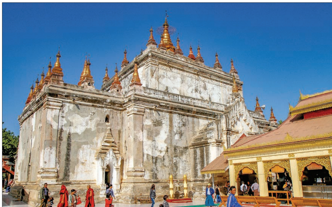
Manuha Temple in Bagan.

of ancient cave temple will take a long time. Nowadays, the Manuha Temple, which is located near Nagayon Temple,