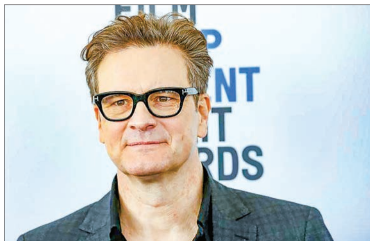
Actor Colin Firth arrives at the 2017 Film Independent Spirit Awards in Santa Monica, California, US, on 25 February, 2017.

"We never really thought much about our different pass-