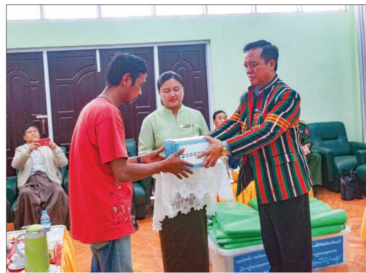
Chin State Chief Minister presents cash to a local.

The state chief minister and party then inspected the construction of Falam airport (Surbone) implemented by the Department of Civil Aviation. After explaining the working situation by officials, the state chief minister gave instruction to finish in time and carry out eradication of occupational hazard and fulfilled the needs.—State IPRD ■