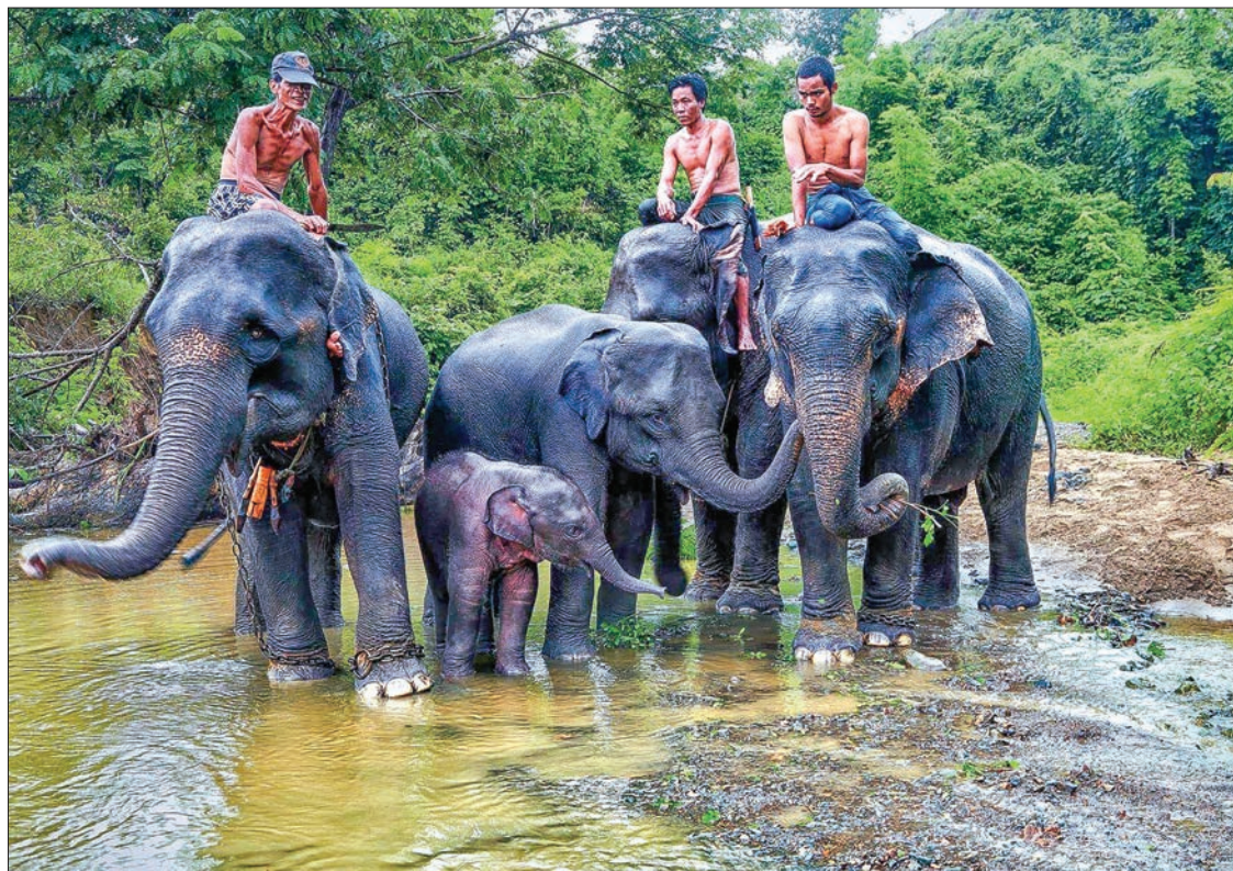
Mahouts seen cleaning elephants at the Winga Baw Elephant Camp near Yangon-Mandalay Highway.

Elephant bathing watch is also available between 7 a.m. and 8.30 p.m. daily. "We widely explain the natural characters and movements of the large mammal to the visitors while they visiting around the camp for observation purpose between 12 to 3 p.m. on a daily basis," said U Myint Soe.—GNLM ■