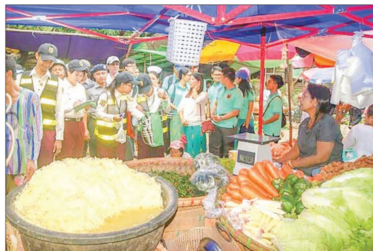
A surprise check finds contaminated foodstuff.

micelli and noodle produced by Mya Thidar food industry have been contaminated with formaldehyde out of 26 items, with 5 purified water factories in Wakema, Kyonmangay and Shwelaung found to have been unregistered. Those who produce for distribution of foodstuff unfit for health will be taken into legal actions, it was learnt. — Myanmar Digital News ■