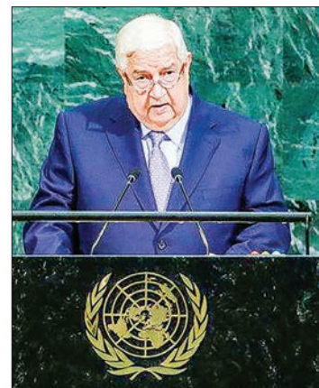
Deputy Prime Minister for Syrian Arab Republic Walid Al-Moualem addresses the 72 nd United Nations General Assembly at UN headquarters in New York, US, on 23 September 2017.

Moualem, who praised as constructive the role of Russia and Iran, which back Syrian President Bashar al-Assad, said Syria