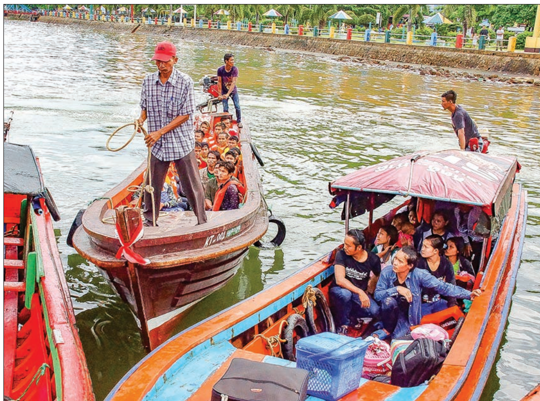
Myanmar migrant workers arriving back home from Thailand. PHOTO: KYAW SOE (KAWTHOUNG) ■

So far, total 2295 having no legal documents Myanmar migrant workers returned to Myanmar through Kawthoung Border Gate. —Kyaw Soe (Kawthoung) ■