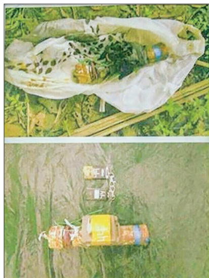
Photo shows pipe bomb defused by Security personnel.