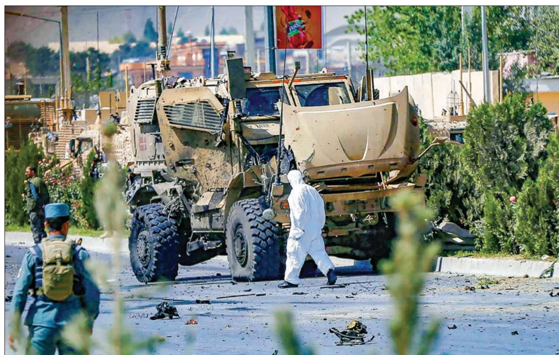
An Afghan official investigates a damaged Danish convoy at the site of a car bomb attack in Kabul, Afghanistan, on 24 September 2017.

Afghan security officials said a car bomb had been used in the attack on the convoy.—Reuters ■