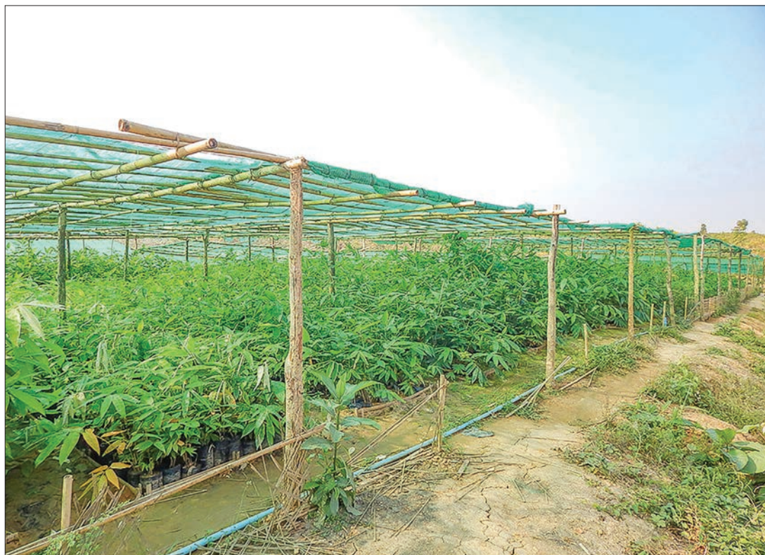
Bamboo plantation in the Hlaing Yoma Mountain reserve forest.