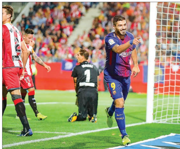
Barcelona's Luis Suarez celebrates their second goal scored by Girona's Gorka Iraizoz at Estadi Montilivi, Girona, Spain, on 23 September.

MADRID — Barcelona opened up a four-point gap at the top of La Liga, maintaining their 100 percent start as they cruised to a 3-0 victory at Catalan rivals Girona on Saturday.