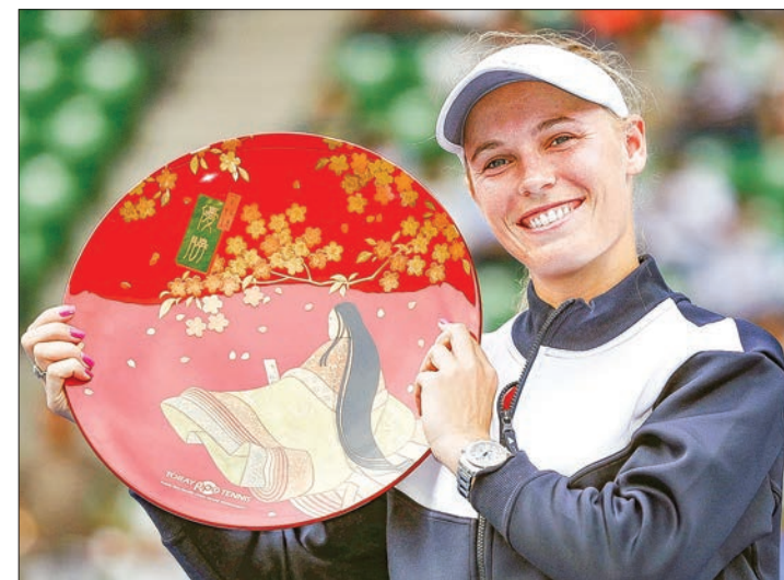
Caroline Wozniacki of Denmark celebrates after defeating Anastasia Pavlyuchenkova of Russia 6-0, 7-5 in the final of the Toray Pan Pacific Open at Tokyo's Ariake Colosseum, on 24 September 2017.

"I've won here in the past and it's a great court where I have great memories so I'm very happy."—Kyodo News ■