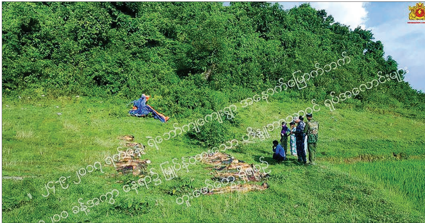
Remains of Hindus murdered by terrorists in Northern Rakhine State.