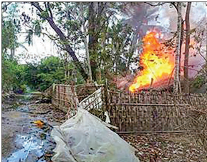
Abandoned houses on fire at a village in Maungdaw Township.

SECURITY forces while on their duty to ensure the rule of law in Tinmay village-tract searched an empty house of Abu Kalaung, 45, and its compound at Ward 2 of Tinmay village at 4:30 pm on 23 September. They were acting on information.