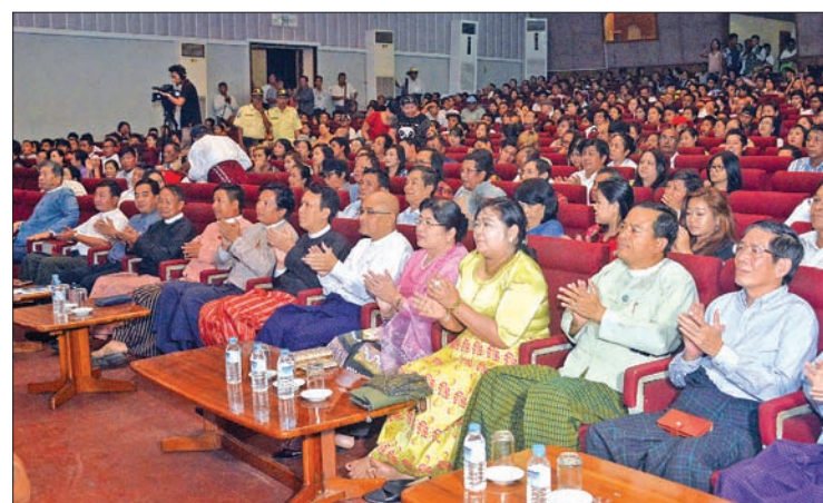
Dignitaries enjoy the contest of Anyeint troupes.