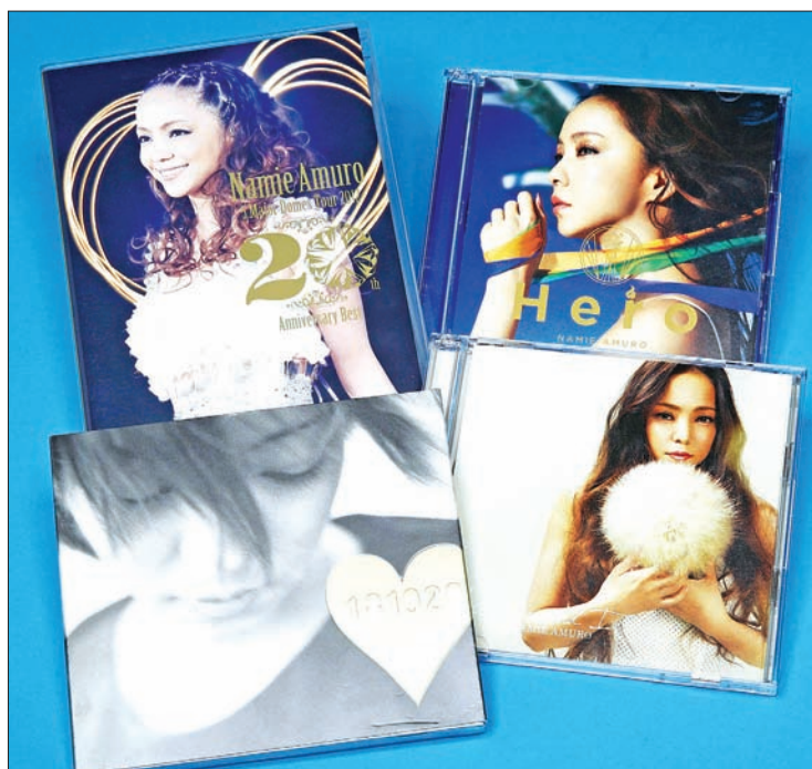
Photo taken 20 September, 2017, shows albums of Japanese pop singer Namie Amuro, who said the same day she will retire from show business in September 2018.

She also won music awards including the prestigious Japan Record Award for two years in a row and marked several mile-