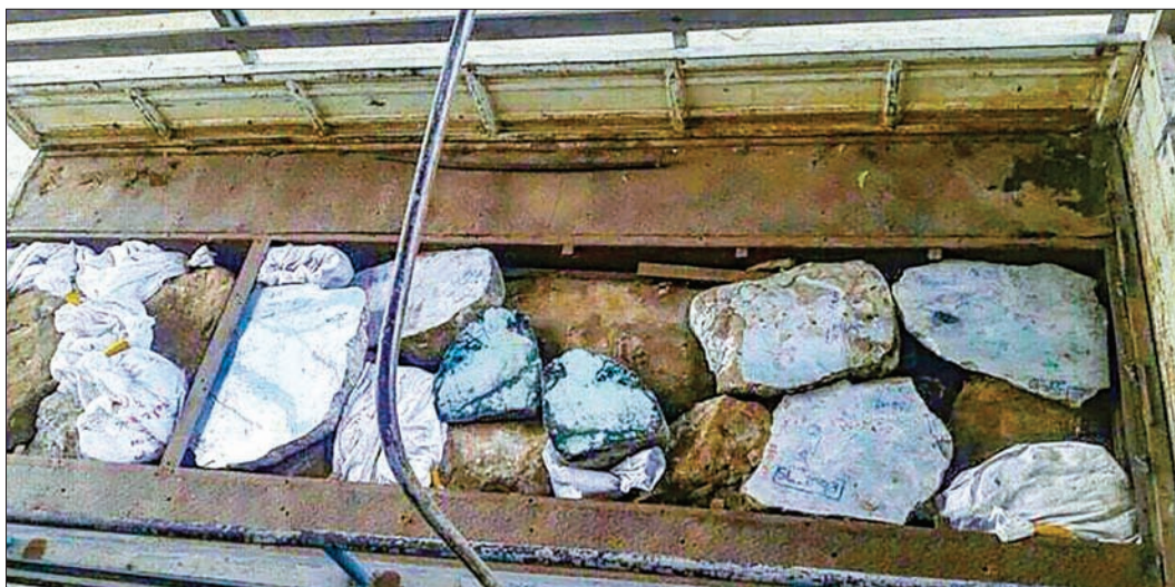
Jade stones of varying sizes seen on the illegal vehicle in northern Shan State.