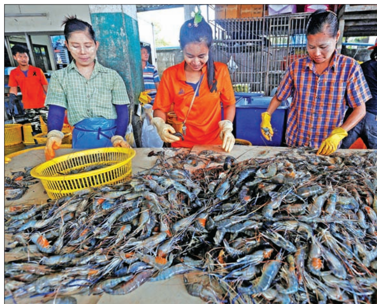
Workers from Myanmar sort shrimp at a wholesale market in Mahachai, in Samut Sakhon province, Thailand, in July 2017.

The Ministry's statement said that in addition to the six CI stations in Samut Sakhon (Mahachai) 1 and 2, Samut Prakan, Mae Sai, Mae Sot and Ranong, three more stations were opened in Chaing Mai, Nakhon Sawan and Songkhla.