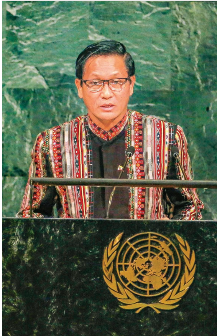
Vice President U Henry Van Thio addresses the 72nd United Nations General Assembly at U.N. headquarters in New York, U.S., on 20 September 2017.

Yesterday, the State Counsellor briefed the Diplomatic Corps on the government's efforts regarding national reconciliation and peace. She highlighted the achievements in the past 18 months and challenges that remain. In touching upon the situation in Rakhine, she said that Myanmar shares the concern of the international community regarding displacement and suffering of all communities affected by the latest round of terrorist attacks. She also stressed that "We condemn all human rights violations and unlawful violence. We are committed to the restoration of peace, stability and rule of law throughout the State. The security forces have been instructed to adhere strictly to the Code of Conduct in carrying out security operations, to exer-