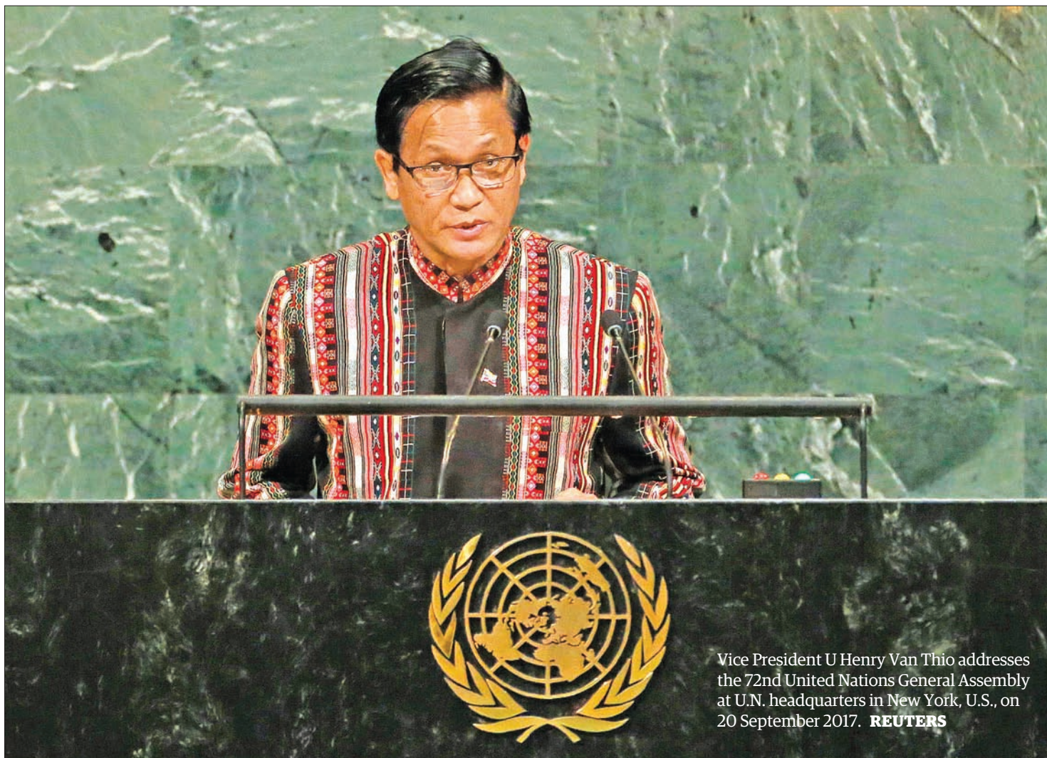
Vice President U Henry Van Thio addresses the 72nd United Nations General Assembly at U.N. headquarters in New York, U.S., on 20 September 2017.