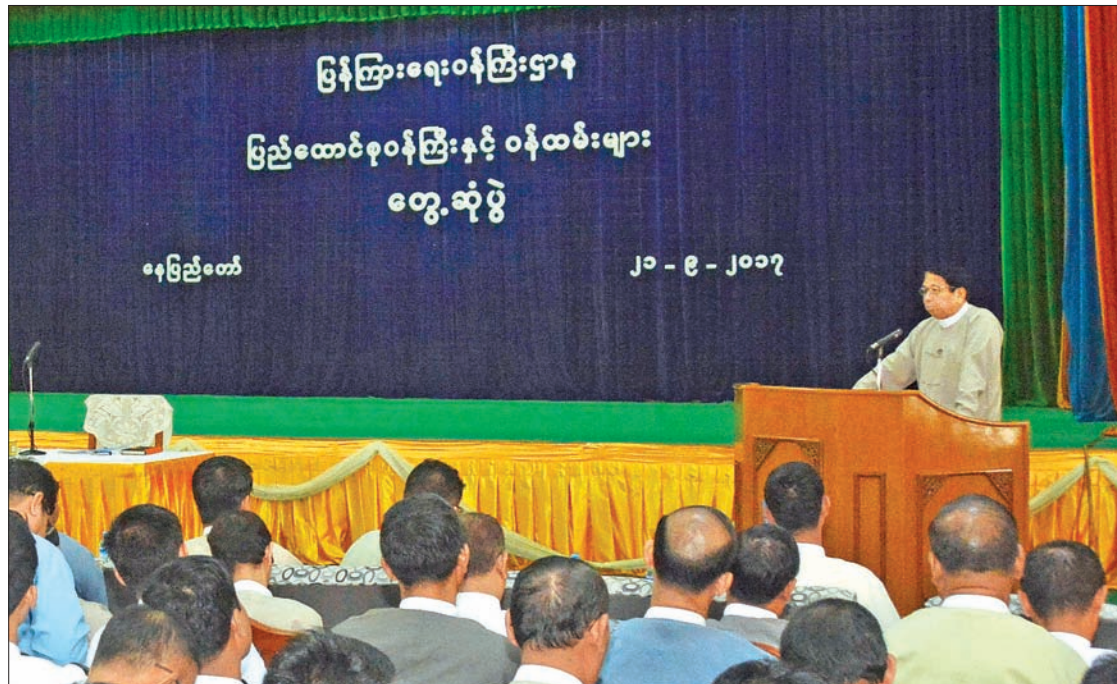
Union Minister Dr. Pe Myint delivers an opening speech at the meeting with staff from departments and enterprise under the ministry in Nay Pyi Taw on 21 September.

The presentations presented by those present at the ceremony included matters on extension of the set up of IPRD offices in districts and townships, detailed data collection on films, the supplying of books issued by Sarpay Beikman, the budget shortage for development in sports sector, the acquisition of daily allowances plus lodging fees for staff from other areas to come to Nay Pyi Taw on duty, appointment of daily