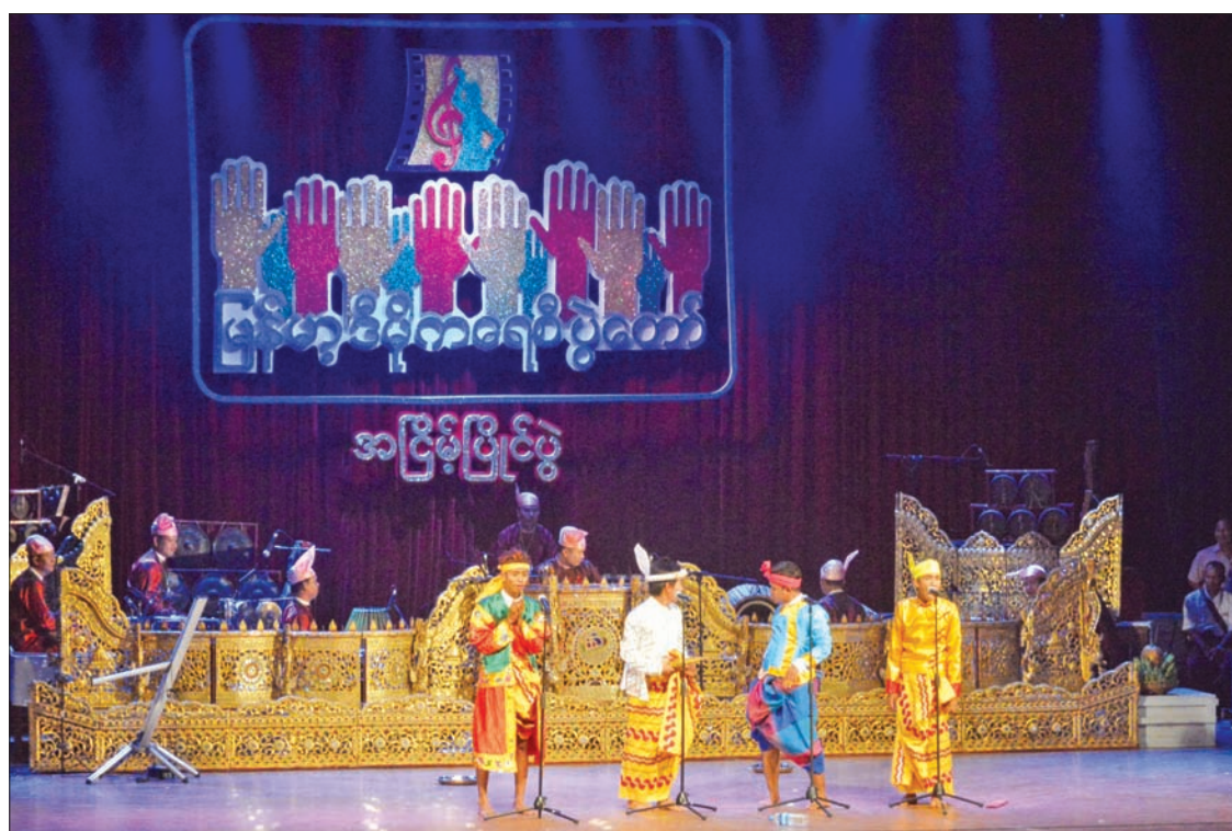
Eight Anyeint troupes compete in the final contest, making constructive criticisms for the transition period of Myanmar.