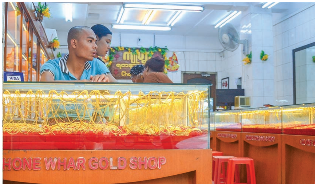
A sales man anticipates customers as gold price rises at a shop in Yangon.