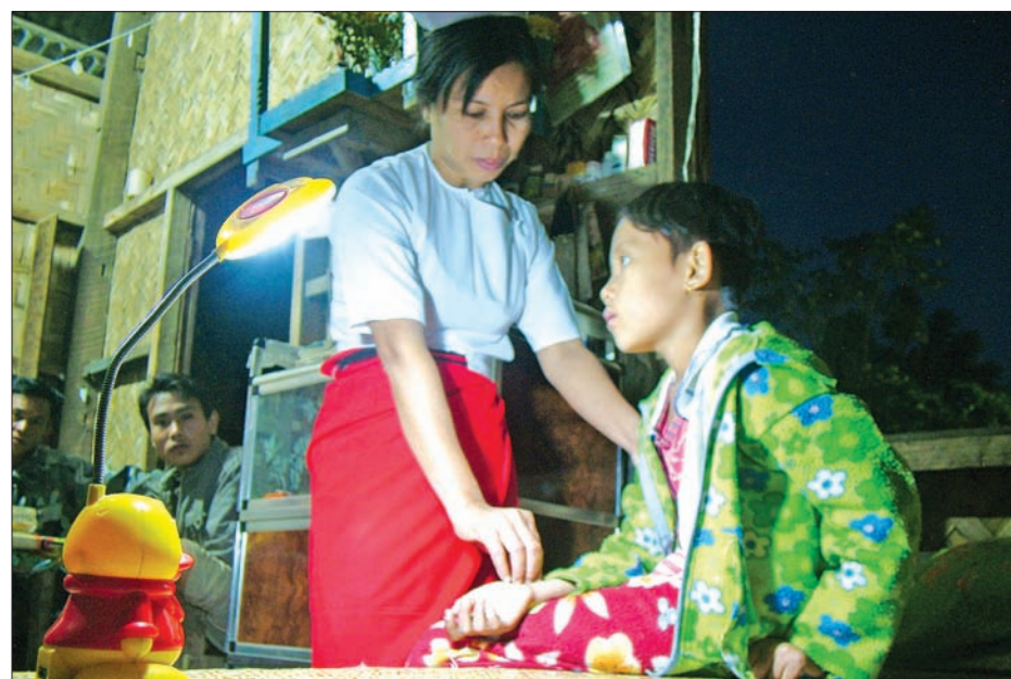
A nurse checks a patient at a rural clinic near Nay Pyi Taw.

tor engagement, the government is rolling out reforms to streamline processes for local and foreign companies to invest in the country's growing health care sector.