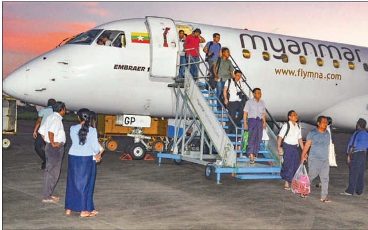
The media group from China arrive at Sittway Airport in Rakhine State on 21 September 2017.