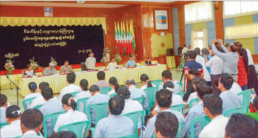
Officials of Ministry of Planning and Finance clarifies loans for agro-livestock, SME and construction at the Ministry of Planning and Finance in Nay Pyi Taw on 21 September 2017.