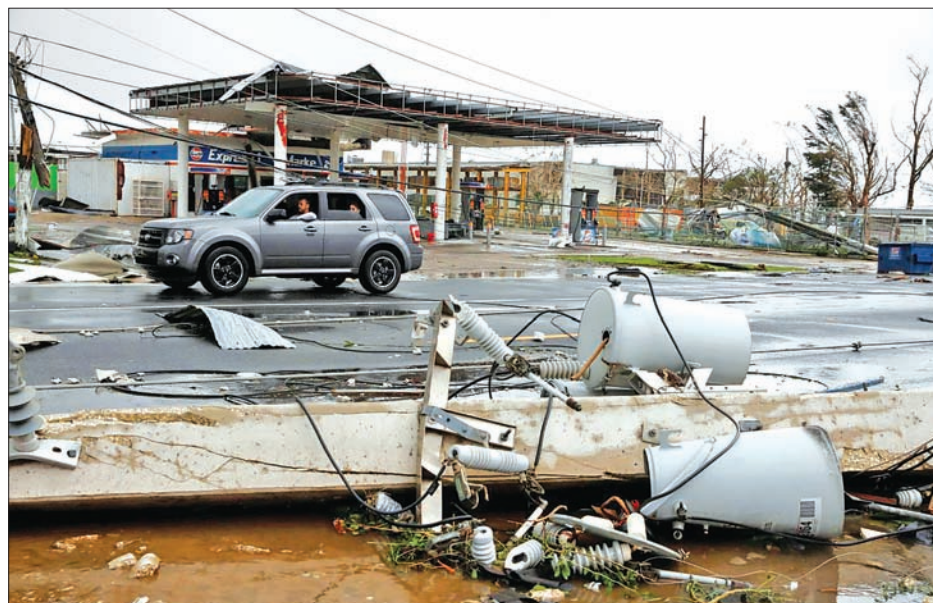
Damaged electrical installations are seen after the area was hit by Hurricane Maria en Guayama, Puerto Rico, on 20 September 2017.

It ripped roofs off almost all structures on the island country of Dominica, where seven people were confirmed dead. The toll is expected to climb when