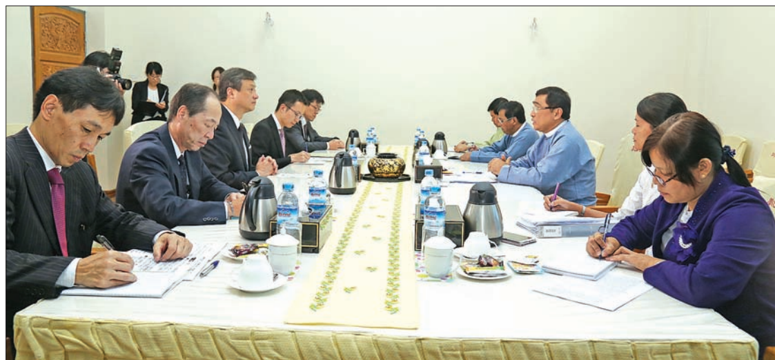
Union Minister Dr Win Myat Aye holds talks with Japan Parliamentary Vice-Minister for Foreign Affairs Mr. Iwao Horii in Nay Pyi Taw on 21 September, 2017.

The Union Minister said the incumbent democratic government has only been in power for 18 months, and establishment of democracy, rule of law and a socio-economic base were given priority. Work on national reconciliation is also being conducted consistently. The Union Minister discussed priority being given to states where development is lagging behind, the status of work