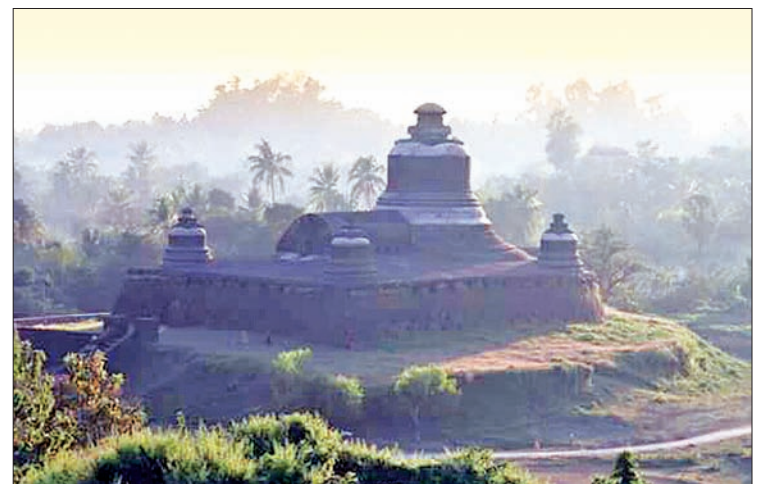
An ancient temple in Mrauk U.

"There are three kinds of heritage — cultural heritage, natural heritage and mixture heritage — culture and nature. Mixture heritage is the kind such as Inlay Lake. Mrauk is cultural heritage. So arrangements are being made to have the Mrauk U region en-