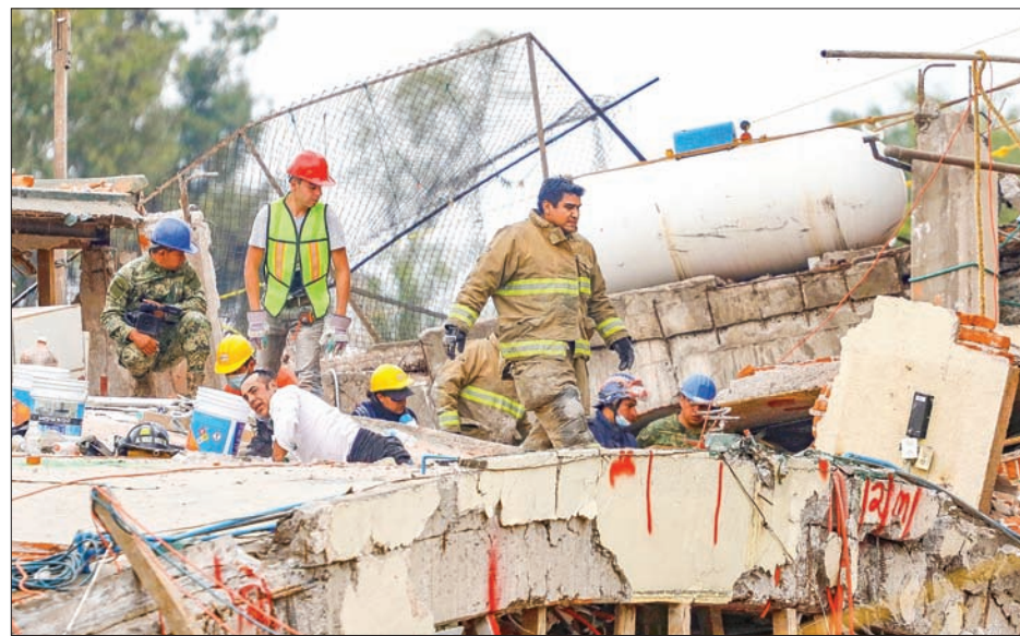
Rescue workers search through the rubble for students at Enrique Rebsamen school after an earthquake in Mexico City, Mexico, on 20 September 2017.

As the odds of survival lengthened with each passing hour, officials vowed to continue with search-and-rescue efforts such as the one at a collapsed school in southern Mexico City where Navy-led rescuers could