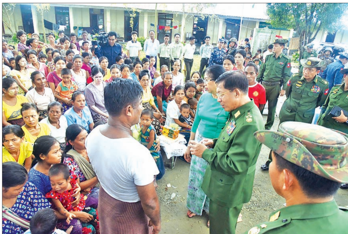
Senior General Min Aung Hlaing meets with local people in Sittway, Rakhine State.

displaced villagers from nearby villages who were staying in No. 2 sub school in the 4 mile area. The Senior General and wife encouraged the villagers and provided aid.