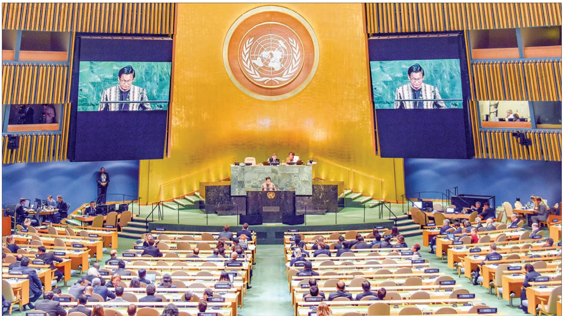
Vice President U Henry Van Thio addresses the 72nd United Nations General Assembly at UN headquarter in New York, US, on 20 September 2017.

No armed clashes have been reported since 5 September.