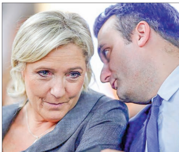
France's far-right National Front (FN) leader Marine Le Pen (L) and vice-president Florian Philippot attend a FN political debate in Paris, France, on 15 November, 2016.