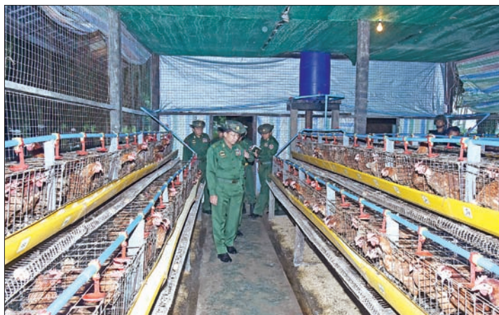
Senior General Min Aung Hlaing visits Multi-Agricultural and Poultry Farming.

Yesterday’s meeting was attended by government representatives, members of JMC-U, representatives from ethnic armed groups of NCA signatories and civilian representatives. ■