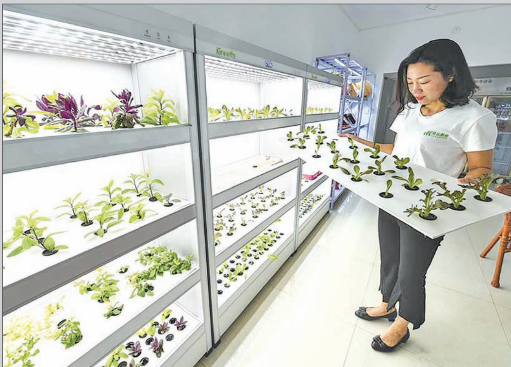
A working staff checks the hydroponic vegetables at Donghong Xinnong Agricultural Demonstration Garden in Dacheng County, north China's Hebei Province on 20 September, 2017.