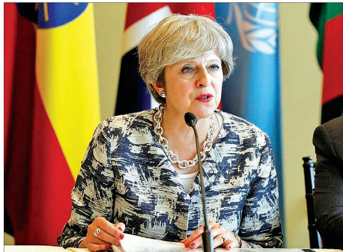
British Prime Minister Theresa May speaks during a meeting on action to end modern slavery and human trafficking on the sidelines of the 72 nd United Nations General Assembly at UN Headquarters in Manhattan, New York, US on 19 September, 2017.

The British UN mission said May will welcome progress, but urge companies