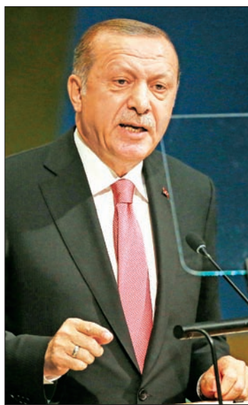
Turkish President Recep Tayyip Erdogan.