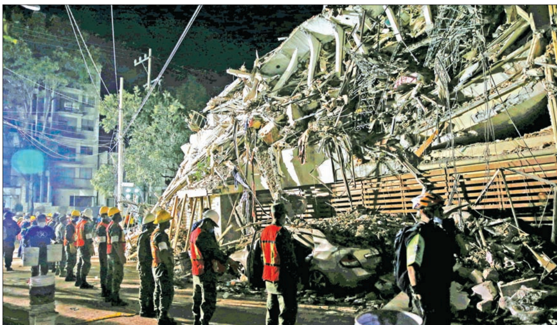
Rescuers work at the site of a collapsed building after an earthquake in Mexico City, Mexico on 20 September, 2017.

"Relatives of Fatima Navarro," one soldier shouted through cupped hands at the school the Coapa district in the south of the city. "Fatima is alive!" The earthquake toppled dozens of buildings, broke gas mains and sparked fires across the city and other towns in central Mexico. Falling rubble and billboards crushed cars. Parts of colonial-era churches crumbled in the state of Puebla, to the south of the capital, where the US Geological Survey (USGS) located the