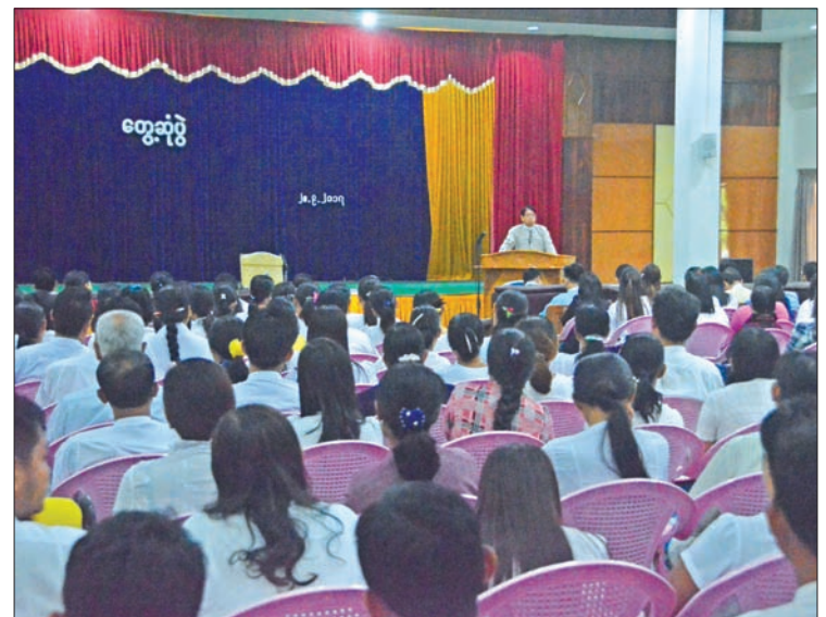
Union Minister Dr Pe Myint meeting with staff from the two state-run dailies and Printing and Publishing Department.

Discussions are under way as to whether it will stand as public-orientated media or it will stand as a government media. The present meeting is designed