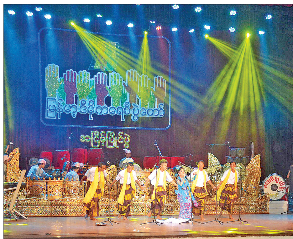
Troupes are competing with their Anyeint songs at the final Anyeint contest of Myanmar Democracy Festival at National Theater in Yangon.