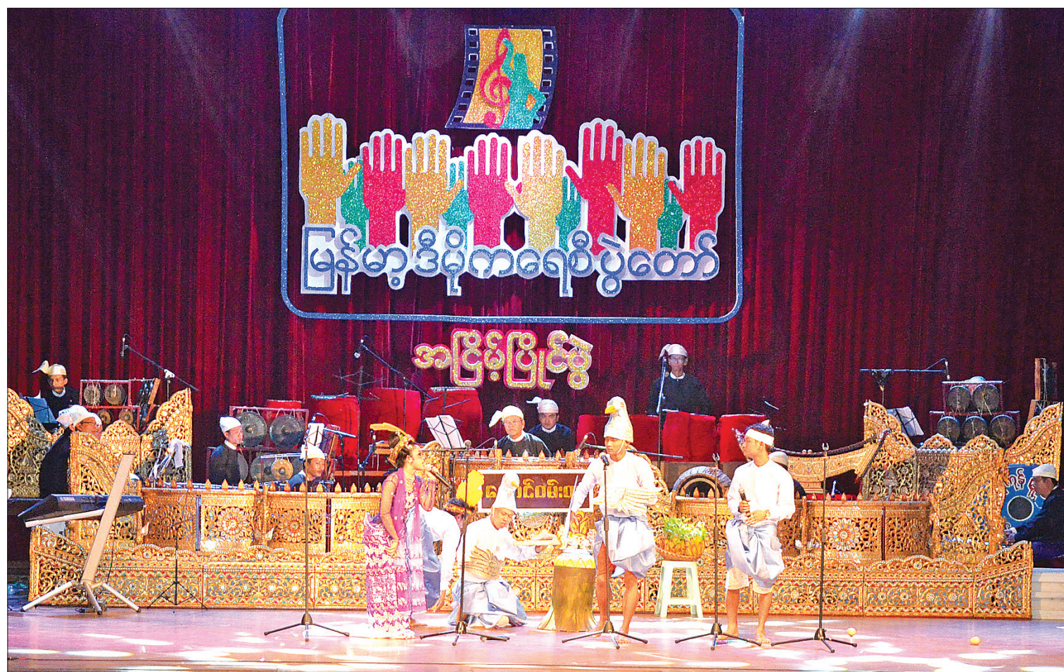
The final Anyeint contest of Myanmar Democracy Festival is performed at National Theater in Yangon on 20 and 21 September.

"The democracy songs and the jokes reflected the current