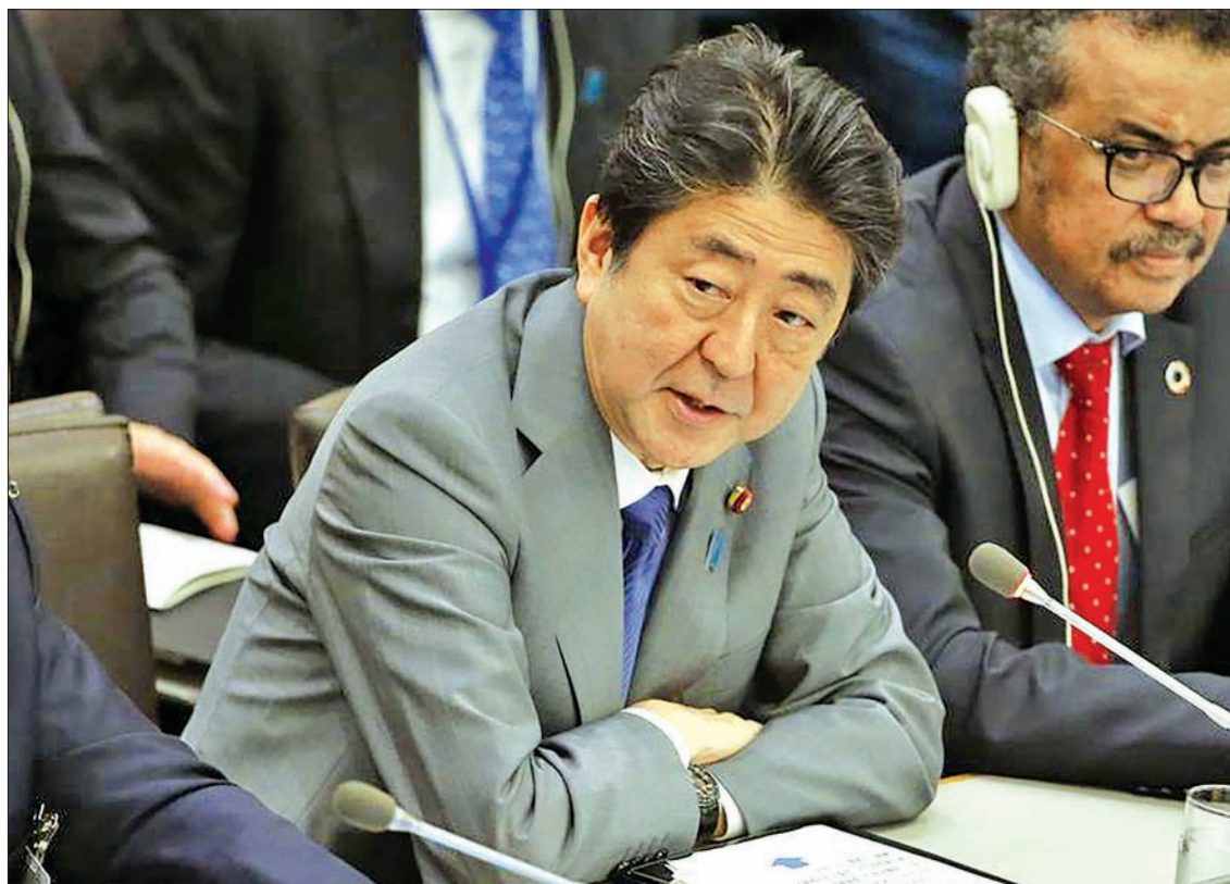
Japanese Prime Minister Shinzo Abe attends the World Leaders for Universal Health Coverage event held at UN headquarters in New York, US on 18 September, 2017.

But with massive government bond purchases by the central bank under its yield curve control policy, the bond market has already lost its price-setting mechanism that should serve as warning against weakening of