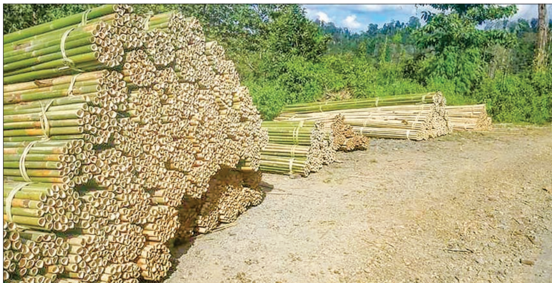
Bamboo binds are sorted beside the road for sale in Mawlamyinyun Township.