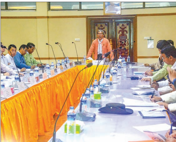
Chief Minister of Rakhine State U Nyi Pu delivers the address at the coordination meeting for suggestions on Rakhine Issue.

"The Implementation Committee is required to implement on the ground situation. We have already seen and listened to feelings and sufferings they had faced. As we have concluded these situations in general, it is necessary to prioritise resettlement including rehabilitation of the national people. Had the findings been implemented generally, the tasks of the committee could have been accomplished successfully. Committee members need to submit the findings of the trips collectively," said the Chief Minister of Rakhine State