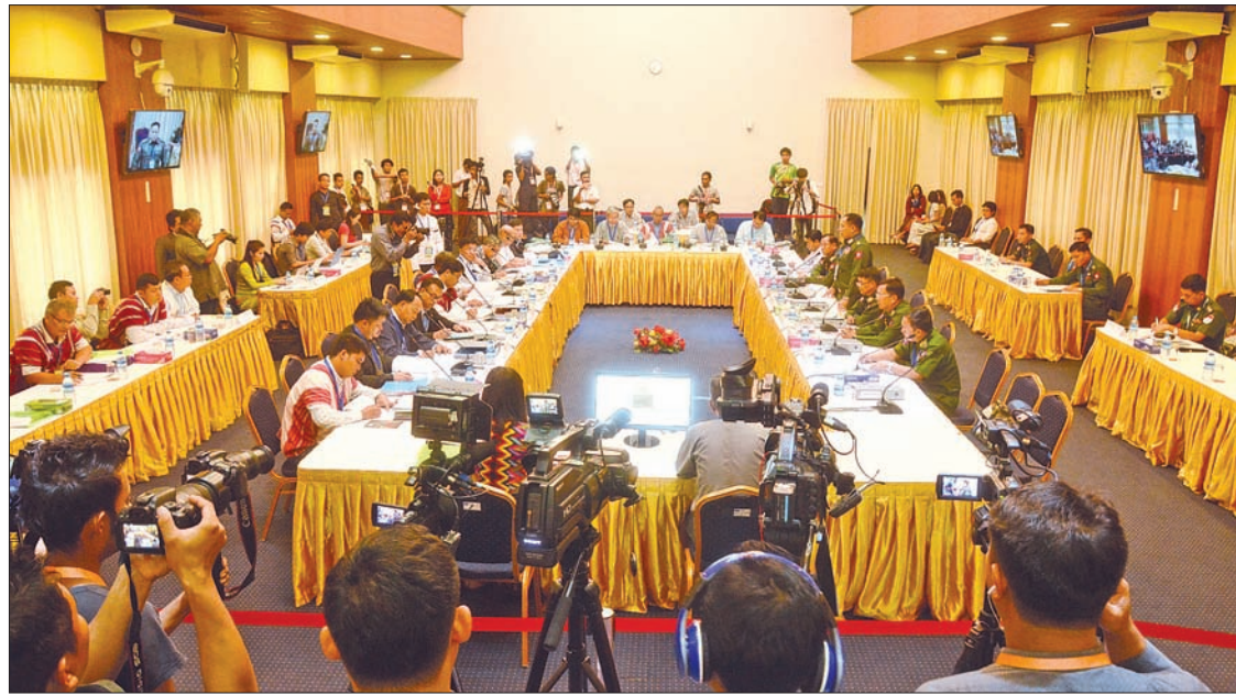
Peace makers participate in the 12th regular meeting of JMC-U.

of the JMC-U is being held for three days from 20-22 September. In the meeting, the discussion regarding organising local civilian monitors, holding workshops for the placement of the armed groups in order to avoid engagement, acquiring policy to review the SoP and ToR which