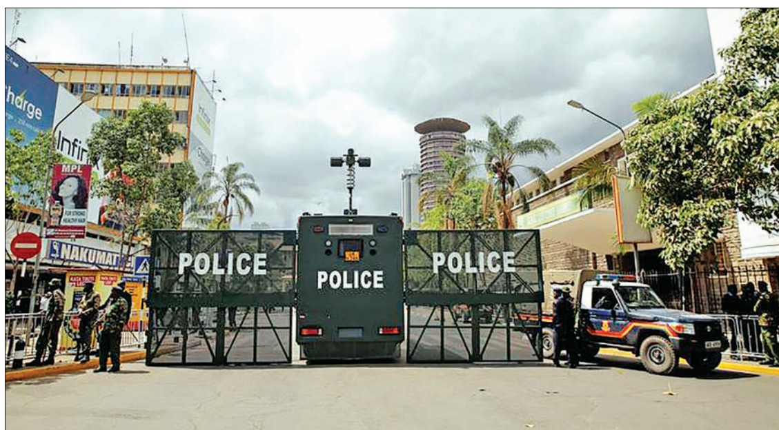
Police seal off roads near Kenya's Supreme Court in Nairobi, Kenya on 20 September, 2017.

Kenya used two parallel systems: a quick electronic tally vulnerable to typos and a slower paper system designed as a verifiable, definitive back-up. The official results were based on the electronic tally before the paper results were fully collated, the judges said.