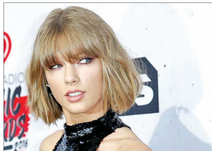
Singer Taylor Swift.