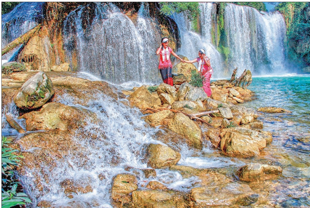
One of the most precious geographical treasures of Myanmar, Kyone Htaw Waterfall, consists of emerald waters and rocks in Kayin State.

Due to limitation of space we are only able to publish "Letter to the Editor" that do not exceed 500 words. Should you submit a text longer than 500 words please be aware that your letter will be edited.