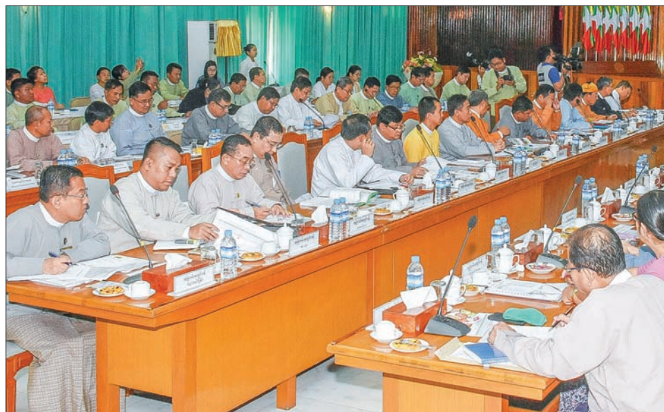
Vice President U Myint Swe addresses the National-Level Environmental Conservation and Climate Change Central Committee in Nay Pyi Taw.

The decisions mainly include drawing up a policy on climate change impacts in My-