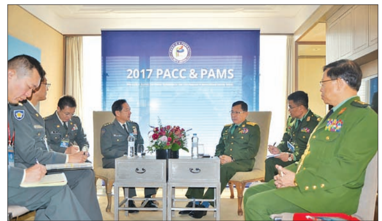
Vice-Senior General Soe Win holds talks with General Koji Yamazaki.

In the meeting, Vice-Senior General Soe Win spoke of the friendship and military cooperation between the two armies, the Tatmadaw’s participation in Myanmar’s democratic transition