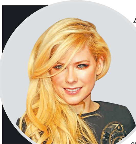
Singer Avril Lavigne.