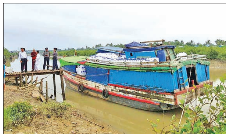
Local authorities arrive at the boat loaded with aid as they arrange for negotiation with the crowd.

However, people gathered to see the situation reaching the number about 300 at 8 pm and some threw stones and Molotov at the riot police. About 200 police used 20 12-bolt greeners and water cannons to disperse the crowd. Some people from the crowd threw homemade arrows, locally called 'Jingali' with the use catapults. Currently, security forces are stationed in Sittway providing security to local people and the situation under control.— Myanmar News Agency ■