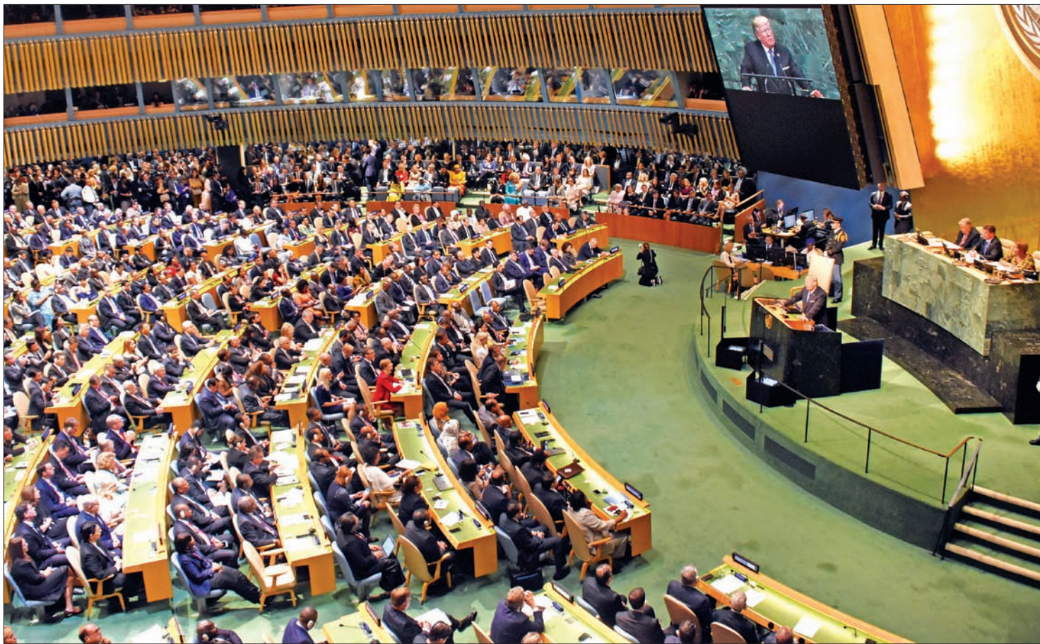
Donald Trump addresses the 72nd United Nations General Assembly at UN Headquarters in New York City yesterday.