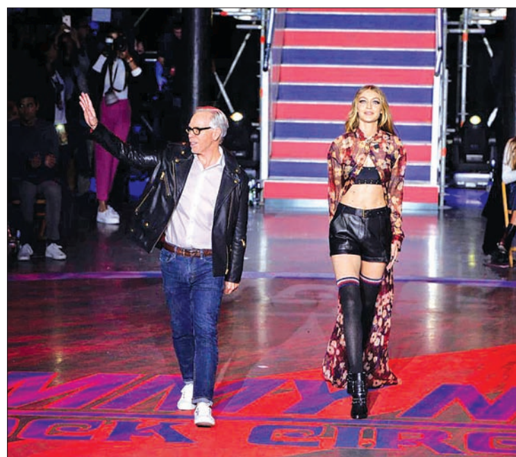
Tommy Hilfiger and model Gigi Hadid thank guests at the end of the Tommy Hilfiger Spring/Summer 2018 show at London Fashion Week, in London, Britain on 19 September, 2017.

Their participation gave the event a boost, as Britain's fashion industry — which experts say contributes £28 billion ($37 billion) to the country's economy — faces uncertainty as the UK negotiates its exit from the European Union. —Reuters ■