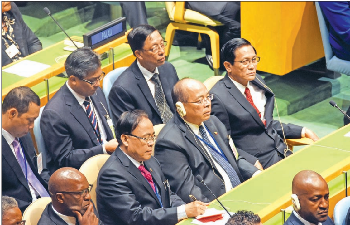
Myanmar delegation led by Vice President U Henry Van Thio attends 72 nd session of UN General Assembly in New York, US.