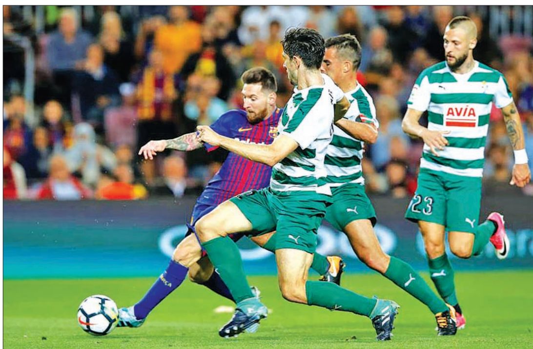
Barcelona's Lionel Messi scores their fifth goal to complete his hat-trick at Camp Nou in Barcelona, Spain on 19 September, 2017.

“Game by game he surprises us, there are no words for him,” said the Portuguese right back, who won the penalty which Messi converted for his first goal of the night in the 21 st minute.