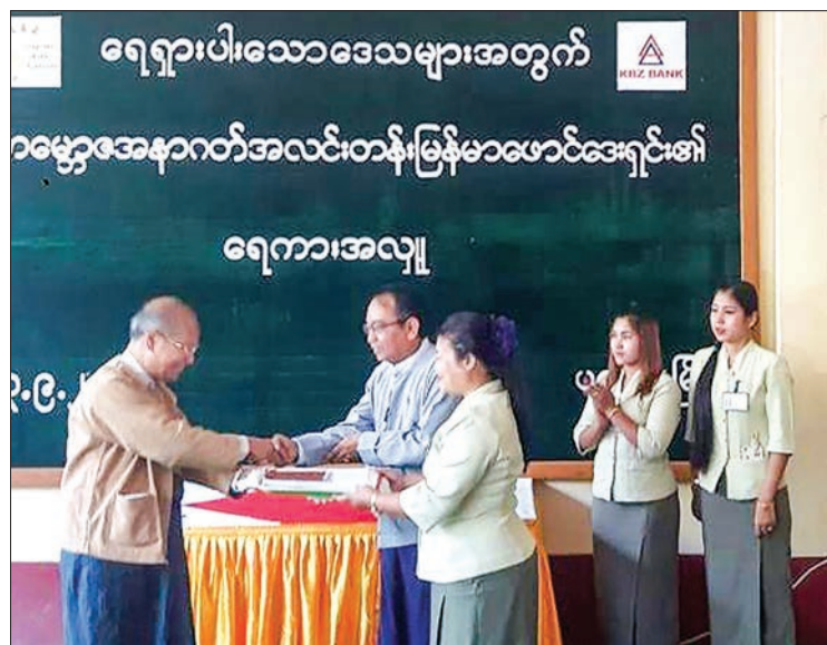
KBZ's officials donate 3000-gallon water bowser in Pakokku Township.

The data, released ahead of Monday's Respect-for-the-Aged Day, are the clearest demonstration yet of the rapid graying of a nation where more people of retirement age remain gainfully employed amid a shrinking population. The number of people aged 90 or older stood at 120,000 in Japan in 1980 and has been on the rise since, reaching 1.02 million in 2004. As of 15 September, 2017, the population of the age group had doubled to 2.06 million, up 140,000 from a year earlier. — Kyodo News ■