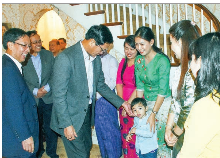
Vice President U Henry Van Thio meets family members of Myanmar Permanent Mission staff in New York.