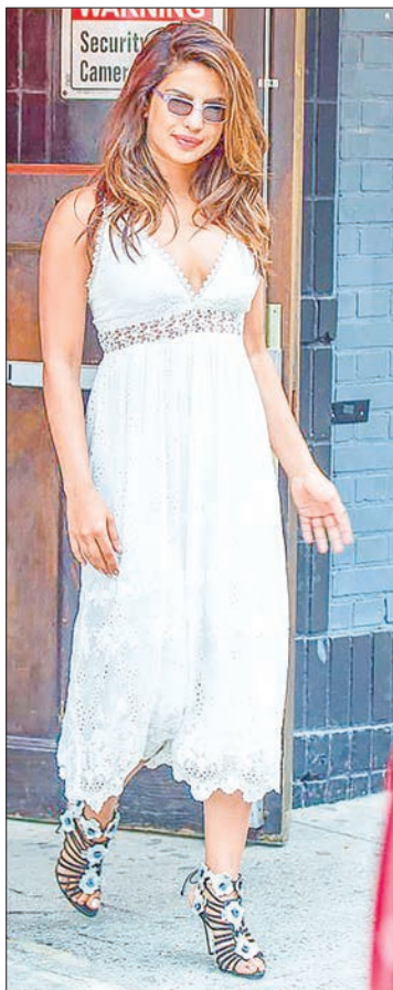
Lovely in lace! Priyanka Chopra.

The Indian star presented the outstanding variety talk series award to John Oliver of “Last Week Tonight”, with co-presenter Anthony Anderson.