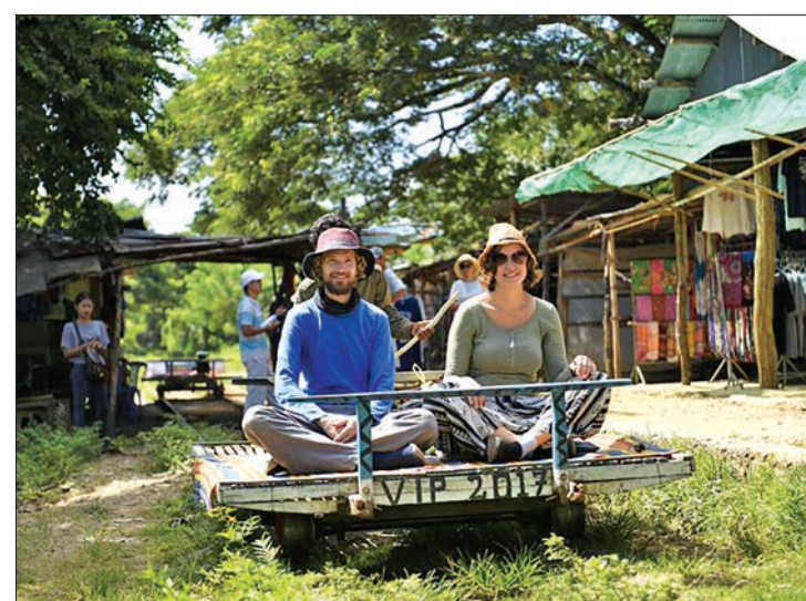
Tourists enjoy their journey on a bamboo train in Battambang, about 291 km northwest of Cambodia's capital Phnom Penh on 13 September, 2017. Bamboo train, which has delighted tourists for nearly two decades, is on the brink of disappearance as Cambodia has started to restore the rail line for a train service.