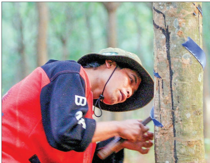
Worker scrapes rubber latex at a rubber plant.

U Ohn Than from Myanmar Rubber Planters and Producers Association (MRPPA) said that rubber plantation acres were developed in virgin and vacant land areas across Bago Yoma forest. Therefore, those rubber plantation acres have