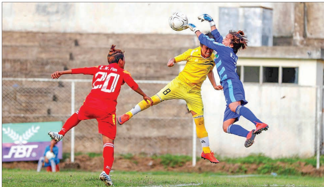
Thitsar Arman FC's woman footballers (yellow) is trying to score against Myawady FC's goalkeeper (blue) and defender (red) at the first round of KBZ Bank Women's Football League.

Zwekapin United FC won one, drew one and lost four matches. YERO FC lost all its matches. Each team in the second round plays six matches. The second round of the KBZ Women's Football League will be played between 9 September and 4 November. The best football club will be awarded Ks15 million, with Ks10 million for second place team and Ks5 million for third place team. The best player will be awarded Ks300,000. ■