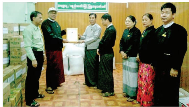
Shan State Chief Judge and family donate cash assistance for Rakhine ethnic nationals in Maungdaw.

ON Monday morning in the Rakhine State government office, Shan State Chief Judge and families of Shan State High Court donated Ks1.8 million and members of judicial officer courses 1, 8 and 18 donated Ks600,000 for ethnic Rakhine nationals in Maungdaw District who were displaced by the terrorist attacks by the Arakan Ro-