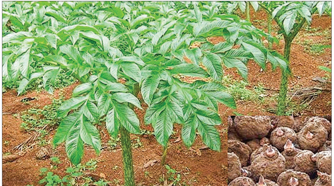
Elephant foot yam plant,

The Myanmar Fruit, Flower and Vegetable Producers and Exporters Association (MFVP) is planning to promote the dried elephant foot yam, a vegetable tuber plant, for the export sector. Official statistics show that Myanmar has earned over US$2.5 million in fiscal 2016-2017. Myanmar exports 700,000 visses of dried elephant foot yams worth Ks7 billion annually. "Local farmers are growing elephant foot yam tubers on their farms. The USAID, MFVP and Dana Association are promoting a farming project for elephant