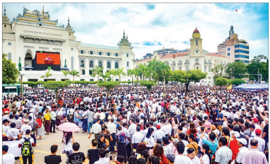
A crowd gathers at the City Hall in Yangon listening Daw Aung San Suu Kyi's speech.

seen holding posters showing support for the State Counsellor.