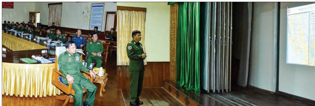
Director of Military Engineers explains about border fencing work to Senior General at Regional Control Command in Sittway.

DEFENCE Services Commander-in-Chief Senior General Min Aung Hlaing, Union Ministers Lt-Gen Kyaw Swe and Lt-Gen Ye Aung arrived in Sittway yesterday afternoon and were briefed by the Regional Control Command (Sittway) Commander.