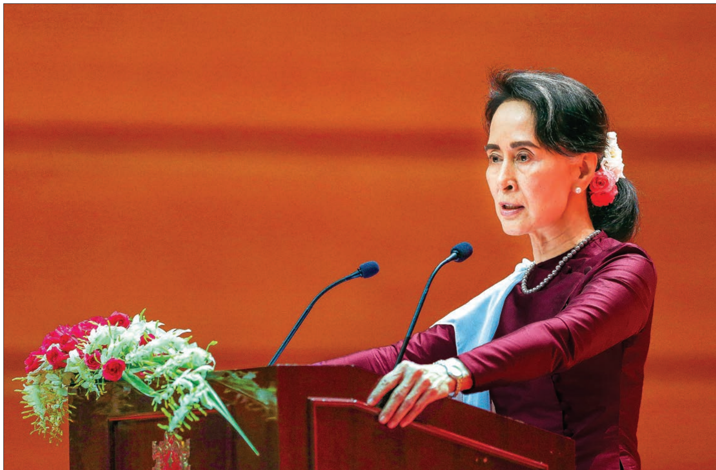
State Counsellor Daw Aung San Suu Kyi delivers the speech yesterday morning in Nay Pyi Taw on the government's efforts in dealing with national reconciliation and peace. The State Counsellor also addressed the crisis in northern Rakhine State