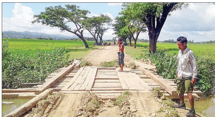
Local people reconstruct bridges and roads destroyed by terrorists in Maungdaw, northern Rakhine State.

Bridges and roads destroyed by terrorists in the Maungdaw region in northern Rakhine State have been reconstructed, according to the Maungdaw District Road Department. Seven bridges damaged in the terrorist attacks by the Arakan Rohingya Salvation Army (ARSA) extremist terrorists are No. 3/25 Wetkyein bridge 2 No. 1/27 Padakar Daiwanali bridge 1, No. 4/27 Padakar Daiwanali bridge 2, No. 1/29 Laungboub bridge, No. 5/32 Letyar Chaung bridge, No. 4/34 Arzabaw bridge and No. 2/29 bridge on Maungdaw-Kyeekanyin-Kyeinchaung-Aung Tha Pyay-Bandula road, which were rapidly reconstructed in order for the smooth resumption of transport, communications and secu-