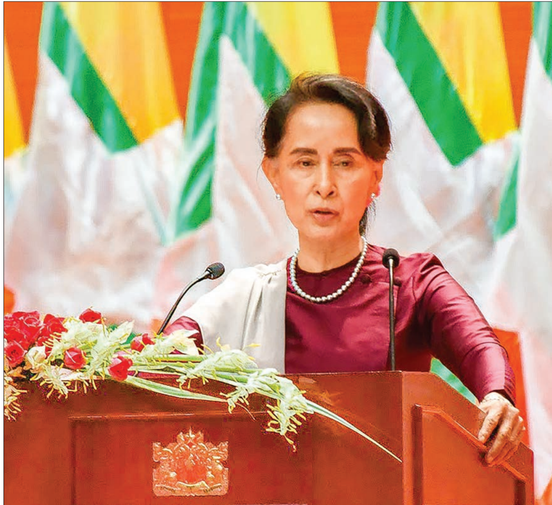
State Counsellor Daw Aung San Suu Kyi delivers the speech on the government's efforts with regard to national reconciliation and peace in Nay Pyi Taw on 19 September.

I think it is only fitting that I should remind you today that our government has not yet been in power for even eighteen months. It will be eighteen months at the end of this month. Eighteen