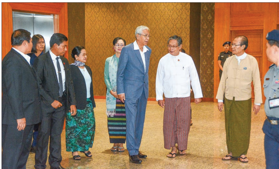
President U Htin Kyaw arrives back Nay Pyi Taw after receiving the medical examinations and necessary surgical operations in Bangkok, Thailand.