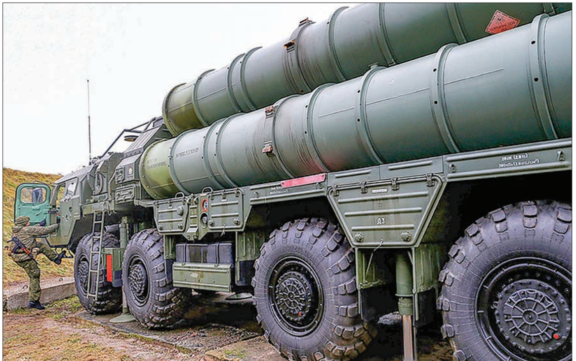
In 2016 such complexes were for the first time provided for a military unit in the Siberian region.

S-400 Triumph was authorized for service in 2007.—Tass ■