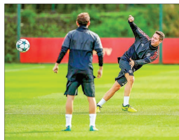
Manchester United's Ander Herrera during training.

"I will try to enjoy every minute I have on the pitch. I want to win titles and feel part of the team and feel important and I really do feel important because the manager makes me feel important." —Reuters ■