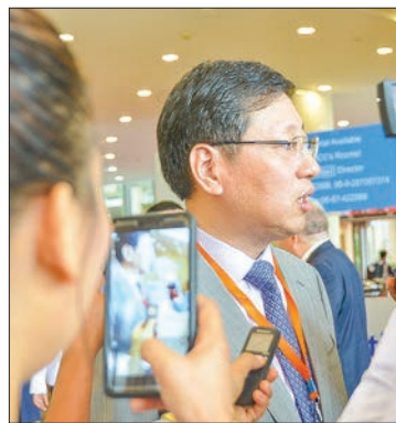
Mr Hong Liang, Ambassador of China to Myanmar.

There is no evidence of ethnic cleansing in Rakhine. Only a constructive approach can solve the Rakhine issue, which is complicated. International communities should also show how they can cooperate effectively with Myanmar government. Meanwhile, the Myanmar government needs to solve the citizenship is-