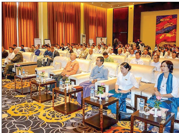
An opening ceremony for the start of high and mid-level management courses held in Nay Pyi Taw.

A CEREMONY was held at the Park Royal Hotel in Nay Pyi Taw yesterday for the start of high and mid-level management courses organised by the Joint Coordination Committee on Hluttaw Development and the United Nations Development Programme (UNDP) for Hluttaw office staff. Amyotha Hluttaw Deputy Speaker U Aye Tha Aung attended the ceremony and delivered a speech.