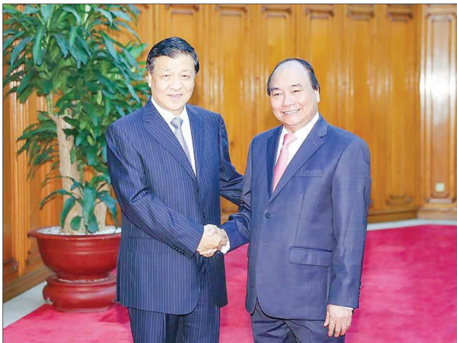
Liu Yunshan (L), a member of the Standing Committee of the Political Bureau of the Communist Party of China Central Committee, meets with Vietnamese Prime Minister Nguyen Xuan Phuc in Hanoi, Viet Nam on 19 September, 2017.

The two economies are highly complementary, with huge potential for practical cooperation, he said.