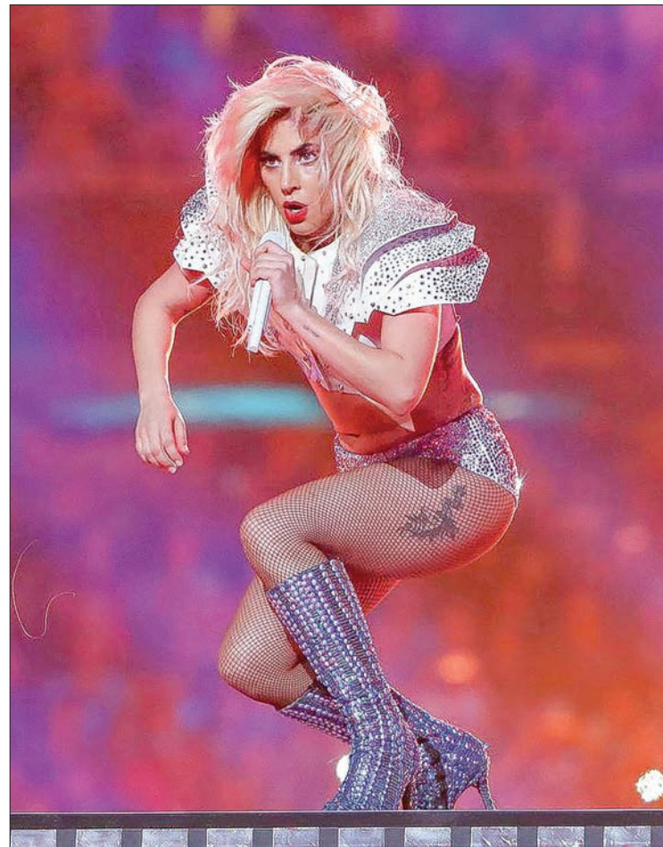
Singer Lady Gaga performs during the halftime show at Super Bowl LI between the New England Patriots and the Atlanta Falcons in Houston, Texas, US on 5 February, 2017.

Fibromyalgia is a musculoskeletal pain disorder, often accompanied by fatigue and mood issues, that can be