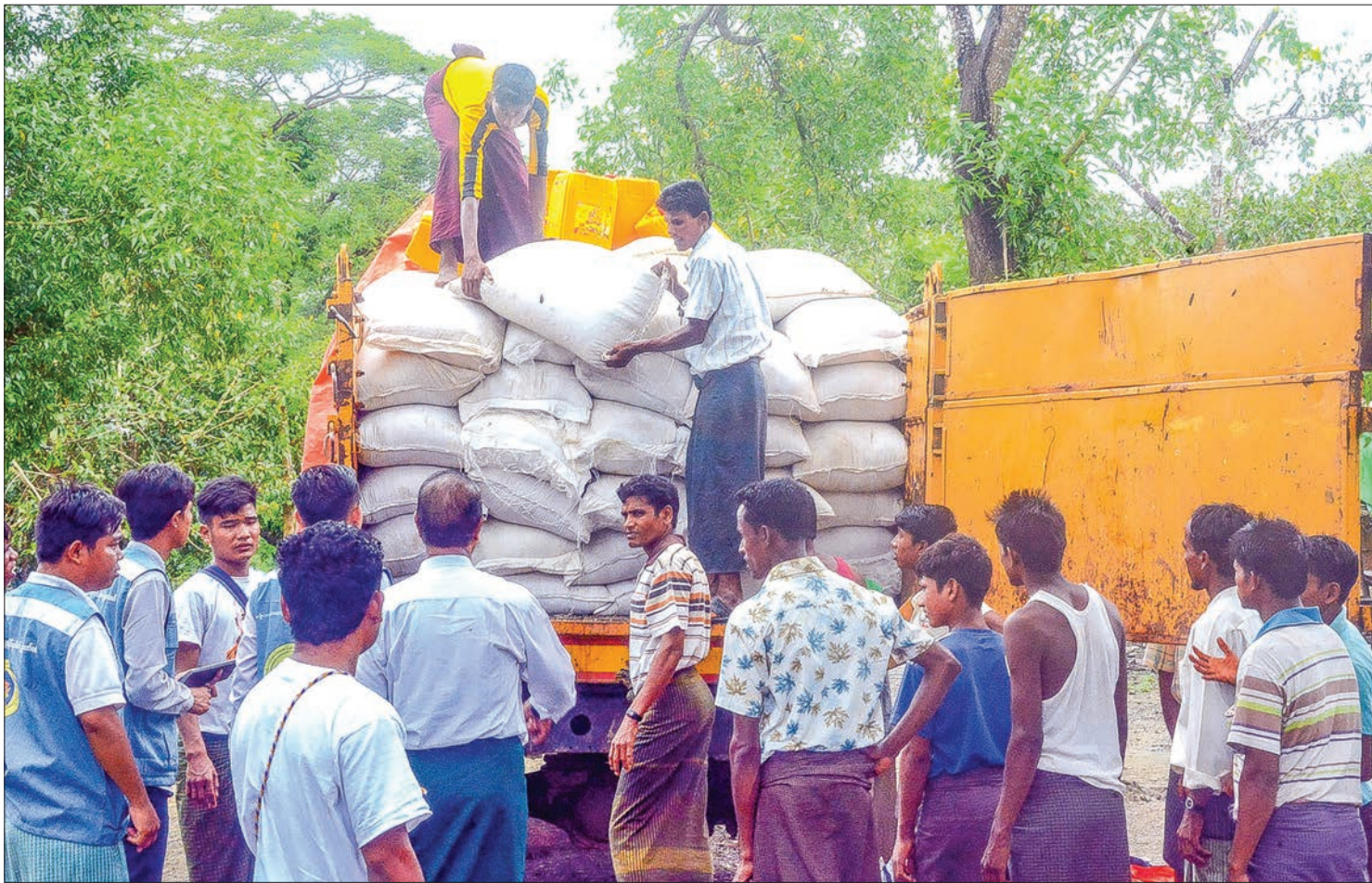
Relief aids are arriving at both Local Ethnic communities and Muslim communities in Northern Rakhine State.

The central administrative body of the State Pariyatti Sasana universities of State Sangha Maha Nayaka Committee held its meeting (2/2017) at the convocation hall of the State Pariyatti Sasana University (Yangon) at Kaba Aye in Yangon at 1 pm yesterday. NEWS ON PAGE-2 >>>