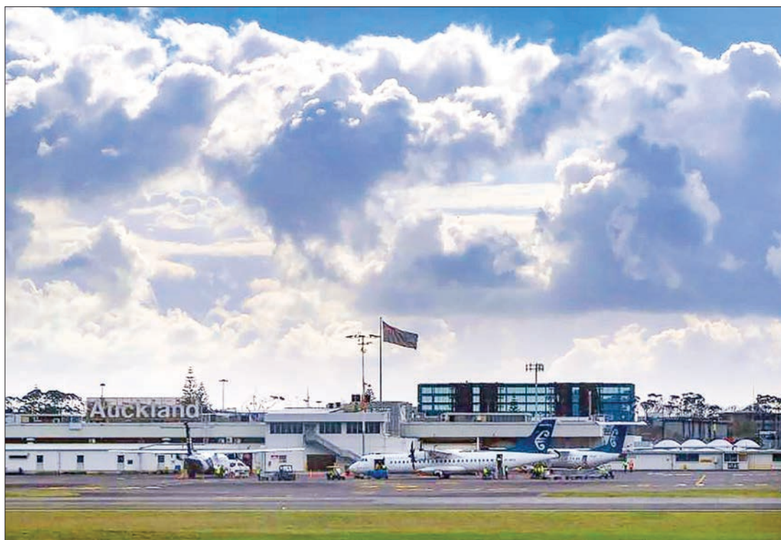
Air New Zealand Bombardier Q300 planes sit near the terminal at Auckland Airport in New Zealand, on 25 June 2017.