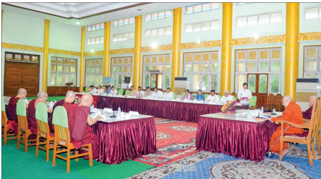
Pariyatti universities administrative body meeting in progress.

Sayadaw Bhaddanta Obhasabhivamsa delivered a sermon.—Myanmar News Agency ■