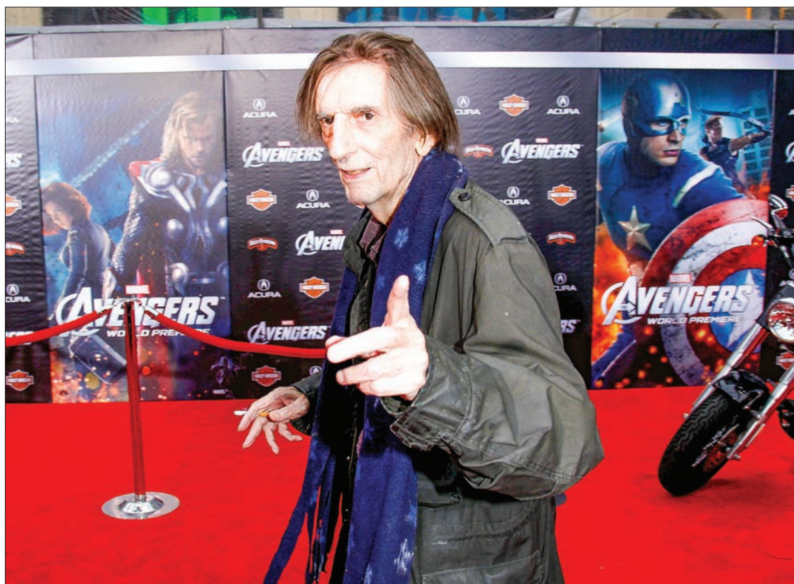
Actor Harry Dean Stanton poses at the world premiere of the film “Marvel’s The Avengers” in Hollywood, California, US in 2012.

Stanton credited Jack Nicholson with giving him vital professional advice. Nicholson had written a part for Stanton in the Western “Ride the Whirlwind” and told him, “Let the wardrobe do the acting and just play yourself.” “After Jack said that, my whole approach to acting opened up,” Stanton told Entertainment Weekly. Stanton worked with many of Hollywood’s most notable directors, including Frances Ford Coppola (“The Godfather Part Two” and “One From the Heart”), Sam Peckinpah (“Pat Garrett and Billy the Kid”), Mar-