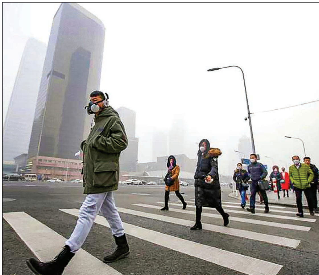
A man wearing a respiratory protection mask walks toward an office building during the smog after a red alert was issued for heavy air pollution in Beijing's central business district, China, in 2016.

In the capital, it is aiming to reduce airborne particles known as PM2.5 by more than