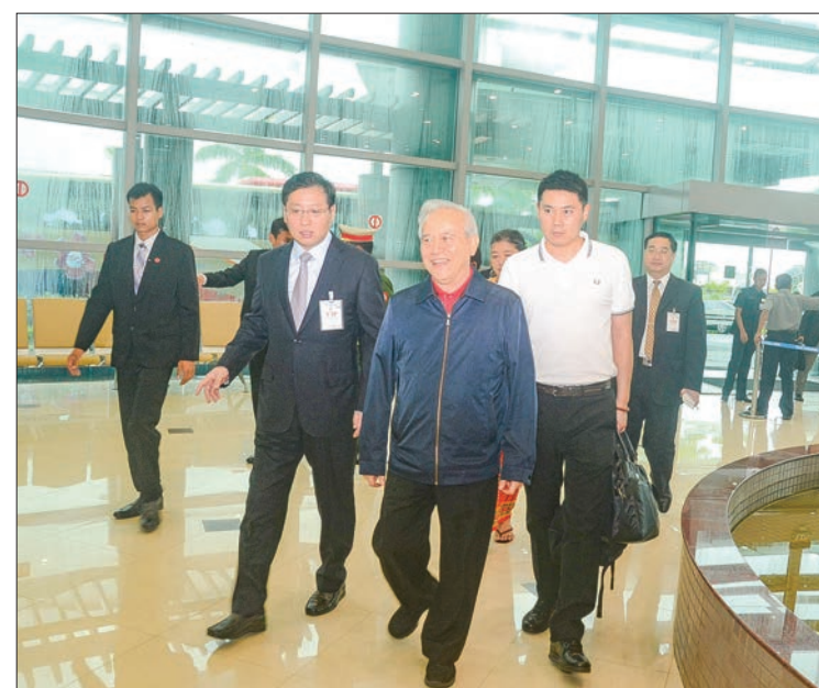
CPPCC Vice Chairman Mr Wang Qin Min seen off at Yangon International airport.