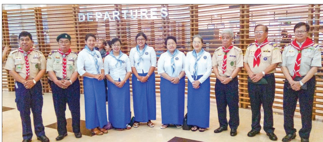
Myanmar Girl Scout delegation pose for documentary photo: PHOTO: MYANMAR SCOUT ASSOCIATION

will submit the paper regarding the activities of Myanmar Girl Scout Association, holding the training and workshops for the progress of scout services and the programs to revive the girl scout services since 2013 in co-operation with Japan Girl Scout Association. Then the Myanmar group discussed about the training courses and seminars which will be conducted in co-operation with the world Girl Scout Association.—Myanmar Scout Association ■