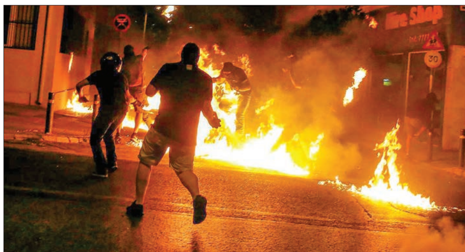
A masked demonstrator (C) is engulfed in flames as clashes with riot police take place during a rally marking four years since the fatal stabbing of Greek anti-fascism rapper Pavlos Fyssas by a supporter of the ultranationalist Golden Dawn party in Athens, Greece, on 16 September 2017.

The killing of Pavlos Fyssas, who performed under the stage name Killah P, had sparked protests across Greece and led to an investigation into Golden Dawn for evidence linking it to violent attacks. A trial of party members is continuing. Clashes broke out on Saturday after dozens of hooded demonstrators broke off from a march of about 2,000 people, including activists and migrants, towards the Golden Dawn