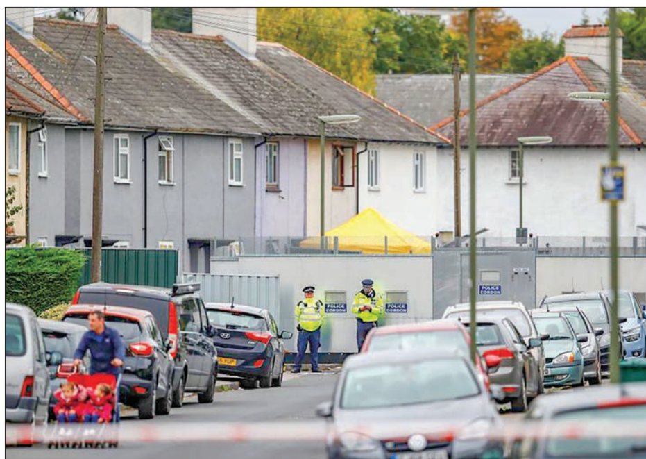
Police officers stand in front of barriers forming a cordon around a property being searched after a man was arrested in connection with an explosion on a London Underground train, in Sunbury-on-Thames, Britain, on 17 September 2017.

"I think that he like I supports the prime minister at this difficult time as we try to conclude the negotiations with the EU," she said.—Reuters ■