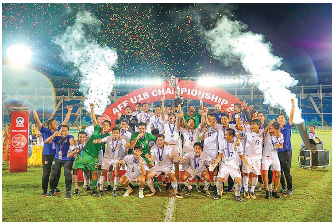
Thailand footballers are celebrating victory as they won the 2017 AFF Under-18 Championship Cup.

Just before the end of the match, Malaysia got a penalty but Muhammad Zafuan Azeman unable to score when Kantaphat judged the direction well and ended up the match with 2-0 win for Thailand.