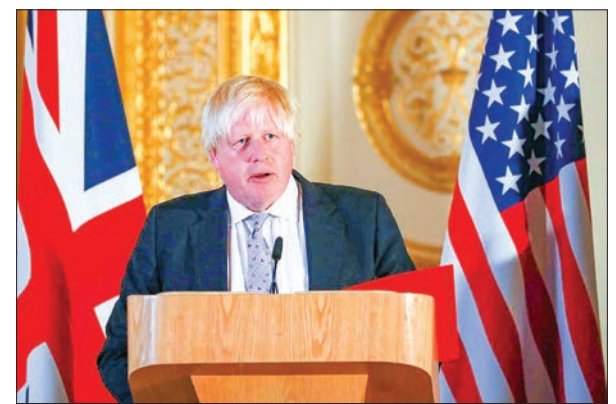
Britain's State Secretary for Foreign and Commonwealth Affairs Boris Johnson speaks during a news conference at Lancaster house in London, Britain, on 14 September 2017.

Prior to that it had not been triggered since 2007.—Reuters ■