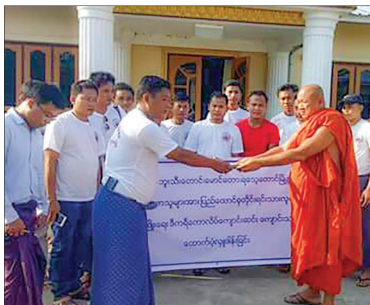
Well-wishers making donations for people of Maungtaw.

Ks 700,000 for a temporary rescue camp in four miles ward, Maungtaw Township for, Ks 200,000 for a temporary rescue camp of Dat Paung Su Parahita (Philanthropic) monastery in three miles ward, Ks 500,000 for a temporary rescue camp of Aloetaw Pyae monastery, Ks 600,000 for a temporary rescue camp of Beikman emergency supporting committee, Ks350,000 for students in temporary rescue camp of Myoma Nant Tha Taung Parahita monastery, Ks500,000 for a temporary rescue camp of Lan Ma monastery in No.2 ward, Buthidaung Township, Ks 500,000 for a temporary rescue camp