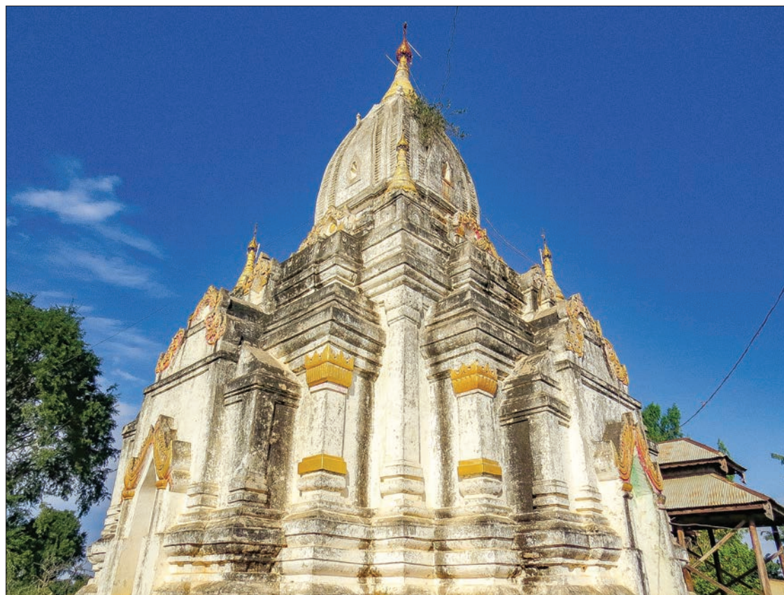
Photo shows a Stupa of Bagan era in MyinKunn Ancient City.

There are seventeen hotels and seventeen hostels in Magway and it is reported that the number of tourists reached 19,386 in 2016 and 10,861 in 2017. Dr. Aung Moe Nyo, the Chief Minister of Magway Region, said after community based tourism (CBT) was set up in Pakkoku District, about a thousand tourists come visit annually. The Chief Minister said CBT was also set up in Makyikan Village