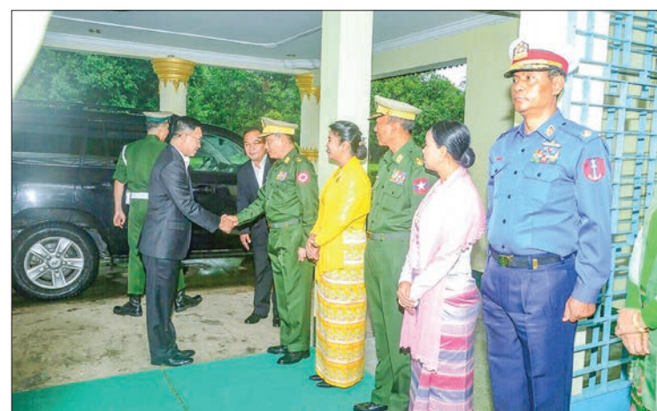
Chief of Defence Forces of Royal Thai Armed Forces General Surapong Suwana-adth, his wife and party arrive in Yangon.

The delegation visited Shwemawdaw Pagoda and Shwethalyaung Pagoda, Kanbawzathadi Palace in Bago and Bogyoke Aung San Market in Yangon. —Myanmar News Agency ■