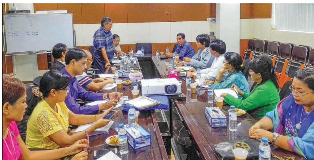
Meeting to provide free ferry service to Democracy Anyeint contest in progress.

YANGON Region government has arranged to provide ferry services across six different routes to Anyeint Contest, which is scheduled to be held at the National Theatre in Yangon, from 20 to 21 September.