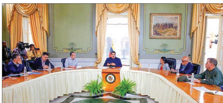
Venezuela's President Nicolas Maduro (C) speaks during a meeting with ministers in Caracas, Venezuela, on 15 September 2017.

CARACAS — President Nicolas Maduro has predicted a new foreign-led effort to mediate Venezuela's political crisis would produce a deal soon, but the opposition said on Saturday it would not accept another time-wasting "show".