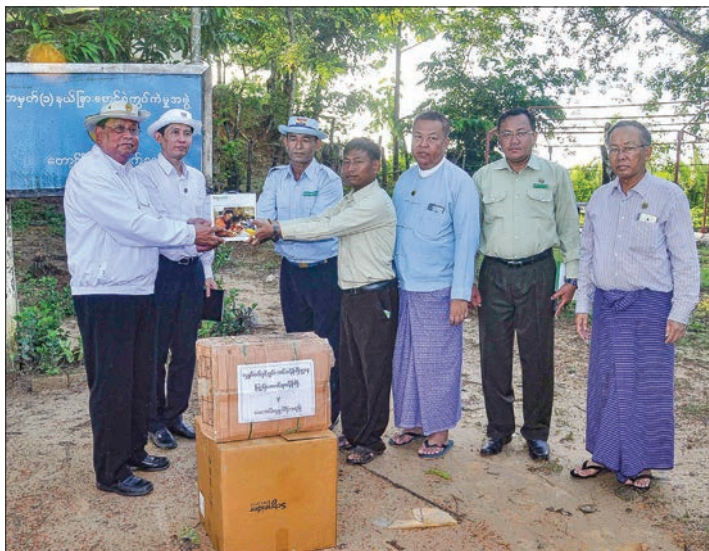
Union Minister U Win Khaing presents solar lamps for service personnel.

In Buthidaung township, they inspected the 600-ft-long Saitin Bridge on Ponnagyun-Yathedaung-Buthidaung road undertaken by construc-