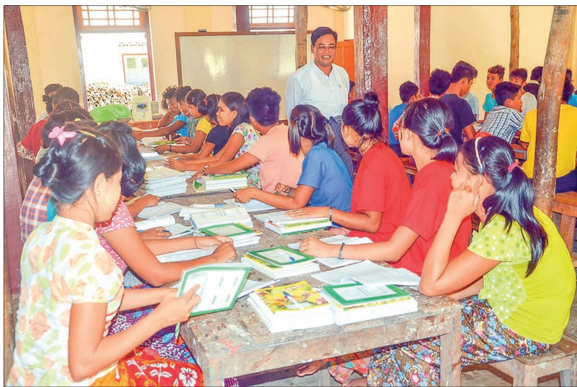
A peaceful learning environment in a restive area.