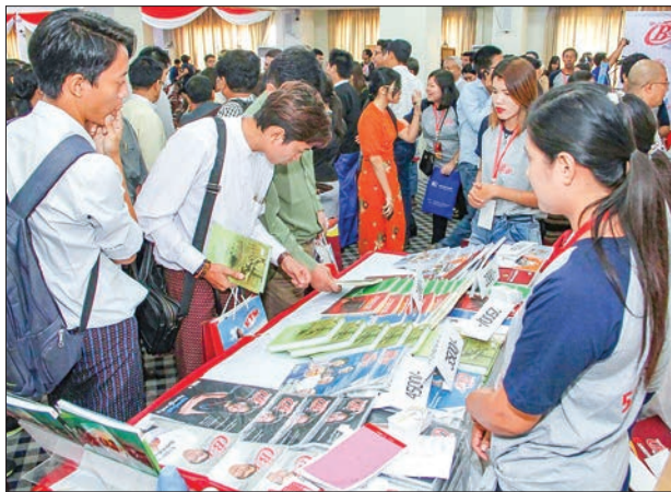
Guests view copies Myanmar B2B Magazine at its 5 th anniversary at UMFCCI on 10 September.

Present at the ceremony were economic experts, businesspersons, writers, cartoonists, special guests, news medias and other interested persons. — GNLM