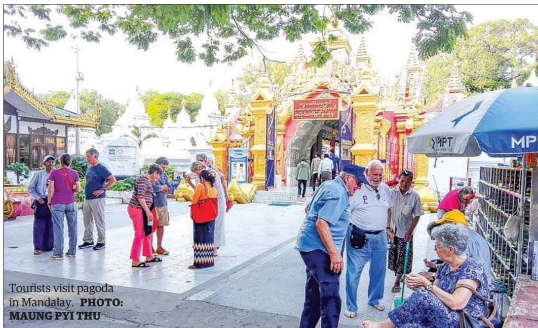
Tourists visit pagoda in Mandalay.