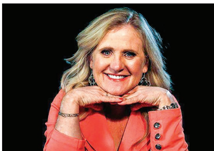
Actor Nancy Cartwright poses for a portrait in Los Angeles, California, US, on 11 September 2017.

“In Search of Fellini” follows Lucy, a young, naive girl living a sheltered life with her mother in a small Midwestern American town until she undergoes a spiritual awakening watching Fellini’s 1954’s “La Strada” and