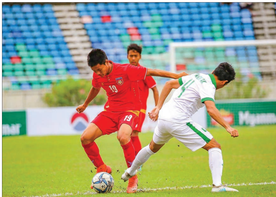
Myanmar and Indonesia football players in action with passing the ball at yesterday match in Thuwunna Stadium.