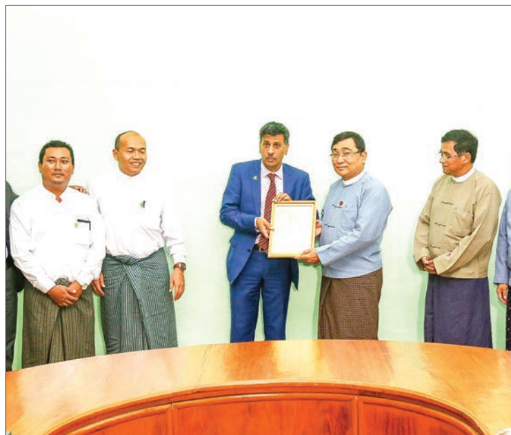
Union Minister Dr Win Myat Aye receiving aids for victims in N Rakhine State.

Ministry of Social Welfare, Relief and Resettlement is systematically distributing cash, foods and utensils contributed by international organizations to all victims in Rakhine State. —Myanmar news Agency