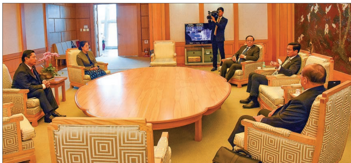
Vice-President U Henry Van Thio on his way to fly to New York via the Republic of Korea.