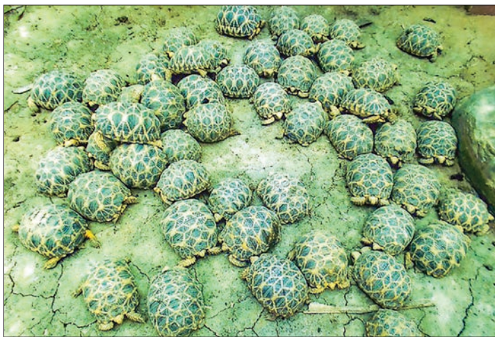
Myanmar Star tortoises are found in arid regions of Myanmar.

Situated in Minbu Township, Magway Region, a total of 150 star tortoises ( Geochelone Platynota ), a critically endangered species, are naturally living in the sanctuary, according to a report of the Myawady Daily issued on Sunday. All of the total numbers, small radio transmitters have been installed on the back of 42 turtle's upper shell to provide information for follow-up healthcare to those land-dwelling reptiles in the sanctuary. Altogether 50 tortoises have been placed in each 2.5-acre wide plot. Recording, mapping and calculation have been conducted by