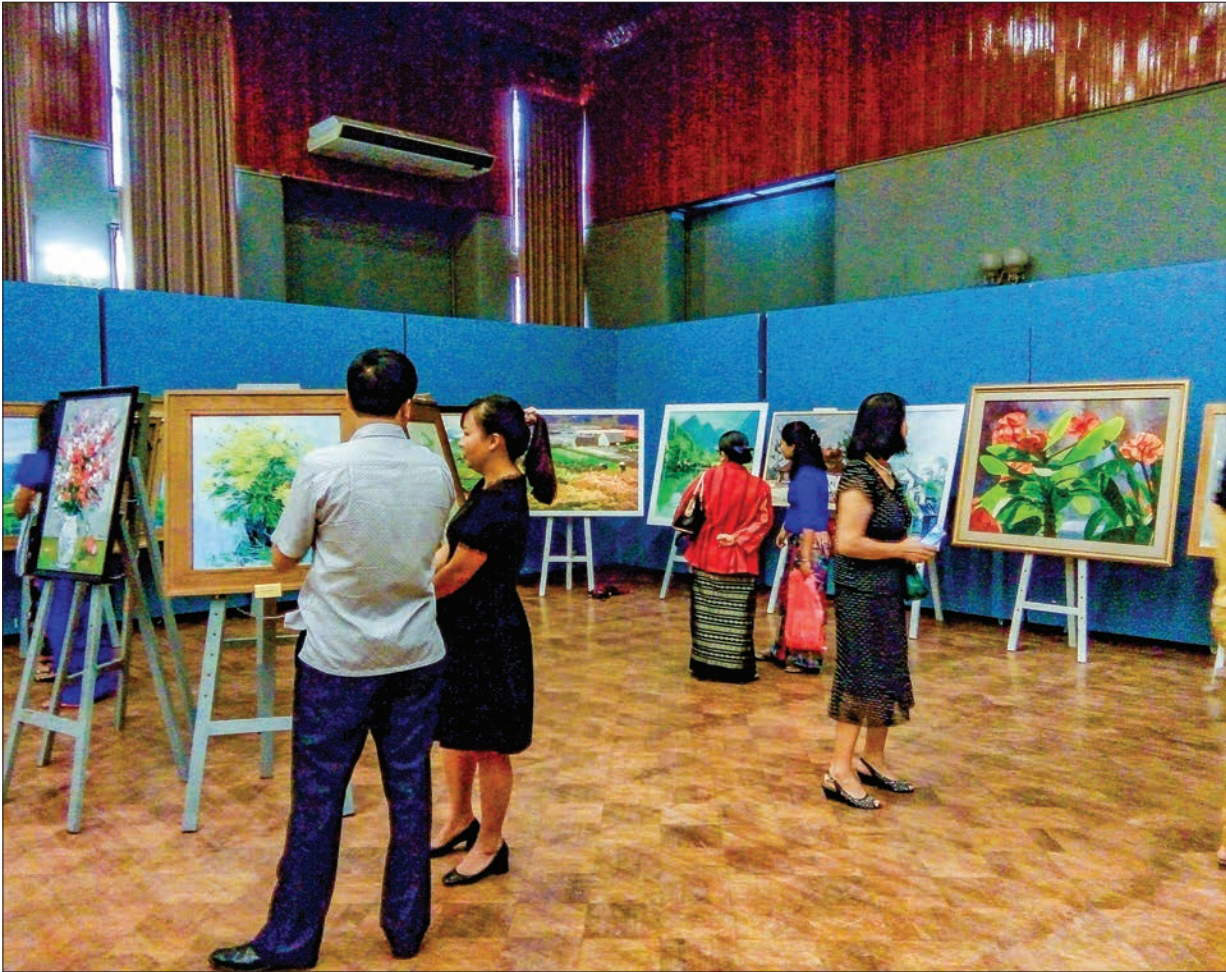
Visitors view paintings at the Myanmar-Viet Nam art exhibition at the National Theatre in Yangon.

Twenty-nine paintings of Viet Nam and 23 of Myanmar showing the charm and beauty of both countries are displayed at National Theatre in Yangon.