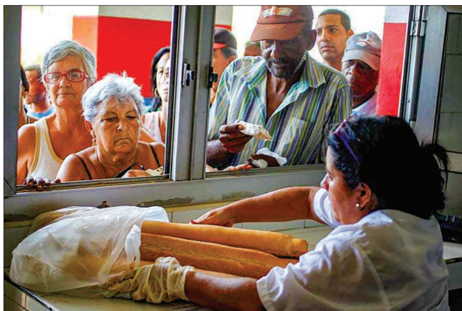
People line up to buy bread after Hurricane Irma caused flooding and a blackout in Havana, Cuba, on 11 September 2017.

The WFP already had more than 1,600 tonnes of food pre-positioned around Cuba available to distribute and had funds to buy more. It would start by distributing for free rations of rice and beans in the most vulnerable areas. Irma's impact on food availability