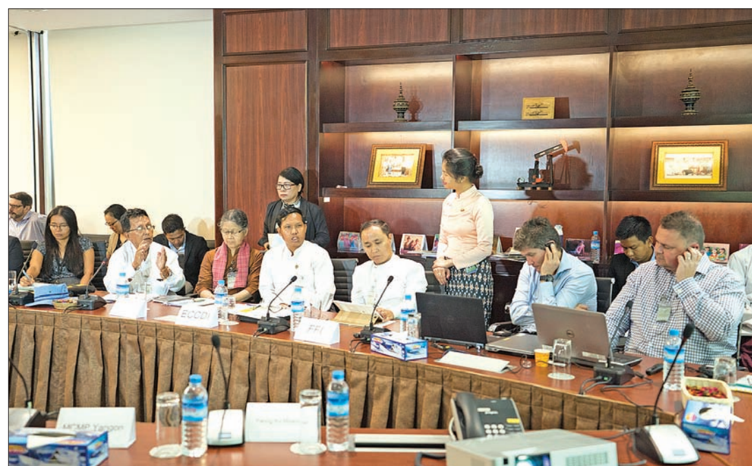
Environmental Impact Assessment (EIA) workshop in session to construct an offshore gas production base in Rakhine State.

The offshore supply base is planned to be completed in 2020-2021, and once it is completed, it will support offshore gas production in the offshore area of Rakhine State.—Taya ■