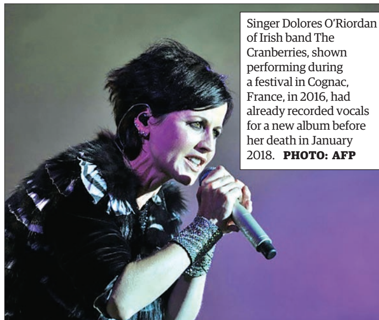
Singer Dolores O’Riordan of Irish band The Cranberries, shown performing during a festival in Cognac, France, in 2016, had already recorded vocals for a new album before her death in January 2018.

LONDON - Irish rockers The Cranberries said Wednesday they would go ahead with a new album despite the sudden death of singer Dolores O’Riordan in January.