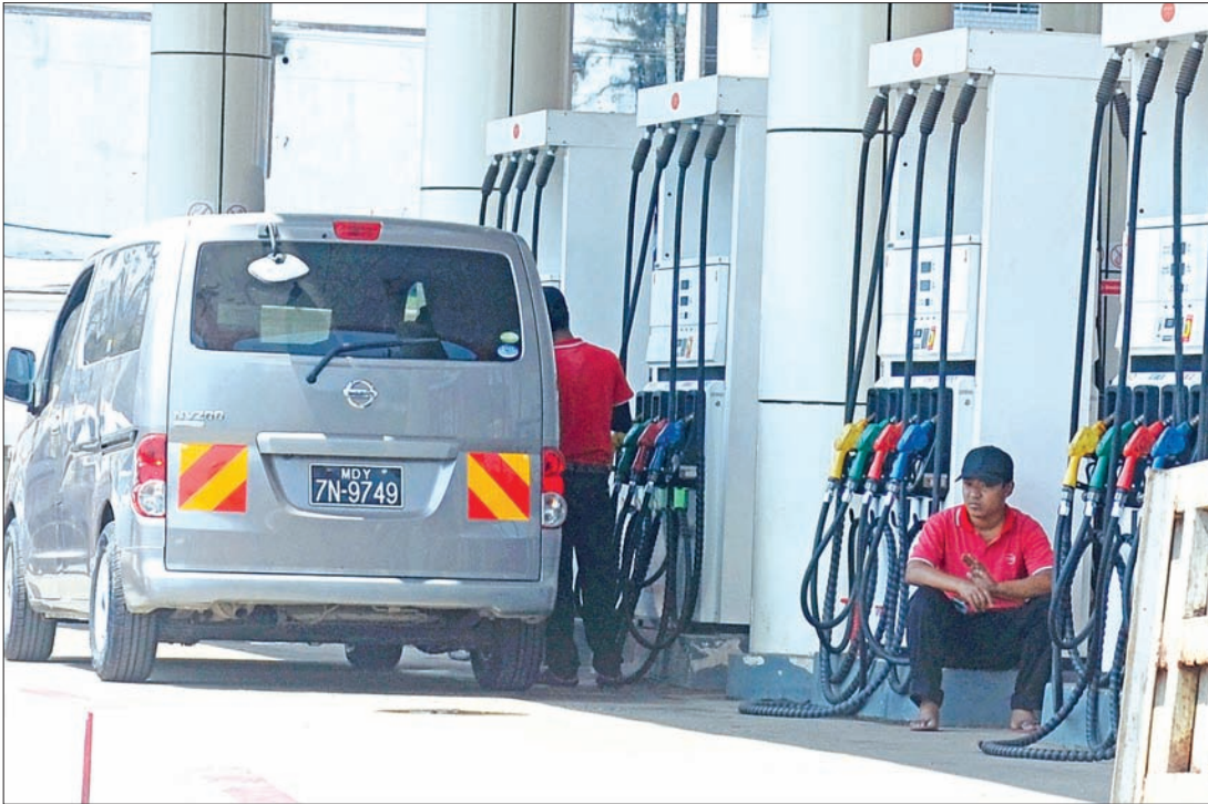
An employee at a gas station fills up a car while his colleague waits for another customer.