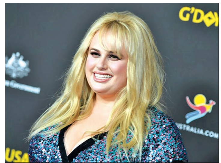
Hollywood actor Rebel Wilson spent more than Aus$1.3 million (US$1.1 million) to win Australia’s largest defamation payout and she is now chasing publisher Bauer to pay those costs as well.

“The Remix” will be launched on Amazon Prime Video on 9 March.—PTI ■