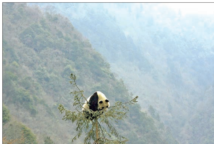
The Chinese park plans are aimed at enabling wild pandas that are currently isolated in several different areas of Sichuan, Shaanxi and Gansu provinces to mingle and hopefully breed.

Plans for the park — which would cover 27,134 square kilometres (10,476 square miles) — were first put forward early last year by the ruling Communist Party and the State Council, China’s cabinet, the paper said. Yellowstone, established in 1872 as the first US national park, spans 8,983 square kilometres. The Chinese park plans are aimed at enabling wild pandas that are currently isolated in several different areas of Sichuan, Shaanxi and Gansu provinces to mingle