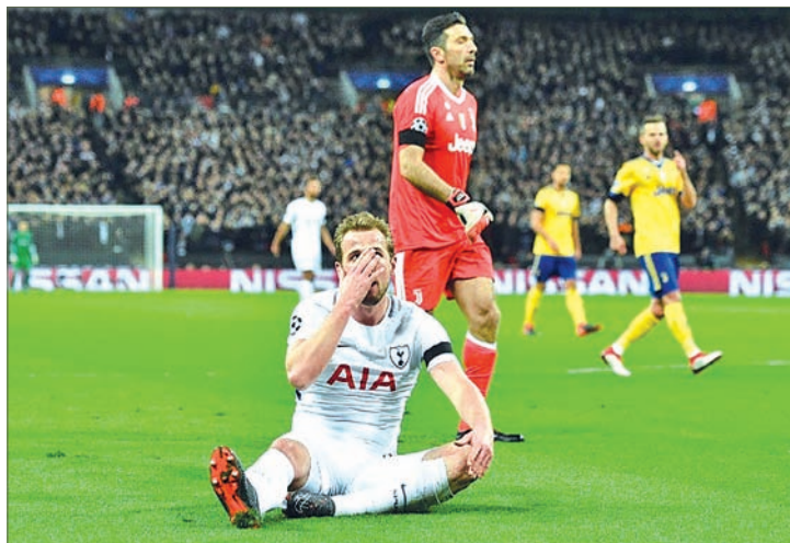
Tottenham's Harry Kane holds his head in his hands after a chance goes begging against Juventus.

It was a bitter blow for Tottenham and the loss raised fresh questions about their ability to win major trophies under Pochettino. But, yet to land any silverware with the north Londoners, Pochettino bristled at suggestions Tottenham aren't