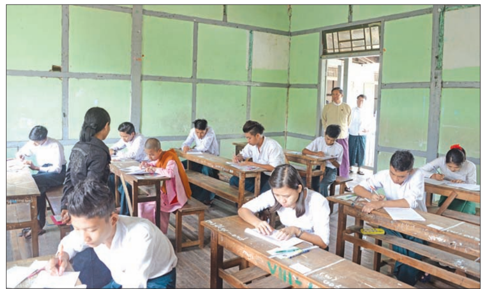
Union Minister for Education Dr. Myo Thein Gyi, far back, inspects students sitting in the matriculation exam in Lewe Township.

On the second day of the 2018 matriculation examination for the English subject, some 789,070 students of the