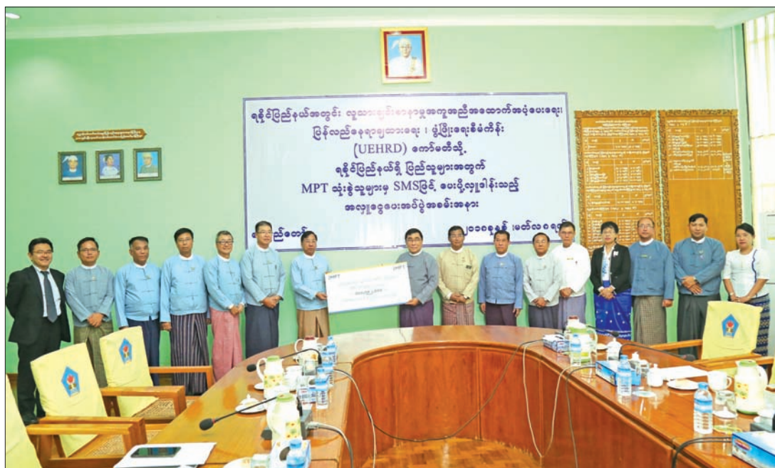
Permanent Secretary of Ministry of Transport and Communications U Chit Way hands over K101,792,000 to Union Minister Dr. Win Myat Aye.