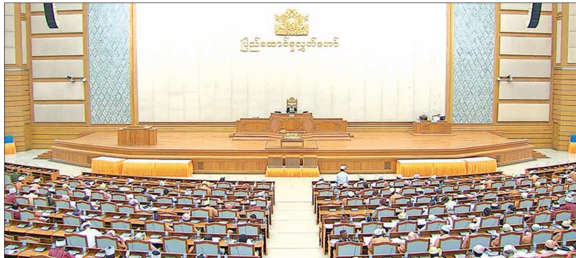
MPs discuss various tax systems and stock shares at the 13th day of the Seventh Regular Session of the second Pyidaungsu Hluttaw in Nay Pyi Taw.