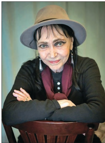
Danish-French actress Anna Karina poses during a photo session in Paris, on 2 March, 2018. She is revelling in a comeback at the age of 77.

It was also where she became Anna Karina.