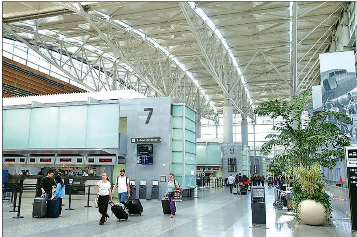
San Francisco International Airport is among the structures built mostly on landfill.

Brunei is expected to introduce China’s hybrid paddy varieties that can produce at least 12 tonnes per hectare in irrigated areas.—Xinhua ■