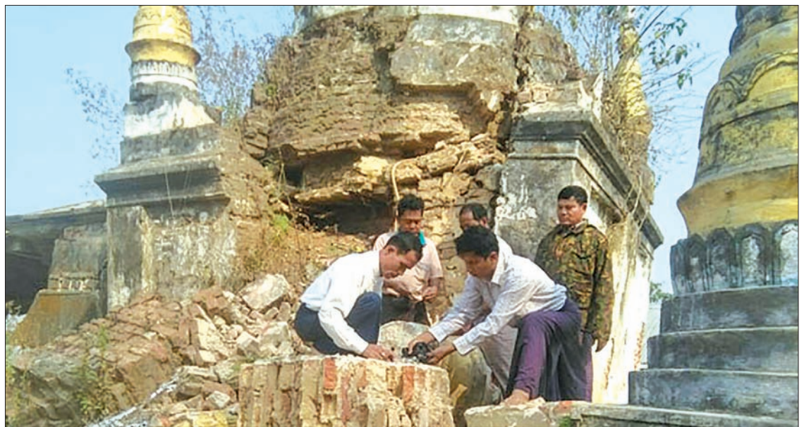
Local residents from Ottara Thiri Township, Nay Pyi Taw, salvaging pieces of a pagoda partially destroyed by a 5.5 magnitude earthquake yesterday.

The quake was strong enough to knock down the diamond bud of a 55 ft. high pagoda in Mau Lay Bin village. It also caused severe damage to the bottom of a 45ft high pagoda in Moe Swe village in Ottara Thiri Township, including the collapse of a nine feet high