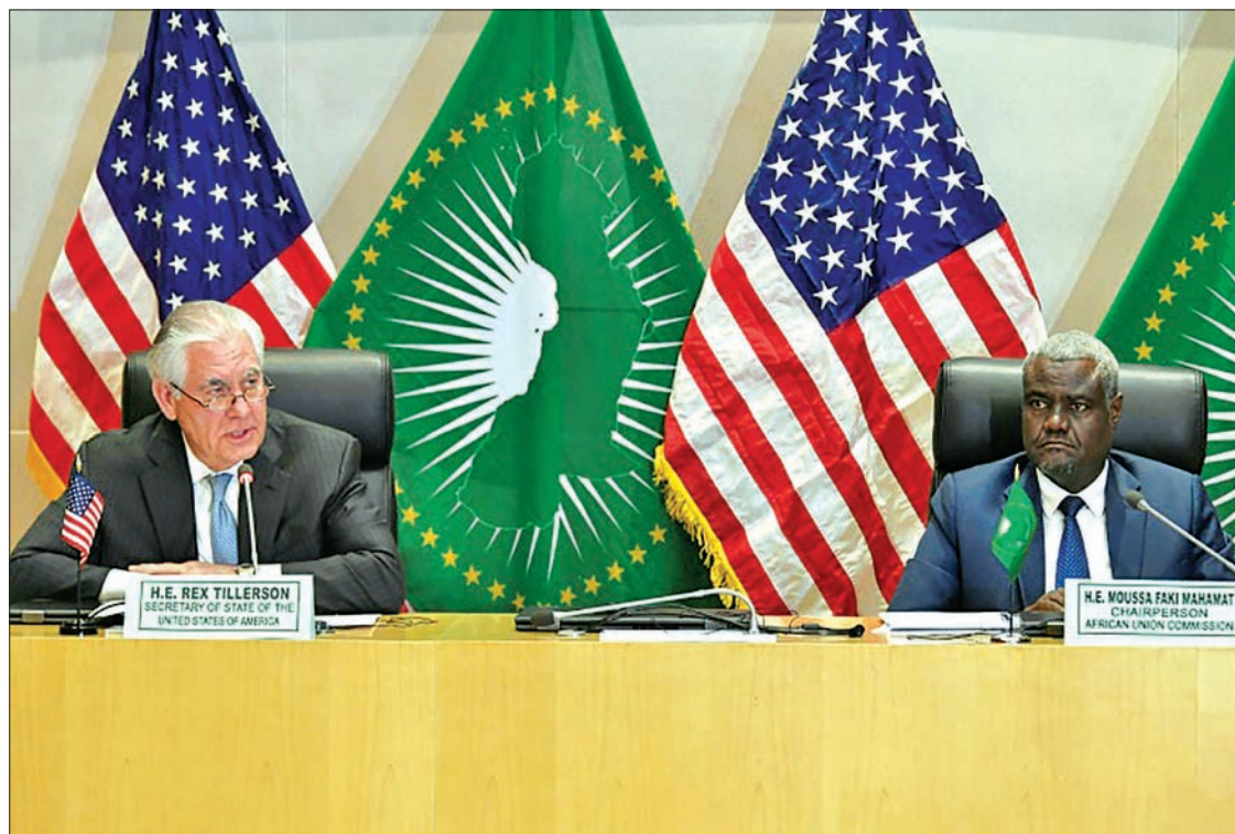
US Secretary of State Rex Tillerson, at a press conference with the African Union's Moussa Faki.

"I received a letter written by President Trump to myself and I shared that with other African leaders. I believe this