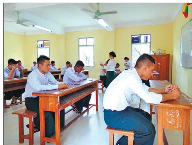
Inmates from Insein Correctional Department taking the matriculation examination for 2018.

Private donors also provided cash assistance to those who registered for the exam in the prison.