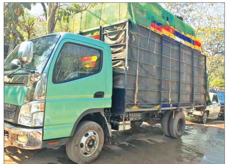
The truck used to smuggle live chickens illegally imported from Thailand into Hpa-an, Kayin State.

The Hpa-an police force is preparing to take action against the two truck drivers under the Animal Health and Development Law. The live chickens were sent to the Hpa-an District Livestock Breeding and Veterinary Department, according to the Hpa-an police force. —Nay Myo Lwin (IPRD)