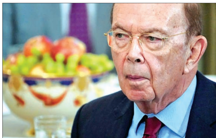
Commerce Secretary Wilbur Ross says the US wants "sensible relations" with allies and isn't looking for a trade war.

As markets fell on news that Wall Street favorite Gary Cohn, Trump's top economic adviser, had resigned from the White House in protest at Trump's trade decision and global partners vowed retaliation, Ross tried to calm fears of a trade war.