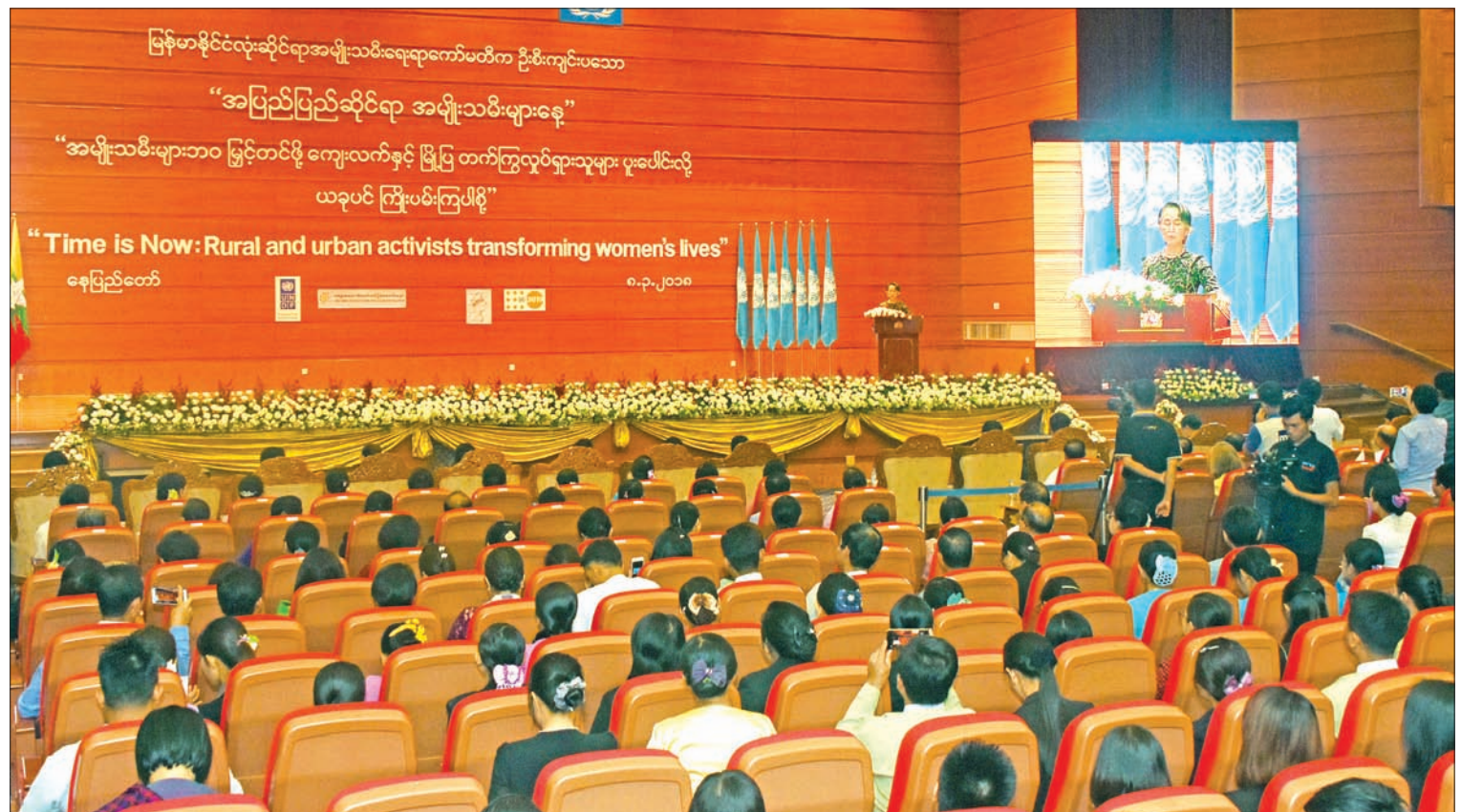
State Counsellor Daw Aung San Suu Kyi addresses the International Women's Day event in Nay Pyi Taw yesterday.

Yesterday's ceremony was also attended by First Lady Daw