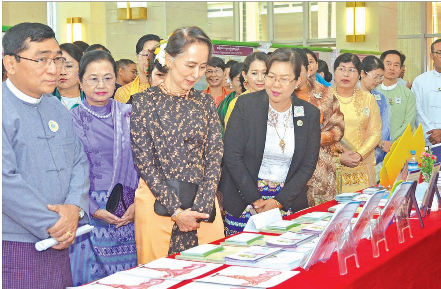
Daw Aung San Suu Kyi visits a booth displaying periodicals at the event celebrating International Women's Day in Nay Pyi Taw.