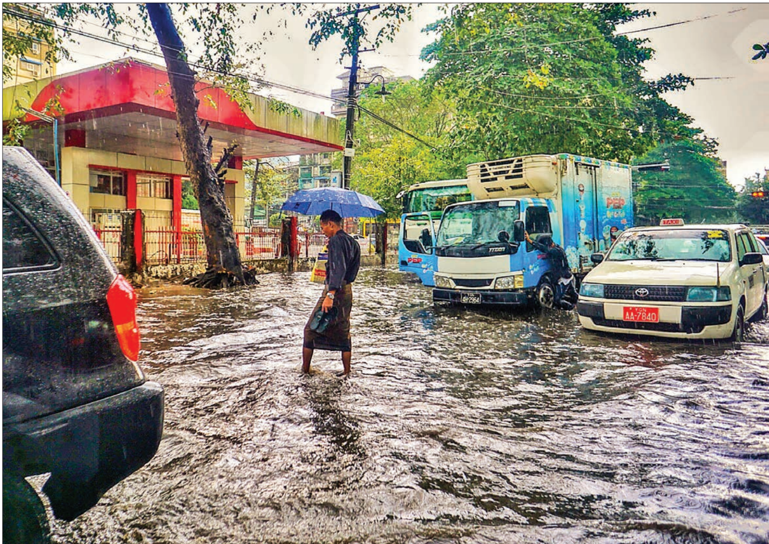
This scene on Baho Road near Bagayar Street in Sangyaung was one of the intersections that flooded yesterday afternoon. The high water slowed traffic to a crawl and caused one truck to stall. Scattered rain is expected over several parts of Myanmar today.