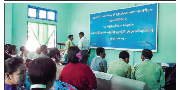
Rehabilitation program for drug addicts opened by Department of Social Welfare in Mandalay.