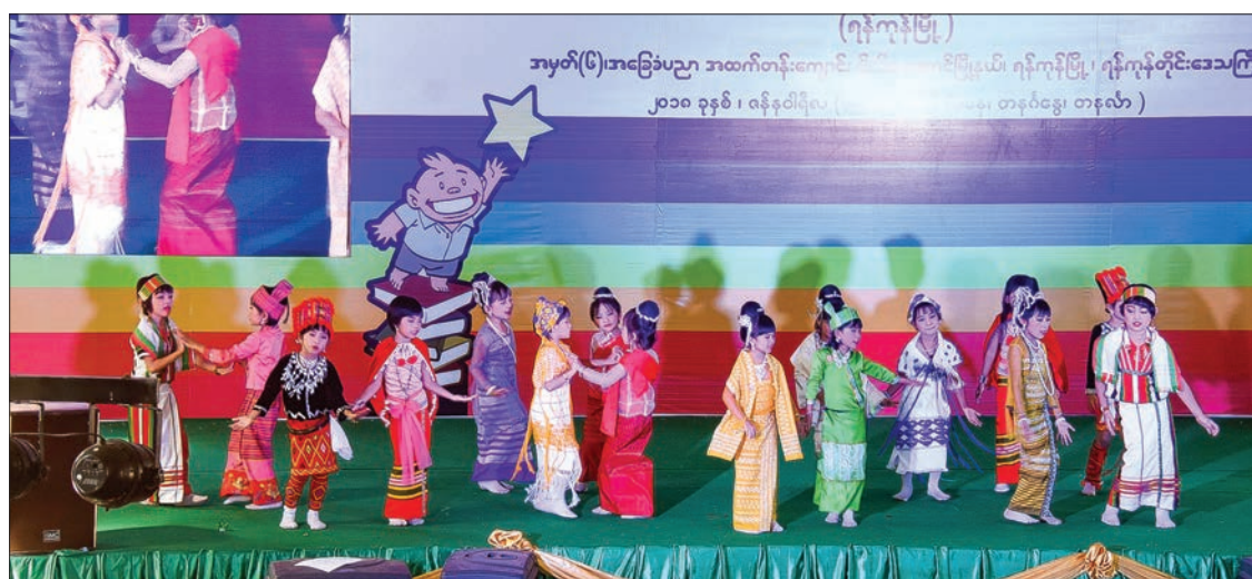
Children wearing traditional dress perform at the Children's Literature Festival.