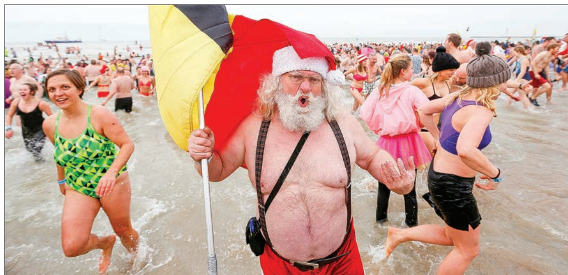
A participant holds a Belgian flag during the annual New Year's plunge event in Ostend, Belgium on 6 January 2018.