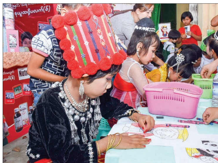
Students participate in the painting event.