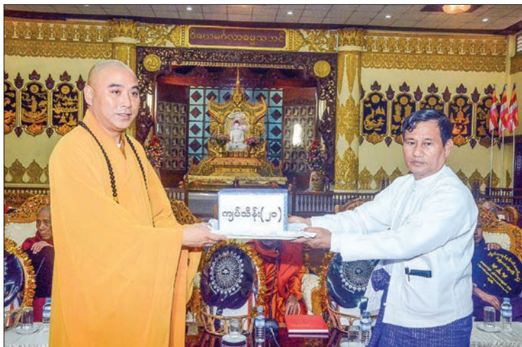
Chinese Buddhist delegation presents K2 million donation for "soon" a day meal for monks through an official.