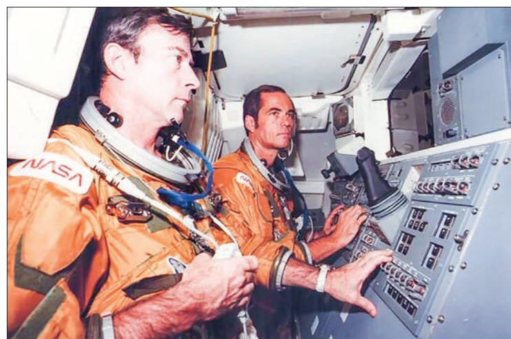
Looking aft toward the cargo bay of NASA's Space Shuttle Orbiter 102 vehicle, Columbia, Astronauts John Young (L) and Robert Crippen preview some of the intravehicular activity expected to take place during the orbiter's flight test, at Kennedy Space Center, on 10 October 1980.

As mission commander, he and crewmate Charles Duke explored the moon's Descartes Highlands region, gathering 200 pounds (90 kg) of rock and soil samples and driving more than 16 miles (26 km) in the lunar rover to sites such as Spook Crater. —Reuters ■