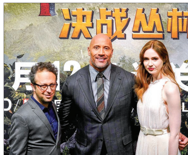
Cast members Dwayne Johnson (L) and Karen Gillan attend a news conference promoting their film “Jumanji: Welcome to the Jungle” in Beijing, China on 4 January, 2018.

20th Century Fox’s musical biopic “The Greatest Showman” came in fourth with an estimated 13.8 million dollars in its third weekend. Universal’s musical comedy film “Pitch Perfect 3” finished fifth with an estimated 10.2 million dollars in its third weekend. —Xinhua ■