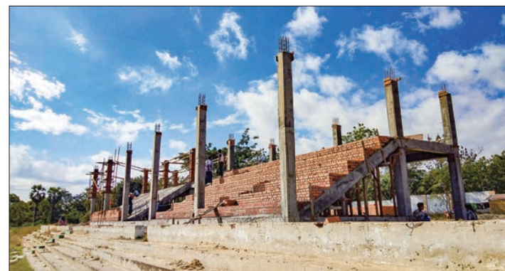
Grandstand seating for spectators construction site at Myoma athletic field.

CONSTRUCTION of grandstand seating for spectators at Myoma athletic field in Mahlaing Township, Mandalay Region, is now fifty per cent complete according to U Win Naing, assistant department head of Sports and Physical Education in Mahlaing Township.