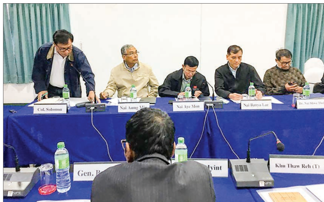
United Nationalities Federal Council-UNFC members seen during the meeting in Chiang Mai.

The nine-points proposed by the UNFC have been discussed for more than 17 months between the DPN and the PC. — Ye Khaung Nyunt