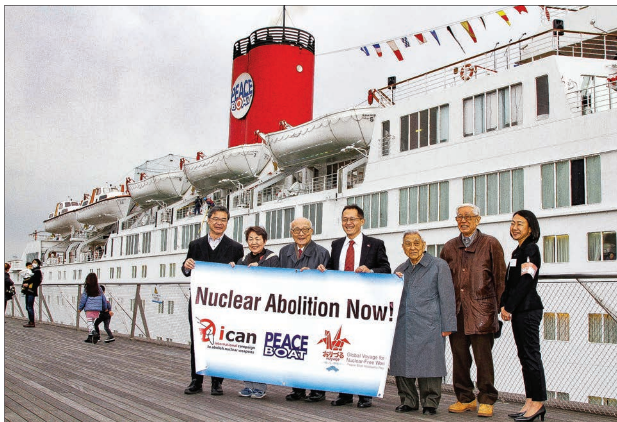
Passengers on a Peace Boat ship, including survivors of the 1945 US nuclear bombings of Hiroshima and Nagasaki, pose for a photo at Yokohama Port on 8 January, 2018, before leaving for an eight-nation tour of Asia and Oceania.