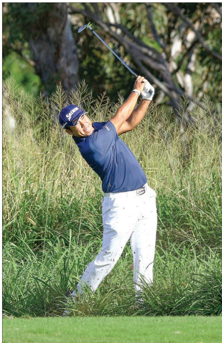
Hideki Matsuyama of Japan hits an iron from the fourth-hole rough during the third round of the Tournament of Champions in Kapalua, Hawaii on 6 January, 2018.

"It's still a long (season) from here, the last day will be an important round. I want to