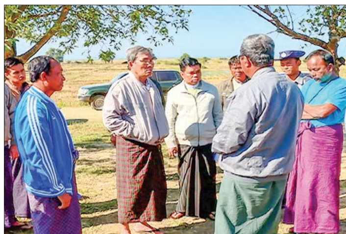
Rakhine State Chief Minister U Nyi Pu makes a field visit in Maungtown Township, Rakhine State.

Next, they met with ethnic villagers in Thinbawkwe for whom they had some words of encouragement. They then went to Innadin Village and instructed the officials concerned on area security, regional peace and de-