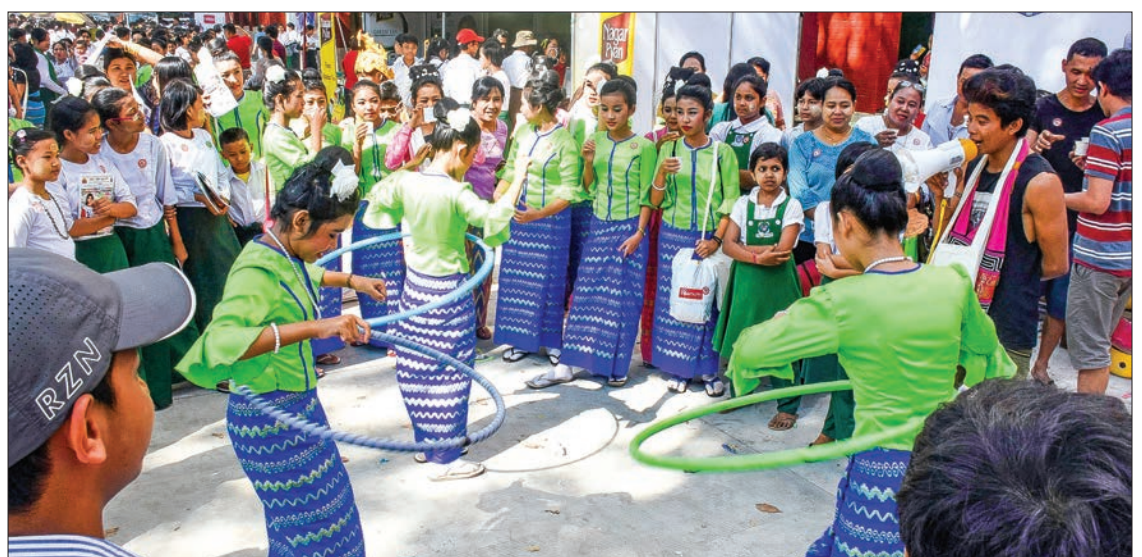
Students competing exercise with the hula hoop at the Children's Literature Festival.