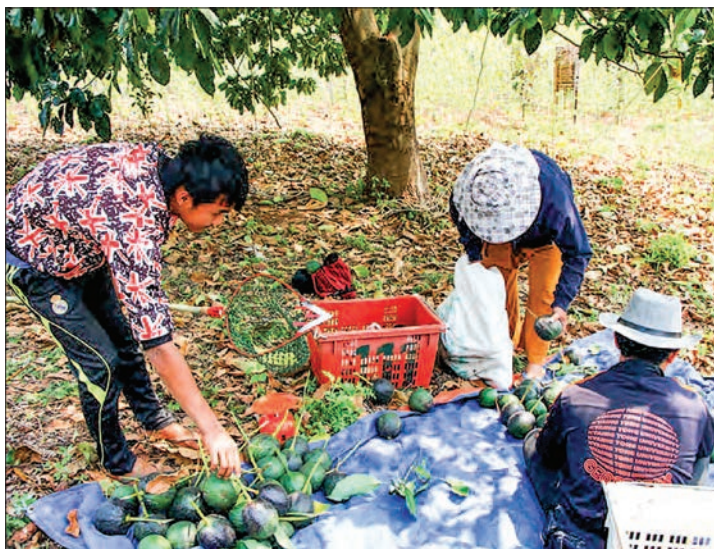
Workers pick avocados during harvest at a farm.

Avocado growers in Myanmar have been calling for