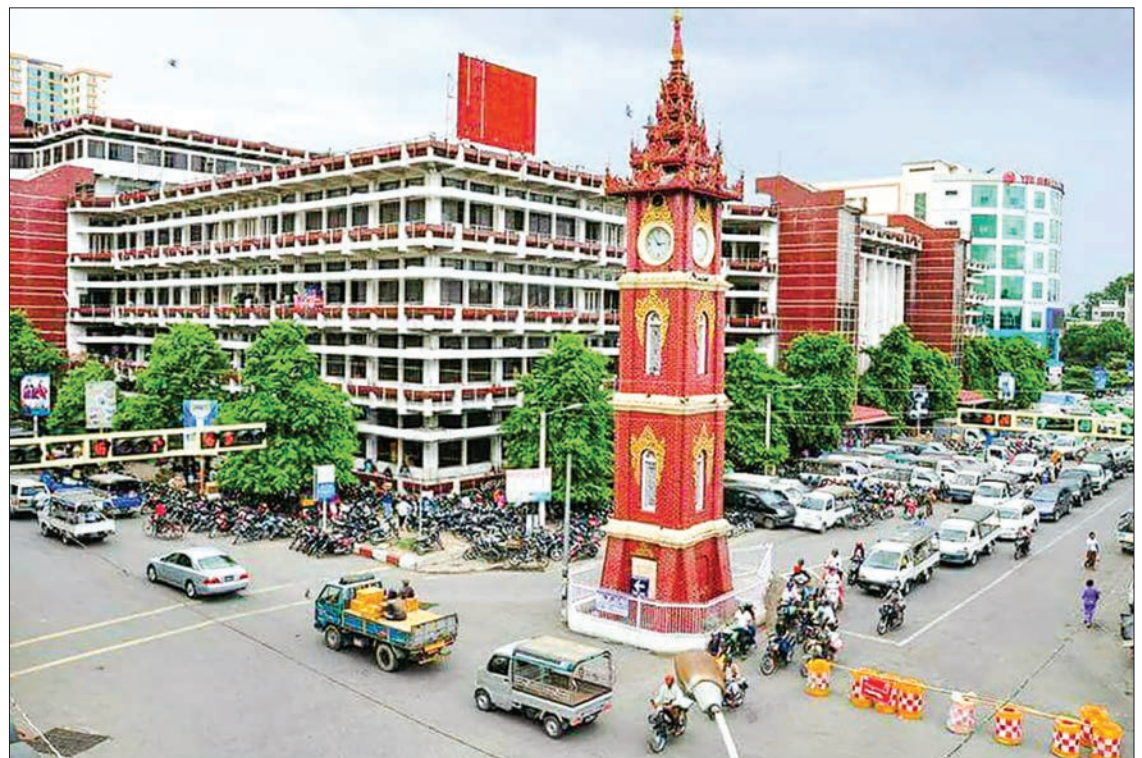
Mandalay Zaygyo market, most famous and Biggest wholesale market, to renovate depend on budget available.

A wide range of products and items are available at the unique market which is situated strategically in the upper capital of the country.—Myanmar Digital News ■