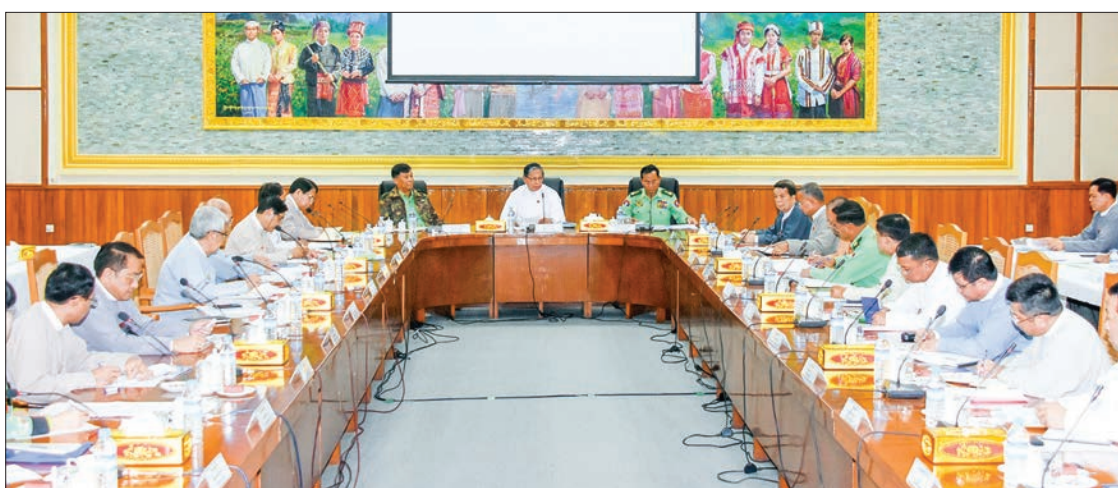
The central committee for holding the Union Peace Conference-21 st Century Panglong holds a meeting in Nay Pyi Taw yesterday for organizing a third session of the Union Peace Conference.

ternational Cooperation U Kyaw Tin, on behalf of the Invitation Work Committee chairman; Reception and Lodging Work Committee chairman Union Minister for Border Affairs Lt-Gen Ye Aung; Transportation Work Committee chairman Deputy Minister for Transport and Communica-