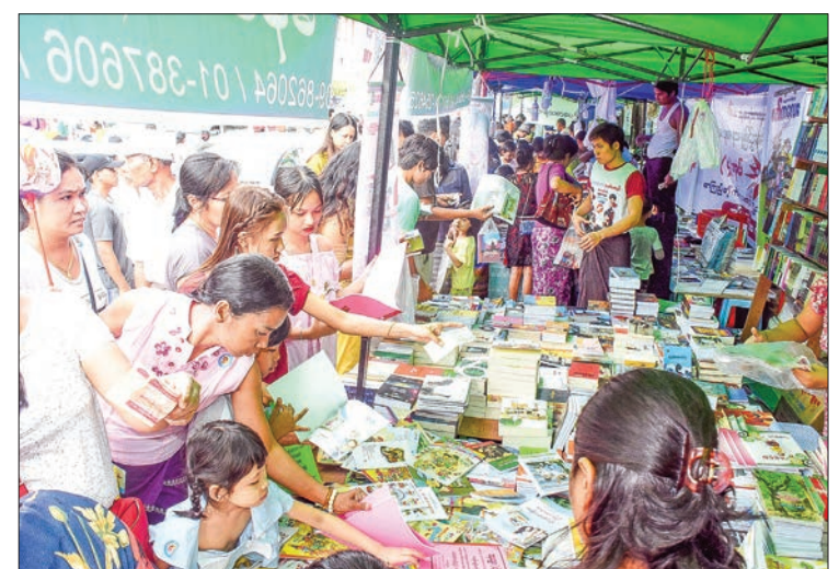
Book shops are crowded with visitors.

In the individual competition, there are some 56127 children took part in the game-playing, along with 16,628 children on 6th January, 22,648 children on 7th January and 16,851 yesterday totalling 56,127. ■