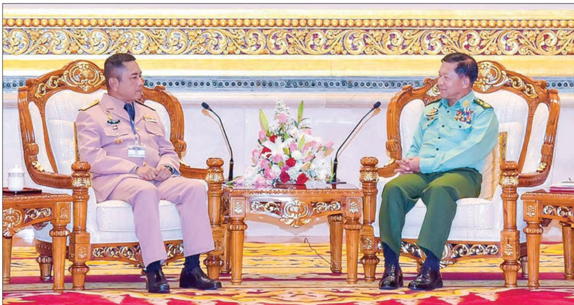
Senior General Min Aung Hlaing holds talks with Commander-in-Chief of the Royal Thai Navy Admiral Naris Phatoomsuwan in Nay Pyi Taw.