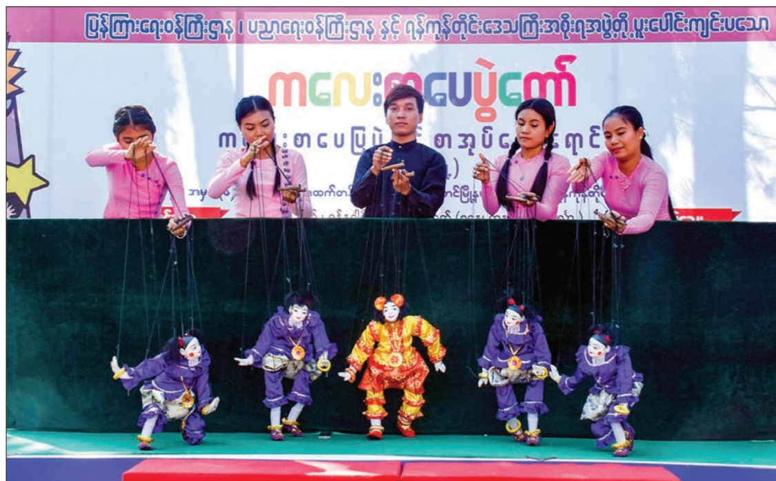
Traditional puppet show performs at the Children's Literature Festival.