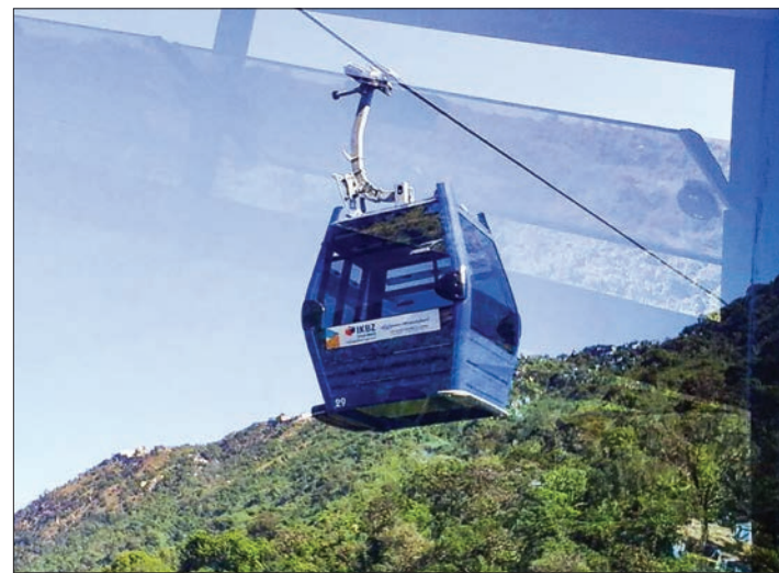
Cable car runs between Rathittaung station and Kyaikhtiyo Pagoda on the skyline.