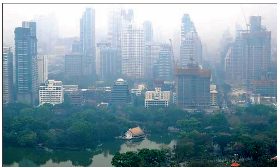
The skyline is seen through morning air pollution in Bangkok, Thailand 08 February 2018.

"We've received information from my daughter's