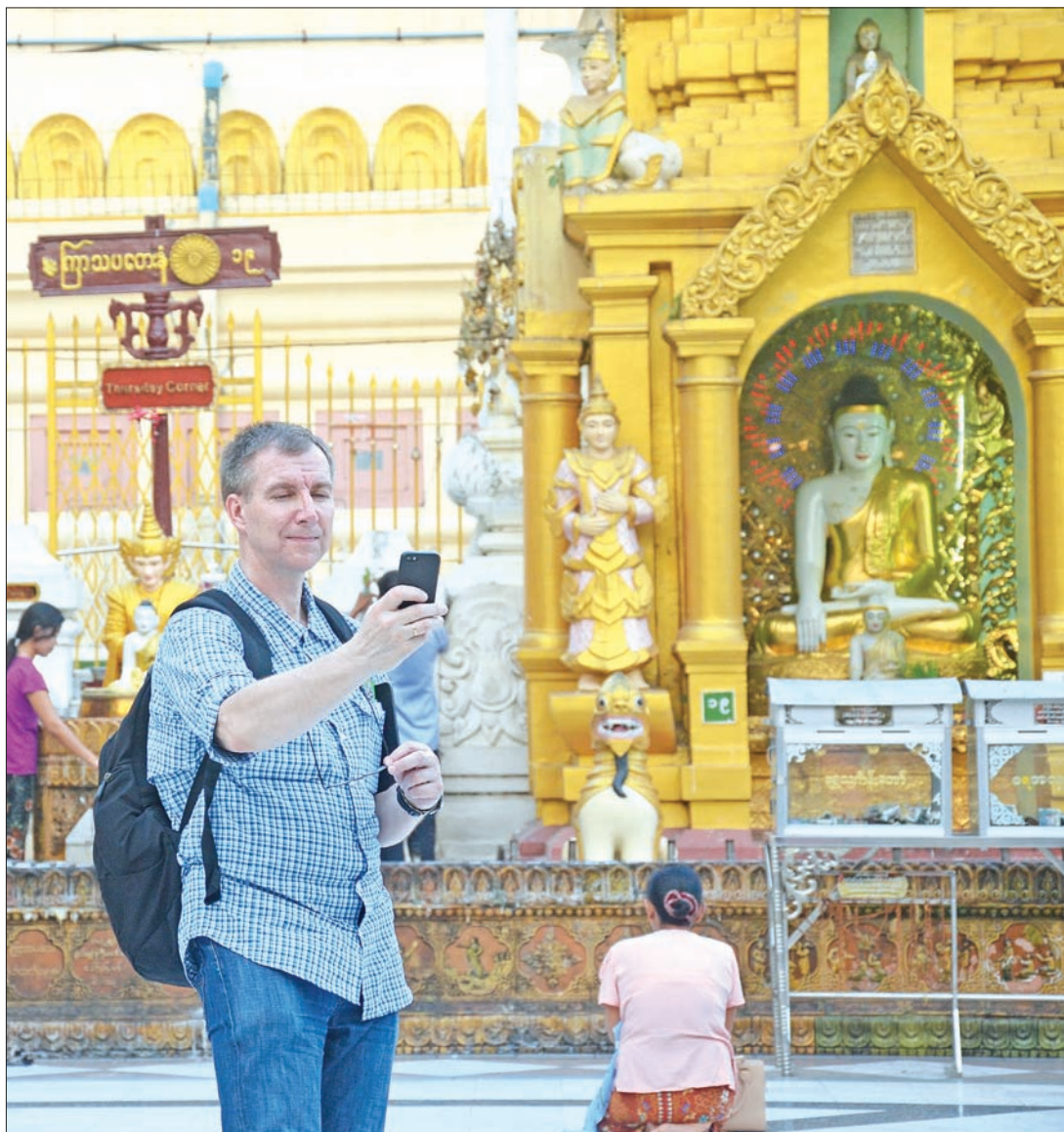
A tourists takes a photo with his smart phone at Shwedagon Pagoda in Yangon.

The entrance fees for the Shwedagon pagoda increased to Ks10,000 on 1 December 2017 from Ks8,000. —GNLM ■