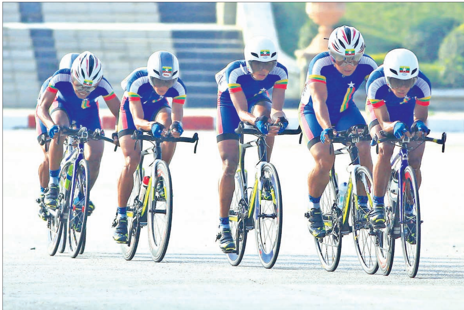
Cyclists contest with their best effort in 2018 Asian Road and Para Cycling Championship in Nay Pyi Taw yesterday.

"I had that short stint with Sam with England and to see it now every day, the way the intensity of training is and how demanding it is has been great. I like to go into training every day and try to be better than the day before." Everton are 10 th in the league with 31 points and go into Saturday's home Premier League clash against Crystal Palace on the back of a 5-1 thumping by Arsenal but Walcott said Allardyce was working hard to turn things around.—Reuters ■