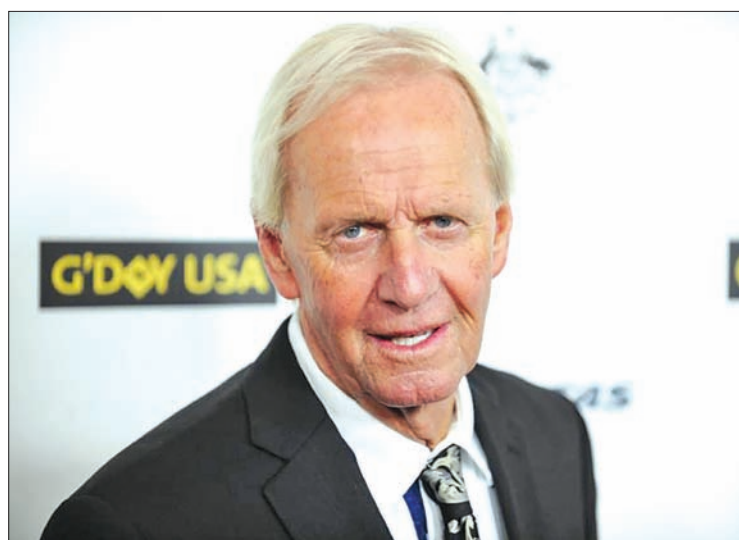
Australian actor Paul Hogan arrives during the G'Day USA Black Tie Gala in Los Angeles, California on 11 January 2014.

The movie was a commercial and critical hit, garnering the Australian actor a Golden Globe Award for best actor and an Acad-