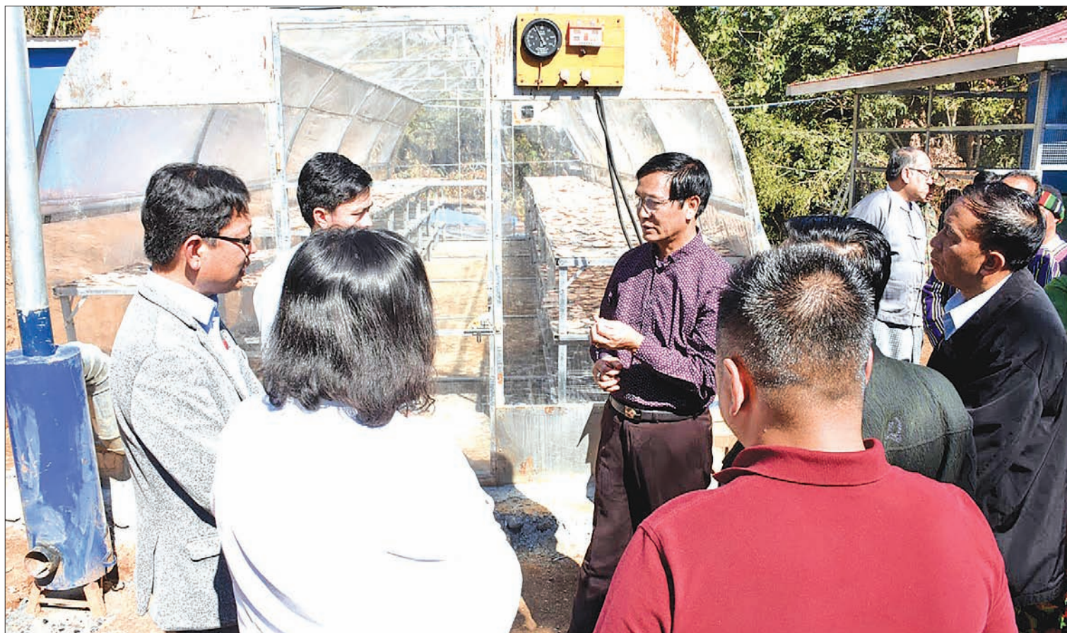
Vice President U Henry Van Thio visits the mountain fruits drying and value-adding work in Kanpetlet, Chin State.

"The Paletwa Bridge is scheduled to open in 2018-2019. The Laymyo River Project is also underway and it will become