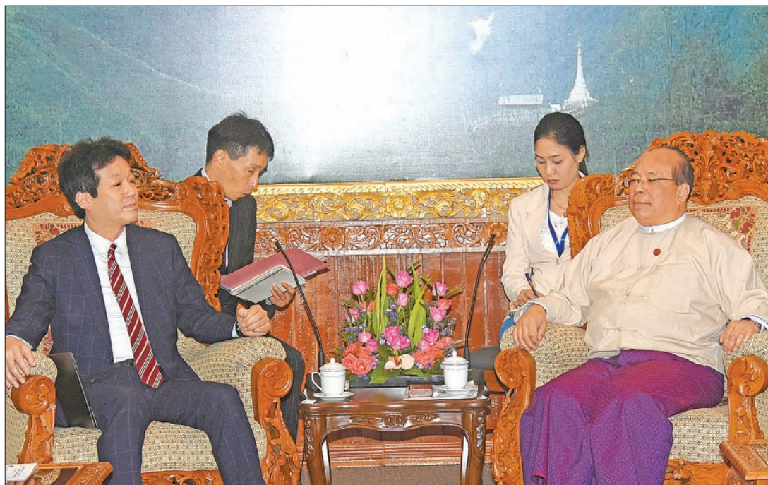
Union Minister for the Office of the Union Government U Thaung Tun meets Special Advisor to the Prime Minister of Japan (National Security) Mr. Kentaro Sonoura in Nay Pyi Taw.

U Thaung Tun, Union Minister for the Office of the Union Government, received Special Advisor to the Prime Minister of Japan (National Security), Mr. Kentaro Sonoura at 11 am