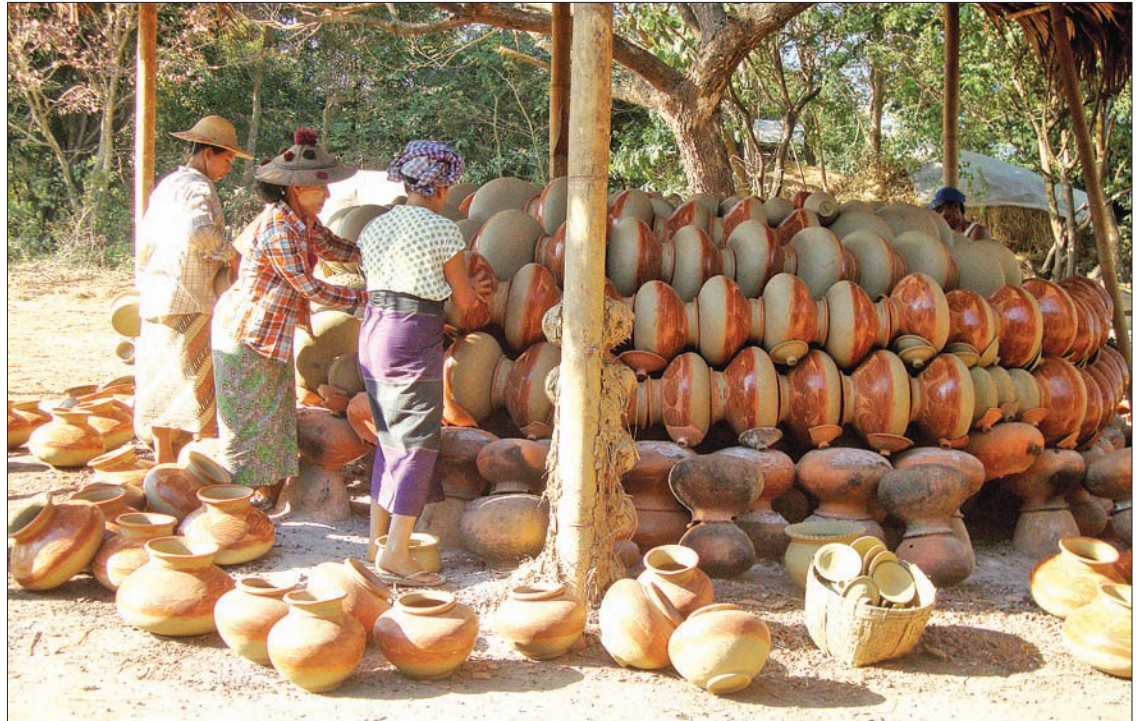
Workers sorting out pottery after the burning process.

"Pots are made of clay and there are four colors of clay; black, brown, sepia and yellow. The yellow color pot is the most attractive to make. First, the clay is soaked for one or two nights. Then, the