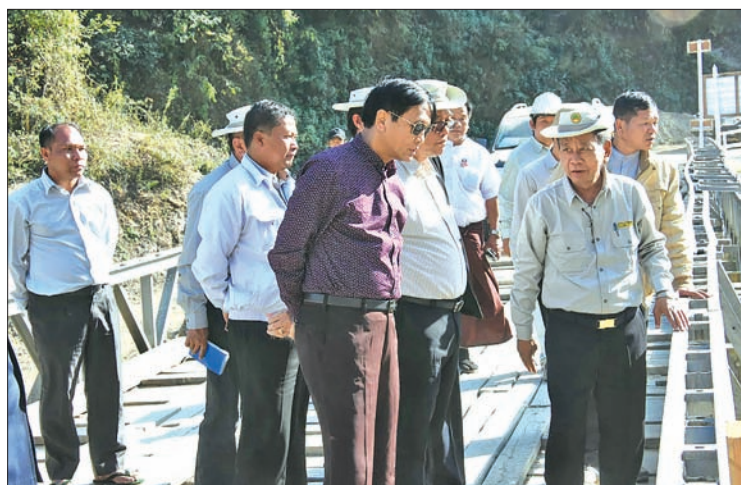
Vice President U Henry Van Thio inspects the construction site of Chichaung Bridge situated on the Kanpetlet-Mindat Road.