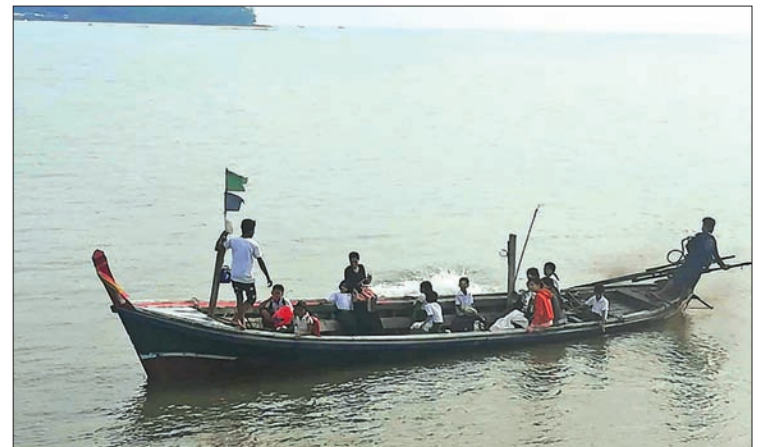
A ferry-boat carried students is seen in Andaman sea yesterday.

Children who live in villages near the sea went to school by ferry boat because some of the villages do not have post-primary schools. Relevant organizations should provide life-jackets, umbrellas and raincoats to those who have a difficult time commuting to school by ferry boat in addition a new school should be opened in Warkyun village that's affiliated according to the voices of the local residents.—Myanmar Digital News ■