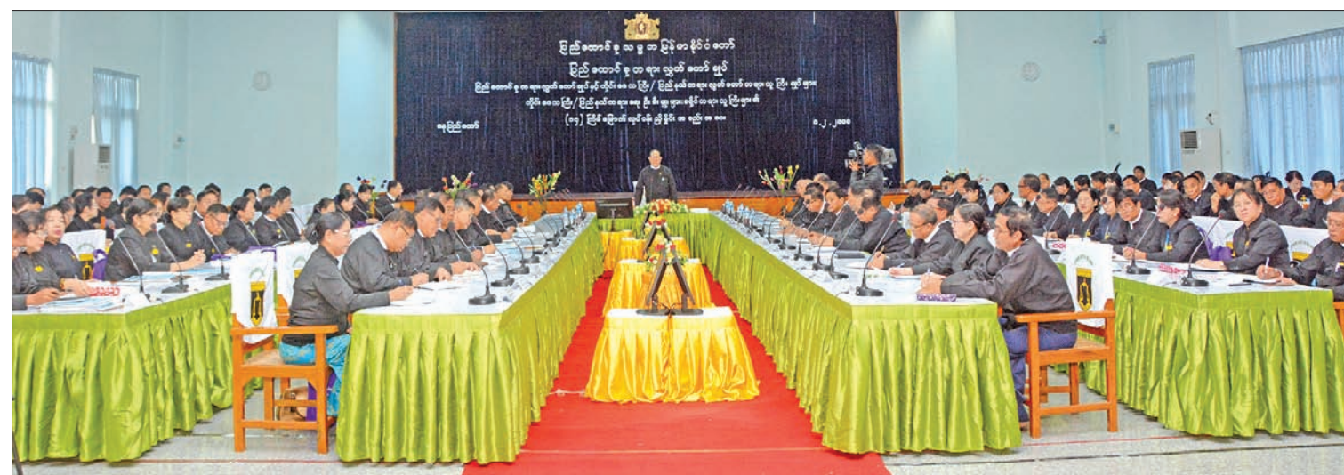
Union Chief Justice U Htun Htun Oo addresses the 14 th coordination meeting of the Union Supreme Court and states/regions High Courts.

"Freedom of the courts, integrity of the judges, impartial court processes and trust of the people on the courts' effective-