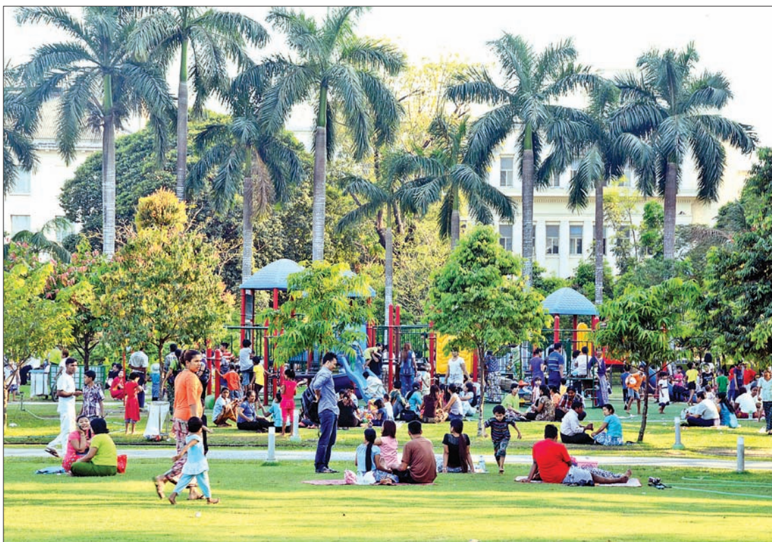
People relaxing on lush green floor at Maha Bandula Park in Yangon.

The major destination for the week is Shwe Sattaw Pagoda and Mawtin Soon Pagoda, and people are showing increased interest with travel packages to Dawei. After the matriculation exams there will be more travelling to Chin and Kachin states, specifically Myitkyina. —Zaw Gyi, Ohnmar Thant, Myat Sandi ■