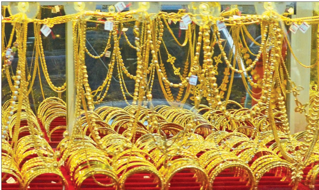
Gold jewellery displayed at a shop in downtown Yangon.