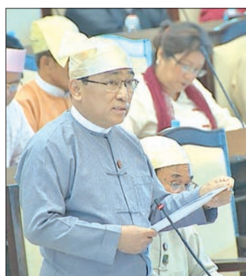
Union Minister Dr. Win Myat Aye.

Questions by U Kyaw Thaung of Sagaing Region constituency (1) and U Mahn Law Moun of Chin State constituency (8) on natural resources