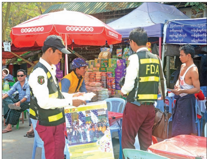
FDA workers distribute posters and pamphlets to the sellers and buyers in Nay Pyi Taw.

FDA is not only providing pamphlets, posters and stickers but also umbrellas and calendars with educational slogans.—Mee Mee Phyto ■