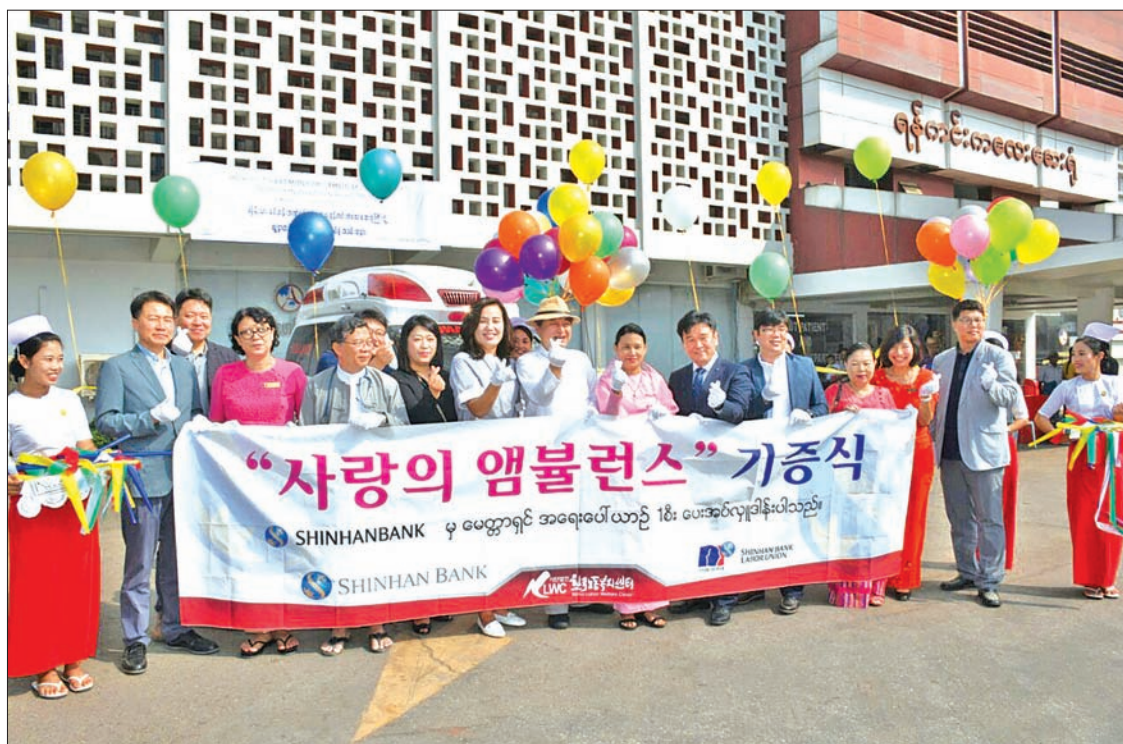
Shinhan Bank's employees, doctors and nurses pose for a photo in front of Yankin Children Hospital.