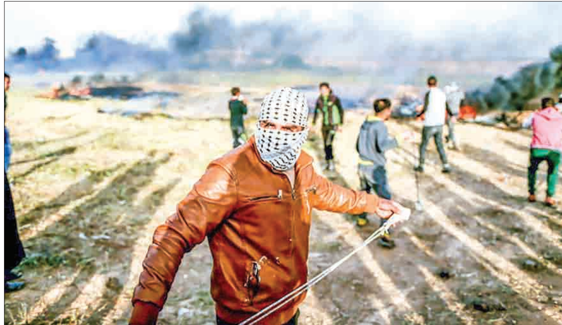
A Palestinian protestor uses a slingshot to throw a stone during clashes with Israeli forces at the Israel-Gaza border east of Gaza City on 4 April, 2018.

Tens of thousands demonstrated peacefully last Friday. But small groups of Palestinians approached the border, threw stones and rolled burning tyres towards Israeli troops who responded with live fire and tear gas. The Israeli response generated significant international anger, with critics accusing troops