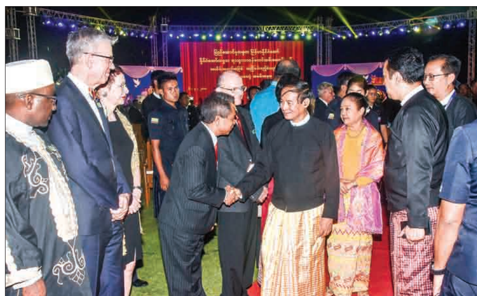
President U Win Myint and First Lady Daw Cho Cho greet guests at the dinner event marking the President's taking of office at the Presidential Palace in Nay Pyi Taw.