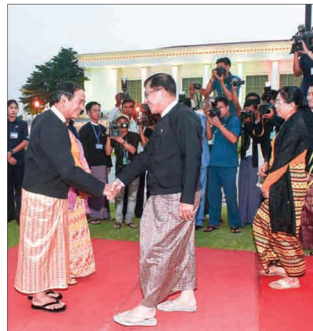
President U Win Myint and First Lady Daw Cho Cho greet Commander-in-Chief Senior General Min Aung Hlaing and wife Daw Kyu Kyu Hla at the dinner event marking the President's taking of office held on the lawn at the Presidential Palace in Nay Pyi Taw.