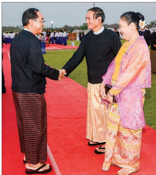
President U Win Myint and First Lady Daw Cho Cho greet Vice President U Myint Swe at the dinner event marking the President's taking of office held on the lawn at the Presidential Palace in Nay Pyi Taw.