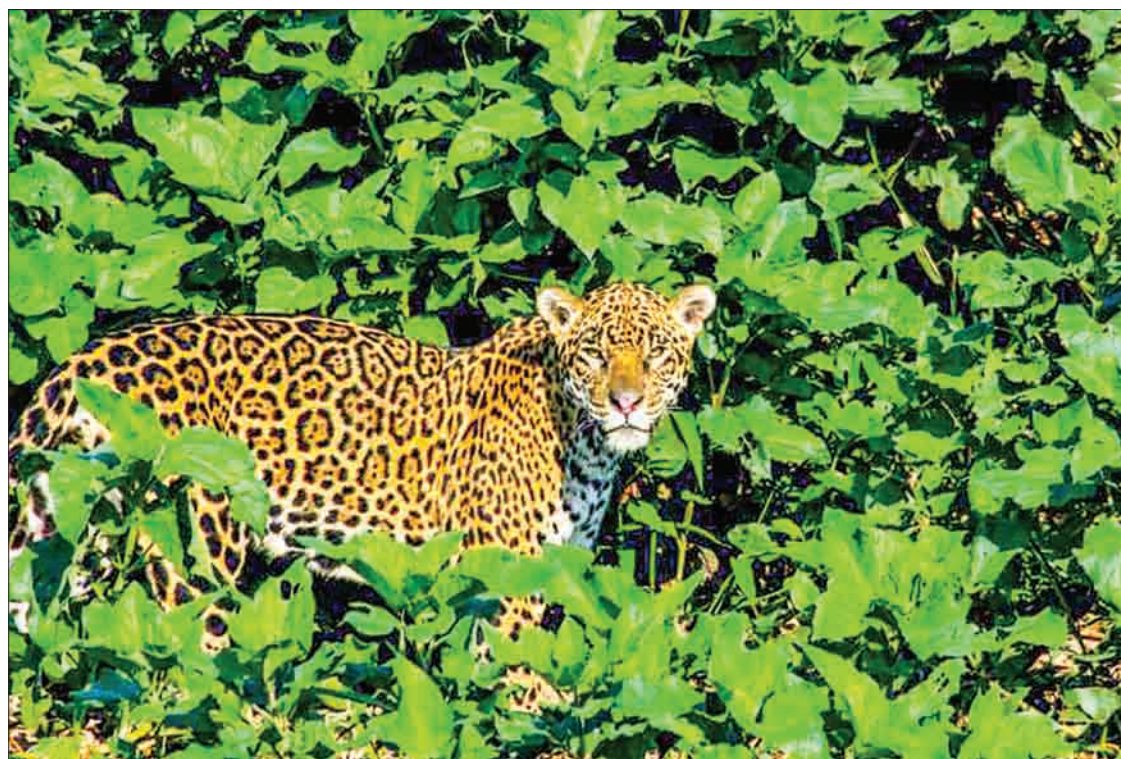
A handout photo showing a jaguar, which researchers believe number around 7,000 in Bolivia, but which are threatened by poaching driven by Chinese demand for teeth and skulls.

President Evo Morales' leftist government has awarded seven billion dollars' worth of public works contracts to Chi-