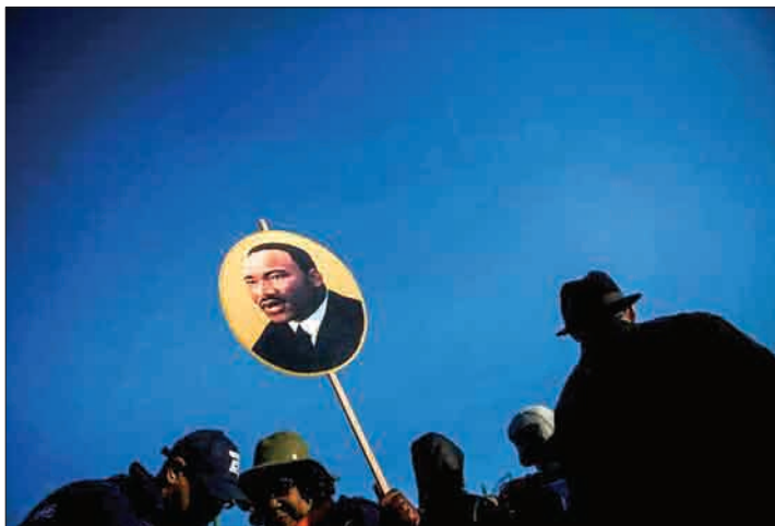
A woman holds an image of Martin Luther King Jr. on the 50 th anniversary of his assassination 4 April 2018 in Memphis, Tennessee.

Addressing thousands of dignitaries and everyday Americans who gathered for an anniversary ceremony at the motel, which has been transformed into the National Civil Rights Museum, Jackson recalled the "pow!" of the gunshot that slew his movement's leader.