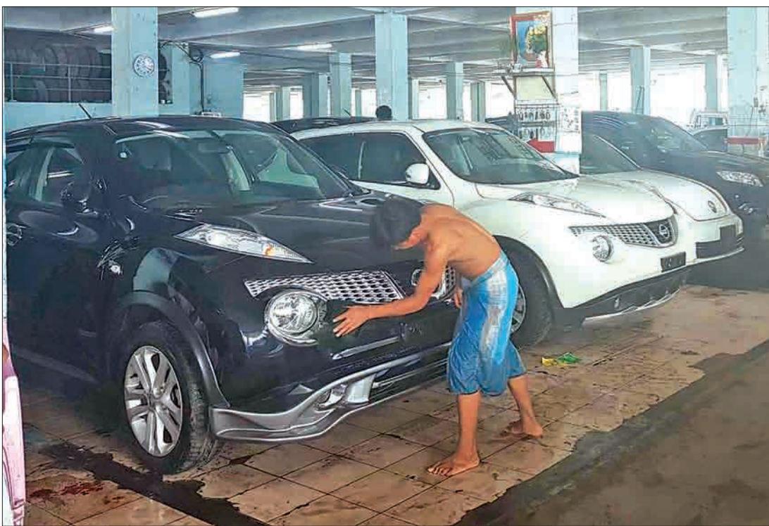
A worker cleans car at a sales centre in Yangon.

During the nearly two-month suspension, more than 2,000 vehicles were stranded at Myawady gate. Similarly, some 150 cars were banned from being claimed. The Myanmar Automobile Purchase and Sale Enterprise (Yangon) requested the officials concerned to revoke the ban. ■