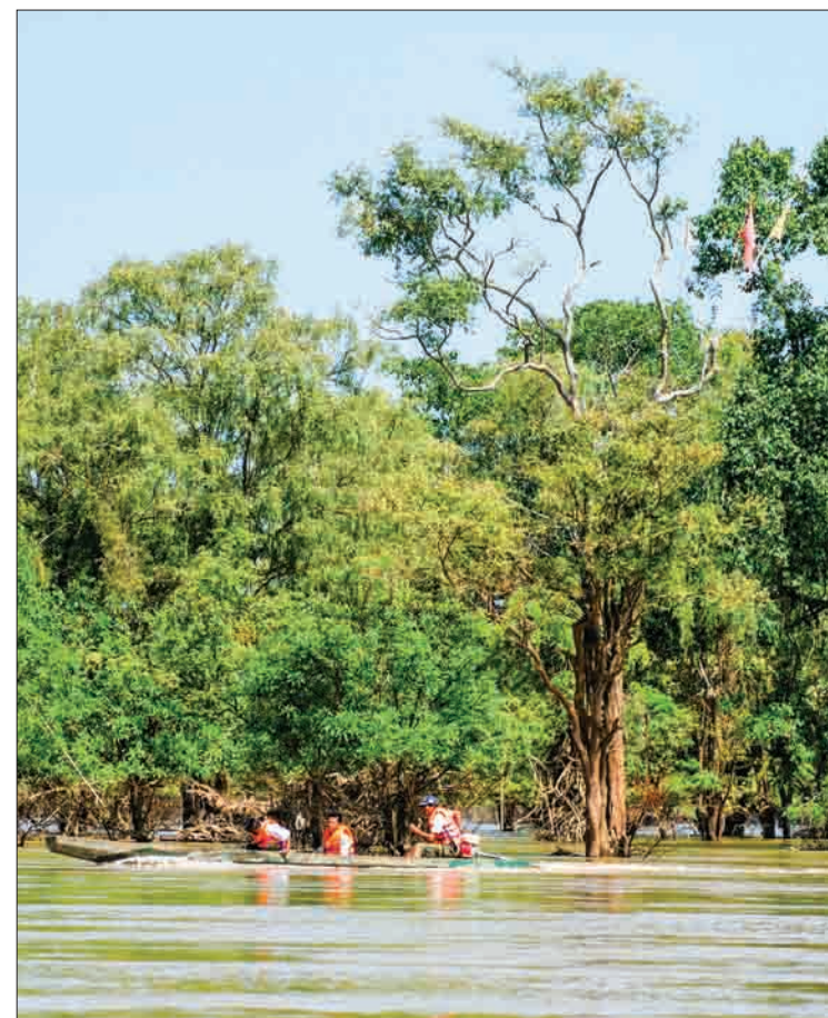
Photo taken in October 2013 shows a forest along the Mekong River in the suburbs of Stung Treng, Cambodia.

It is the third meeting of its kind, the previous ones having been held in Viet Nam in 2014 and in Thailand in 2010. —Kyodo News ■