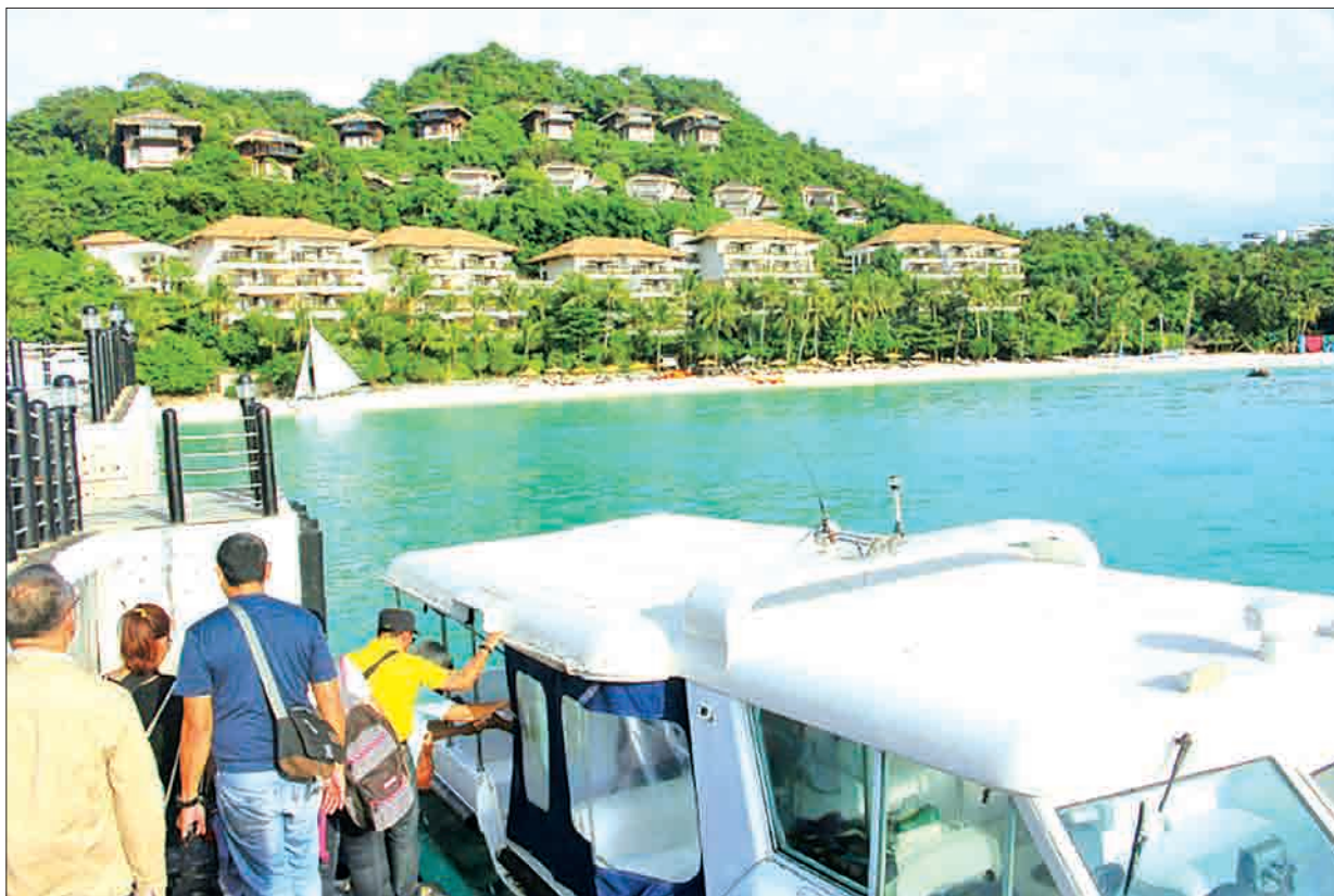
Even before the ban was announced, its shadow had hit some businesses hard in Boracay.