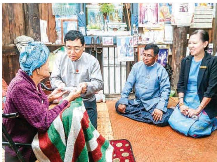
Dr. Win Myat Aye confers social pensions to elderly over 90 years of age.