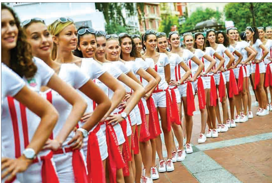
Girl power: Grid girls at the Monaco Grand Prix in 2015.

"They'll be there on the grid, but they won't be holding any name-boards. They're pretty – and the cameras will be on them