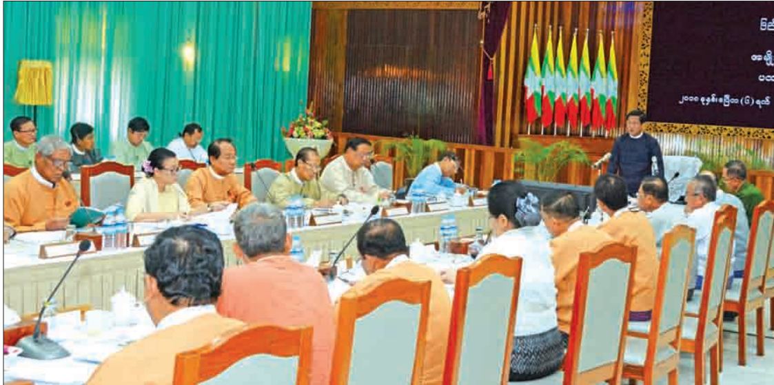
Vice President U Henry Van Thio addresses the meeting of National Land Use Council.

THE first meeting of the National Land Use Council was held at the Ministry for Natural Resources and Environmental Conservation in Nay Pyi Taw yesterday.