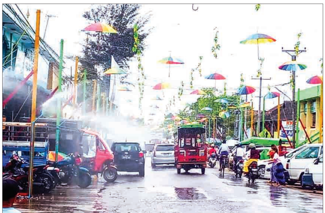
The number of the construction of pandals have been 80% completed.

The pandals for the State Ethnic Affairs Ministry and Construction Industry are being built now. This year 2018 Mahar Thingyan Festival will include a walking Thingyan. The Minyart Ward on the Zawgyun Road has been decorated with traditional Myanma Patheingyi umbrellas for the Walking Thingyan. Water pipes for participants to throw water around have been installed this morning.—Myanmar Digital News ■