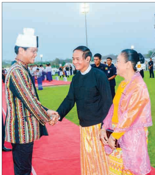
President U Win Myint and First Lady Daw Cho Cho greet Vice President U Henry Van Thio at the dinner event marking the President's taking of office held on the lawn at the Presidential Palace in Nay Pyi Taw.