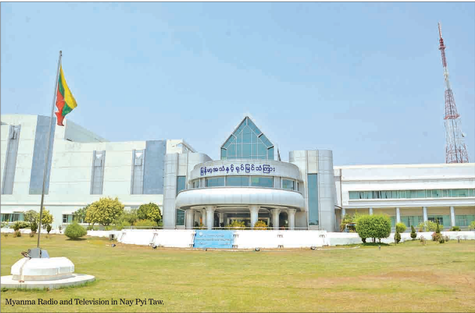
Myanmar Radio and Television in Nay Pyi Taw.

Moreover, MITV Channel is being broadcast in English language especially for the Myanmar