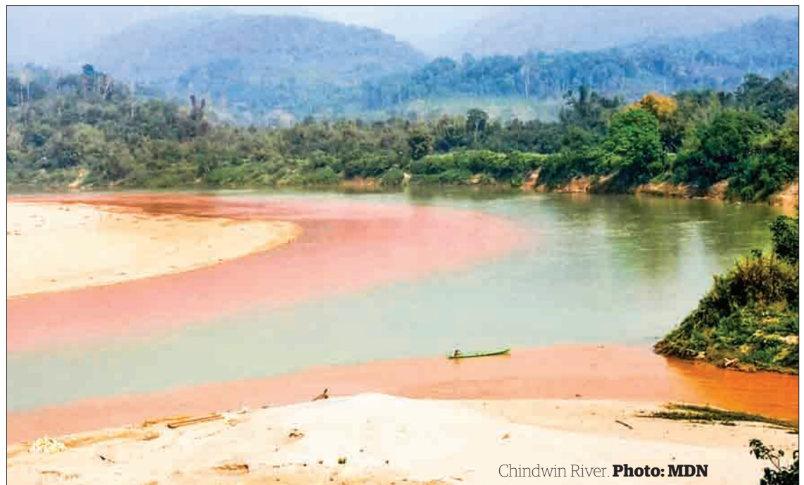
Chindwin River

"The preservation group will investigate a total of eight villages along the Chindwin River. Residents that live along the Chindwin River depend on the Chindwin River for drinking water.