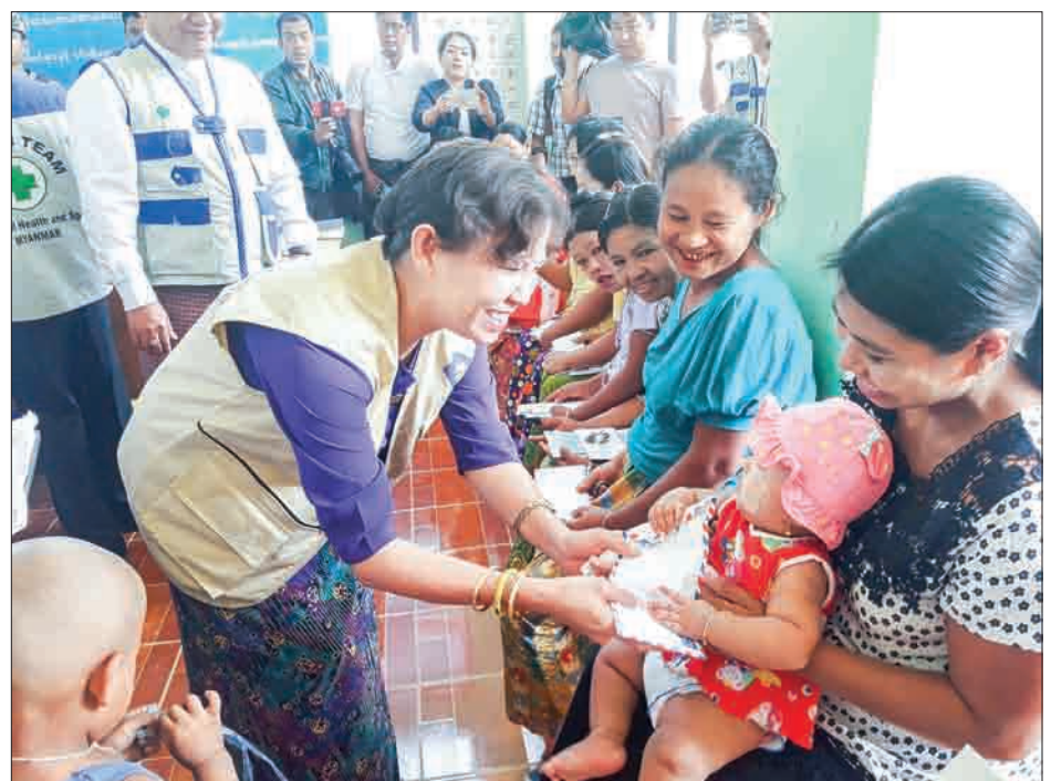
An official from the Social Welfare Department gives cash donation to a child in Maungdaw.

Because of the age-old and complicated programmes, the state lagged behind in development and has weakness in security. Both communities are filled with misunderstandings, mistrust, doubts and fear. The terrorists are exploiting this situation to penetrate, especially in Maungdaw region. Terrorism has caused a lot of damages. Natives dared not live in their villages anymore. The Muslim community is also leaving their homes. We are responsible for resettlement of the returnees. We are still facing the challenges of terrorist attacks on 25 August 2017 that had repercussions in the whole country and that damaged the country's image. We are working to accept the returnees. But we need the