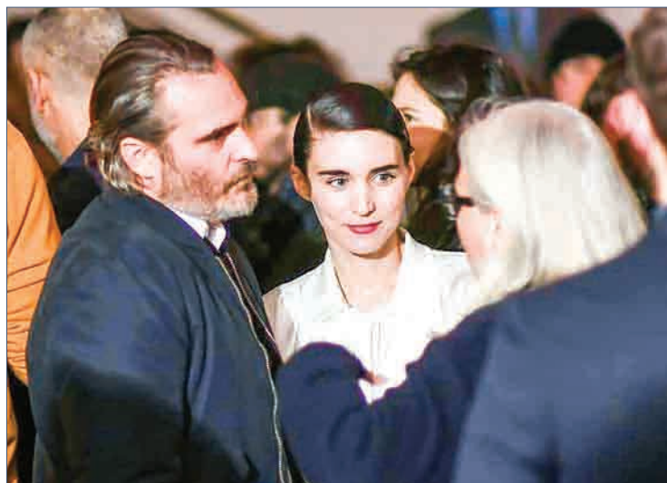
Joaquin Phoenix (L) attended the New York screening of Amazon Studios' "You Were Never Really Here" along with actress Rooney Mara (C).

The movie earned a seven-minute standing ovation, a best actor prize for three-time Oscar nominee Phoenix and best screenplay for Ramsay, who made her name with the much-admired "Ratcatcher"