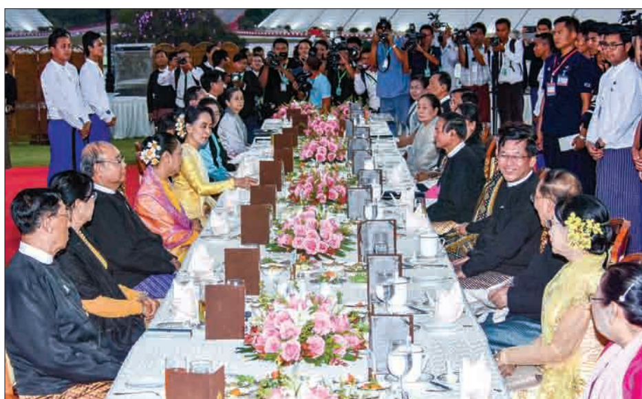
President U Win Myint, First Lady Daw Cho Cho and honoured guests have their meals at the dinner table together on the lawn at the Presidential Palace in Nay Pyi Taw.