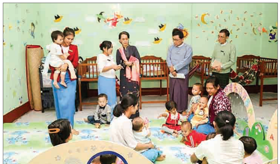
The State Counsellor visits the nursery opened in the Department for Social Welfare.

the public in time. We now have the DAN Mobile Application. Disaster Alert Notification or DAN application will no doubt contribute significantly to our efforts on disaster risk reduction in Myanmar. It enables the Ministry of Social Welfare, Relief and Resettlement to communicate risks to the general public through use of mobile technology. We are also using the Myanmar Mobile Application. But we have some weaknesses in using the application. We are inviting public participation in the disaster management as it is of vital importance. Public must be strong and quick in responding the disaster. So we are imparting safety means during disasters of any kind for people of all walks of life. The important thing is to conduct disaster drills so that people will have knowledge on the safety means. In addition we are distributing pamphlets in Bamar and other ethnic languages. There were 103 multiple-use disaster-resistant buildings. We have built