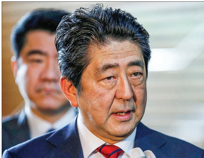
Prime Minister Shinzo Abe.

Xi has said he wants to create a "big family of harmonious coexistence" through the project, but skeptics see it as a bid to position China as a viable alternative to US global leadership. Abe lauded the initiative's "potential to connect East and West as well as the diverse regions found in between." But he cautioned that it is "critical for infrastructure to be open to use by all, and to be developed through procurement that is transparent and fair."