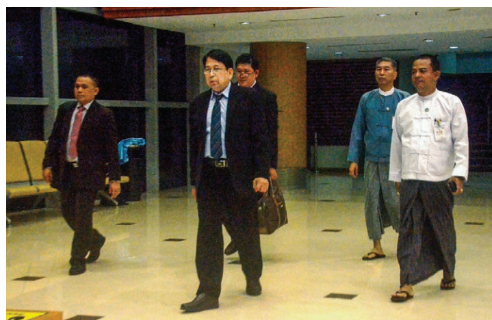
Union Minister for Information Dr. Pe Myint leaves for China to attend the 14th Asia Media Summit yesterday.

The Union Minister was seen off at the airport by Myanmar Radio and Television (MRTV) Director General U Myint Htway and other officials. Deputy Perma-