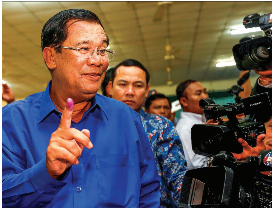
Cambodia's Prime Minister and president of Cambodian People's Party (CPP) Hun Sen.

"It is already clear the ruling party will remain a majority party in the National Assembly and continue to lead the government