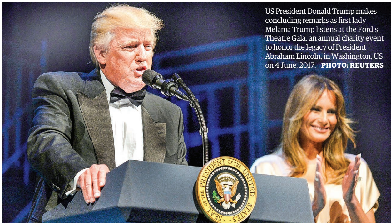
US President Donald Trump makes concluding remarks as first lady Melania Trump listens at the Ford's Theatre Gala, an annual charity event to honor the legacy of President Abraham Lincoln, in Washington, US on 4 June, 2017.

legal team asked the nation's top court to allow his controversial 6 March executive order, which blocks citizens of six predominantly Muslim countries from entering the United States,