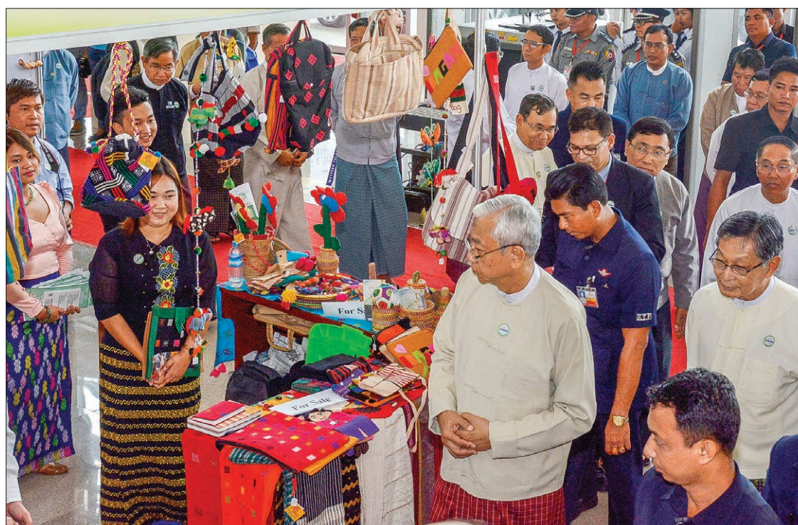
Presiden U Htin Kyaw tours World Environment Day exhibits yesterday in Nay Pyi Taw.

“But it is not just these protected sites that deserve our attention. Today, all of the earth’s ecosystems are under threat and we must work together to protect them. Myanmar’s many natural forests are being depleted at a rapid rate, meanwhile air quality and fresh water sources are being threatened by pollution. One of the greatest challenges that we face in Myanmar today is the threat of climate change. Globally we are considered to be one of the countries that are most vulnerable to climate change. In recent times, we have experienced an unprecedented increase in temperatures and