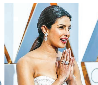
Actress Priyanka Chopra.

NEW YORK — Actress Priyanka Chopra spent an afternoon with Hollywood star Nicole Kidman, wearing almost similar looking dresses.