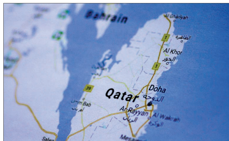
A map of Qatar is seen in this picture illustration on 5 June, 2017.

The diplomatic broadside threatens the international pres-