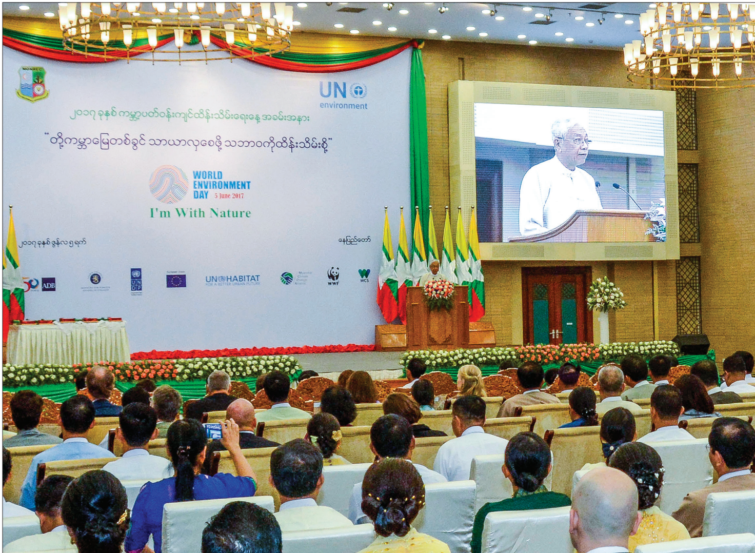
President U Htin Kyaw addresses the audience at the World Environment Day event held yesterday in Nay Pyi Taw.