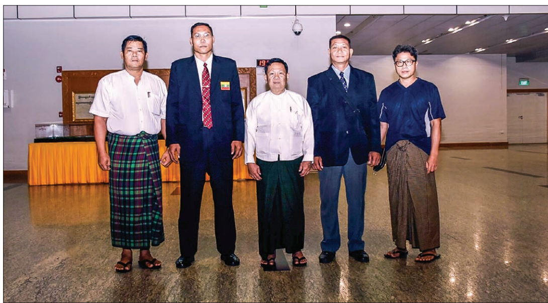
Two top judo coaches poses for a photo before departure for Japan.