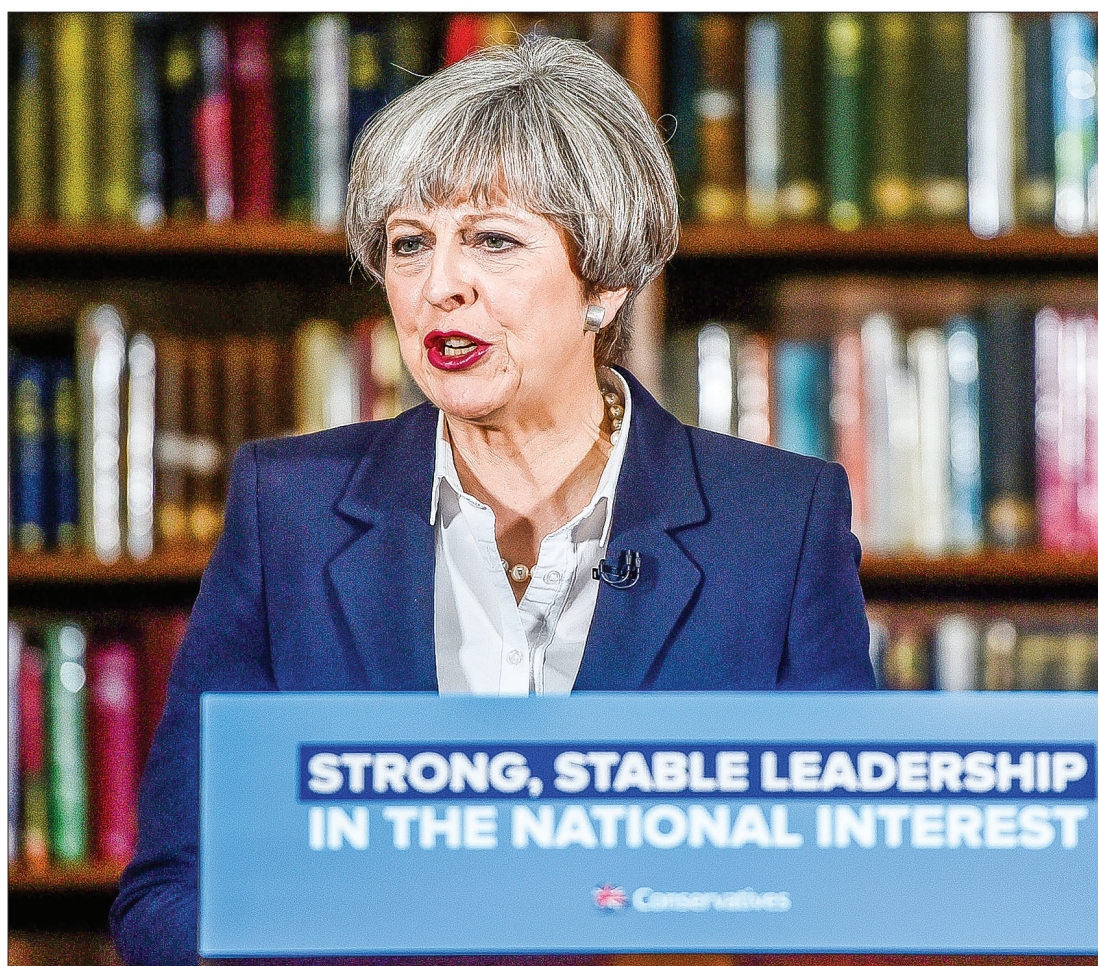
Britain's Prime Minister Theresa May delivers a campaign speech in central London, Britain, on 5 June, 2017.

cy markets, which favour May over Corbyn, after the latest ICM poll, taken between 2 and 4 June and published on Monday, suggested the Conservatives were ahead by 11 points.