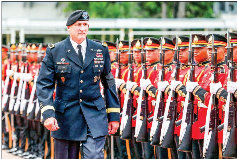
The chief commander of the US Army Pacific, General Robert B Brown reviews the honour guard with his Thai counterpart, General Chalermschai Sittisart (not in pictured) during his visit to Thailand at the Royal Thai Army headquarters in Bangkok, Thailand on 5 June, 2017.

Thailand is Washington's oldest ally in the region, but ties were strained by the 2014 military coup led by then-army chief Prayuth Chan-ocha that ousted an elected civilian government.