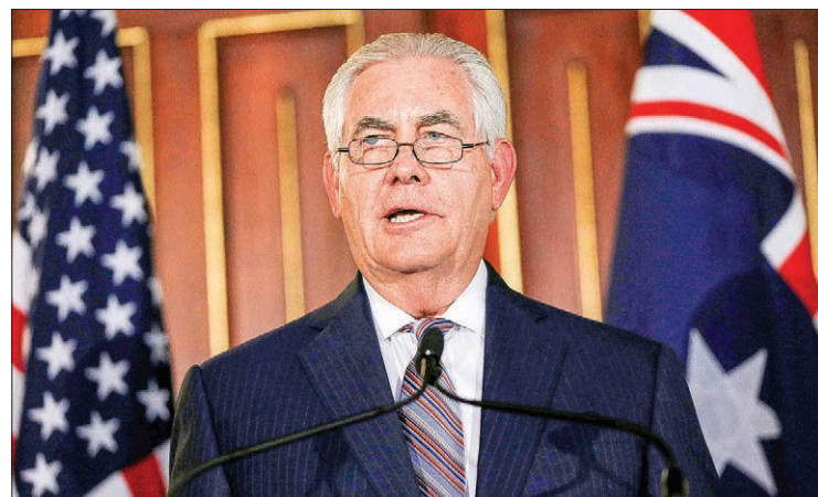
US Secretary of State Rex Tillerson speaks at a press conference at the Australia-United States Ministerial Consultations (AUSMIN) at Government House in Sydney, Australia on 5 June, 2017.

Tillerson urged the Gulf Cooperation Council nations to instead sort out their dif-