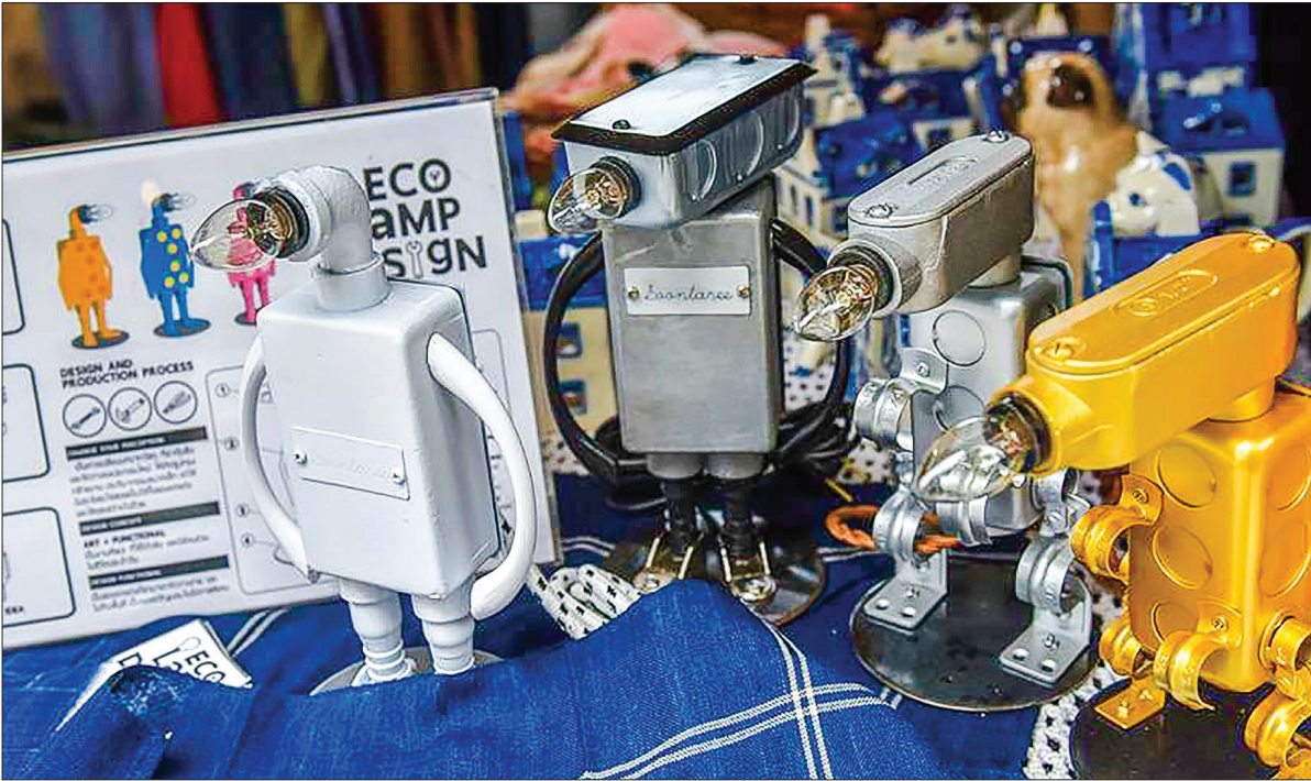
A desk made from recycled beverage packages is displayed at the "Eco Wanderlust" pop-up market in Bangkok, Thailand, on 5 June, 2017. Some 20 enterprises from the cultural and creative industries launched a pop-up market named "Eco Wanderlust" Monday in Bangkok to mark World Environment Day 2017. By selling eco-friendly daily life products made from recycled materials, the market organizers hope that their action could raise environmental awareness among the public.