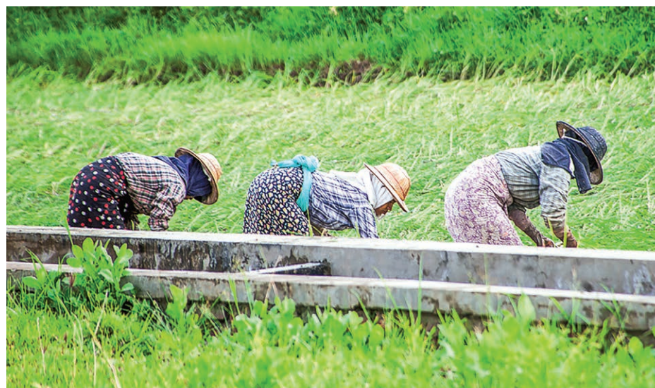
"Of the 20m ha of agricultural land available in Myanmar, only 20% is farmed using machinery."

This gap is forecast to persist in the medium term, with the World Bank estimating in its "Sustaining Resilience" report published last month that Myanmar's agriculture sector will expand by