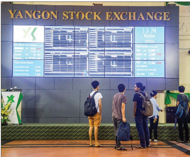
Visitors seen at Yangon Stock Exchange in downtown Yangon.

Trading on the Yangon Stock Exchange (YSX) was stable during the past three days. YSX started last year and lists First Myanmar Investment (FMI), Myanmar Thilawa SEZ Holdings (MTSH), Myanmar Citizens Bank (MCB) and First Private Bank (FPB). FMI traded shares priced at Ks 15,500 between 2-5 June, having declined from 16,000 on 1 June. MTSH traded at Ks 3,750, MCB at Ks 9,100