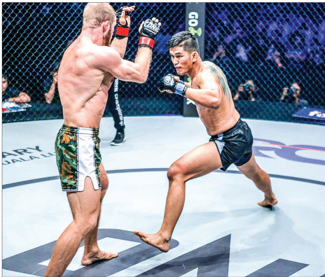
Aung La N Sang fights against Vitaly Bigdash in boxing match at ONE Middleweight World Championship.

"I am excited to be in the boxing ring again. I hope the present