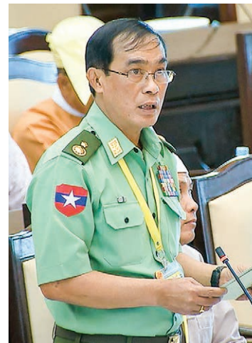
Deputy Minister for Border Affairs Maj-Gen Than Htut.

Amyontha Hluttaw yesterday, Rakhine representative U Tet Tun Aung asked if the government planned to provide any new