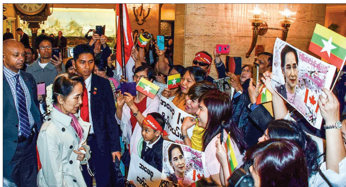
State Counsellor Daw Aung San Suu Kyi welcomed by Myanmar nationals at the Royal York Hotel in Toronto, Canada yesterday, where she will be staying during her visit to the Quebec city.

The State Counsellor and party then departed for Canada