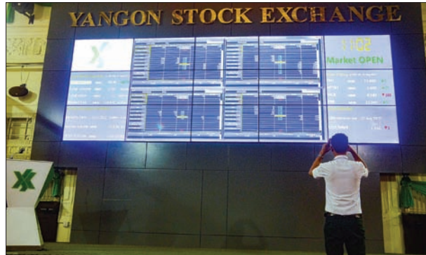
Visitor takes photo at YSX in downtown Yangon. Yangon Stock Exchange (YSX) approved the TMH Telecom Public Co., Ltd to be listed on YSX on 1 st December 2017.

On 4 th December, 14,774 shares worth over Ks77 million were traded by four listed companies. However, stock trading volume dropped down to 4,068 shares yesterday, with estimated trading value of Ks55 million. The share prices were Ks12,000 for FMI, Ks3,100 for MTSH, Ks8,800 for MCB and