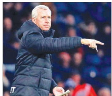
West Bromwich Albion manager Alan Pardew.

LONDON — West Bromwich Albion could be handed a double boost as midfielder Chris Brunt and winger Matt Phillips are close to returning from their respective injuries, manager Alan Pardew