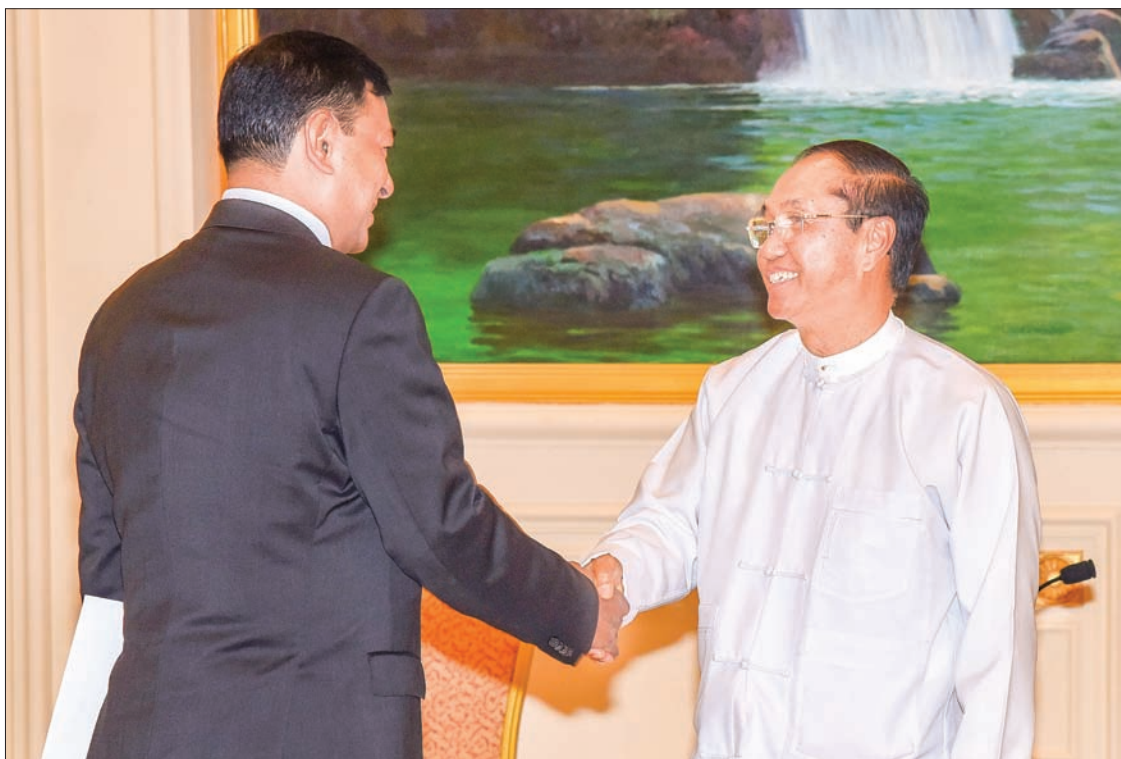
Vice President U Myint Swe welcomes BIMSTEC Secretary-General Mr. Shahidul Islam at the diplomatic lounge of the Presidential Palace in Nay Pyi Taw on 5 December 2017.