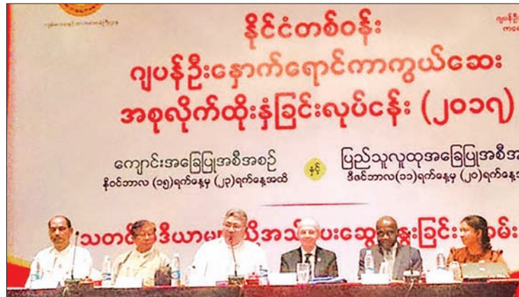
The ceremony for nationwide Japanese Encephalitis vaccination programme 2017 in progress.

"A vaccination team will not vaccinate more than 100 children. Then, we will keep a health staff at the vaccination programme health centre as a standby to ask for the medical biography of the children. We also will keep the health group to observe the post-vaccination condition of the children. We are also planning to provide the key message of the consequences of the JE vaccination to the parents. We are also making ready to provide emergency treatment if we find any post-vaccination problems,"