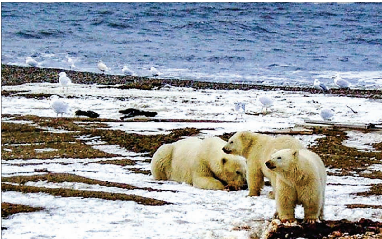
A polar bear sow and two cubs are seen on the Beaufort Sea coast within the 1002 Area of the Arctic National Wildlife Refuge in this undated handout photo provided by the US Fish and Wildlife Service Alaska Image Library on 21 December, 2005.

Cvijanovic led the study with contributions from colleagues at the lab