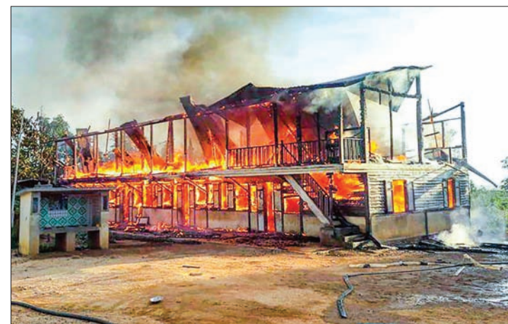
A fire damages to the school building in Gyobingauk Township, Bago Region yesterday.