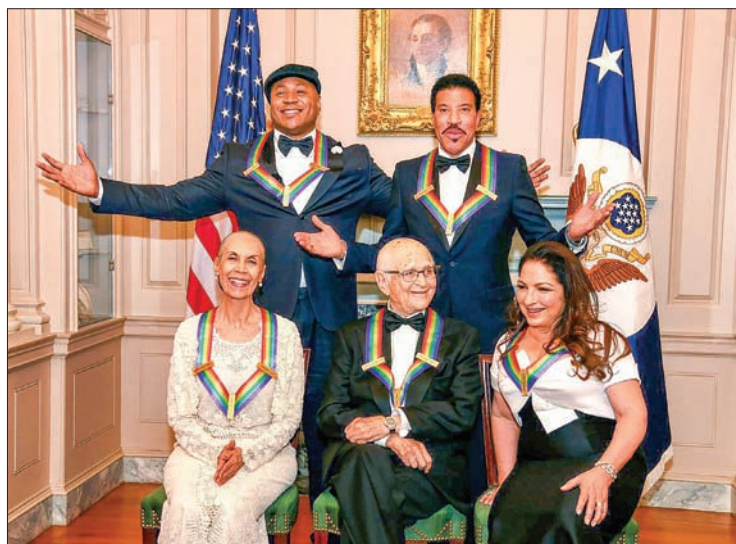
2017 Kennedy Centre Honorees (seated L-R) dancer, actress and choreographer Carmen de Lavallade, TV writer Norman Lear, Cuban-American singer Gloria Estefan and (standing L-R) Rapper LL Cool J and singer and songwriter Lionel Ritchie pose for a group photo at the conclusion of a gala dinner at the US State Department, in Washington, US on 2 December, 2017.

CBS will broadcast the 40th Kennedy Center Honors show on 26 December. —Reuters ■