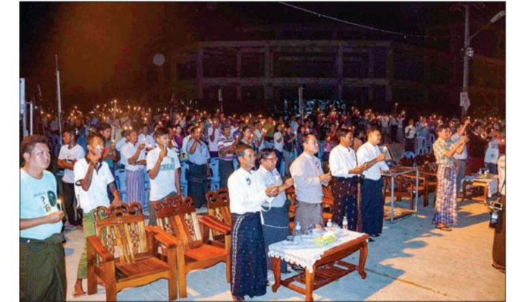
People participate in the peace vigil in Myeik.

THE event known as Public Peace Movement Week was held in Taninthayi Region, Myeik on Monday afternoon in front of the Sea View Condo on Strand Road. The event included musical entertainment and speeches about the peace movement.