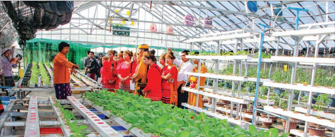
Ethnic delegation observes crop cultivation at Yezin University of Agriculture.

A delegation comprised of ethnic people from border areas visited Nay Pyi Taw yesterday at the invitation of the Ministry of Border Affairs.