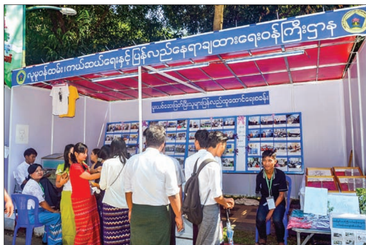
The booth of Social Welfare, Relief and Resettlement Ministry at the Youth All-Round Development Festival.

We can control our desires with our own conscience and we can avert them as desired by us." ■