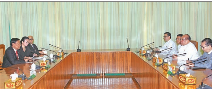
Union Minister U Thaung Tun receives Indonesia Minister Dr. H. Wiranto in Nay Pyi Taw on 5 December. H.E. U Thaung Tun, Union Minister for the Office of the Union Government, received Coordinating Minister for Political, Legal and Security Affairs of the Republic of Indonesia, H.E. Dr. H. Wiranto in Nay Pyi Taw at 10 am on 5 December 2017. During the meeting, they discussed security issues in Rakhine State and exchanged views on counter-terrorism measures. The meeting was attended by senior officials from the Ministry of the Office of the Union Government and the Ministry of Foreign Affairs. — Myanmar News Agency ■