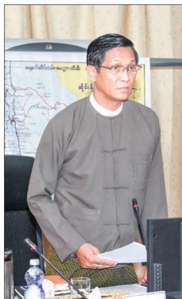
Vice President U Henry Van Thio addresses the coordination meeting of the Central Committee for Myanmar Special Economic Zones (SEZs) in Nay Pyi Taw, on 5 December 2017.

The Vice President added of his trust that the country's economic development will be obvious with the development