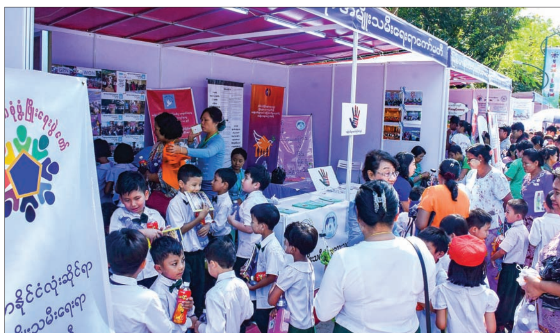
School children visit the Youth All-Round Development Festival.

Child abandonment is a criminal offence. A person can be arrested under section 317 of the Penal Code, it was learnt. A senior official said that, provided the person in question cannot take responsibility for caring for a newborn infant due to social problems, they can apply for entrusting the child to the child care