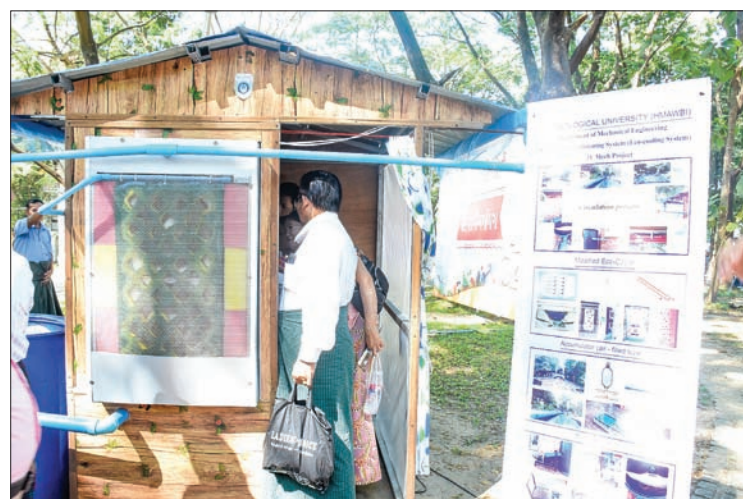
Air-conditioners which are making the best use of natural air and water assembled by the students from Hmawbi Technological University.