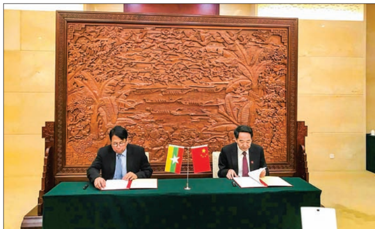
Union Minister Dr Pe Myint and Mr. Jiang Jianguo sign MoU on media cooperation between Myanmar and China.