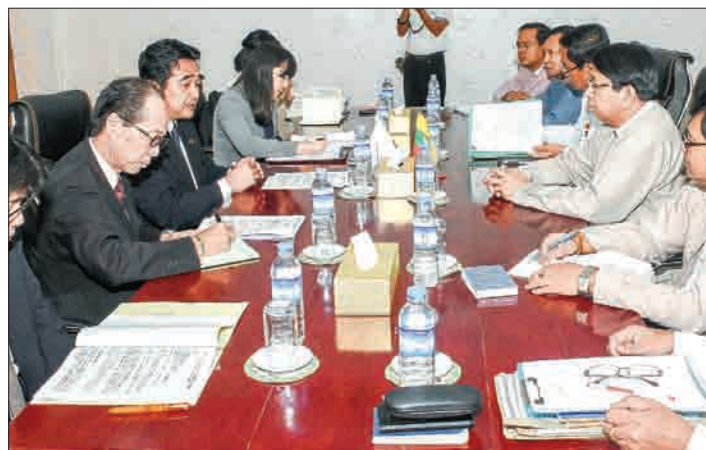
Union Minister for Information Dr. Pe Myint holds talks with State Minister for Internal Affairs and Communications of Japan Mr. Manabu Sakai in Nay Pyi Taw yesterday.

At the meeting, the opening of a company jointly formed by Japan's NHK and Myanmar's Shwe Than Lwin Media on 26 June, the possibilities of cooperation between Myanmar Radio and Television and Japan's broadcasting media, organisation setup and the works conducted by Japan's Ministry of Internal Affairs and NHK, the broadcasting and other interesting programmes from Japan, and the possibility of continuing the ongoing work of a translation