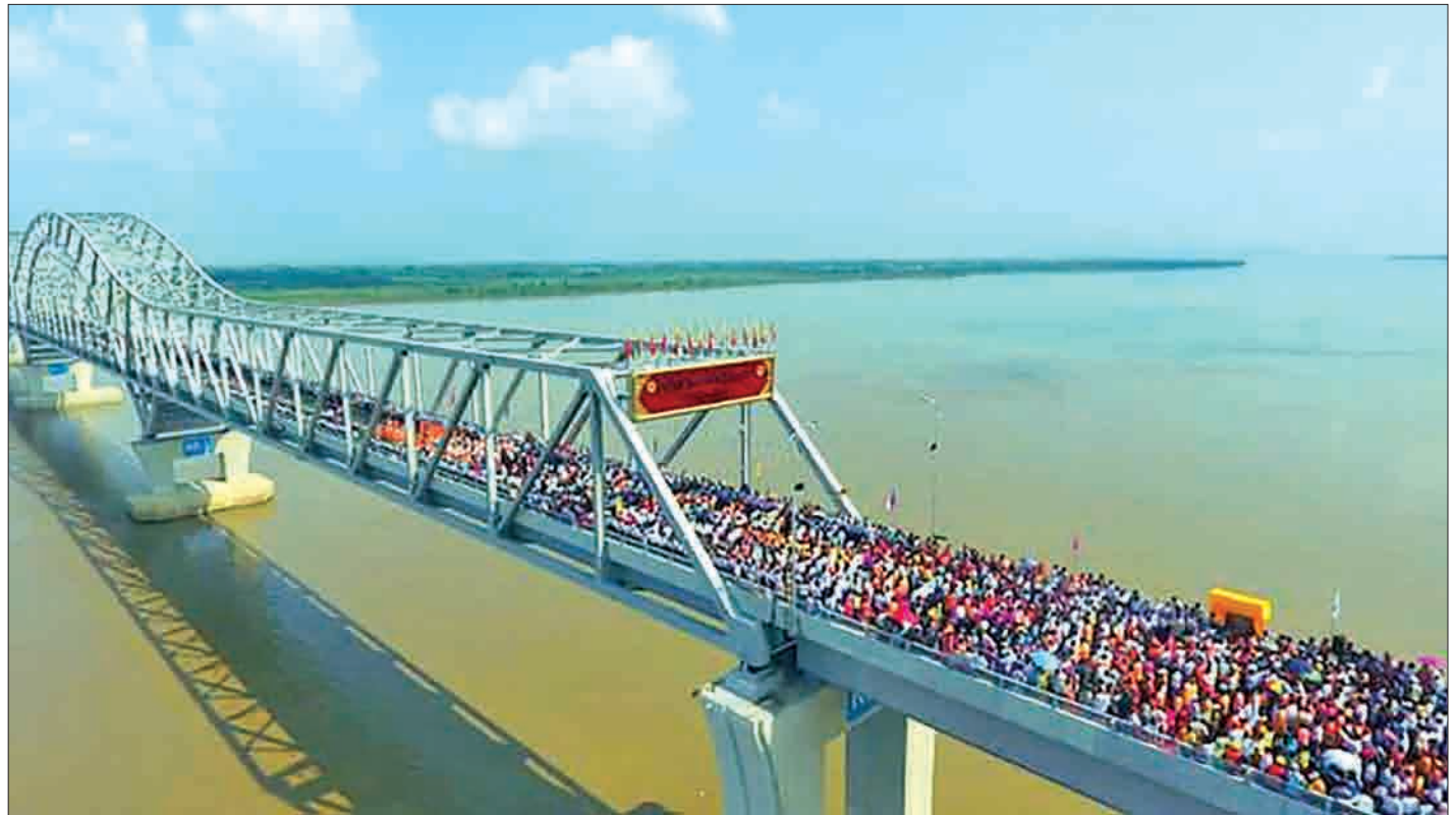
Bogyoke Aung San Bridge (Bilugyun) is commissioned into service in April 2017.

As for the Mon State Government, efforts have been made to improve the transportation systems in and out of the region. The Mon State Road/Bridge Department under the Ministry of Construction built the Bogyoke Aung San Bridge with 5203.4 feet in length. The Bogyoke Aung San Bridge is about a mile long and was built by Myanmar engineers with the use of international construction techniques.