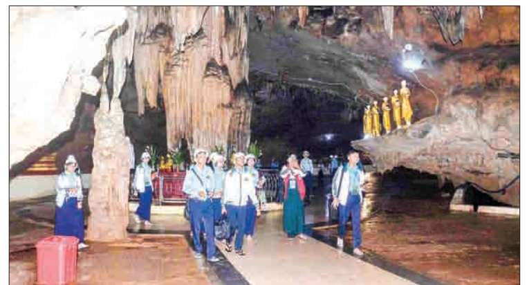
Luyechun students visit Htan San Cave in Shan State.

Similarly, grade ten outstanding students in Ho Pone Township, Pa'O Self-Adminis-