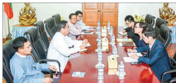
Deputy Minister for Information U Aung Hla Tun meets with Ms. Li Xiaoyan, Minister Counsellor from the China Embassy to Myanmar.

to Myanmar, areas of bilateral cooperation, the current status of Myanmar's media sector, one-sided news on Myanmar, as described in some international media, cooperation between the media of the two countries, creation of more job opportunities for Myanmar workers in China and better quality export products from China.—MNA ■