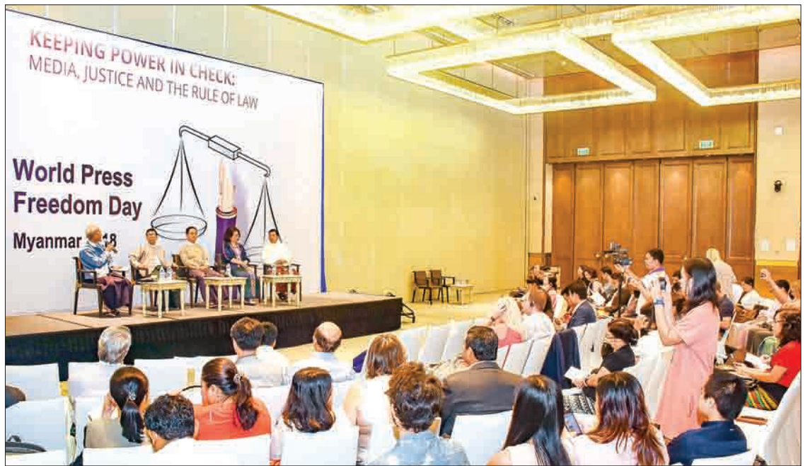
World Press Freedom Day celebrated by UNESCO and journalists in Yangon.