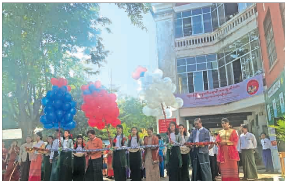
A campaign on vaccination against encephalitic in Mon State.