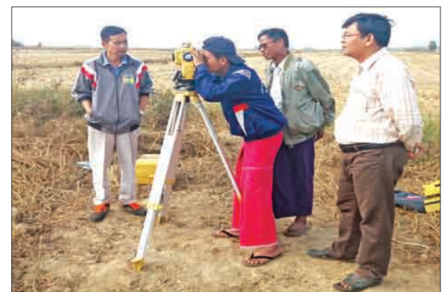
Experts are working for reclamation of farmland in Mawlamyine.