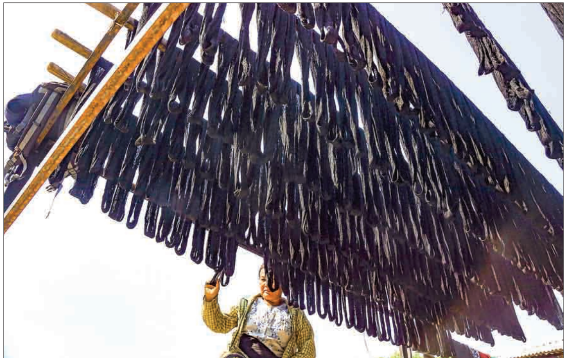
A worker dries cotton fibre dyed in the Sun at a weaving factory in Meiktila.

According to the new Myanmar Investment Law, the region and state Directorate of Investment and Company Administration offices are authorised to grant approval to investment proposals with capital not exceeding US$5 million (Ks6,000 million) to facilitate the verification process of investment projects. —GNLM ■