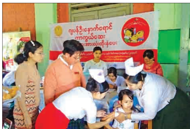
Children in Mon State receive vaccination.