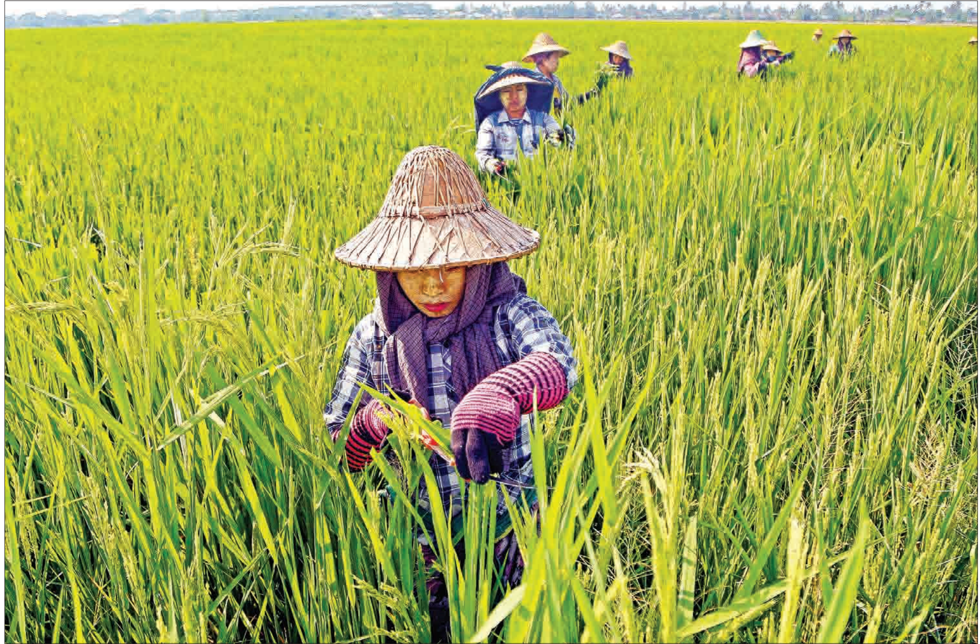
Agriculture investments have been rare because they are usually seen as long-term investments. Myanmar also has onerous requirements for foreign investments in land...

Agriculture is listed in ten prioritized sectors by Myanmar Investment Commission (MIC). However, it is time-consuming