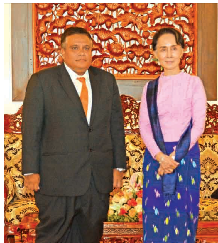
State Counsellor Daw Aung San Suu Kyi welcomes Mr. Zahairi bin Baharim, Ambassador of Malaysia, in Nay Pyi Taw.

and Energy U Win Khaing, Union Minister for Labour, Immigration and Population U Thein Swe, Union Minister for Industry U Khin Maung Cho, Union Minister for Commerce Dr. Than Myint, Union Minister for Education Dr. Myo Thein Gyi, Union Minister for Health and Sports Dr. Myint Htwe, Union Minister for Construction U Han Zaw, Union Minister for Social Welfare, Relief and Resettlement Dr. Win Myat Aye, Union Minister for Ethnic Affairs Nai That Lwin, Union Minister for International Cooperation U Kyaw Tin, Union Attorney-General U Tun Tun Oo, Deputy Minister for Home Affairs Maj-Gen Aung Soe, Deputy Minister for Border Affairs Maj-Gen Than Htut, Deputy Minister for the State Counsellor's Office U Khin Maung Tin, Deputy Minister for Transport and Communications U Tha Oo, and Deputy Minister for Planning and Finance U Maung Maung Win.—MNA ■