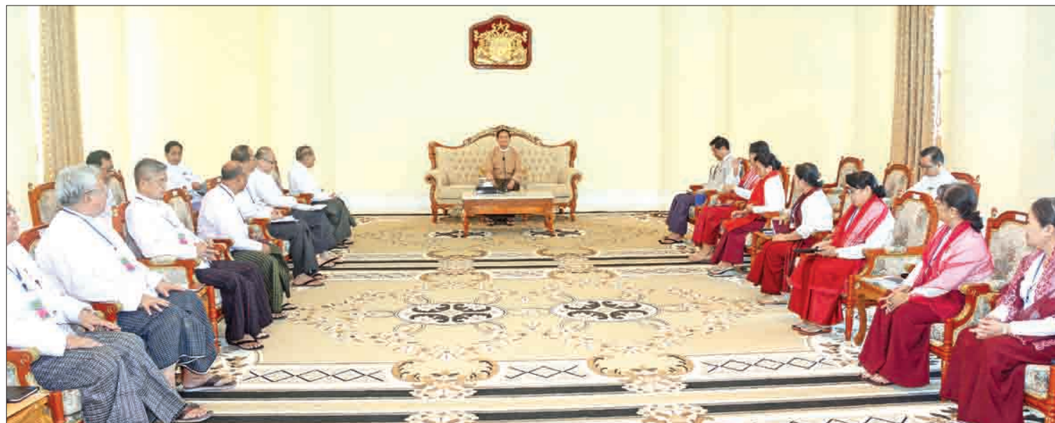
President U Win Myint meets with Union Auditor-General and state/region auditors general in Nay Pyi Taw yesterday .

There should be an audit on whether there are systematic control, maintenance and usage of state, public and cooperative owned assets as well as audit on proper records kept of own-