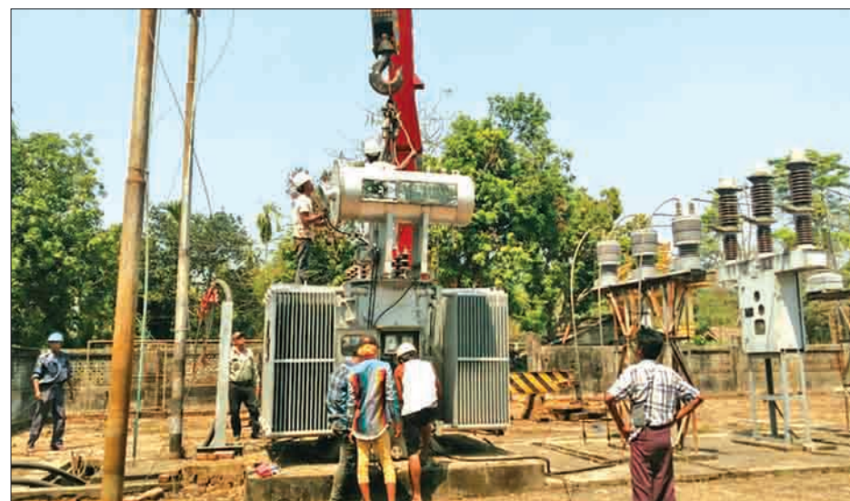
33/11 KV MVA transformer is being installed in Mudon under the electrification plan.