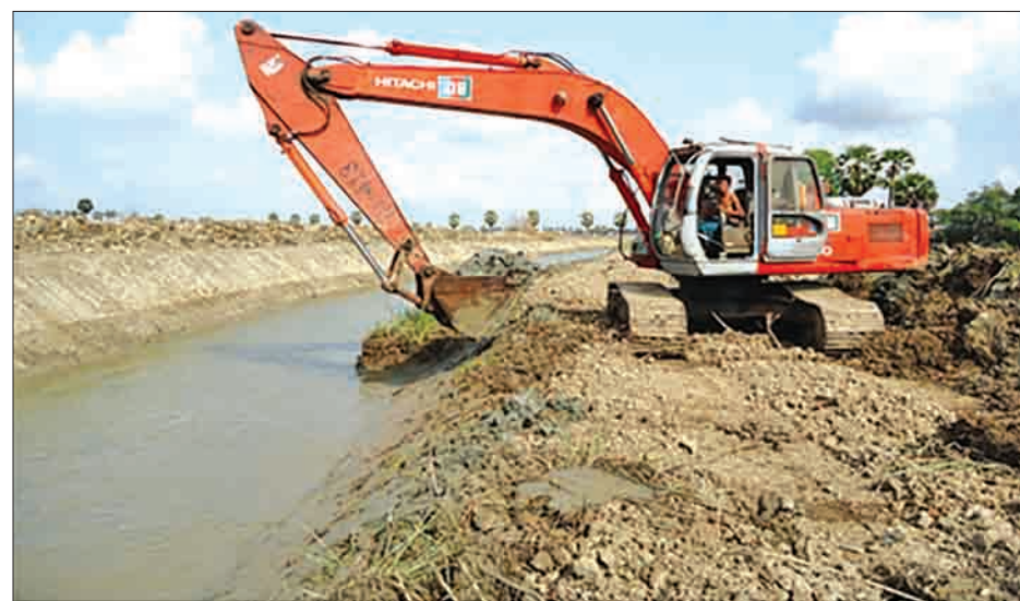
A creek is being draged in Mudon Township to prevent from flooding in the rainy season.