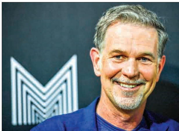
Netflix CEO Reed Hastings said streaming companies and cinemas did not have to be in competition with one another.

Last month, festival director Thierry Fremaux said he was hoping to heal the rift with the Silicon Valley giant after Netflix’s