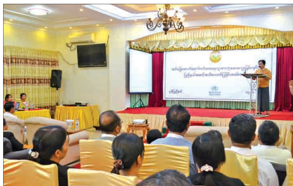
A ceremony to raise awareness against elephantiasis in Mawlamyine, Mon State.

During the two years period in office, the state government had built a 40-foot-width-Yangon-Myeik Road (Sit-taung-Kyaikhto-Moatame Section) which has upgraded into a four-way-road in the state.