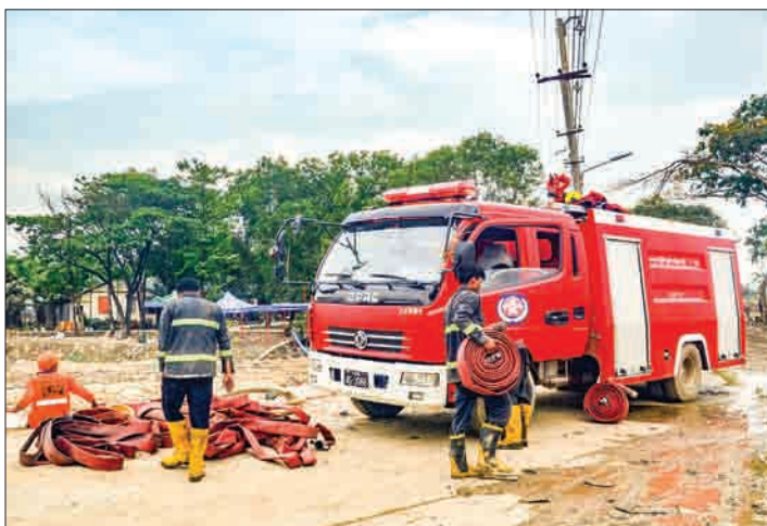
Fire fighters stationed near the garbage dump.

At the moment, a combined force of more than 100 is keeping the smoke emissions under observation and putting out any leftover fires. ■