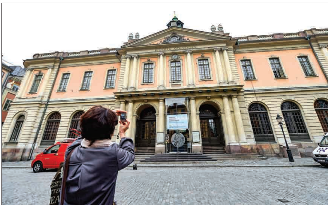
Seen as bearers of high culture, the The Swedish Academy, founded in 1786, is traditionally known for its integrity and discretion.