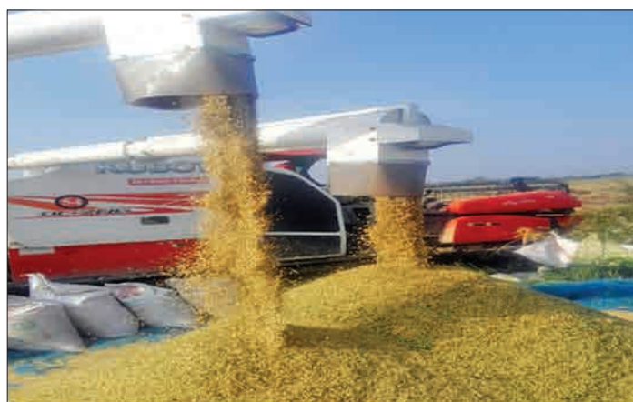
Machinery are used for post harvest in Bilugyun Township.