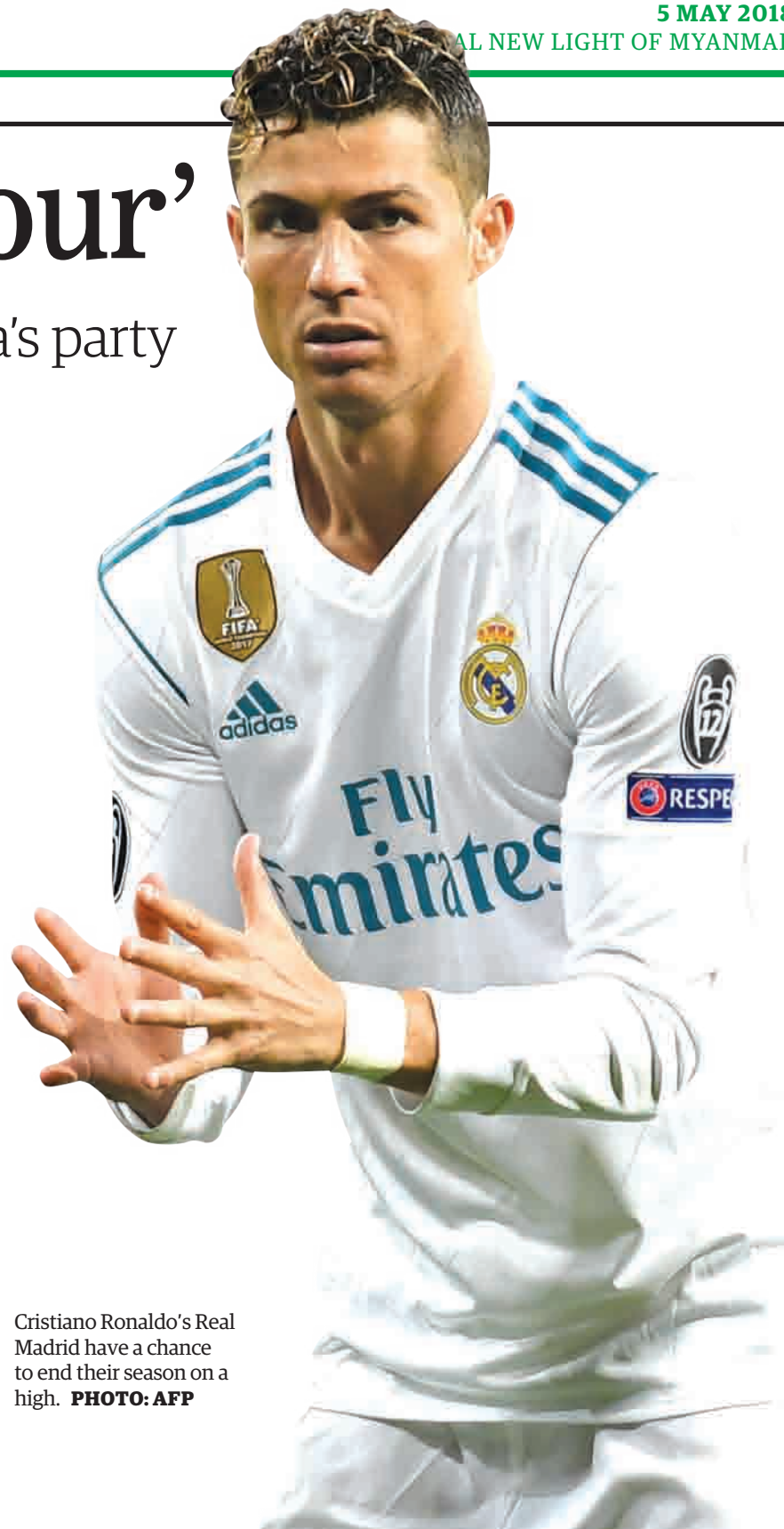
Cristiano Ronaldo's Real Madrid have a chance to end their season on a high.

The suggestion is both teams could give the departing Iniesta, Barca's captain, a guard of honour, even if Real refuse to do so for Barcelona's La Liga triumph.—AFP ■