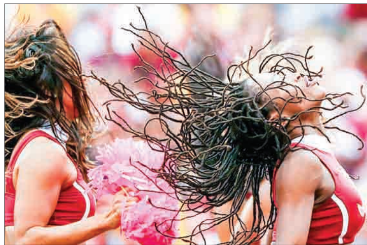
Washington Redskins cheerleaders dance at a game against the San Francisco 49ers at FedExField in Landover, Maryland.

“It’s a big family. We respect each other and our craft,” she said. “It’s such a supportive environment for these ladies.” — AFP ■