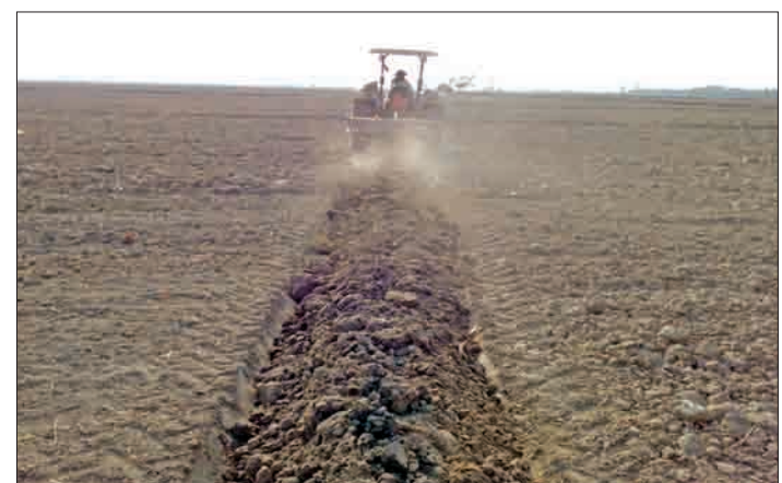
Land reclamation in Bilugyun Township.

The span across the Thanlwin River is especially important for Chaungzone Township on the Bilugyun island, a large, major island that, until this bridge was built, was accessible only by boat. The bridge is the one spanning Bilugyun, which is a part of the Gulf of Mottama/ Gulf of Martaban. Bilugyun Island has a population of over 120,000, 858 square kilometers in area. With better transpor-