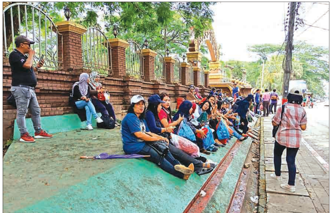
Visitors seen in Tachilek.

Tourists who travelled on a day's return trip visited Tarrlot market, Bayintnaung Statue, Maha Myatmuni Pagoda, Wamkaung market, Padaung Village, Shwedagon Pagoda,