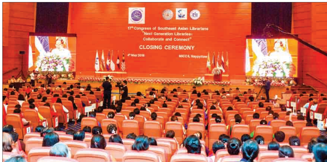
Vice President U Myint Swe addresses the closing ceremony of the 17 th Congress of Southeast Asian Librarians at the Myanmar International Convention Centre-2 in Nay Pyi Taw yesterday.

The first CONSAL was held in Singapore back in 1970 under the leadership of the ASEAN, in accordance to its form and essence. At the moment, CONSAL includes the 10 countries of Bru-