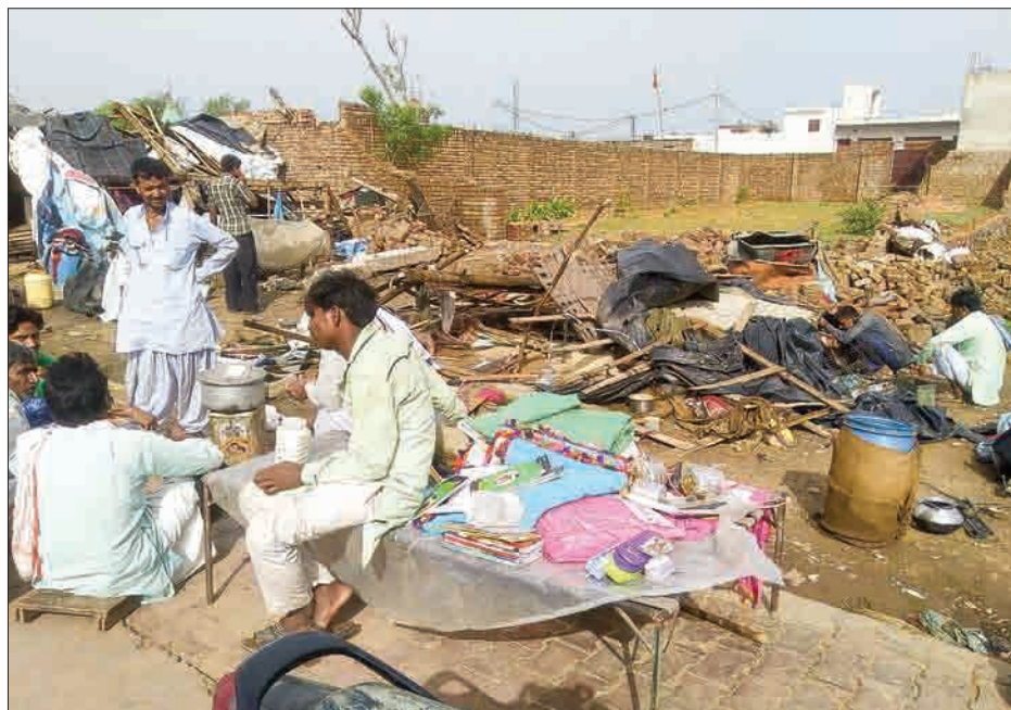
The storm flattened homes and toppled electricity pylons in Rajasthan.

Pradesh, where 76 died, and Rajasthan, where the storms claimed 39 lives, battled to restore power, clear roads and help people who lost houses.