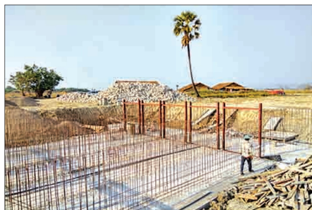
Sluice Gate in Kyaikmayaw is under construction.

The bridge has become the 9th span over the Thanlwin River and the 2nd bridge for Mon State. The landmark bridge connecting Mawlamyine and Bilugyun region would boost the socio-economy of the area as the businesses, including hotels, tourism and production businesses, will flourish, thanks to better communication and transportation.