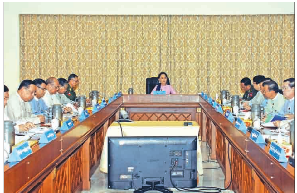
State Counsellor Daw Aung San Suu Kyi chairs the meeting of the Central Committee for Implementation of Peace, Stability and Development in Rakhine State.

The forecast for Nay Pyi Taw, Mandalay, Yangon and the neighbouring areas for today is isolated rain or thundershowers. The degree of certainty is 80 per cent.—GNLM ■