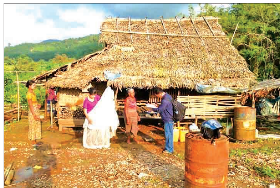
A campaigning on fighting against malaria in a far-flung area in Mon State.

Signing the Nationwide Ceasefire Agreement (NCA) by the New Mon State Party (NMSP) has strengthened the security and the rule of law in Mon State and has brought situation for implementing regional development tasks effectively.