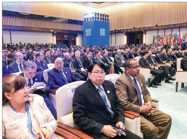
Union Minister Dr. Pe Myint at Fourth World Internet Conference in Wuzhen.