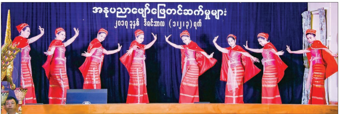
Ethnic dancers entertaining the visitors.