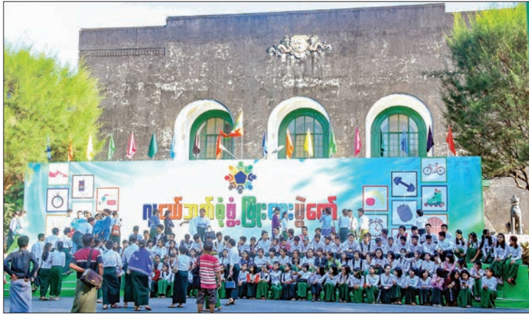
Students seen at All-round Youth Development Festival in Yangon.