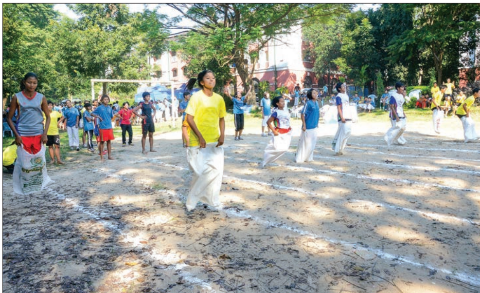
A traditional sports event in progress.