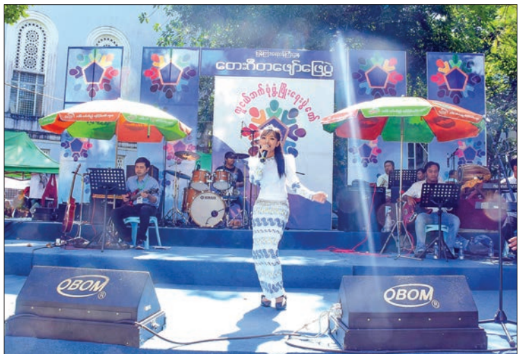
A stylish performance of a vocalist at the festival.