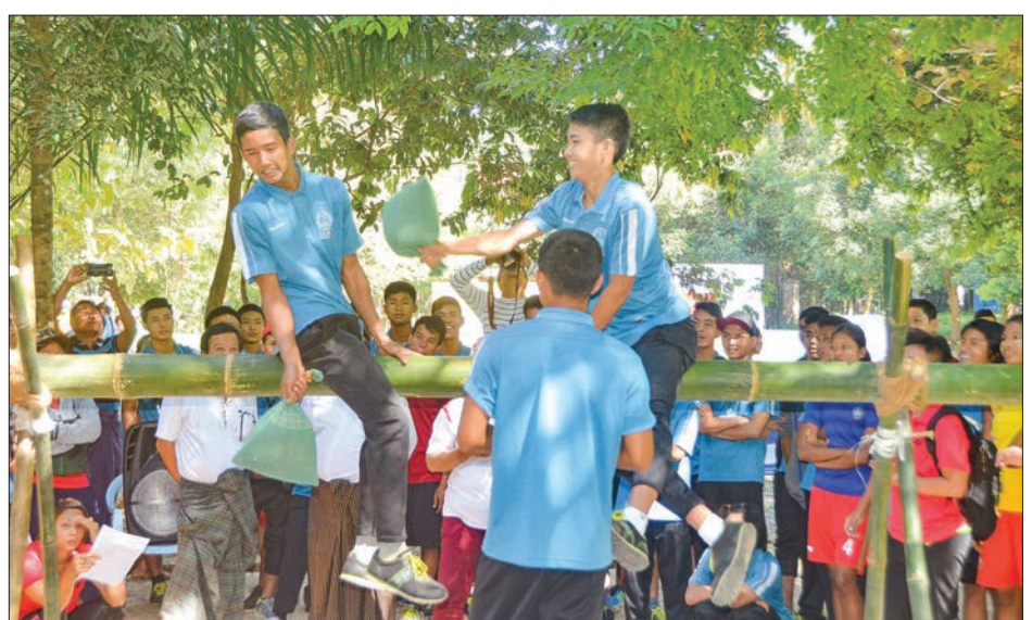
Two boys taking in the pillow fight.