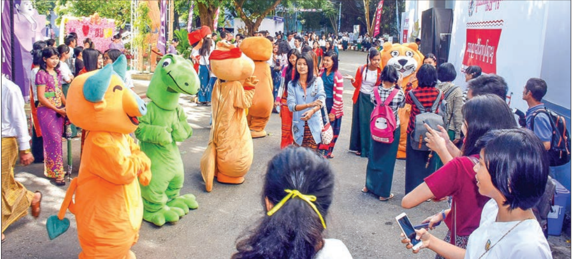
An interesting moment at the festival.