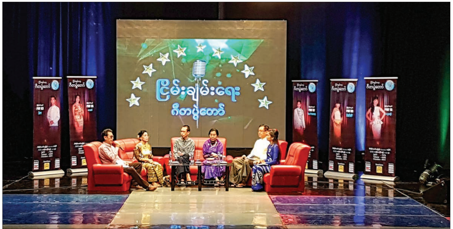
Judges explain selection of four singers who reach Grand Final of Peace Music Festival.

The winner will be awarded Ks 30 million, the first runner up Ks 20 million, the second runner up Ks10 million and the third runner up Ks 5 million. The seven consolation winners will