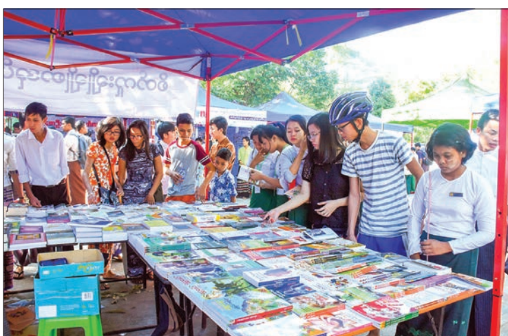
Youths visiting a literature booth.