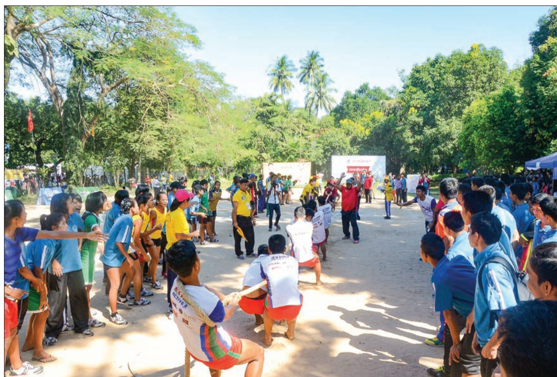
Pull! Let's see which team is stronger.

"Children were brought to study the sport competitions. Children are believed to get interest not only in their lessons but also in sport activities. Sport is also included in the school timetable. School lesson study can get only intellectual devel-