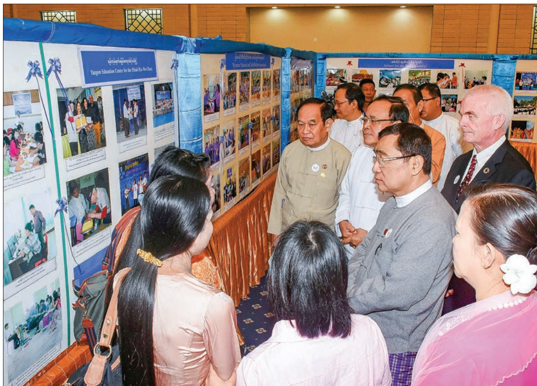
Union Minister Dr Win Myat Aye views the photo display of the International Day of Persons with Disabilities in Nay Pyi Taw.

The resident representative of the UN agencies read out the message of the UN General Secretary. Union minister Dr Win Myat Aye, Union Minister for Health and Sports Dr Myint Htwe, Union Minister for International Cooperation U Kyaw Tin, Deputy Minister for Education U Win Maw Tun and Deputy Minister for SWRR U Soe Aung presented outstanding awards commemorating the Day. Two troupes of the children with disabilities performed dances, followed by a group documentary photo session. —Myanmar News Agency ■