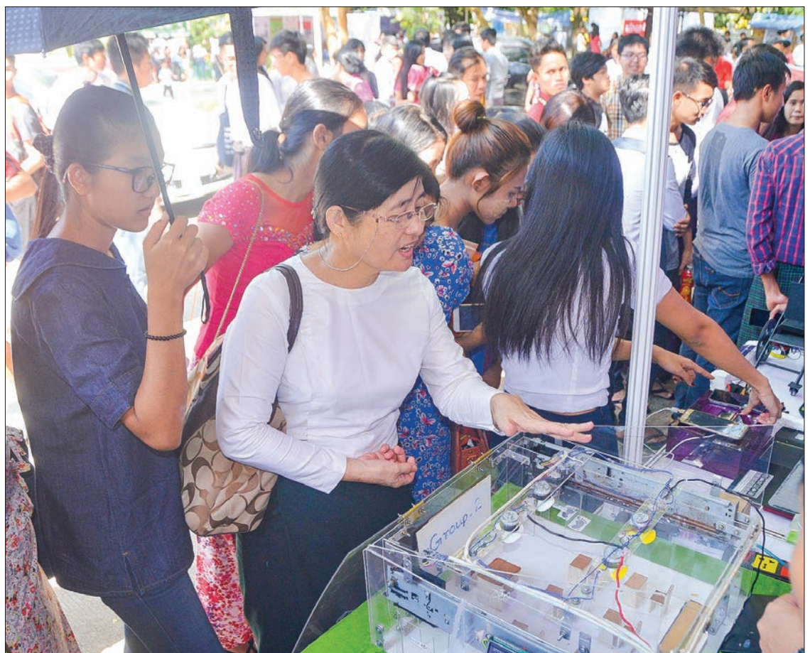
The festival serves as the venue where technological knowledge is shared.