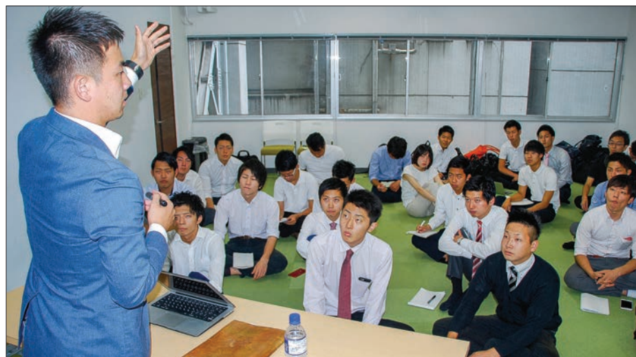
Job seekers hold a discussion during a Hassiyadai Inc. training session in Tokyo in September 2017.