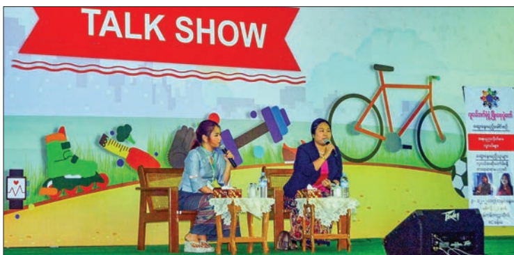
A talk show in progress.

especially youths came to it not only as visitors but also as the active participants.— Myanmar News Agency ■