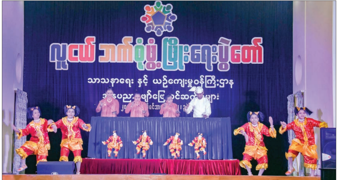
Performers dancing together with marionettes.