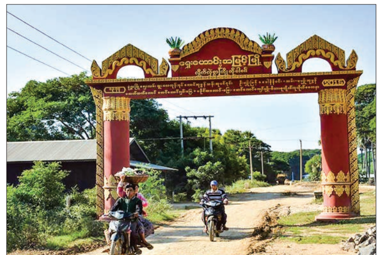
Photo shows archway of Ah Myint town (Ah Myint Old City).

Among them, only the pagoda of Min Ye Phayar Taik Su is in best condition and the other seven are mostly in damage. According to the drawing styles and pictures, ancient mural painting conversation organization approved that they are the ancient arts of Innwa and Kounghaung eras. — Win Oo (Zaya Taing)