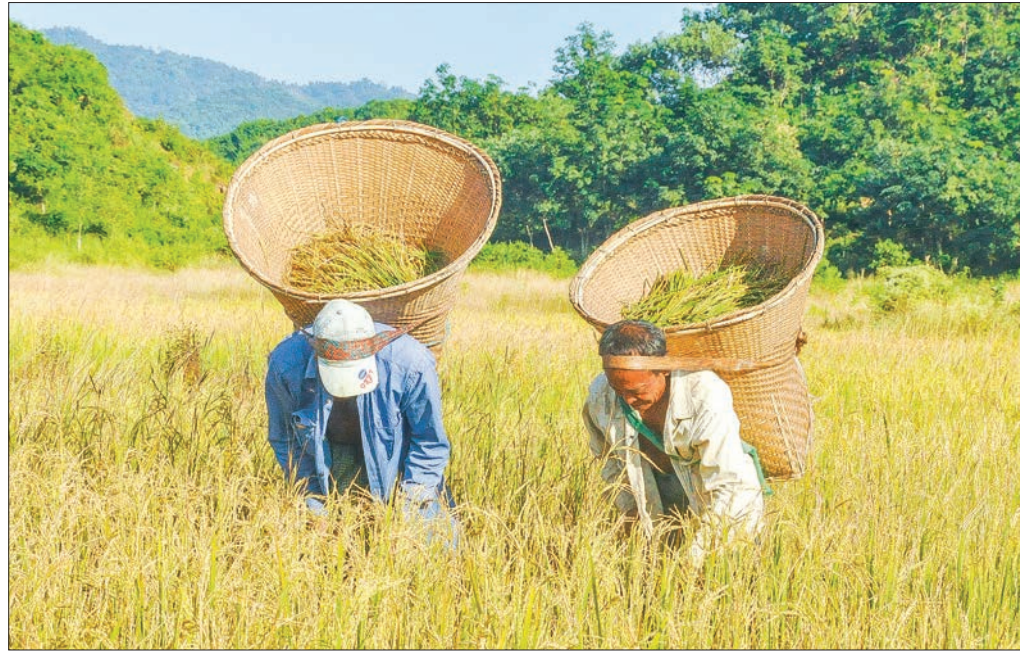
Farmers harvest summer paddy in a paddy field.

Myanmar earned US$0.831 million from the export of broken rice weighing 2,775 tonnes to China through borders, including 2,482 tonnes from Muse and 293 tonnes from Jwejel border