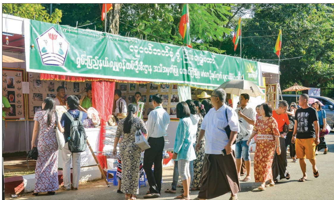
People can learn Shan paper making-process at the festival.

Exhibition and demonstration for the production of lotus fiber in the booths of the All-Round Youth Development Festival were popular sites for the youths.—News Team (MNA)