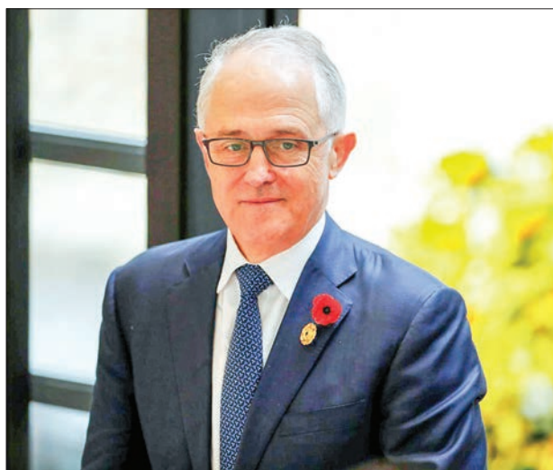
Australia's Prime Minister Malcolm Turnbull attends the APEC Economic Leaders' Meeting in Danang, Viet Nam, on 11 November 2017.