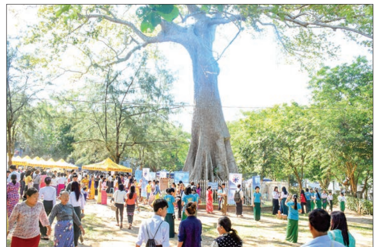
Thitpokpin or the landmark tree of Yangon University see more visitors and more activities on the final day.

Yangon City Development Committee also joined in the