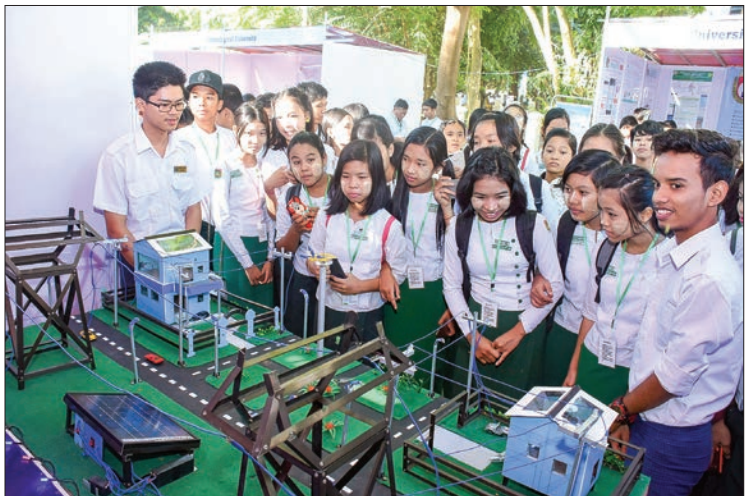
Students visiting the IT booth.