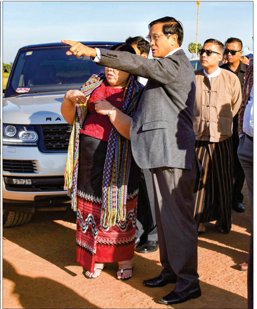
Vice President U Henry Van Thio inspects the site where fish auction market and a development zone project will be implemented in Taninthayi Region.