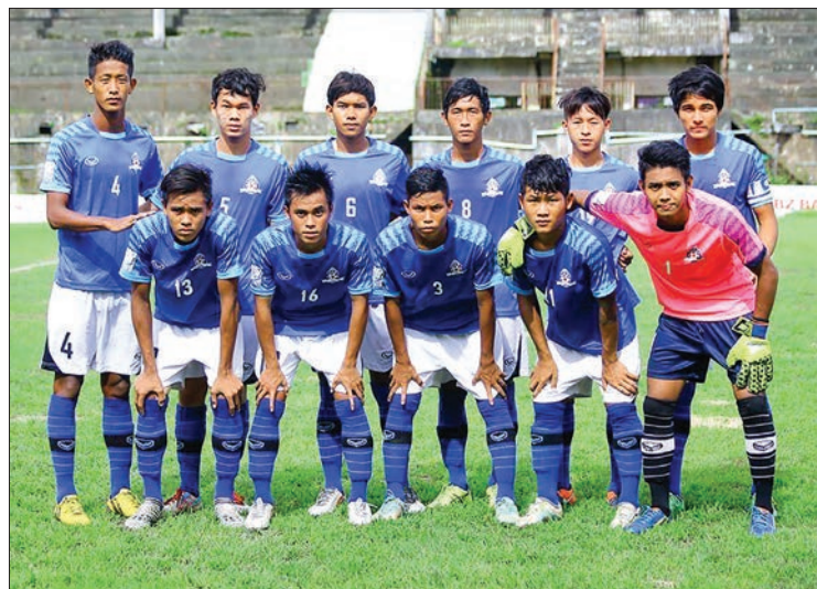
Magwe youth FC.