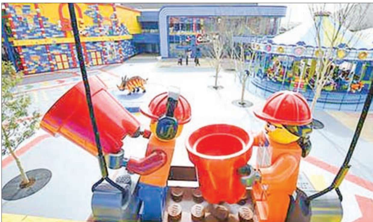
Reporters are allowed to visit new entertainment park “Legoland Japan” in the central Japan city of Nagoya, on 2 February 2017, prior to its opening in April. It is Japan's first outside Legoland facility.

Children aged 2 or younger can enter the park for free. Indoor Lego-block parks operate in Tokyo and Osaka. —Kyodo News