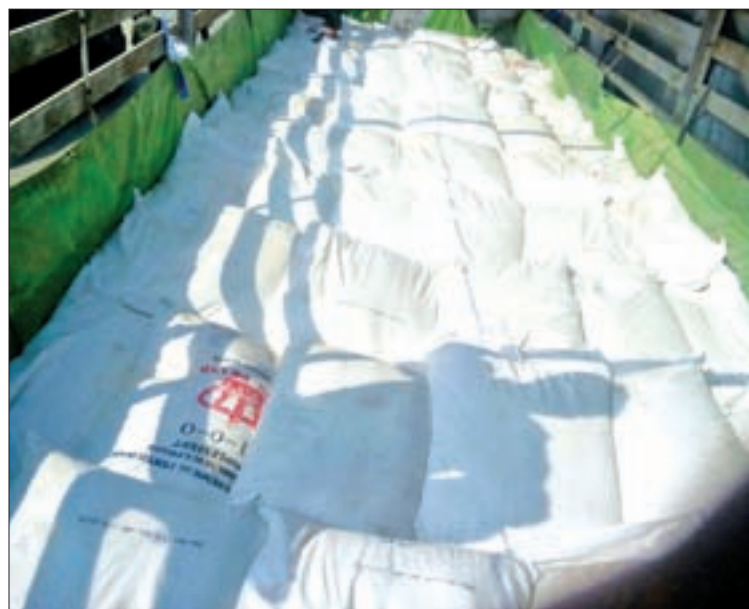
Seized bags of Crown Brand chemical fertilizer.