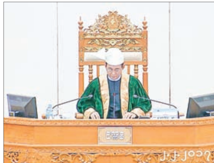
Speaker U Win Myint.

U Win Myint Oo, also known as U Ne Myo of Nyaungshwe and parliamentarians constituency