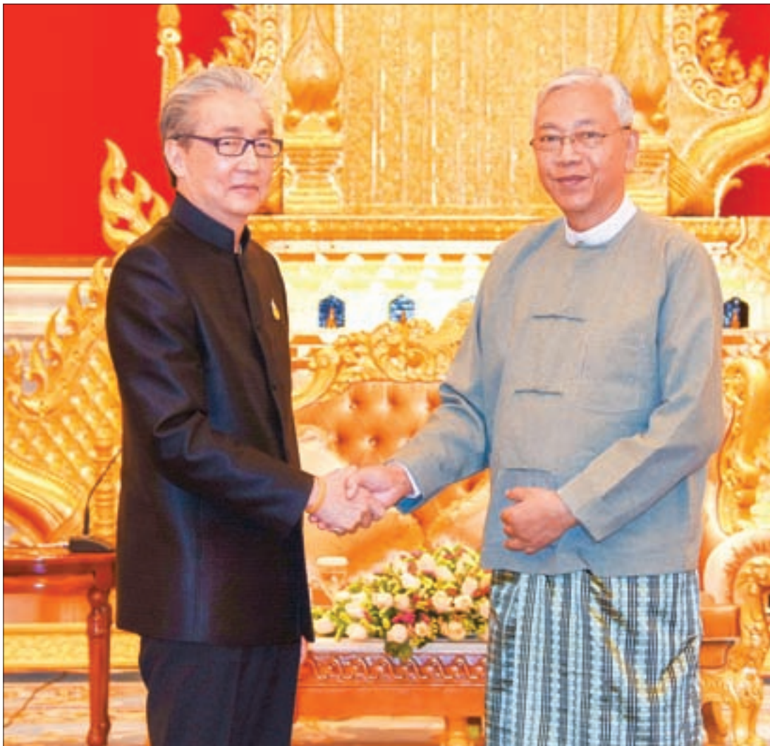
President U Htin Kyaw welcomes Deputy Prime Minister of Thailand Dr. Somkid Jatusripitak.

Also present were Union Minister for Electricity and Energy U Pe Zin Tun, Minister of State for Foreign Affairs U Kyaw Tin and Deputy Minister for Planning and Finance U Maung Maung Win and officials. — Myanmar News Agency