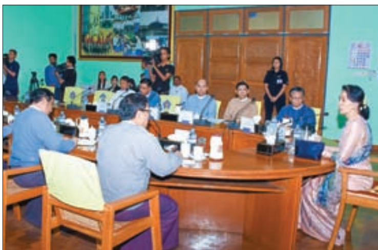
State Counsellor Daw Aung San Suu Kyi stresses need to provide health care services to temporally displaced persons.

The State Counsellor went on to say that she hoped the