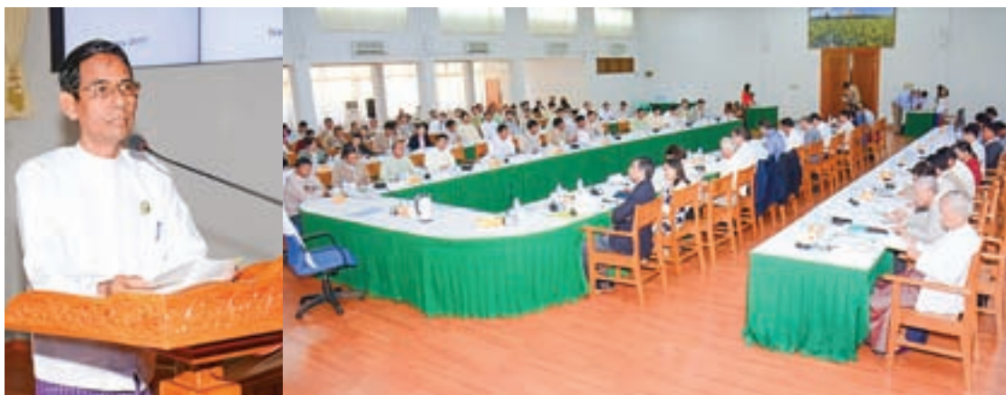
Union Minister Dr Aung Thu delivers an opening speech at the MoALI meeting in Nay Pyi Taw.

The company pledged to share agricultural techniques to the local farmers, planning to extend the market for their organic products.—Than Oo (Laymyathnar)