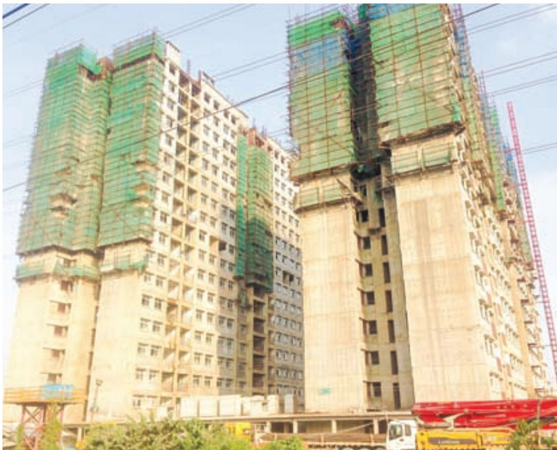
Ayeyawun and Yadana housing projects is under construction at Dagon Seikkan, Yangon.