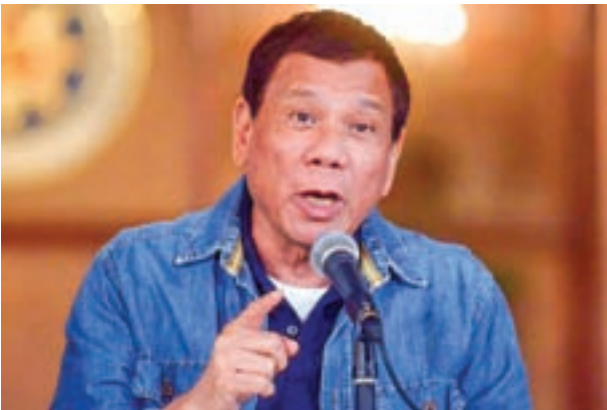
Philippine President Rodrigo Duterte gestures while speaking during a late night news conference at the presidential palace in Manila, Philippines, on 30 January 2017.

MANILA — Philippine President Rodrigo Duterte said on Thursday he would issue an executive order for military support in his fight against illicit drugs, which he said was a national security threat and he would “kill more” people if he had to. The mercurial leader ruled out declaring martial law and said he did not need extra powers, but wanted to bring the Armed Forces of the Philippines (AFP) into his drugs war because he could no longer trust law enforcement agencies. All police operations in the drug crackdown were suspended on Monday due to deep-rooted corruption. Duterte has placed an anti-drugs agency in charge of the campaign and has said he wants the armed forces to play a supportive role. “I still have to write the, whether it is a proclamation or an executive order, but I’ve taken in the AFP and raised the issue of drugs as a national se-