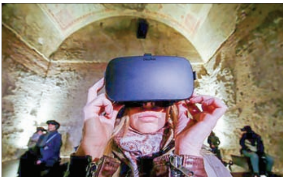
A woman wears a virtual reality device during a visit at the Domus Aurea, built by Roman Emperor Nero in 64 AD and later buried by Emperor Trajan in Rome, Italy, on 31 January 2017.

the later Emperor Trajan, who built his baths on top, the palace was rediscovered in the 15th century. It has been undergoing restoration in recent years.