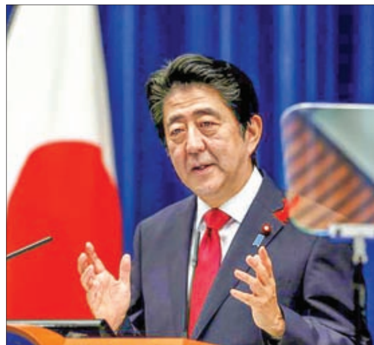
Japan's Prime Minister Shinzo Abe.

Japan is expected to defend its auto sector, which has built many manufacturing plants in the United States. Japan is also ex-