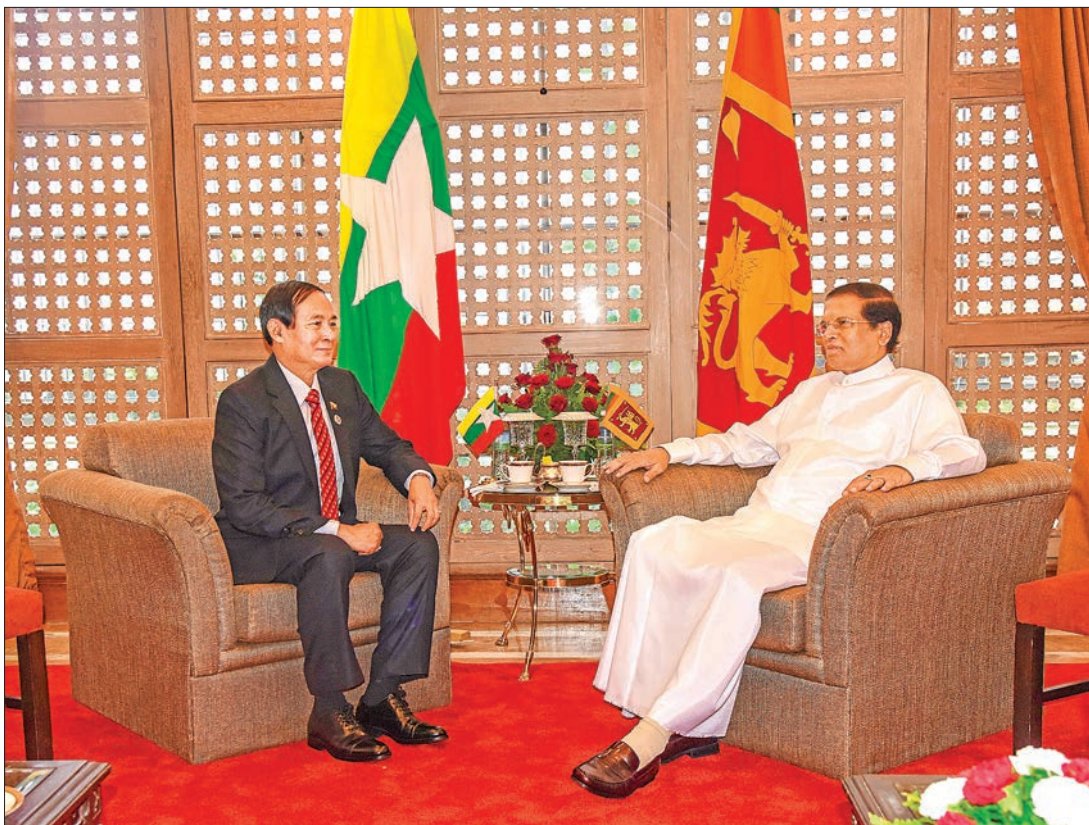
President U Win Myint meets with Sri Lankan President Mr. Maithripala Sirisena in Kathmandu, Nepal yesterday.