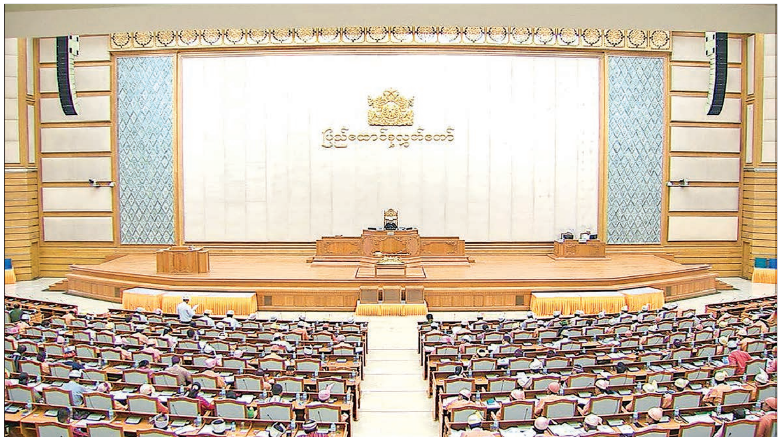
Second Pyidaungsu Hluttaw's ninth regular session is being convened in Nay Pyi Taw yesterday.

According to figures published by ASEAN secretariat, in 2017, Myanmar's foreign investment to GDP ratio is 7 per cent, taking up the fourth position among the ten ASEAN countries. Myanmar was also presented the Star Reformer Award in 2017 by the World Bank group for amending and reforming the Myanmar Investment Law and investment frames in a short period, explained the MIC