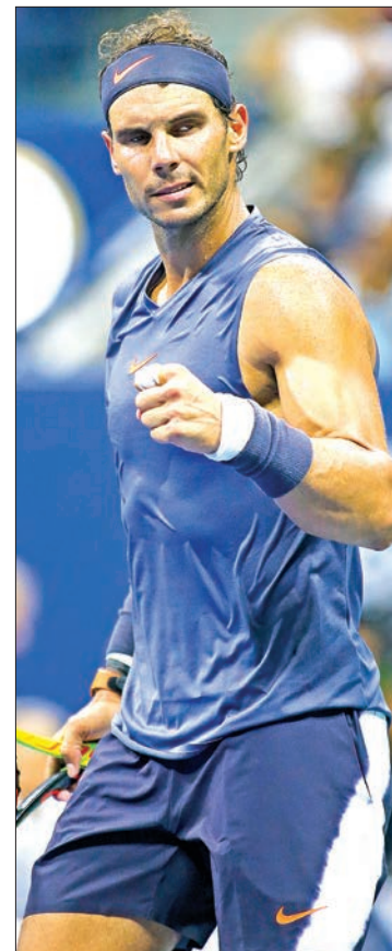
Quick work: Rafael Nadal celebrates US Open victory over Vasek Pospisil.

pleased to find himself feeling fit after prevailing 7-6 (7/5), 4-6, 6-3, 7-5 in three hours and 21 minutes. — AFP ■