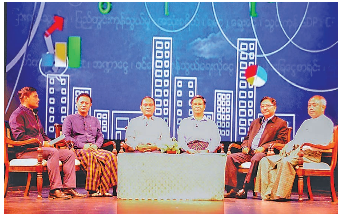
Deputy Minister U Aung Htoo, 4 th from left, and Director-General U Aung Soe, 2 nd from right.

The government has said that economic growth is on the rise, but some have argued that the situation of Myanmar's economy is shrinking. In fact, the economy in Myanmar has been steadily increasing.