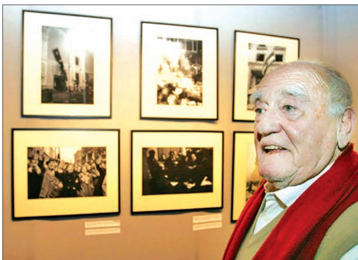
Austrian photographer Erich Lessing, who has died aged 95, with pictures of the 1956 Hungarian uprising.

He later taught photography at various venues and his work was published in around 60 volumes. In 2013 he donated 60,000 images to the archives of the Austrian National Library.