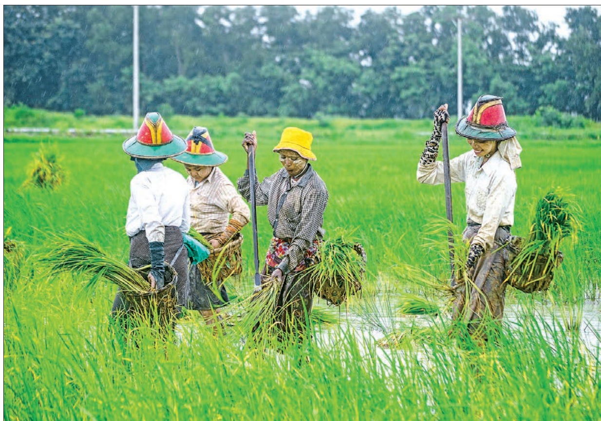
Farmers plant rice seedlings in a paddy field on the outskirts of Yangon.