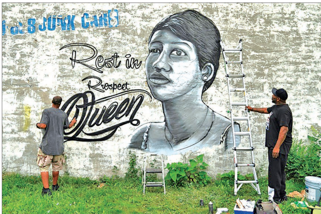
A man paints a mural of Aretha Franklin on a wall down the street where the Rev. Jesse Jackson spoke celebrating the life of singer Aretha Franklin at her father's church, New Bethel Baptist, during a Sunday morning service in Detroit, Michigan.

On Friday, former president Bill Clinton and Smokey Robinson are among those due to address her six-hour, invitation-only funeral with musical tributes coming from Stevie Wonder and Ariana Grande. —AFP ■