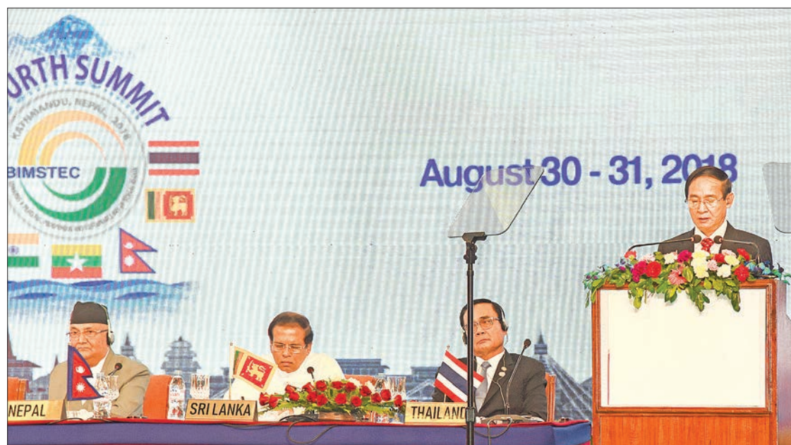
President U Win Myint delivers the address at the opening ceremony of the 4 th BIMSTEC Summit in Kathmandu yesterday.

At the Third BIMSTEC Summit, held in Nay Pyi Taw in