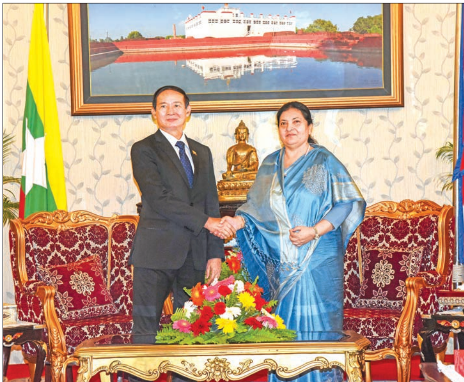
President U Win Myint is welcomed by Nepalese President Mrs. Bidhya Devi Bhandari in Kathmandu, Nepal, yesterday.