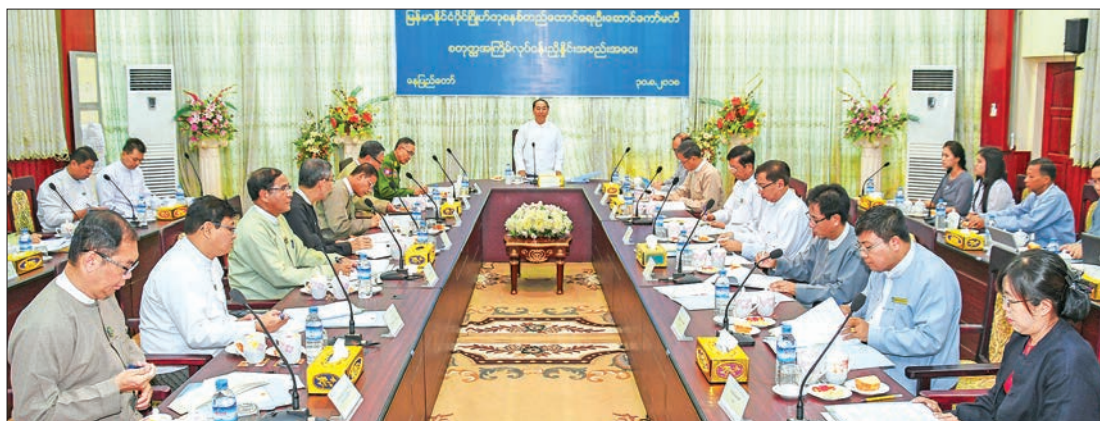
Vice President U Myint Swe delivers the opening speech at the coordination meeting on establishing satellite system in Nay Pyi Taw yesterday.

Under the management of the committee, a 9-member work committee led by Union Minister for Transport and Communications was formed and was implementing six tasks. In addition to this to support the leading committee and to implement the works quickly, three sub-committees, Myanmar-owned satellite system technical sub-committee, Myanmar-owned satellite system legal affairs and rules sub-committee and Myanmar-owned satellite transponder leasing sub-committee were formed. The leading committee has conducted three coordination meetings where sixteen decisions were made. Of the sixteen, thirteen were conducted and three are still to be done. The three ongoing works