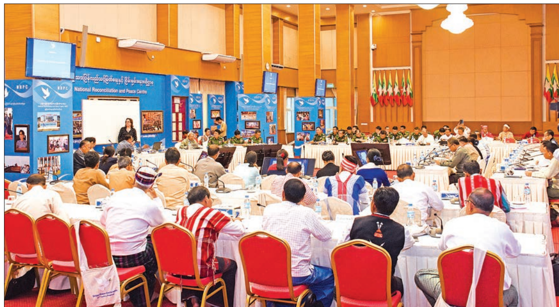
Roundtable discussion on reviewing the framework for political dialogue being convened in Nay Pyi Taw yesterday.

As I'm from a government organisation, in the work committee, if each group's thoughts, weaknesses and group wise requirements were discussed and requirements fulfilled, the work process will speed up. The review