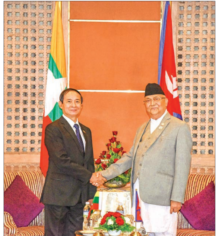
President U Win Myint shakes hands with Nepal Prime Minister Mr. Khadga Prasad Sharma Oli in Kathmandu, Nepal yesterday.