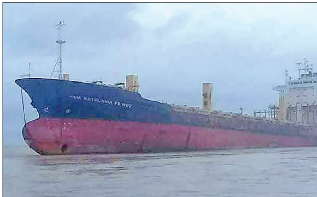
SAM Ratulangi PD stranded in the sea near the Thamaseikta Village in Thongwa Township.

Smith Salvage Company initially informed the Myanmar Port Authority of the Ministry of Transport and Communications that the vessel was not destined for Myanmar and it was being towed to Bangladesh.—Myanmar News Agency