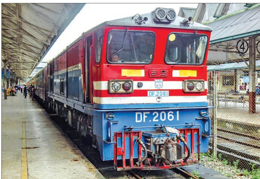
A locomotive seen at Yangon Railways Station.

Following heavy rains, the rail tracks on Yangon-Bagan railway between milepost 217/16 and 217/20 were covered with silts and sand. Therefore the authorities temporarily suspended the railway service along Yangon-Bagan