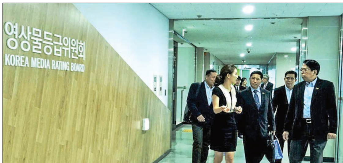
Union Minister for Information Dr. Pe Myint visits the Korea Media Rating Board, in Busan Visual Industry Center in Busan City yesterday.

In the afternoon, the union minister and his delegation arrived at the Busan Asian Film School (AFiS) where they were given presentations on the