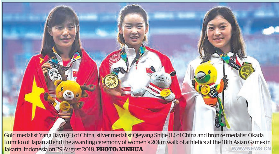
Gold medalist Yang Jiayu (C) of China, silver medalist Qieyang Shijie (L) of China and bronze medalist Okada Kumiko of Japan attend the awarding ceremony of women's 20km walk of athletics at the 18th Asian Games in Jakarta, Indonesia on 29 August 2018.

JAKARTA—China bagged two golds from athletics at the Asian Games here on Wednesday, remaining top of medal tally in the sport.