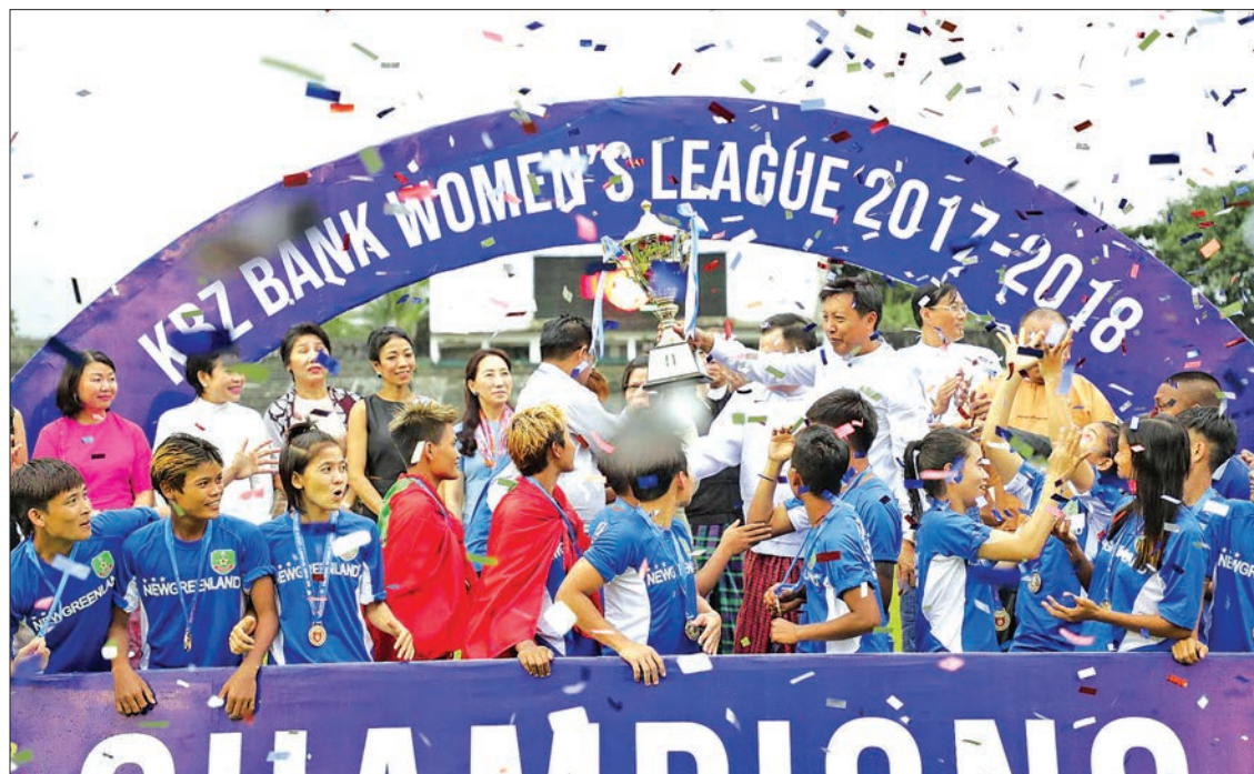
Myawady team celebrates victory after winning the championship title of the KBZ Bank Women's League 2017-2018.