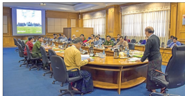
Pyidaungsu Hluttaw Deputy Speaker U Tun Tun Hein addresses the Pyidaungsu Hluttaw Joint Bill Committee meeting.

Committee Chairman U Tun Aung @ U Tun Tun Hein, deputy chairmen, secretaries, joint secretary and committee members from Joint Bill Committee and joint public accounts committee, Legal Affairs and Special Cases Assessment Commission members, Office of the Supreme Court of Myanmar, Ministry of Health and Sports, Ministry of Planning and Finance, Office of the Union