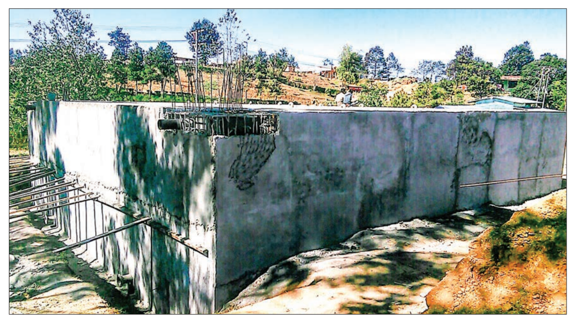
Construction of water tank for sufficient drinking water in Falam, Chin State.

The irrigated water will be stored in 100,000 gallon water tanks and supplied to the households from eight wards in Falam. The water tanks are being installed at four sites in Falam by a con-