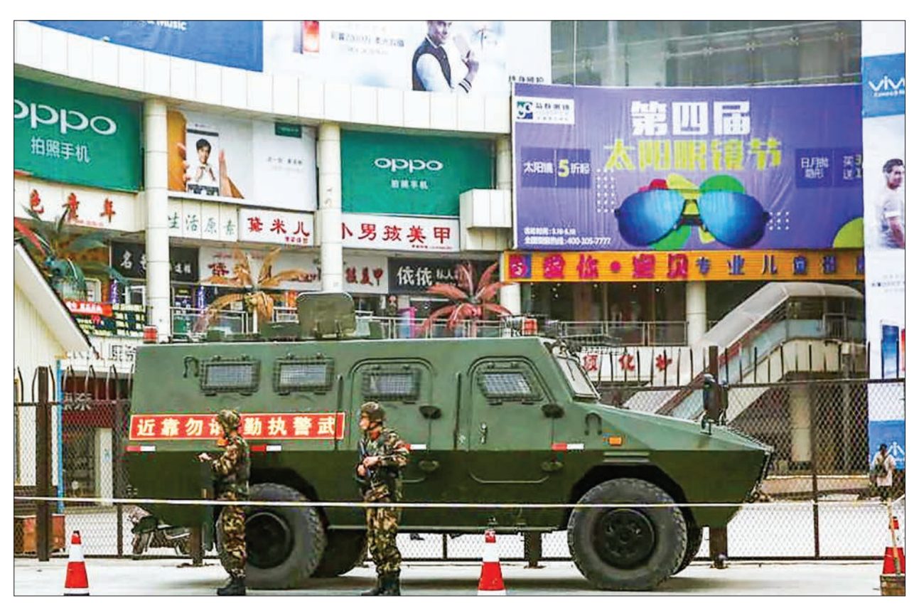
Security personel stand in front of an armoured vehicle in Kashgar, Xinjiang Uighur Autonomous Region, China, March 24, 2017.

In response, the government has organised mass police rallies and rolled out new surveillance and anti-terror measures throughout the region, including thousands of newly installed street-corner police stations in cities and towns.