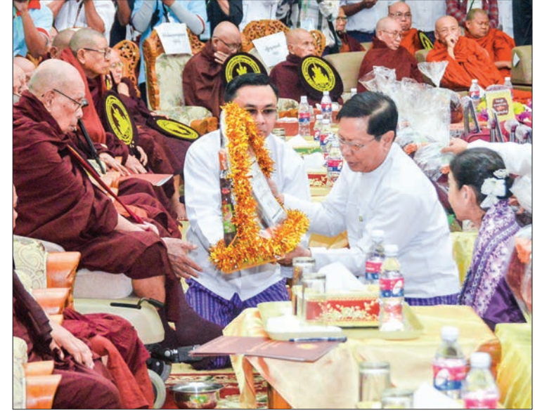
Union Minister Thura U Aung Ko presents offertory to a Sayadaw at the 20th Conference of Shwekyin Nikaya.