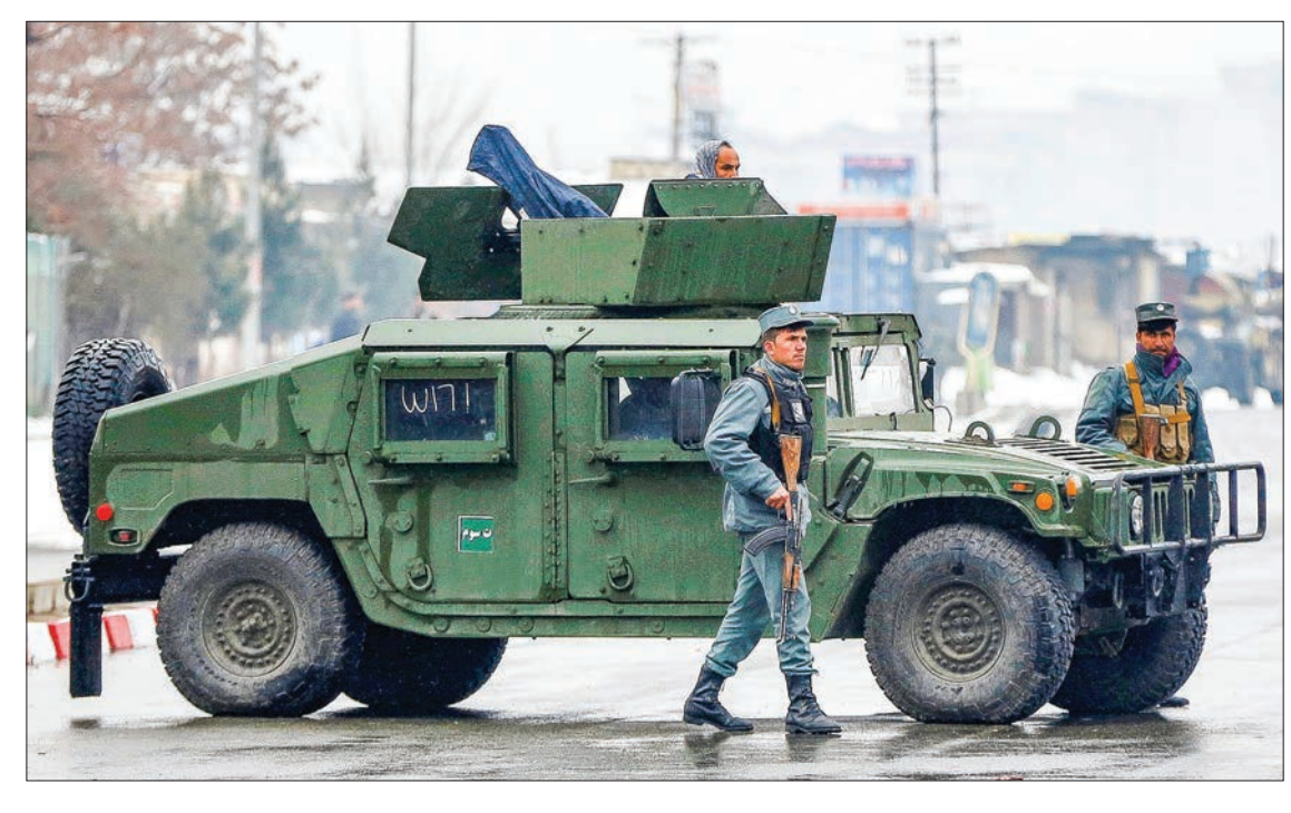
Afghan policemen keep watch near the site of an attack at the Marshal Fahim military academy in Kabul, Afghanistan on 29 January, 2018.

legiance to Islamic State operate in mountains in the eastern province of Nangarhar, little is known about the group and many analysts question whether they are solely responsible for the attacks they have claimed in Kabul and elsewhere.