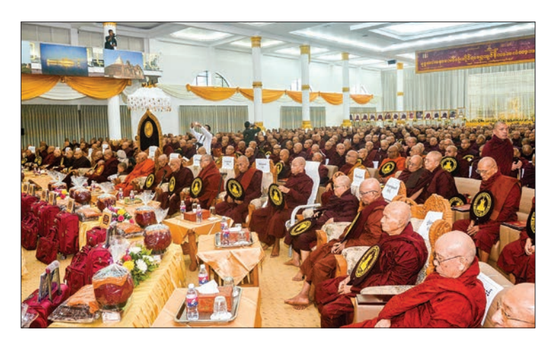
Sayadaws attend the 20th Shwekyin Nikaya conference.