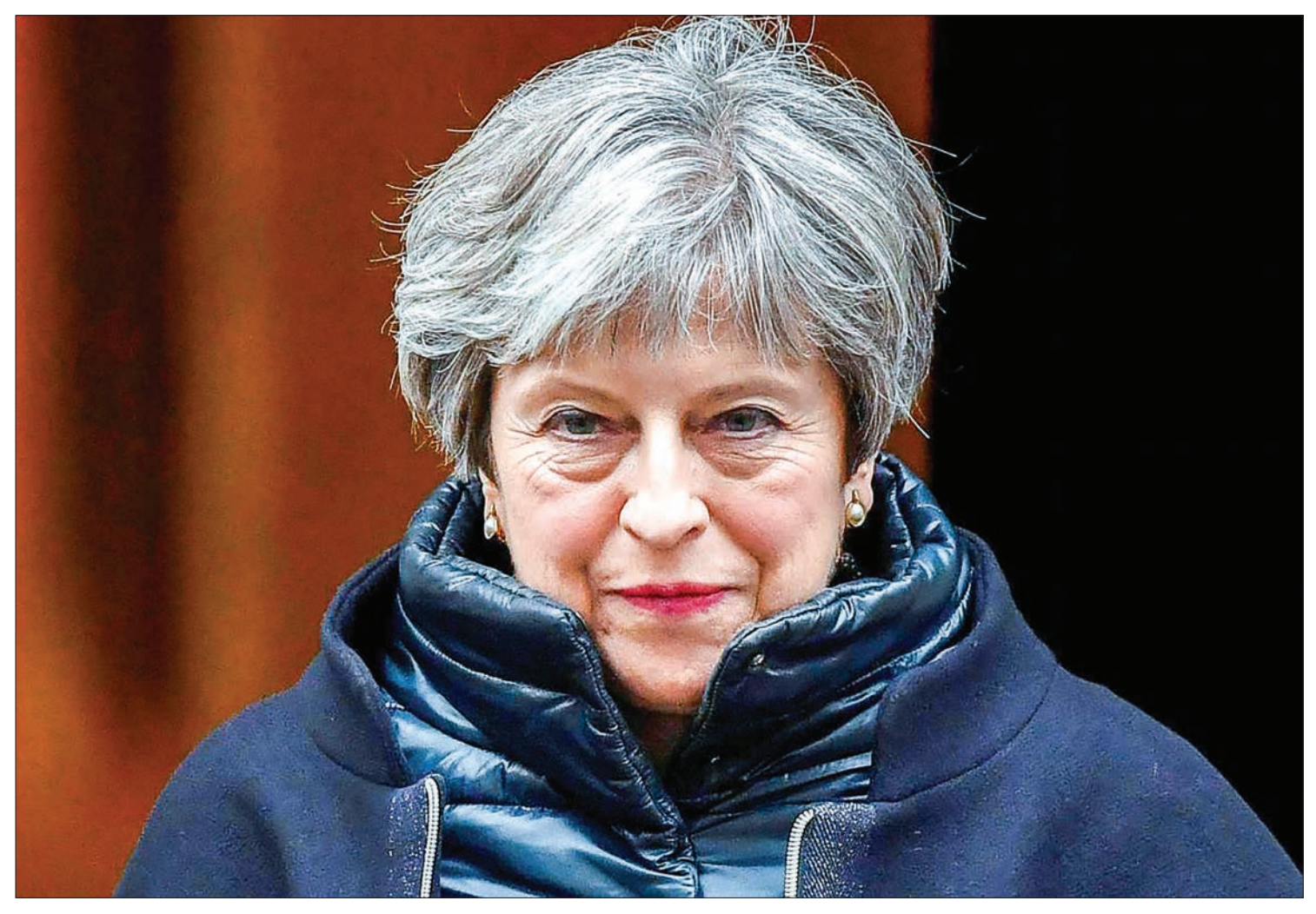
Britain's Prime Minister Theresa May.