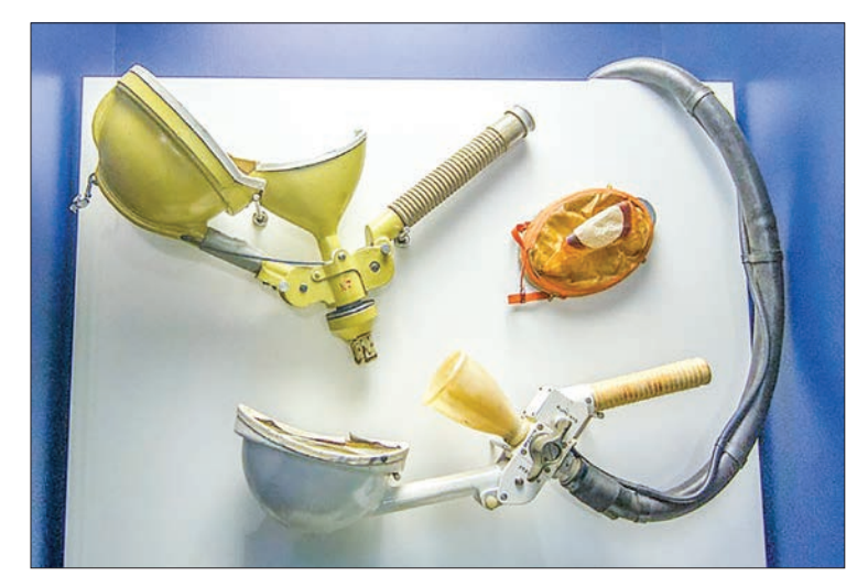
Toilet used on the ISS's Soyuz spacecraft.

The researcher said while their method is not ready for application yet, it provides a new model for creating food on board spacecraft.—Xinhua