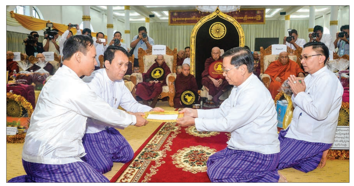
Yangon Region Chief Minister U Phyo Min Thein presents K3 million donated by President U Htin Kyaw and First Lady to Union Minister Thura U Aung Ko.