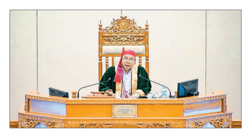
Amyotha Hluttaw Speaker Mahn Win Khaing Than.

lish a national day, and the government should not set it up, explained the union minister. U Ye Htut of Sagaing Region constituency 5 then asked whether there was a plan to exempt from commercial tax the entire service supply chain of books, literature and journals published by publishers who had applied