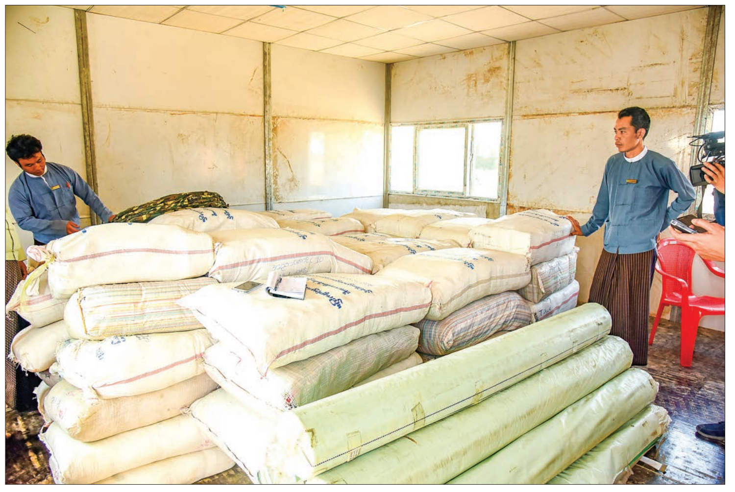
Authorities check the aid stored for returnees in Maungtaw as the government is ready to launch the repatriation.