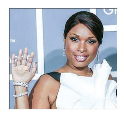
Jennifer Hudson.

Sting, accompanied by musician Shaggy, looked dapper with a jaunty silk ascot, pink shirt and white handkerchief folded to resemble a rose in the pocket of his black jacket. Singer Joy Villa — who made headlines in 2017 with her "Make America Great Again" gown in support of President Donald Trump — made another highly charged statement. Eschewing the white roses worn by others, Villa showed off a white gown hand-painted with the image of a fetus in a rainbow-colored womb, accessorized by a "Choose Life" purse. — Reuters ■