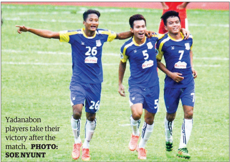
Yadanabon players take their victory after the match.

The first-place teams from all groups and the best second place team will participate in the semifinal of the AFC Cup 2017. —Kyaw Zin Lin ■