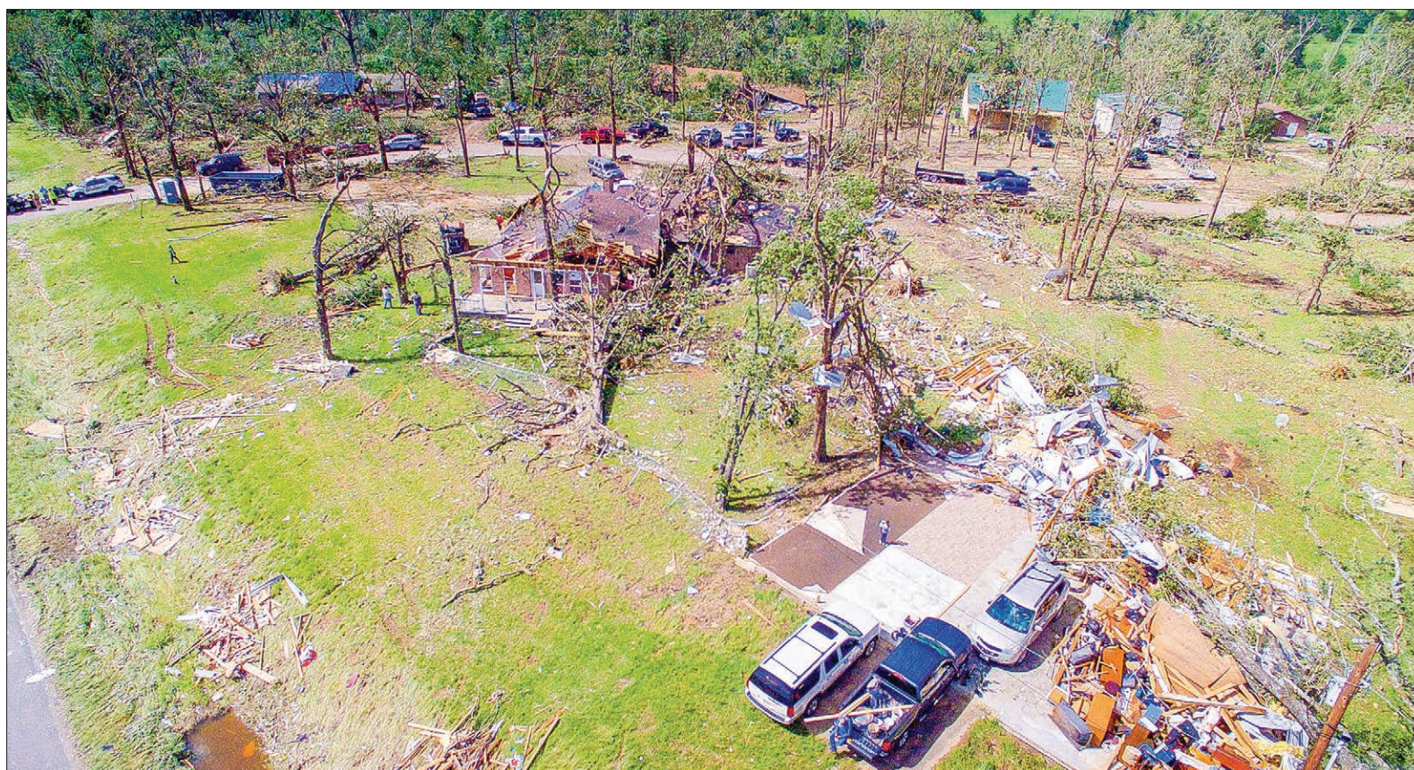
Homes are severely damaged after a tornado hit the town of Emory, Texas, US on 30 April, 2017.

Earlier a Canton fire department captain said he believed five people had been killed.