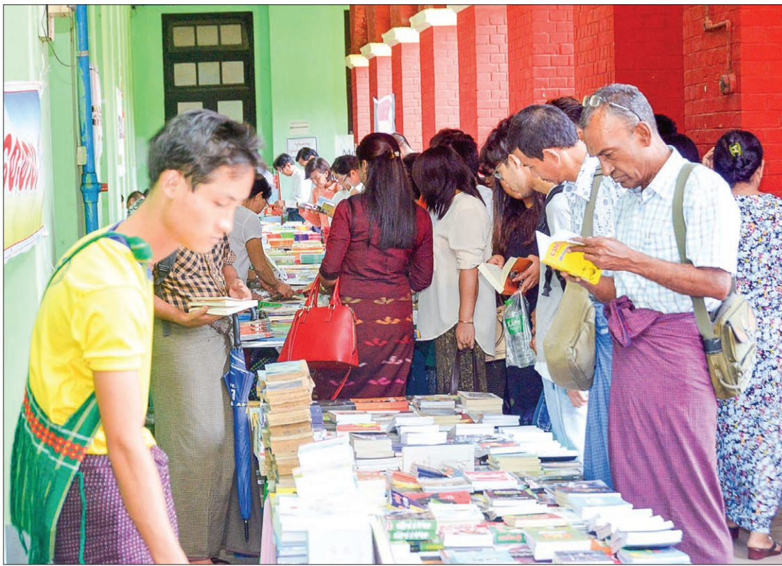
Book shops at the summer book festival are crowded with book lovers.