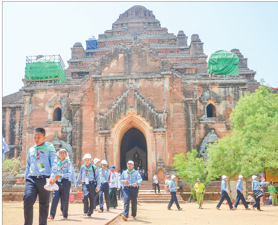
Outstanding students leave the Dhammayangyi Pagoda after observing the mural paintings and architectural designs at the pagoda.

The opening ceremony of Outstanding Youth's Recreation Camp in Ngwehsaung was opened with the students sing-