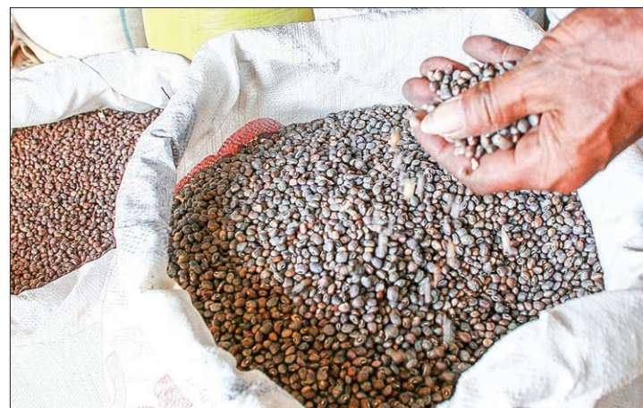
Matpe beans.

If the breeding of fresh and seawater fish is successful, it will help to increase the declining trade with neighbouring Bangladesh. ■