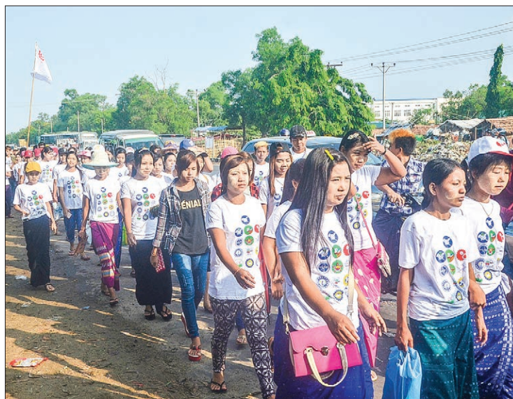
Workers march to the gathering point to celebrate the 127th May Day in Hlinethaya Industrial Zone.

Film stars and members of labour unions entertained the gathering with songs.