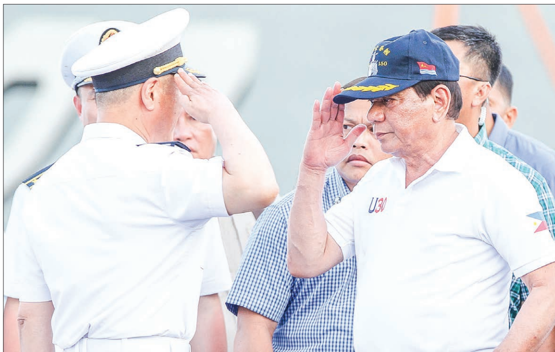
Philippine President Rodrigo Duterte returns the salute of a Chinese Navy officer as he tours a Chinese Naval ship during a visit to Davao city, southern Philippines on 1 May, 2017.

A Chinese naval fleet has begun a three-day friendly visit after arriving Sunday at Davao City in the southeastern region of The Philippines. —Xinhua ■