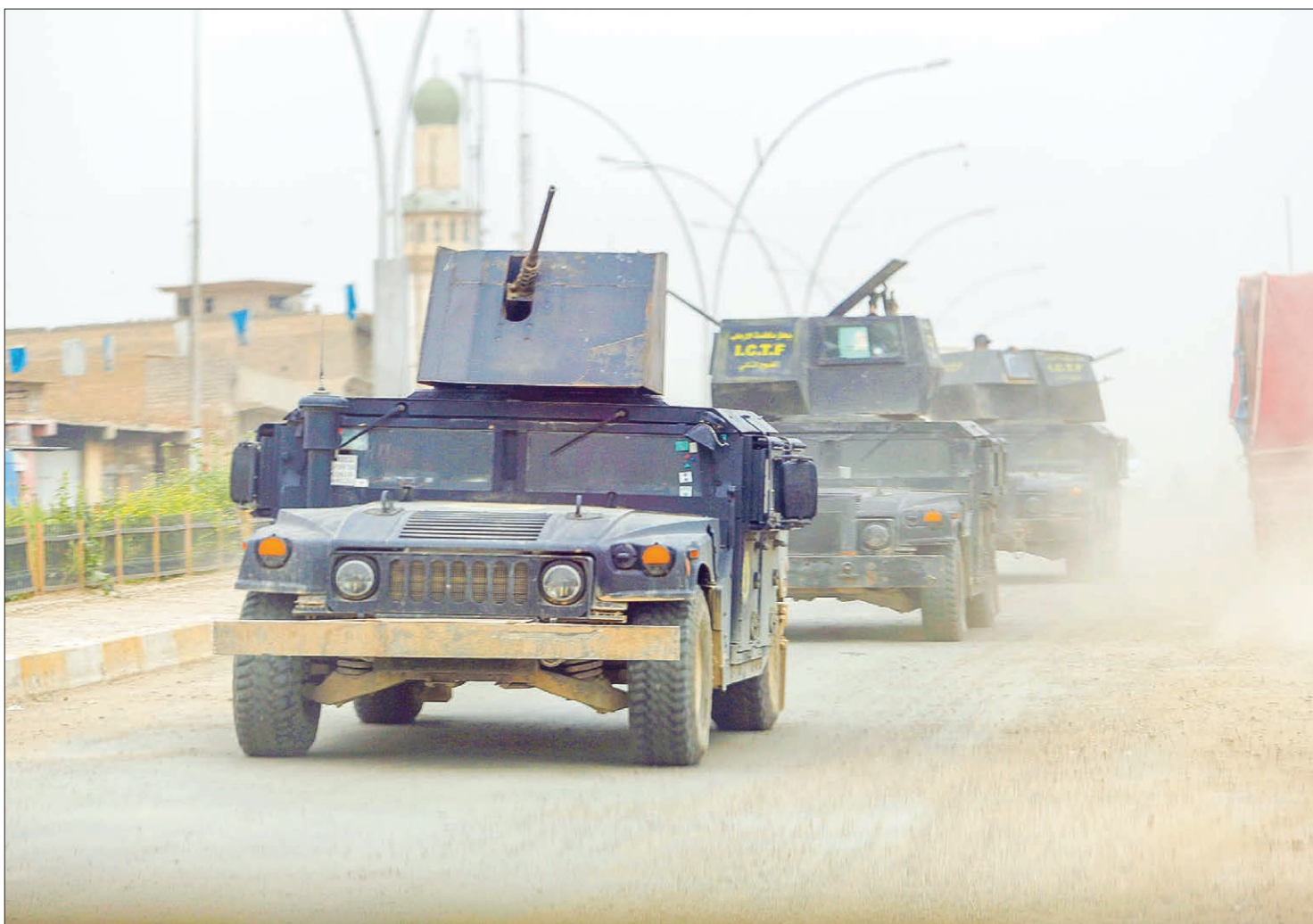
Iraqi forces patrol a street as they battle with Islamic State militants, in western Mosul, Iraq on 1 May, 2017.

Marches calling on Zuma to quit have drawn tens of thousands of protestors but the ANC has rejected such calls ahead of two key conferences this year, one where it will chart its policy direction, the other where it will pick Zuma's successor to lead the party in 2019 general elections. —Reuters ■