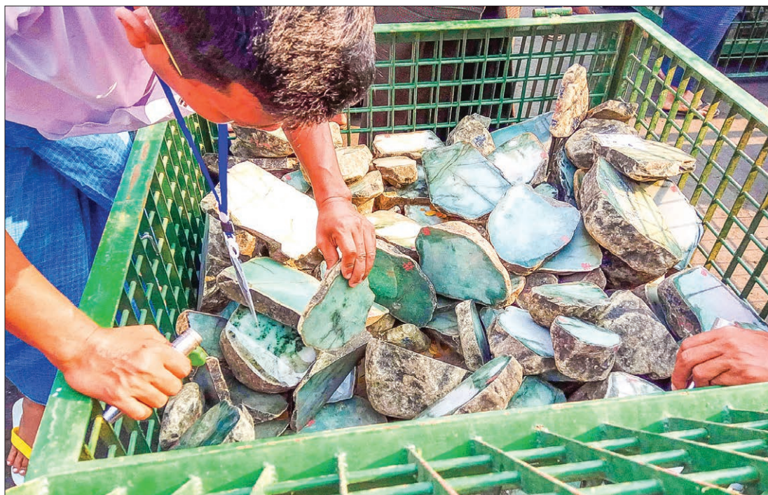
A trader evaluates jade stones at the Gems and Jade emporium in Nay Pyi Taw in March.