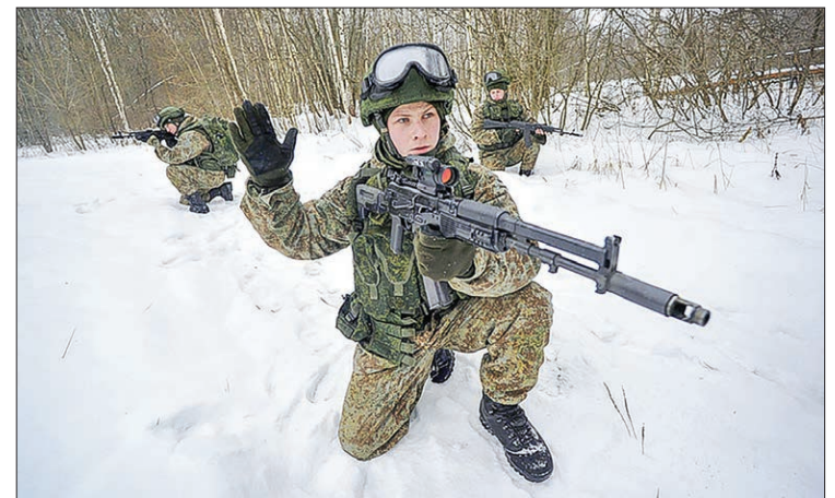
The second-generation Ratnik combat outfit is delivered to land troops, the Airborne Force and marine infantry.

Pakistan denies that and says India must hold negotiations on the future of Kashmir.—Reuters ■