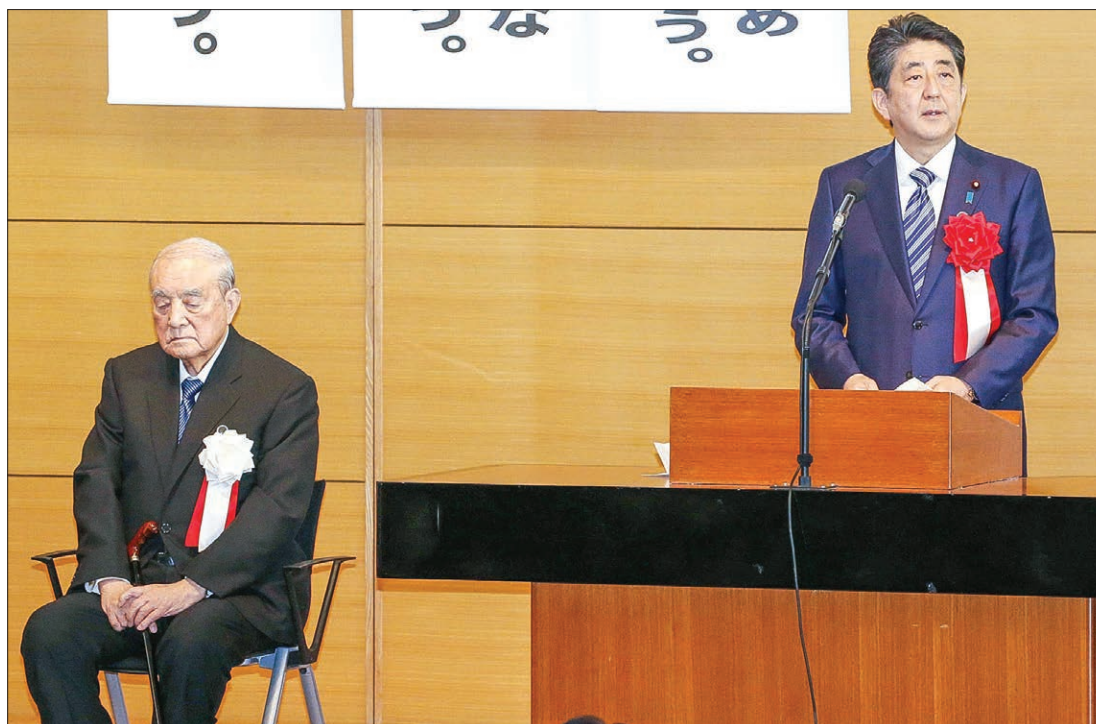
Japanese Prime Minister Shinzo Abe (R) speaks at a gathering of a cross-party league of lawmakers in favor of constitutional reform in Tokyo on 1 May, 2017.

“In this milestone year, we will take a historic step toward the large goal of constitutional reform,” he said. “Those mem-