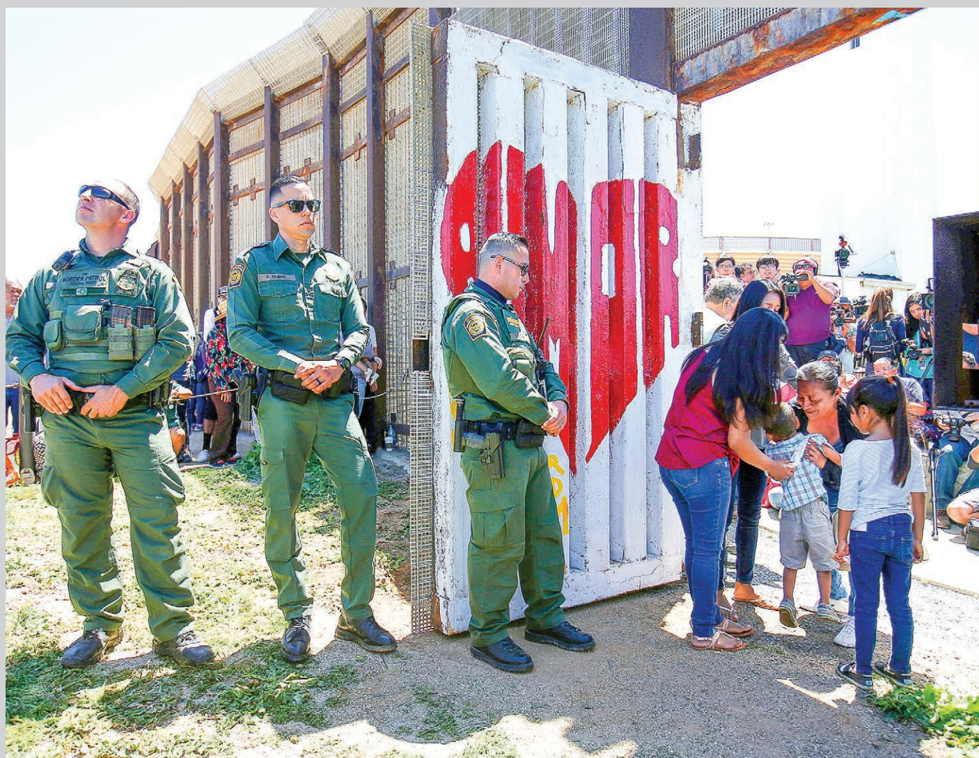
Families are reunited as US Border patrol agents open a single gate to allow families to hug along the Mexico border as part of Children's Day in Mexico, at Border Field State Park in San Diego, California, US on 30 April, 2017.

ISTANBUL — Turkey's $6.5 billion annual trade volume with India is "not enough" and should be boosted, Turkish President Tayyip Erdogan said on Monday. "I think it would be beneficial to raise it to $10 billion," he told a joint news conference with Indian Prime Minister Narendra Modi in New Delhi broadcast on state television channel TRT Haber. Erdogan also said he believed India would take steps to expel the domestic network of Muslim cleric Fethullah Gulen, who Ankara accuses of orchestrating a failed coup in July. —Reuters ■