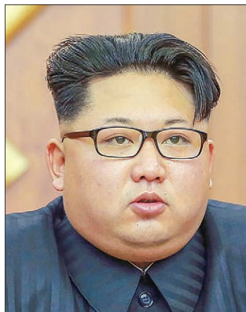
North Korean leader Kim Jong Un.

“Now that the US is kicking up the overall racket for sanctions and pressure against the DPRK, pursuant to its new DPRK policy called ‘maximum pressure and engagement’, the DPRK will speed up at the maximum pace the measure for bolstering its nuclear deterrence,”