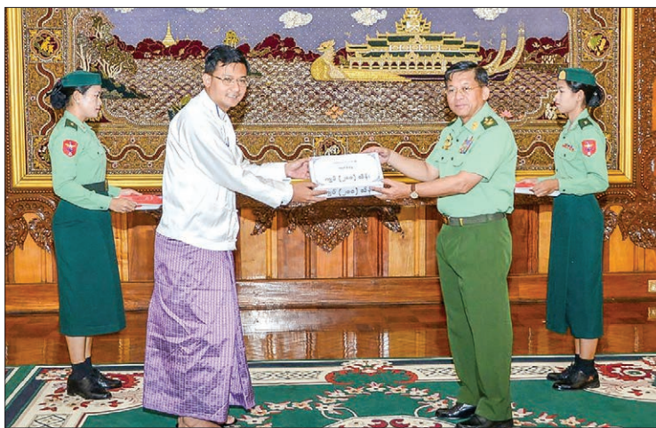
Senior General Min Aung Hlaing gives donation at the Zeyathiri Beikman in Yangon.