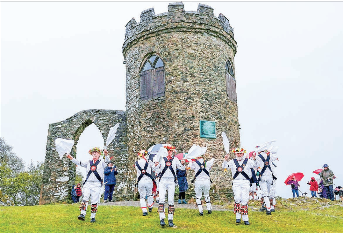
Demonstrators walks behind a banner as part of traditional May Day labour day march in Nantes, France on 1 May, 2017. Banner reads, “Finish with social backstepping that makes the fertile ground for the far-right”.

After 40 people were injured jumping into the river in 2005, local authorities installed