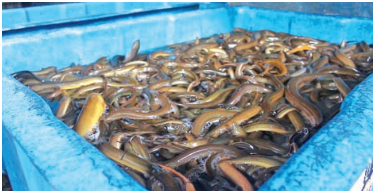
Experimental cultivation of eels conducted in the past but failed due to the high rate of eel death.

Baby eels are banned from being caught or sold in order to prevent further