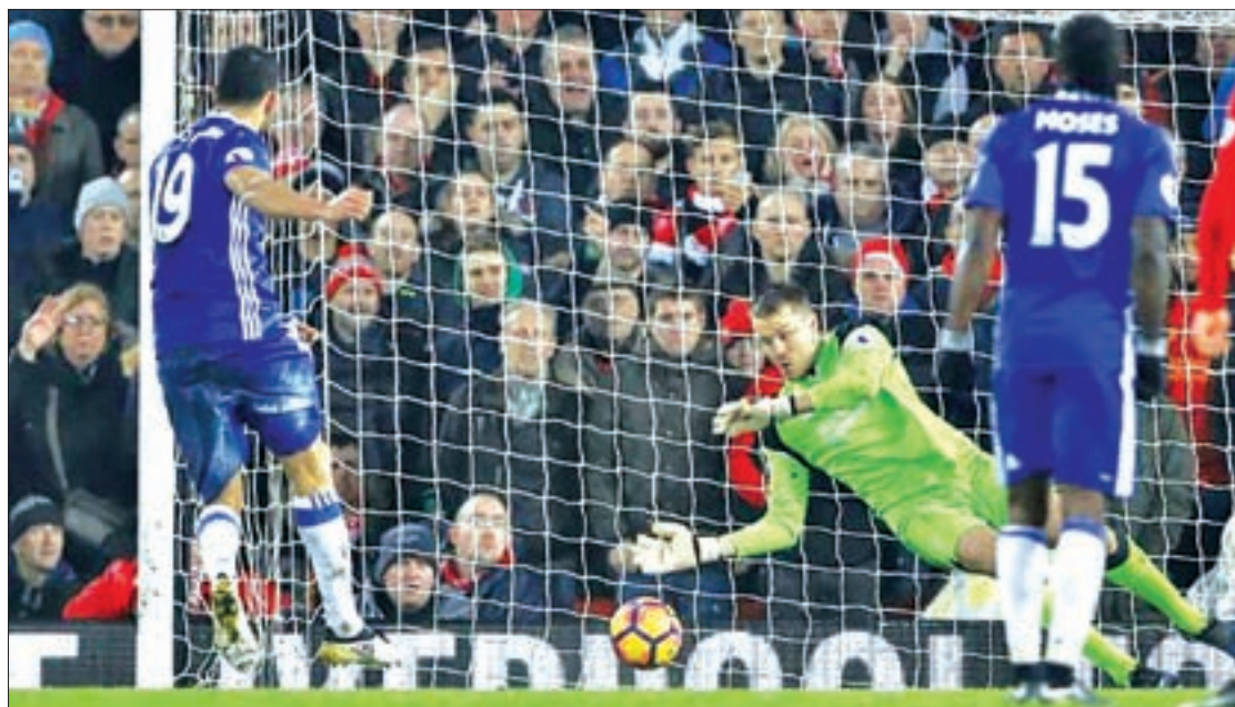
Chelsea's Diego Costa has his penalty saved by Liverpool's Simon Mignolet at Anfield on 31 January, 2017.

ing acute after Claudio Ranieri's side went down 1-0 at Burnley for whom Sam Vokes grabbed a late winner. Leicester's third consecutive league defeat left them two points off the relegation zone in 16 th place with the battle for survival hotting up after wins for Swansea City and Crystal Palace and Sunderland's battling point at home to Spurs.—Reuters