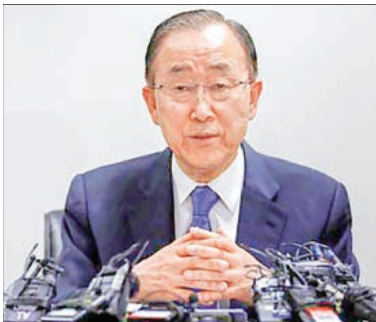
Former UN Secretary-General Ban Ki-moon speaks during his news conference in Seoul, South Korea on 31 January, 2017.

coming, the US Justice Department announced that his brother and nephew have been charged in the United States with violat-