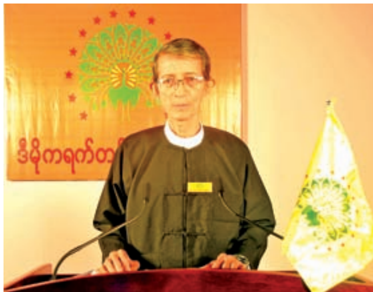
U Tint Swe of Democratic Party (Myanmar).

VICE Chairman U Tin Swe of the Democratic Party (Myanmar) presented the policies, philosophy and programs on 30 January on Radio and TV.