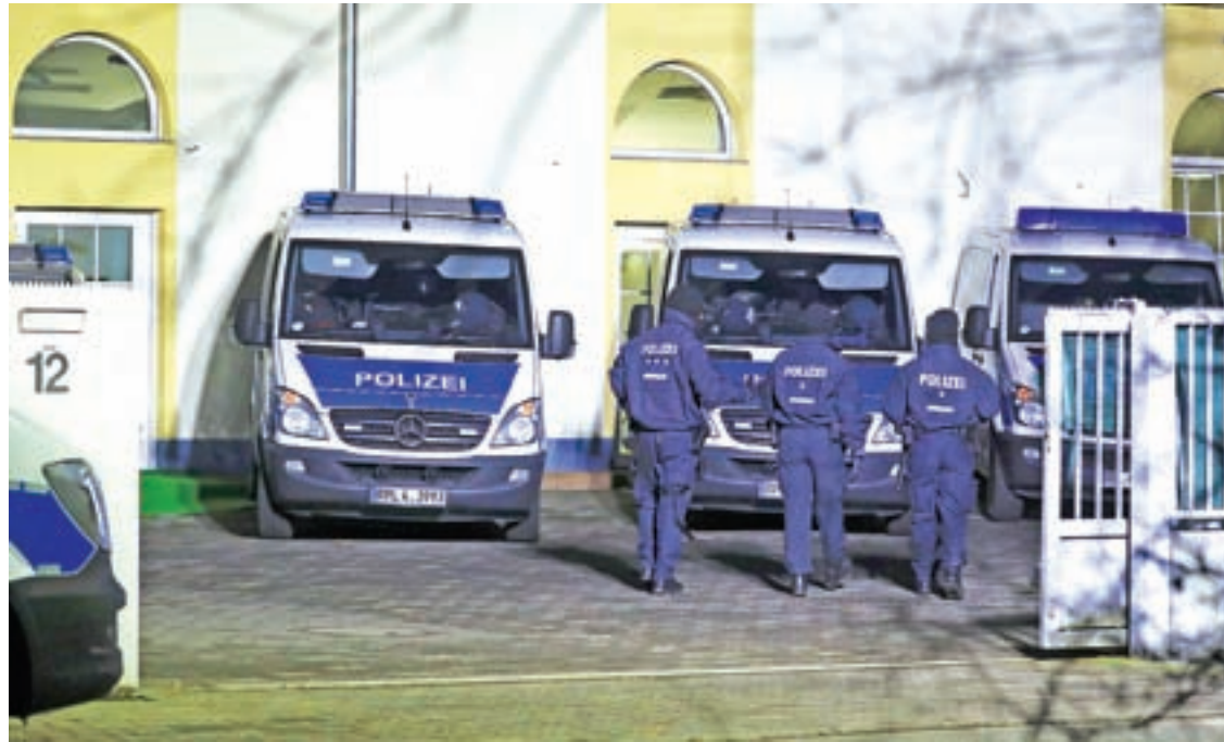
German police officers enter Frankfurt's Bilal mosque during early morning raids in the federal state of Hesse and its capital Frankfurt, Germany, on 1 February, 2017.

Peter Beuth, interior minister of the state of Hesse, said there had not been any immediate danger: "It was not about preventing an imminent attack — rather security forces in Hesse intervened