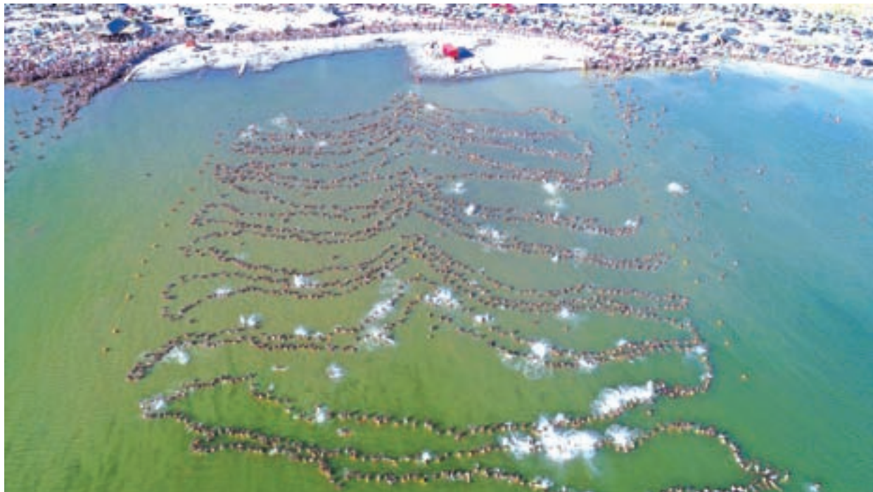
Nearly 2,000 people float in a line setting a new Guinness world record for the most people floating while holding hands in Lake Epecuen, a salty lake, near Carhue, Argentina, on 29 January, 2017 in this handout supplied by Prensa Municipalo Adolfo Alsina. PHOTO: REUTERS