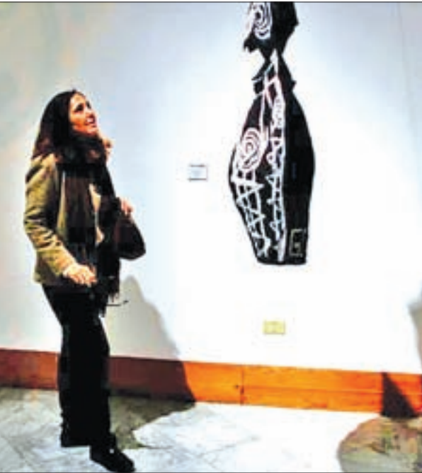
Mariela Castro, sexologist, National Assembly member and daughter of Cuba’s President Raul Castro looks at a painting on a dress by Cuban artist Jorge Perugorria during the ‘Fashion Art Havana’ exhibition in Havana, Cuba, on 31 January, 2017.