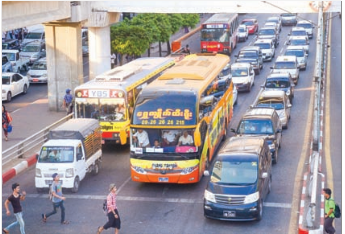
Asian Development Bank will help Myanmar with its transport infrastructure, which is critical to the country's development and will improve people's access to markets and basic services.