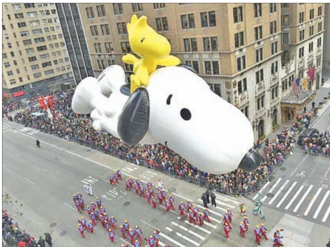
A float depicting the animated “Peanuts” characters Snoopy and Woodstock proceeds along 6th Ave as spectators watch from buildings during the 89th Macy’s Thanksgiving Day Parade in the Manhattan borough of New York on 26 November, 2015.

The New York-based company is working with investment