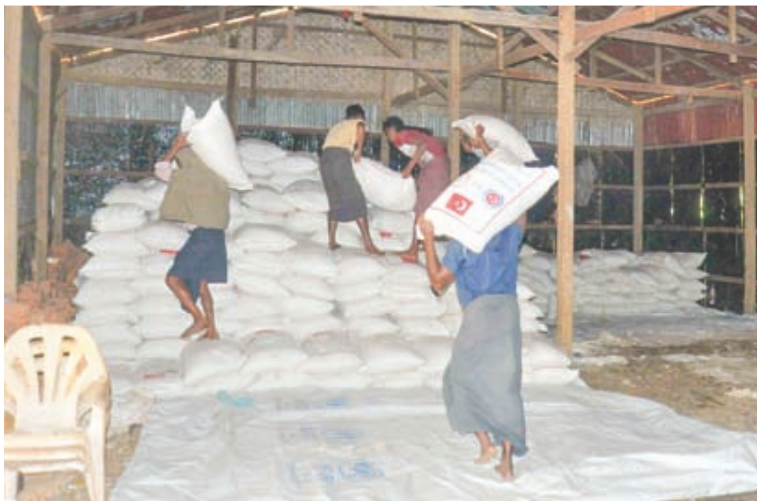
Bags of rice from Turkey are delivered to villages yesterday in Maungtaw, Rakhine State.