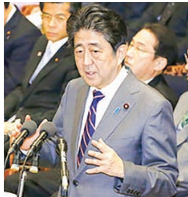
Prime Minister Shinzo Abe attends the lower house budget committee in Tokyo on 1 February, 2017. Abe said he will explain at his upcoming meeting with US President Donald Trump on 10 February how Japanese companies have contributed to overall US industry.

During his election campaign, Trump suggested Japan and other US allies need to contribute more toward the costs of stationing the US military in their countries if they want to retain the protection of the alliance. —Kyodo News