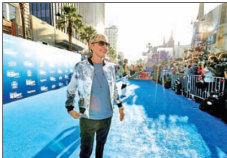
Cast member Ellen DeGeneres poses at the premiere of ‘Finding Dory’ at El Capitan theatre in Hollywood, California US on 8 June, 2016.

The remarks by DeGeneres were the latest in a series of direct and indirect attacks by celebrities on the president’s immigration ban, which has caused chaos and protests at airports around the world. Actors at the Screen Actors Guild awards ceremony in Los Angeles on Sunday also took aim at the ban in fiery speeches that ranged from personal experiences as immigrants or Muslims to calls for solidarity.—Reuters