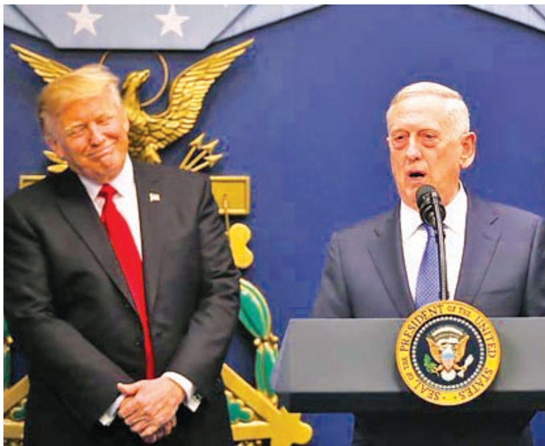
US President Donald Trump listens to remarks by Defence Secretary James Mattis (R) after a swearing-in ceremony for Mattis at the Pentagon in Washington, US, on 17 January, 2017.

WASHINGTON/TOKYO — US President Donald Trump's defence secretary is expected to underscore US security commitments to key allies South Korea and Japan on his debut trip to Asia this week as concerns mount over North Korea's missile programme and tensions with China.