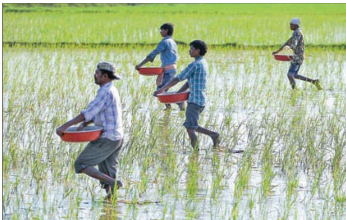
Farmers sprinkle fertilizers on a paddy field on the outskirts of Ahmedabad, India, on 1 February, 2017.

“The move should encourage more people to pay tax. The present burden of taxation is mainly on taxpayer and the salaried employees who are showing their income correctly. We also