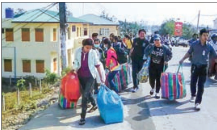
Forty-four Myanmar national sold into forced labour in Thailand have returned home.

Present at the hand-over ceremony were officials from the Ministry of Labour, Immigration and Population, the Task Force against Trafficking in Persons (Myawady), the Maternal and Child Welfare Association and the Women's Affairs Organisation.