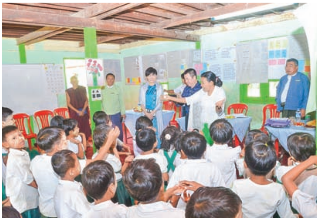
Mrs Akie Abe meets children at a Monastic Education School, Yangon yesterday.

township, Dhammadipa Monastic school in Sitagu International Buddhist Academy and Mary Chapman School for the Deaf in Dagon Township, and donated cash and stationery to each of the schools.— Myanmar News Agency