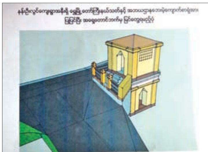
Photo shows building of Abaya Htana Bay Mae stone inscription near Nan Oo Lwin village.

The renovation was started on 25 January with the cleaning of