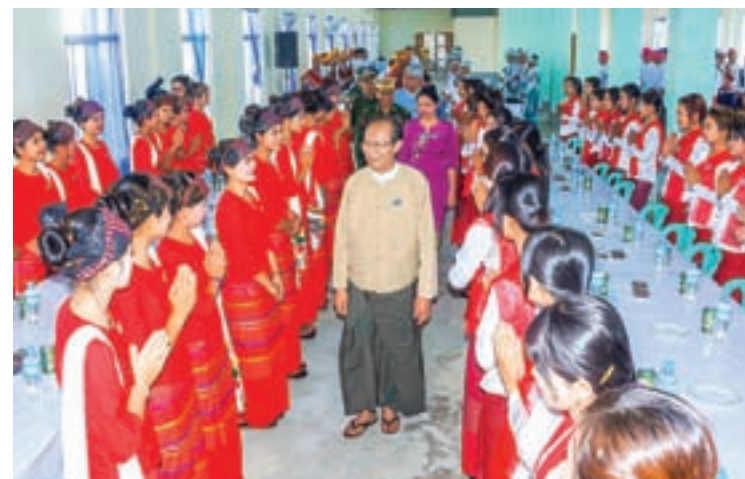
Dr Myo Aung, chairman of the Nay Pyi Taw Council, welcomes cultural troupes from regions and states.

It is learnt that the excursion trips to Uppata Santi Pagoda, Nay Pyi Taw Buddha Gaya and Water Fountain Garden in Nay