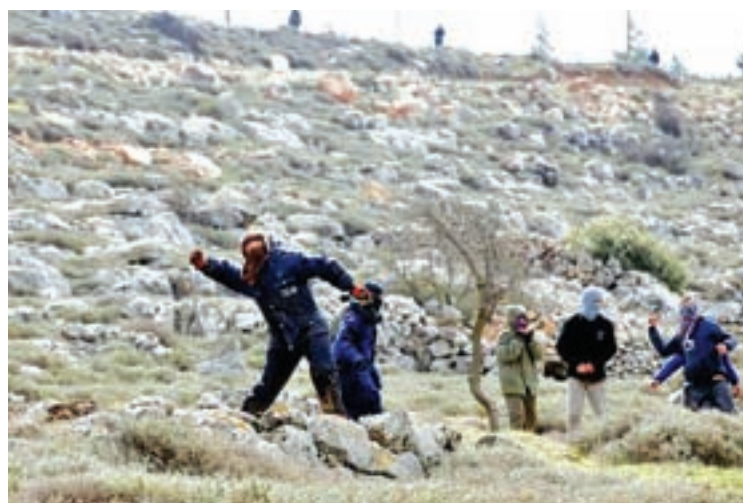
A protestor throws a stone towards Israeli security forces during an eviction of residents from the Israeli settler outpost of Amona in the occupied West Bank on 1 February, 2017.

Hours before the police operation, Israel announced plans for 3,000 more settlement homes in the West Bank, the third such declaration in eleven days since US President Donald Trump took office. Trump has signalled he could be more accommodating toward such projects than his predecessor