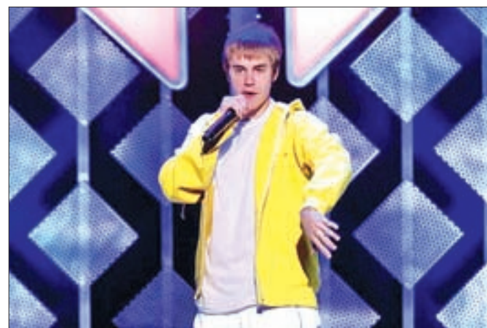
Justin Bieber performs at Z100’s Jingle Ball in Manhattan, New York, US, December 9, 2016.

The accident happened as Bieber, 23, was pulling out of parking lot following a church