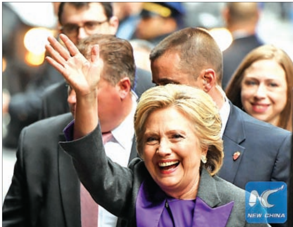
File photo taken on 9 November 2016 shows that US Democratic presidential nominee Hillary Clinton arrives for her first public concession speech after losing the presidential election to the Republican candidate in New York, the United States.

“This is her most personal memoir yet,” said Simon & Schuster on its Web page for the book in which for the first time Clinton reveals “what she was thinking and feeling during one of the most controversial and unpredictable presidential