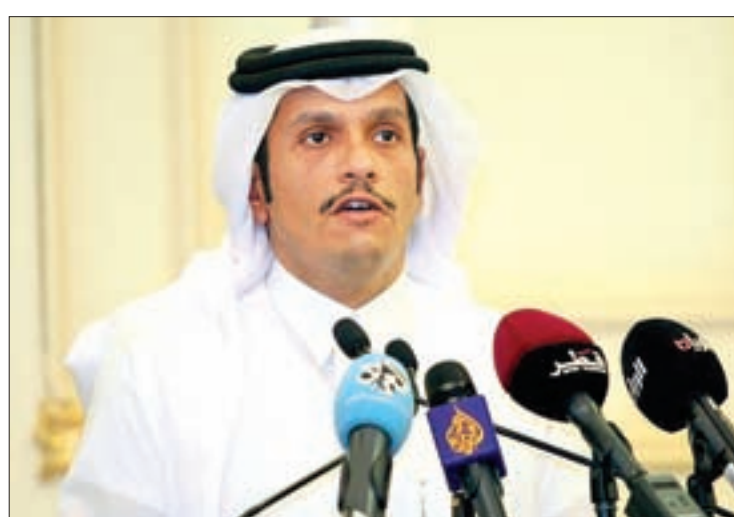
Qatar’s Foreign Minister Sheikh Mohammed bin Abdulrahman al-Thani attends a joint news conference with French Foreign Minister Jean-Yves Le Drian in Doha, Qatar, on 15 July 2017.

In June, Qatar asked the Montreal-based UN aviation agency to intervene after its Gulf neighbours closed their airspace to Qatar flights. While Egypt last week accused Qatar of adopting a “pro-terrorist” policy that violated UN Security Council resolutions and described it as “shame-