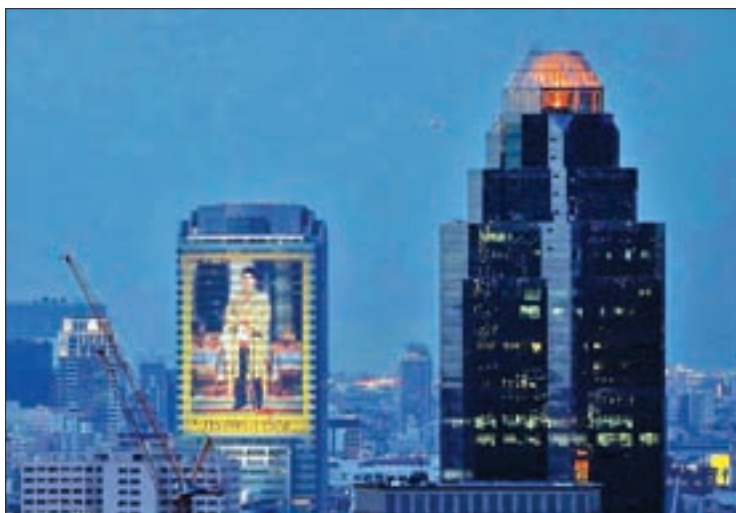
A portrait of Thai King Maha Vajiralongkorn is seen on a building on the eve of his 65th birthday in Bangkok, Thailand, on 27 July 2017.

The Thai government is officially in a year-long period of mourning following the death last October of King Bhumibol Adulyadej, Vajiralongkorn's father, which means government offi-