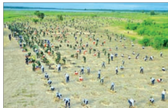
Family members of the Tatmadaw plant trees.

Next, Senior General Min Aung Hlaing and wife planted teaks as Deputy Commander-in-Chief of Defence Services Commander-in-Chief (Army) Vice-Senior General Soe Win, union ministers and wives, high ranking Tatmadaw officers and wives of Commander-in-Chief