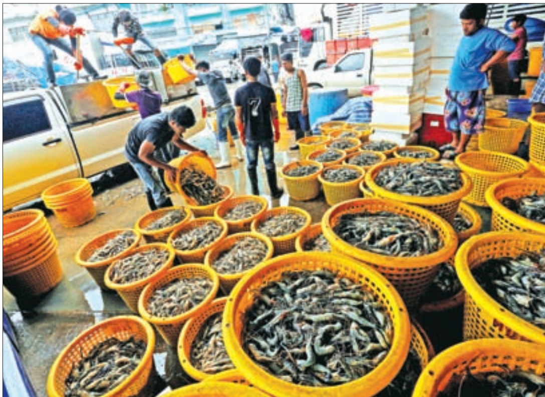
Myanmar migrant workers sort shrimp at a wholesale market for shrimp and other seafood in Mahachai, in Samut Sakhon province, Thailand, July 4, 2017.

Due to limitation of space we are only able to publish "Letter to the Editor" that do not exceed 500 words. Should you submit a text longer than 500 words please be aware that your letter will be edited.