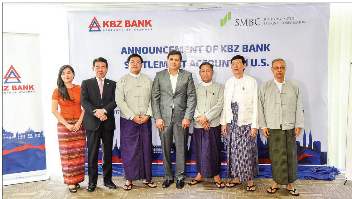
Dignitaries pose for a photo at the ceremony to announce USD settlement account between KBZ Bank and SMBC New York.

The press conference was also attended by diplomats from the US Embassy in Yangon, responsible personnel of the SMBC, U Than Cho, Vice-Chairman-2 of KBZ Bank, U Maung Maung, Vice-Chairman-3, responsible personnel of the KBZ Bank Ltd and members of the media.—Thura Lwin (Eco)