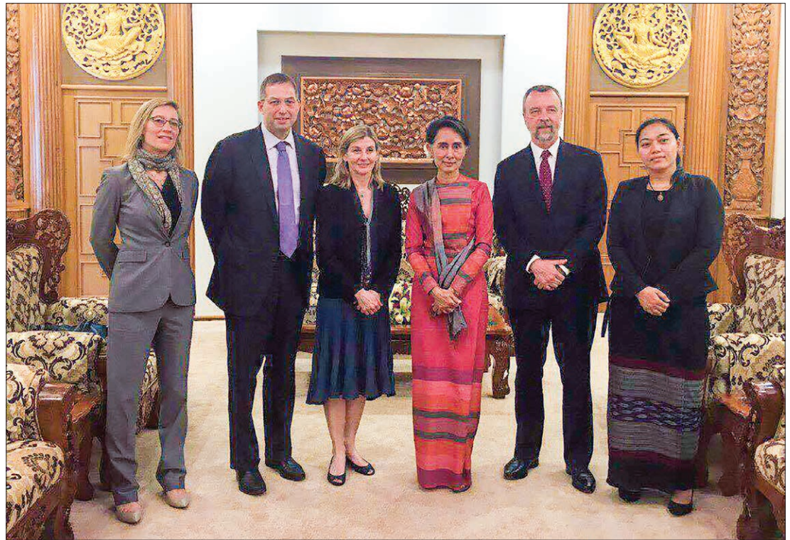
State Counsellor Daw Aung San Suu Kyi, the President of USIP Ms. Nancy Lindborg pose for a documentary photo at the Ministry of Foreign Affairs in Nay Pyi Taw yesterday.

STATE Counsellor and Union Minister for Foreign Affairs Daw Aung San Suu Kyi received the President of the United States Institute of Peace (USIP) Ms. Nancy Lindborg and party at 10:00 am at