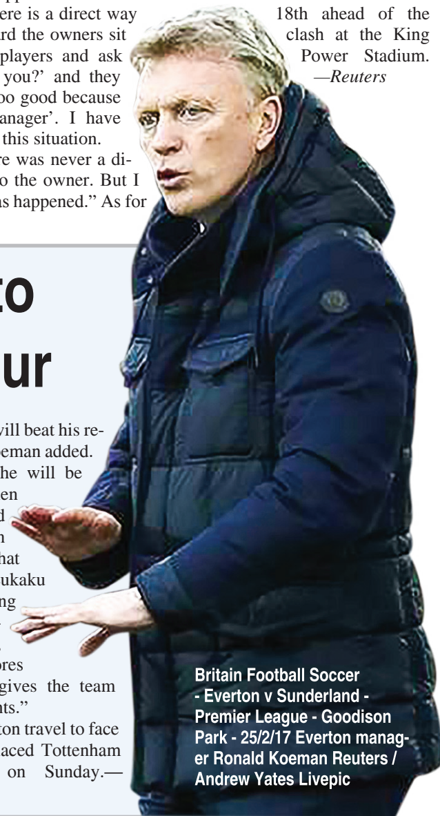
Britain Football Soccer - Everton v Sunderland - Premier League - Goodison Park - 25/2/17 Everton manager Ronald Koeman

Everton travel to face second-placed Tottenham Hotspur on Sunday.—Reuters