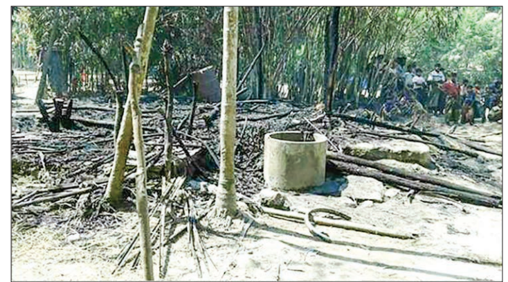
The negligence fire totally destroys the house in Ducheerdan (south) village in Maungtaw.