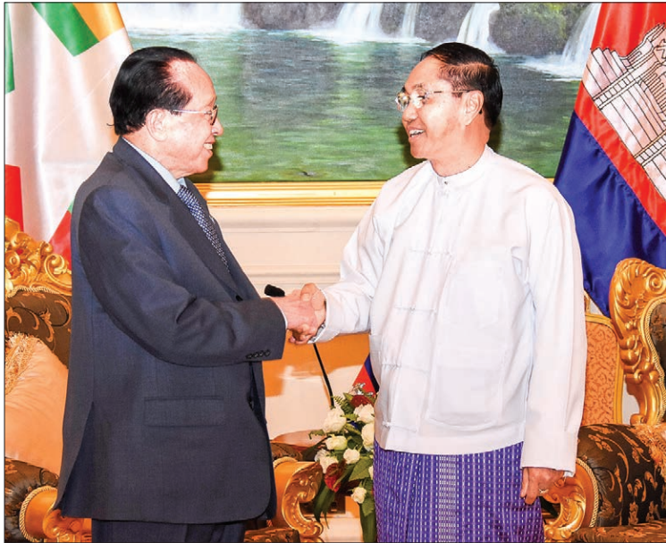
Vice President U Myint Swe welcomes Cambodian Deputy Prime Minister Mr. Hor Namhong in Nay Pyi Taw yesterday.