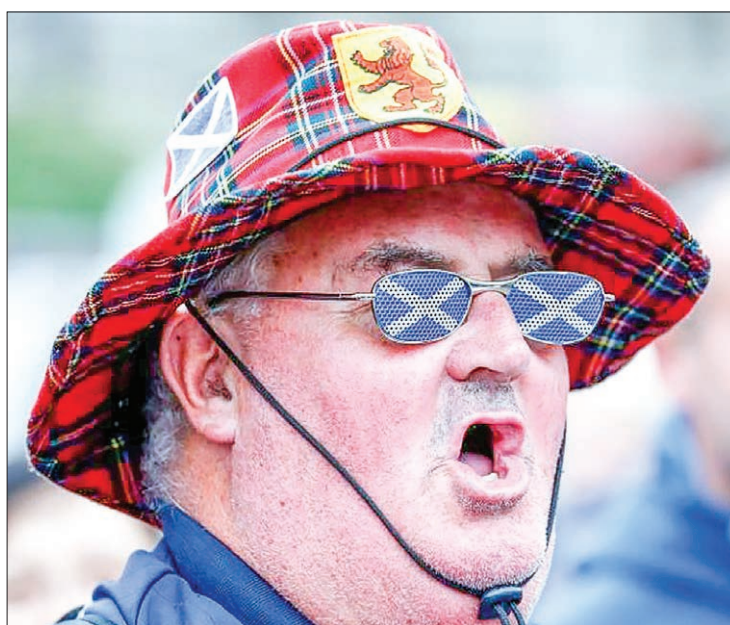
A supporter of the “Yes” campaign reacts in George Square after the referendum on Scottish independence in Glasgow, Scotland on 19 September, 2014.

Scottish voters overwhelmingly backed staying inside the bloc in the referendum, but Britain as a whole voted to leave.