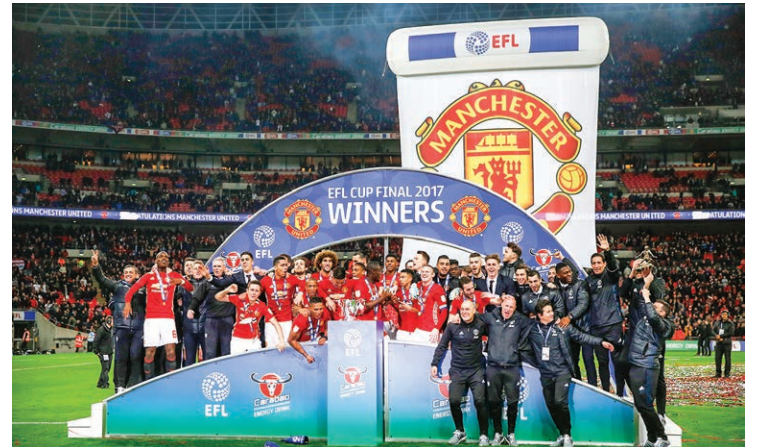
Manchester United players celebrate with the trophy at the end of the EFL Cup Final match at the Wembley Stadium on 26 February, 2017.

United had taken a rather fortunate 2-0 lead with Ibrahimovic's 19 th -minute strike and Jesse Lingard's clinical finish but Southampton striker Manolo Gabbiadini's brace either side of halftime breathed life into the showpiece match.