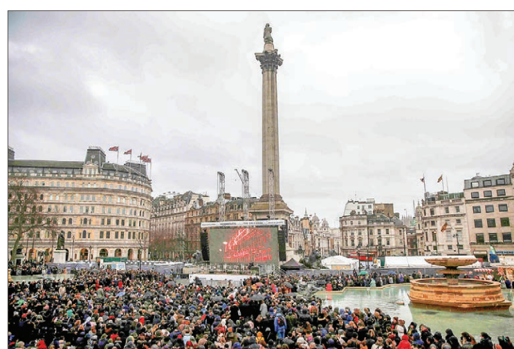
Director Asghar Farhadi's film The Salesman is shown on a screen in Trafalgar Square in London, Britain on 26 February, 2017. PHOTO: REUTERS

The directors of the four films he is up against — from Sweden, Germany, Denmark and Australia — joined Farhadi in issuing a joint statement ahead of the Oscars criticising a "climate of fanaticism and nationalism" in the United States and elsewhere.—Reuters