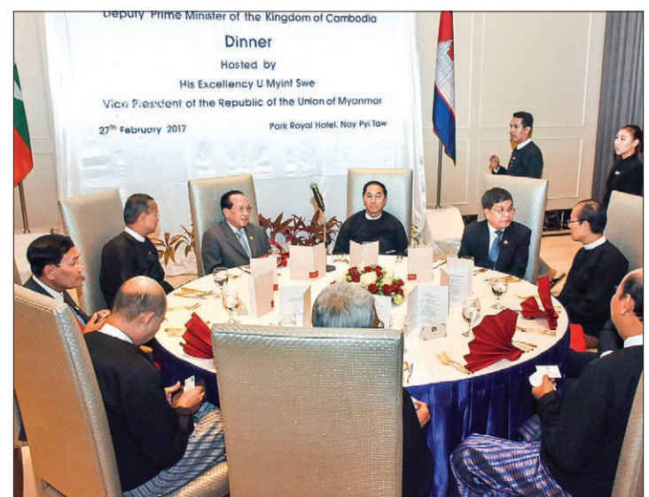
Vice President U Myint Swe hosts dinner for Deputy Prime Minister of Cambodia Mr. Hor Namhong at Park Royal Hotel, Nay Pyi Taw.

The Vice President added, “Myanmar will continue to cooperate closely with other ASE-