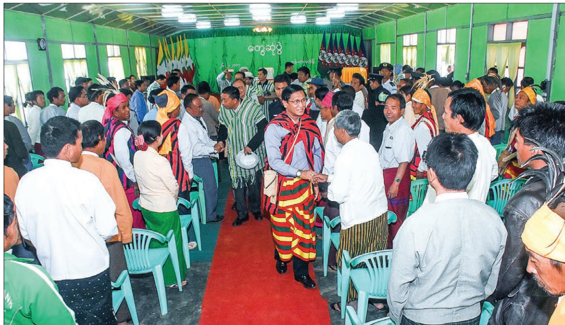
Vice President Henry Van Thio meets with locals at Zalattwa Hall.

munications, telecommunications, health, border-area development, power supply, upgrading schools and gymnasium, tourism industry development and conducting training courses for tourism that are basically of great importance, in the State were explained respectively by officials according to sectors about the programmes to be provided.