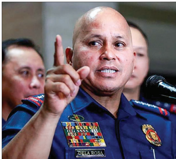
Philippine National Police (PNP) Director General Ronald Dela Rosa gestures during a news conference at the PNP headquarters in Quezon city, Metro Manila, Philippines on 30 January 2017.

Philippine National Police to decide," he said. "What they have to do (is) to succeed."