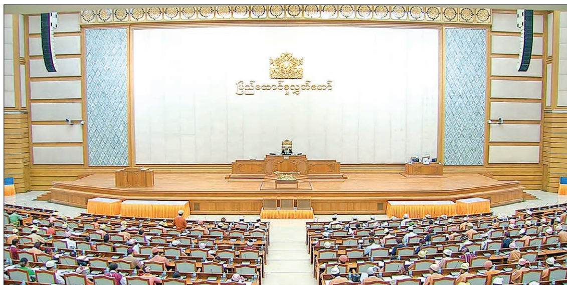
Pyidaungsu Hluttaw is being convened in Nay Pyi Taw.