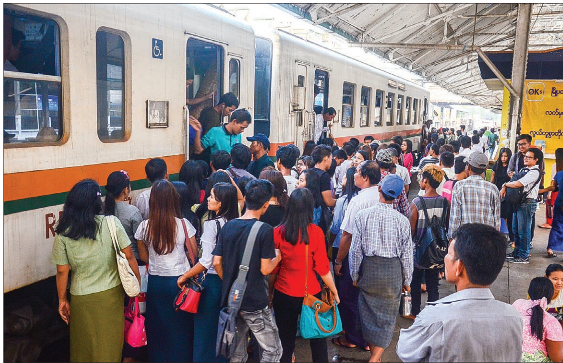
The circular train is crowded with passengers at Yangon Central Railways Station.

AS PART OF its plans to offer extensive passenger and freight transportation services to commuters, the state-run Myanma Railways will decrease the freight rate on some goods starting 1 March, according to the railway.