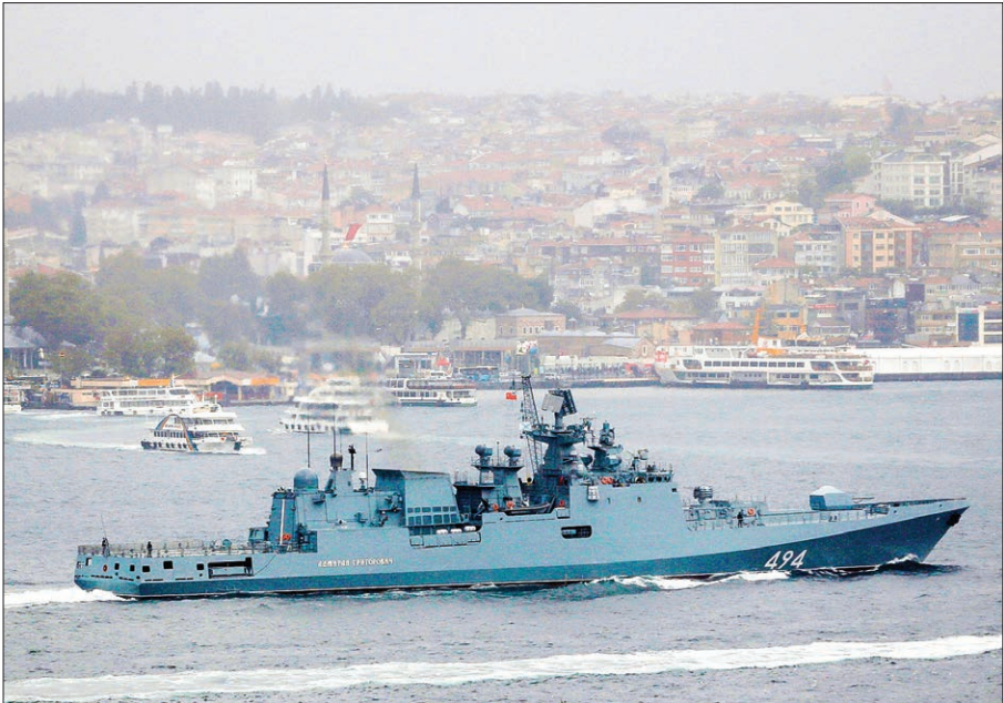
The Russian Navy’s frigate Admiral Grigorovich sails in the Bosphorus on its way to the Mediterranean Sea, in Istanbul, Turkey on 4 November, 2016.