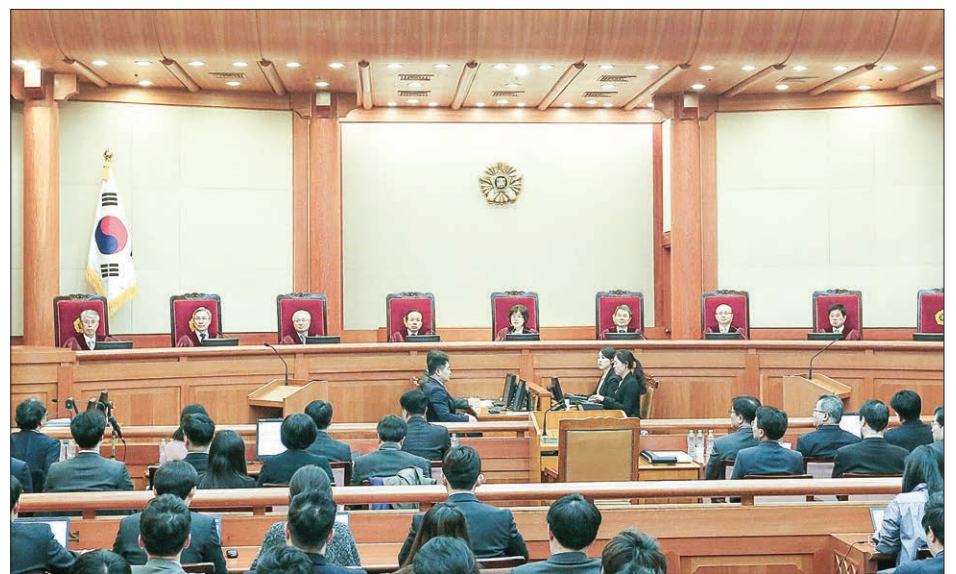
Judges of the Constitutional Court sit during the final hearing on whether to confirm the impeachment of President Park Geun-hye at the Constitutional Court in Seoul, South Korea on 27 February, 2017.

Should the Constitutional Court uphold parliament's impeachment of Park, South Korea would hold an election within 60 days. —Reuters