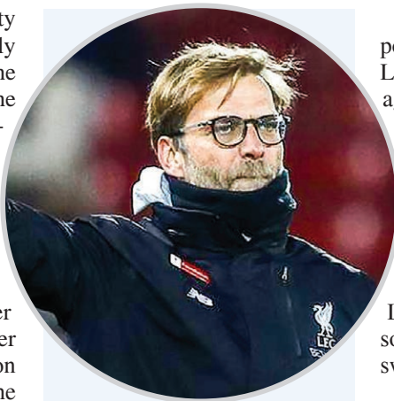
Liverpool manager Juergen Klopp.

"Players are not more powerful. We were much more powerful in the past," Klopp told British media ahead of Monday's clash at Leicester, who are languishing in the relegation zone after picking up just five league