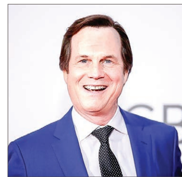
Actor Bill Paxton.