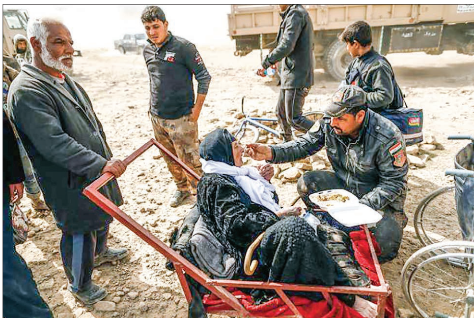
A special forces member feed a displaced Iraqi woman who just fled her home, as she waits to be transported while Iraqi forces battle with Islamic State militants in western Mosul, Iraq on 27 February, 2017.

If they defeat Islamic State in Mosul, that would