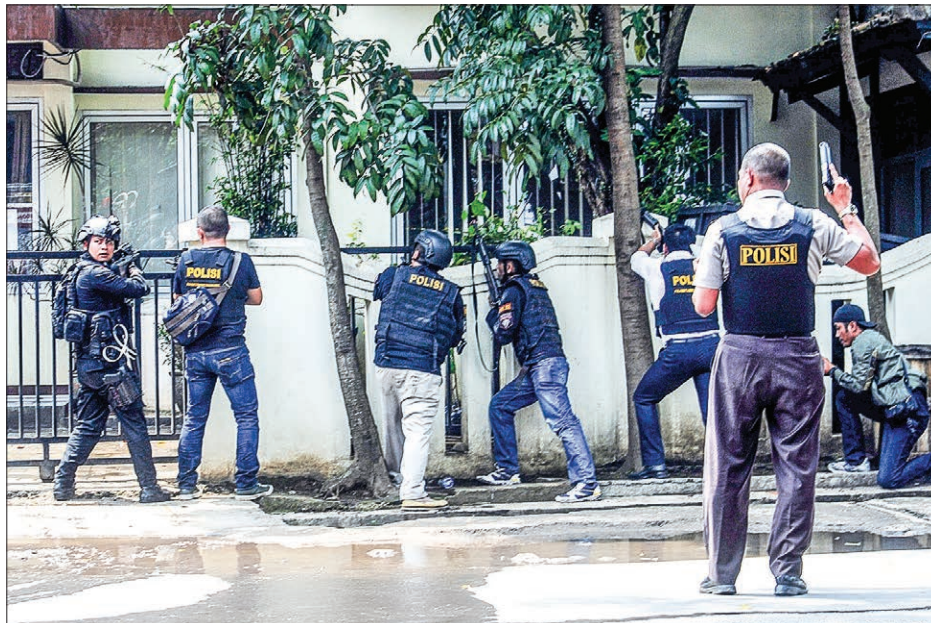
Police are seen near a local government office following an explosion in Bandung, West Java, Indonesia n 27 February, 2017.

The attacker had demanded that Indonesia’s anti-terror police unit, Densus 88, release all its detainees, according to provincial police chief Anton Charliyan.