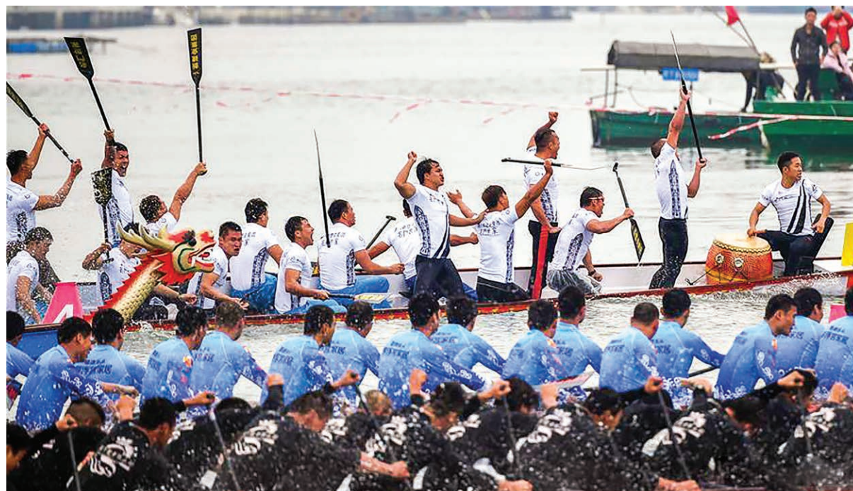
The team of Jiujiang celebrate after winning Men's 200m final during the dragon boat race in Wanning of south China's Hainan Province, on 27 February, 2017. A total of 36 teams took part in the event to mark the Chinese traditional Dragon Boat Festival.