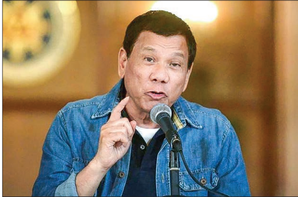
Philippine President Rodrigo Duterte.

MANILA — Four Philippine legislators who supported a staunch critic of leader Rodrigo Duterte's war on drugs lost important positions in the Senate on Monday, drawing political lines in the upper house in a tightening of the president's grip on power.