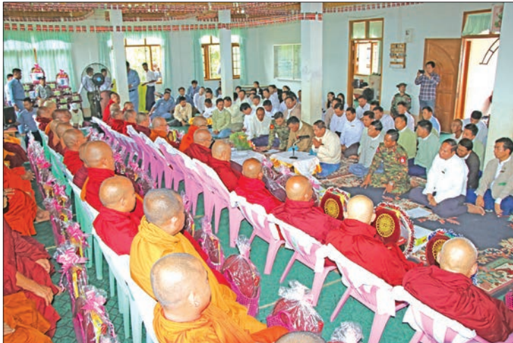
Waso robes offering ceremony held in Hopang, Shan State (North).