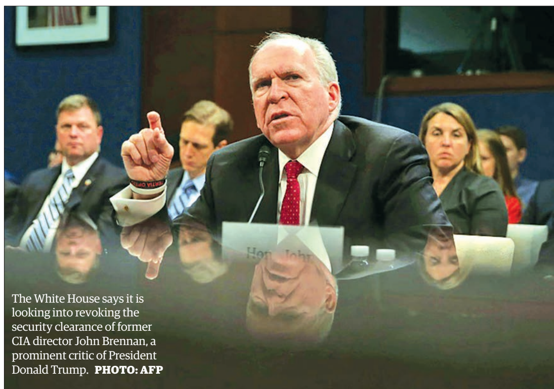
The White House says it is looking into revoking the security clearance of former CIA director John Brennan, a prominent critic of President Donald Trump.

Brennan, Comey, Clapper and Hayden, in particular, have