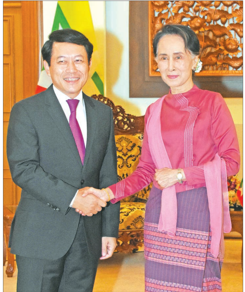
State Counsellor Daw Aung San Suu Kyi shakes hands with LPDR's Foreign Minister Mr. Saleumxay Kommasith in Nay Pyi Taw yesterday.

Also present at the meetings were Union Minister for International Cooperation U Kyaw Tin, Deputy Minister for the Office of the President U Min Thu and other officials.—MNA ■