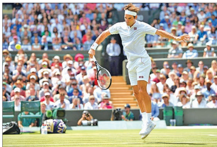
Roger Federer lost last year's Rogers Cup final to Alexander Zverev in Montreal.