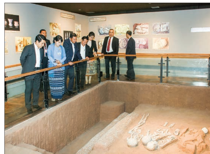
Laos Foreign Minister Mr Saleumxay Kommasith and his delegation visit the National Museum in Nay Pyi Taw yesterday.

Next, the Laos Minister and his delegation arrived at Up-patasanti Pagoda and presented