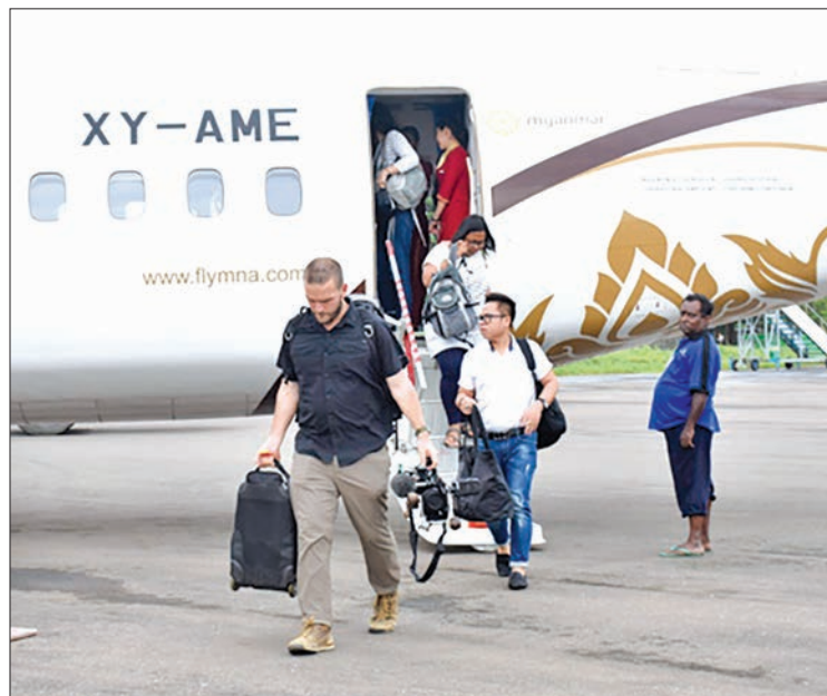
Journalists arrive at Sittway Airport yesterday.