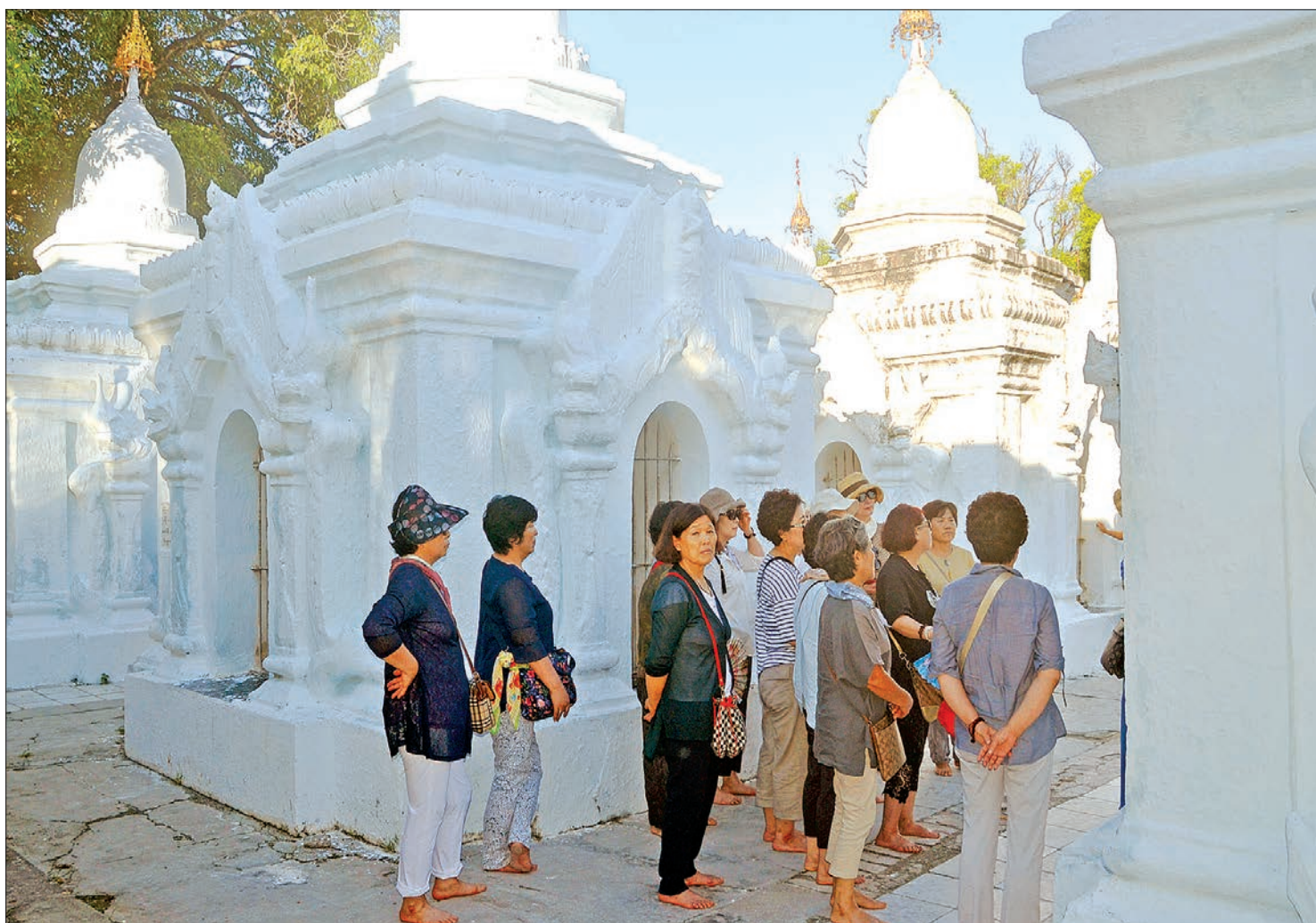
Chinese tourists seen at a pagoda in Mandalay.

Due to limitation of space we are only able to publish "Letter to the Editor" that do not exceed 500 words. Should you submit a text longer than 500 words please be aware that your letter will be edited.