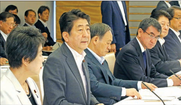
Prime Minister Shinzo Abe (2nd from L) speaks during a ministerial meeting in Tokyo on 24 July, 2018, about a plan to accept more foreign workers from April.

TOKYO — Japan wants to start accepting more foreign workers from April next year, Prime Minister Shinzo Abe said on Tuesday, as the country faces a serious labour crunch across many of its industries. In a meeting with Cabinet members, Abe instructed them to speed up the necessary preparations for the plan to be implement-