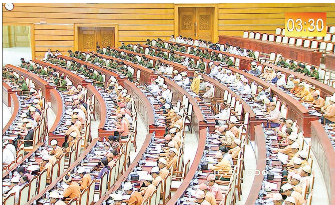
Pyithu Hluttaw representatives at the 2 nd day meeting of second Pyithu Hluttaw's ninth regular session in Nay Pyi Taw yesterday.

Daw Khin Sandi of Launglon constituency suggested that obtaining permission directly from