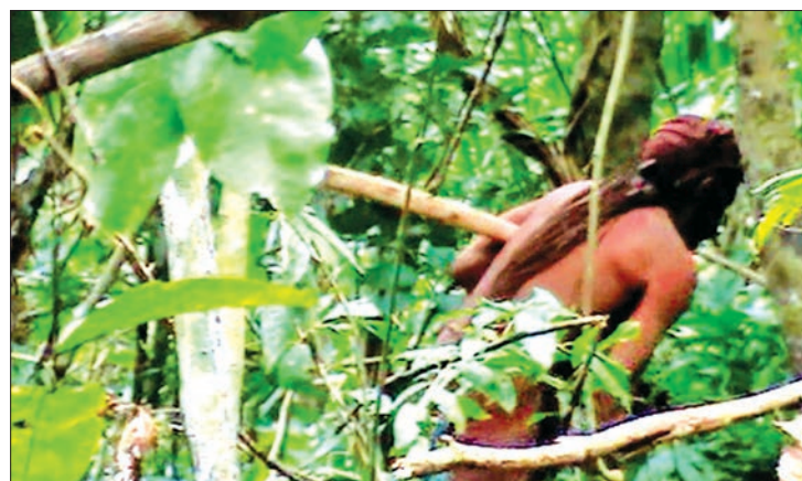
Tribal rights group Survival International has asked authorities in Brazil to do more to protect isolated Amazon communities after images surfaced of a man believed to be one group’s lone survivor.

According to the most recent government data, there are some 800,000 indigenous people belonging to more than 300 distinct groups living in Brazil, a country of 209 million.—AFP ■