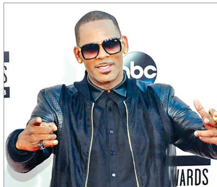
Singer Robert Sylvester Kelly, seen here in a 2013 file picture, has released a 19-minute song venting frustration over a boycott campaign over his treatment of women.

“I’m not convicted / Not arrested / Dragged my name in the dirt,” he sings.—AFP ■