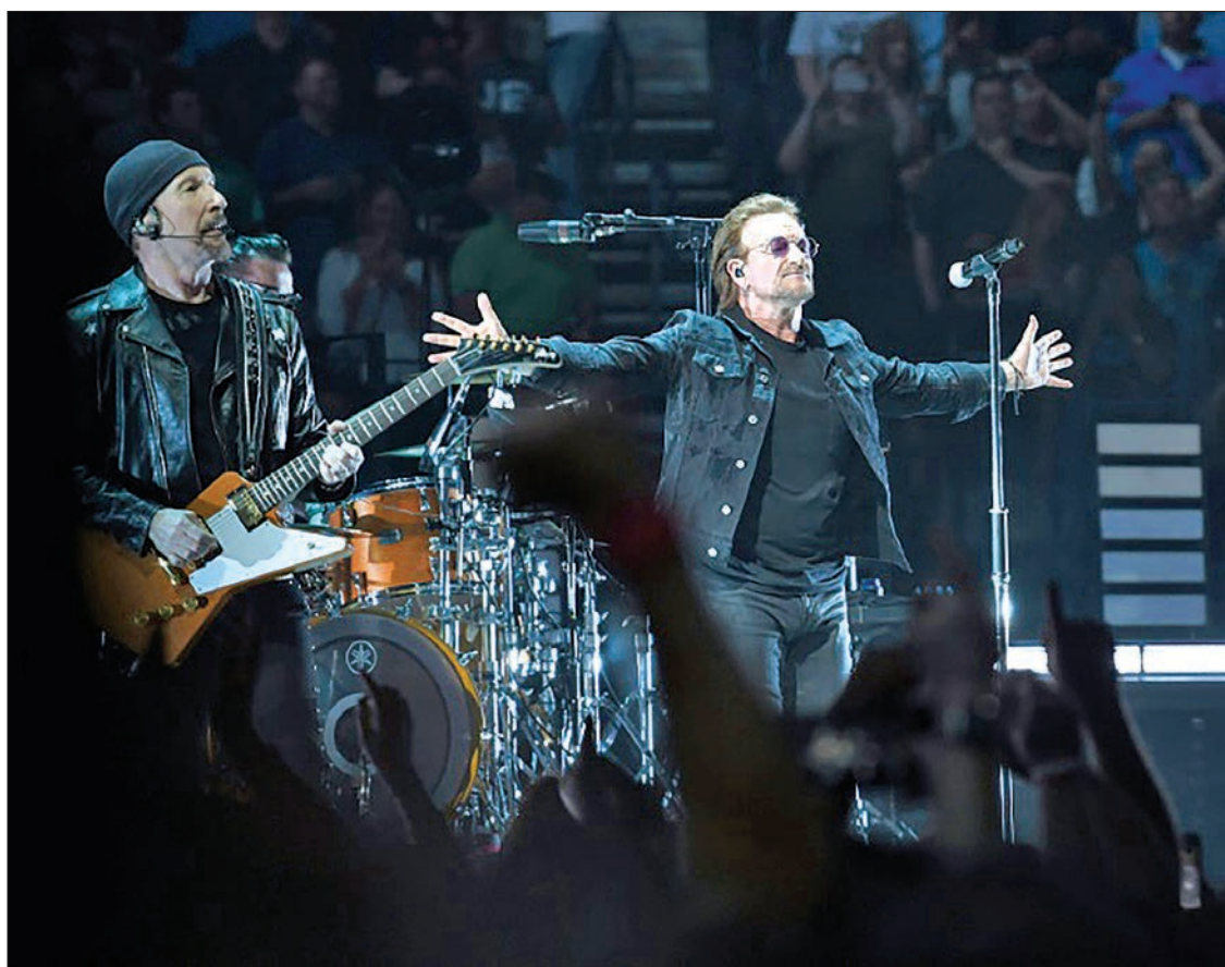
Rock band U2 — guitarist The Edge and frontman Bono are shown here performing at a concert in Nashville in May 2018 — were the top-paid musicians in the US in 2017, Billboard says.