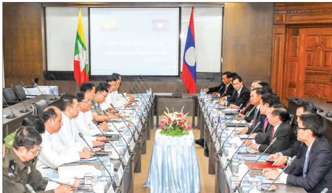
Union Minister U Kyaw Tin and LPDR's Foreign Minister Mr. Saleumxay Kommasith hold bilateral talks in Nay Pyi Taw yesterday.

UNION Minister for International Cooperation U Kyaw Tin and Minister of Foreign Affairs of the Lao People's Democratic Republic H.E. Mr. Saleumxay Kommasith held bilateral talk at the Chindwin Hall of the Ministry of Foreign Affairs, Nay Pyi Taw.