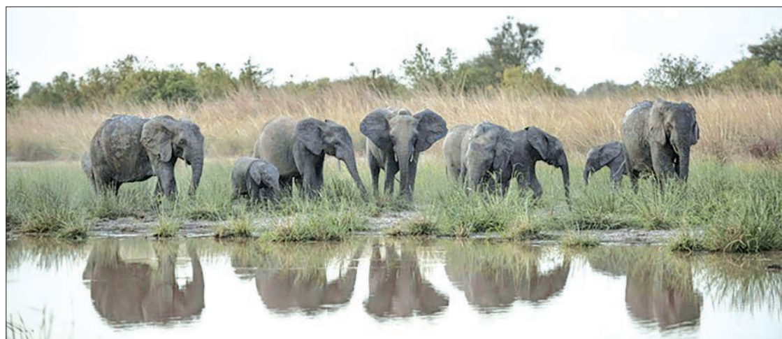
A herd of elephants feed around the waterhole in late afternoon at Pendjari National Park in Benin on 10 January, 2018.

"We hope to expand this work to develop additional tools for sustainable passive management of elephant movements, to augment the current approaches used."—AFP ■