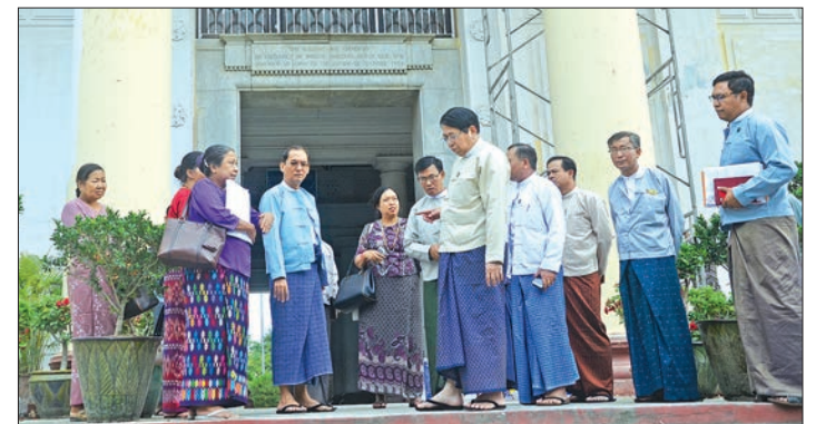
Union Minister Dr Pe Myint inspects Mandalay University compound to hold all-round youth development festival.

Afterwards the Union Minister and officials inspected the Mandalay University compound, where the all-round youth development festival (Yangon) was held at Yangon University from 1 to 3 December 2017. The all-round youth development festival (Mandalay) will be held at Mandalay University from 11 to 13 August 2018.—Mandalay Sub-Printing House ■