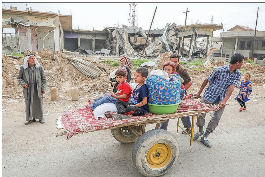
A displaced Iraqi family is transported on a cart as the battle between the Iraqi Counter Terrorism Service and Islamic State militants continues nearby, in western Mosul, Iraq on 23 April, 2017.