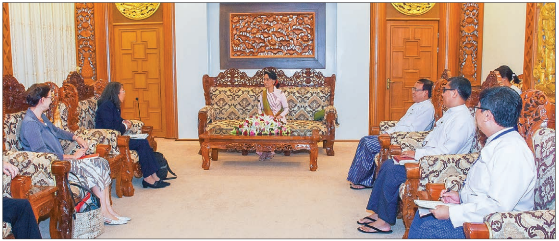
State Counsellor Daw Aung San Suu Kyi holds talks with delegates from United Nations Office for the Coordination of Humanitarian Affairs at the Ministry of Foreign Affairs in Nay Pyi Taw.

During the meeting, they exchanged views on pertaining to ODSG's 2017 humanitarian assistant program to Myanmar, current situation of the humanitarian assistant works and cooperation between Myanmar and OCHA. — Myanmar News Agency