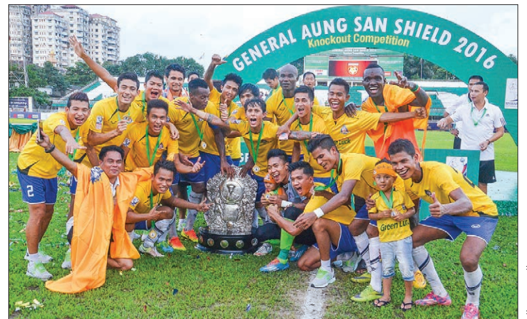
File photo shows Magway Football Club celebrate with their shield after winning of 2016 General Aung San Shield.

In the second round, twelve clubs competing in 2016 MNL and the six winners from the first round, sixteen teams in total, will be playing at a neutral ground with eight teams to emerge as winners. The games of Round