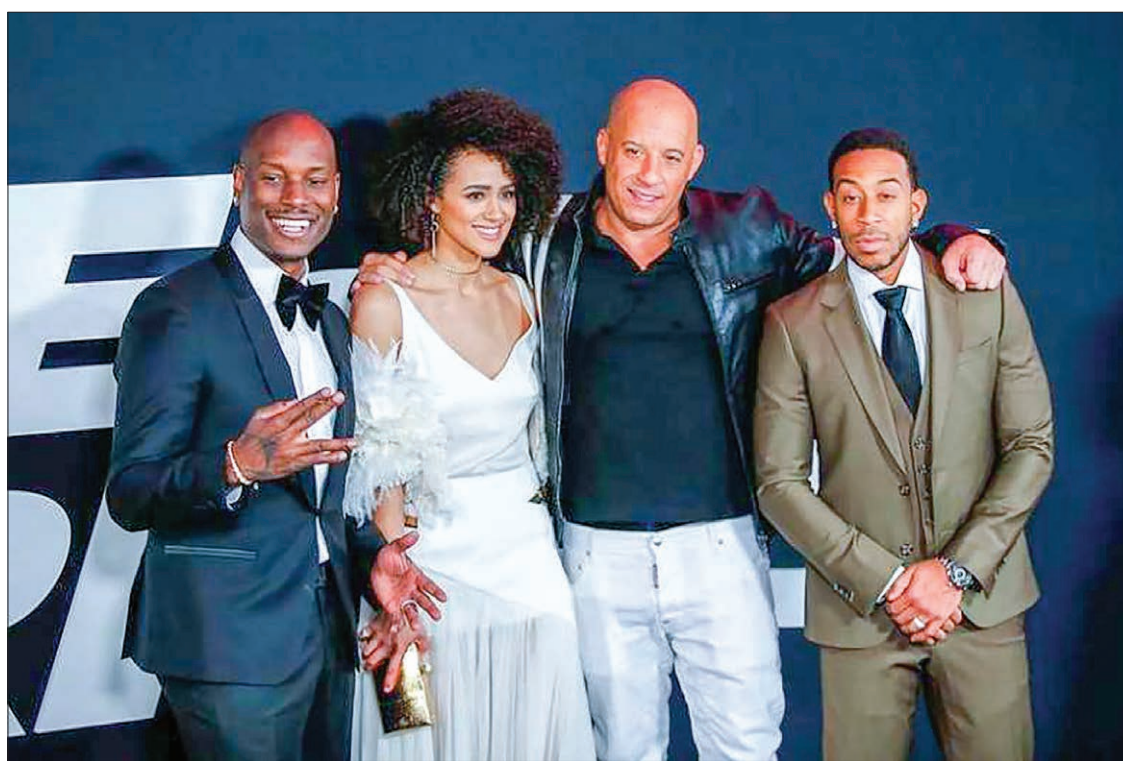
Actors Tyrese Gibson, Nathalie Emmanuel, Vin Diesel and Ludacris attend 'The Fate Of The Furious' New York premiere at Radio City Music Hall in New York, US April 8, 2017.