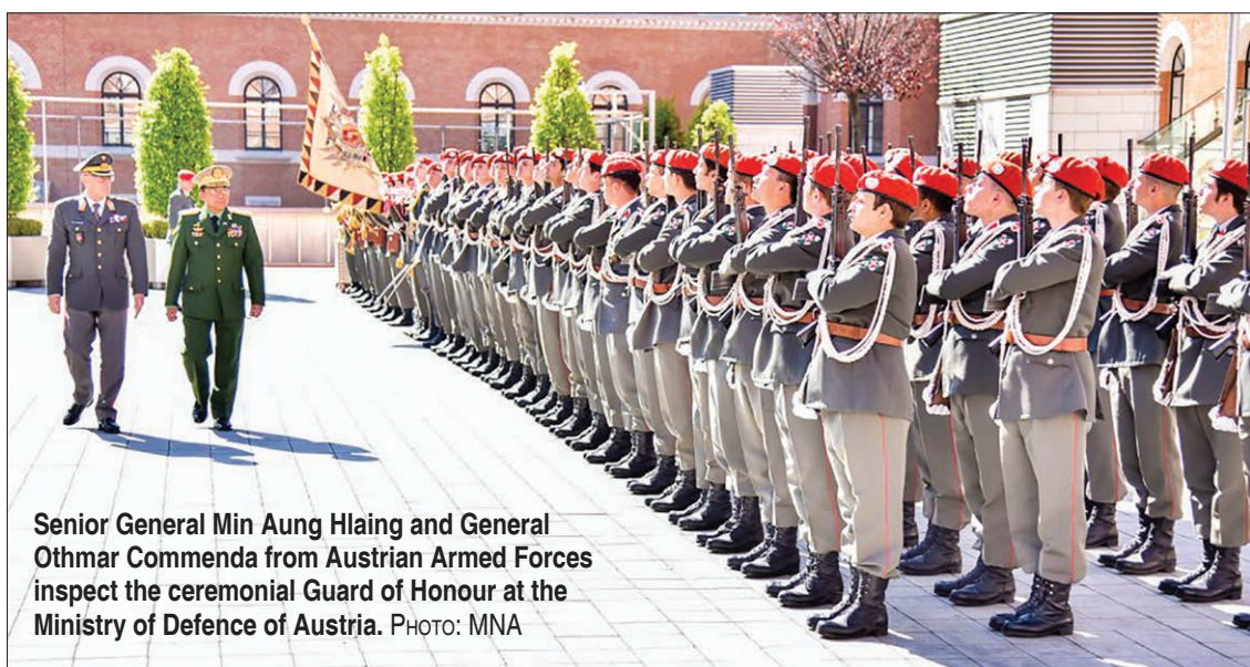
Senior General Min Aung Hlaing and General Othmar Commenda from Austrian Armed Forces inspect the ceremonial Guard of Honour at the Ministry of Defence of Austria.

Then, the Commander-in-Chief and party visited Donau Tower at 4:10 pm local standard time and viewed the Vienna's scenic beauties. Then, the Commander-in-Chief and party were hosted dinner by General Othmar Commenda and wife at Marriott Hotel in Vienna.— Myanmar News Agency