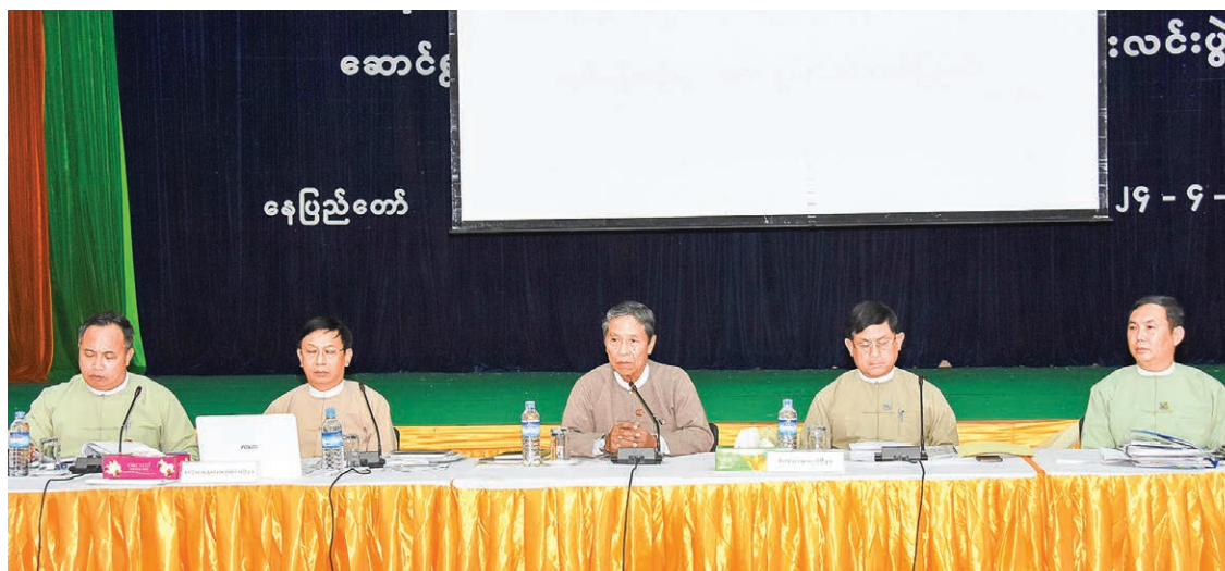
Union Minister U Kyaw Win (centre) at press conference on performance during the one-year term of the current government at the Ministry of Information in Nay Pyi Taw.

“Union Minister U Kyaw Win said plan is drawn up to enable employee ownership of their home by the time of retirement.”