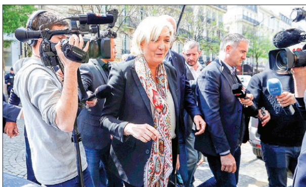
Marine Le Pen, French National Front (FN) political party leader and candidate for French 2017 presidential election, comes back from her hairdresser in front of her campaign headquarters in Paris, France, on 24 April, 2017 the day after the first round of presidential elections where Le Pen ended in second place behind En Marche ! movement candidate.

Seeking to exploit Macron's lack of experience in the area, she told reporters in her northern stronghold of Henin-Beaumont: "I'm on the ground to meet the French people to draw their attention to important subjects, including Islamist terrorism, on which Mr Macron is, to say the least, weak."