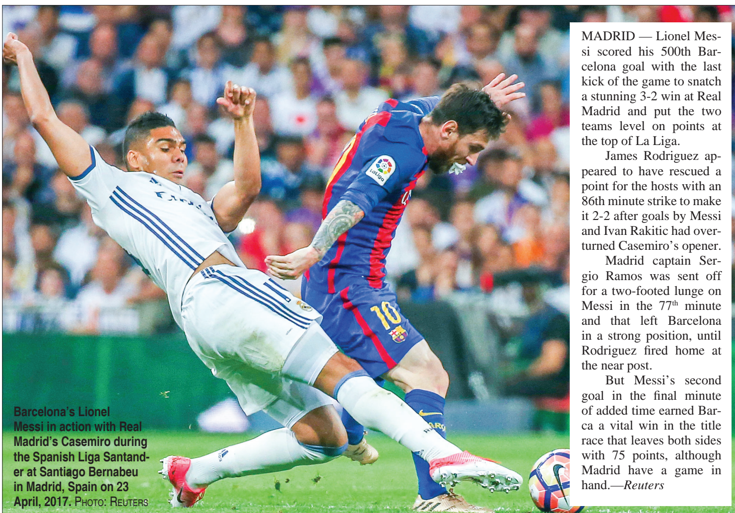
Barcelona's Lionel Messi in action with Real Madrid's Casemiro during the Spanish Liga Santander at Santiago Bernabeu in Madrid, Spain on 23 April, 2017.

MADRID — Lionel Messi scored his 500 th Barcelona goal with the last kick of the game to snatch a stunning 3-2 win at Real Madrid and put the two teams level on points at the top of La Liga.