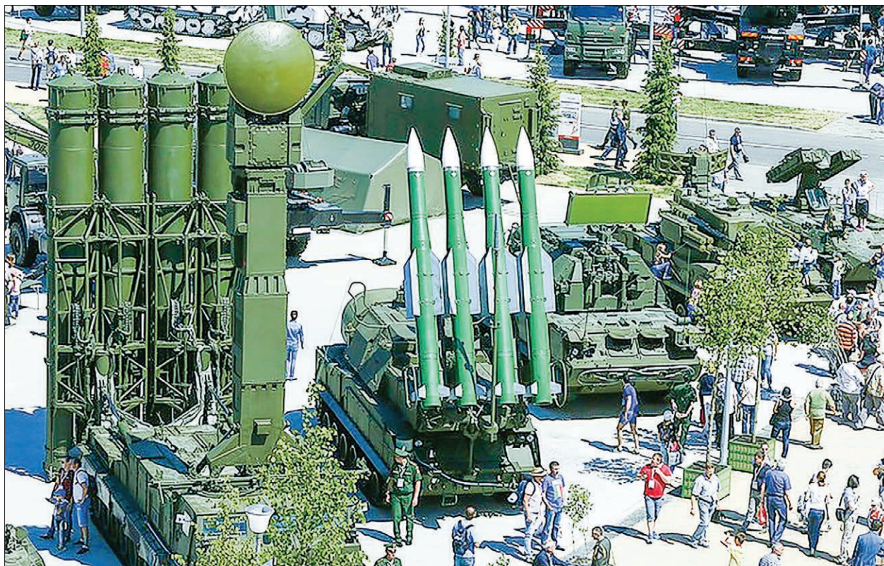
The US topped the chart with 2016 military spending estimated at $611 billion, nearly three times the level of China with $215 billion.

"It was originally expected and planned that the Russian Government would reduce its spending, including military spending," the report reads. "However, late in 2016 actual spending was pushed substantially higher by a decision to make a one-off payment of roughly $11.8