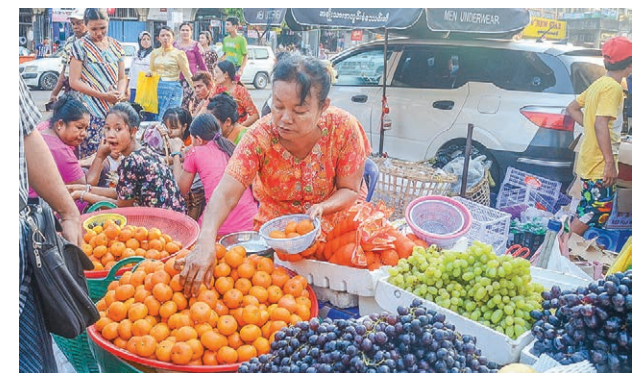
A vendor arranges oranges at a fruit stall in Yangon.

The Yangon Region government suspended the granting of Yangon licences for cars, resulting in the prices for cars already bearing a Yangon licence to rise starting from early 2017.—200