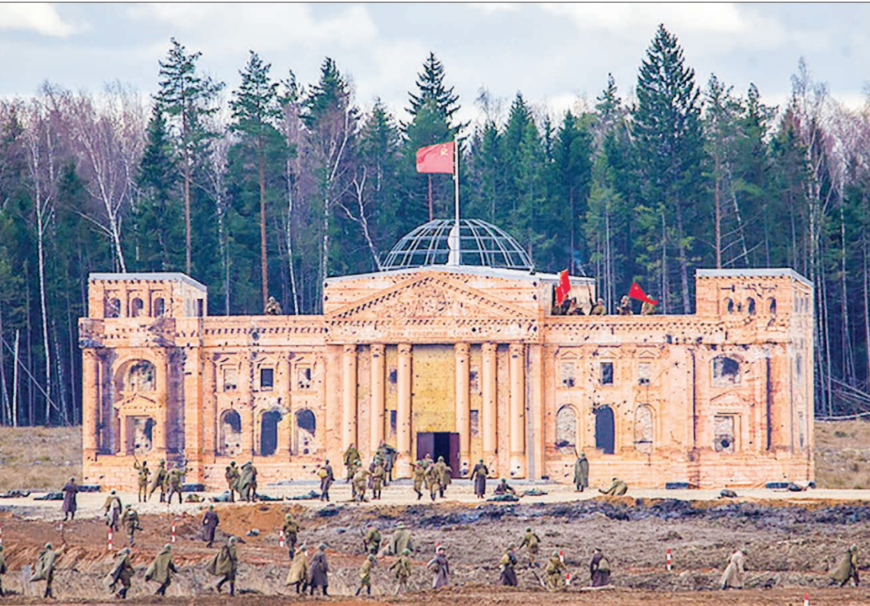
Participants storm a Reichstag building.

MOSCOW — More than a hundred stunt men, trophy German armored vehicles and restored Soviet tanks of World War II times took part in historical reconstruction of the Berlin offensive operation of Red army in Moscow’s “Patriot” park. According to the Russian Defense Ministry, during the re-enactment the participants used two T34-85 tanks, two IS-2 tanks, two self-propelled artillery units, four BM-13 “Katyusha” launchers — from the Soviet side, four PzKpfw IV tanks, two PzKpfw III tanks, a PzKpfw VI tank, a Sturmgeschütz self-propelled gun, armored vehicles on the side of the Wehrmacht and two Messerschmitt Bf-109 E. The audience saw performed tank fights, aviation duels, as well as infantry clashes.—Tass