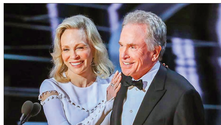
Warren Beatty and Faye Dunaway present for Best Picture at the 89th Academy Awards.

LONDON — Hollywood legend Warren Beatty says he thinks the film industry needs to accept home video streaming.