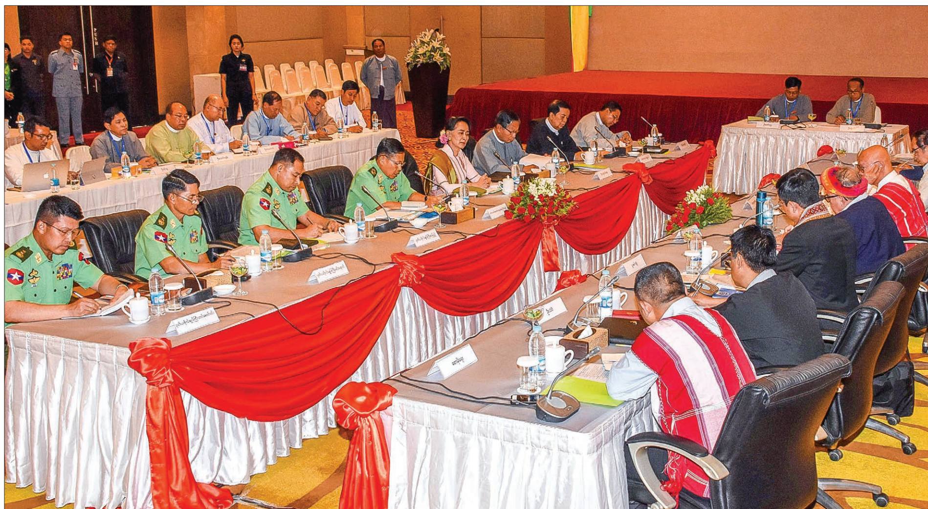
State Counsellor Daw Aung San Suu Kyi, senior military officers and ethnic leaders discuss national reconciliation and the peace process at Thingaha Hotel in Nay Pyi Taw.