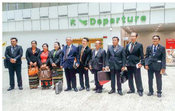
Members of the Legal Affairs and Special Cases Assessment Committee for the Pyidaungsu Hluttaw pose for a documentary photo before departure for Vietnam.