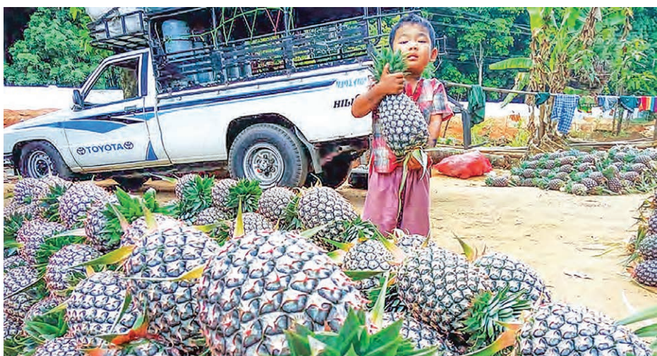
Pineapples growers Thaton have reaped healthy profit this year.