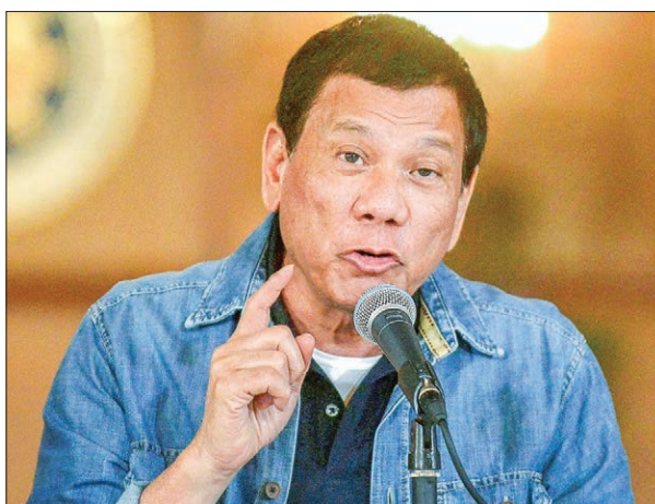
Philippine President Rodrigo Duterte announces the disbandment of police operations against illegal drugs at the Malacanang palace in Manila, Philippines early 30 January, 2017.

US marines also used for the first time in the Philippines a long-range truck-mounted multiple