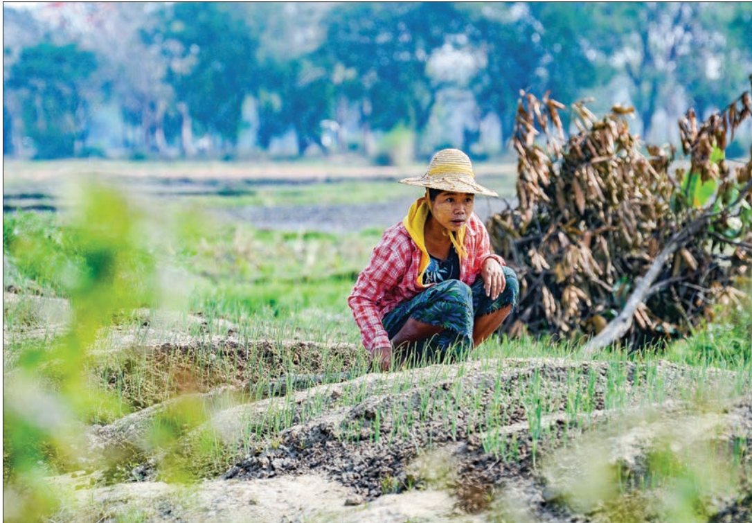
A woman works in an onion plantation.