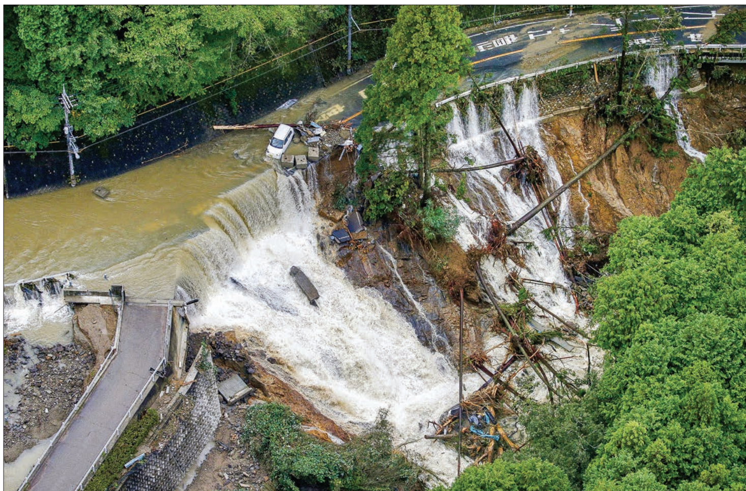
Photo taken on 23 October, 2017, from a Kyodo News helicopter shows a collapsed road in the western Japan city of Kishiwada, following torrential rain caused by Typhoon Lan.