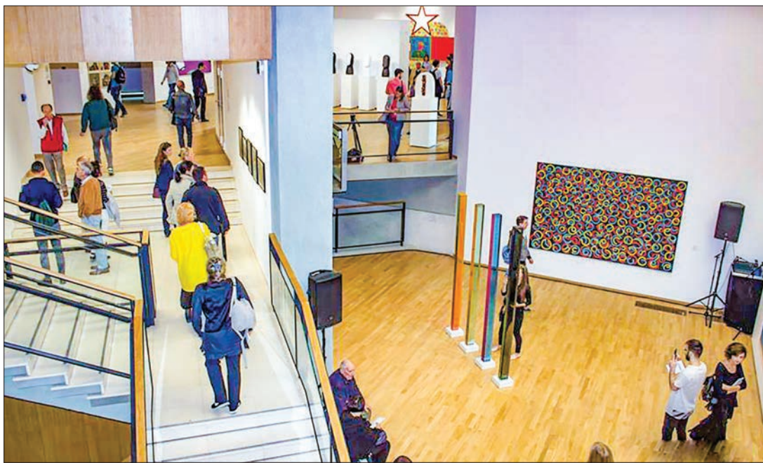
People visit the exhibition "Sequences. Art of Yugoslavia and Serbia from the Collections of the Museum of the Contemporary Art" in the Museum of Contemporary Art in Belgrade, Serbia on 20 October, 2017. The museum is reopened for the public after a ten-year renovation.

However, it was closed in 2007 as it had to be preserved and adjusted to new architectural standards and safety regulations.—Xinhua ■