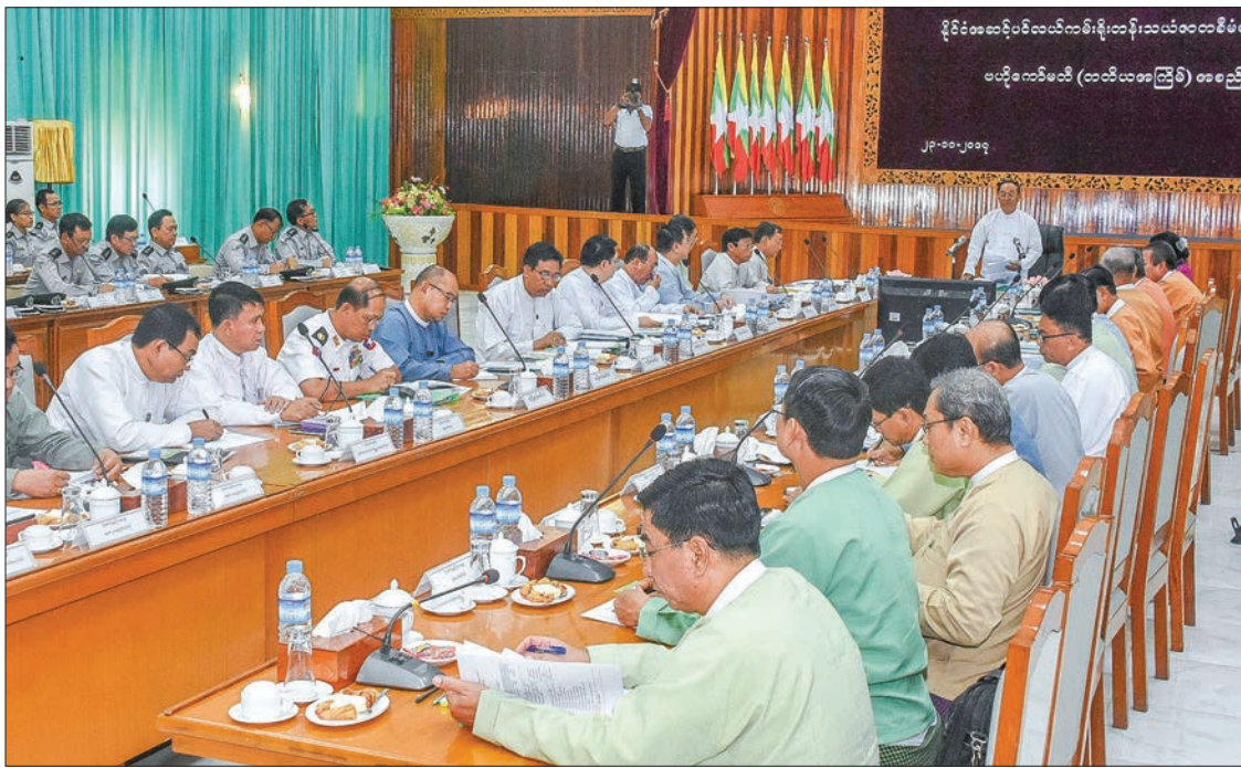
Vice President U Myint Swe addresses the third coordination meeting of the State-Level Central Committee on Management of Natural Resources in Coastal Areas held in Nay Pyi Taw.