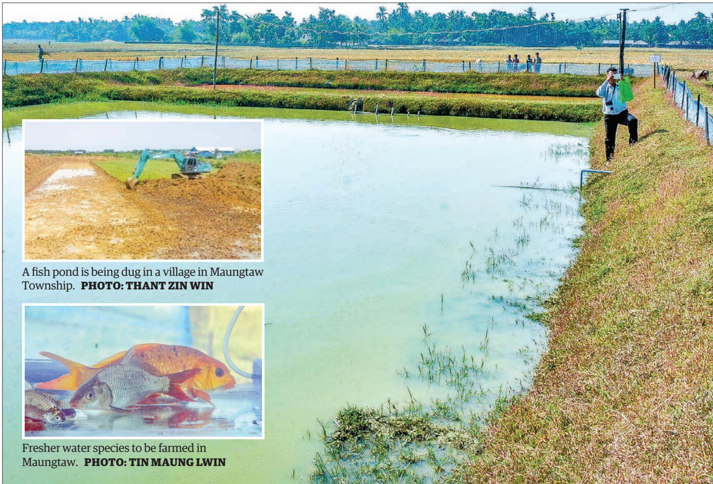
A fish pond is being dug in a village in Maungtau Township.