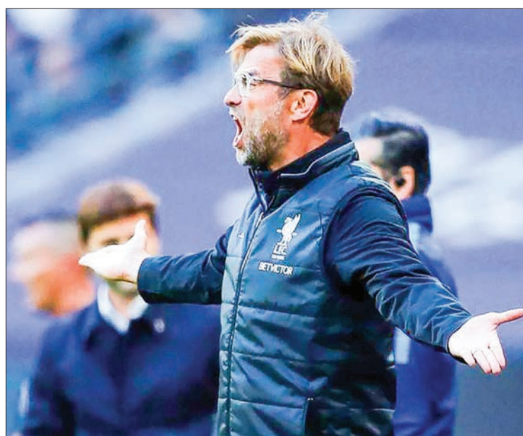
Liverpool manager Juergen Klopp.

"What he's done now is put all of the responsibility on to Lovren. He will now be in the headlines for this, and that's really unfair. It should be the man-