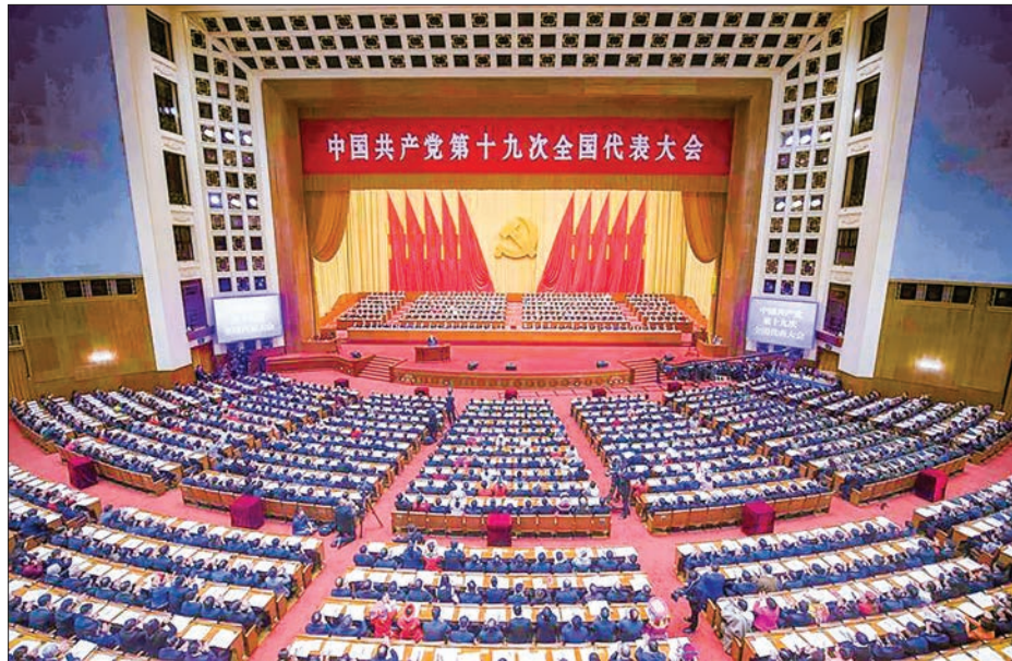
The Communist Party of China (CPC) opens the 19th National Congress at the Great Hall of the People in Beijing, capital of China on 18 October, 2017.

The CPC has lifted more than 700 million people