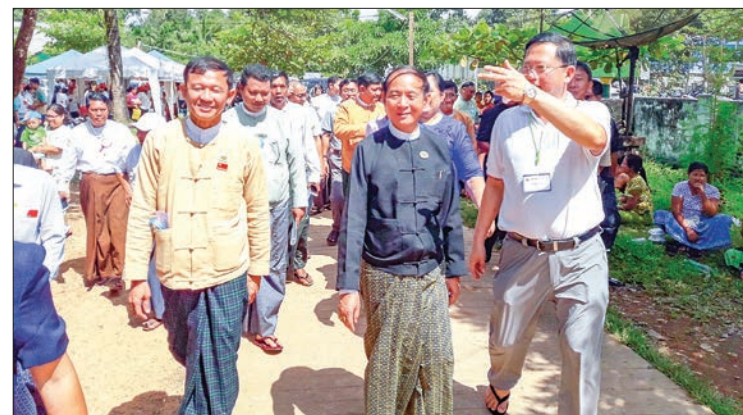
Speaker U Win Myint (Centre) visits Shwe Parami Health Foundation where local people are receiving free health care.