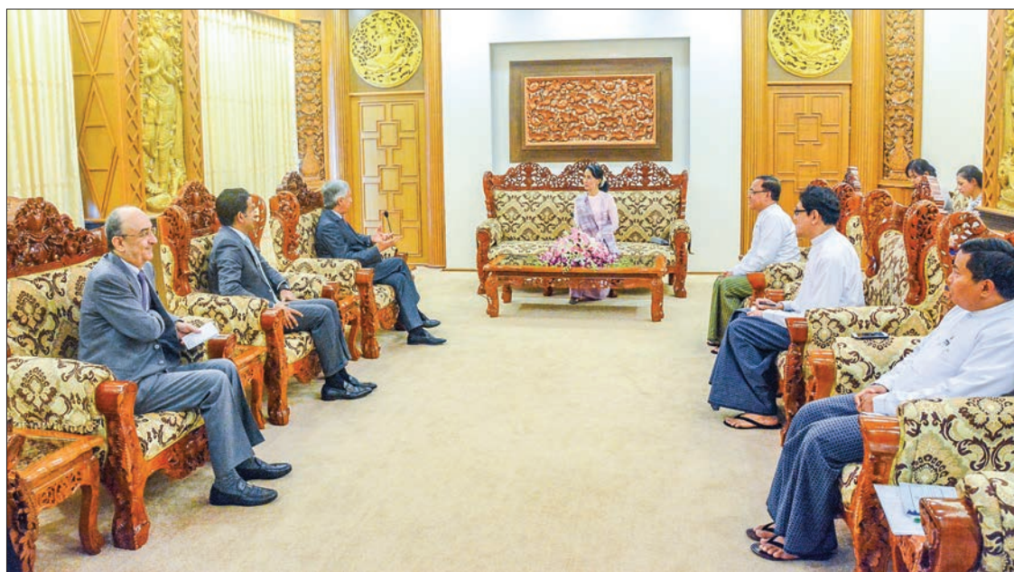
State Counsellor Daw Aung San Suu Kyi holds talks with Minister of State for Foreign Affairs of Qatar Soltan Bin Saad Al Muraikhi in Nay Pyi Taw on 23 October 2017.

Our world faces many grave challenges. Widening conflicts and inequality. Extreme weather and deadly intolerance. Security threats – including nuclear weapons. We have the tools and wealth to overcome these challenges. All we need is the will. The world's problems transcend borders. We have to transcend our differences to transform our future. When we achieve human rights and human dignity for all people – they will build a peaceful, sustainable and just world. On United Nations Day, let us, 'We the Peoples', make this vision a reality. Thank you. Shokran. Xie Xie. Merci. Spasibo. Gracias. Obrigado. Yet