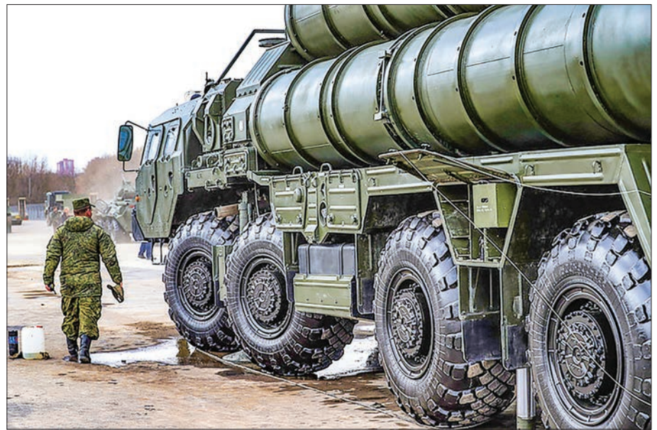
The S-400 Triumf is the most advanced long-range anti-aircraft missile system that went into service in Russia in 2007.

Place : Office no. 27, Ground Floor, Meeting Room, Ministry of Electricity and Energy