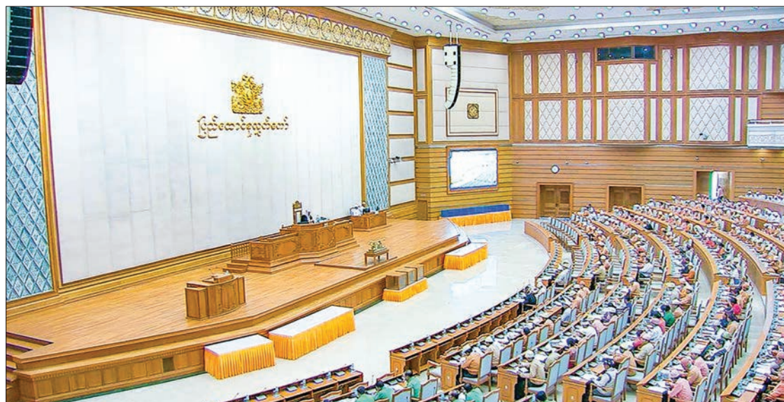
Pyidaungsu Hluttaw is being convened in Nay Pyi Taw.