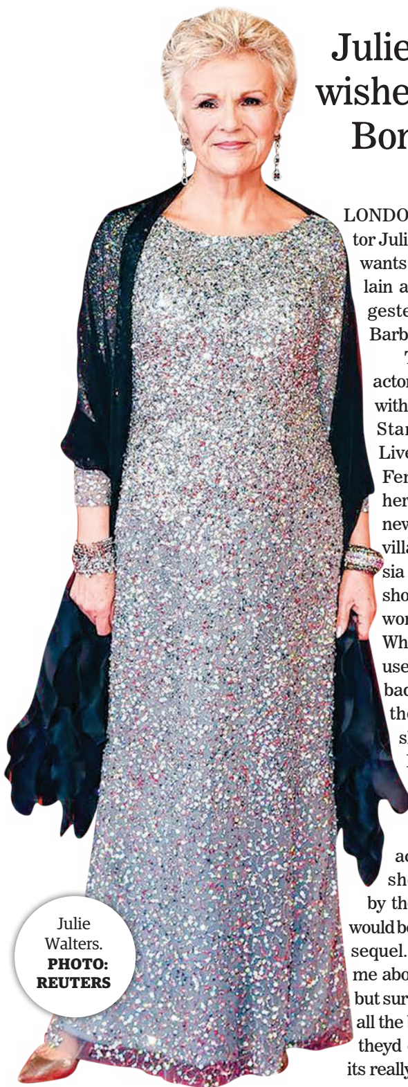
Julie Walters.

"Dialogue is always enriching as long as it is coherent," said Castillo. The two kept quiet about their collaboration until the day it opened to the public, at the start of the theater festival that runs from 20-29 October.—Reuters ■