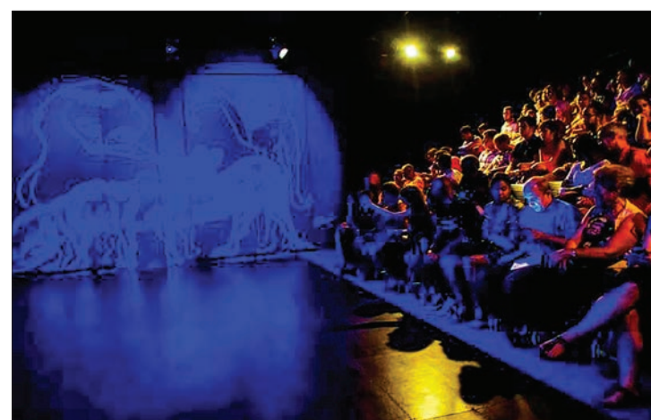
Public wait for the beginning of the spectacle "¡Guan melón!, ¡tu melón!" beside a paint of Cuban street artist Yulier Rodriguez in a theatre in Havana, Cuba on 20 October, 2017.