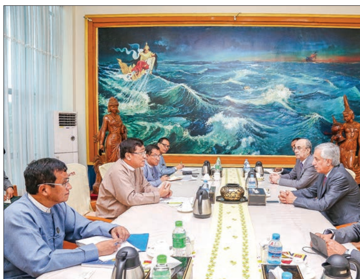
Union Minister Dr Win Myat Aye receives Qatar Minister of States for Foreign Affairs H.E. Soltan Bin Saad Al-Muraikhi in Maykhalar hall of the ministry on 23 October 2017.

In the meeting with ADPC, matters relating to ADPC closely cooperating with Myanmar government in implementing natural disaster related works, courses on increasing quality, preparedness against natural disaster and setting up a disaster resistant society were discussed. The Union Minister thanks ADPC for its cooperation and discussed cooperative works between Union Government and