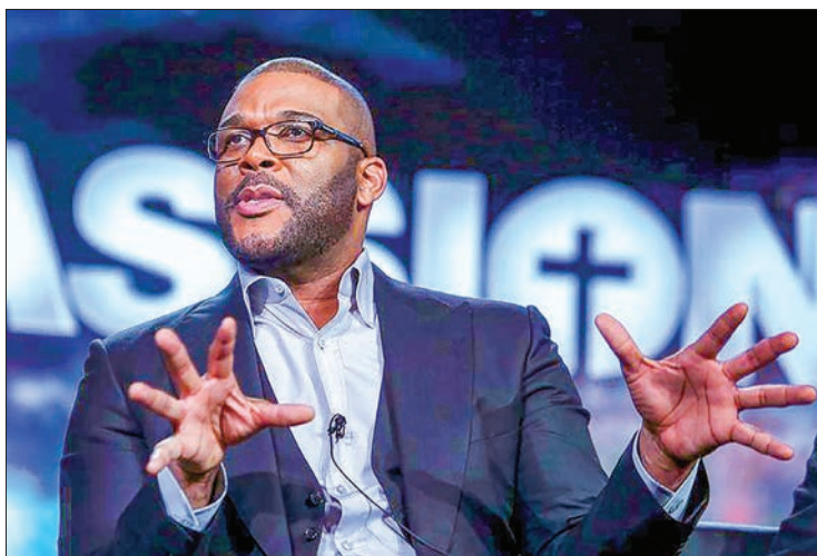
Host and narrator in New Orleans, Louisiana, Tyler Perry speaks during the Fox Network presentation at the Television Critics Association (TCA) winter press tour in Pasadena, California on 15 January, 2016.

On the international side, "Geostorm" took in $36.4 million at 13,000 screens with first-place finishes in 36 territories to lift its international total to $49 million. South Korea and Russia were the