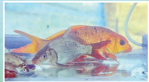
Fresher water species to be farmed in Maungtau. PHOTO: TIN MAUNG LWIN

Freshwater fish pond in Myothagyi Village in Maungtau Township in Northern Rakhine State. PHOTO: TIN MAUNG LWIN