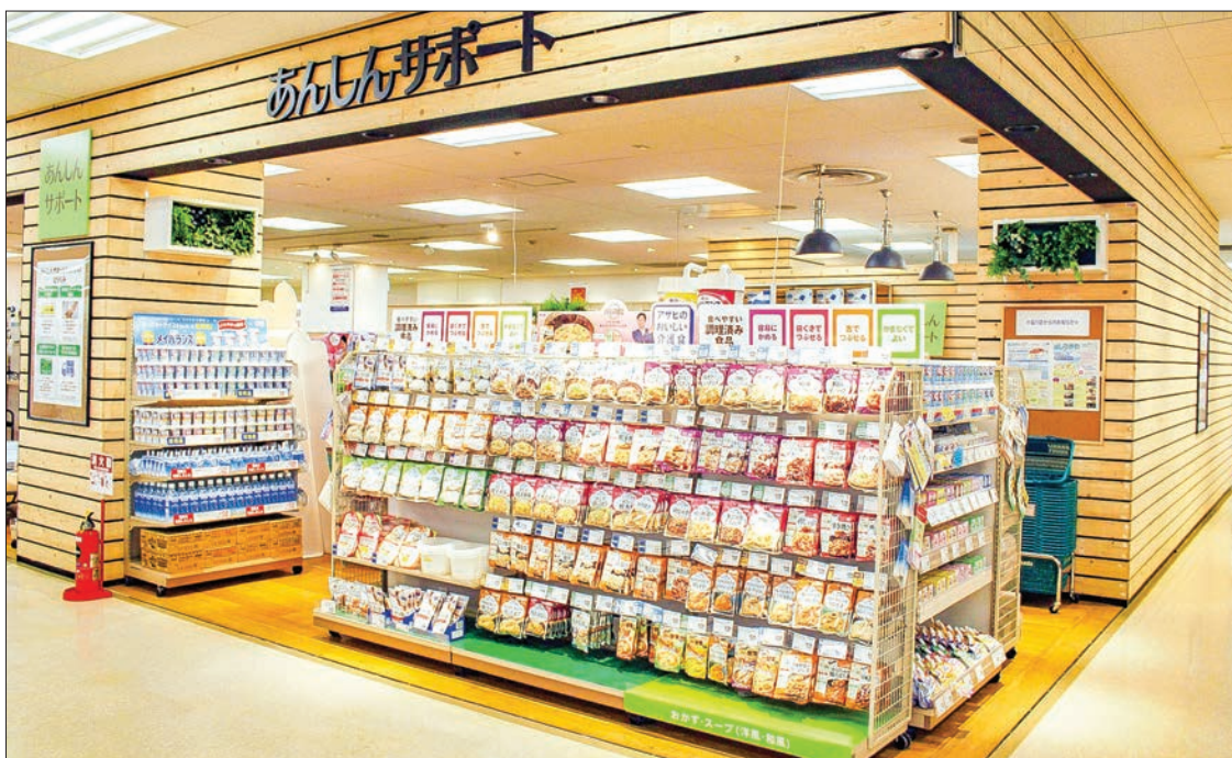
Photo taken on 27 September, 2017, shows shelf space earmarked at an Ito-Yokado store in Oimachi, Tokyo for food items targeting people needing nursing care. The major supermarket chain set up spaces for such foods at 105 of its 180 stores nationwide.

"We will offer products aimed at nutritionally supporting the elderly because an increasing number of people receive nursing care at home nowadays," a Meiji