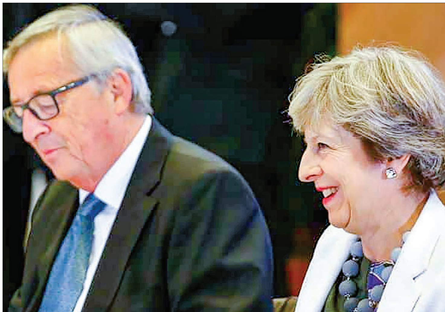
European Commission President Jean-Claude Juncker and British Prime Minister Theresa May take part in an EU summit in Brussels.