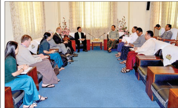
Thura U Shwe Mann holds talks with International Monetary Fund personnel in Nay Pyi Taw.