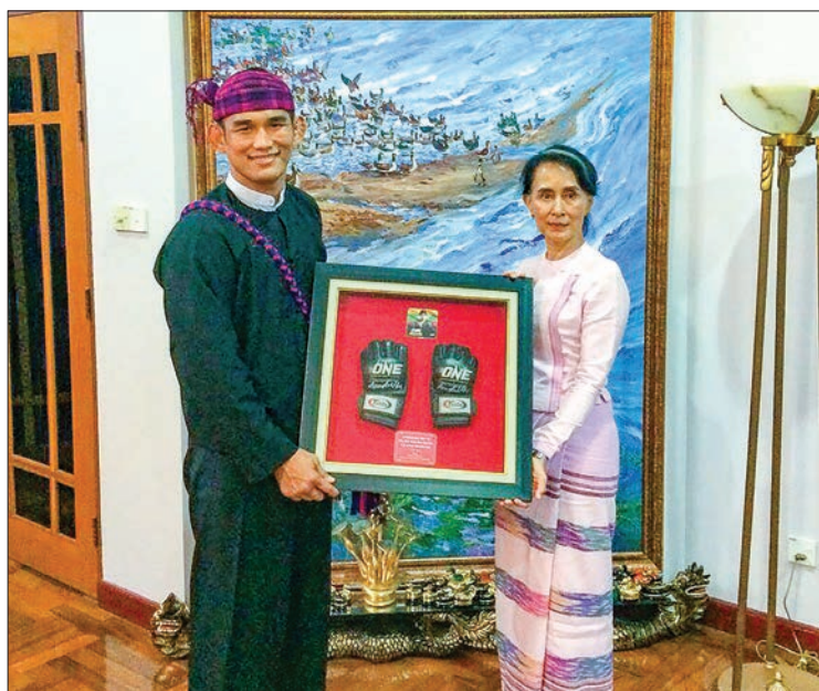
State Counsellor Daw Aung San Suu Kyi accepts the memento given by Mixed Martial Arts contestant Aung La N Sang at the State Counsellor's residence in Nay Pyi Taw.

voy for the Foreign Minister on Counterterrorism and Mediation for Settling Conflicts of the State of Qatar and H.E. Hassan Bin Mohamed Rafei AL-Emadi, Ambassador of State of Qatar also attended from Qatar side.—Myanmar News Agency ■