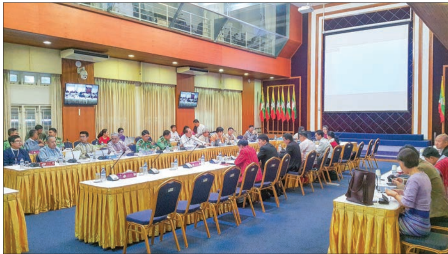
The 7th meeting of the Peace Commission and the Delegation for Political Negotiation of the United Nationalities Federal Council being held in Yangon.

Lt-Gen Yar Pyae, a representative of the Tatmadaw, expressed that the Tatmadaw want to see an agreement in