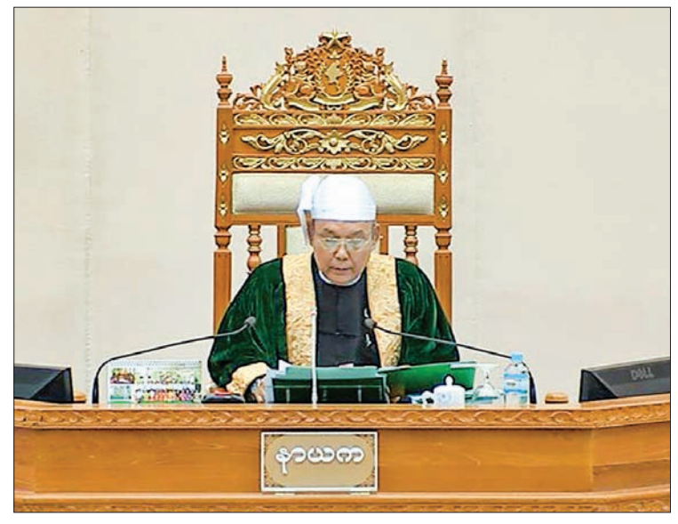
Speaker of Pyidaungsu Hluttaw Mahn Win Khaing Than.

In his discussion on the matter, Minister of State for Foreign Affairs U Kyaw Tin said there are many political and economic benefits for My-