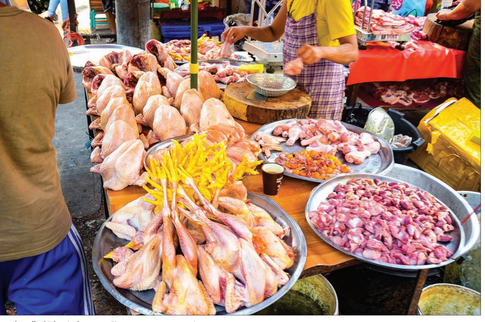
A vendor sells chicken in downtown Yangon.

address and improve food safety practices, develop the country's agribusiness, and open new export markets, hoping that Myanmar can learn from the experiences of countries around the world with IFC's help.