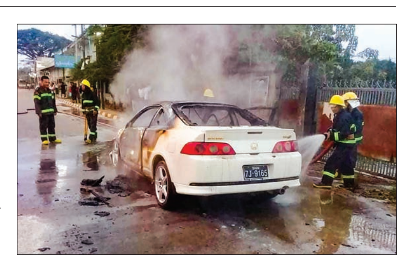
Firefighters extinguish the burning car in Tachilek.

The car owner has been charged with negligence of causing a fire by Tachilek Myoma Police Department. ■