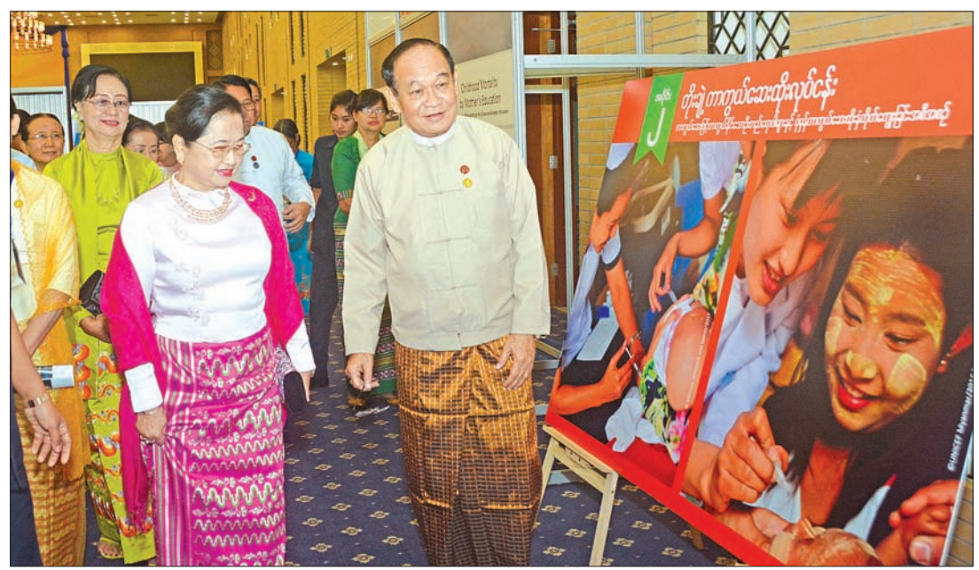
First Lady Daw Su Su Lwin looks at the poster displayed at the ceremony for introduction of health standards.

At the ceremony, the message sent from the State Counsellor was read out by Dr. Pe Myint, Union Minister for Information. Afterward, Dr. Myint Htwe, Union Minister for Health and Sports said, "So as to lift up the health standards of the