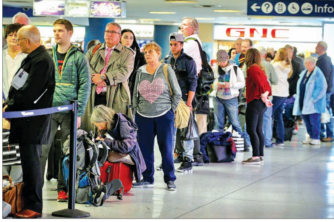
Passengers wait in line to board an Amtrak train ahead of the Thanksgiving Day holiday, at Pennsylvania Station in New York City, US, on 20 November 2017.

The number of people discussing Friendsgiving on social media sites including Twitter and Instagram has quadrupled this year compared with 2016, according to a review by social media analytics company Brandwatch.