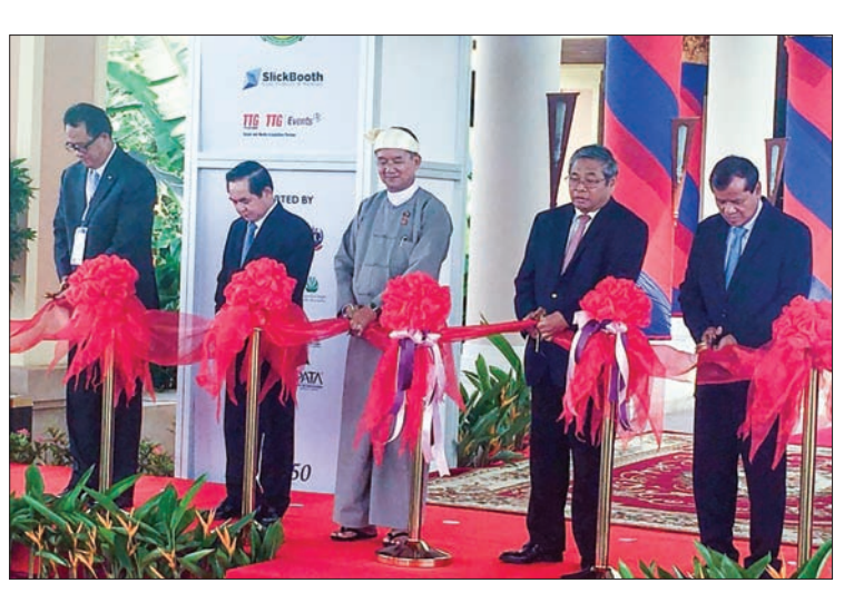
Union Minister U Ohn Maung, Cambodia Tourism Minister Dr. Thong Khon and officials cut ribbon at the ceremony.