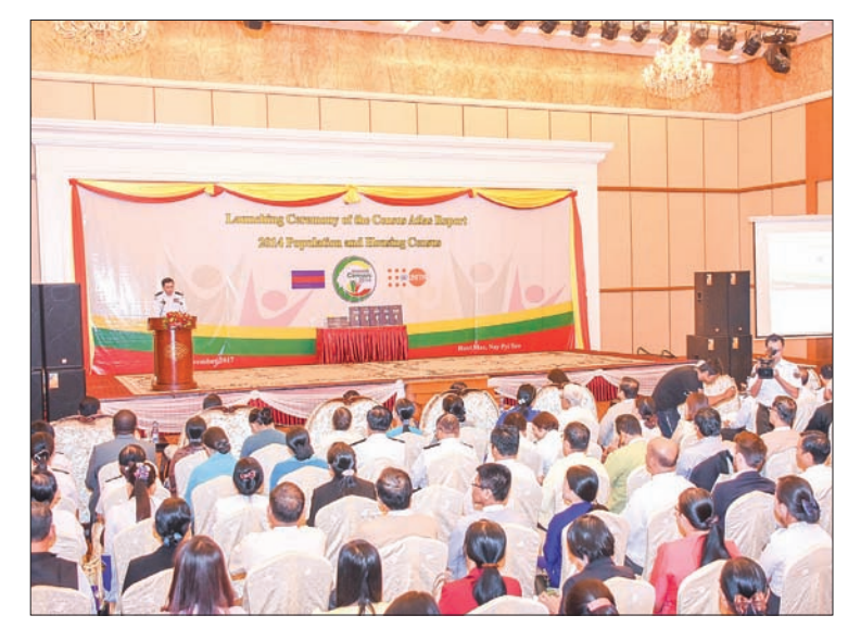
Introduction of Census Altas Report 2014 ceremony held in Nay Pyi Taw on 23 Novemer 2017.

Based on the 2014 population and household census data, 13 detailed research reports and census result map reports were published and are posted in the Population Department website www.dop.gov.mm, it is learnt. — Myanmar News Agency ■