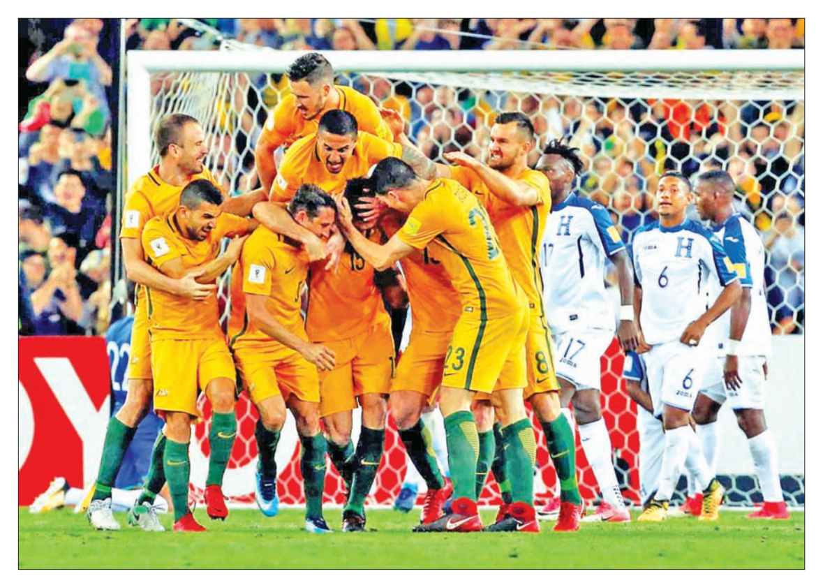
Australia's Mile Jedinak celebrates scoring a goal with team mates at ANZ Stadium, Sydney, Australia, on 15 November 2017.

Postecoglou overhauled an ageing squad at the start of his reign and his young side performed creditably in Brazil, even if they lost all three matches to Chile, the Netherlands and Spain, before going on to win the 2015 Asian Cup.