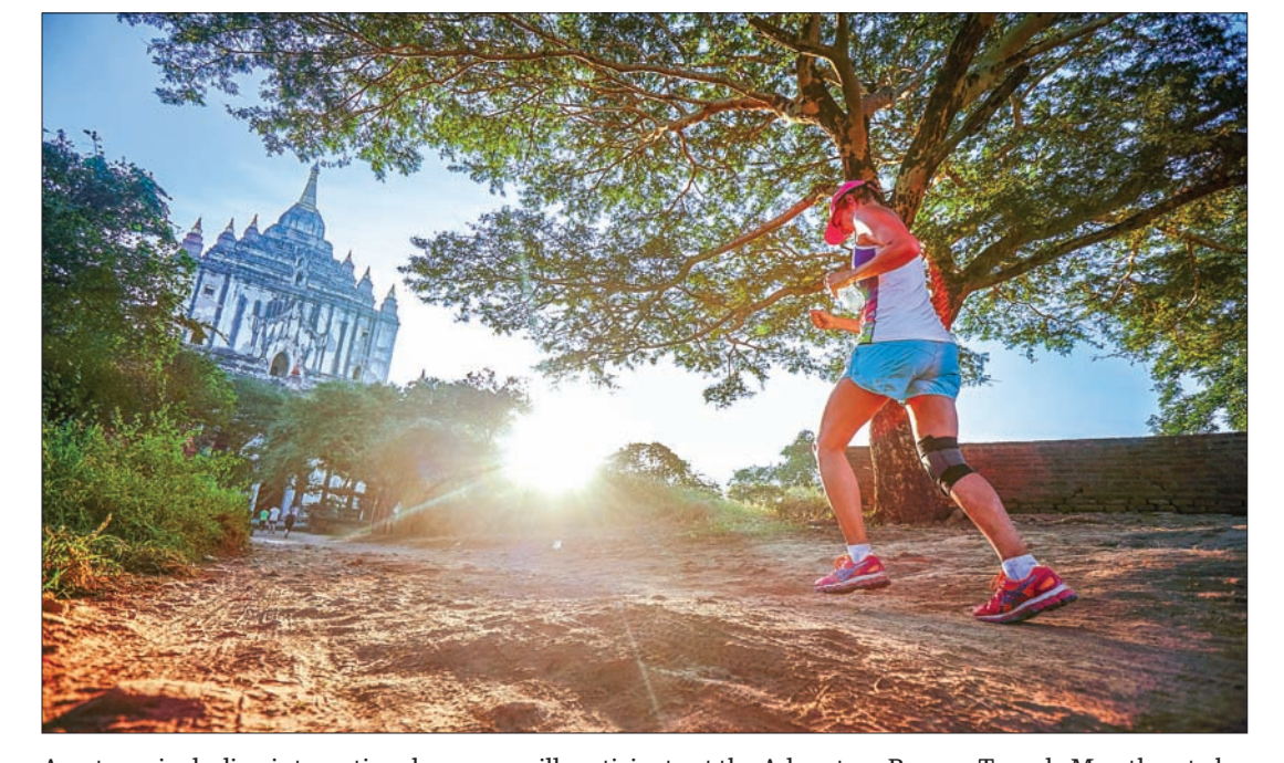
Amatures including international runners will participate at the Adventure Bangan Temple Marathon to be held in Bagan on Saturday. The Adventure Bagan Temple Marathon started in 2013.

The Adventure Bagan Temple Marathon started in 2013 and this is in its fifth time in Myanmar. ■