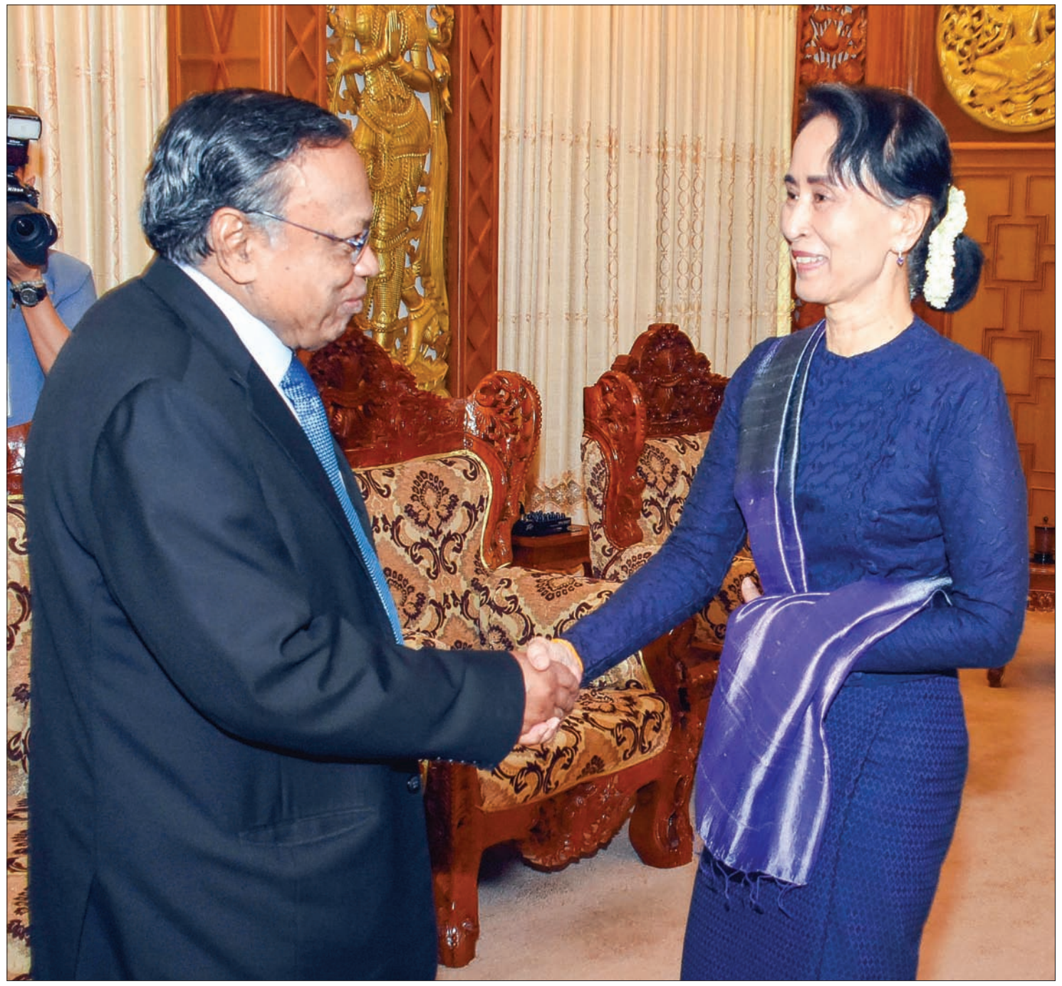
State Counsellor Daw Aung San Suu Kyi greets Bangladesh Foreign Minister Mr. Abul Hassan Mahmood Ali in Nay Pyi Taw.