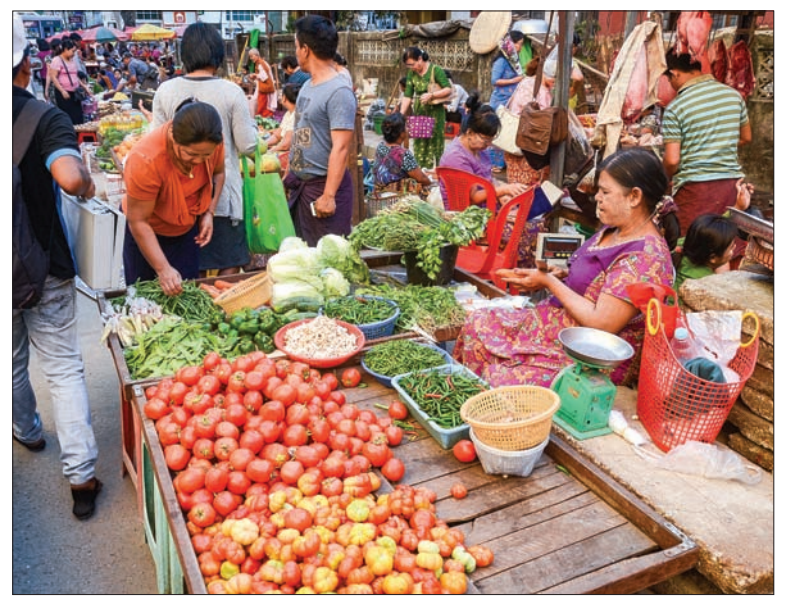
A vendor sells vegetable in Yangon.

We welcomed an initiative launched recently by IFC, a member of the World Bank Group, to help food producers