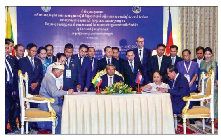
Union Minister for Hotels and Tourism U Ohn Maung and Cambodia Minister of Tourism signed the action plan including Siem Reap-Bagan-Siem Reap direct flights.

In the afternoon, representative teams led by Union Minister and Cambodia Minister of Tourism discussed matters to