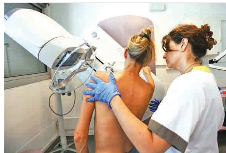
Some 90 per cent of breast cancer deaths occur with metastasis, when the disease moves to other organs or parts of the body.

Half the animals were given a drug that inhibits autophagy,