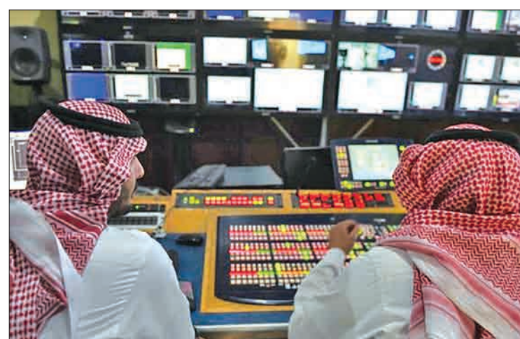
Employees work at the studio of the new channel Saudi Broadcasting Corporation “SBC” in Riyadh on 24 April, 2018.

“Saudi Arabia is making good progress in implementing its ambitious reform programme,” the