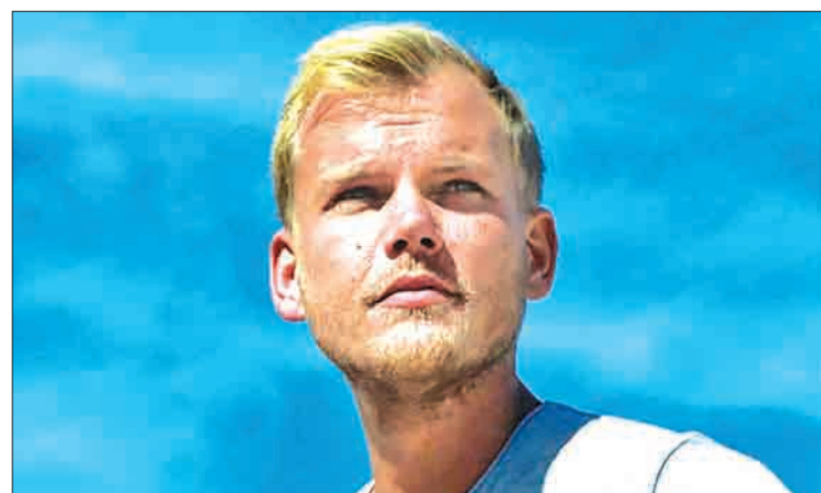
Swedish superstar DJ Avicii.