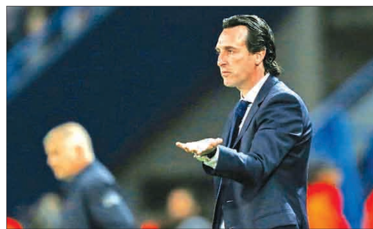
Unai Emery is the new Arsenal head coach.

Emery, 46, left PSG this month after winning Ligue 1 and four domestic cups in two