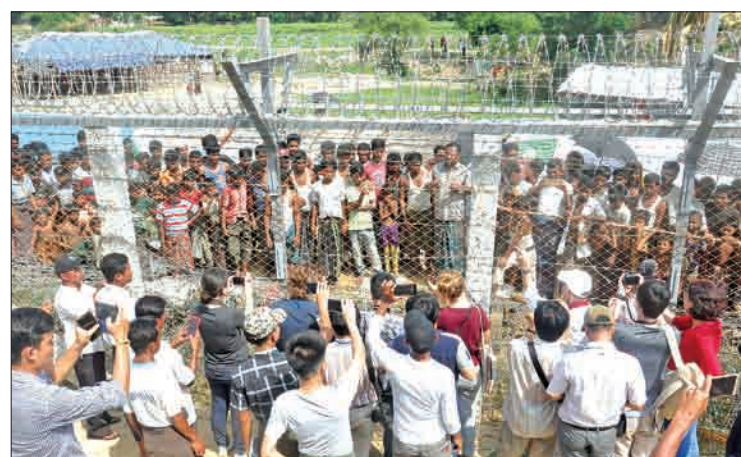
Independent journalists take photos and collect news in Maungtaw, Rakhine State.

In the afternoon, the media group arrived in Sittway and then departed for Yangon by flight. — Myanmar News Agency ■