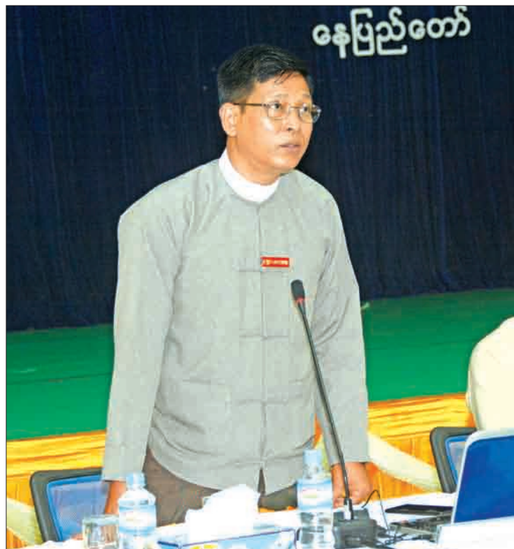
Director-General U Zaw Htay, Ministry of the State Counsellor's Office.

a matter of our country's sovereignty, which is every country's right to be free from interference from foreign entities. It's in the UN Charter, too. But due to various reasons such as terrorist groups killing civilians and destroying villages, the military had to intervene. Without security forces, everyone would be in trouble. Every country has the Right of Defence, and it will defend its people from terrorism,” said U Zaw Htay. ■