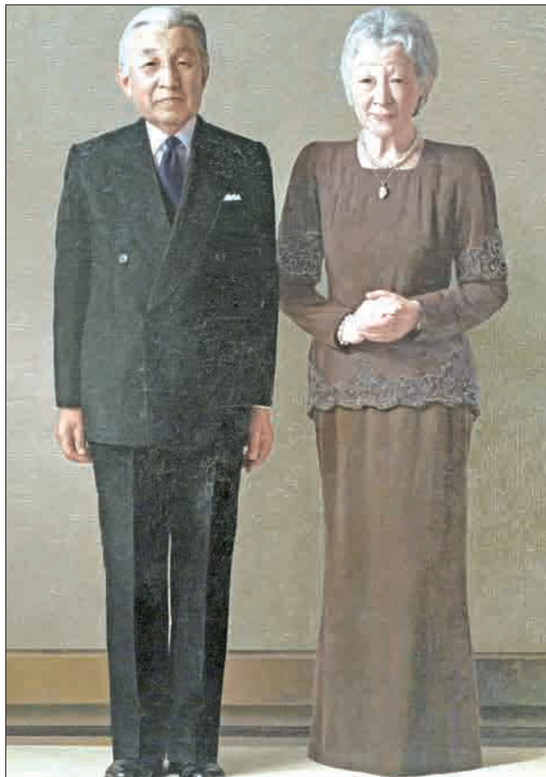
Supplied photo shows a portrait of Japanese Emperor Akihito (L) and Empress Michiko.

The two-meter square work by Hiroshi Noda, one of Japan's most famous realist painters, has been painted based on a photo taken in 2014 and was brought to the agency in March, it said. The emperor and empress had only been painted in 1974, as a crown prince and princess, while there are 31 portraits of previous imperial couples from the Meiji era (1868-1912), according to the agency.— Kyodo News ■