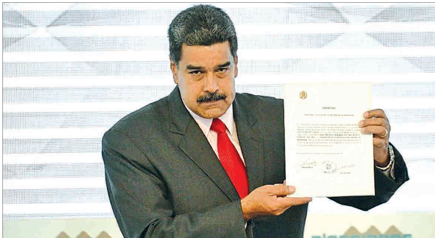
Venezuela's Nicolas Maduro.