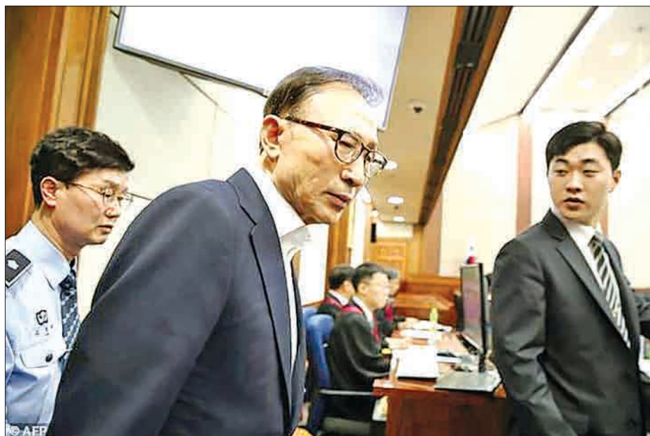
Former South Korean president Lee Myung-bak.

The case against Lee means all four former South Korean presidents who are still alive have been charged or convicted for criminal offences. TV footage showed Lee, wearing a dark blue suit with a badge with his inmate number “716” pinned to the lapel, being led into a courtroom in Seoul. He was uncuffed due to his advanced age. “I stand here broken-hearted,” Lee said in his opening statement.