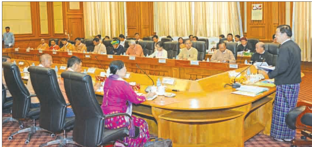
Pyithu Hluttaw Speaker U T Khun Myat addresses the coordination meeting of Speaker, chairmen and secretaries from the respective committees of the Pyithu Hluttaw in Nay Pyi Taw.

U T Khun Myat also stressed the need to scrutinize the enacted laws if they are effective or if the ministries and institutions are