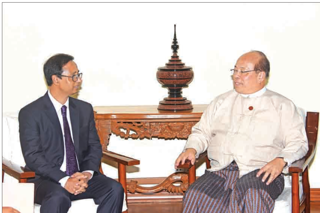
Union Minister U Thaung Tun receives Ambassador of Bangladesh Mr. Manjurul Karim Khan Chowdhury in Nay Pyi Taw yesterday.