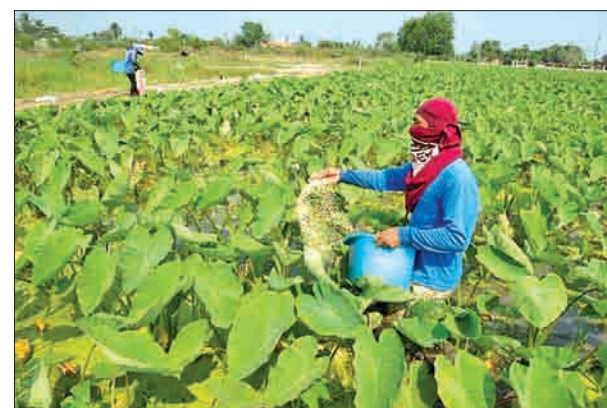
Thailand decided that reports of health and environmental hazards were not serious enough to merit a full ban of paraquat and two other controversial farm chemicals.