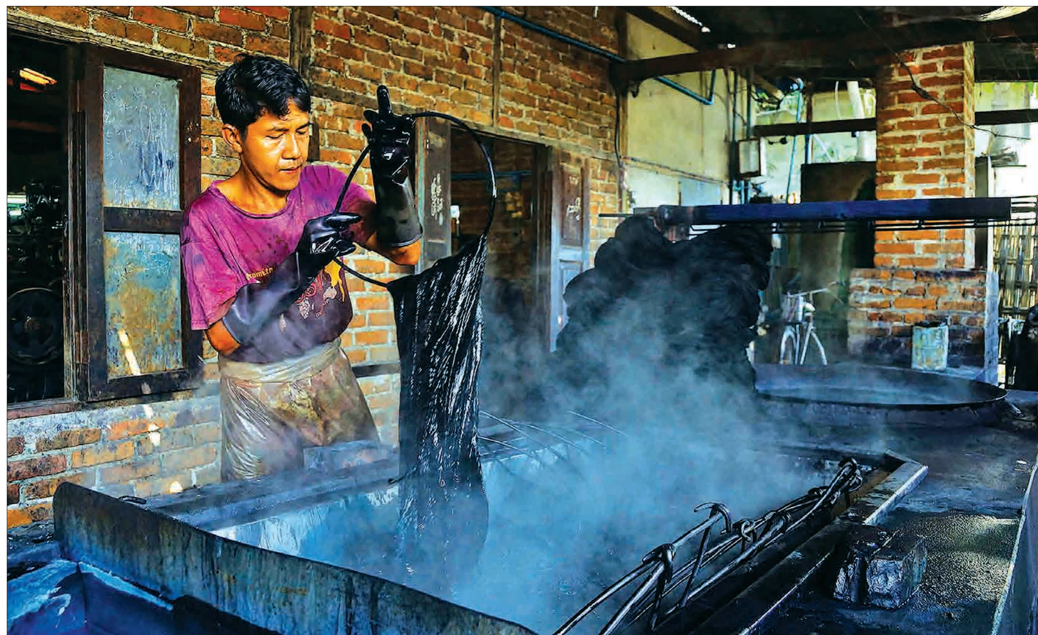
A worker dyes textiles at the weaving factory in Meiktila in central Myanmar.

Furthermore, we need to ensure proper coordination on how to effectively use the funds requested for long-term natural disaster prevention programmes and how to use the natural disaster fund.