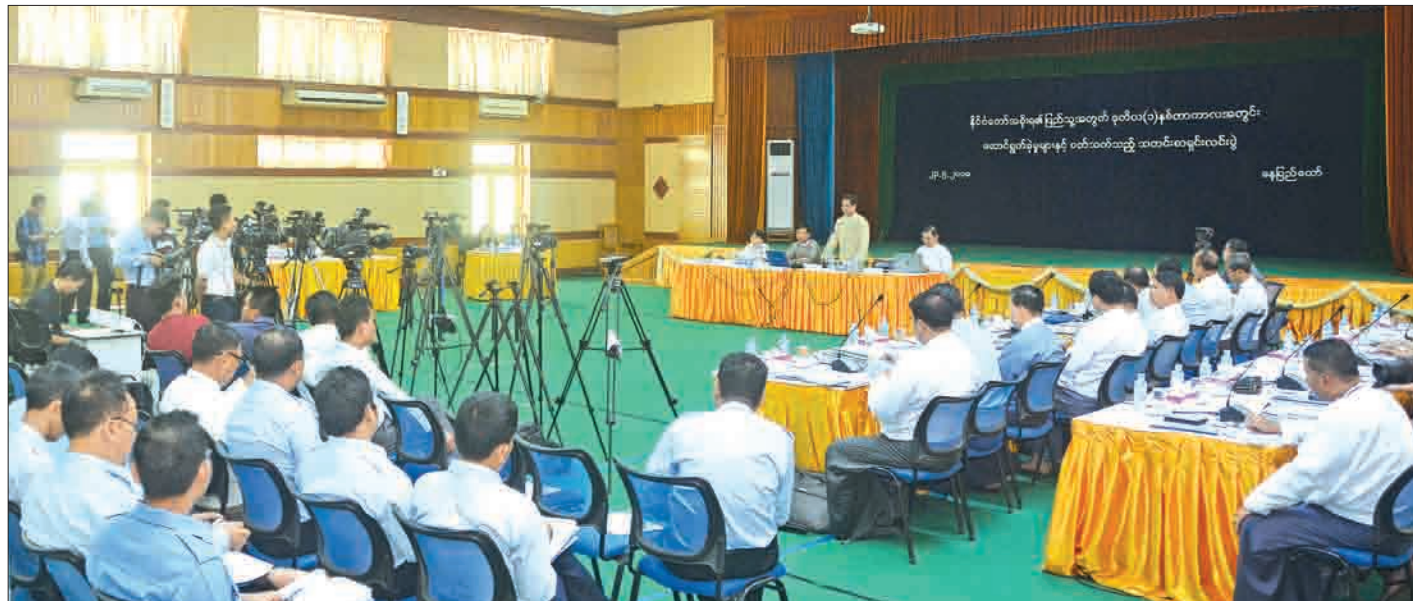
Deputy Minister for Commerce U Aung Htoo addresses the press conference on performance during the second one-year term of the incumbent government at the Ministry of Commerce in Nay Pyi Taw.

The ministry is set to amend the Consumer Protection Law 2014 to make it more comprehensive in protecting the public and has set up laboratories to ex-