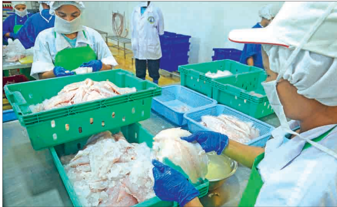
Labourers work at fish cold storage factory.

are still calling into question the facts incorporated into NRMP to the government and private entrepreneurs. Samples have already been sent to them. It took more than a year, but they still have not given the green light to the products of farming businesses," said U Tun Aye.