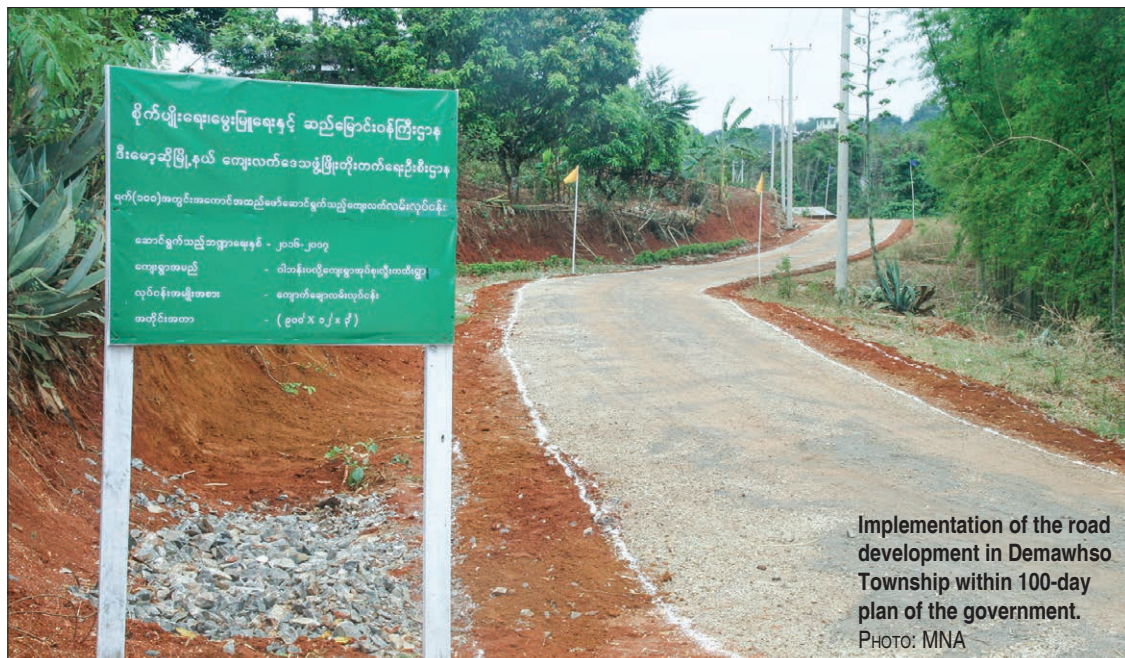
Implementation of the road development in Demawhso Township within 100-day plan of the government.

Surveying land for accuracy of data on land, purchases of modernized land surveying equipments to give more accurate digital maps were carried out and a total of 7229 fields were managed to be surveyed in the fiscal year 2016-2017.