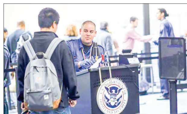
A Transportation Safety Administration agent looks over a passenger at San Francisco International Airport in San Francisco, California in 2015.

ICAO has not decided whether to propose turning the carry-on electronics ban into a global standard, a second source said.