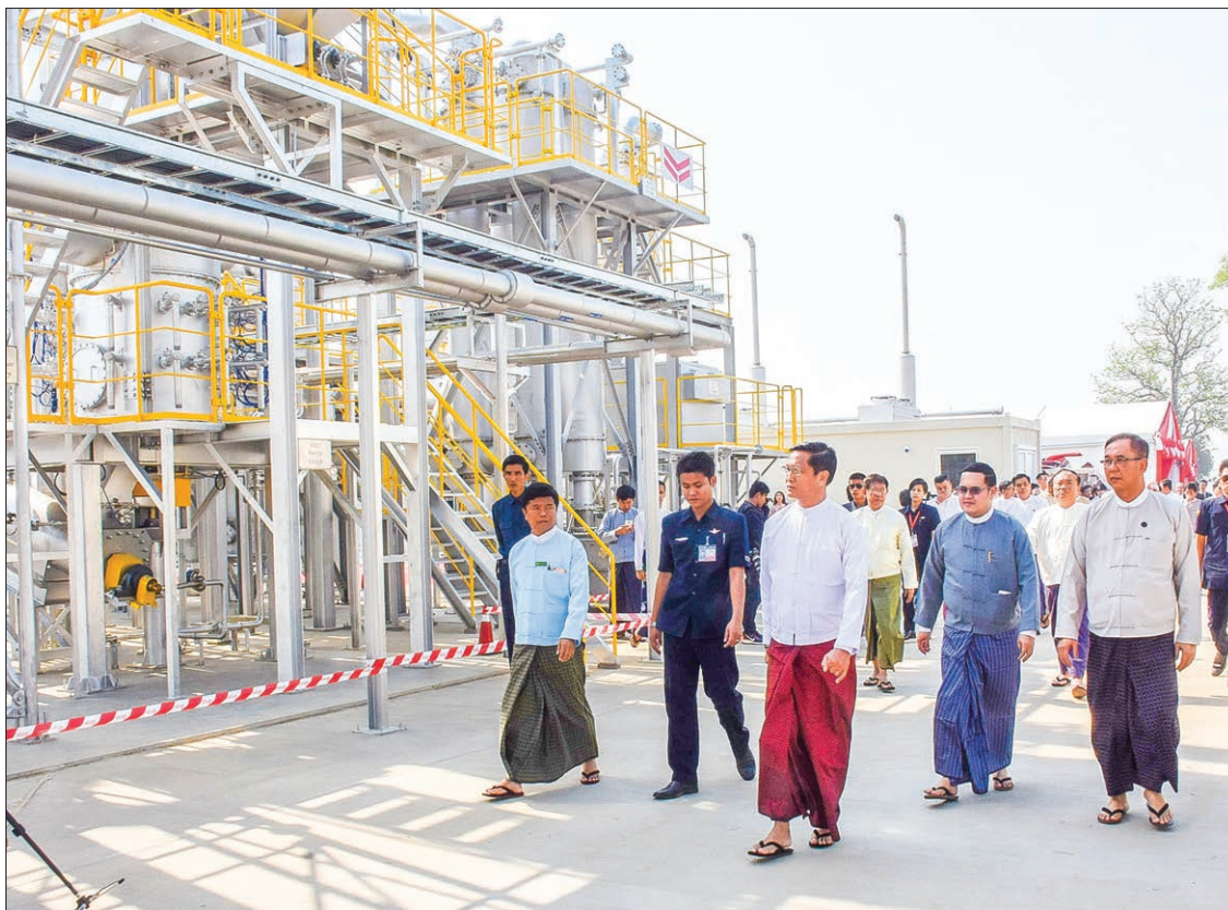
Vice President U Henry Van Thio visits the husk-fired power plant in Pinyinmana.