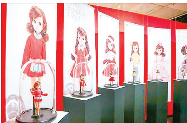
Licca-chan dolls by toymaker Tomy Co. are displayed at Tokyo’s Matsuya Ginza department store on 22 March 2017, in a new exhibit commemorating the 50th anniversary of the launch of the first Licca girl doll. The exhibition will run through 3 April.

The iconic doll is in the form of an 11-year-old, fifth-grade schoolgirl named Licca Kayama, fondly called “Licca-chan,” a suffix in Japanese denoting endear-