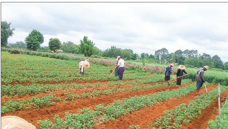
Better GMO cultivation method is being used in local farms.