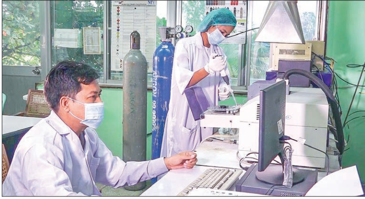
Technicians are testing and screening of the viruses under controlled environment at Antibiotics and Virus Diagnostic Lab Department.