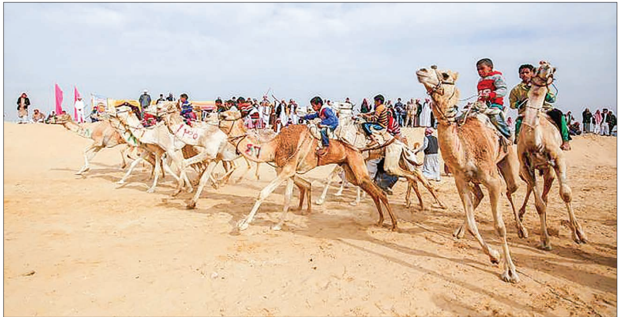
Jockeys, most of whom are children, compete on their mounts at the starting line during the opening of the International Camel Racing festival at the Sarabium desert in Ismailia, Egypt, on 21 March 2017.