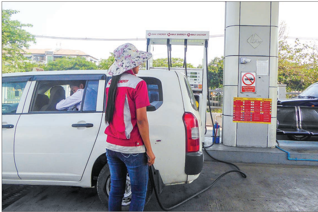
A worker fills a car with fuel at a petrol station in Yangon on 21 March 2017.

FUEL oil importers and distributors are reported to have requested that the Ministry of Planning and Finance review the invitation of Foreign Direct Investment (FDI) to the local fuel oil market, according to Myanmar Fuel Oil Importers and Distributors Association.