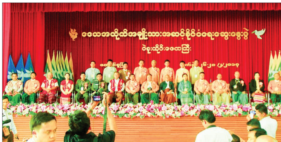
National level political dialogue in Bago Region .