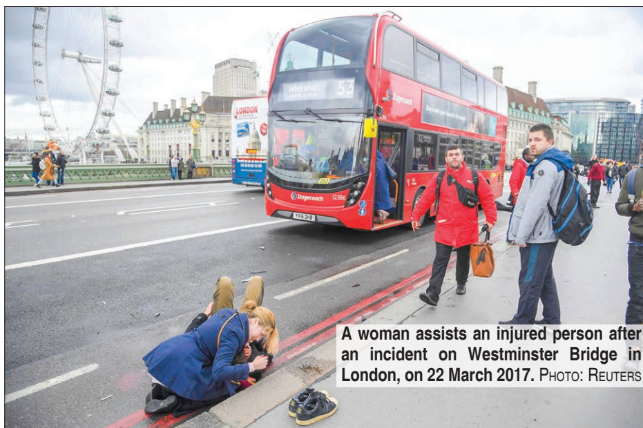
A woman assists an injured person after an incident on Westminster Bridge in London, on 22 March 2017.

Authorities have said they are working on the assumption that the attack was Islamist-related. Britons have been shocked by the fact that the attacker was able to cause such mayhem in the heart of the capital equipped with nothing more sophisticated than a hired car