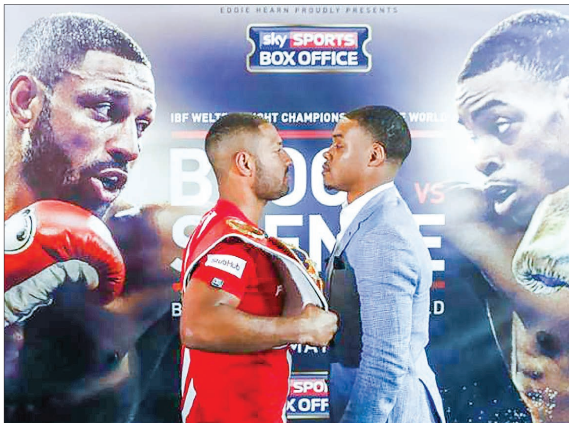
Kell Brook and Errol Spence pose after the press conference at Bramall Lane, Sheffield, on 22 March 2017.

"I'm going to show the world that I'm the best welterweight on the planet and I'm going to do it right before my people's eyes."—Reuters