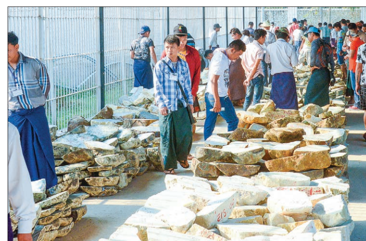
Raw and uncut jades showing at Mani Yadana Jade Hall.

UNCUT and raw jade were sold for the fifth day straight using Myanmar currency at Mani Yadana Jade Hall, Nay Pyi Taw on Thursday.