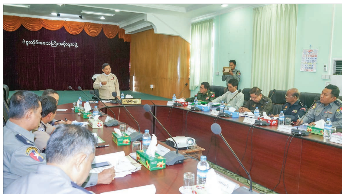
U WinThein, Bago Region Chief Minister, delivering a speech during the cabinet meeting.