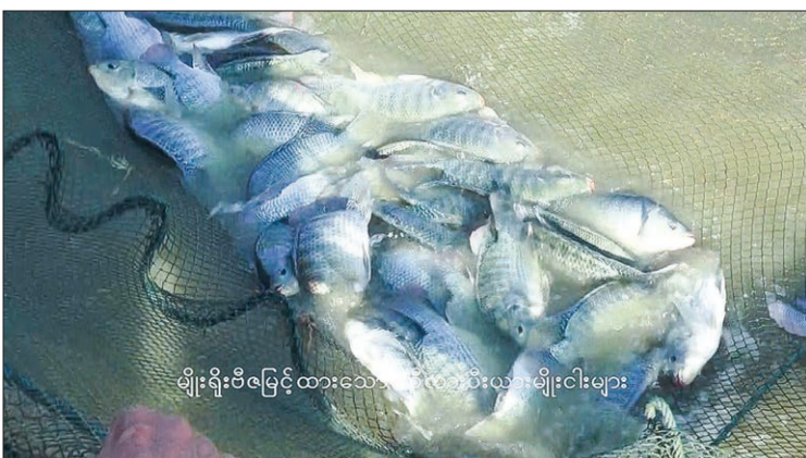
Gently-modified fishes are being bred nation wide.