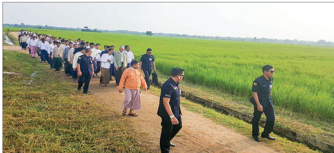
President U Htin Kyaw looking around the systematic planting of annual crops in the field of Shwedaung Township.