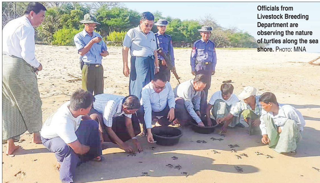
Officials from Livestock Breeding Department are observing the nature of turtles along the sea shore.

Surveying land for accuracy of data on land, purchases of modernized land surveying equipments to give more accurate digital maps were carried out and a total of 7229 fields were managed to be surveyed in the fiscal year 2016-2017.