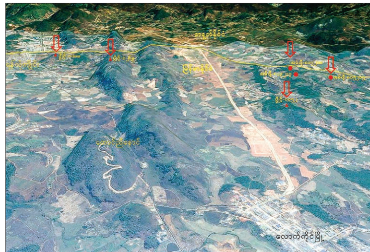
Map shows MNDAA's outposts occupied by the forces of the Tatmadaw.

Tatmadaw troops as well, fought against the armed groups for the peace and stability in