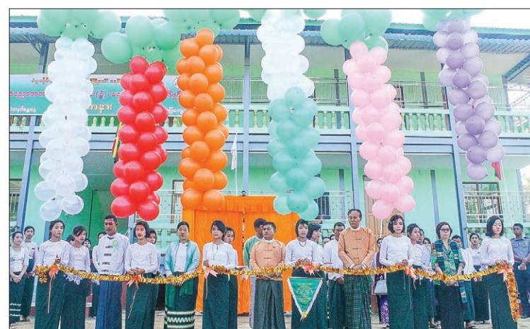
New school building is formally opened by MPs.