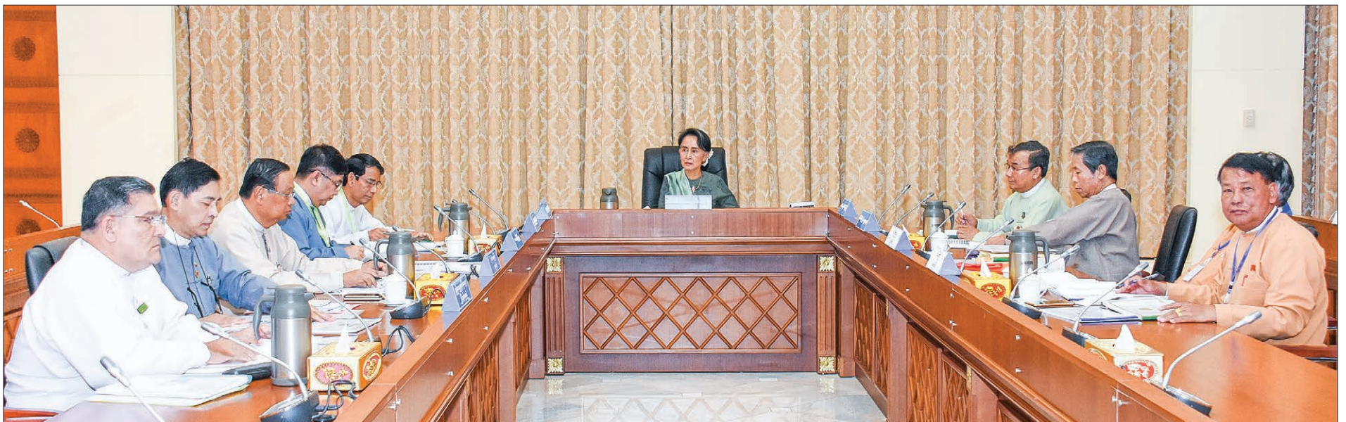
State Counsellor Daw Aung San Suu Kyi addresses in coordination meeting between ministries and Sagaing Region Government at the Presidential Palace in Nay Pyi Taw yesterday.

STATE Counsellor Daw Aung San Suu Kyi has stressed the need to improve the transport and electricity infrastructures in Sagaing Region to be able to attract foreign investments in the region.