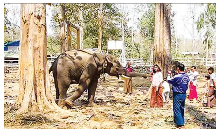
Tourists visit Elephant Camp in Bago.