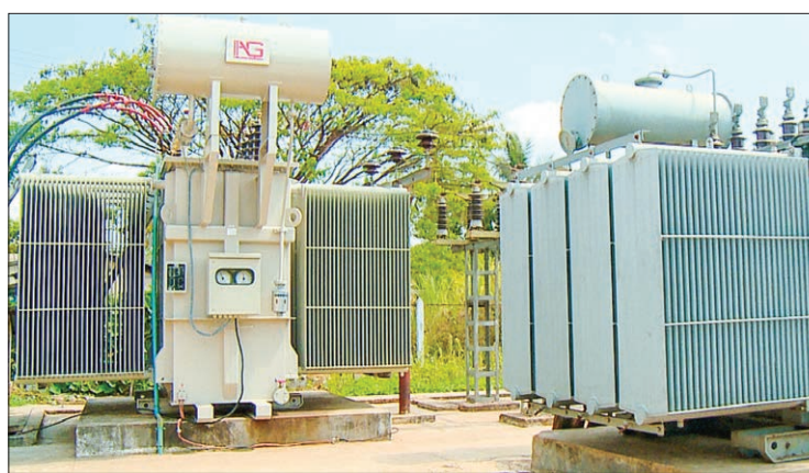
Electricity of the region is well provided by generators.

Bago Region Government has relaxed some rules and regulations in order to provide the people with the rule of law and better socio-economy.