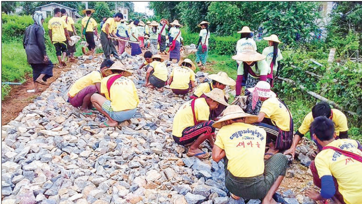
Villagers are volunteering for building a new pavement for their village.