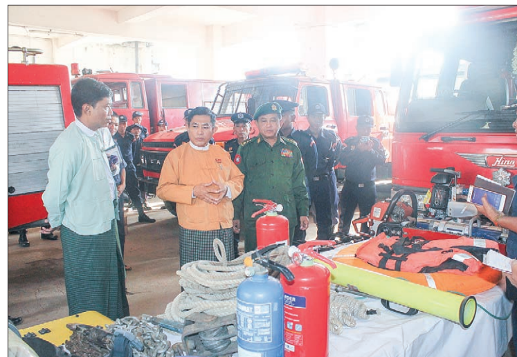
Chief Minister of Bago Region, U Win Thein encouraging officials and members of Fire Service Department.