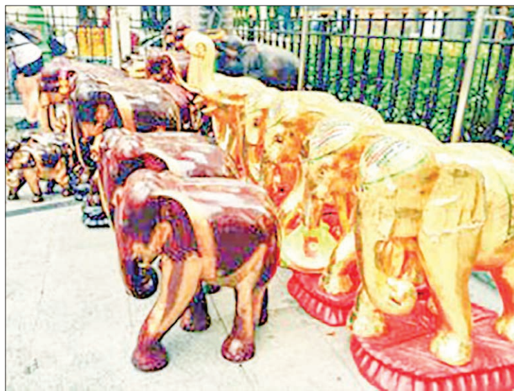
Elephant shaped handiworks on display utilizing a variety of materials and postures.

The biggest deal of the year for Southeast Asia? Momo, a mo-