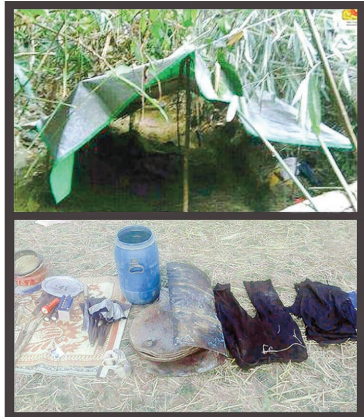
Evidences seized from the suspects.

They also confessed that plans were made to open terrorist training sites at Tinn May, Ngamyinbaw, Yinma Kyauktaw and Innchaw Badana villages. They were arrested while attending the first training session at Tinmay Village, according to the State Counsellor's Office Information Committee. — Myanmar News Agency