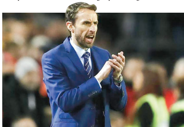
England manager Gareth Southgate.

With three wins out of four games in the World Cup 2018 qualifying campaign, England are two points clear at the top of the group F standings.—Reuters