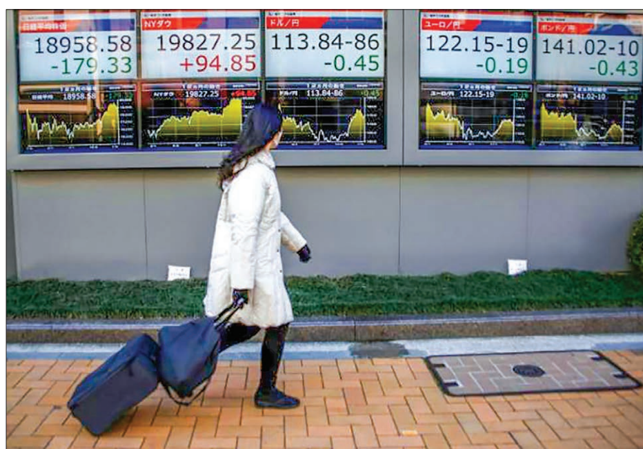
A woman walks past electronic board showing stock prices and Japanese Yen's exchange rate outside a brokerage at a business district in Tokyo, Japan, on 23 January 2017.

states will continue to review the evolving aviation security environment in the coming weeks,” the statement said.—Reuters