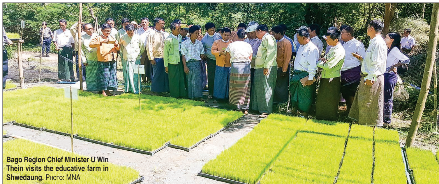
Bago Region Chief Minister U Win Thein visits the educative farm in Shwedaung.