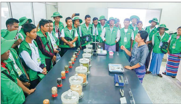
The official from Agriculture Department is explaining better methods for growing organic plants to local people at Nwe Ni village.