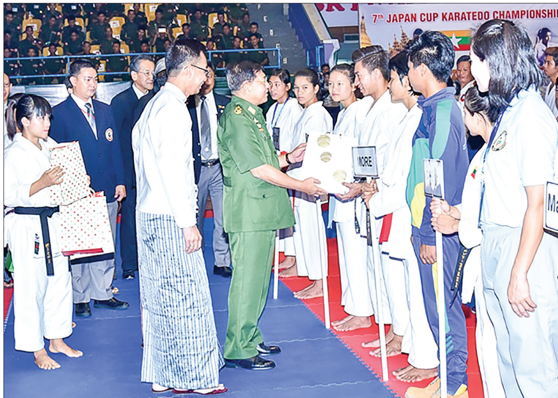
Senior General Min Aung Hlaing presenting awards to the participants of the 7 th Japan Cup.