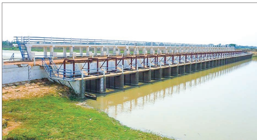
Paing Kyone sluice gate that regulate sewage in the river.