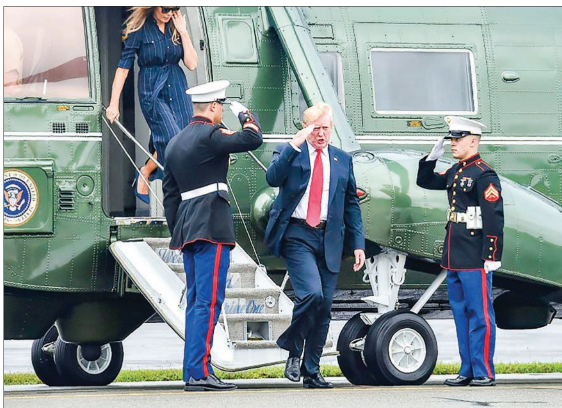
Trump's tweet to Iran's Rouhani was written entirely in capital letters.

On Saturday, Iran's supreme leader Ayatollah Ali Khamenei said US words and "even... their