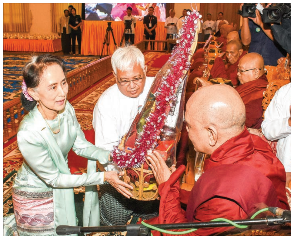
State Counsellor Daw Aung San Suu Kyi presents offertories to Sayadaw Agga Maha Pandita Bhaddanta Sandimabhivamsa in Nay Pyi Taw yesterday.