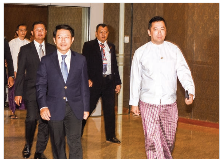
LPDR Foreign Minister Mr. Saleumxay Kommasith arrives at Nay Pyi Taw International Airport, Nay Pyi Taw yesterday.

A DELEGATION led by Lao People's Democratic Republic (LPDR) Minister of Foreign Affairs Mr. Saleumxay Kommasith arrived by air in Nay Pyi Taw yesterday evening.