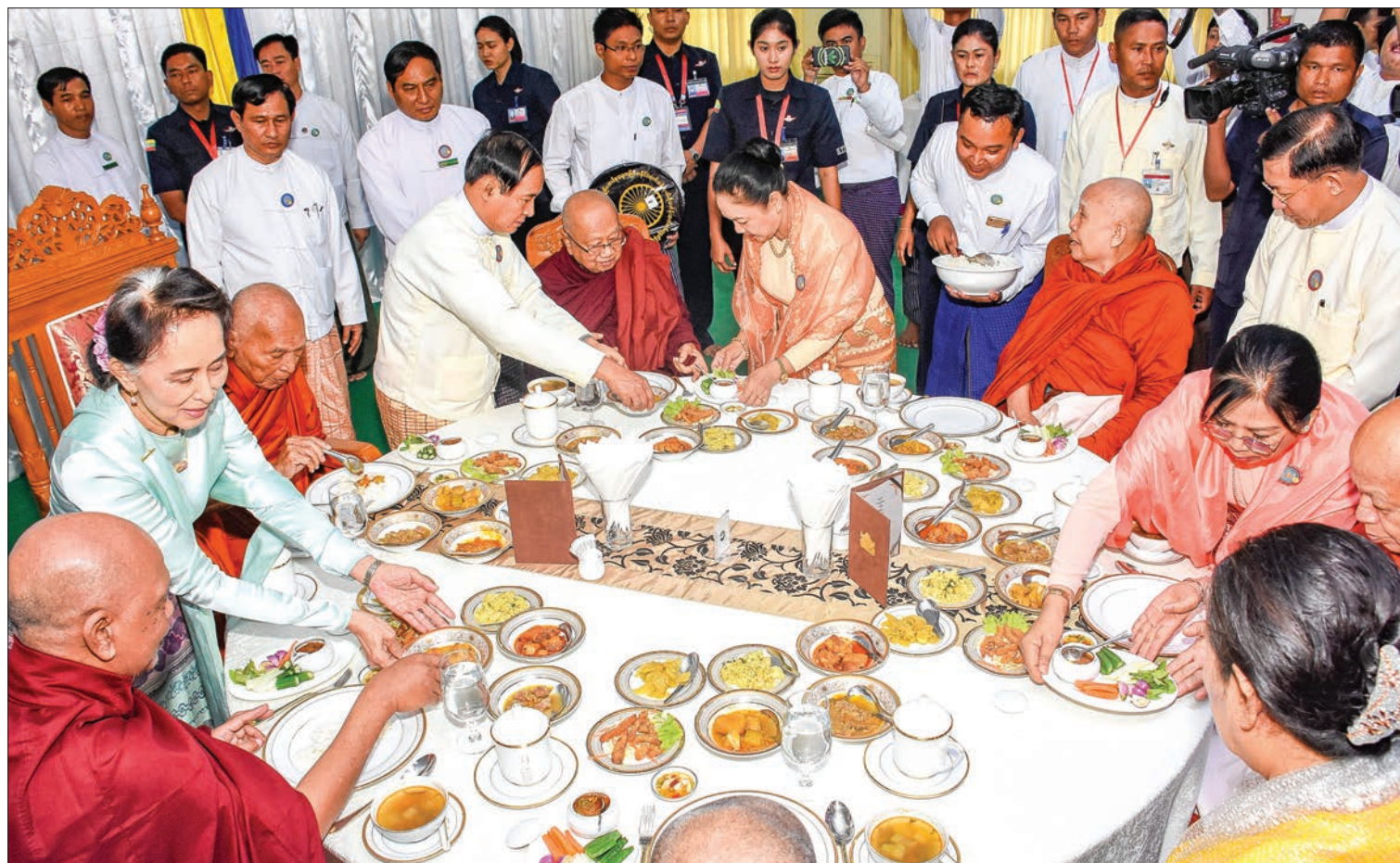
President U Win Myint, First Lady Daw Cho Cho and State Counsellor Daw Aung San Suu Kyi offering 'soon' to Sayadaws as part of the Waso robe offering ceremony.