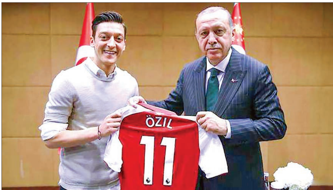
File photo taken on 13 May, 2018 shows Turkish President Recep Tayyip Erdogan (right) posing with German footballer of Turkish origin Mesut Ozil (left) in London.

who by leaving the national team has scored the most beautiful goal against the virus of fascism," Justice Minister Abdulhamit Gül wrote on Twitter.