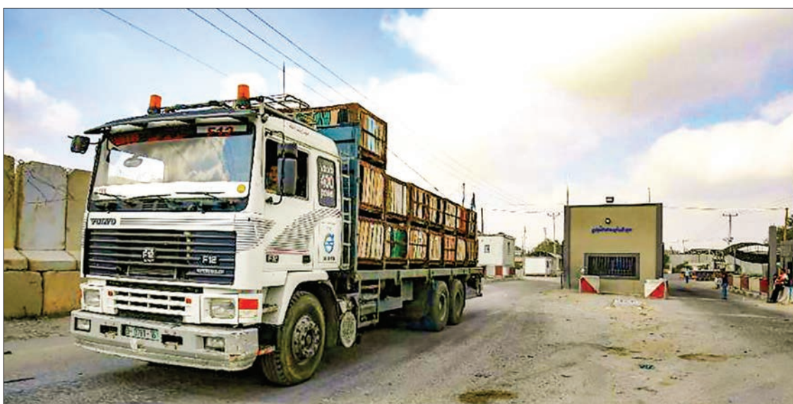
A lorry passes through the Kerem Shalom crossing, the main passage point for goods entering Gaza, in the southern Gaza Strip town of Rafah on 17 July, 2018.

The ceasefire followed a wave of deadly Israeli air strikes across Gaza sparked by the death of an Israeli soldier shot near the border. There has been relative calm on the Gaza border since the ceasefire.