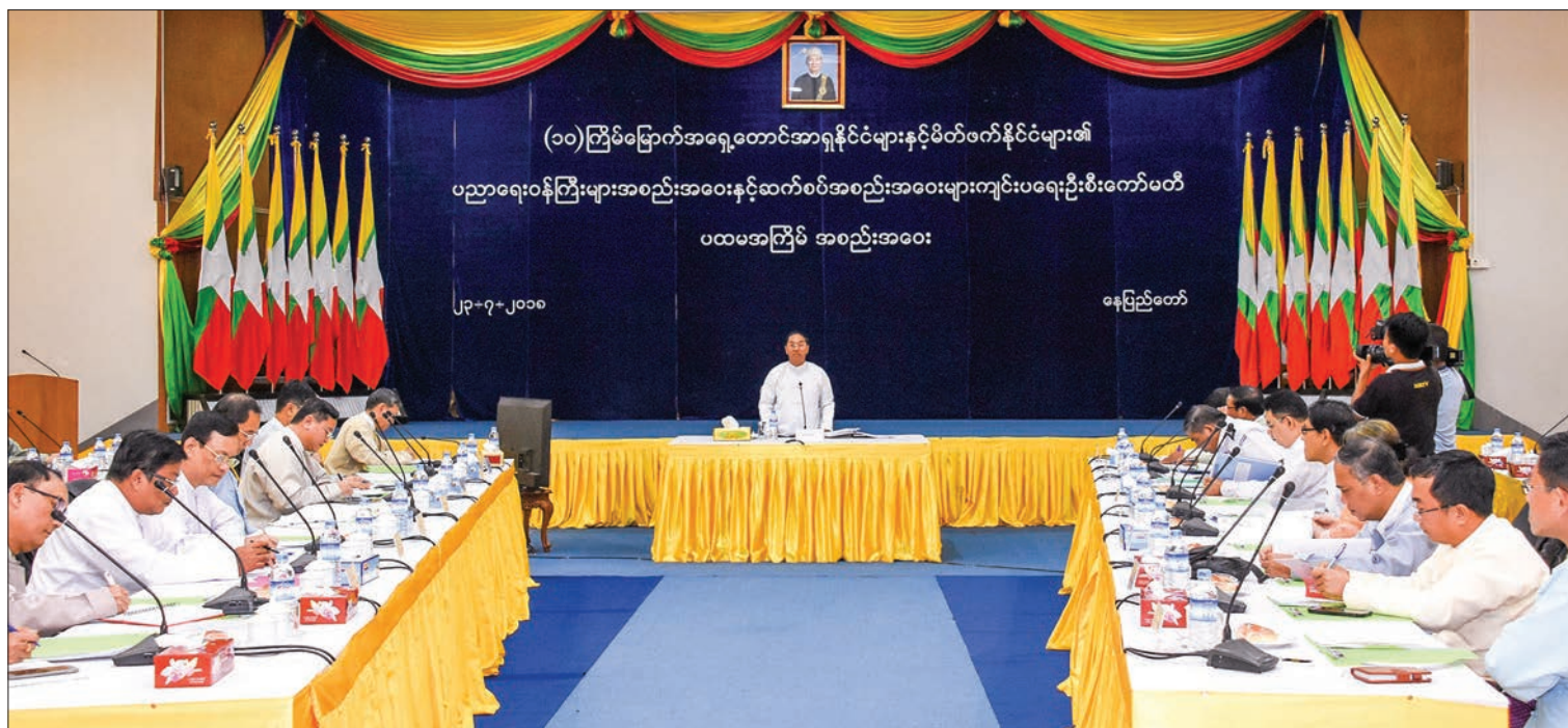
Vice President U Myint Swe delivers a speech at the meeting to prepare for holding the 10 th ASEAN Education Ministers Meeting in Nay Pyi Taw yesterday.

The 10 th ASED will see the participation of education ministers and senior officials from the ASEAN-member countries, education ministers from ASEAN's dialogue partners: the Republic of Korea, Japan, China, New Zealand, the Russian Federation, the United States, India and Australia, and officials from the ASEAN Secretariat.