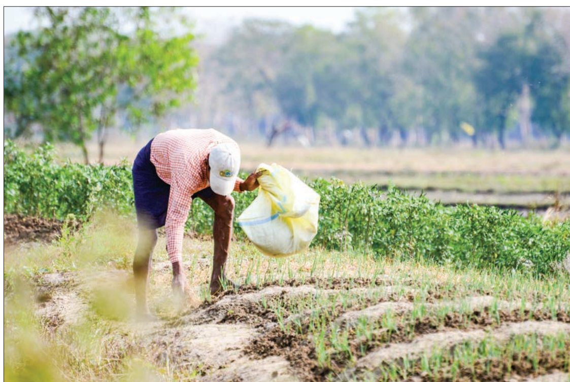
A farmer works in an onion field.

It takes some five-and-a-half months from farmland treatment to onion harvesting.