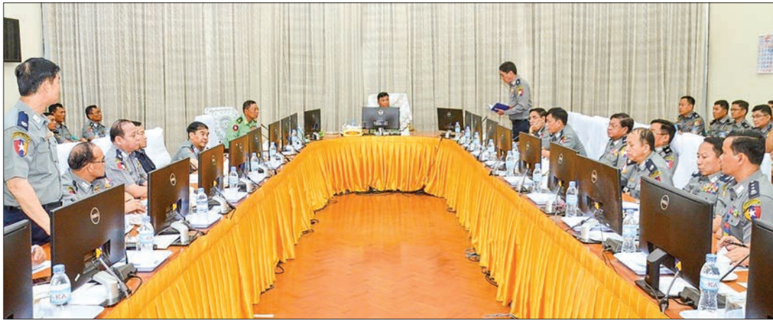
Union Minister for Home Affairs Lt-Gen Kyaw Swe meets with Anti-Narcotics Task Force officers yesterday.

UNION Minister for Home Affairs Lt-Gen Kyaw Swe met senior officers and 44 officers transferred to the Anti-Narcotics Task Force at the meeting hall of the Ministry of Home Affairs yesterday afternoon. The union minister said that the new officers were specifi-