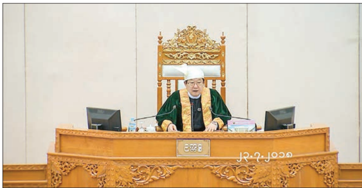
Pyithu Hluttaw Speaker U T Khun Myat.

At first, Pyithu Hluttaw Speaker U T Khun Myat said that during the ninth regular session, there were 23 bills to be discussed. On bills, four submitted during the eighth regular session and three more would be discussed and in the asterisk-marked question, 137 transferred from the eighth regular