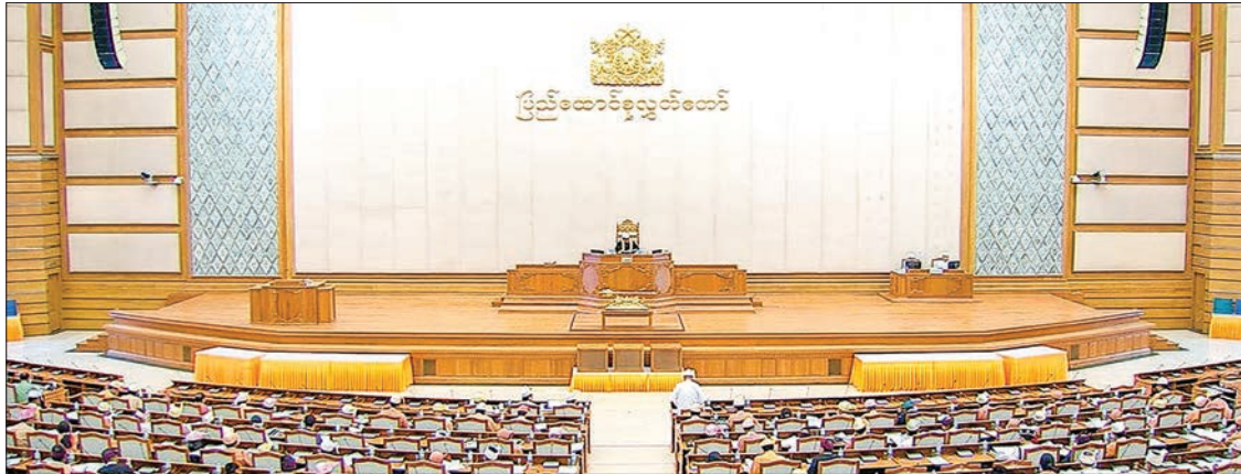
Pyidaungsu Hluttaw being convened in Nay Pyi Taw yesterday.

The Speaker said members of parliament should keep in mind the immediate and long-term benefits for the public, while avoiding unnecessary spending