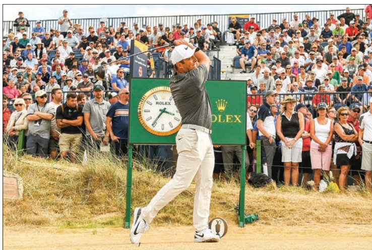
Italy's Francesco Molinari watches his shot from the 6 th tee during his final round on day 4 of The 147 th Open Golf Championship at Carnoustie, Scotland on 22 July, 2018.

see how Xander Schauffele concludes his last round before he can celebrate winning his first major. Schauffele was seven under par for the championship coming down the 17th, with