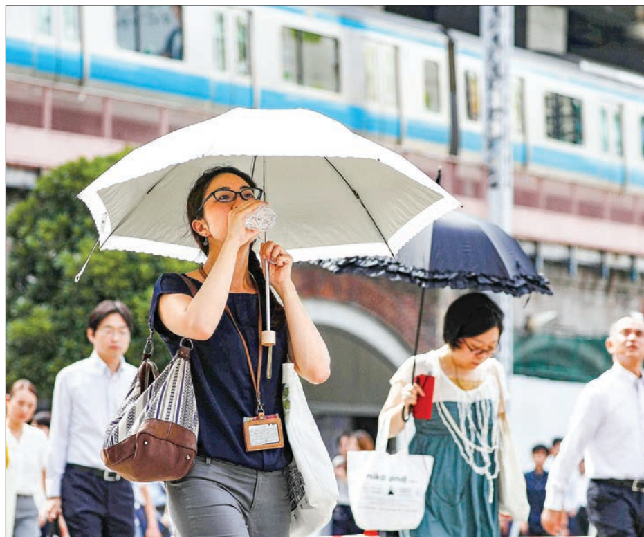
Women walk with parasols amid a continued heat wave in Tokyo on 23 July, 2018.

The agency has issued advisories over the scorching heat, urging people to drink water frequently and take measures against heatstroke.—Kyodo News ■