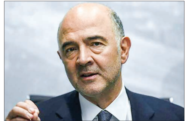
EU finance chief Pierre Moscovici hits out at Trump over the US president’s protectionist policies.

“These meetings take place in an international context which