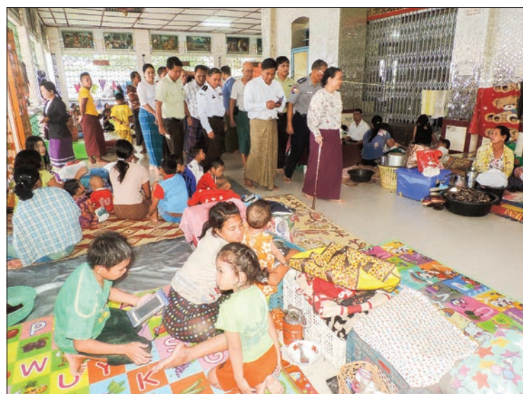
Kayin State government staff visit people in relief camps affected by flooding in the state.

818 households. Meanwhile, 12 camps in Hlaingbwe Township were occupied by 321 households, two camps in Kawkareik Township by 65 households, two camps in Kya-in-Seikkyi Township by 122 households and nine camps in Myawady Township by 448 households. —Myanmar News Agency ■