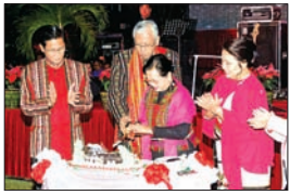
NATIONAL President U Htin Kyaw and First Lady attend Christmas ceremony PAGE-3