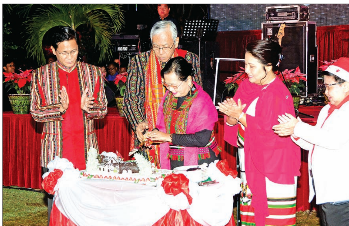
President U Htin Kyaw and First Lady Daw Su Su Lwin slice the cake to mark the Christmas ceremony in Nay Pyi Taw yesterday.