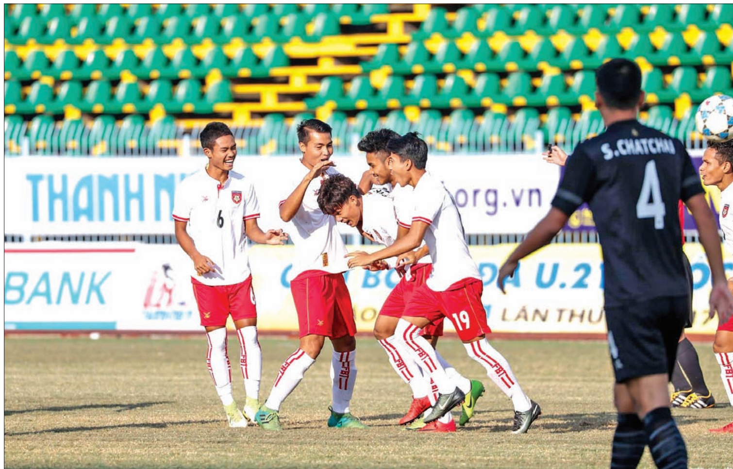
Myanmar U-21 football players celebrating their victory at Can Tho Stadium in Can Tho, Viet Nam yesterday as they secured the bronze medal in international Than Nien Cup.

In the second half, Thailand made some substitutions to strengthen their defence. But