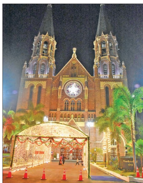
Saint Mary's Cathedral decorated with Christmas light in Bo Aung Kyaw Street, Yangon.