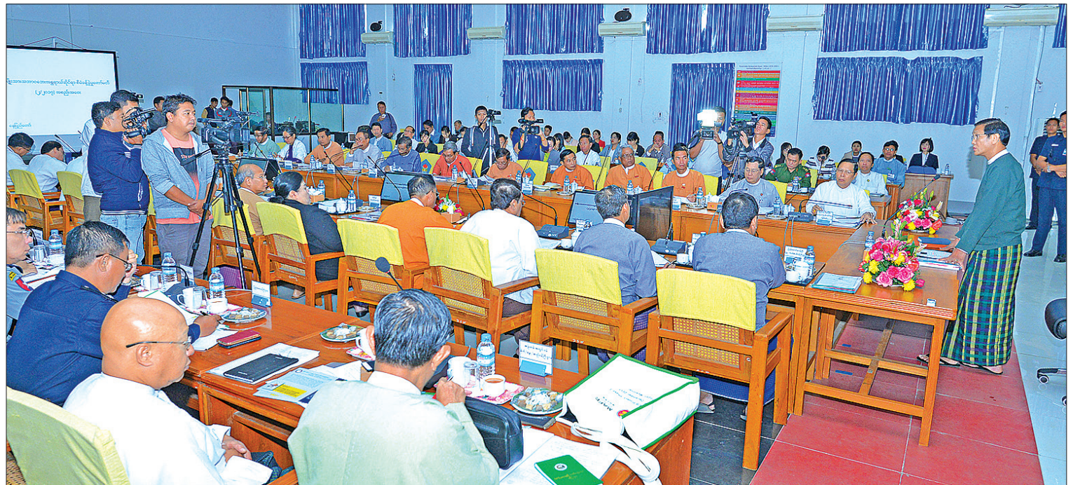
Vice President U Henry Van Thio addresses the Natural Disaster Management Committee meeting in Nay Pyi Taw.

At the national level, the Myanmar Action Plan on Disaster Risk Reduction (MAPDRR) is drawn according to Sustainable Development Goals (SDGs) and