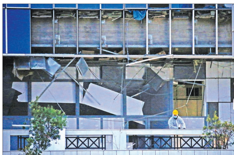
A police officer searches for evidence after a bomb blast at a Court building in Athens, Greece, on 22 December 2017.

Police were also investigating footage from