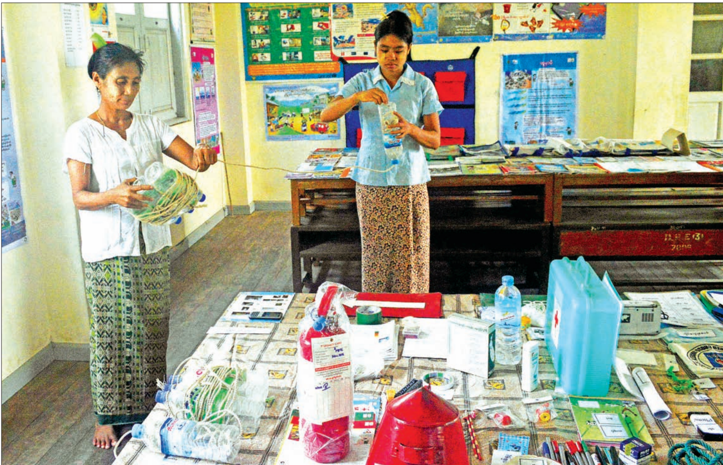
Local women demonstrate making life-saving flotation devices with empty water bottles and string at a ceremony to raise awareness of disaster preparedness in Yangon's southern area of Kungyangon, where Cyclone Nargis struck in 2008.