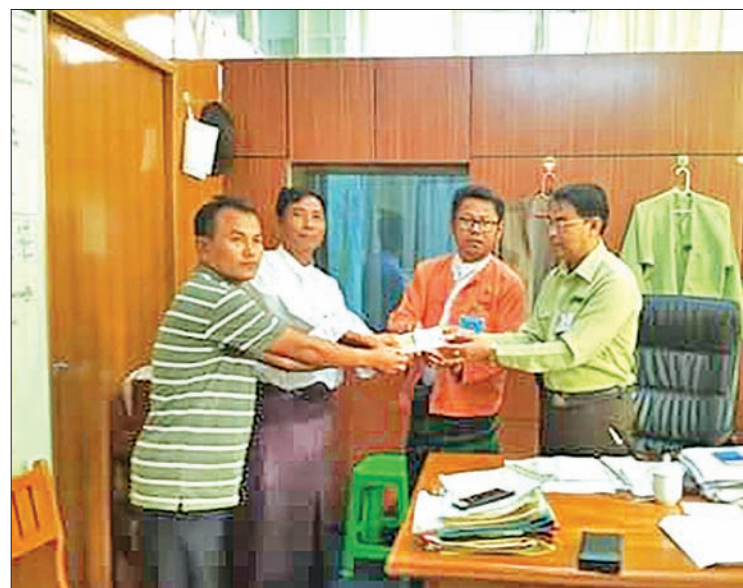
An official receives cash donation from a donor.

Remaining works of earth filling 49.58 acres in the zone, constructing a 1.8 mile hard surfaced road to Maungtaw, upgrading 1.55 miles of road in the zone, constructing 1.18 miles of brick wall to fence the zone, concrete surfacing of the loading/unloading yard and parking area, constructing two buildings for security personnel, rest room for workers and a store, installing a generator, setting up poles for power distribution and laying of distributing wires, and piping work for water distribution are underway.—Myanmar News Agency ■