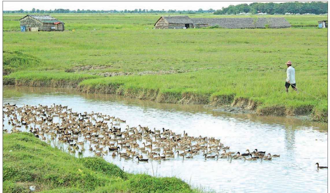
A farmer herding ducks in the creek.

"Ducks bred for eggs are fed broken rice and shrimp powder. Last year, the price for broken rice was Ks11,000 per bag, and