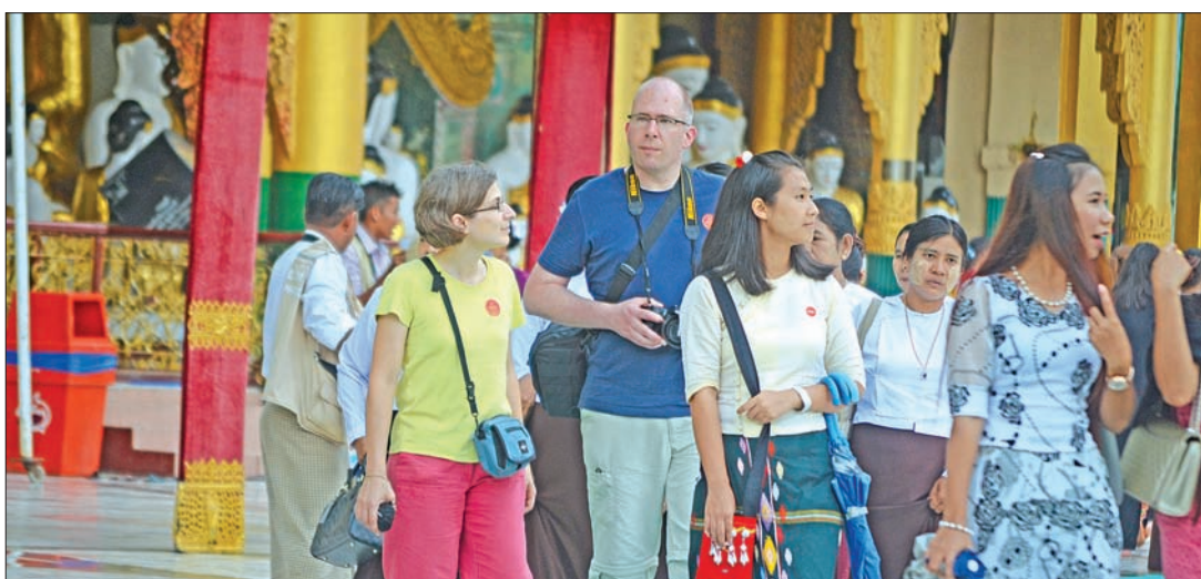
Tourists seen at Shwedagon Pagoda in Yangon.

From 1 April to 21 December, there were 703,419 day trip tourists who entered via the Tachileik border gate, 11,428 visitors of whom traveled to Maing Phat and Kyaing Tong. Tourist arrivals for those with a visa who traveled by air via Tachileik totalled 5,341.—GNLM ■