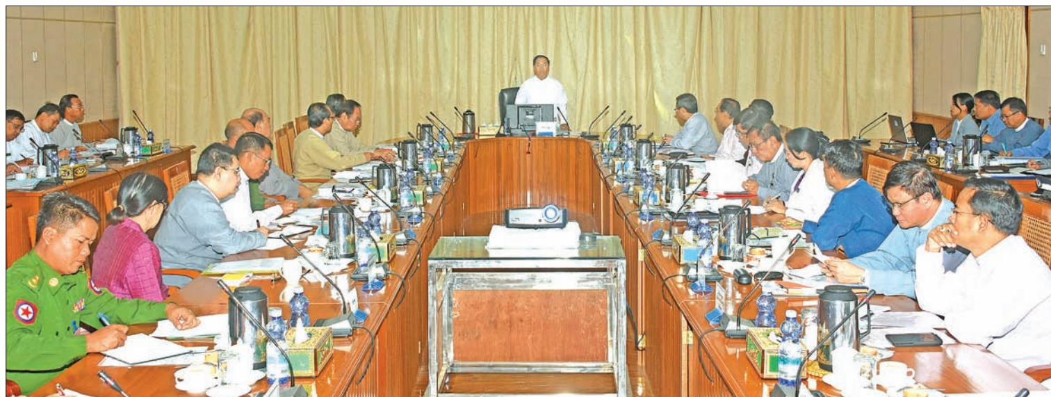
Chairman of the 2018 71st Anniversary of the Union Day Convening Central Committee Vice President U Myint Swe addresses the co-ordination meeting held on 22 December 2017.

Leaders of ethnic nationals led by Bogyoke Aung San met and held the Panglong Conference, signed the Panglong Agreement on 12 February 1947 and achieved independence. The day shows the firm unity of the ethnic nationals and Union Day was celebrated every year to reach the 71st Anniversary this time.