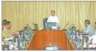
NATIONAL VP U Myint Swe attends coord meeting to hold 2018 Union Day PAGE-2