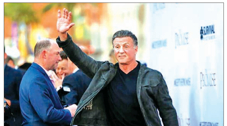
Actor Sylvester Stallone waves at the premiere of "The Promise" in Los Angeles, California, US, on 12 April 2017.

Rodriguez said the accusation could fall within California's complex statute of limitations for criminal prosecutions of sexual abuse. Offences must generally be prosecuted within 10 years. Stallone, 71, skyrocketed to fame in 1976 with his Oscar-winning boxing movie "Rocky" and went on to become one of Hollywood's biggest action stars through the "Rambo" and "Rocky" film franchises.—Reuters ■