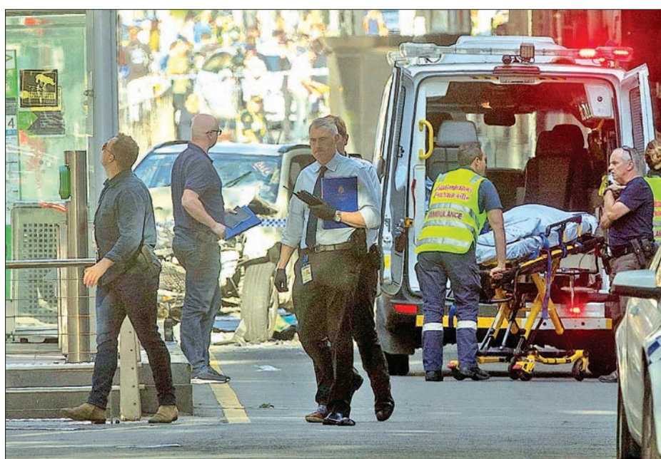
Australian police and paramedics are seen near the place where they arrested the driver of a vehicle that had ploughed into pedestrians at a crowded intersection near the Flinders Street train station, in central Melbourne, Australia, on 21 December 2017.

killed and more than 20 injured in January when a man deliberately drove