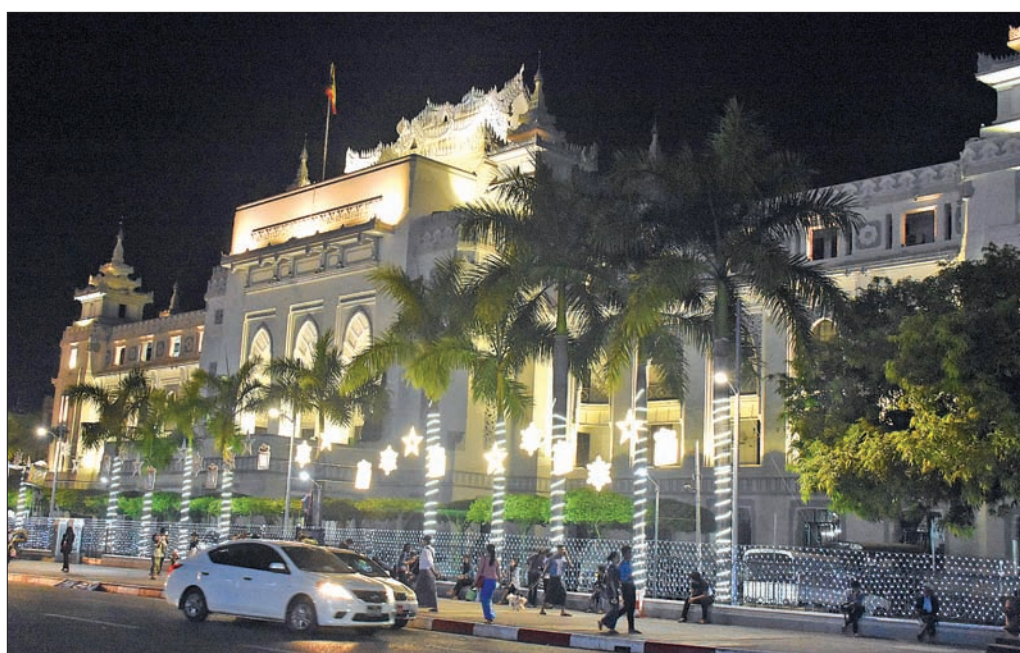
Christmas light installations seen in front of the City Hall in Yangon.