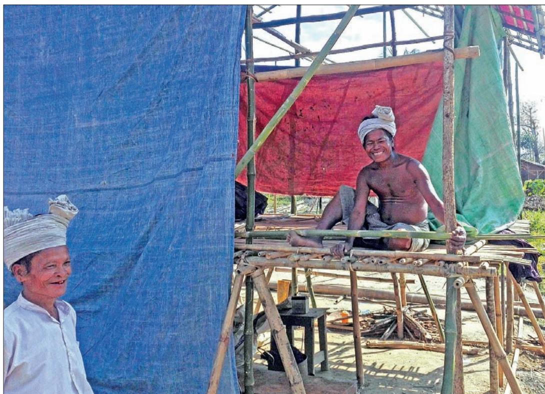
Mro ethnic men build their houses in Thit Tone Nar Kwa Sone Village.