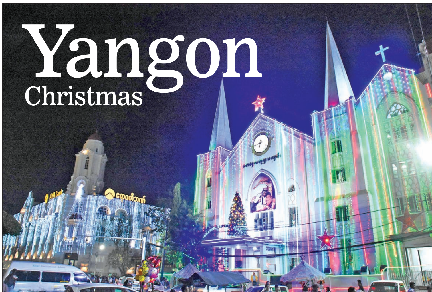
Immanuel Church is illuminated at night before the Christmas in Yangon on 22 December.