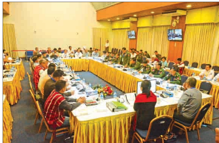
15 th Union Joint Monitoring Committee meeting being held in Yangon yesterday.

resentative and JMC-U Vice Chairman-1, said at the meeting that it is not only the EAOs that need to build trust, but also the local residents of each state.