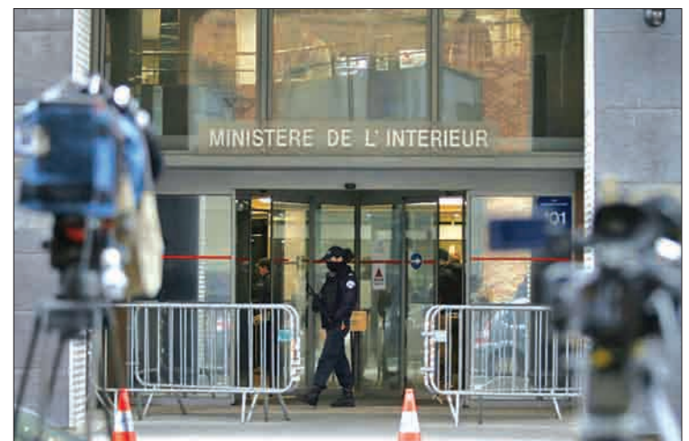
Sarkozy is being questioned at the bureau of officers specialising in corruption, money laundering and tax evasion in the western Paris suburb of Nanterre..

a Franco-Lebanese businessman admitted delivering three cash-stuffed suitcases from the Libyan leader in 2006 and 2007 as contributions towards Sarkozy's first presidential run.—AFP ■