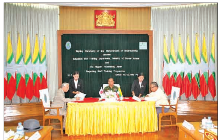
The signing ceremony of the Memorandum of Understanding between the Education and Training Department under the Ministry of Border Affairs and The Nippon Foundation of Japan on a staff training programme being held.

Now the foundation has an agreement to overtake launching the courses in 2018-2020 with the use of $600,000 in funding.—Myanmar News Agency ■