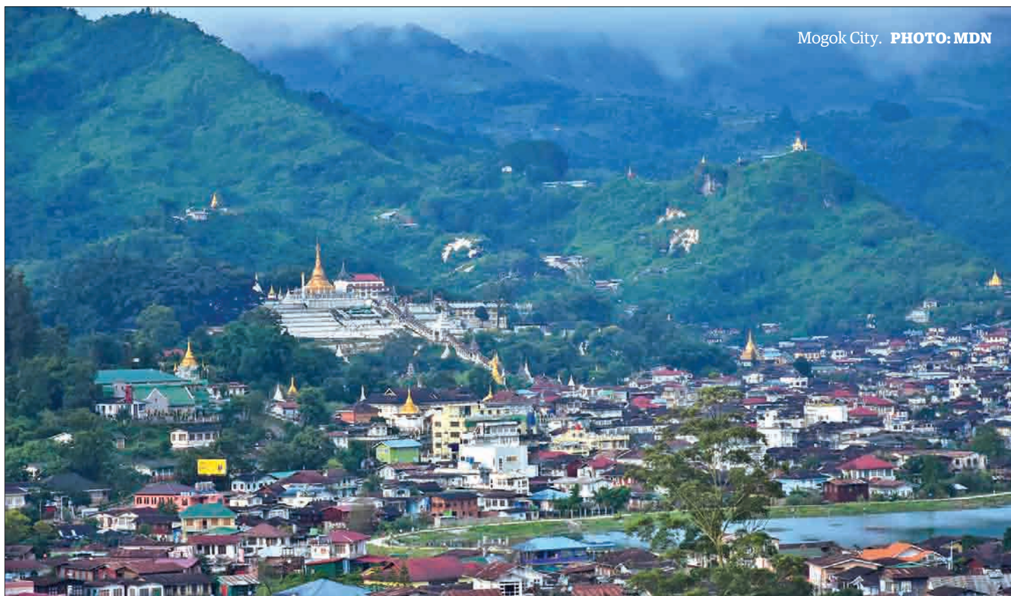
Mogok City.