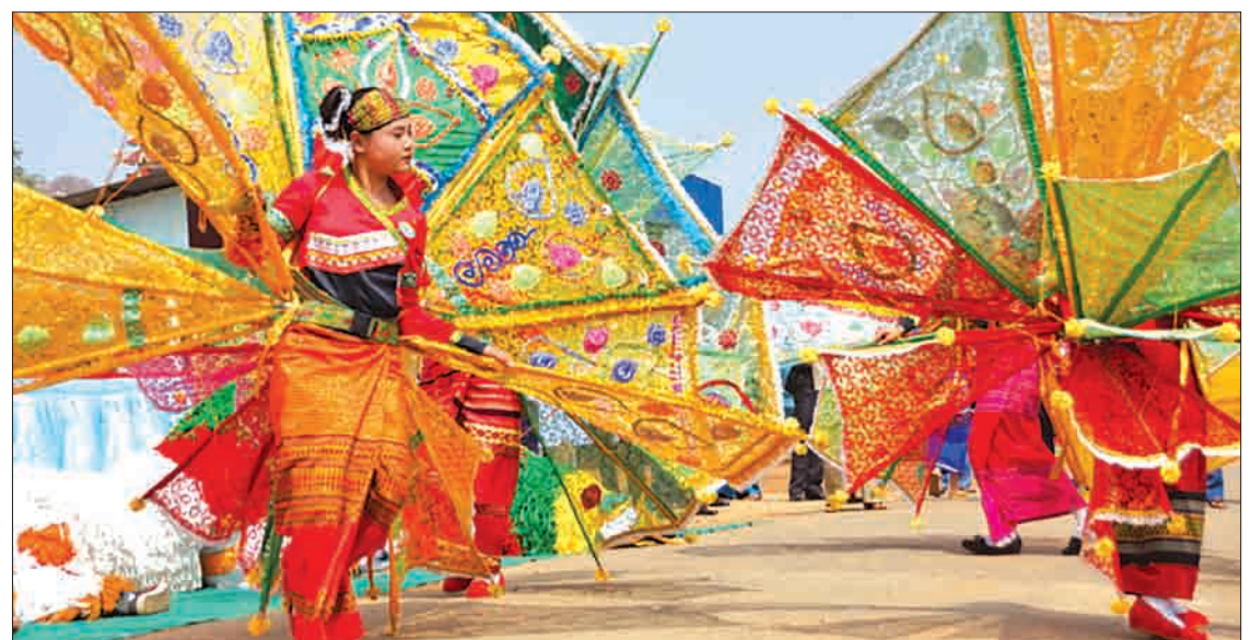
An ethnic dance troupe performs their traditional dance at the opening of the Ethnic Literature and Culture Development festival.

Arrangements were made to entertain the audience with musical concerts and the display of booths, entertainment and traditional food stalls at the fire balloon launching field in Taunggyi.—State IPRD