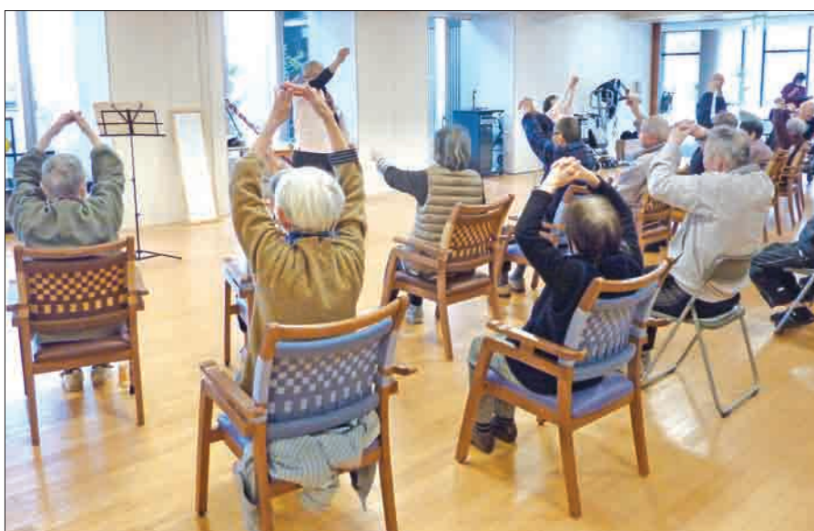
File photo taken on 7 March, 2018, shows senior citizens exercising in Funabashi, Japan. The country’s aging has reached a new level as a government estimate showed on 20 March that people aged 75 or older make up more than half of the elderly population.

Those aged 75 and older make up 14.0 per cent of the country’s entire population of 126.52 million, with 6.93 million being men and 10.77 million women, the data showed.