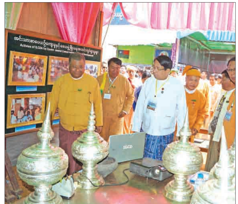
Union Minister Dr. Pe Myint visits the booth displaying hand made artifacts of Intha tribe.