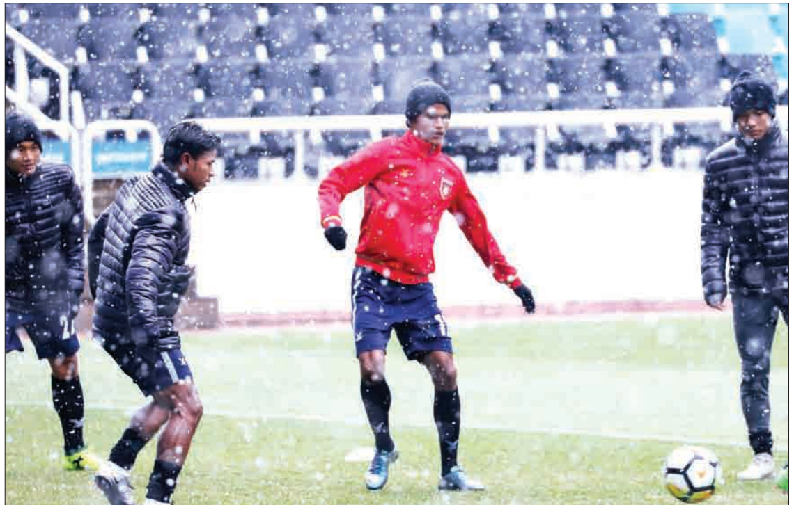
Myanmar national football team seen training in Incheon, South Korea.

A win today is essential in order for Myanmar to advance to the next stage, said an official from Myanmar Football Federation. ■