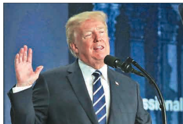
US President Donald Trump.

"An escalation of the trade conflict would damage international value chains and in the medium term threaten the international rules-based trading system," warned the German Council of Economic Experts — known as the "Wise Men" although one member is a woman. The economists highlighted other dangers in a regular report, including a disorderly British departure from the European Union, a tricky Italian election outcome dominated by populists, "geopolitical risks" from war and conflict and a financial crisis trigger-