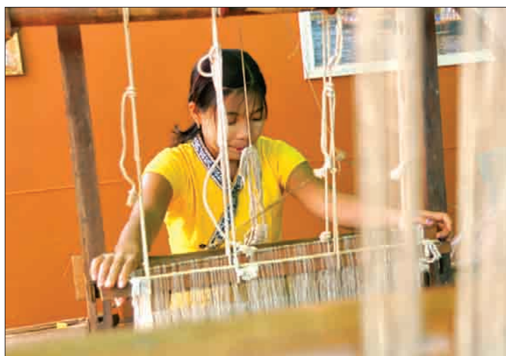
An ethnic woman demonstrates traditional weaving.