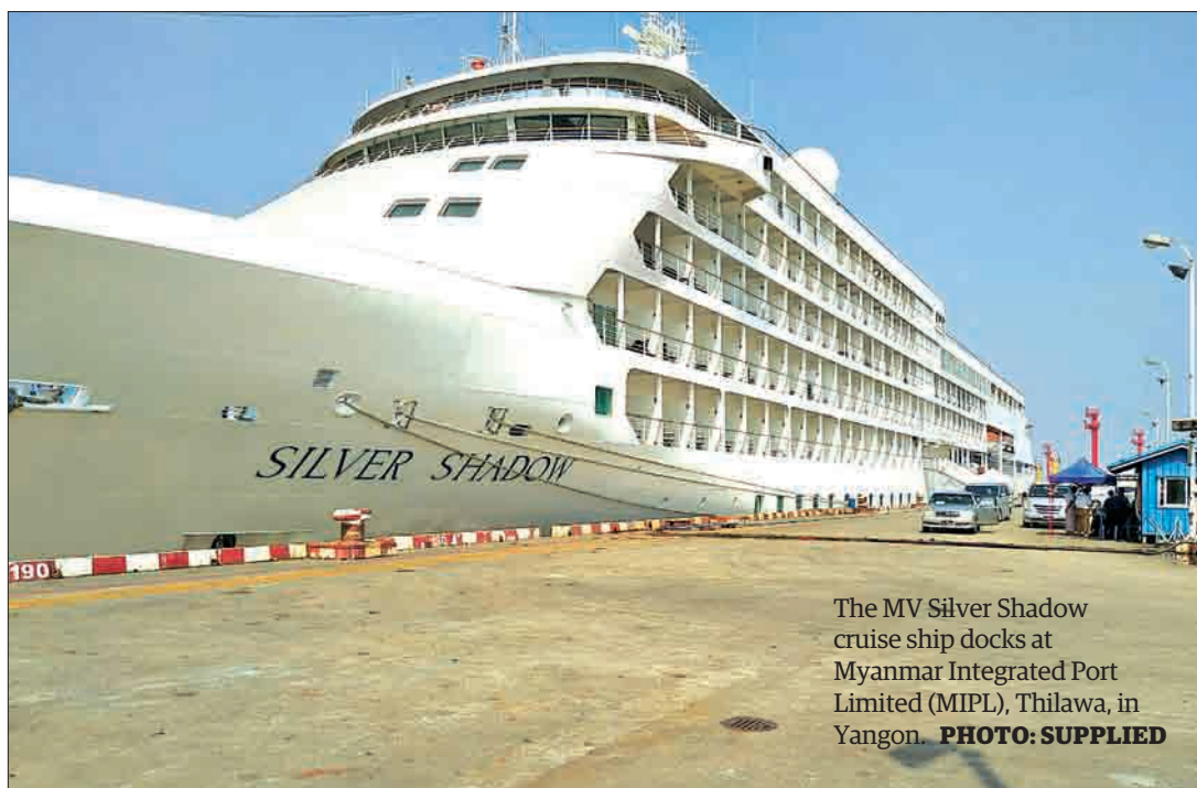
The MV Silver Shadow cruise ship docks at Myanmar Integrated Port Limited (MIPL), Thilawa, in Yangon.

Due to limitation of space we are only able to publish "Letter to the Editor" that do not exceed 500 words. Should you submit a text longer than 500 words please be aware that your letter will be edited.