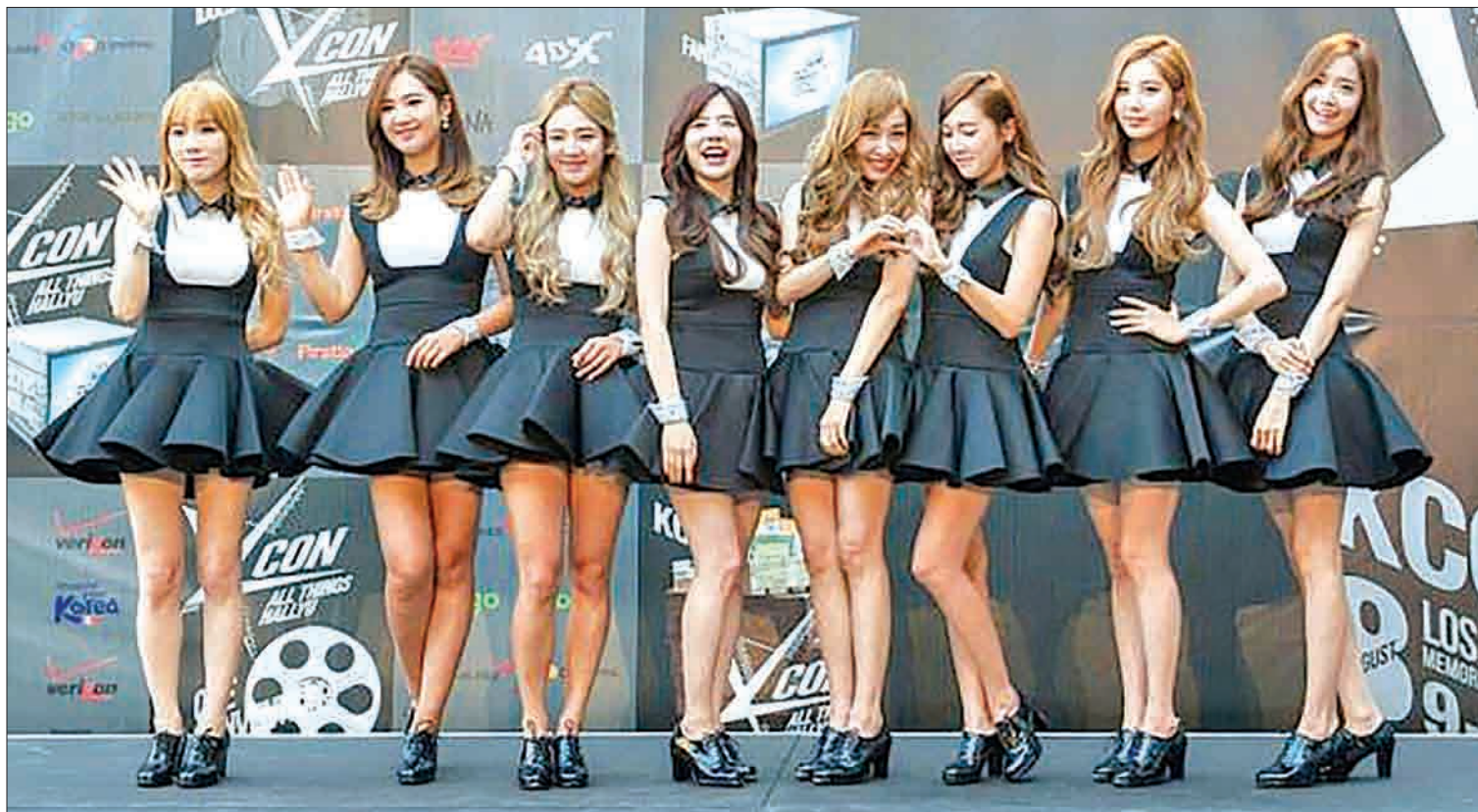
The performers will include K-pop group Girls Generation, seen here in the US in 2014.