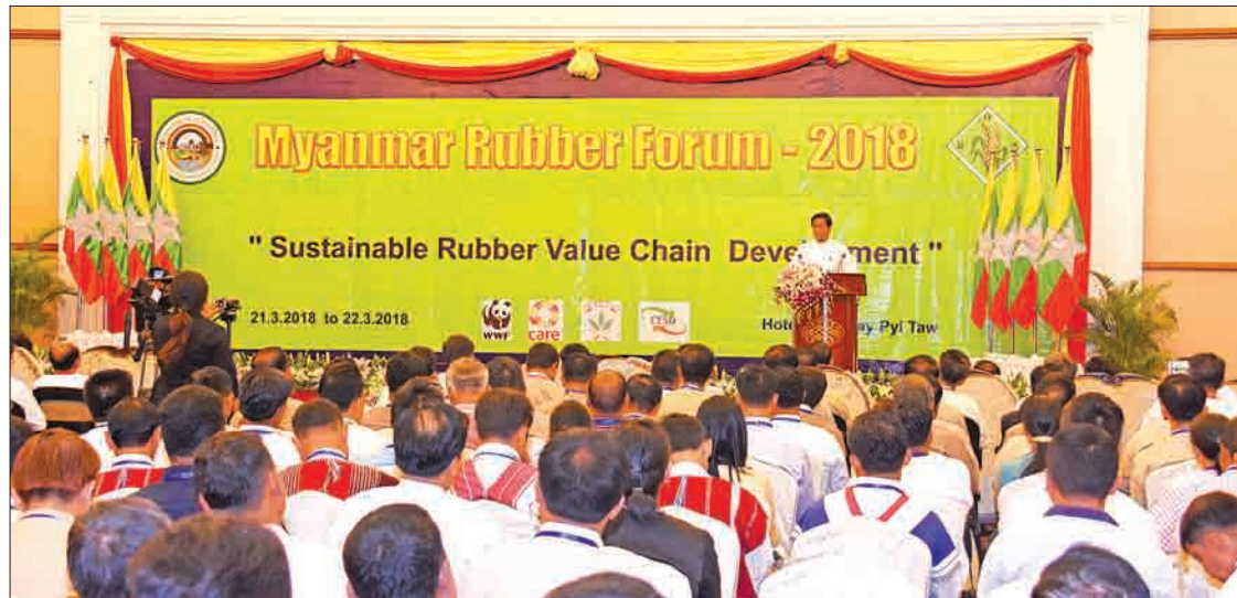
Vice President U Henry Van Thio delivers the speech at the Myanmar Rubber Forum 2018 in Nay Pyi Taw yesterday.

The Vice President said the government was supporting the development of the rubber indus-