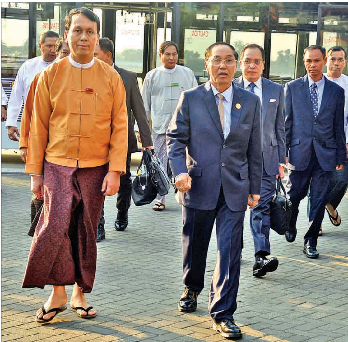
Vice President U Myint Swe is welcomed back at Yangon International Airport yesterday.