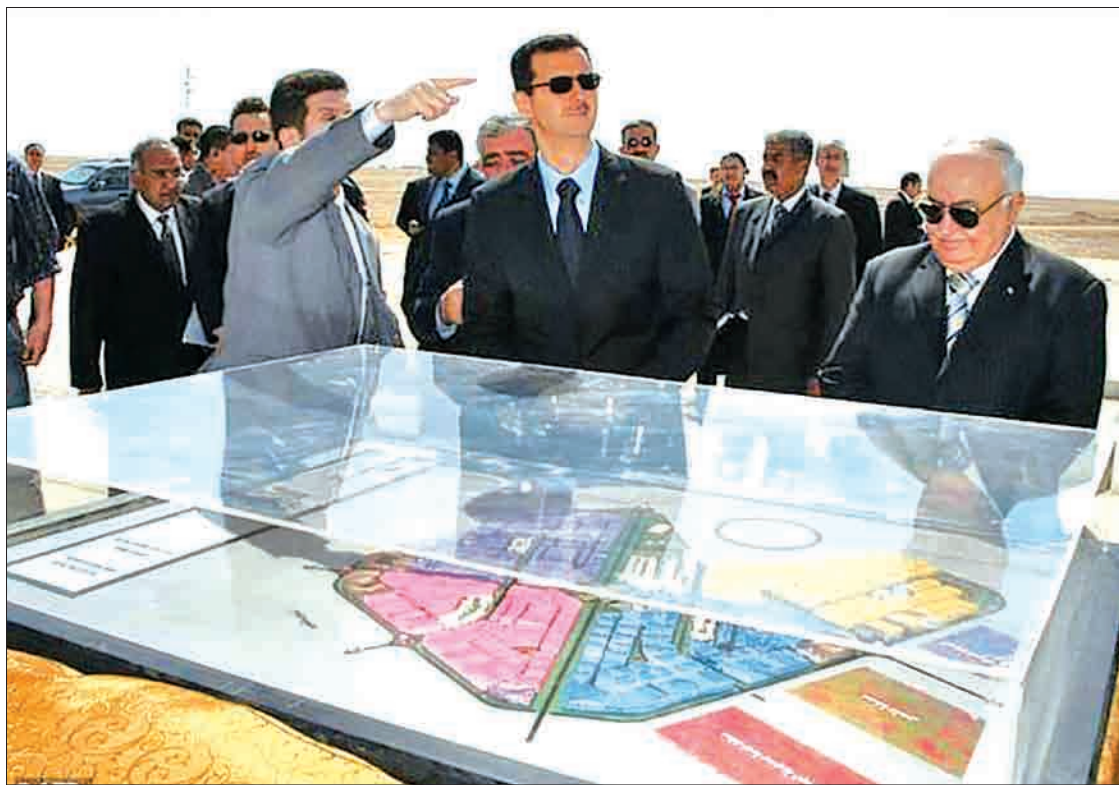
Picture released by the Syrian Arab News Agency (SANA) shows Syrian President Bashar al-Assad (C) looking at a project plan during a visit to Deir Ezzor in April, 2007. PHOTO: AFP

The declassified material includes footage of the strike, video of a speech by military chief of staff Gadi Eisenkot on the operation and pictures of secret army intelligence communiques about the site. A military statement summarising the operation lays out the case for why Israel carried out the strike at the desert site in the Deir Ezzor region of eastern Syria on what it says was a nuclear reactor under