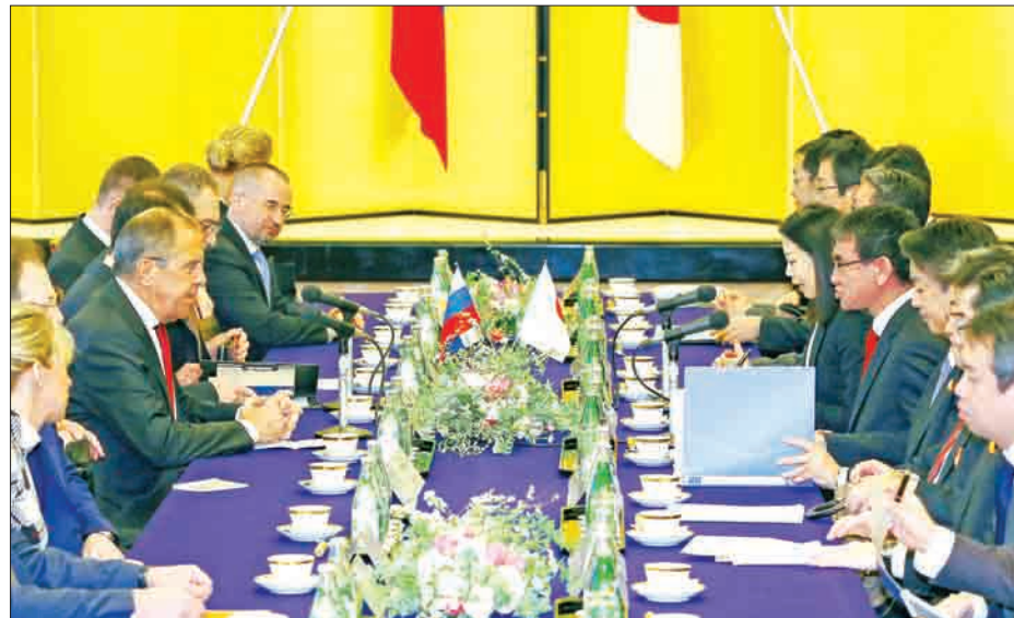
Japanese Foreign Minister Taro Kono (R) and Russian Foreign Minister Sergey Lavrov hold talks in Tokyo on 21 March, 2018.

Japan and Russia still need to work out the details of a special system that they have agreed is necessary in order for the projects not to compromise either side's legal position on the islands' sovereignty.