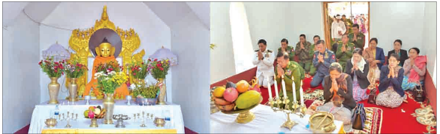
Senior General Min Aung Hlaing pays homage to Kaunghmulon pagoda in Kachin State yesterday.

After paying homage to the Kaunghmulon Pagoda, the Senior General and wife offered fruits, flowers, water and oil lights to the Buddha image of the pagoda. The Senior General and his wife then presented a cash donation to the Pagoda Board of Trustees. An official of the board returned a certificate of honour. After going round the pagoda clockwise, they viewed the environs of the Malikha River and the precinct of the pagoda. The