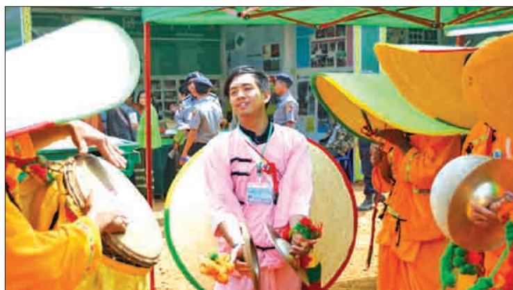
An ethnic troupe performs at the Ethnic Literature and Culture Development festival.