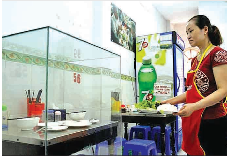
The glass-encased table where former US President Barack Obama sat with chef Anthony Bourdain at Bun Cha Huong Lien restaurant, now dubbed ‘bun cha Obama’, in Hanoi’s Old Quarter.

Pictures of Obama and Bourdain’s budding bromance over dinner — filmed for the chef’s CNN series “Parts Unknown”