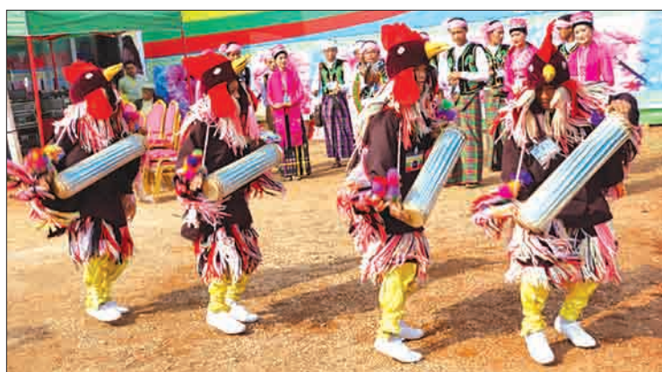
An ethnic dance troupe performs traditional dance at the opening of the Ethnic Literature and Culture Development festival.

UNION Minister for Information Dr. Pe Myint attended the Ethnic Literature and Culture Development festival and funfair at the Awaiyar Kone Myint Tharyar grounds in Taunggyi, Shan State, yesterday morning.