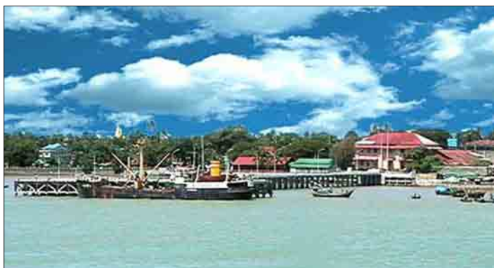
Sittway port in Rakhine State.

From April 2017 to early February 2018, some 3 million tonnes of rice and broken rice, worth $948 million, were exported to foreign trade partners. Also, 4 million tonnes of rice are expected to be shipped by 2020. Therefore, the MRF wants more