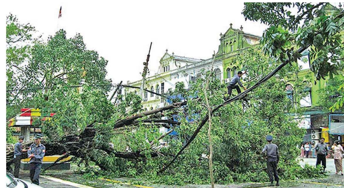
Overtaken trees litter a street in Yangon on 4 May, 2008 after tropical cyclone Nargis tore through swathes of the country, battering buildings, sinking boats and causing unknown casualties.

Occasional squalls with rough seas will be experienced off and along the Myanmar coast. Surface wind speed in squalls may reach 40 mph. The wave's height will be some 9-14 feet off and along the Myanmar coast.—GNLM ■