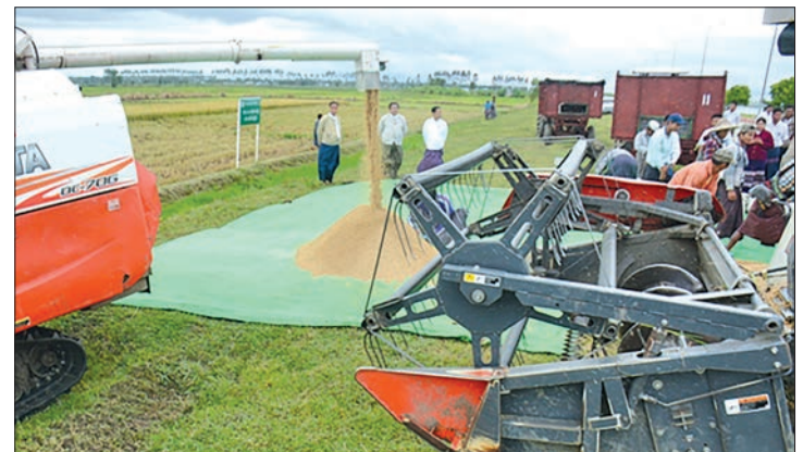
Union Minister Dr Aung Thu and officers inspect harvesting paddy in Nay Pyi Taw yesterday.

Later, the union minister received United States Department of Agriculture Under-Secretary Mr. McKinney and party at the union minister's meeting hall and discussed matters relating to information on assessing and calculating the danger of pests in trading plants and plant products and increasing the exports of Myanmar agriculture products.—Myanmar News Agency ■