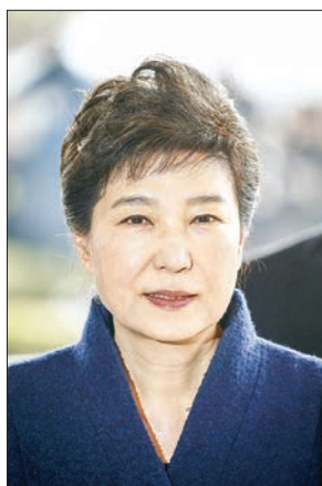
Former South Korean President Park Geun Hye.

Friday's Seoul Central District Court ruling consists of six-year imprisonment and 3.3 billion won in penalties over the slush funds from the National