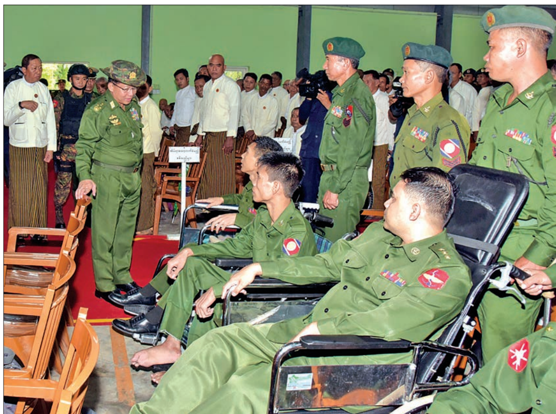
Senior General Min Aung Hlaing greets veterans in the Hmawbi cantonment hall, Yangon Command, yesterday.