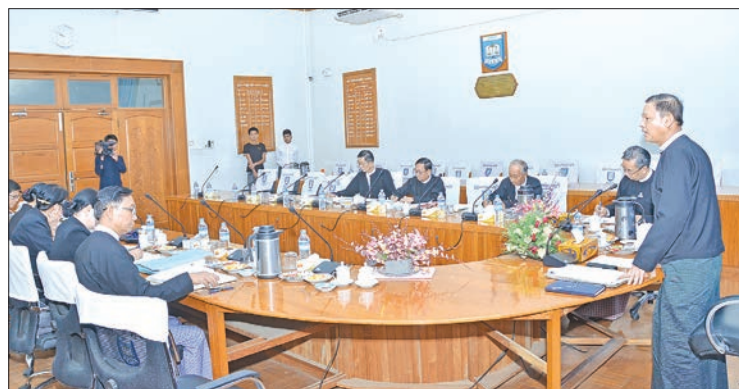
Union Attorney-General U Tun Tun Oo delivers the speech at the meeting of Supreme Court Bar Council yesterday.

As such, the Bar Council Act is being drawn up to make it more appropriate to the times. According to the new bill, the role of advocates will be expanded. In order to support the drawing up of the new bill, the current Bar Council Act was translated and announced on