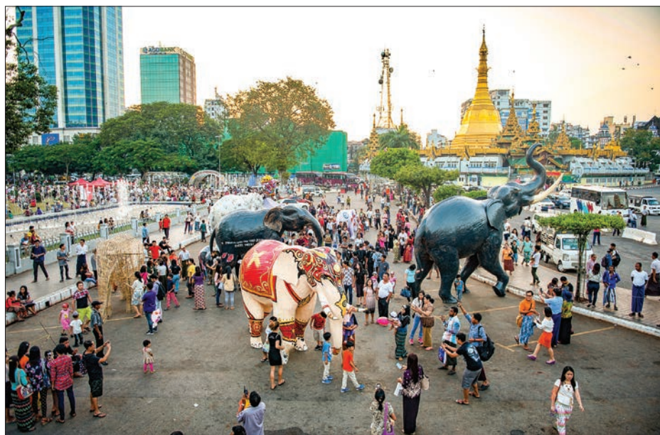
People enjoy elephant sculptures displayed at Maha Bandoola Park near Sule Pagoda in downtown Yangon.

At the public event, the artists created four