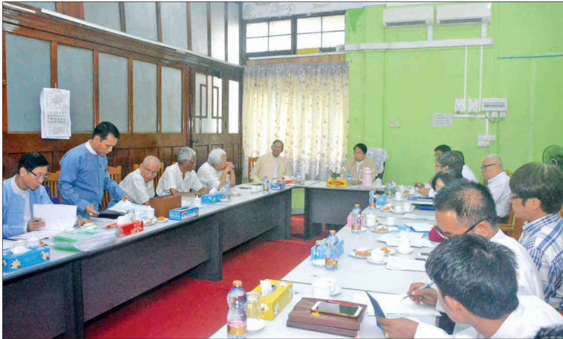
Union Minister Dr Pe Myint attends the meeting for publishing and distribution of the 100 Myanmar Classics series in Sarpay Beikman, Yangon yesterday.

UNION Minister for Information Dr. Pe Myint attended a meeting in Sarpay Beikman, Yangon, yesterday morning to discuss the speedy publishing and distribution of the 100 Myanmar Classics series.