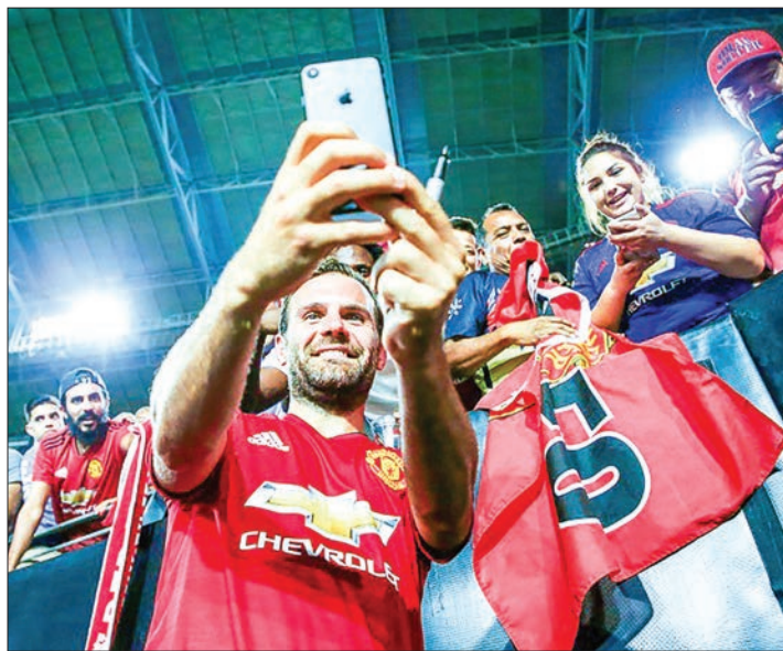
Juan Mata of Manchester United takes photos with fans after their International Champions Cup game against the Club America, at the University of Phoenix Stadium in Glendale, Arizona, on 19 July 2018.