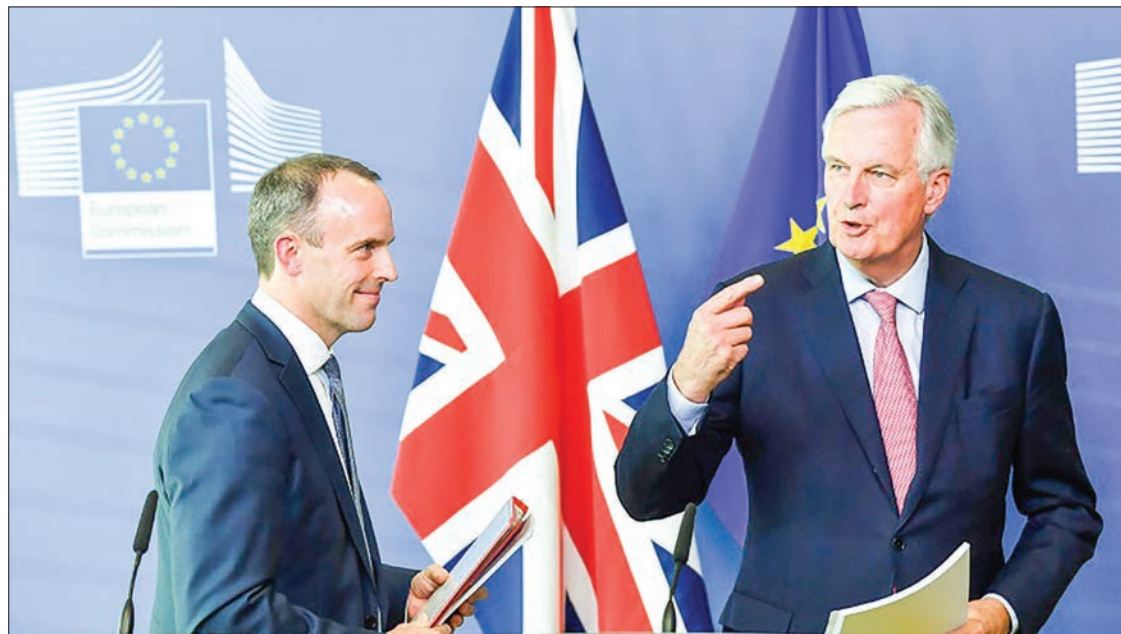
EU Chief Brexit Negotiator Michel Barnier (R) and Britain's Secretary of State for Exiting the European Union (Brexit Minister) Dominic Raab together in Brussels.

Brexit minister David Davis and foreign minister Boris Johnson may actually help in persuading Brussels to take her plan seriously. “It allows her credibly to turn around to the EU and say I’m taking these people on and I need some help,” he told AFP.