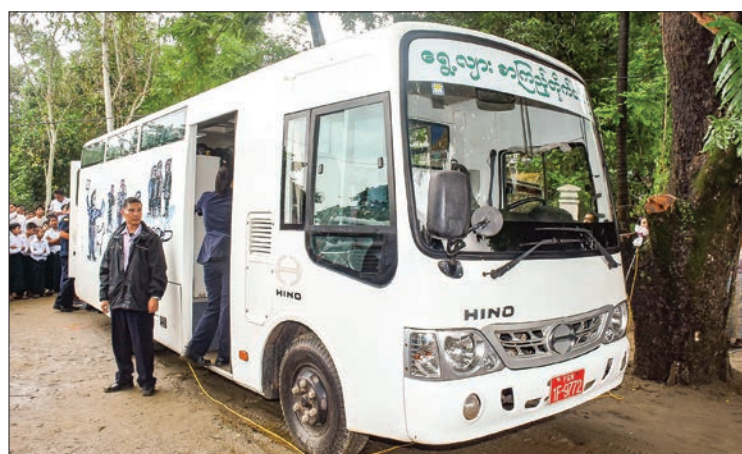
The Daw Khin Kyi Foundation mobile library.

tunities to do good things, but if responsibility is not taken it will affect the administration. The administrative sector will not fully know the situation and views of the people if the Hluttaw representatives do not relay them to the administrative sector. It is important to have mutual respect, understanding and the assuming of responsibilities. At the same time, despite the submission of the Hluttaw representatives, there will be prob-