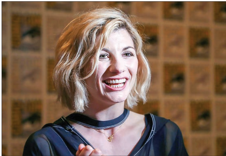
BBC America's "Doctor Who" At Comic-Con International: San Diego 2018.

to a brief glimpse of Whittaker, walking towards the Tardis in a forest, in a clip shown after the Wimbledon tennis final on BBC television.