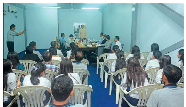
Deputy Minister U Aung Hla Tun meets with GNLM officials in Bahan Township, Yangon yesterday.

Next, GNLM officials, the editorial team and staff discussed the requirements and the deputy minister coordinated over the discussion.—Myanmar News Agency ■