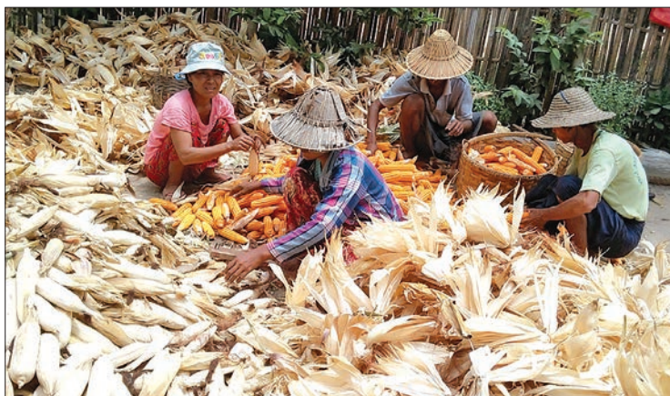
Maize growers in Pobbathiri Township.

Maize export was registered at 1.1 million tons worth over US$300 million in the 2015-2016 fiscal year, 1.2 million tons worth $250 million in the 2016-2017 FY, 900,000 tons worth $287 million in the 2013-2014 FY and 600,000 tons worth $200 million in the 2012-2013 FY. — Zar Lin Thu (AMIA) ■