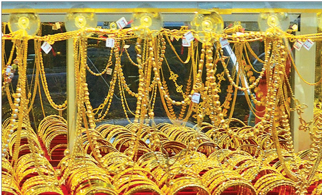
Gold jewellery displayed at a shop in downtown Yangon.

"Previously, the domestic gold price used to be proportionately related to the global gold price. However, the local gold price has not fallen as much as it was expected to. The US dollar appreciating against the kyat might be the reason for a small dip in the local gold market," said U Ohn Myaing from MGEA. The global gold price was recorded at US$1,255 per ounce last week and it fell to $1,227 per ounce on 18 July. Meanwhile, the domestic gold price was recorded at its highest rate of Ks948,500 per tical (16.4 gm) last week and the price dropped to Ks945,500 per