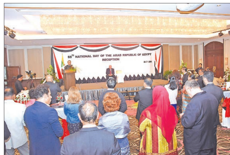
Union Minister Dr Than Myint delivers the speech at the 66 th National Day of Egypt reception in Yangon yesterday.

Present at the event were ambassadors and persons responsible from embassies in Yangon, United Nations representatives and invited guests.— Myanmar News Agency ■