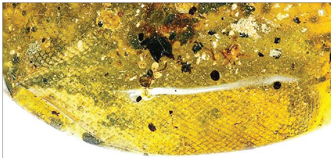
The amber also contained a fragment of snakeskin with thin diamond-shaped scales.

"Compared with other fossilised vertebrates, snake fossils are very rare because the bones of most snakes are not very hard.