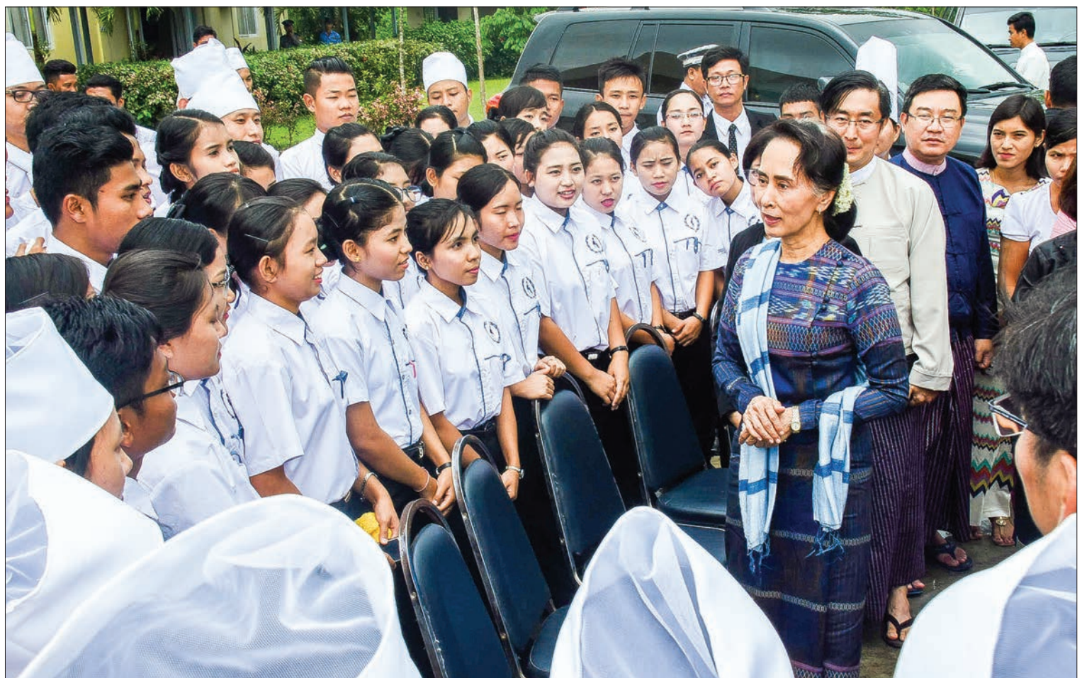
State Counsellor Daw Aung San Suu Kyi meets with trainees at Hospitality and Catering Training Academy in Magyikan Village, Kawhmu Township yesterday.

In her opening address, State Counsellor Daw Aung San Suu Kyi said the roles of Hluttaw representatives and administrative sectors are not the same, though they need to work together. Hluttaw representatives are the bridge connecting the administration and the public. There will be oppor-