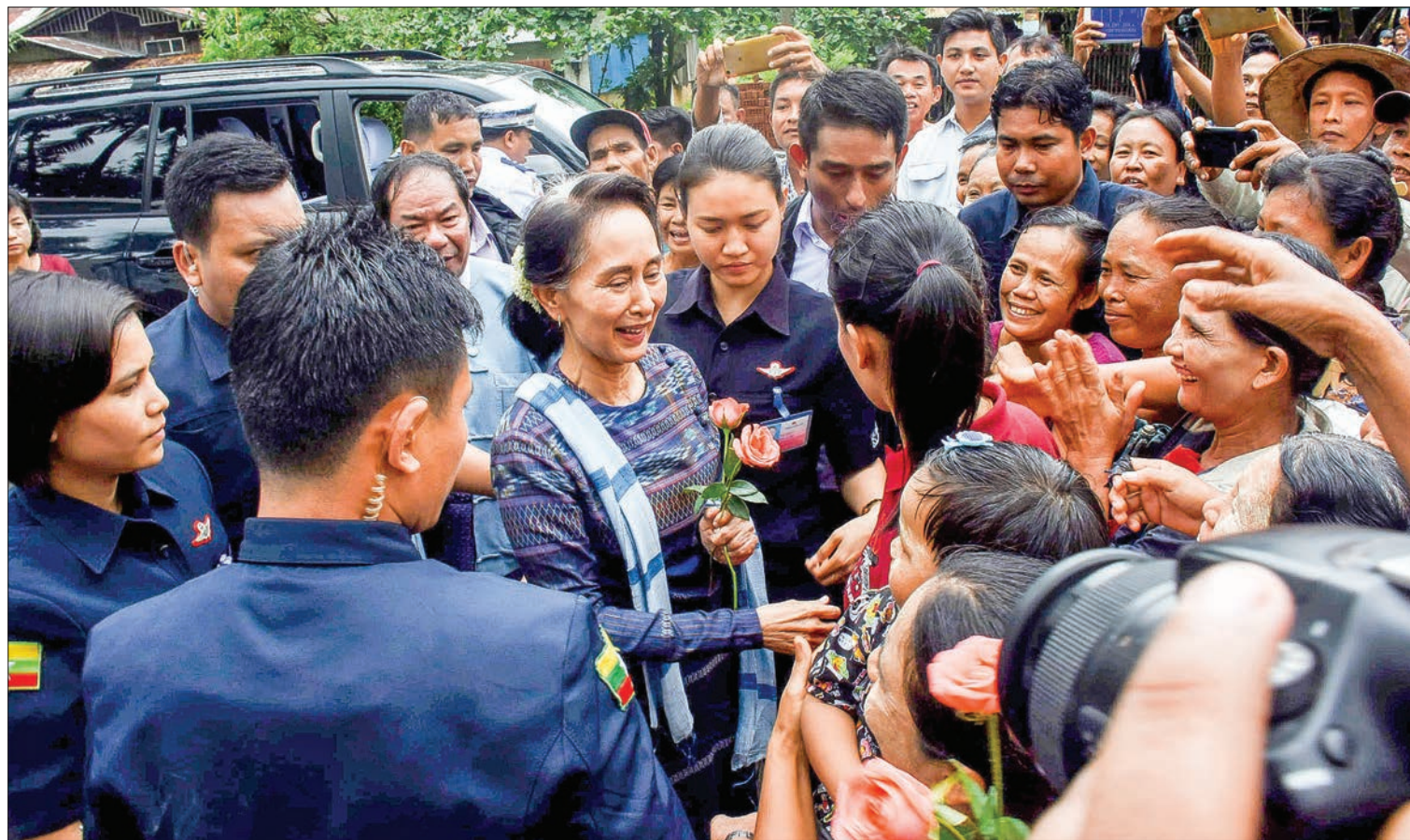
State Counsellor Daw Aung San Suu Kyi arrives at Patope Basic Education Post Primary School in Kawhmu yesterday.

In the government, there are fewer than 30 ministers. But at the grassroots level, there are many administrative personnel who are in contact with the people. Only when the administrative personnel are honest and the public has no suspicion of corruption, can the country be a dignified and developed country. It is easy to take action against