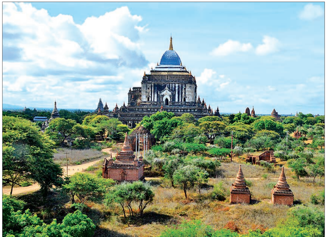
A file photo shows a temple in Bagan, one of the most famous tourist attractions in Myanmar.

or Method measurement, the composition of the soil, hardness, softness, resonance frequency of the ground, as well as the structure on it will be known and when there is an earthquake, the ability of a structure to withstand it can be estimated.