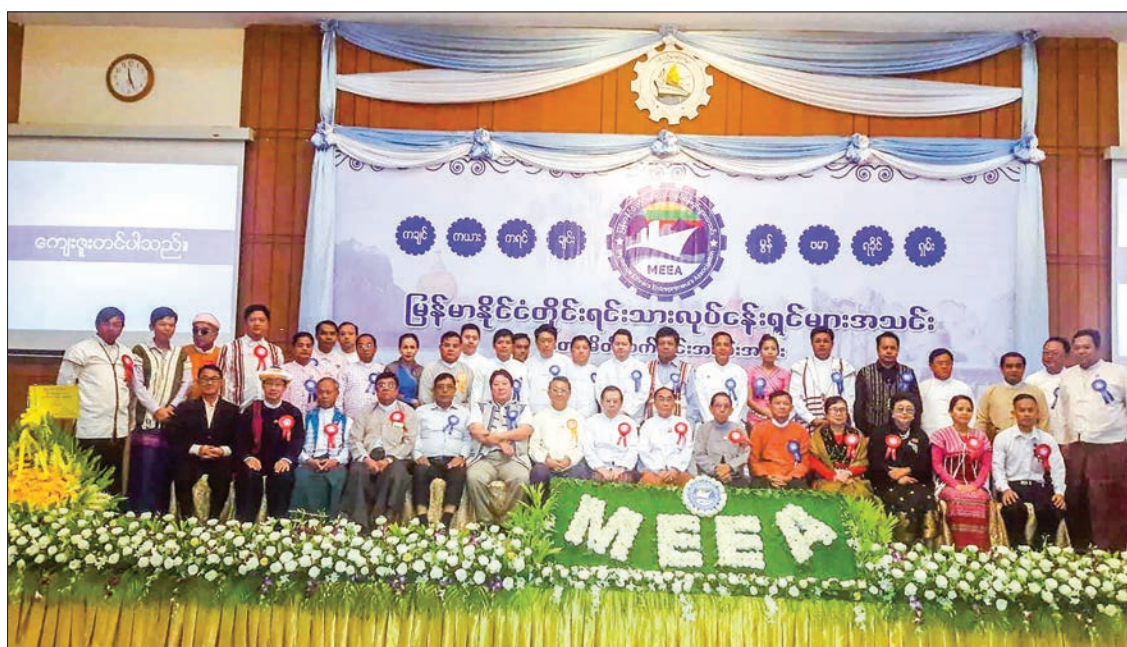
Union Minister Nai Thet Lwin poses for a photo together with attendees at the workshop to promote Public Private Partnership (PPP) in Yangon.

He added that PPP programmes are part of the business programmes for peace, and peace and development are related to each other and cannot be