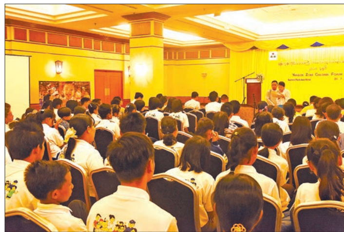
Officials from Yangon Region Social Welfare Department and World Vision Myanmar hold Yangon Zone Children Forum in Yangon.

Attendees discussed current matters of the children, including education, health, future professions and relation-