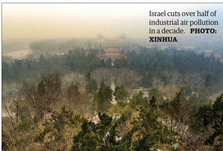
Israel cuts over half of industrial air pollution in a decade.

The Clean Air Law included strict regulations to reduce pollution from companies, industrial plants and power stations. A total of 145 polluters have been continuously inspected in the last decade. The regulation focused on