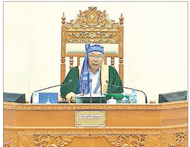
Speaker of Pyidaungsu Hluttaw Mahn Win Khaing Than.

Later, Union Minister for Home Affairs Lt-Gen Kyaw Swe urged the Pyidaungsu Hluttaw to approve the memorandum of understanding between ASEAN and Australia for cooperation in fighting international terrorism, sent by the President.