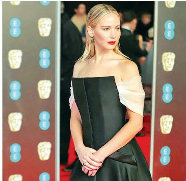
US actress Jennifer Lawrence was among the stars to wear black at the British Bafta awards in solidarity with the #Metoo movement.

French Culture Minister Francoise Nyssen said film producers had a huge "responsibility to fight stereotypes, discrimination and harassment" both on