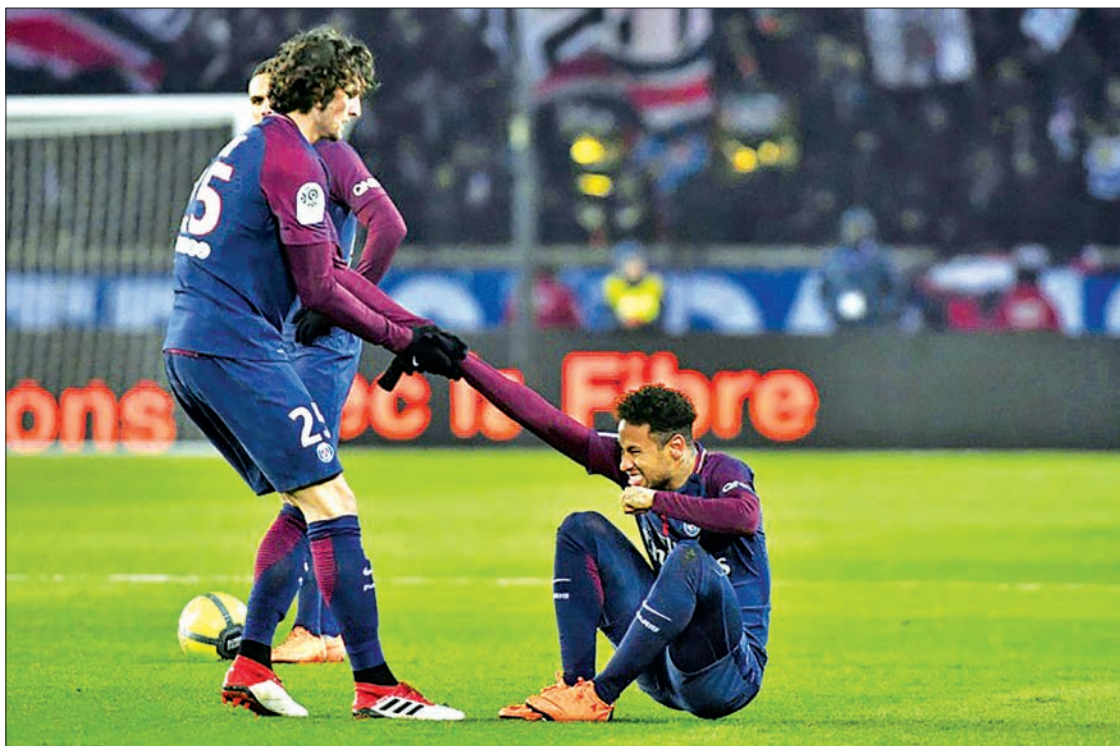
Neymar is helped to his feet by Adrien Rabiot during PSG's win over Marseille on Sunday, in which he suffered a twisted ankle and a hairline metatarsal fracture.

as he was stretchered off the field at the Parc des Princes, immediately raising fears that the 26-year-old could miss the Champions League last 16, second leg against Madrid.