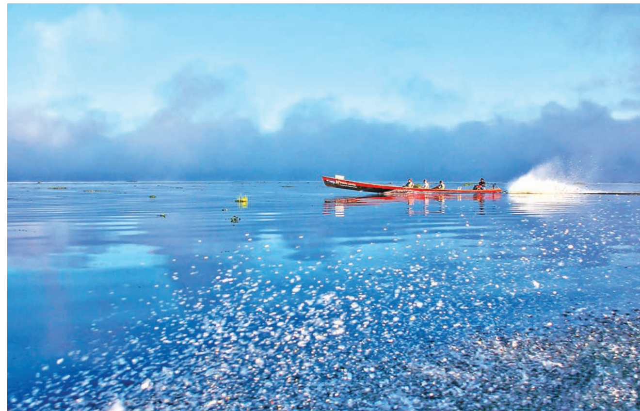
A boat runs at Inle Lake in Nyaungshwe Township, Shan State.

Fauna species are diverse and, the lake is a nesting place of the sarus