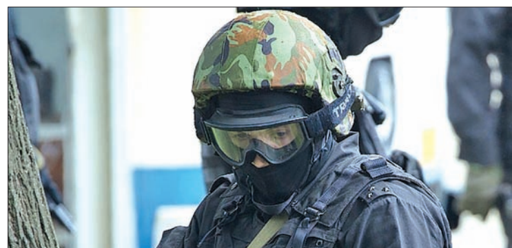
The activity of more than 50 terrorist cells was quashed, 1,060 militants were detained.

"Last year more than 80 persons were prevented from leaving Russia for participation in terrorist activities. A firm obstruction has been placed to minimize this flow," he said.—AFP ■