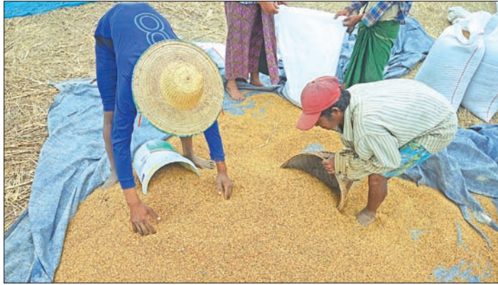
Foreign investors have criticised the slower economic development in the country, attributing it to weak infrastructure and policy requirements.