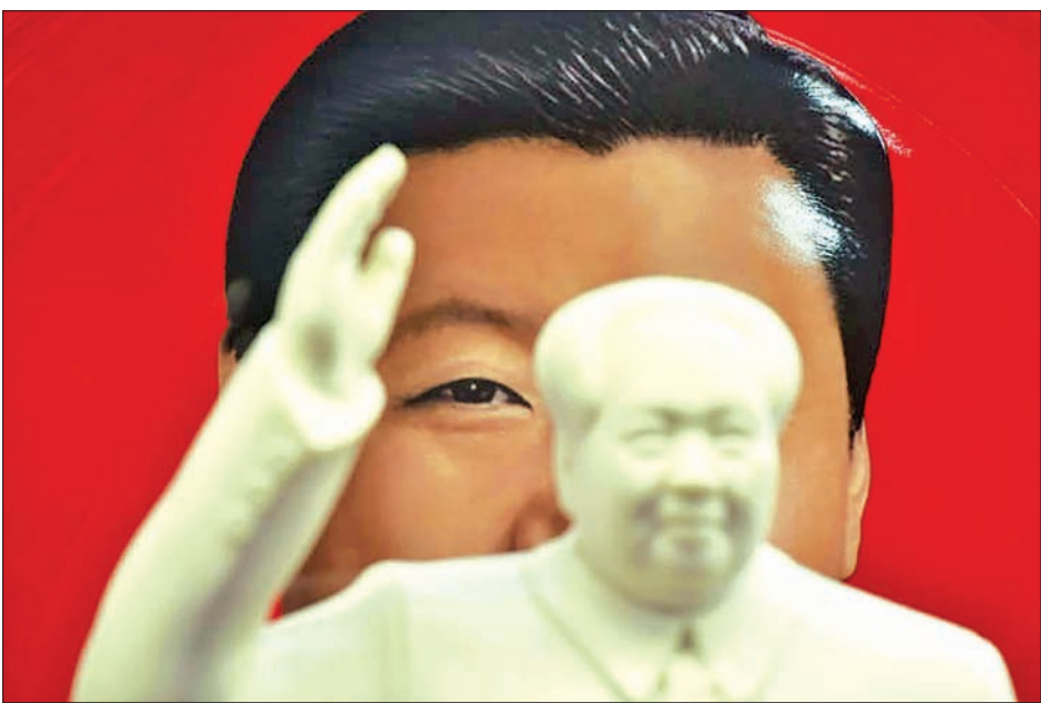
While some say removing term limits will allow Xi Jinping to push through key reforms, there are fears about one-man rule, with the horrors of Mao Zedong’s Cultural Revolution and Great Leap Forward still remembered by many in China.