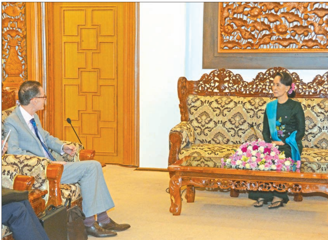
State Counsellor Daw Aung San Suu Kyi receives Australian Ambassador Mr. Nicholas Coppel at the Ministry of Foreign Affairs in Nay Pyi Taw yesterday.

on 28 February 2018 at the Ministry of Foreign Affairs, Nay Pyi Taw. During the meeting, they discussed matters on promotion of bilateral relations and cooperation between Myanmar and Republic of Korea.—Myanmar News Agency ■