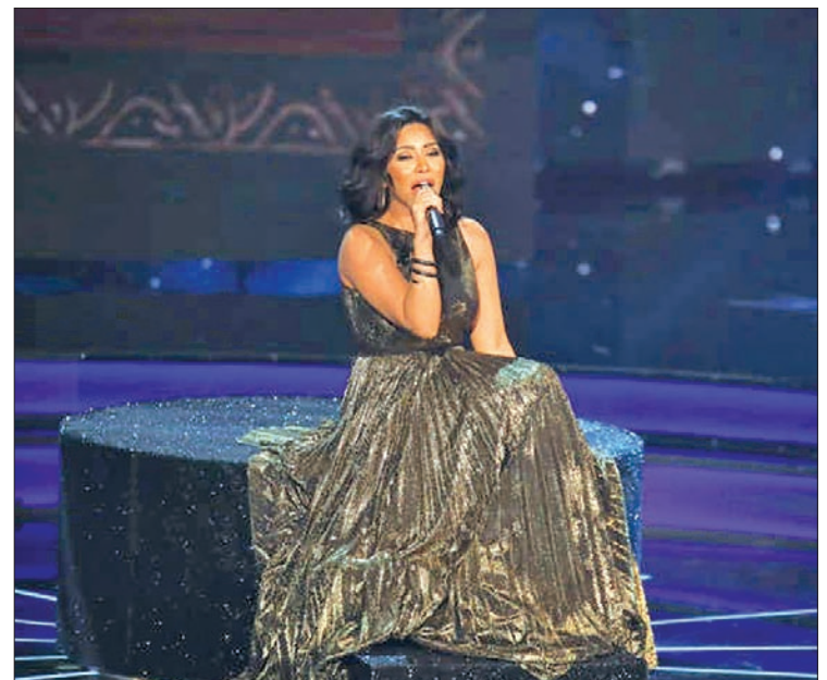
Egyptian singer Sherine Abdel Wahab performs on stage during the final show of the pan-Arab song contest "Arab Idol" on 25 February, 2017 in Lebanon.