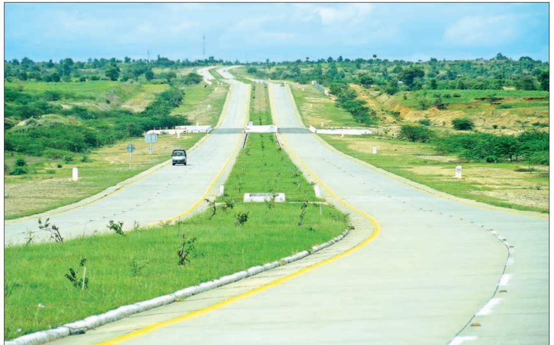
File photo of the Yangon-Mandalay highway.

"The highway traffic police are also providing awareness training about road safety measures on the Yangon-Mandalay