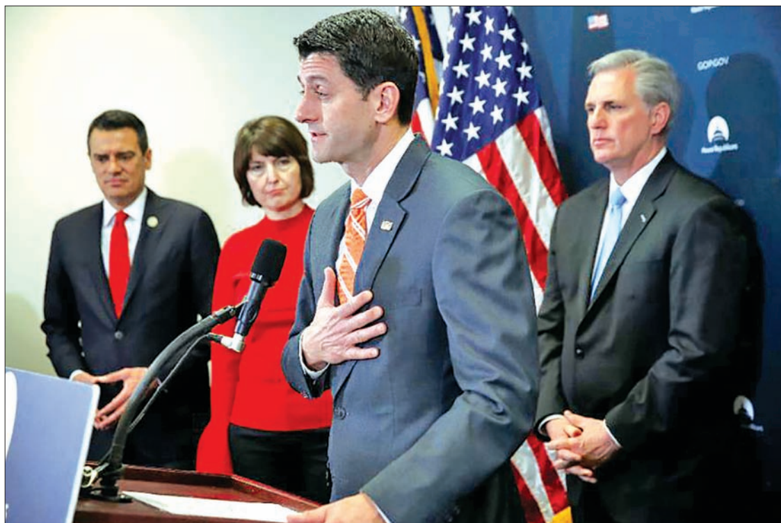
House Speaker Paul Ryan says no to a ban on guns "for law-abiding citizens".

"There was a colossal breakdown in the system locally," Ryan said, citing lapses by the FBI and a deputy sheriff accused of failing to act when shooting broke out at the school. Ryan's argument echoed that of Trump, who asserted on Monday that he would have charged into the school after