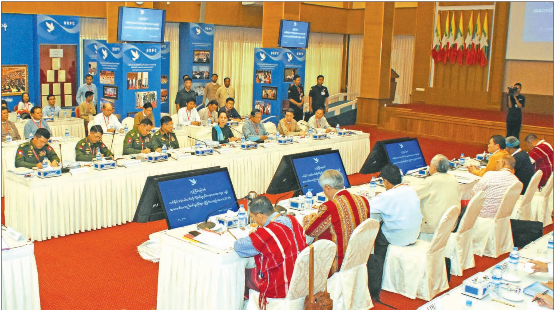
State Counsellor Daw Aung San Suu Kyi delivers a speech at the 7 th Joint Implementation Coordination Meeting on the NCA in Nay Pyi Taw yesterday.