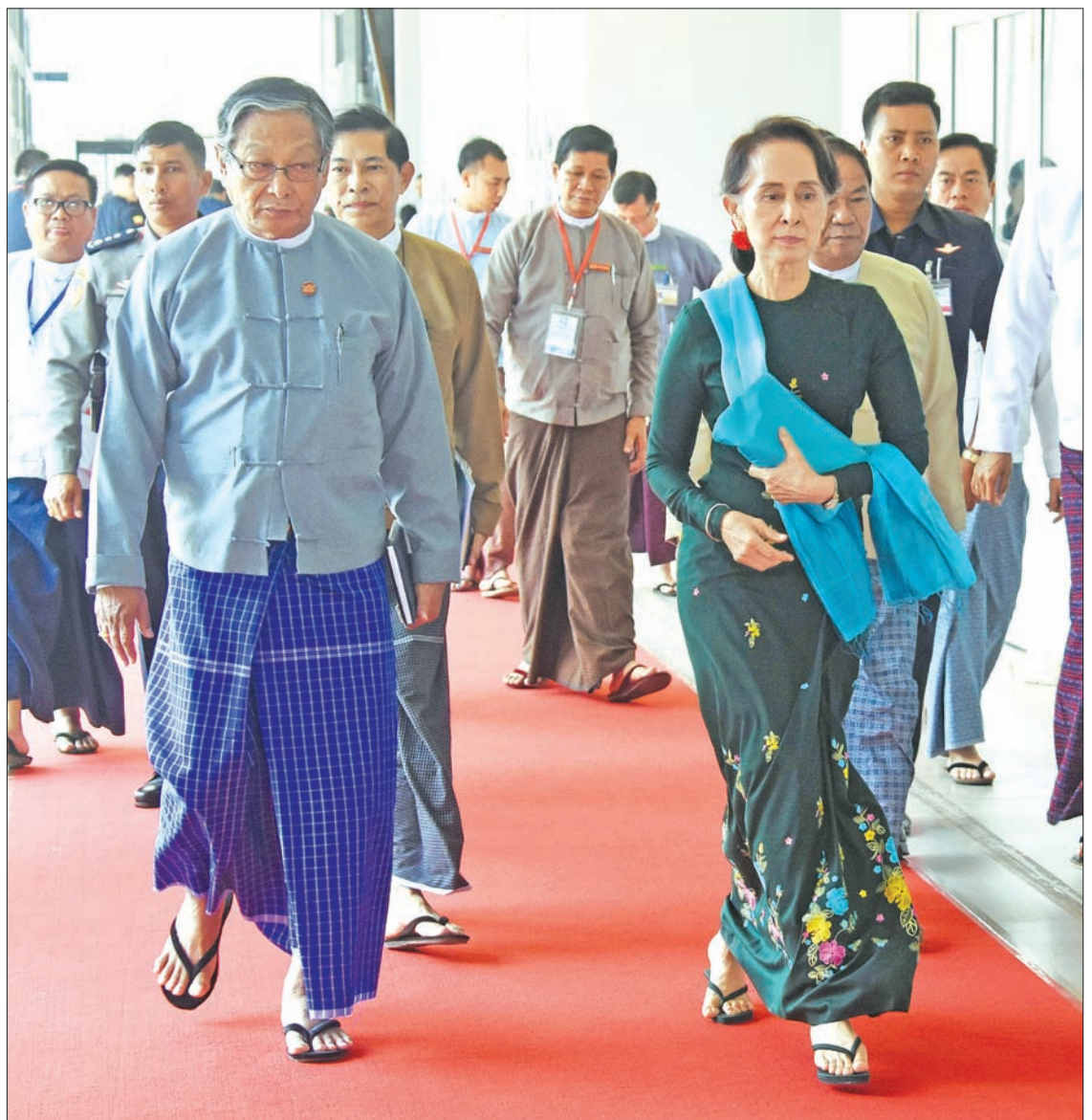
State Counsellor Daw Aung San Suu Kyi arrives to attend the 7th Joint Implementation Coordination Meeting on the Nationwide Ceasefire Agreement in Nay Pyi Taw yesterday.

He also stressed the importance of inclusiveness in making efforts for building a Democratic Federal Republic.—MNA ■