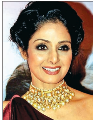
Sridevi took a 15-year break from the silver screen after marrying but returned in the 2012 hit comedy-drama "English Vinglish".

Sridevi's body is due to leave the ground at 2:00pm to embark on its final journey. She will be cremated at a private Hindu ceremony later on Wednesday.