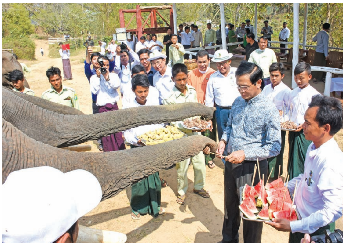
Vice President U Henry Van Thio feeds elephants as he visits the Phoe Kyar elephant camp in Bago Region on 28 February 2018.