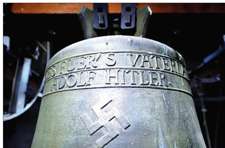
The German village of Herxheim has repeatedly caught national attention for the controversial “Hitler bell” since a former church organist complained about the inscription.

Amid the controversy, the bell was silenced last September and a second one used, pending the municipal decision in the southwestern village near the university city of Heidelberg. —AFP ■