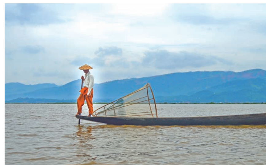
An Intha rowing his boat with legs in Inle Lake.

crane ( Grus antigone ). Among the 16 endemic fish species, the Inle carp ( Cyprinus carpio intha ) is culturally symbolic and important as a source of food and income. Among the species recorded are 267 bird species, 43 fish species, 10 reptile species, nine mammal species, three species of turtle, 75 species of butterfly and 20 species of snails.