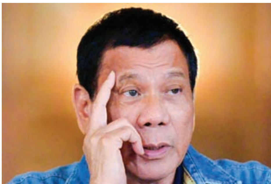
Philippine President Rodrigo Duterte.

"We would be glad if they have their presence there ... just to patrol,"