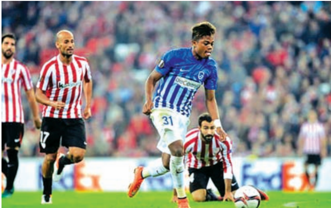
KRC Genk's Leon Bailey prepares to shoot during the match of UEFA Europa League group stage between Athletic Bilbao v KRC Genk at San Mames, Bilbao, Spain on 3 November, 2017.

BERLIN — Bayer Leverkusen have signed 19-year-old Jamaican winger Leon Bailey from Belgium's Racing Genk on a contract to 2022, the German club said on Tuesday. Bailey, who played for Genk in the Europa League and scored four goals in six matches, is also eligible for the Champions League, the German club said. Leverkusen are through to the round of 16 in Europe's top club competition and face Spain's Atletico Madrid next month. "He is an unusually quick and very cunning player, who gives our attack an added push," Leverkusen sports director Rudi Voeller said in a statement. "We are certain he will prove to be a huge win for us." Bailey, who joined Genk in 2015 and has played once for Jamaica's under-23 team, was reportedly a target for several top European clubs before being signed by Leverkusen.—Reuters