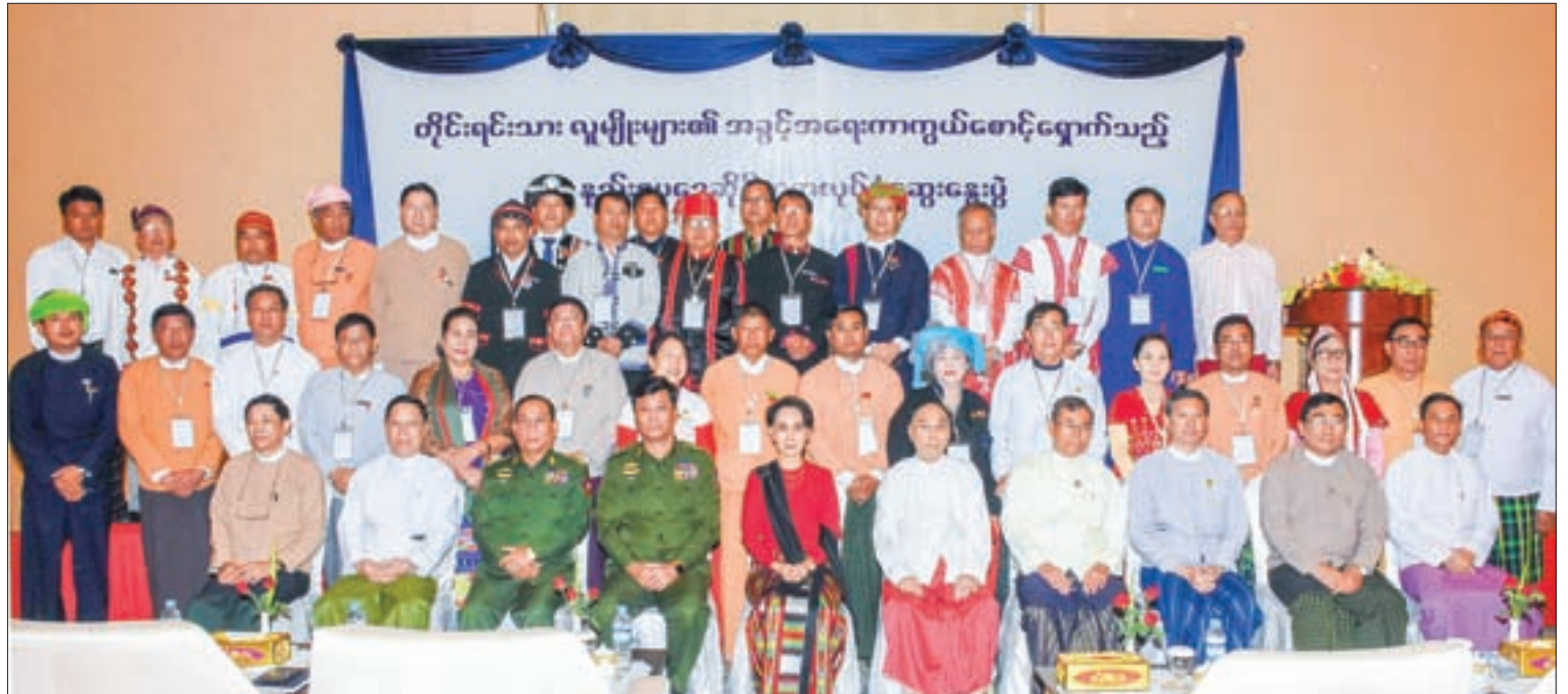
State Counsellor Daw Aung San Suu Kyi, centre, front row, poses for a photo with participants at the workshop in Nay Pyi Taw.

Officials from the Office of the Attorney General, legal experts and scholars also participated in the workshop to address the legal aspect of the draft rules.