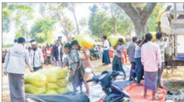
Bags of rice from Muslim for Peace Foundation are delivered to villages yesterday in Maungtaw, Rakhine State.