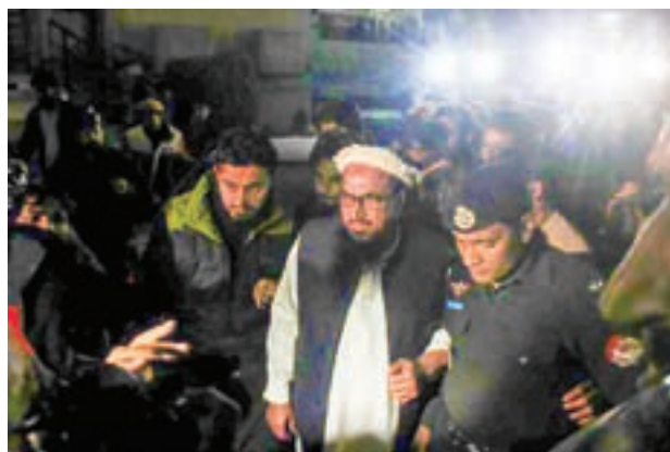
Hafiz Muhammad Saeed, chief of the banned Islamic charity Jamat-ud-Dawa, is escorted to his home where he will be under house arrest in Lahore, Pakistan on 30 January, 2017.

founder of the Lashkar-e-Taiba (LeT) militant group that India blames for the bloodshed, at the headquarters of his charity, the Jamaat-ud-Dawa (JuD), late on Monday.