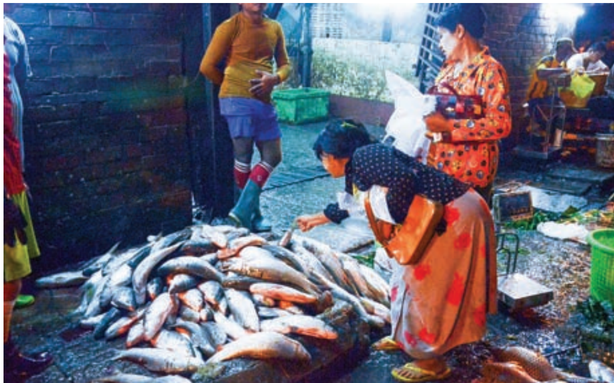
Merchants check fishes at Sanpya fish market in Yangon, early morning on 7 January, 2017.