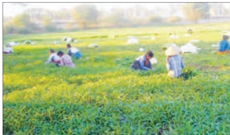
Growers are planting water spinach in Mandalay. PHOTO: THE MIRROR

A basket of water spinach sells for about Ks6,000. — Nway Nadi/Myit Nge