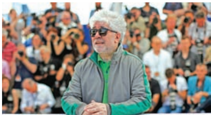
Director Pedro Almodovar poses during a photocall for the film "Julieta" in competition at the 69th Cannes Film Festival in Cannes, France, on 17 May, 2016.

"The Festival de Cannes is delighted to welcome a unique and hugely popular artist. His works have already carved out an eternal niche in the history of film," festival organisers said in a statement.— Reuters