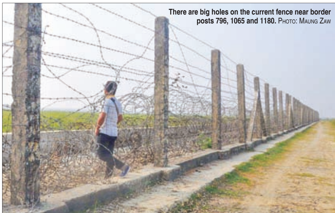
There are big holes on the current fence near border posts 796, 1065 and 1180.

"We have reported to the Ministry of Home Affairs about the damaged fences, which will allocate funds for the upgrading of the fence. We will upgrade the border fence in accordance with the budget allocation of the ministry. But everything depends on the budget allocation," said an official who was involved in the erection of the fence at its first stage.