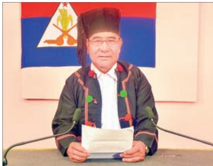
U Shee Mon of Lahu National Development Party.

U SHEE MON, Secretary for Social Affairs of the Lahu National Development Party presented the policy, philosophy and programs of their party on Radio and TV on 31 January 2017.