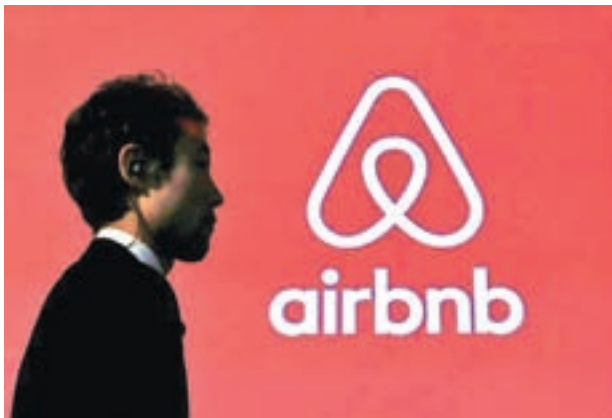
A man walks past a logo of Airbnb after a news conference in Tokyo, Japan, on 26 November, 2015.

Representatives for Google and Netflix could not immediately be reached for comment. An Airbnb spokesman declined to