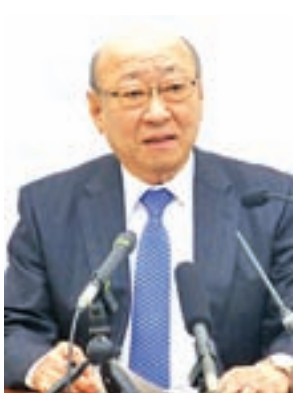
Nintendo Co President Tatsumi Kimishima.

The consumer electronics and game software maker said it booked a foreign exchange-related gain of 1.4 billion yen in the nine-month period as the value of its foreign-denominated assets rose due to a weaker yen. On the other hand, Nintendo cut its operating profit projection to 20 billion yen, against an earlier forecast of 30 billion yen, on projected sales of 470 billion yen, unchanged from its previous estimate.