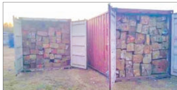
Illegal timber containers are seen.

Police seized 280 tonnes of illegal Padauk square timber and 3 tonnes of Tamalan. Police have taken action against the illegal timber owner and other people involved in the case in accordance with the law, according to the forest department.— Myanmar News Agency