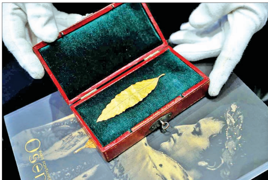
An auctioneer displays a gold laurel leaf from French Emperor Napoleon's imperial crown at the office of the Osenat auction house in Paris, France, on 15 November 2017. The leaf will go under the hammer on Sunday and is expected to fetch between 100,000 and 150,000 euros.

Napoleon complained the crown was too heavy, leaving its creator Martin-Guillaume Biennais to remove six leaves.