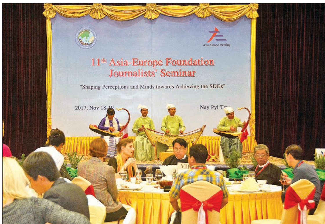
Union Minister Dr Pe Myint hosts the dinner in honour of 11th ASEF Journalists.

"Today is an auspicious day for our country and our people. It is a rare chance in a hundred year for a member country to host this kind of seminar. It is a pleasure and honor to deliver this welcoming speech. We are honored and happy for the