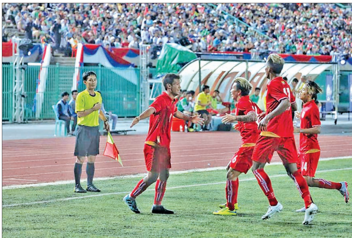
Myanmar U-23 national footballers seen at the international friendly match against Cambodia at Phnom Penh Olympic Stadium in Cambodia on 9 November.

The Myanmar U-21 team is preparing for international matches and tournament including the Vietnam U-21 In-