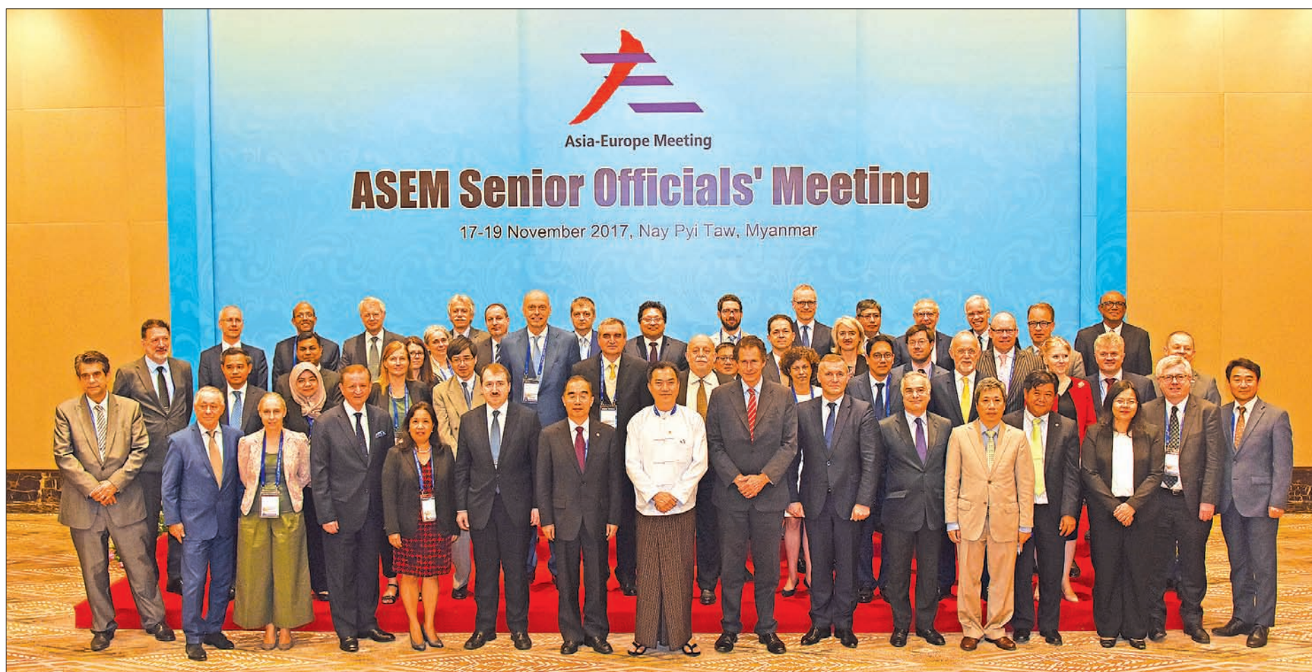
Participants of the ASEM Senior Officials' Meeting have the documentary photo taken in Nay Pyi Taw on 17 November 2017.