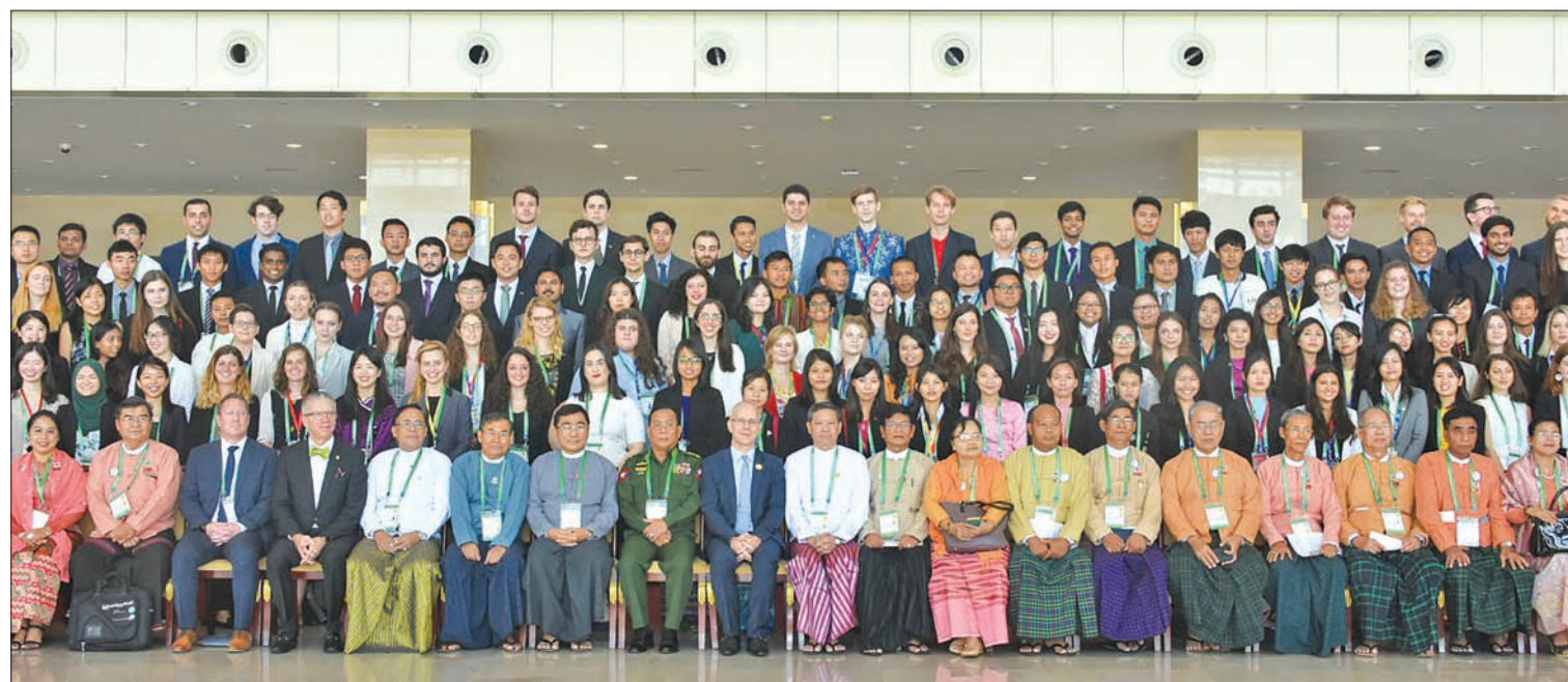
Participants of the 8th Model ASEM pose for a documentary photo in Nay Pyi Taw on 17 November 2017.

"In accord with the theme of 8th ASEM and 13th ASEM Foreign Ministers' Meeting -- 'Strengthening Partnership for Peace and Sustainable Development,' -- discussions should be made in familiar terms by upgrading patience, mutual understanding and trust among the communities with differences in politics, economy and culture. For strengthening sustainable development, the Ministry of Education has been bringing about high-quality education by laying