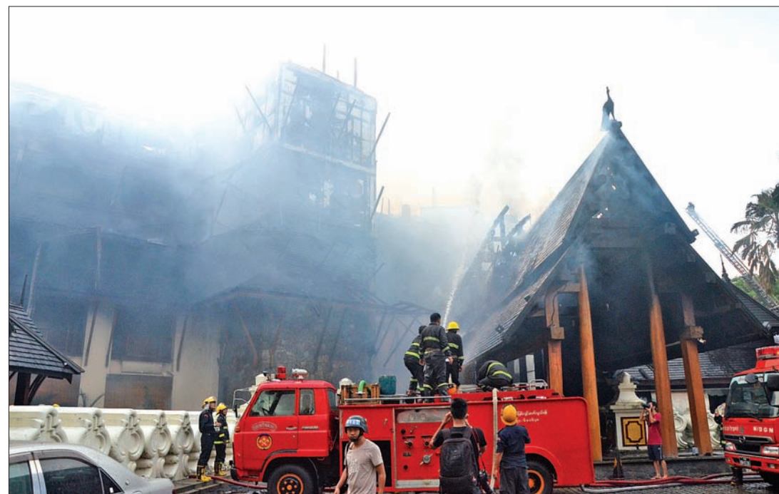
Firefighters work to extinguish a fire at Kandawgyi Palace hotel in Yangon on 19 October 2017. The State-owned Myanma Insurance provides Ks692 million for the hotel fire incident.

But there is still a market for these vehicles, merchants said. Those who wish to operate car rental businesses in other townships come to the Yangon car market to purchase those cars.—GNLM