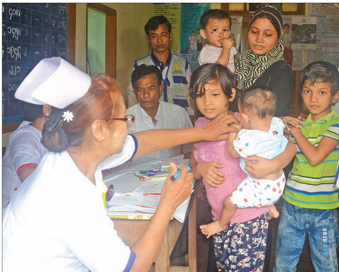
A nurse vaccinates the child against encephalitis in Buthidaung.

After the events of the ARSA extremist terrorist attacks in Buthidaung, transport and communications in the area became worse, but medical staff are continuing their efforts to vaccinate against encephalitis by forming vaccination teams in cooperation with related departments. As a first priority, a total of 7,530 children under the age of 15 in