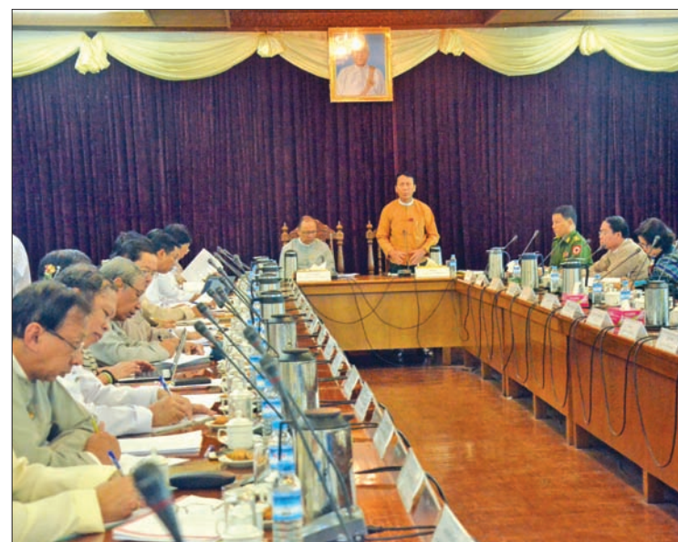
Yangon Region Chief Minister U Phyo Min Thein delivers the opening remark at the 3rd Asia-Pacific Water Forum.

ing committee then explained about matters discussed in the first coordination meeting and officials from related ministries, sub-committees and secretariat group explained the status of work done and discussed future works.