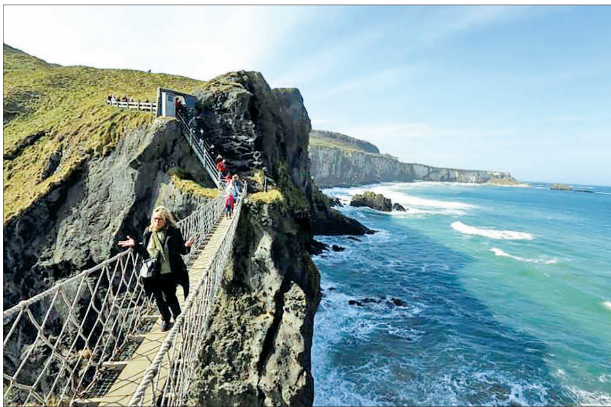
Tourists make their way across Carrick-a-Rede Rope Bridge on the Causeway coast, north of Belfast in 2015. The bridge is suspended 30 metres above sea level and was built 350 years ago by salmon fishermen, according to conservation organisation National Trust.

The pound fell sharply after the referendum decision to leave the European Union in June 2016, pushing up inflation for British households — and