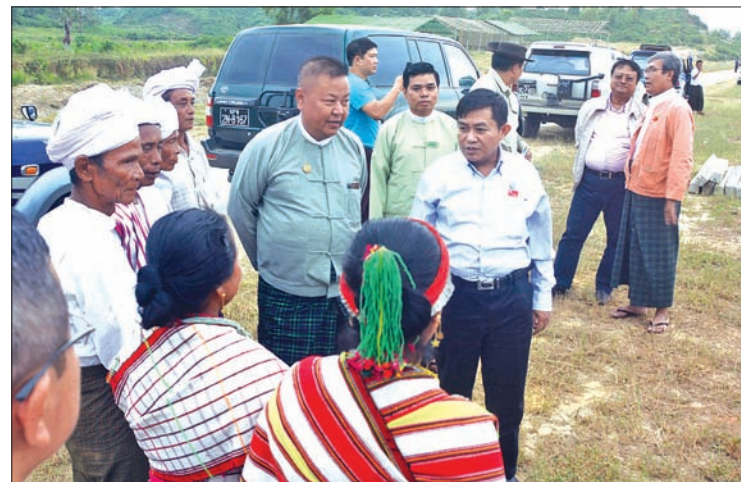
Bago Region Chief Minister U Win Thein greets ethnic people in Kainggyi Village, Maungtau, Rakhine State.

The reason for coming to Rakhine is because the State Counsellor had told ethnic nationals to assist another who is facing difficulties in all sectors starting with human, financial, moral and technical resources in the Rakhine State affairs. Reconstruction of this region will start with construction of villages and schools. The construction of houses needs to be completed before the rain comes. This will be followed by assistant and coordination for economic works.