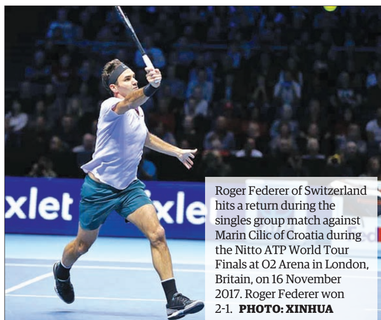
Roger Federer of Switzerland hits a return during the singles group match against Marin Cilic of Croatia during the Nitto ATP World Tour Finals at O2 Arena in London, Britain, on 16 November 2017. Roger Federer won 2-1.

LONDON — Champions Chelsea face a stiff challenge to defend their Premier League title from in-form leaders Manchester City but will fight till the end in the race, midfielder Willian has said. City have won 10 of their opening 11 league games and sit at the top of the table, nine points ahead of fourth-placed Chelsea. "It's difficult," Willian told BBC's Football Focus. "Manchester City are playing very well but I think we can fight for the title until the end." —Reuters ■