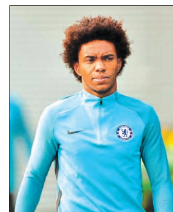
Chelsea's Willian.

This is the first time Viet Nam has had up to six teams which have secured berths to the tournaments' final roads, the federation said, noting that they will compete at the coming AFC Asian Cup, AFC Women's Asian Cup, AFC U-23 Championship, AFC U-19 Championship, AFC U-16 Championship and AFC Futsal Championship. —Xinhua ■