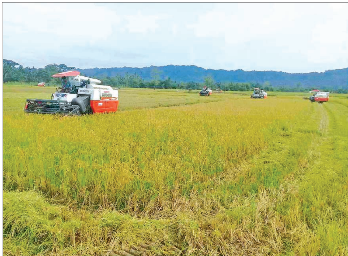
Harvesters are seen at a paddy field in MraukU, Rakhine State.

countries including Myanmar. By having individuals, especially children, vaccinated against encephalitis, they can be immune from the disease forever, it was learnt.—News Team