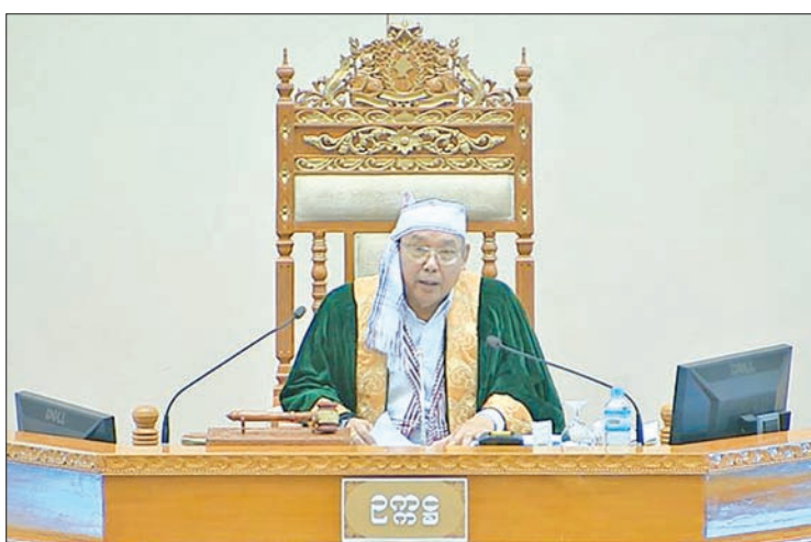
Speaker of Amyotha Hluttaw Mahn Win Khaing Than.