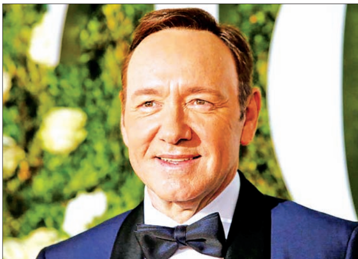
Actor Kevin Spacey.