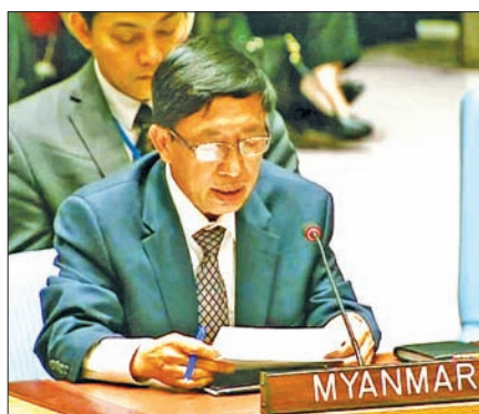
Permanent Representative U Hau Do Suan.

Now the OIC is exerting political pressure on Myanmar by submitting the unfair resolution at the Third Committee of the United Nations General Assembly. Myanmar opposes any at-