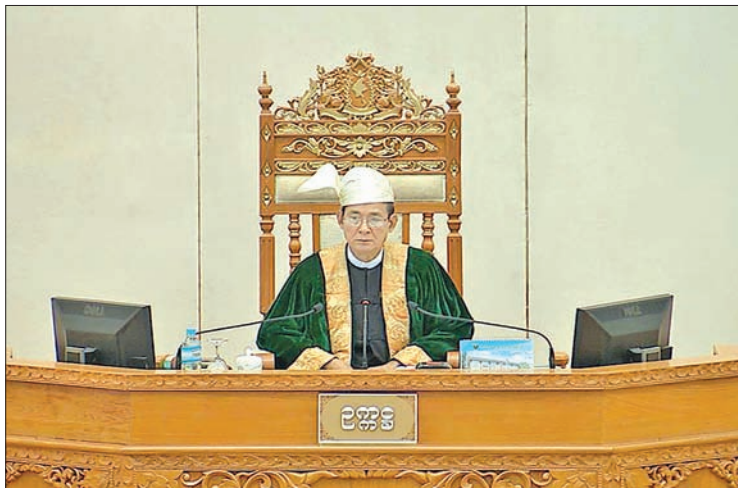
Speaker of Pyithu Hluttaw U Win Myint.

Responding to a question by U Myint Han Tun of Budalin constituency on the joint venture conducted by June Pharmaceutical and Ministry of Industry, Union Minister for Industry U Khin Maung Cho said Sagaing June Pharmaceutical & Foodstuff Industry Ltd joint venture was formed by Myanmar Pharmaceutical Industries and June Pharmaceutical in No. 3 Pharmaceutical Factory (Sagaing) under Myanmar Pharmaceutical Industries of Ministry of Industry with the permission of President Office and Myanmar Investment Commission. The joint venture company was formed with share ratio of 80 per cent from Myanmar Pharmaceutical Industries and 20 per cent from June Pharmaceutical. The joint venture agreement