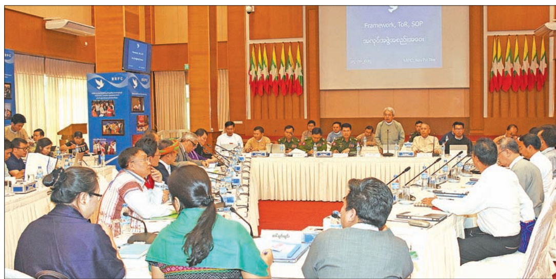
The Framework, ToR, SOP Work Group meeting being held in Nay Pyi Taw.

The head of the group representing ethnic armed organ-