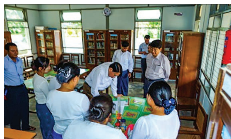
Union Minister Dr Pe Myint visits the Information and Public Relations Department (IPRD) in Waingmaw Township, Kachin State.

Union Minister for Information Dr Pe Myint and Kachin State Minister for Development Affairs U Nay Win visited the Information and Public Relations Department (IPRD) in Waingmaw Township, Kachin on 16 July to inspect the office and library. The Union Minister said the government is relying on librarians to increase literacy and library use. The Minister also said that librarians assist people to find useful references and encourage children to visit the reading room.—IPRD ■