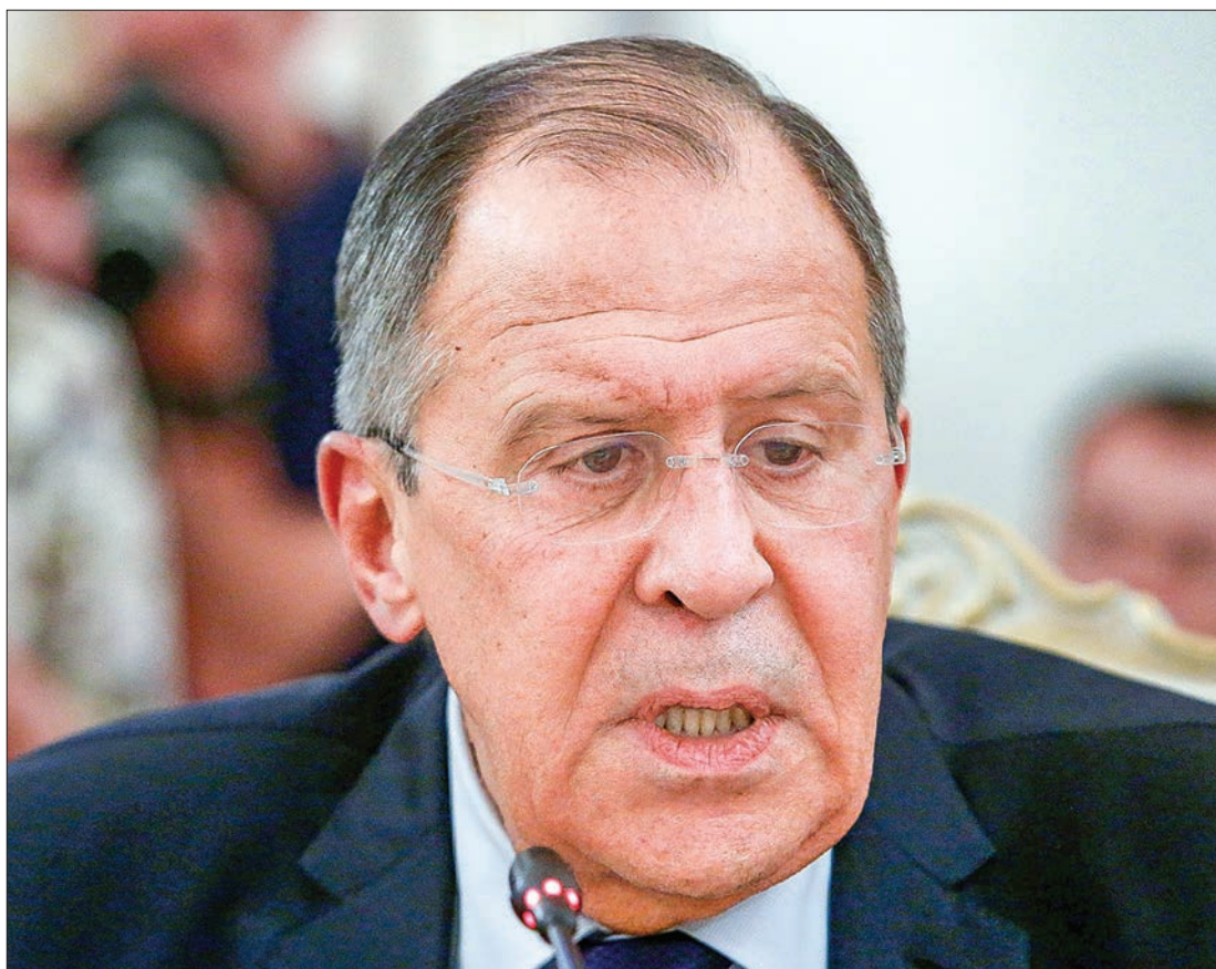
Russian Foreign Minister Sergei Lavrov.

On a separate issue, RIA cited Lavrov as saying that