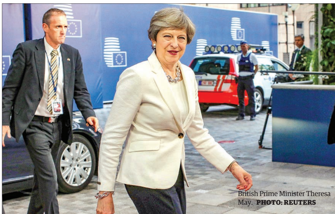
British Prime Minister Theresa May.

"She'll just be reminding them of their responsibilities and making the point that ministers across government need to be focused on getting on with delivering for the British public," the spokesman said.—Reuters ■