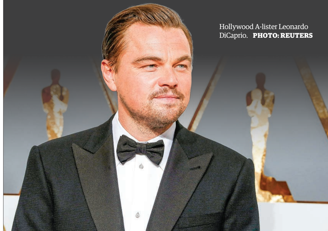
Hollywood A-lister Leonardo DiCaprio.

reuniting with Martin Scorsese in an upcoming true-crime thriller, based on the best-selling book by David Grann, "Killers of the Flower Moon: The Osage Murders and the Birth of the FBI". —PTI ■