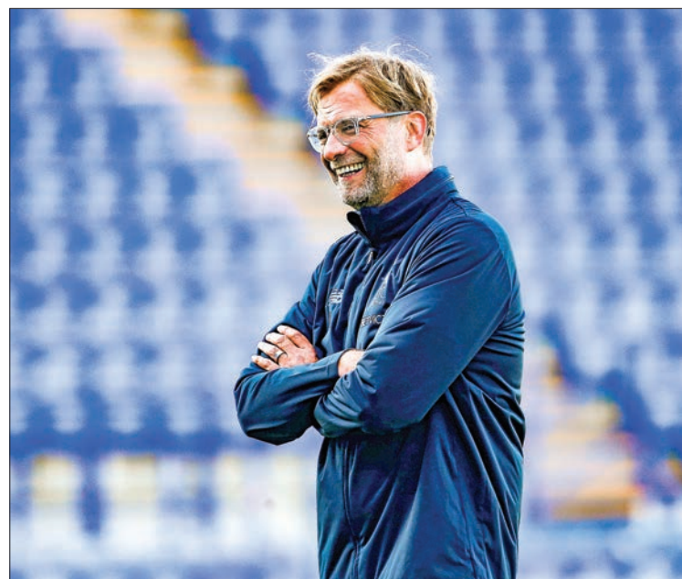
Liverpool manager Juergen Klopp.

Liverpool, who finished fourth in the league last season, visit Watford in their opening game of the season on 12 August. —Reuters