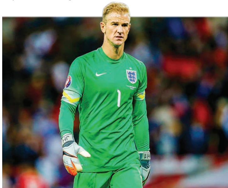
England's goalkeeper Joe Hart.

“In my opinion, he (Hart) has been a little bit hard done by in recent years. He has been fantastic for England and for his club for the last 10 years, and he probably deserves a little bit more respect.” British media reports claim Hart will undergo a medical at West Ham on Monday and is close to completing a deal ahead of the team's pre-season fixtures, which begin on Thursday against Championship side Fulham. —Reuters ■