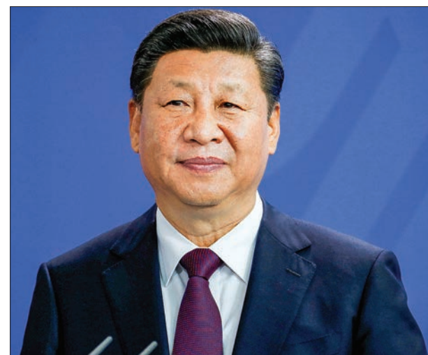
President Xi Jinping .