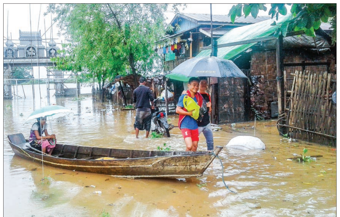
Low-lying areas in Hpa-an are inundated by overflow water from the Thanlwin River.

Occasional squalls with rough seas will be experienced off and along Myanmar Coast. Surface wind speed in squalls may reach (40) m.p.h. Wave height will be about (9 - 14) feet along Myanmar Coast.—GNLM ■