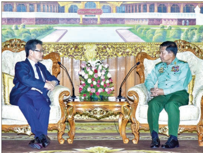
Senior General Min Aung Hlaing holds talks with US Deputy Assistant Secretary in Nay Pyi Taw yesterday.

The Senior General expressed his wish that the Korean Peninsula become a de-nuclearized zone, that the