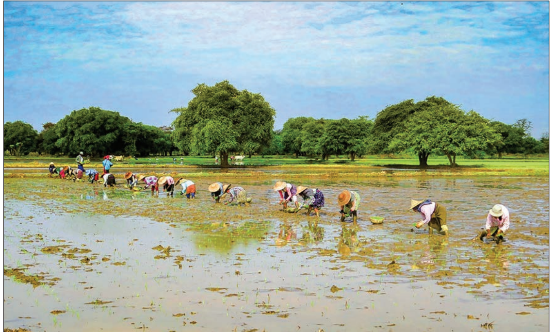
Women transplant seedlings into a rice paddy field in Meiktila.

The cooperative syndicate can officially take out Ks0.2427 from Ks1.50 for funds for development of suitable kinds of businesses for its members in the