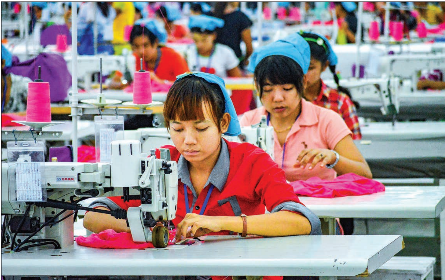
Employees work on a production line at a garment factory in Hlinethaya, Yangon.