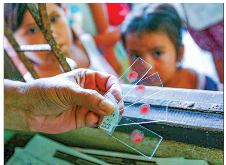
An official holds blood test slides taken from children.

The Public Health Department will distribute medicated mosquito nests and launch awareness campaigns in eight townships in south district and 11 townships in north district and other townships in Yangon Region where malaria mainly occurs.— 200 ■