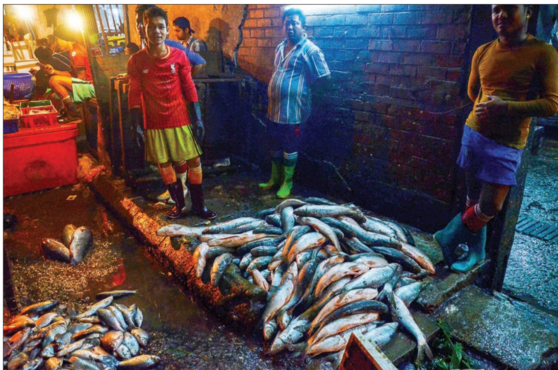
Fishmongers stand as they sell fish at the Sanpya Fish Market in Yangon.