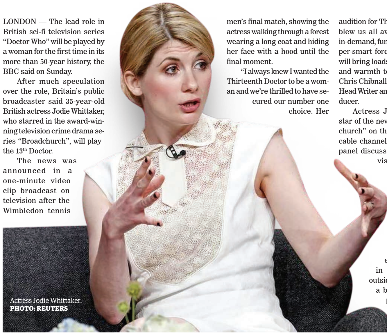
Actress Jodie Whittaker.

"This is a really exciting time, and Doctor Who represents everything that's exciting about change. The fans have lived through so many changes, and this is only a new, different one, not a fearful one." —Reuters ■