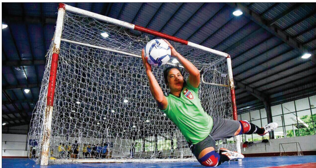
Myanmar futsal team's goalkeeper under training.