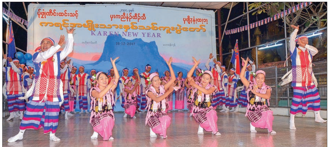
Ethnic Kayin performers entertaining at their New Year Celebration in Insein Township on 17 December.