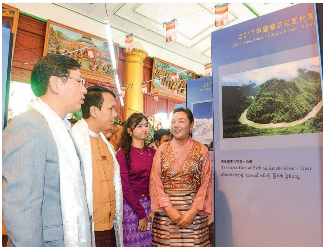
Yangon Chief Minister U Phyo Min Thein observes the Tibet Cultural Exhibition at Shwedagon Pagoda.