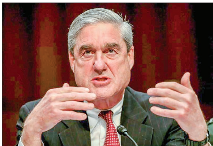
FBI Director Robert Mueller testifies at a Senate Intelligence Committee hearing on Capitol Hill in Washington, DC, US on 16 February 2011.