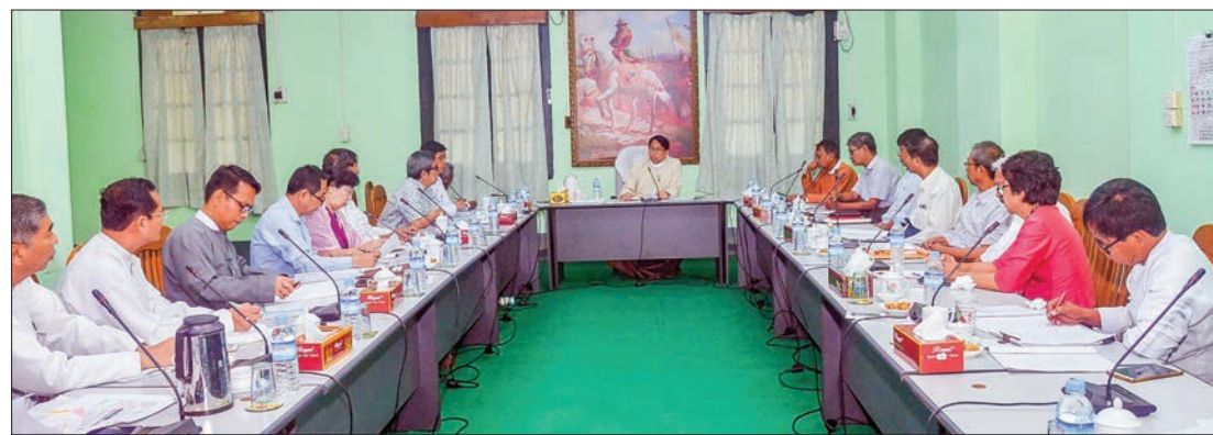
Union Minister Dr Pe Myint (Centre) holds talks with the laterati at the meeting on 17 December.

THE first sequence of a compilation of novels of the 100 Myanmar books comes out in early 2018, according to a meeting held in Yangon yesterday morning.