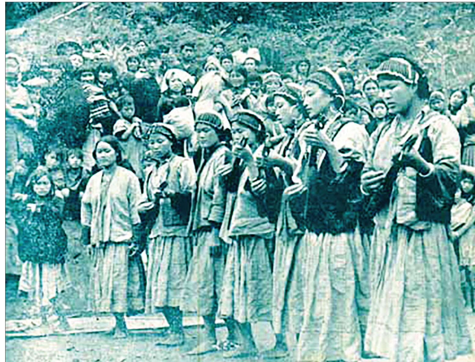
Lisu girls playing traditional musical instrument.

At the time when Morse missionaries arrived at Puta-O