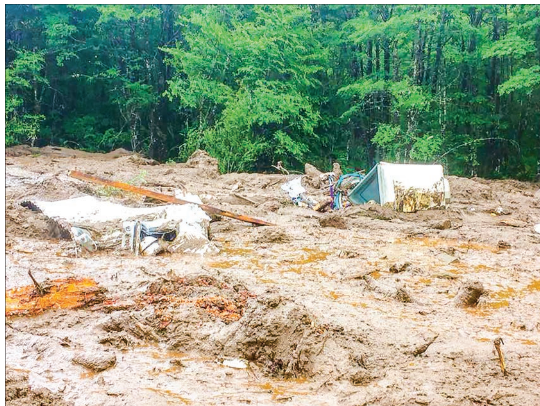
Damage done by a landslide is seen in Villa Santa Lucia, Los Lagos, Chile, on 16 December, 2017 in this picture obtained from social media.

The nearby Chaiten volcano erupted in 2008, forcing the evacuation of thousands of residents.—Reuters ■