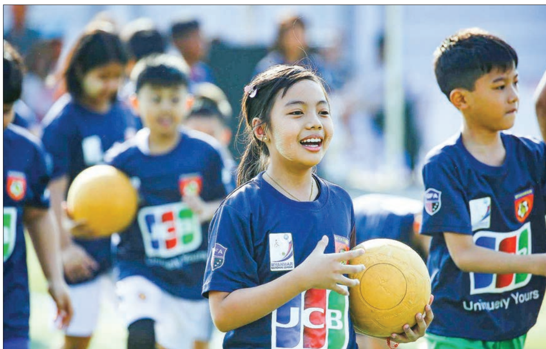
Kids seen at the JCB football clinic at the artificial turf ground of MFF in Yangon, Myanmar yesterday.

The Group (B) won the championship of the friendly tournament by beating the Group (G) with 2-0 result while Group C secured the third place by beating the Group (E) with the penalty in the third place