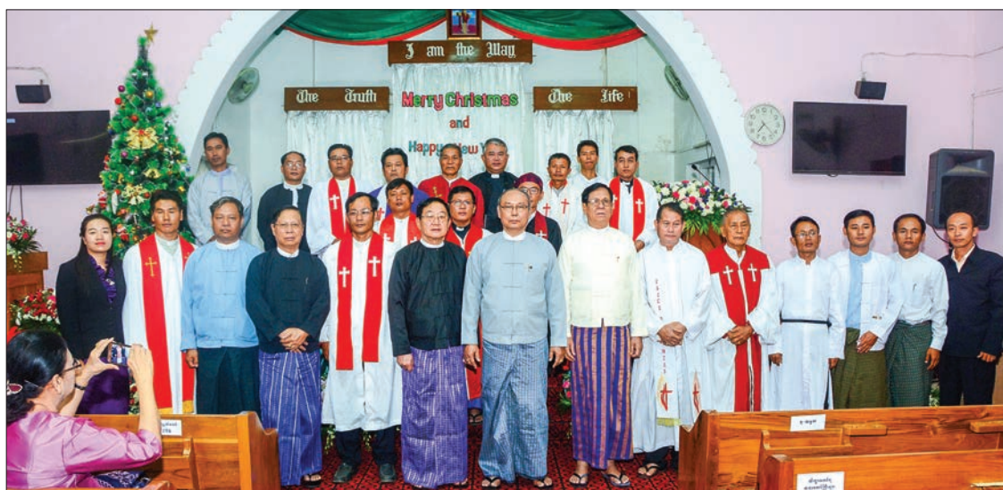
Attendees to the Pre-Christmas Celebration pose for documentary photo.