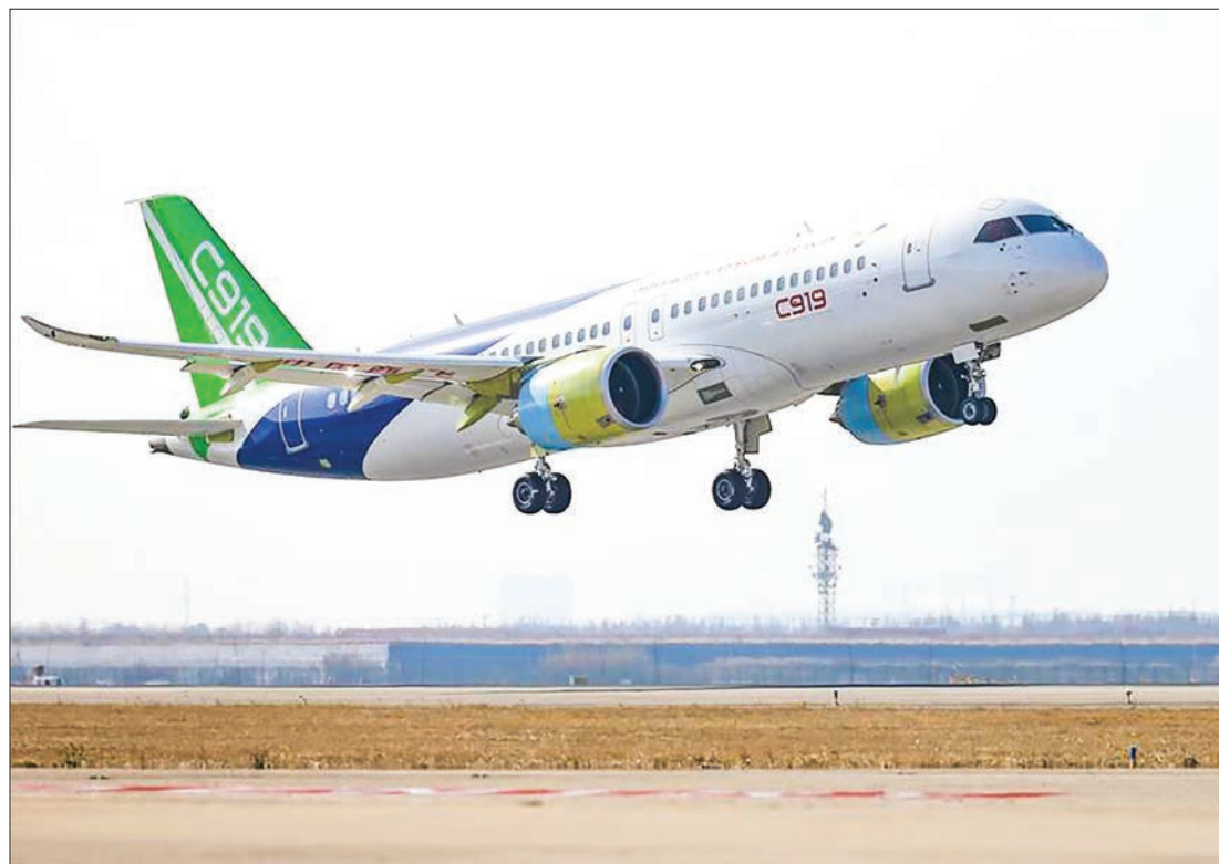
The second plane of China's homegrown large passenger plane, the C919, takes off from Pudong International Airport in Shanghai, east China, on 17 December 2017. The second plane of the C919 made its first test flight in Shanghai on Sunday.

SHANGHAI — A second prototype of China's large passenger jet C919 completed its maiden flight in Shanghai Sunday, which was marked as a step closer to China becoming a global aviation powerhouse.