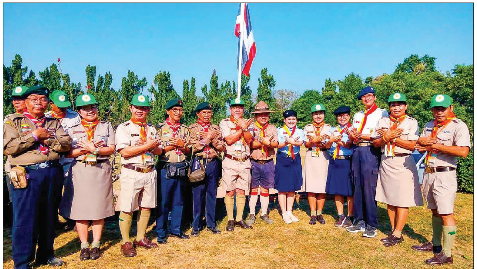
Myanmar Scout representatives attended 1st Solar Scouts Jamboree festival are seen, together with international scout representatives.

Scout delegation will stage public activities and share the knowledge and experience they gained at the 1st Solar Scouts Jamboree festival for creating a better world through energy saving. —Myanmar Scout Association ■