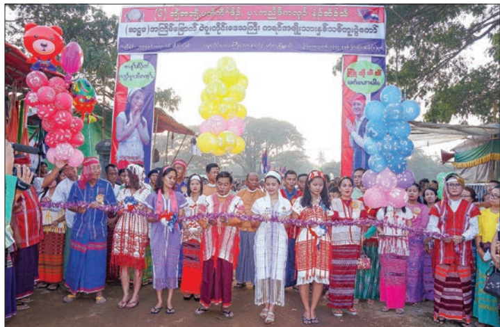
Sixth time of the 80 th Kayin new year ceremony held in Minhla Township, Bago Region Region on 17 December.

At night the ceremony was ongoing with the booths exhibiting Kayin traditions and their traditional goods and also booths representing Peace can be seen with setting of fireworks in the event. ■