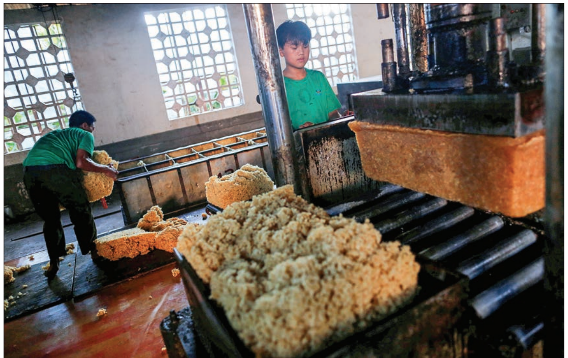
Workers work in rubber factory at Namtit in north east Myanmar.

More than 90 per cent of rubber production goes to export market. The vast majority of Myanmar's rubber goes to China through cross-border trade gates and it is also exported to Malaysia, Singapore, Japan, Indonesia, Korea, Tai-