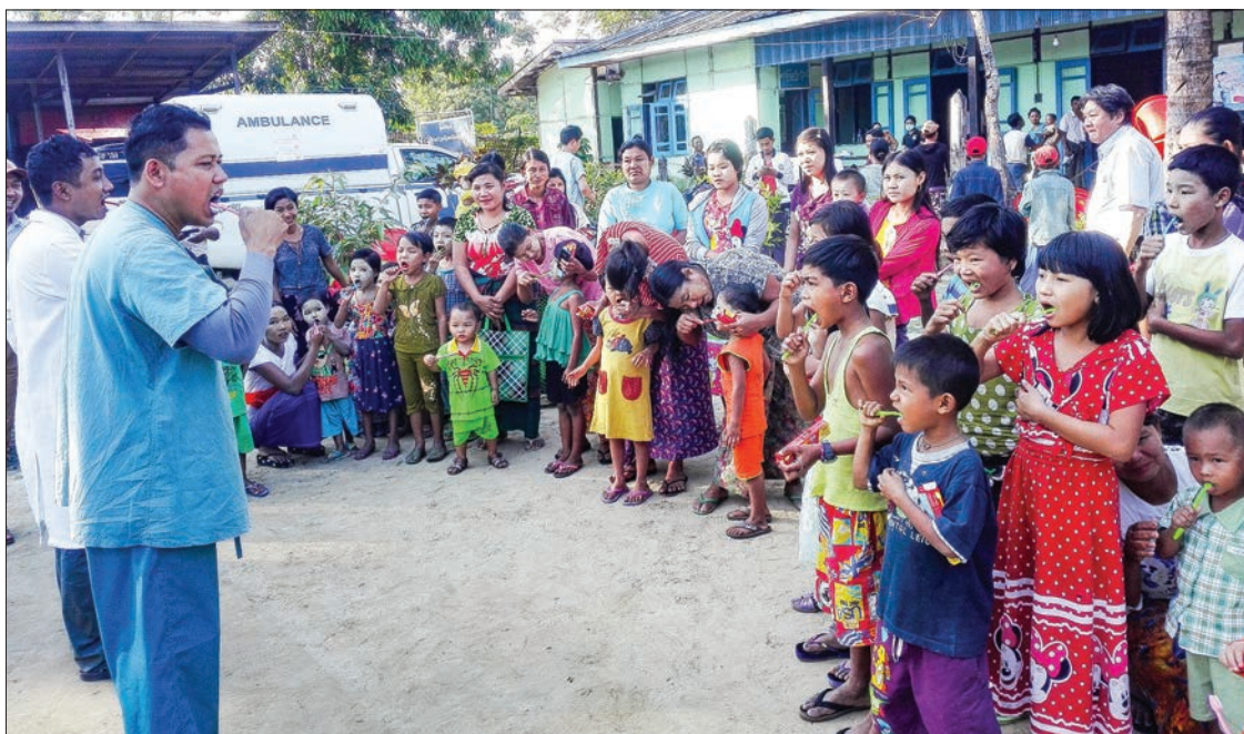
Volunteering Doctors greeting children in Rakhine State.

At the clinic of No 2 border guard force at 4th mile, the team gave health awareness talks and provided toothbrushes and toothpastes free of charge to about 70 families. On 16 December, it carried out knowledge dissemination and medical treatments at Dapyuchaung village in Buth-