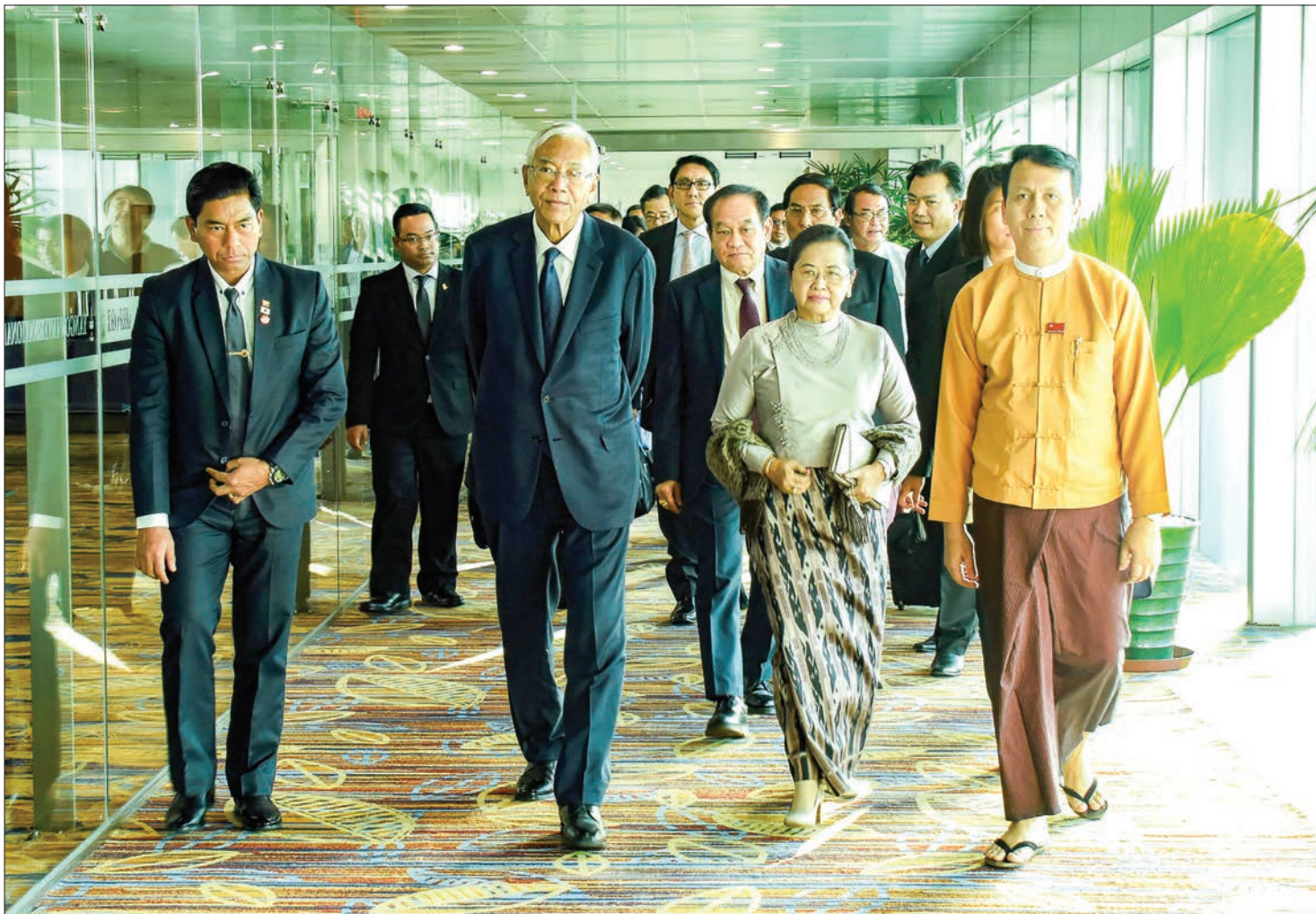
President U Htin Kyaw and wife Daw Su Su Lwin being welcomed back at the Yangon International airport by officials.