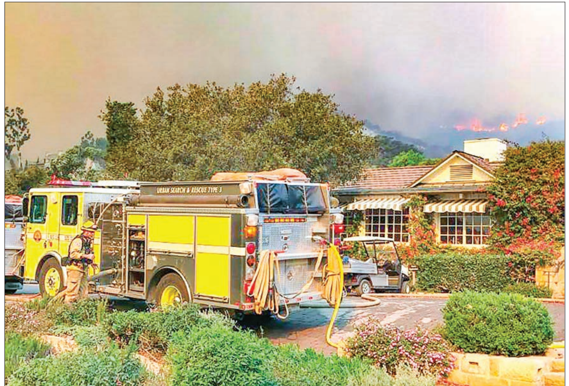
Firefighters provide structure protection at the historic San Ysidro Ranch as flames from the Thomas Fire, now the third-largest on record, rage in the distance in Montecito, California, US, on 16 December 2017.

count 10 people who lost their homes. My best friend from high school, his mom's house burned down."