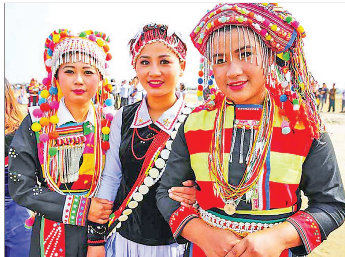
Three Lisu women wear traditional dress.