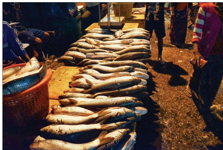
Freshwater fish are seen in local market.

Rubber, Technically Specified Rubber (TSR) and Crepe Rubber were exported to foreign countries. —Ko Khant ■