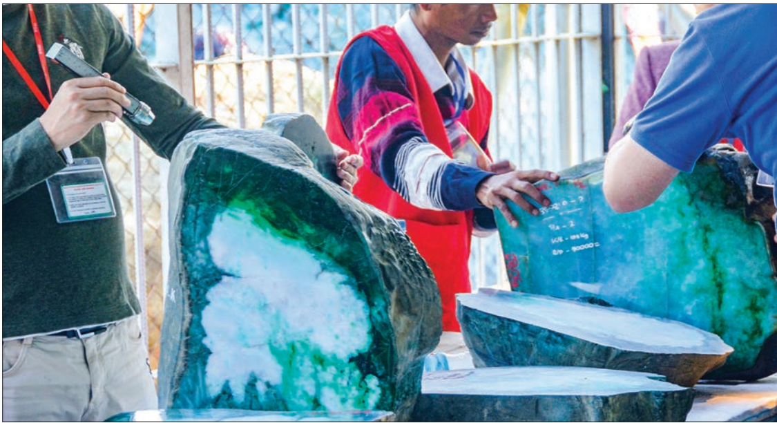
Merchants inspecting jade lots at Myanma Jade and Gems Emporium