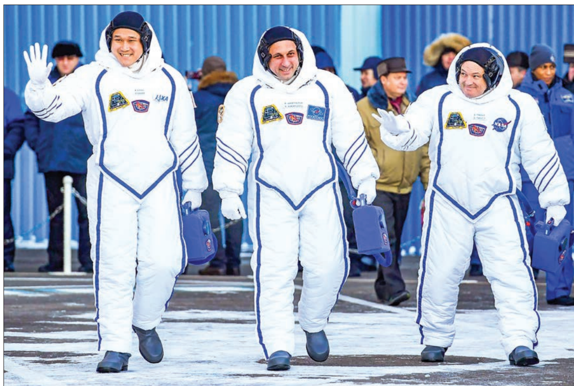
Members of the International Space Station expedition 54/55, Roscosmos cosmonaut Anton Shkaplerov (C), NASA astronaut Scott Tingle (R) and Norishige Kanai (L) of the Japan Aerospace Exploration Agency (JAXA) during the send-off ceremony after checking their space suits before the launch of the Soyuz MS-07 spacecraft at the Baikonur cosmodrome, in Kazakhstan, on 17 December 2017.

Onboard cameras showed crew members making thumbs-up gestures after the blast-off. Also visible was a stuffed dog toy chosen by Shkaplerov's daughter to be the spacecraft's zero-gravity indicator. Soyuz was safely in orbit about 10 minutes after the launch.—Reuters ■