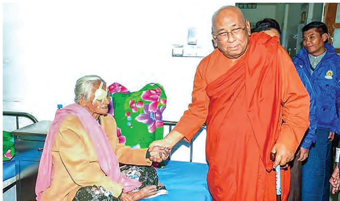
Sitagu Sayadaw encourages an elder after she undergoes surgical treatment at Sitagu Cakkhudana Hospital.

NEARLY 400,000 people have received free vision care and eye surgeries under the eye care programme organized by Sitagu Sayadaw, a well-known Buddhist monk, over the past 23 years.