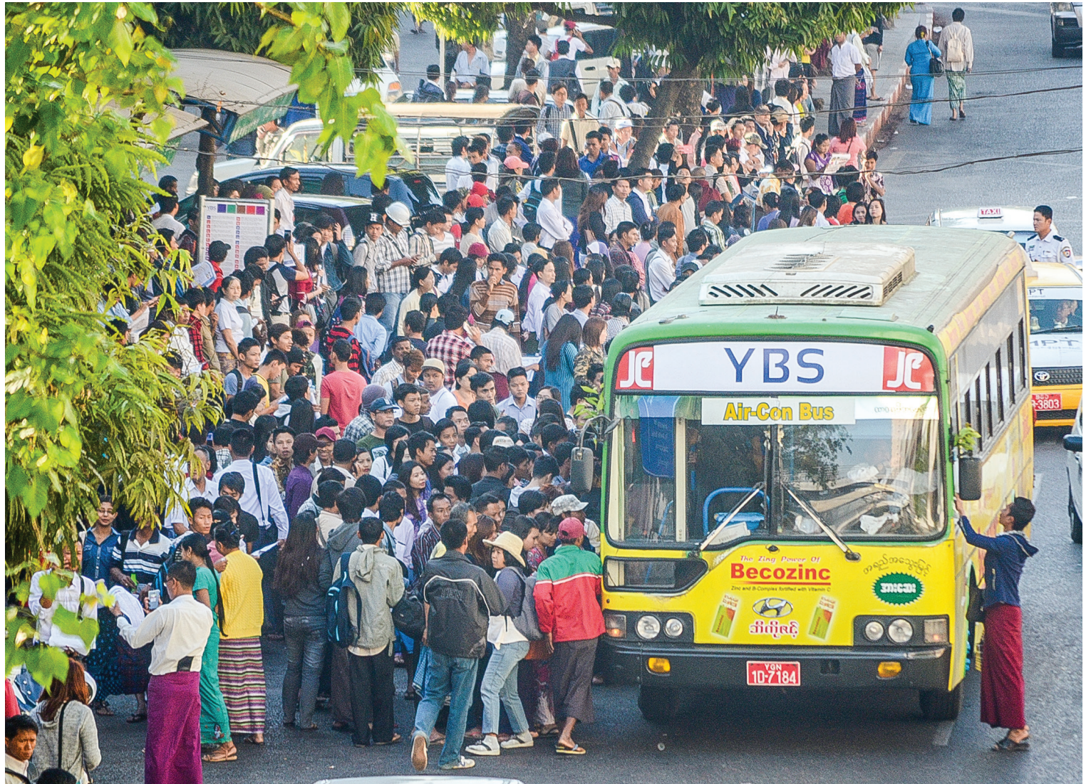
There were many more passengers than buses yesterday, the first day of a new bus system in Yangon, which made for a chaotic rush hour.