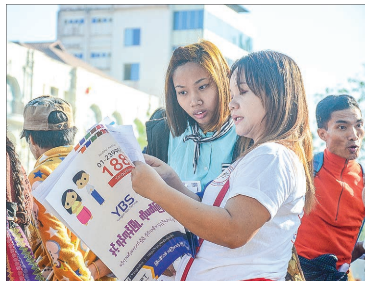
A volunteer helps a commuter find bus routes.