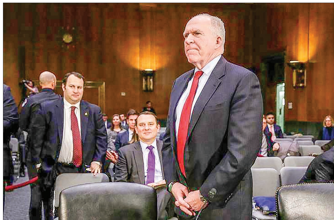
CIA Director John Brennan prepares to testify to the Senate Select Committee on Intelligence hearing on "Russia's intelligence activities" on Capitol Hill in Washington, US, January 10, 2017.

WASHINGTON— CIA Director John Brennan on Sunday had a stern parting message for Republican Donald Trump days before he assumes the US presidency, cautioning him against loosening sanctions on Russia and warning him to watch what he says.