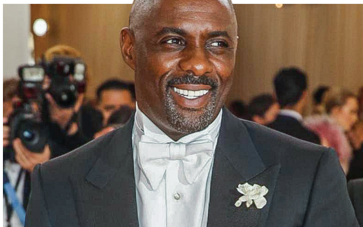
Actor Idris Elba.