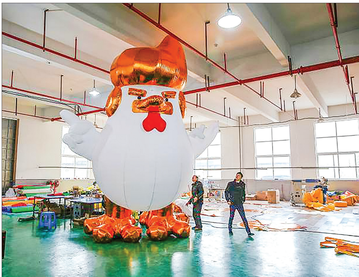
Workers show to visitors an inflatable chicken that local media say bears resemblance to US President-elect Donald Trump as their factory braces for the Year of the Rooster in Jiaxing, Zhejiang province, China on 12 January, 2017.