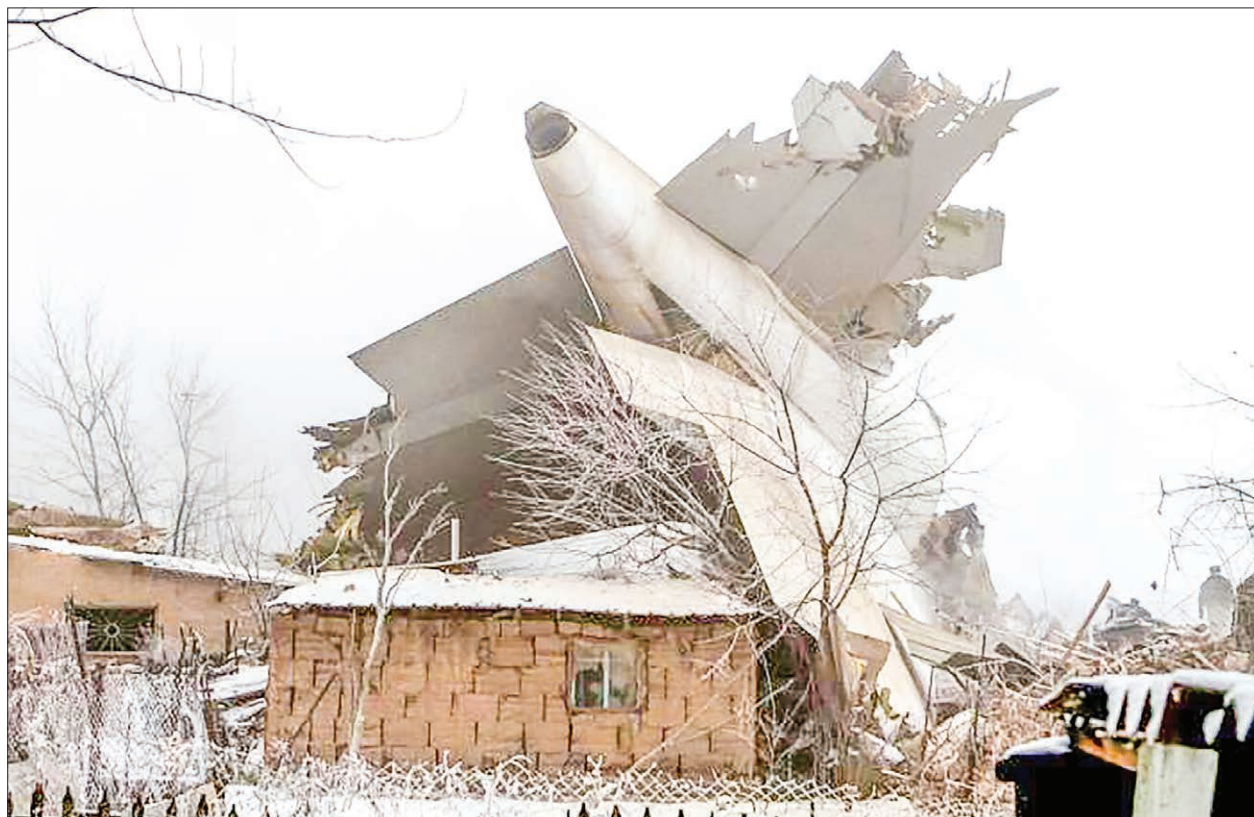
Plane debris is seen at the crash site of a Turkish cargo jet near Kyrgyzstan's Manas airport outside Bishkek, on 16 January, 2017.

"More information will be disclosed concerning our four-person team when we get clear information." —Reuters