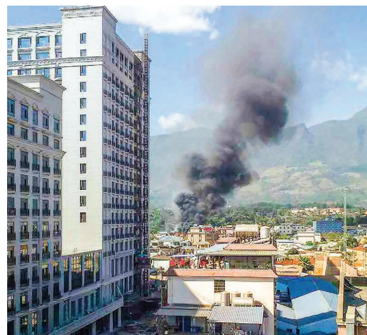
Smog are seen in Laukkai northern Shan Sate.