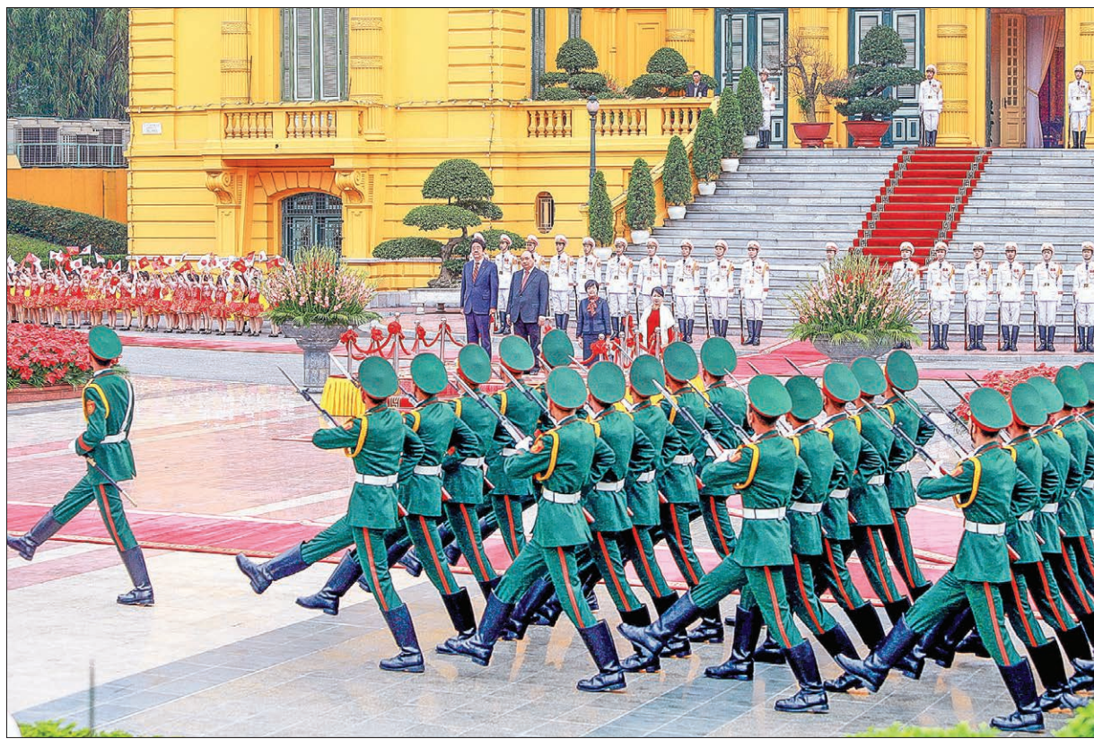
Japanese Prime Minister Shinzo Abe and his Vietnamese counterpart Nguyen Xuan Phuc review an honour guard at the Presidential Palace in Hanoi, Vietnam on 16 January 2017.

HANOI — Japan's Prime Minister Shinzo Abe on Monday promised Vietnam six new patrol boats during a visit to the Southeast Asian country locked in a dispute with China over the busy South China Sea waterway.