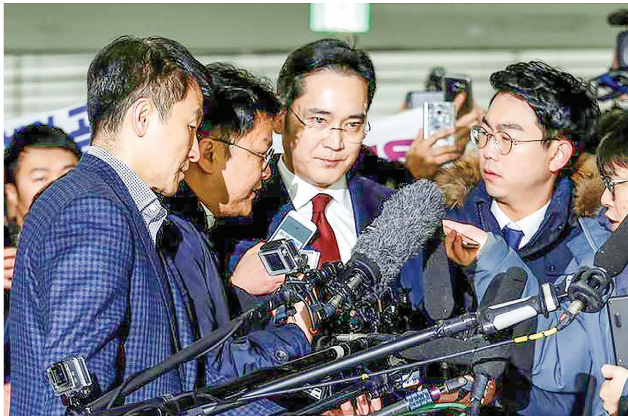
Samsung Electronics vice chairman Jay Y. Lee arrives to attend a hearing at the National Assembly in Seoul, South Korea, on 6 December, 2016.