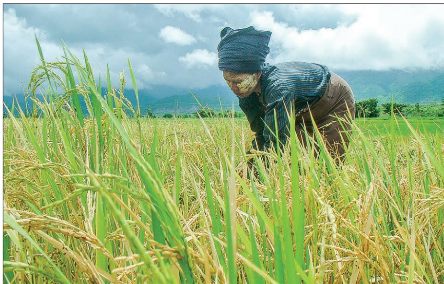
A farmer works on a paddy field near Nay Pyi Taw.

The committees concerned will meet the businessmen and merchants to