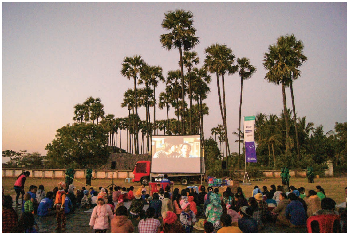
Cinema Paradiso showing films in Mandalay.

KOREA International Cooperation Agency (KOICA) hosted “Cinema Paradiso Project” at Kanphyu village, Madaya Township in Mandalay on 14th January 2017 through World Friends Korea (WFK) volunteers in co-operation with students from Mandalay University of Foreign Languages and 300 community members as well.