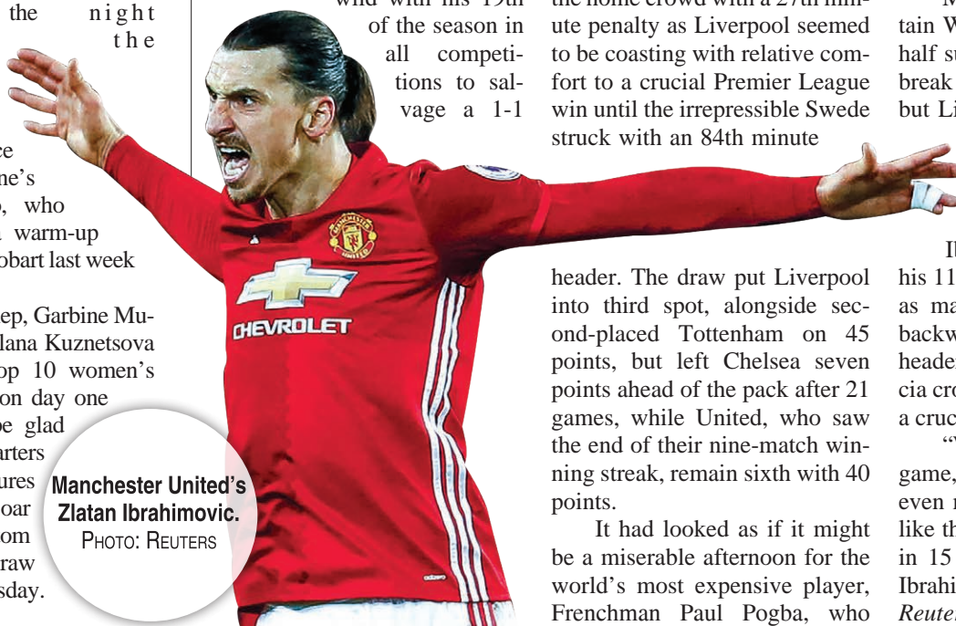
Manchester United's Zlatan Ibrahimovic.

"We would like to win every game, of course, to close the gap even more but 1-1, we continue like this, we haven't lost a game in 15 or 16 and we are there," Ibrahimovic told Sky Sports. — Reuters