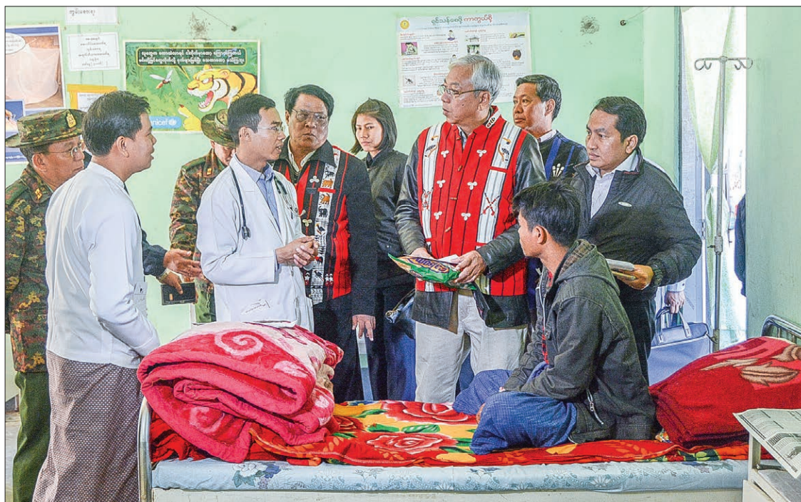
President U Htin Kyaw, third from right, at Namyum People's Hospital yesterday.

Afterwards, Lieutenant-General Ye Aung, Union Minister, explained the acquisition of clean drinking water and the production of hydro-power. Dr Win Myat Aye, Union Minister, spoke of the importance of nutritious food during the time of pregnancy up to the age of two years. Upgrading