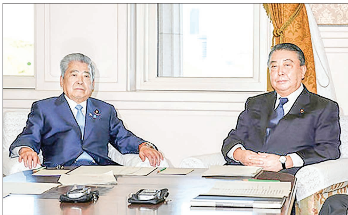
House of Representatives Speaker Tadamori Oshima (R) and his House of Councillors counterpart Chuichi Date meet in Tokyo on 16 January, 2017. After the meeting, Oshima said that members of both houses of the Diet will begin joint discussions on possible legislation enabling Emperor Akihito to abdicate despite a range of differing opinions being held across the party spectrum.

TOKYO — Members of both houses of the Diet will begin joint discussions on possible legislation enabling Emperor Akihito to abdicate despite a range of differing opinions being held across the party spectrum, lower house speaker said on Monday.