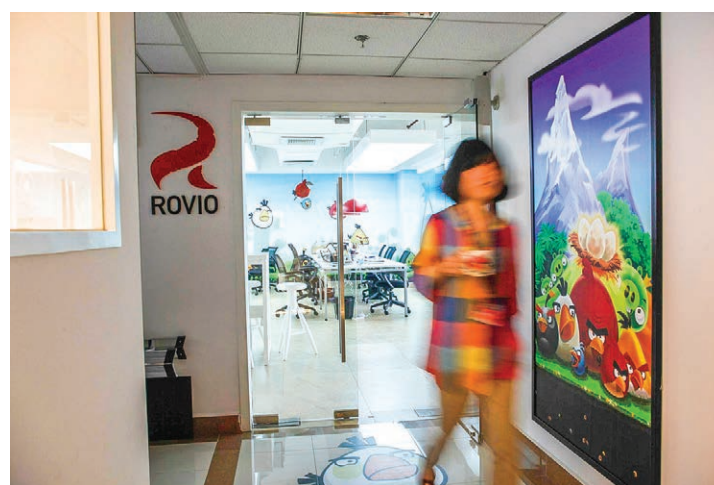
An employee walks out an office of Rovio, the company which created the video game Angry Birds, in Shanghai on 20 June, 2012.