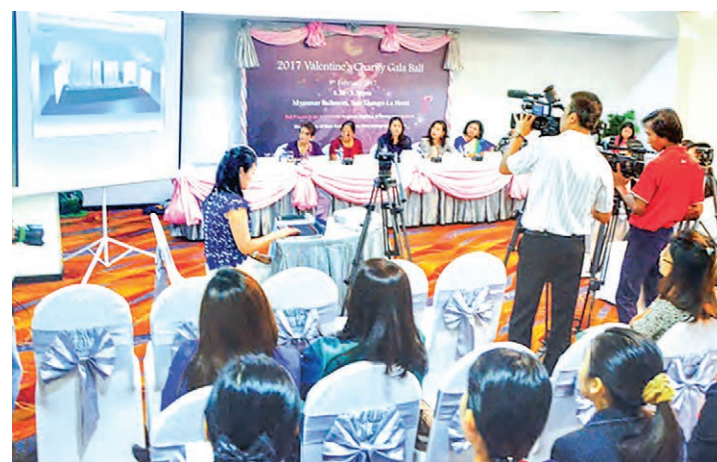
Press conference on 2017 Valentine’s Charity Gala Ball at Sule Shangri-La Hotel in Yangon.

The International Cultural and Charity Group has previously donated a school building worth over Ks40 million in Thawawaddy.