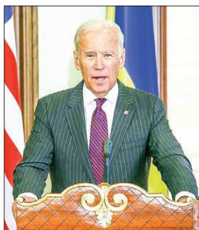
US Vice President Joe Biden.

“You're fighting both the cancer of corruption ... and the unrelenting aggression of the Kremlin,” Biden told reporters, standing