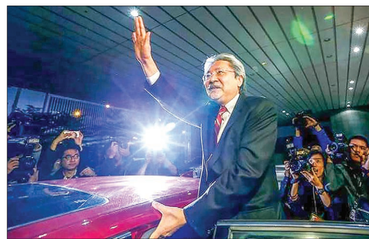
Hong Kong Chief Secretary Carrie Lam leaves after speaking to journalists on her resignation in Hong Kong, China on 12 January, 2017.

Hong Kong’s incumbent, Beijing-backed leader, Leung Chun-ying, surprised many in early December when he said he would not seek a second term of office. China’s State Council also said it had approved Hong Kong’s development secretary Paul Chan to replace Tsang and labour and welfare secretary Matthew Cheung as a replacement for Lam.—Reuters