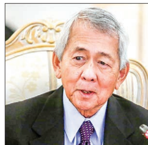
Philippine Foreign Minister Perfecto Yasay.

China claims almost the entire South China Sea, through which about $5 trillion worth of goods passes every year. An international arbitration ruling last year invalidated those claims. Speaking up about that has become a tricky issue for the Philippines since President Rodrigo Duterte turned its foreign policy upside down by seeking