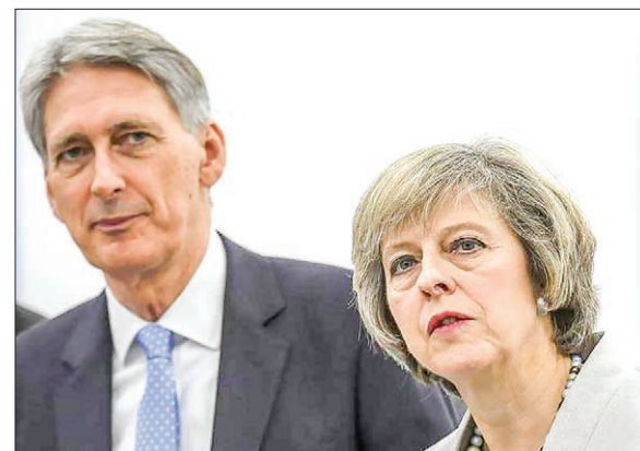
Britain's Prime Minister Theresa May and Chancellor of the Exchequer Philip Hammond tour the Renishaw innovation and engineering plant in Wootton, south west England, in Britain, on 24 November, 2016.

The spokeswoman declined to comment on a fall in sterling to three-month