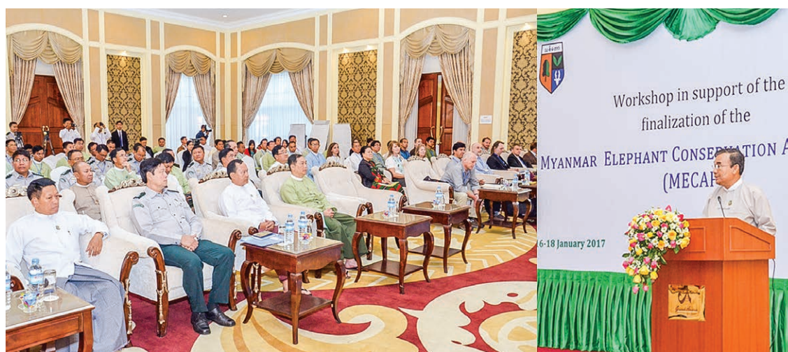
Union Minister U Ohn Win addresses an opening speech at MECAP Review Workshop in Nay Pyi Taw.

The opening ceremony of the Myanmar Elephant Conservation Action Plan – the MECAP Review Workshop – was held at Grand Amara Hotel yesterday morning in Nay Pyi Taw.