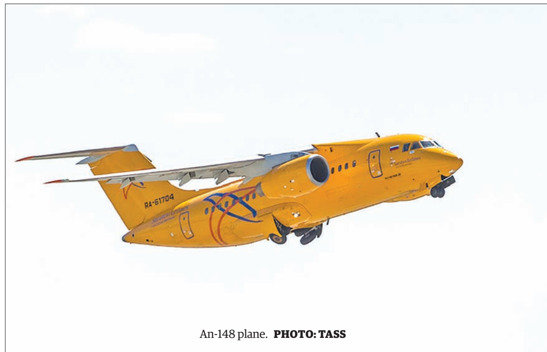
An-148 plane.