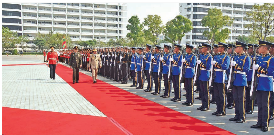
Senior General Min Aung Hlaing and Chief of Defence Force of the Royal Thai Armed Forces Gen. Tarnchaiyan Srisuwan inspect the Guard of Honour in Thailand.

established in 1869 by King Rama V and is awarded to royalty, government employees and foreign dignitaries for their outstanding services to Thailand.