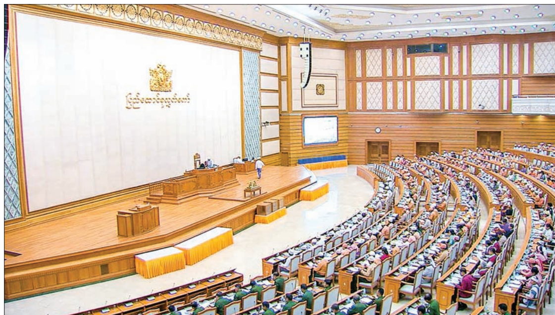
Pyidaungsu Hluttaw is being convened in Nay Pyi Taw.

The suggestion and comment part of the report noted that only the investment amount for works to be conducted during the six-month period from April to September 2018 was shown, but the status of the projects had not been described. The National Planning Law is enacted to implement the national plans completely, and project