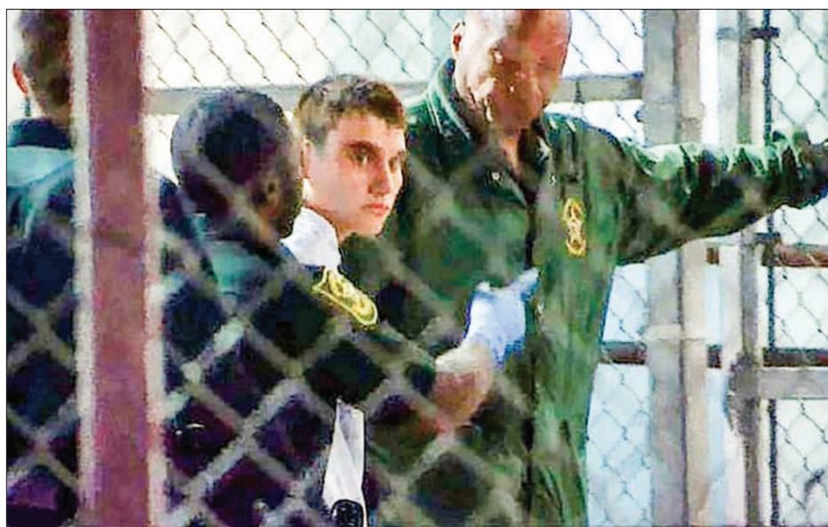
Florida shooting suspect Nikolas Cruz, seen at Broward County Jail in Ft. Lauderdale, Florida on 15 February 2018.

charged with 17 counts of premeditated murder, appearing Thursday afternoon via video link before a judge who ordered him held without bond. More than a dozen other people were injured in the shooting spree.