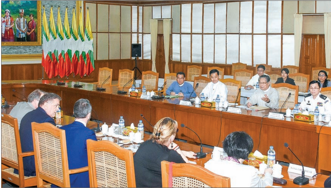
Union Minister U Kyaw Tint Swe holds talk with Chairman of the European Parliament's Subcommittee on Human Rights Mr. Pier Antonio Panzeri in Nay Pyi Taw yesterday.

ing were Senior Officials from the Ministry of Foreign Affairs, the Ministry of the Office of the State Counsellor, the Ministry of Labour, Immigration and Population, and the Ministry of Social Welfare, Relief and Resettlement.—Myanmar News Agency