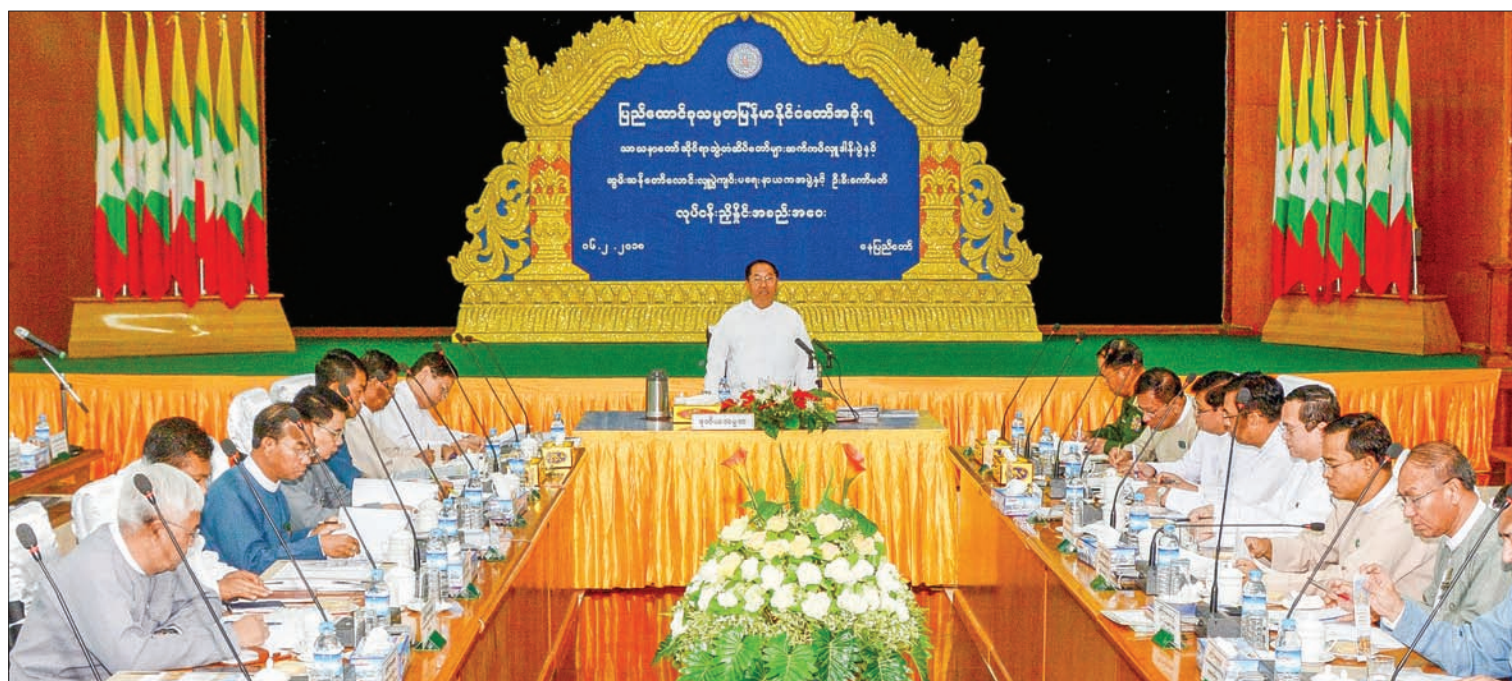
Vice President U Myint Swe addresses the coordination meeting of the patron committee and steering committee to successfully hold the ceremony to award religious titles and donate dry rations in Nay Pyi Taw yesterday.

emonies and were traditionally held since the days of the Myanmar kings. They had been held by successive governments to confer the highest religious titles. The day before the titles are presented, the Government of the Republic of Union of Myanmar offers "soon." On the full-moon day of Tabauing, religious titles are conferred and then the ceremony for the donation of dry rations is held. Therefore, the work committee and the sub-committees need to work in cooperation and coordination, and based on the experiences of the ceremonies held earlier, need to ensure there are no mis-