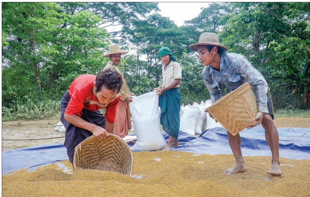
Farmers work at a field in Kangyidaung, Ayeyawady.