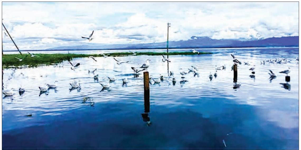
Indawgyi Lake in Mohnyin, Kachin State.

"There are restricted areas where fishing is prohibited and there are distribution zones for fish species under the management of the Department of Fisheries. In addition, fish conservation areas