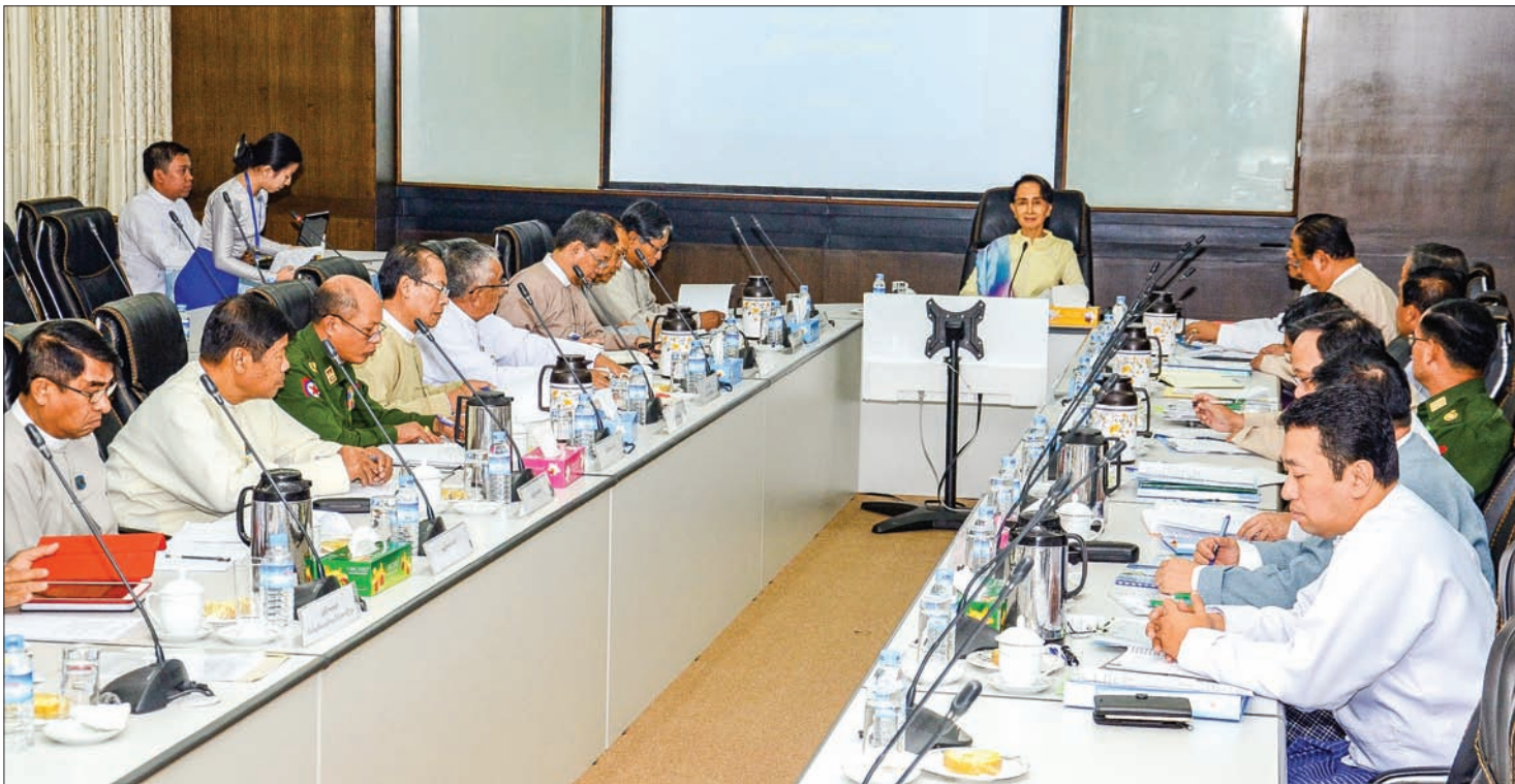
State Counsellor Daw Aung San Suu Kyi delivers a speech at the Nay Pyi Taw diplomatic zone land policy coordination meeting.