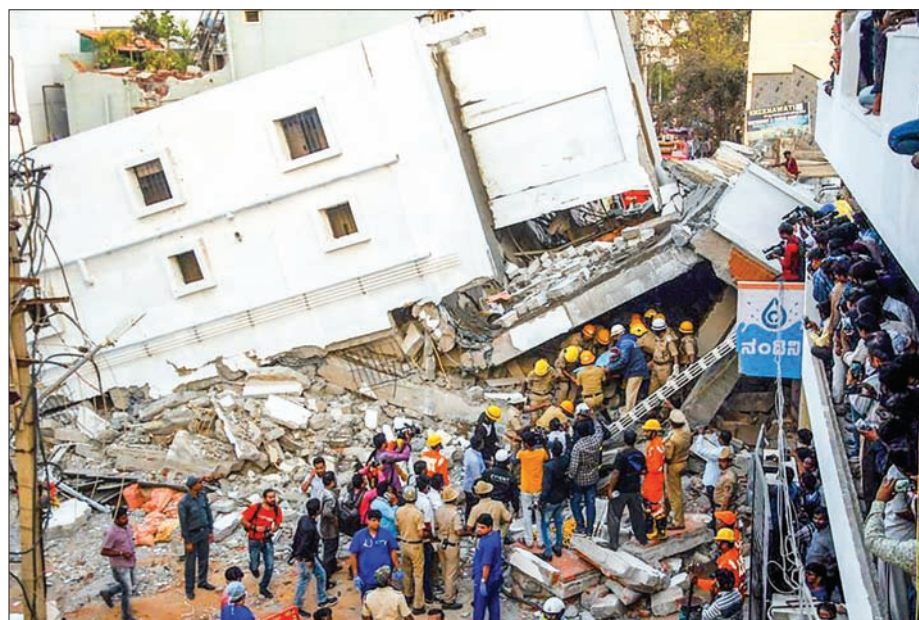
Rescue members search for trapped victims in Bengaluru, India on 15 February 2018. At least three people were killed Thursday after an under-construction building collapsed in southern Indian city of Bengaluru, officials said.

In a statement, the FBI said it had carried out "database reviews and other checks" but was unable to identify the person who made the post.—Tass ■