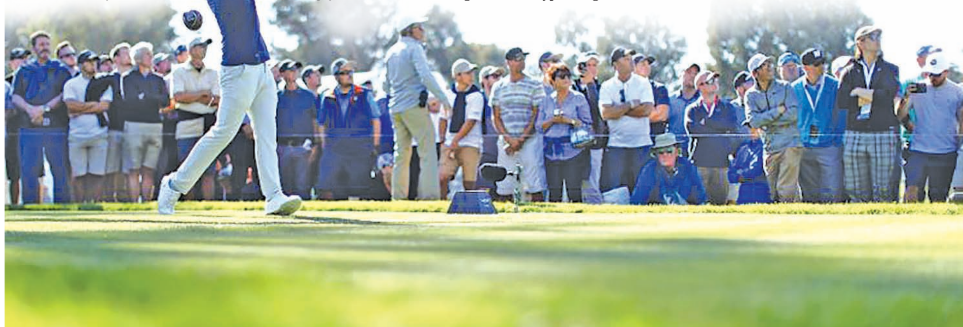
Patrick Cantlay of the US plays his shot from the ninth tee during the first round of the Genesis Open, at Riviera Country Club in Pacific Palisades, California, on 15 February 2018

Nothing seemed easy for world number one Dustin Johnson, who launched his title defense with a three-over par 74.—AFP ■