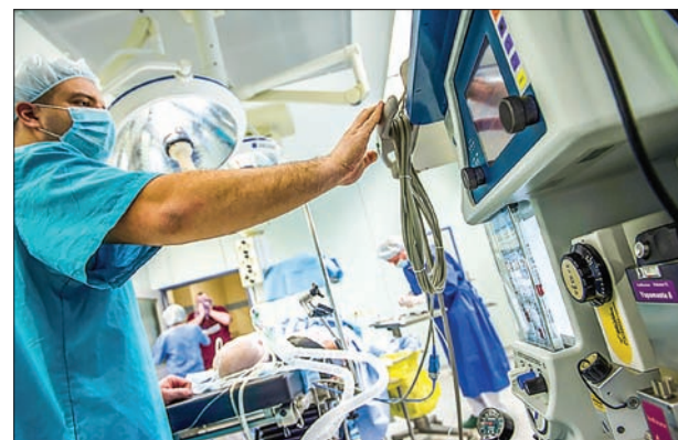
Around 3,500 children are diagnosed with oncological diseases every year.