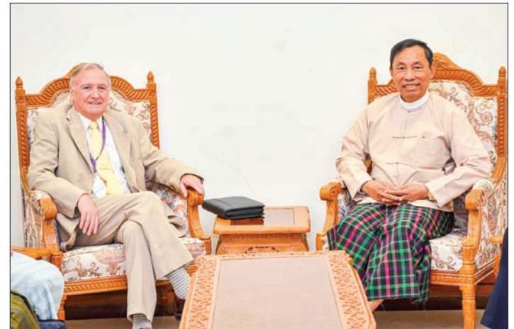
Thura U Shwe Mann meets Rt. Hon. Lord Malcolm Bruce of Bennachie in Nay Pyi Taw yesterday.

THE chairman of Pyidaungsu Hluttaw's Legal Affairs and Special Cases Assessment Commission Thura U Shwe Mann received a delegation from the Westminster Foundation for Democracy (WFD) led by Rt. Hon. Lord Malcolm Bruce of Bennachie and For-