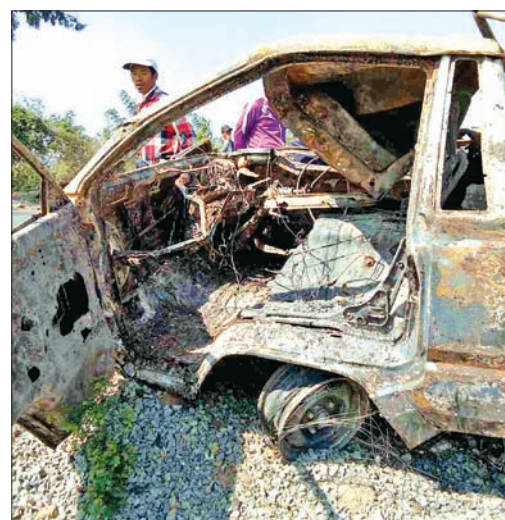
Burnt car seen in Kanbalu, Sagaing Region on Thursday.

According to the traffic police, the incident occurred at around 8 am between mile posts No. 28/4 and 28/5 near bridge No. 1/50 on Mandalay-Shwebo-Myintkyina Union Highway, close to Htockshar Village in Zegon Town. Daw Hla Yi died on the spot while nine other passengers who had sustained minor injuries were taken to the nearby hospital immediately. The police are still investigating the case and are on the lookout for the driver of the car, identified as Pyae Sone Aung, 25, who fled the scene after the accident. Charges will be filed against him for reckless driving under Section 337/338/304 (a) and 285 of the Penal Code.—Chit San (KhinU) ■