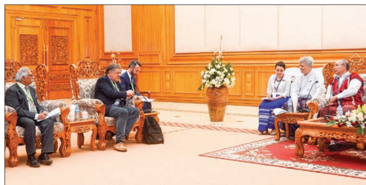
Speaker of the Amyotha Hluttaw Mahn Win Khaing Than holds talks with Mr. Pier Antonio Panzeri in Nay Pyi Taw.

An explanation by union-level organisations and the decision of the Hluttaw on the loan is scheduled to be held during the ninth-day meeting. ■