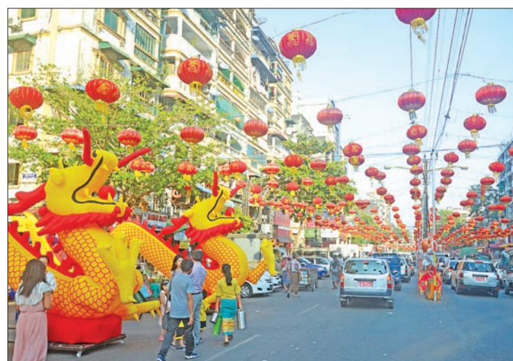
Mahabandula Street in downtown Yangon is festooned with red lanterns in celebration of the Chinese Lunar New Year of the Dog, on 15 February 2018.