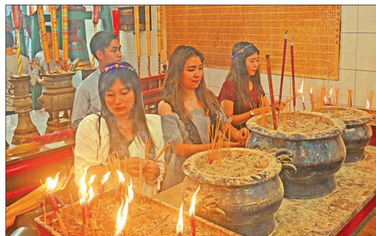
Women pray during celebrations of the Chinese Lunar New Year of the Dog at a temple in Chinatown in Yangon, on 16 February 2018.