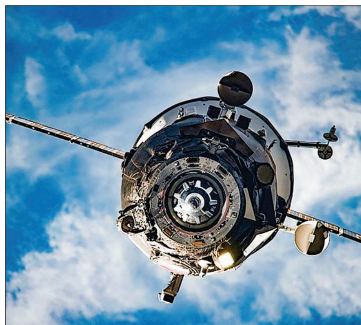
A Progress MS-08 cargo spacecraft has docked with the International Space Station after a two-day flight around the Earth.

Russia may return to the new two-rotation scheme during the launch of the next Progress MS-09 resupply ship scheduled for 10 July this year.—Tass ■