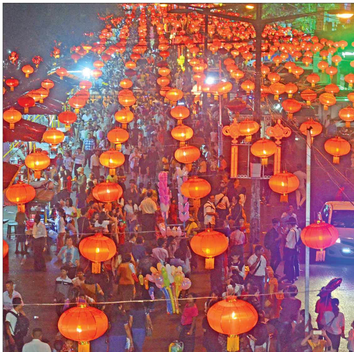
People below Chinese lanterns during celebrations of the Chinese Lunar New Year of the Dog at a temple in Chinatown in Yangon, on 16 February 2018.