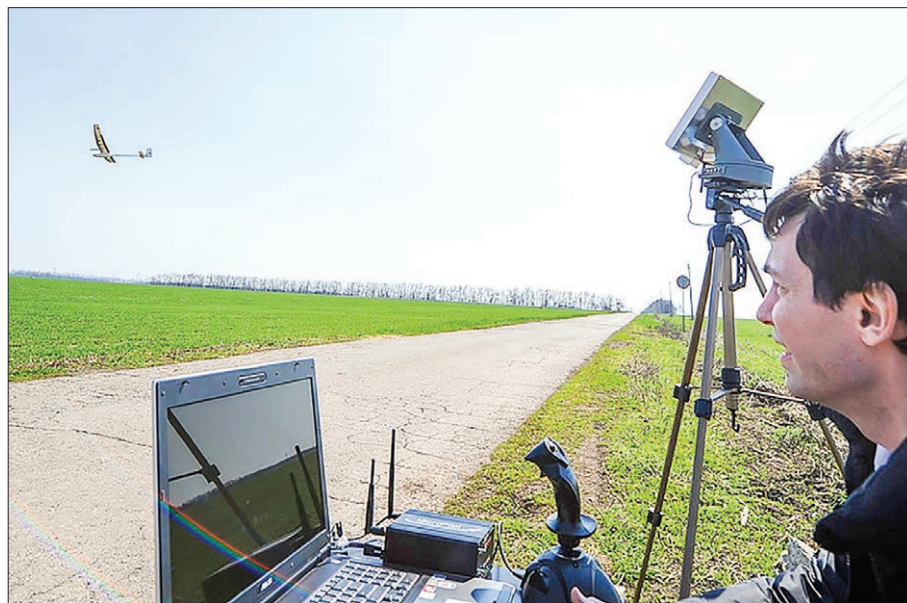
Russian manufacturers have come up with a pilot project of a medium class vertical takeoff drone Fregat.

"The way I see it, it is very low for now. Regulatory matters, security, the availability of technologies and the product's economic