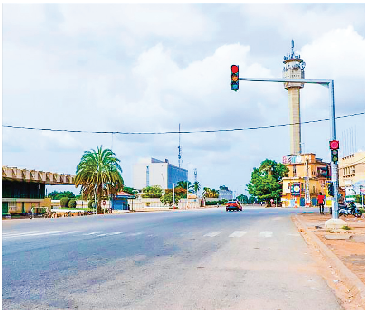
An empty street is seen in Bouake, Ivory Coast on 14 May, 2017.