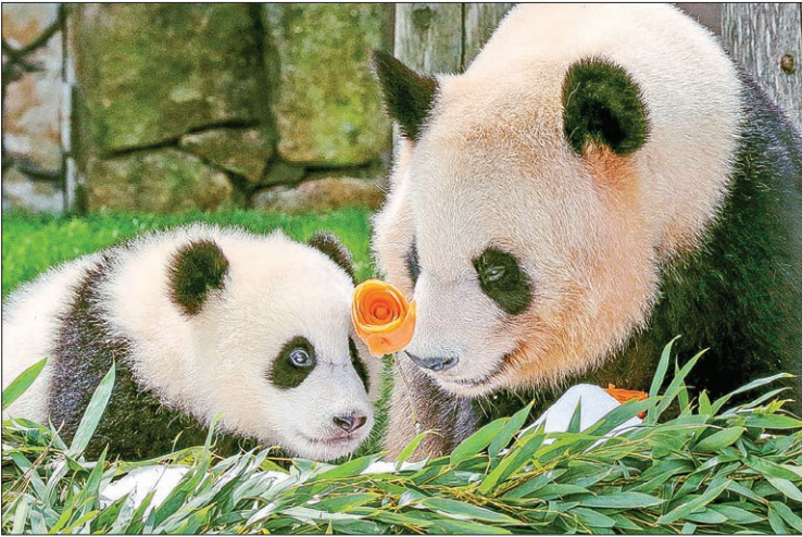
Carnation flowers made of carrots are given as a Mother’s Day gift to Rauhin (R), a female giant panda who has given birth to eight cubs, at the Adventure World zoo amusement park in the town of Shirahama, Wakayama Prefecture, on May 14, 2017. At left is her female cub Yuihin, born in September 2016.

Rauhin was born at the zoo in September 2000. Among her eight offspring is female cub Yuihin, born in September 2016. —Kyodo News ■