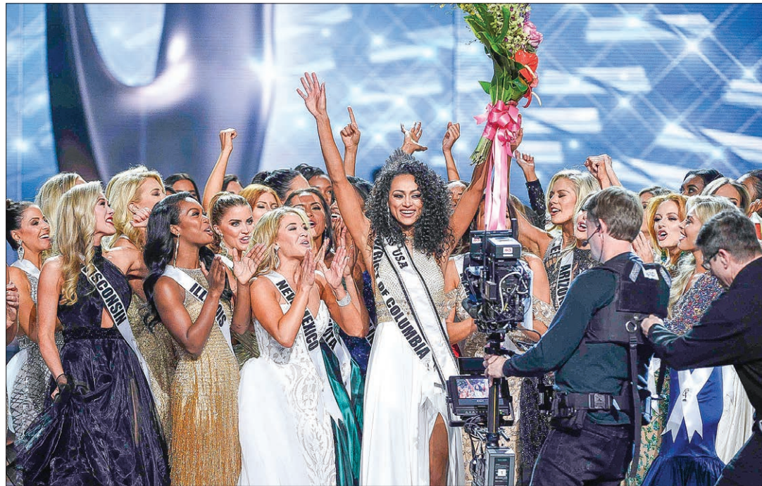
Miss District of Columbia Kara McCullough reacts after being crowned 2017 Miss USA in Las Vegas, Nevada, US on 14 May, 2017.

For her question as one of three finalists, McCullough was asked about healthcare rights, and replied that affordable healthcare was a privilege for people who held jobs. The response drew some stinging criticism on social media platforms such as Twitter, but also had its defenders.