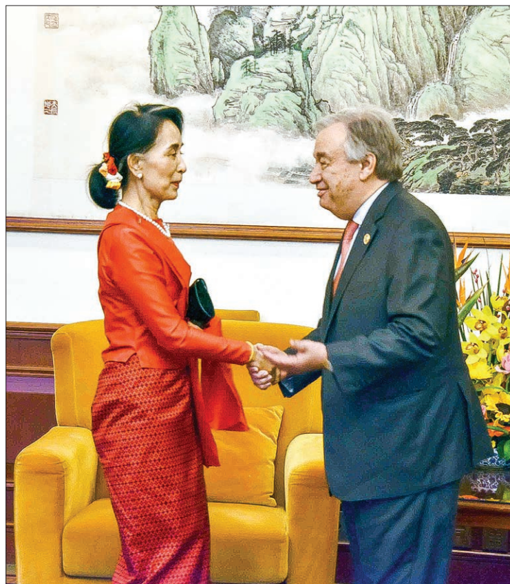
State Counsellor Daw Aung San Suu Kyi meets the United Nations Secretary General Mr. Antonio Guterres.

In the evening, the State Counsellor met the United Nations Secretary General Mr. Antonio Guterres in the Diaoyutai State Guest House and discussed matters relating to the Myanmar peace and reconcili-