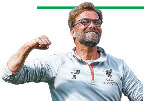
Liverpool manager Juergen Klopp.