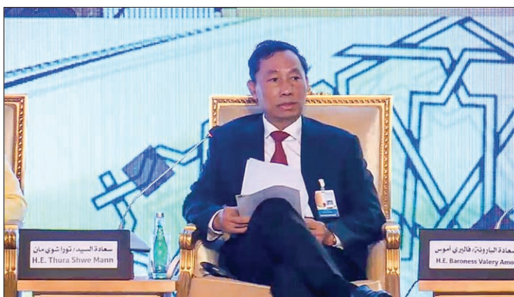
Chairman of Legal Affairs and Special Cases Assessment Commission Thura U Shwe Mann attends at 17th Doha Forum.

Presently the Central Committee for Stability, Peace and Development in Rakhine State, led by State Counsellor Daw Aung San Suu Kyi has been dealing with these problems. The government is placing great importance on the provision of