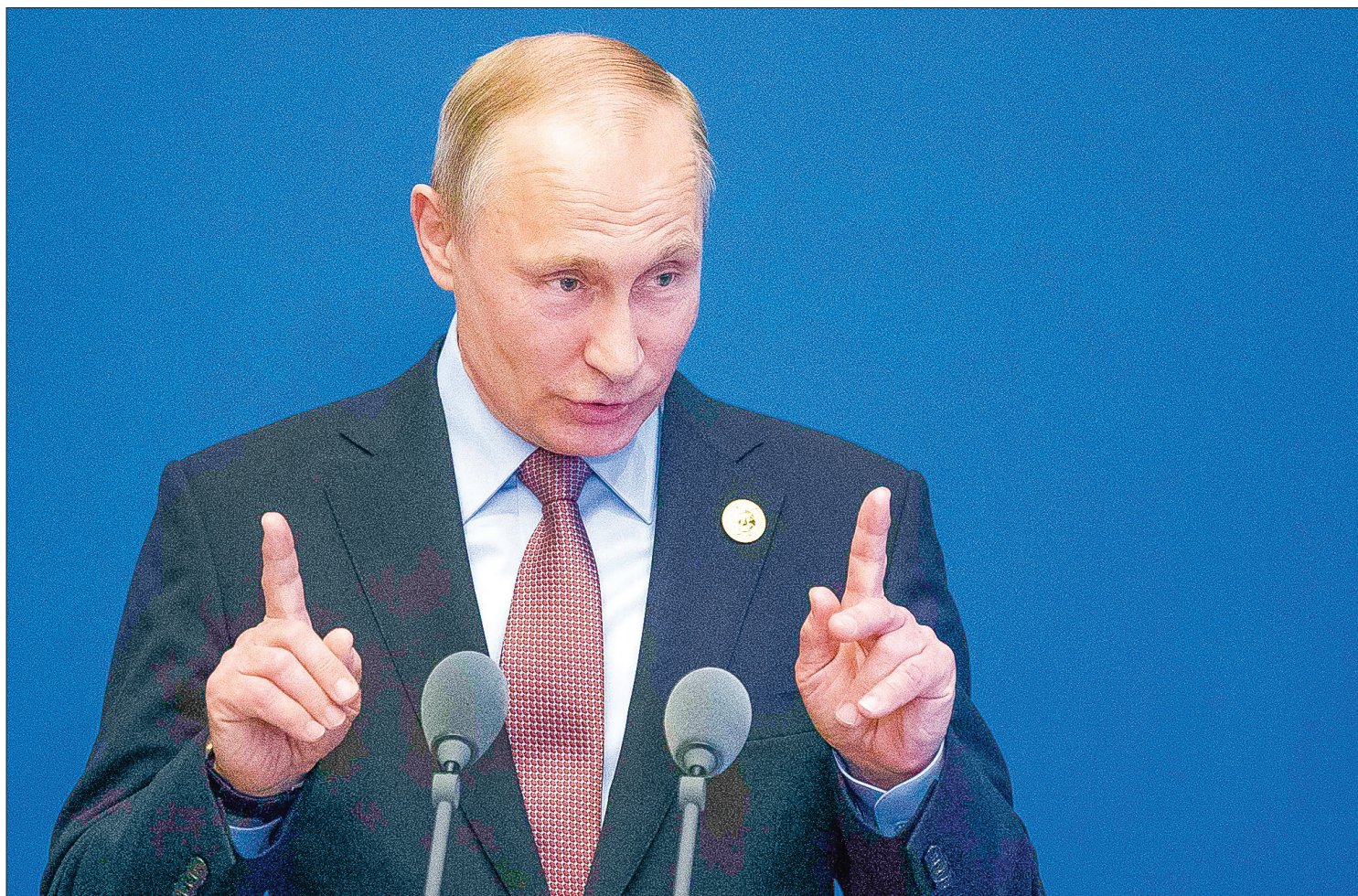
Russian President Vladimir Putin gestures while speaking to the media after the Belt and Road Forum at the China National Convention Center on Yanqi Lake just outside Beijing, China on 15 May, 2017.