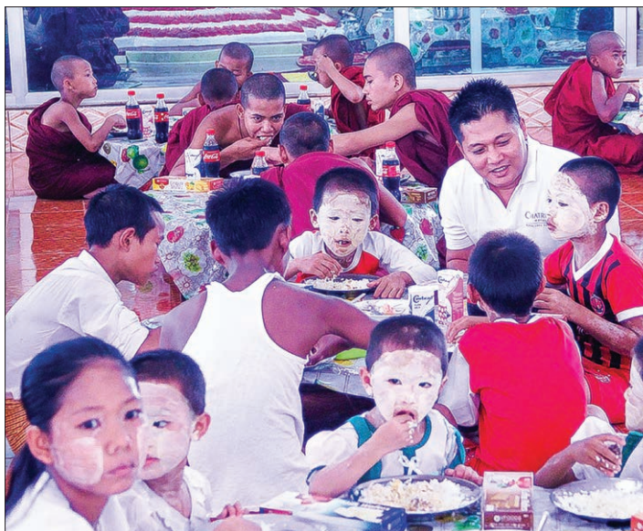
Monks, children and assembled guests having meals in the newly renovated Narawat Monastic School in Shwepyitha township.