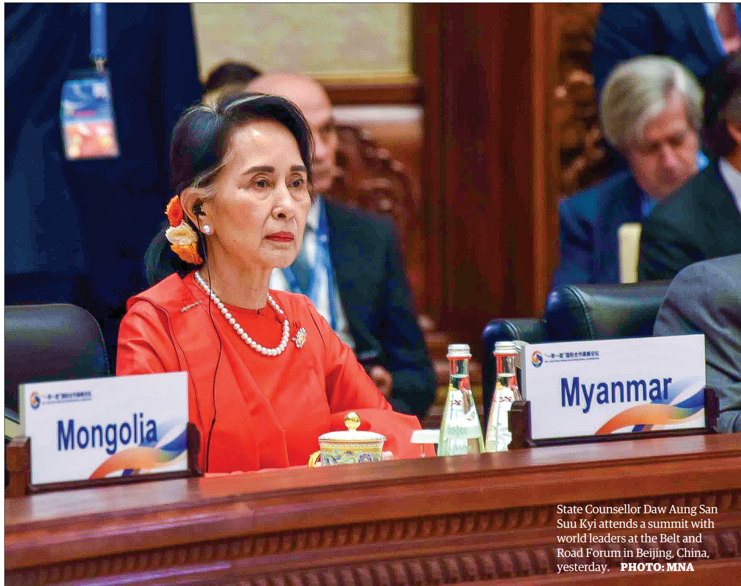
State Counsellor Daw Aung San Suu Kyi attends a summit with world leaders at the Belt and Road Forum in Beijing, China, yesterday.