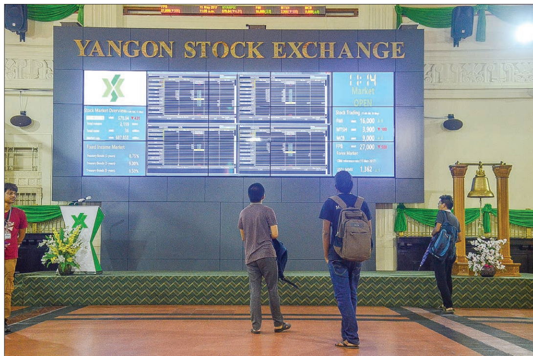
Visitors look at the board showing the stock exchange rates in YSX.