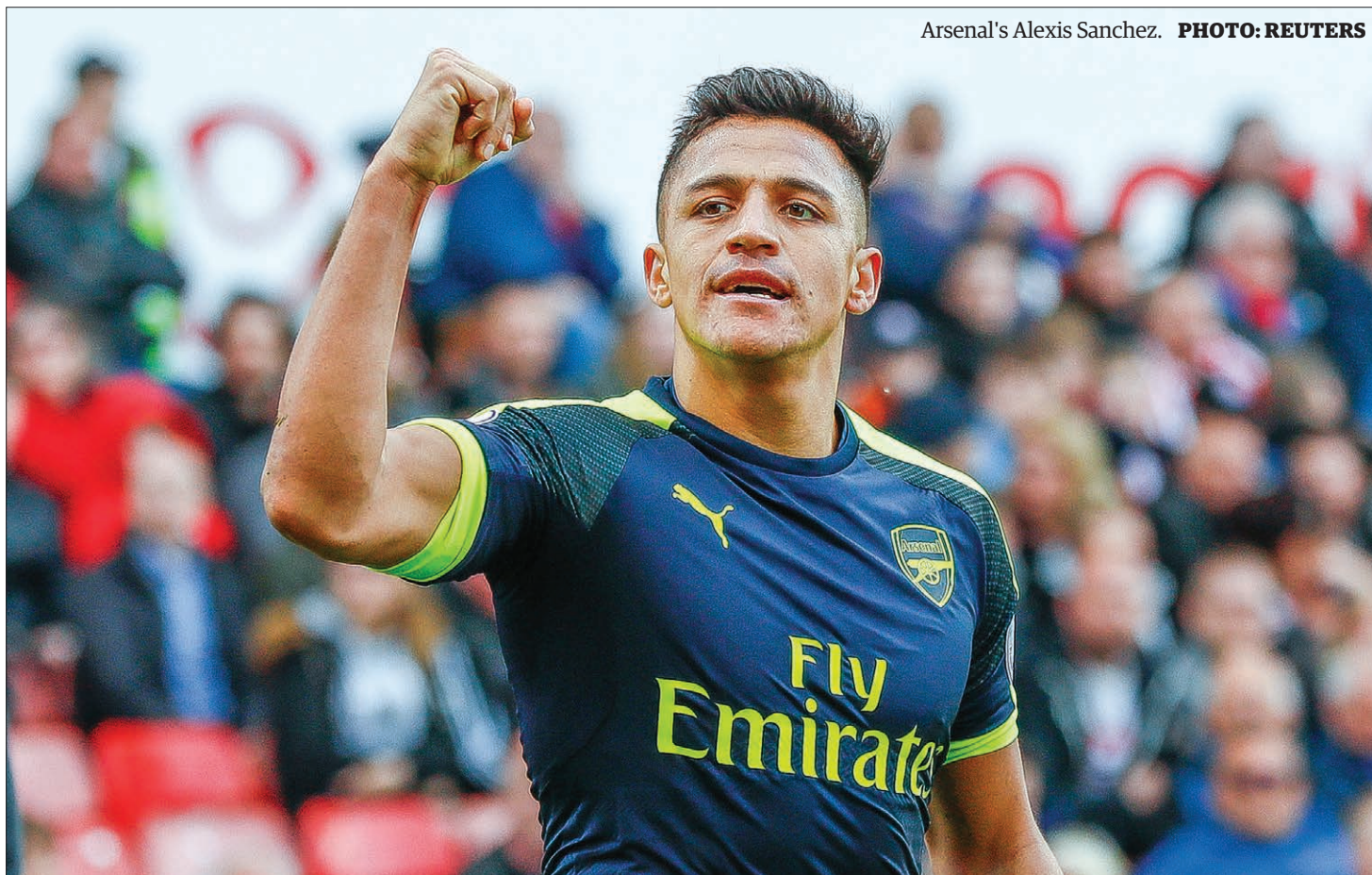
Arsenal's Alexis Sanchez.

His smartness was fantastic, and hopefully we can go through this week without injuries." Sturridge's hip, calf and ankle injuries have limited him to just 26 appearances this season, with the 27-year-old scoring seven goals. Liverpool, who are battling to hold on to a place in the top four, host relegated Middlesbrough in their last game of the season on Sunday. —Reuters ■