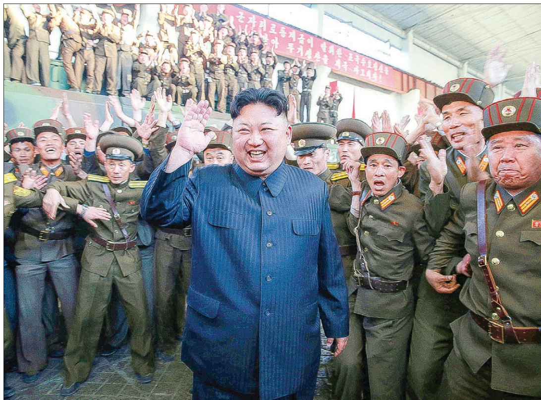
North Korean leader Kim Jong Un reacts with members of the Korean People's Army in this undated photo released by North Korea's Korean Central News Agency (KCNA) on 15 May, 2017.