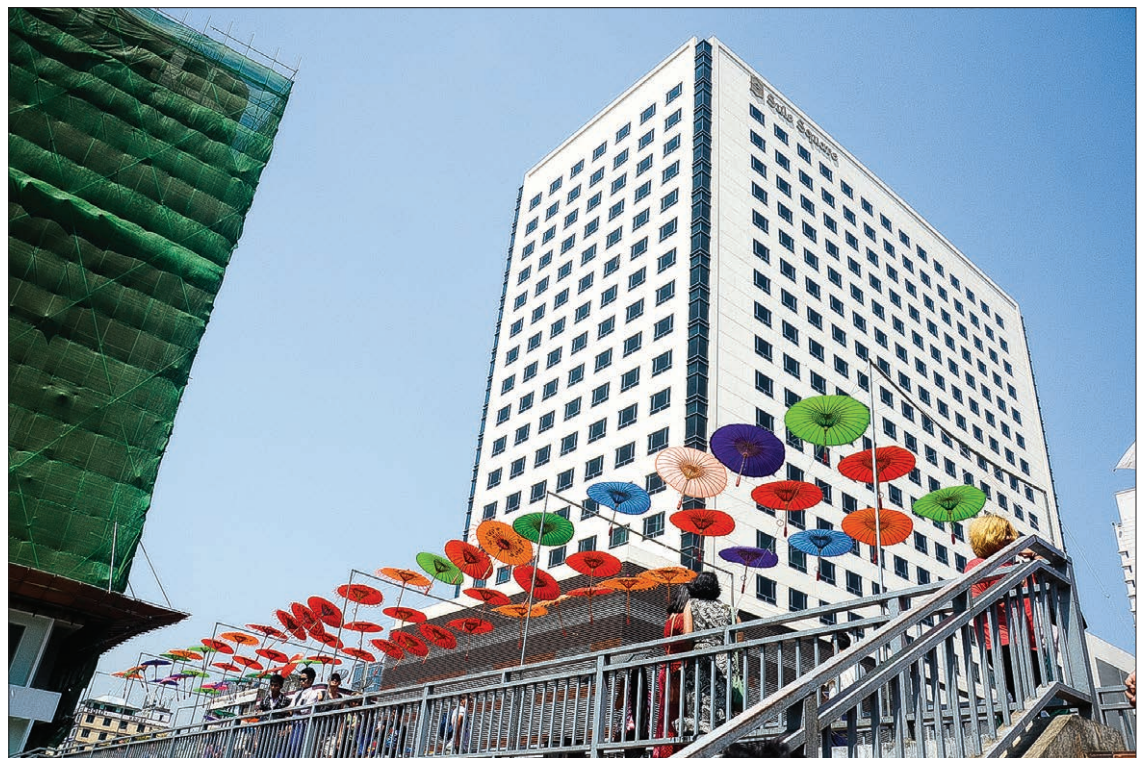
Downtown real estates may also profit from the increased rental prices.

In the office rental market, online rental service has increased, according to rental agencies. Although the rental price has increased, compared to the same period last year it is still lower by 20 per cent.