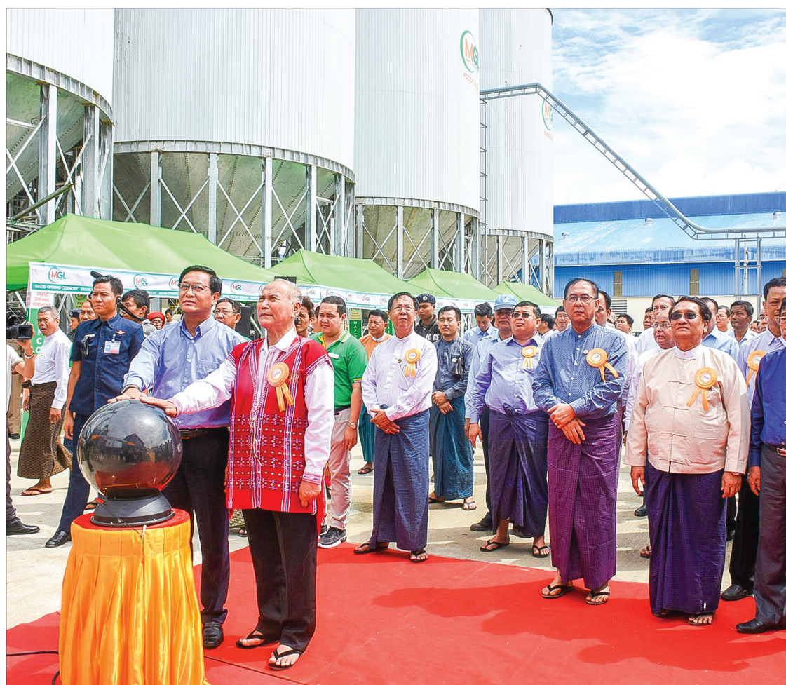
Vice President U Henry Van Thio (Left) and Chief Minister of Ayeyawady Region Mann Jonny unveil the signboard of the MAPCO Golden Lace modern rice mill and the biomass power plant.

high-quality storage buildings and drying machines for better quality of crops, plus grinding, refining and packing machines will have to be included in order to make a high-quality product.