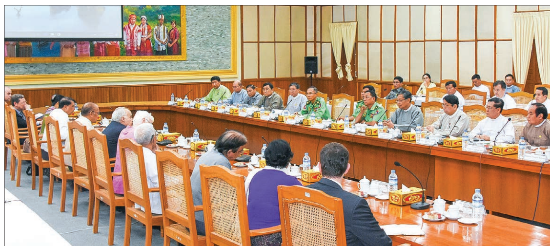
A meeting between Rakhine Advisory Commission and Central Committee on Implementation for Peace, Stability and Development for Rakhine State in Nay Pyi Taw yesterday.

National Reconciliation and Peace Centre (Unofficial Translation)