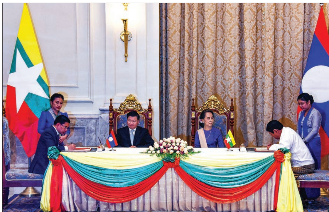
State Counsellor Daw Aung San Suu Kyi and Laotian Prime Minister Thongloun Sisoulith attend the signing ceremony of Memorandum of Understandings between Myanmar and Laos yesterday.

The Myanmar-Laos bilateral meeting was also attended by Union Minister for Home Affairs Lt-Gen Kyaw Swe, Union Minister for Defence Lt-Gen Sein Win, Union Minister for Construction U Win Khaing, Union Minister for Education Dr. Myo Thein Gyi, Union Minister for Planning