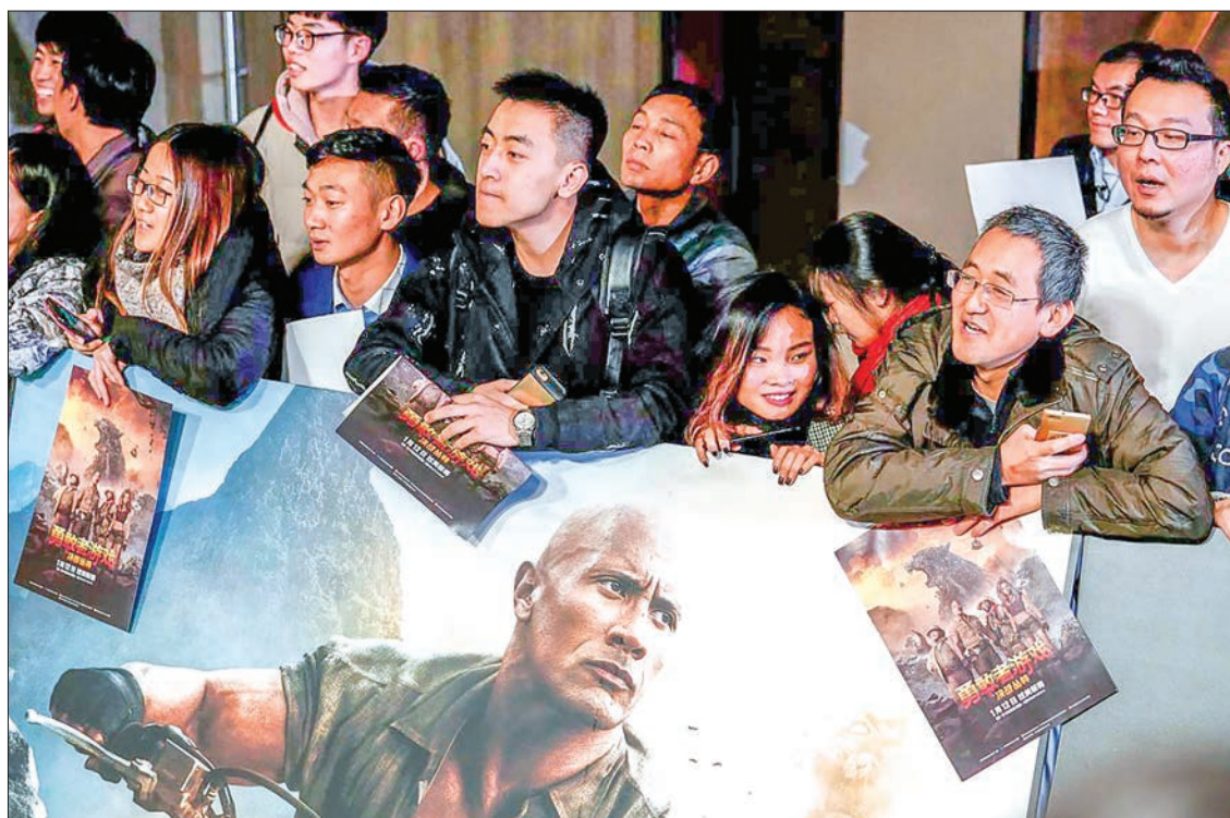
Fans wait for a red carpet event promoting actor Dwayne Johnson’s new film “Jumanji: Welcome to the Jungle” in Beijing, China on 4 January, 2018.

Steven Spielberg directs Meryl Streep and Tom Hanks in “The Post,” a political thriller film about the unlikely partnership between The Washington Post’s Katharine Graham, the first female publisher of a major American newspaper, and editor Ben Bradlee, as they race to catch up with The New York Times to expose a massive cover-up of government secrets that spanned three decades and four US presidents. The two must overcome