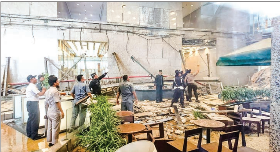
Workers and security examine the damage after a mezzanine floor collapsed at the Indonesia Stock Exchange building in Jakarta, Indonesia on 15 January, 2018.

Police ruled out a bomb as a cause of Monday's collapse. They said at least 77 people had been injured. No deaths had