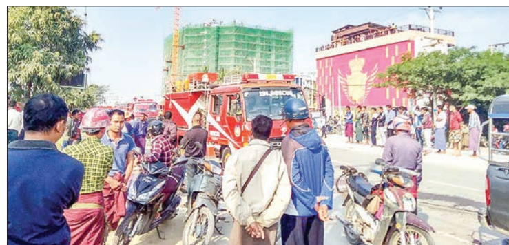
Fire engines seen at the scene of the outbreak of fire.

at the scene of the fire and extinguished it. Additional vehicles arrived ten minutes later to assist the fire fighters according to the initial report of the Fire Service Department.—Myanmar Digital News ■