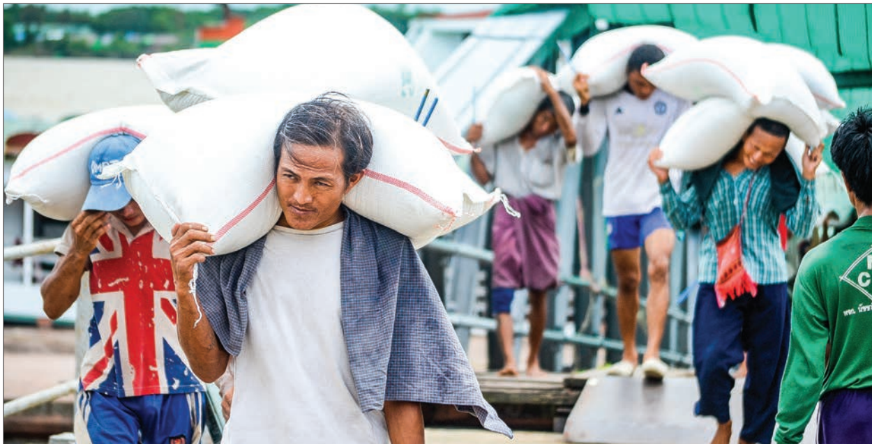
Workers carry rice bags at a jetty in Yangon.