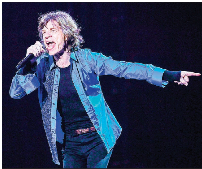
Mick Jagger performs onstage during the Rolling Stones final concert of their 50 and Counting Tour in Newark, New Jersey.

The purpose and duration of Jagger’s visit are yet to be known. —PTI ■