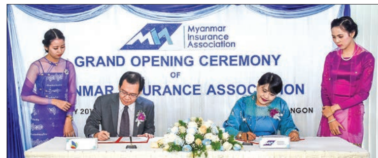
Myanmar Insurance Association signs MoU with Malaysia Insurance Institute during the opening ceremony.

Myanmar Insurance Association was formed with state owned Myanmar Insurance and 11 private insurance companies and was permitted to be formed in 17 October 2017 and the office is now being opened. ■