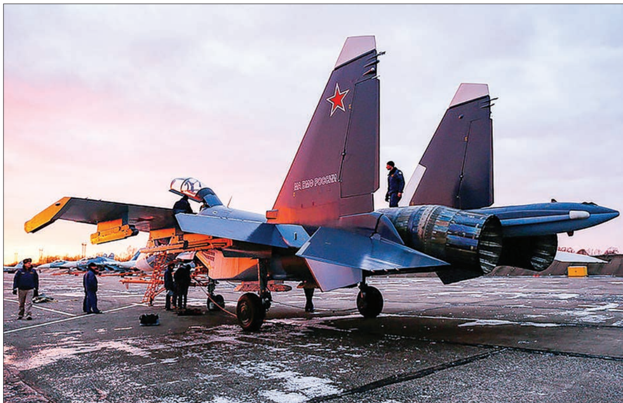
Next week pilots will train in a mixed air force and air defence unit.