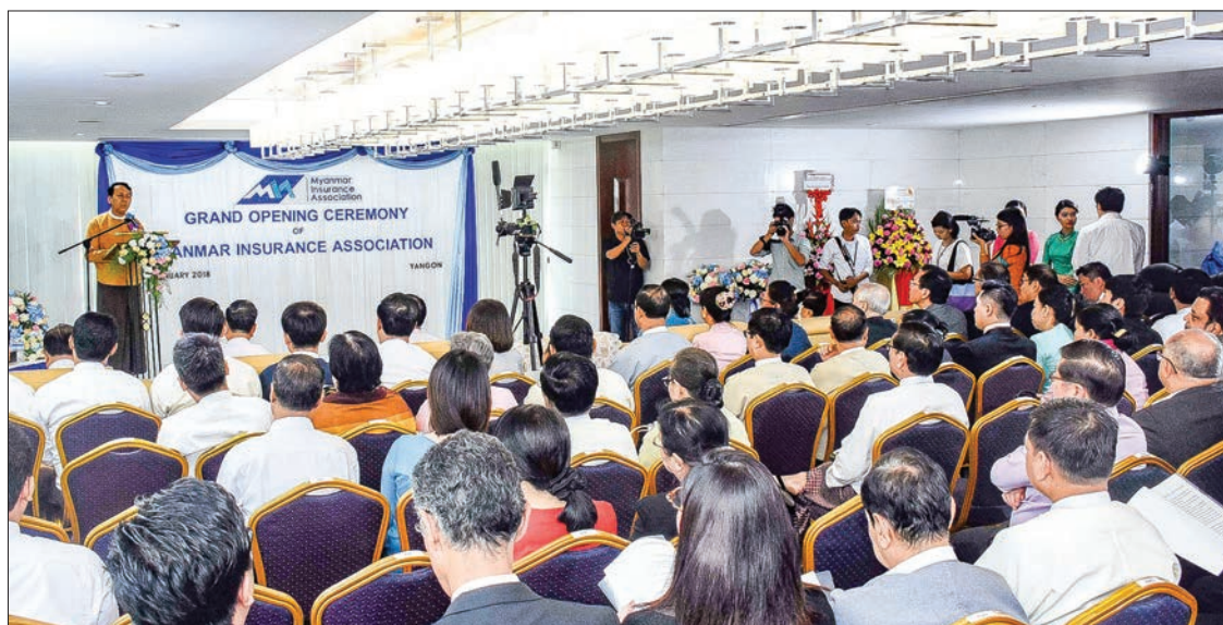
Yangon Region Chief Minister U Phyo Min Thein delivers the speech at the opening ceremony of Myanmar Insurance Association office in Yangon.

Myanmar Insurance Association office is planning to open an insurance school in Yangon. The location is not set