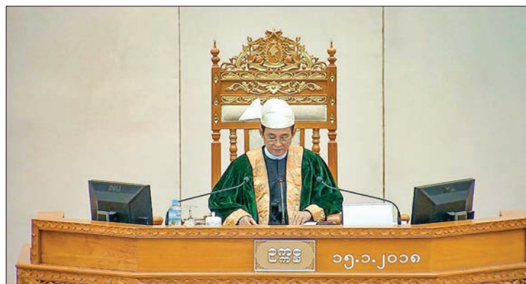
Speaker of Pyithu Hluttaw U Win Myint.

"Hluttaw which reflects the voices of the people should be a legislative pillar which is reliable for the people," said U Win Myint, "representatives of the Hluttaw