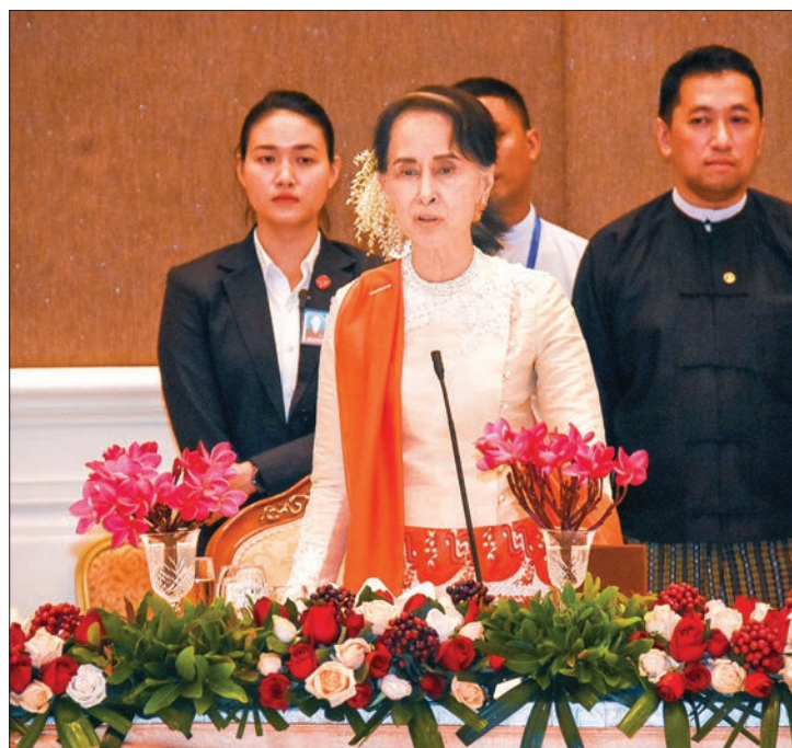
State Counsellor Daw Aung San Suu Kyi extends greeting at the dinner in honour of visiting Laotian delegation.

gation was entertained with a cultural performance by artistes of the Ministry of