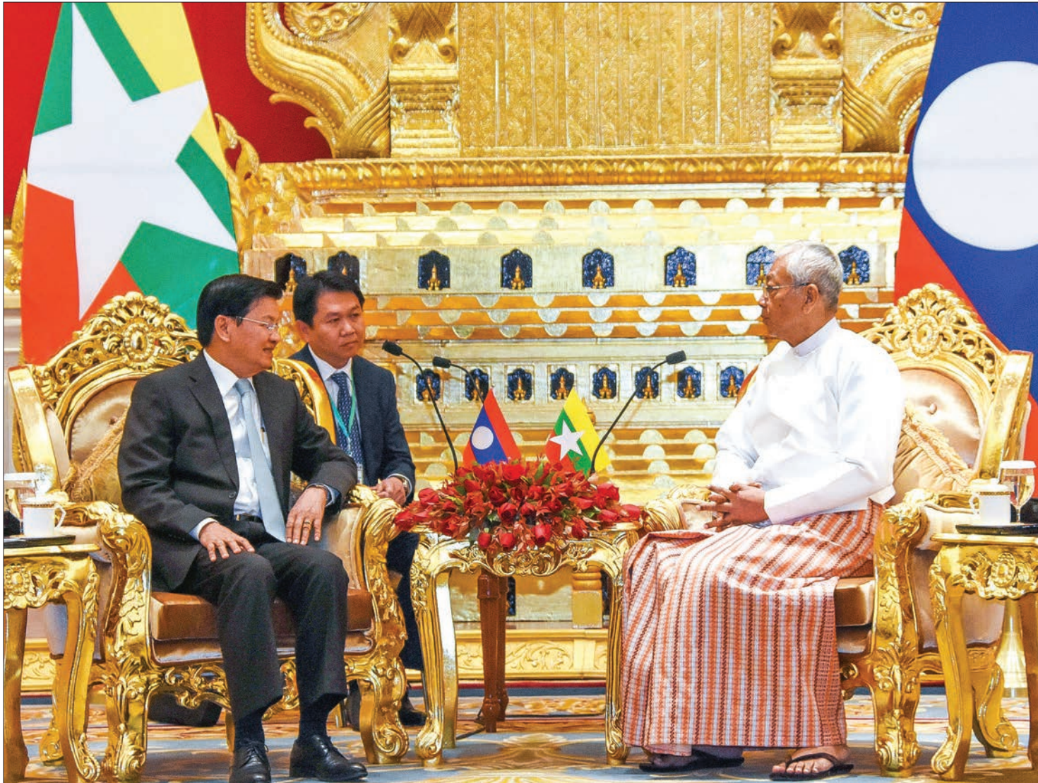
President U Htin Kyaw receives Lao People's Democratic Republic (LPDR) Prime Minister Mr. Thongloun Sisoulith.