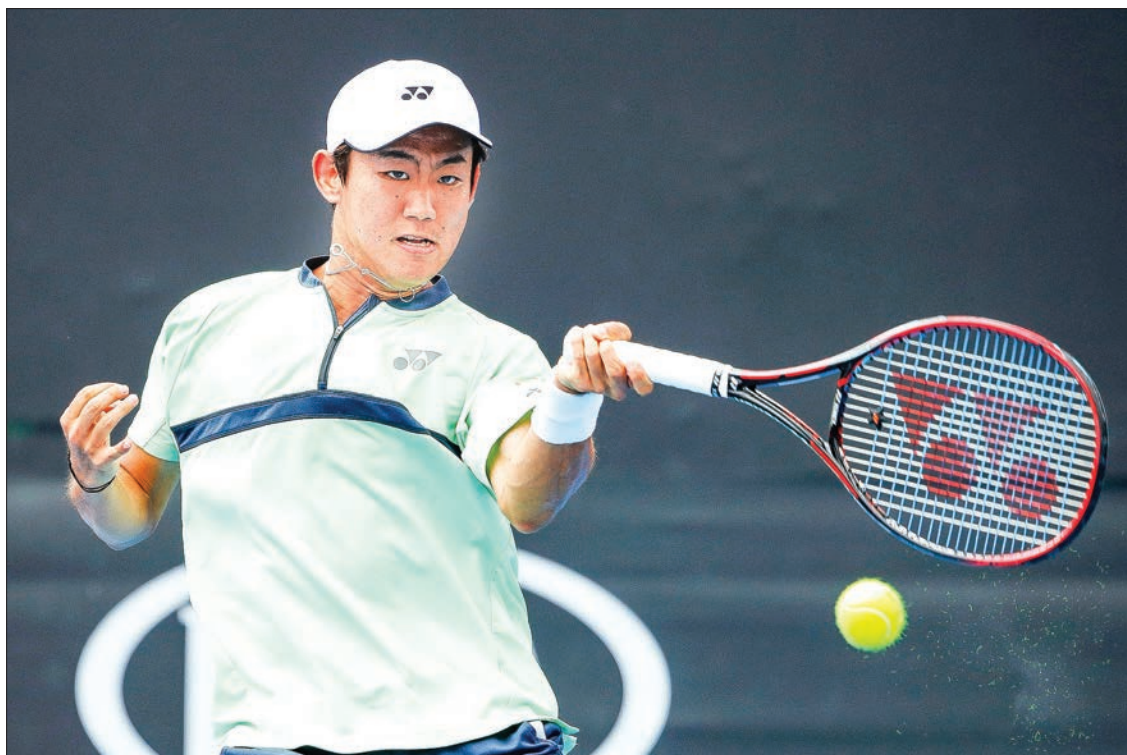
Yoshihito Nishioka of Japan plays a forehand during his first-round match against Philipp Kohlschreiber of Germany at the Australian Open in Melbourne on 15 January, 2018.

Turkey's fourth-most capped player with 100 appearances, Turan will also be hoping to return to his best form for the national side after reversing a decision to retire from international football in August. Turan quit in June but changed his mind a month later after positive talks with new head coach Mircea Lucescu.—Reuters ■