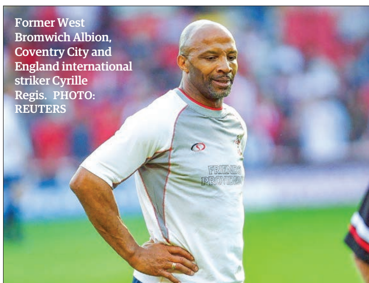
Former West Bromwich Albion, Coventry City and England international striker Cyrille Regis.

Cyrille Regis has died aged at the age of 59, the Professional Footballers' Association (PFA)