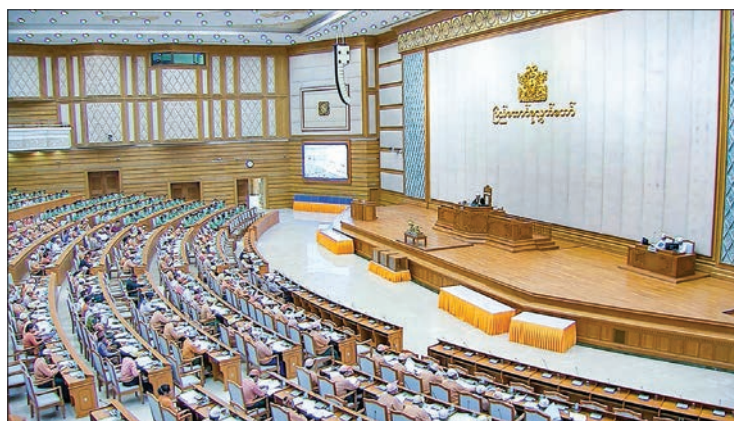
Pyidaungsu Hluttaw is being convened in Nay Pyi Taw.

Union Minister for Planning and Finance U Kyaw Win explained further about the loan and said the grace period is 8 years and repayment period is 17 years, making a total loan period of 25 years. It is an interest-free loan with a management fee of 0.65 per cent of the loan amounting to Euro 32,500,