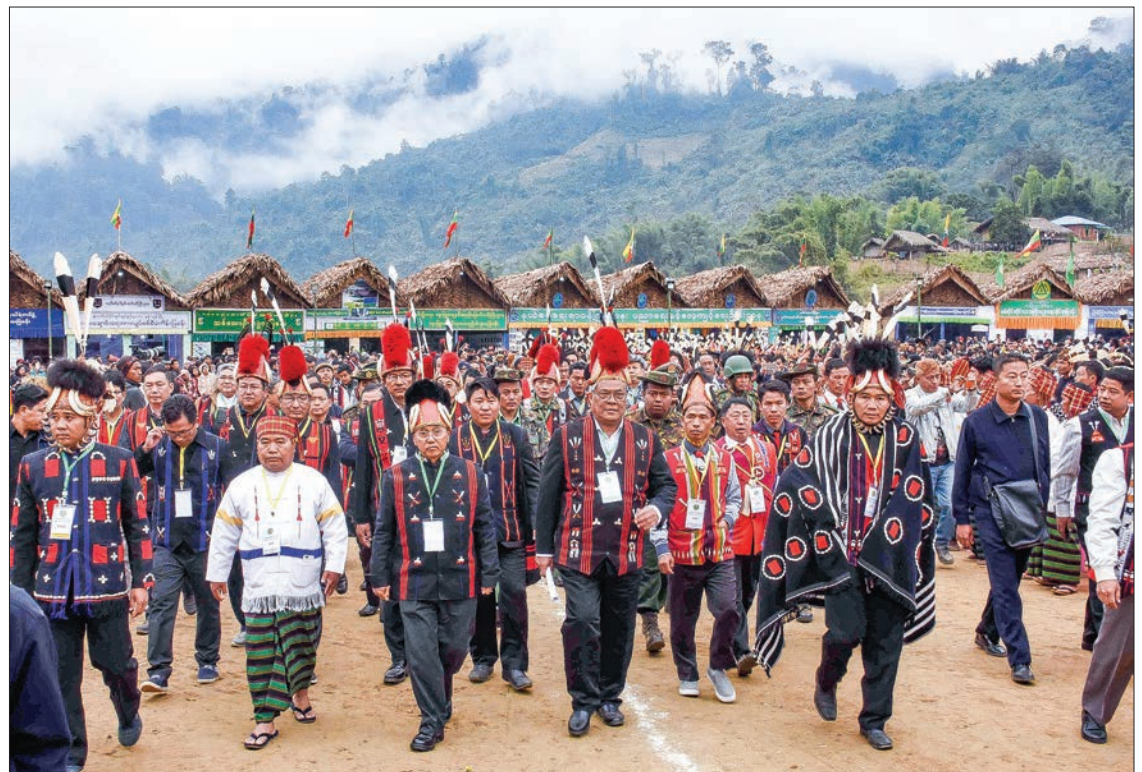
Vice President U Myint Swe arrives at the 2018 Naga Traditional New Year Festival in Nanyun.