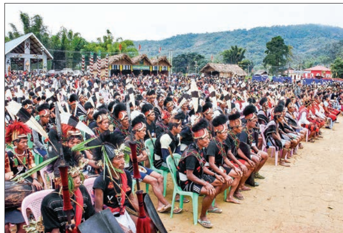
Vice President U Myint Swe delivers the speech at the 2018 Naga Traditional New Year Festival in Nanyun.

"To implement the policies of the government such as national reconciliation, internal peace, establishment of a democratic federal union and improvement in the social living standards of the majority of the people, raising the social living