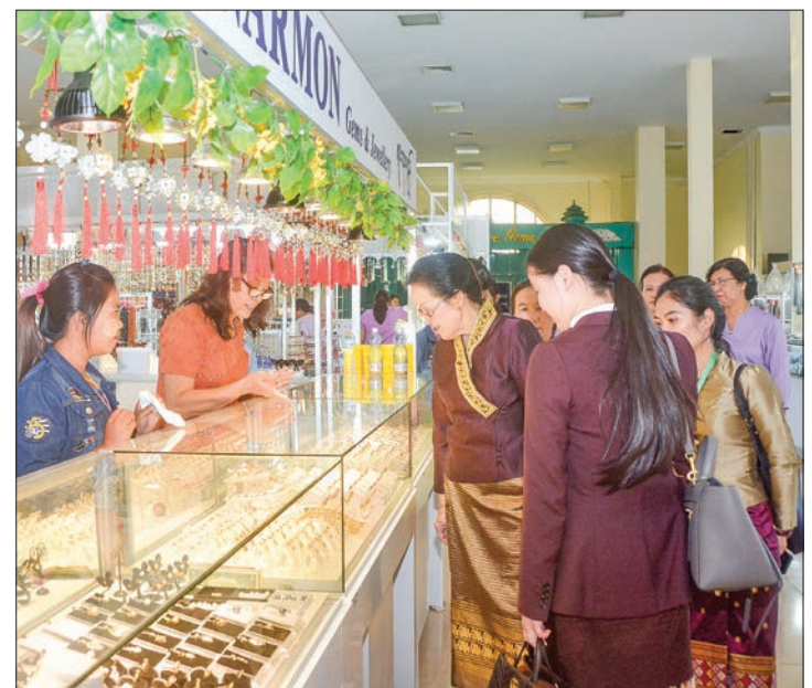
Lao Prime Minister's wife Mrs. Naly Sisoulith visits Myanmar Gems Museum in Nay Pyi Taw.

Following the visit to the pagoda, Mrs Naly Sisoulith visited Myanmar Gems Museum. —Myanmar News Agency ■