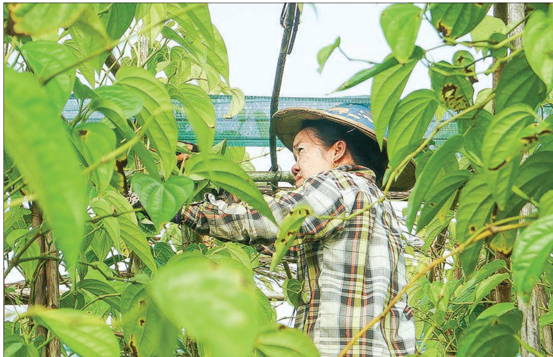
Woman harvests betel leaves at betel farm.

The lower region market depends on the Monywa betel leaf market. "If betel leaves from Monywa enter the mar-