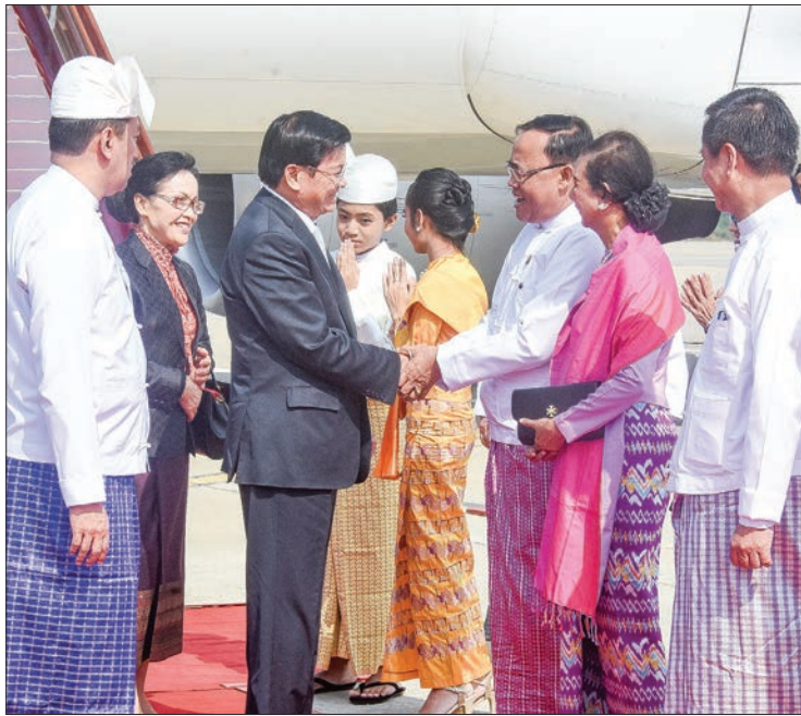
Lao Prime Minister and wife welcomed by Union Minister U Kyaw Tin and officials at Nay Pyi Taw International Airport.

The Lao prime minister, his wife and the accompanying delegation were welcomed by Union Minister for International Cooperation U Kyaw Tin, Deputy Minister for Commerce U Aung Htoo, Myanmar's Ambassador to Laos U Ko Ko Naing, Laos' ambassador to Myanmar Lying Sayasang, their wives and other officials at the Nay Pyi Taw International Airport.—Myanmar News Agency ■