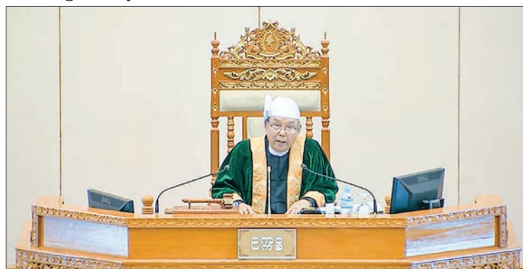
Speaker of Amyotha Hluttaw Mahn Win Khaing Than.

buildings in Kyauktaw Township in middle school level and 178