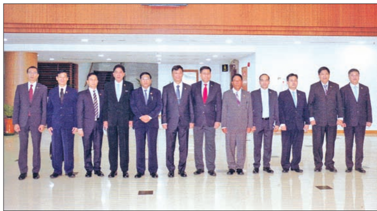
Union Minister Lt-Gen Kyaw Swe and party pose for a documentary photo before departure for Bangladesh.

were seen off at the airport by officials. The Myanmar delegation will discuss matters related to Myanmar-Bangladesh border security, the rule of law, anti-narcotic activities and the opening of a Border Liaison Office during their visit.—Myanmar News Agency ■