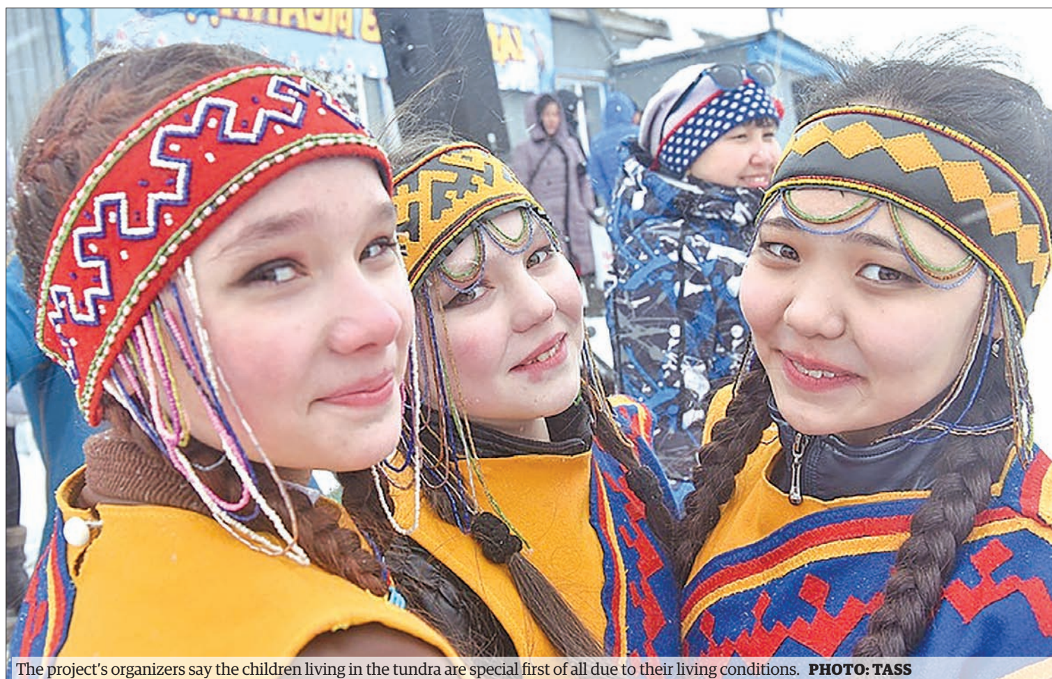
The project's organizers say the children living in the tundra are special first of all due to their living conditions.