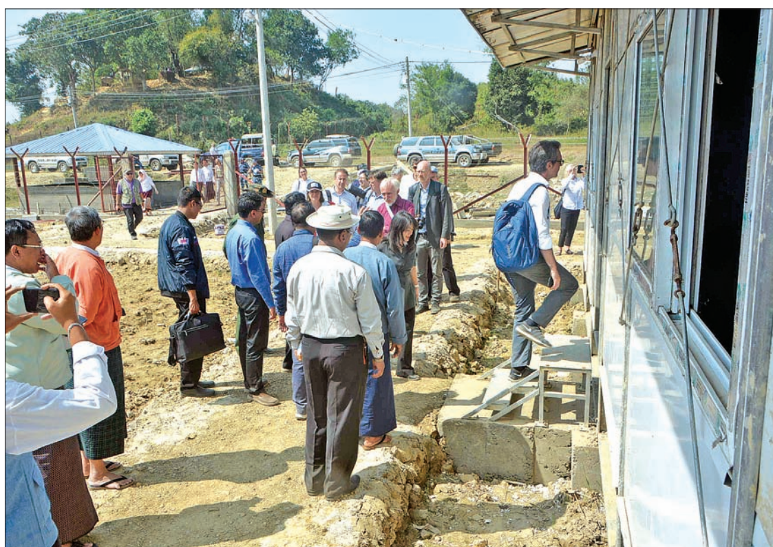
Diplomats and UN officials visit houses at Taung Pyo Letwe repatriation camp in Maungtau, Rakhine State.