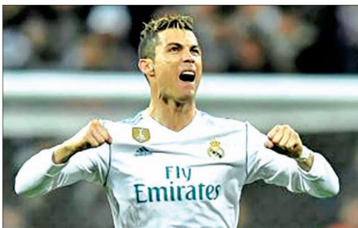
Cristiano Ronaldo came out on top in the battle for supremacy with Neymar as he scored twice in Real Madrid's 3-1 win over Paris Saint-Germain in the last-16, first-leg tie of the Champions League.

On a pulsating evening in the Bernabeu, Ronaldo dragged Real level with a penalty after Adrien Rabiot had given PSG the lead, fed by a cheeky Neymar backheel.