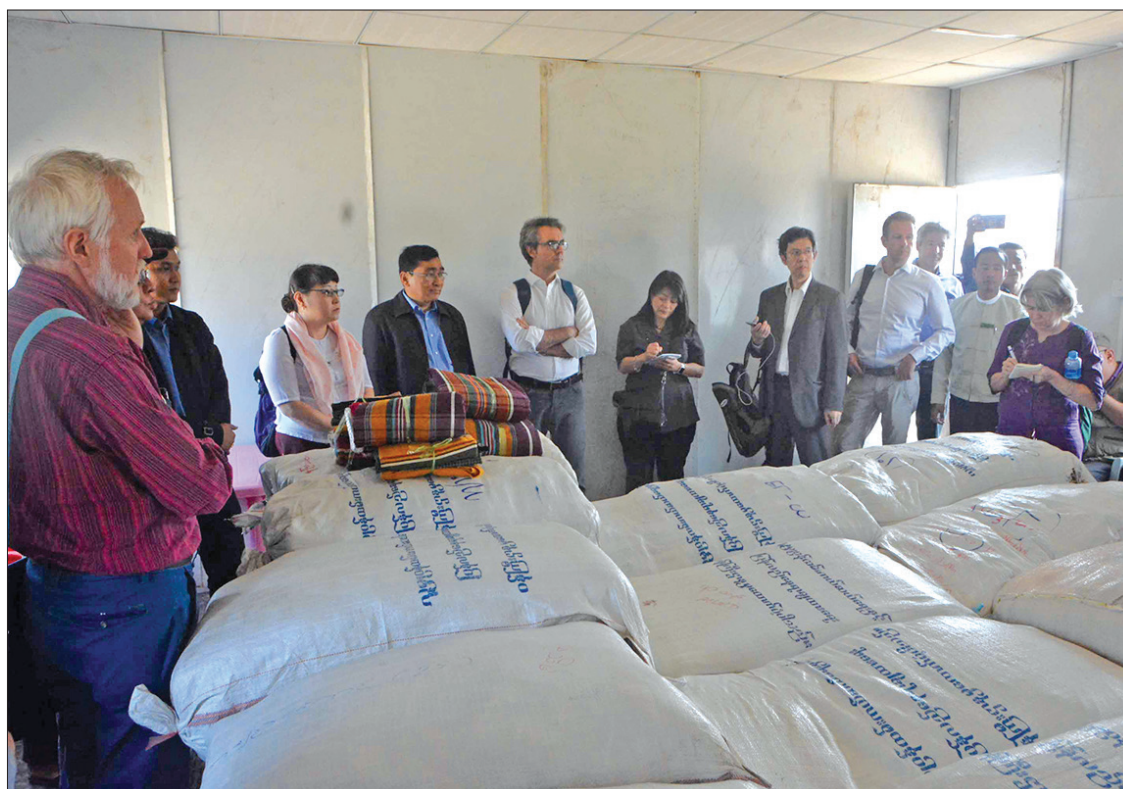
Diplomats and UN officials check rice sacks stored at the repatriation camp in Ngakhuya.