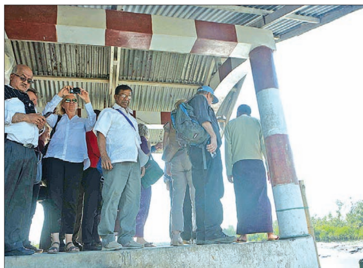
Diplomats and UN officials visit the Border Gate (1) in Maungtau Township.