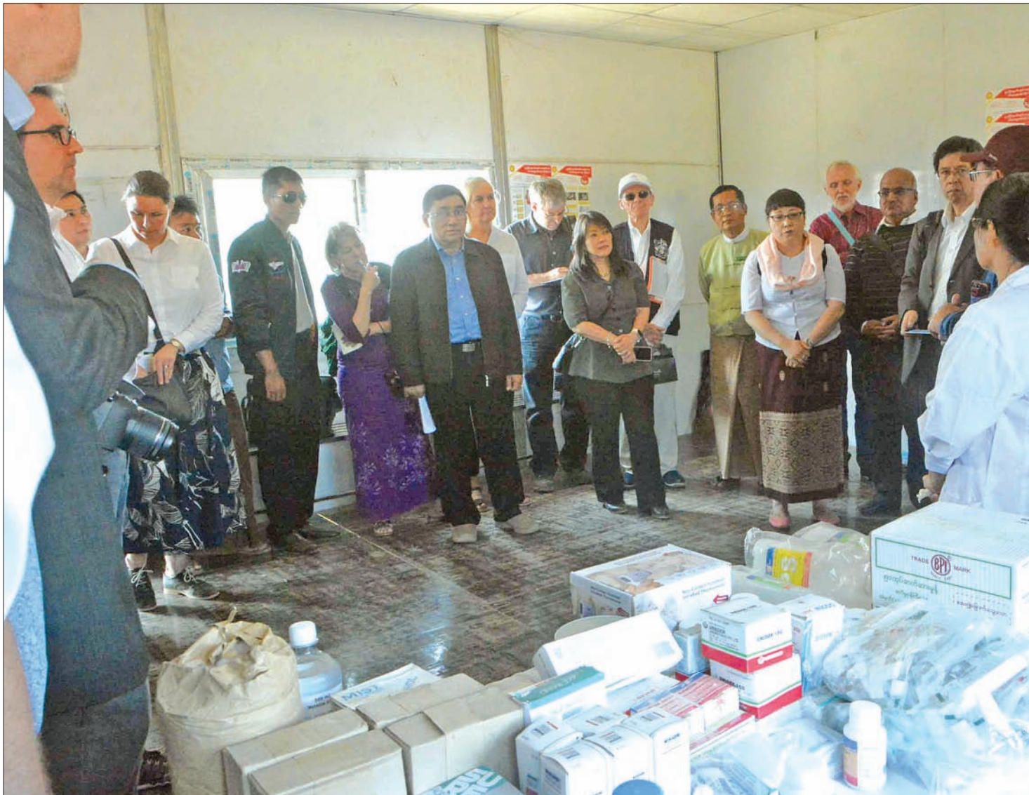
Diplomats and UN officials check readiness for medical care at the repatriation camp in Ngakhuya Village.