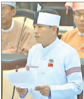
MP U Whey Tin.