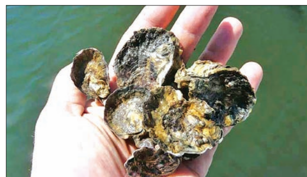
Virtually all of Australia's shellfish reefs have disappeared, making them the country's most threatened ocean ecosystem, scientists say.

"Our study confirms the situation for these important marine habitats in Australia is even worse, with less than one per cent of flat oyster and 10 per cent of rock oyster habitats remaining."—AFP ■