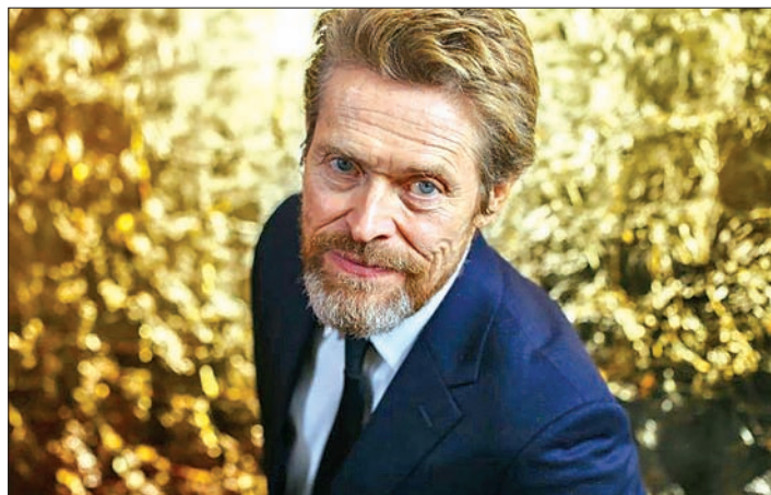
Dafoe holds Oscar flag for heart-melting movie about poor kids.

appointed when (its director) Sean Baker didn't get some love because this is very much his film and he made a beautiful movie." "I was hoping either the film or him or one