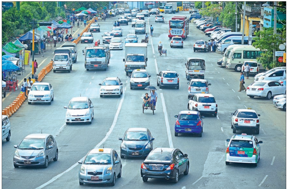
Taxis run in downtown Yangon. The Yangon licensed taxis are yet to register as the City Taxi.

"The announcement was made through the state-owned newspaper and television. The Yangon Region government will now take legal action against unregistered