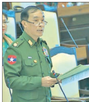
Maj-Gen Than Htut.