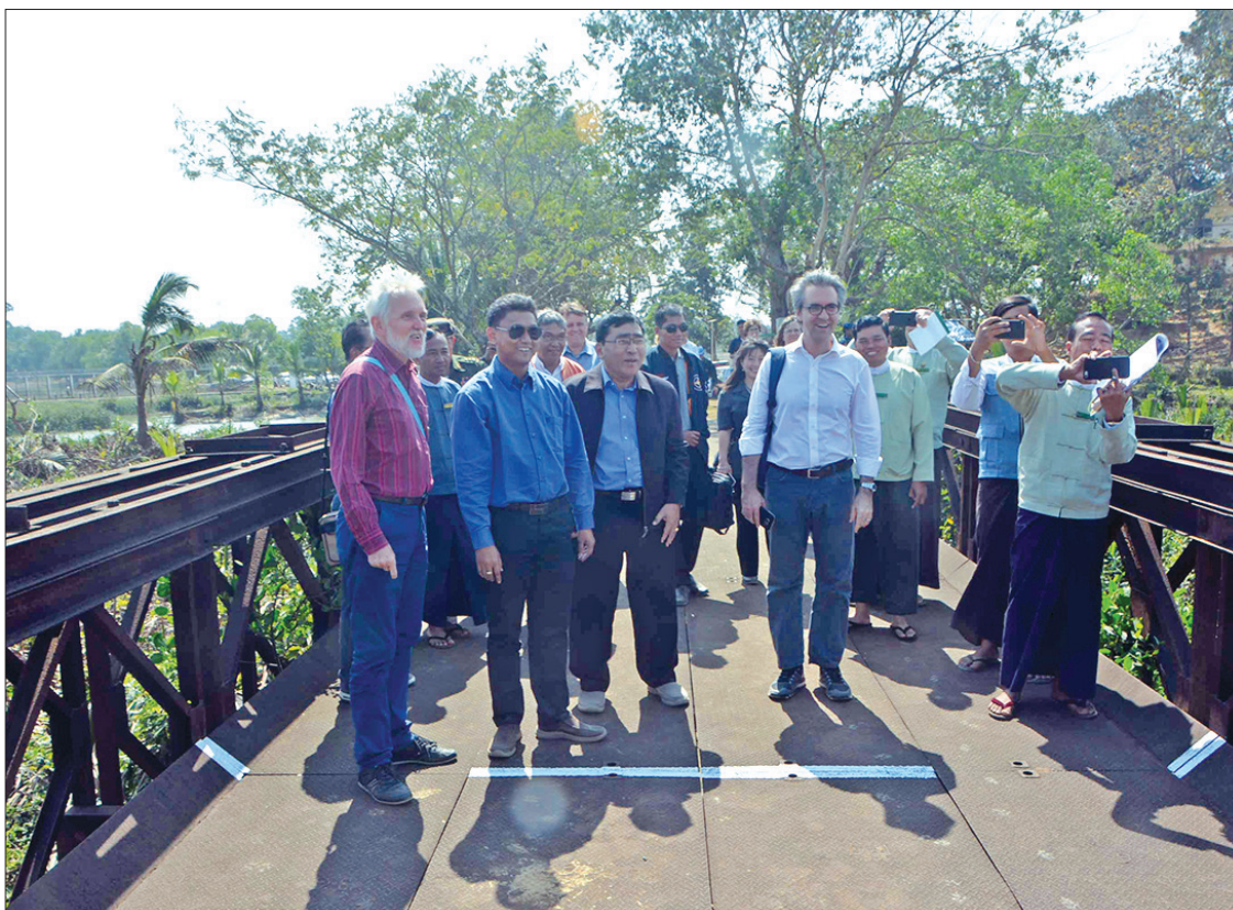
Diplomats and UN officials visit the friendship bridge at Taung Pyo Letwe.