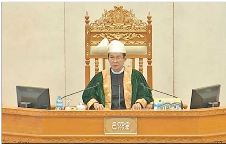
Speaker of Pyithu Hluttaw U Win Myint.

Daw Myint Myint Soe @ Daw May Soe of Botahtaung constituency asked about the arrangements being made to ease the process of passport ap-