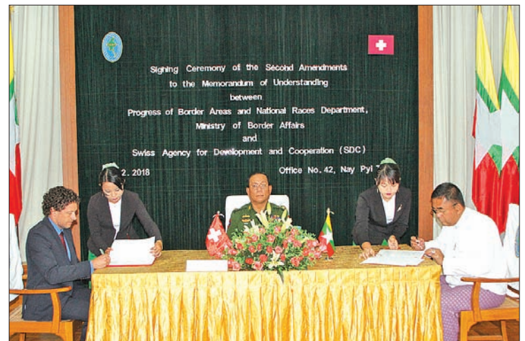
A signing ceremony of MoU between Ministry of Border Affairs and Swiss Agency for Development and Cooperation held in Nay Pyi Taw. PHOTO: MNA

The Ministry of Border Affairs, Progress of Border