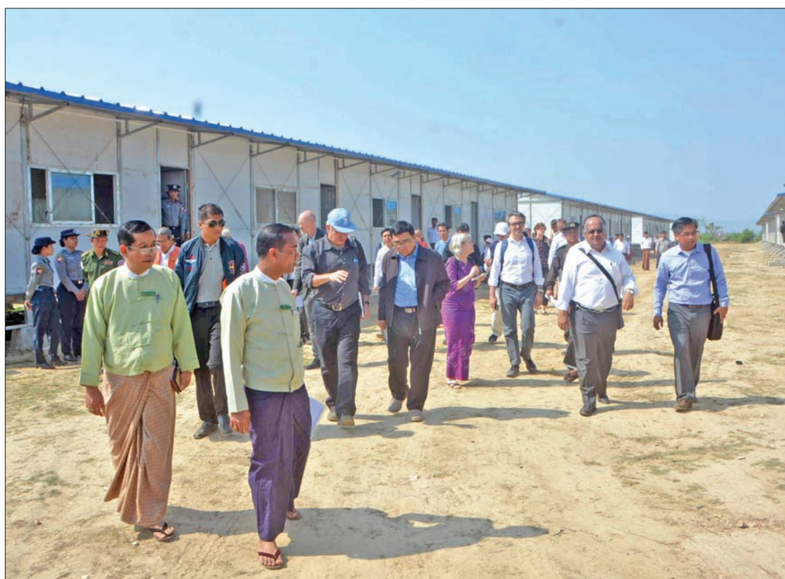
Diplomats and UN officials visit the repatriation camp in Ngakhuya Village, Maungtau.

The Union Minister and his entourage travelled back to Sit-tway and returned to Yangon in the evening. The group, led by Dr. Win Myat Aye, comprised of ambassadors and officials from the embassies of Egypt, Finland, Germany, Israel, Italy, Denmark, the Netherlands, Norway, Sweden, New Zealand, Brazil, Poland and Sri Lanka in Yangon, as well as representatives from United Nations Development Programme, United Nations Office for the Coordination of Humanitarian Affairs, United Nations International Children's Emergency Fund, United Nations Fund for Population Activities, United Nations Human Settlements Programme, World Health Organisation, International Organisation for Migration, Asian Development Bank and United Nations Office for Project Services.—Myanmar News Agency