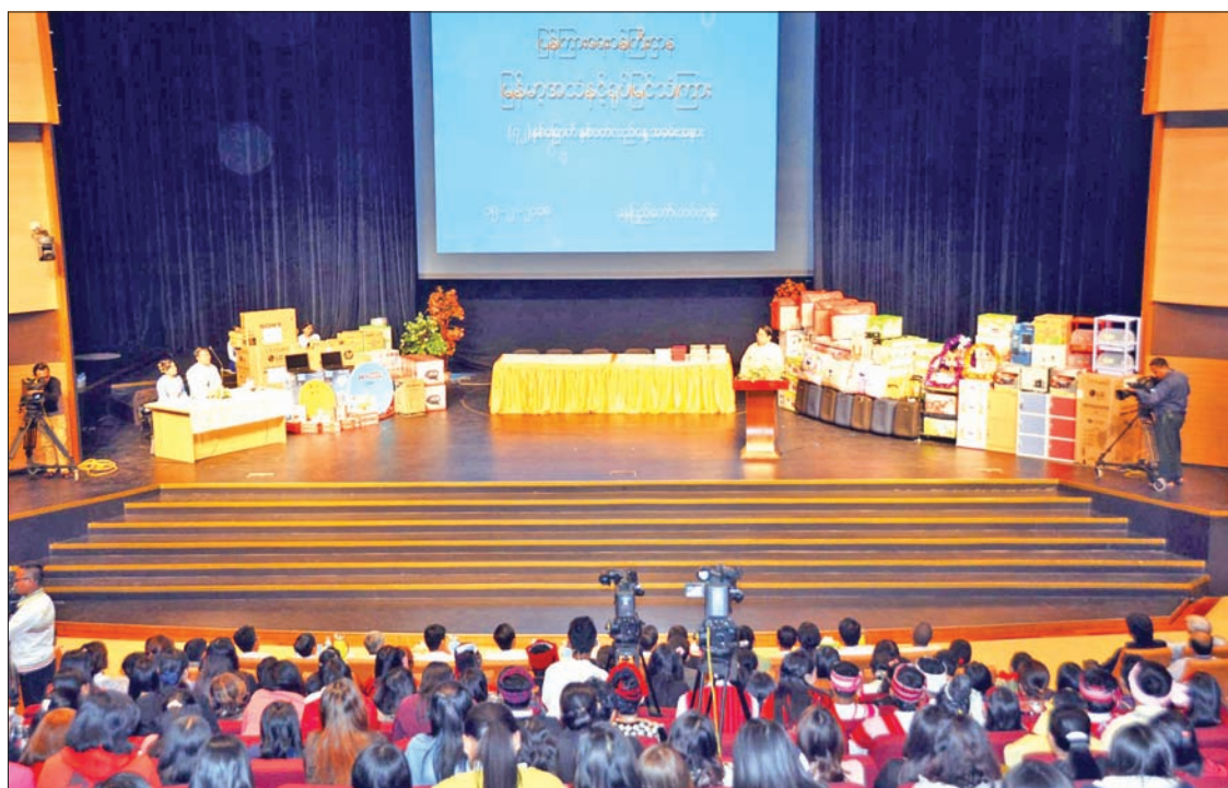
Union Minister Dr Pe Myint addresses the celebration of 72 nd anniversary of MRTV in Nay Pyi Taw.