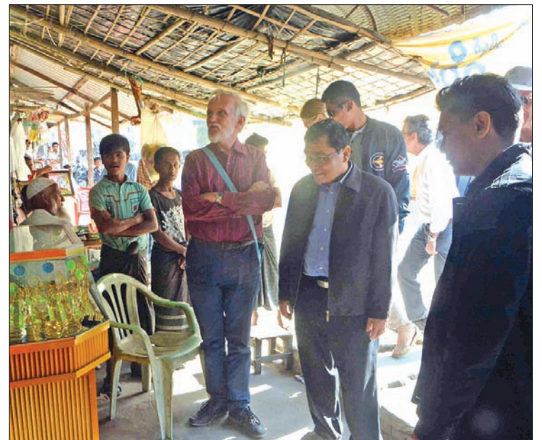
The delegation of diplomats and UN officials headed by Union Minister Dr. Win Myat Aye visits Maungtaw Market.