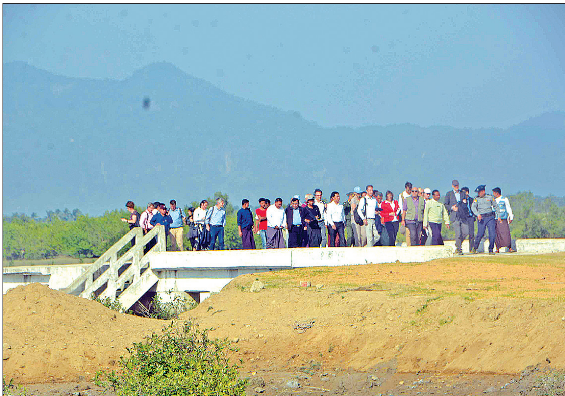
Diplomats and UN officials visit Kanyin Chaung Special Economic Zone.