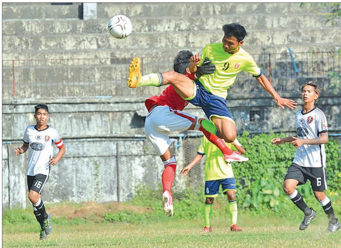
Royal Thanlwin's striker attempts to shoot the ball over the keeper of Mawyawady.