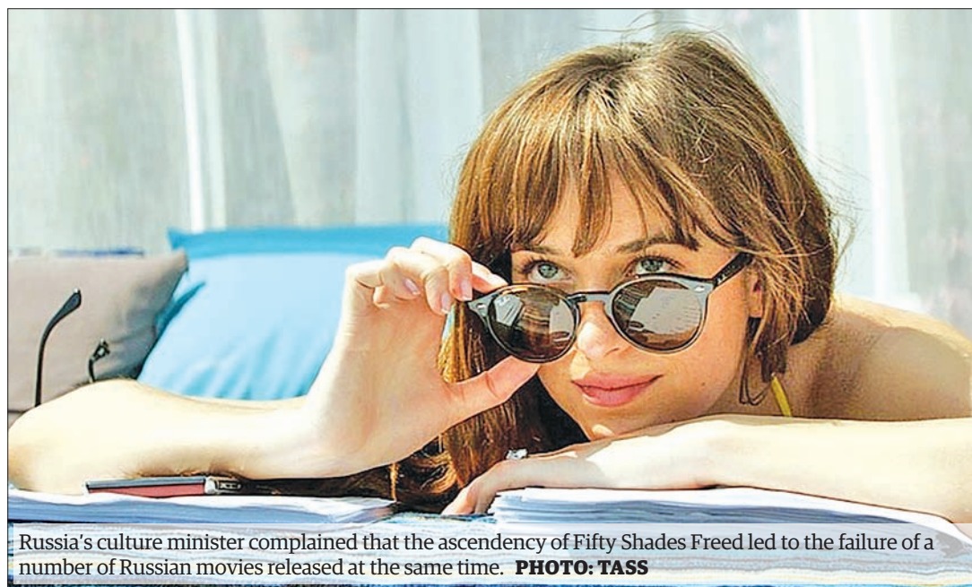
Russia's culture minister complained that the ascendancy of Fifty Shades Freed led to the failure of a number of Russian movies released at the same time.

The culture minister complained that the ascendancy of Fifty Shades Freed, which premiered nationwide on February 8, led to the failure of a number