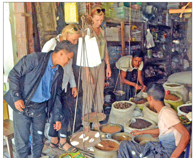
Diplomats and UN officials visit Maungtaw Market.