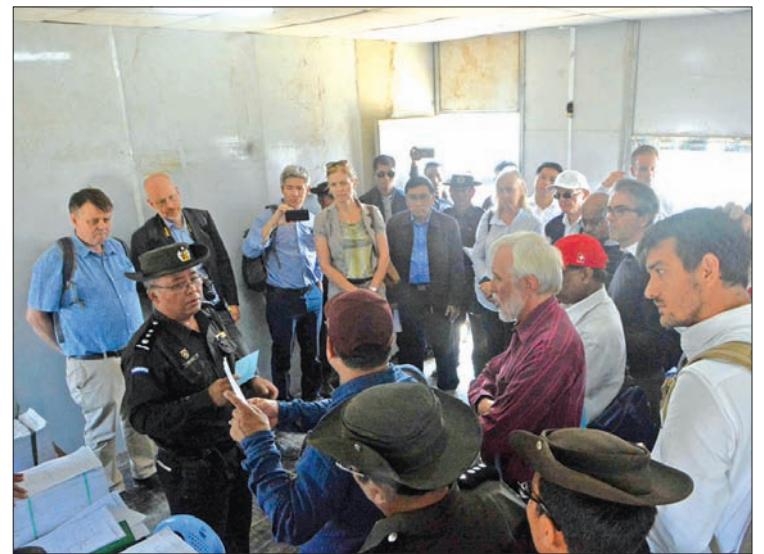
Diplomats and UN officials meeting with immigration officers at Ngakhuya Village.