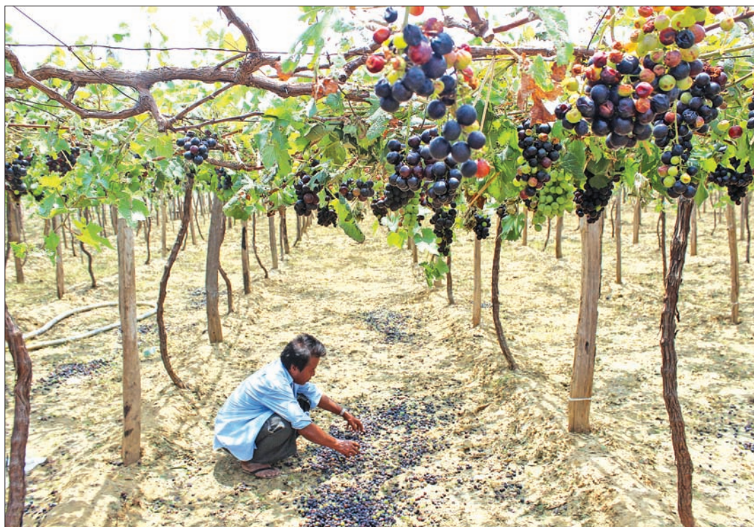
Grapes are seen at a farm in Yamethin Township, Mandalay Region.