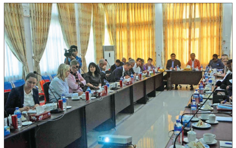
Union Minister Dr. Win Myat Aye and Rakhine State Chief Minister U Nyi Pu brief on repatriation readiness in Sittway.