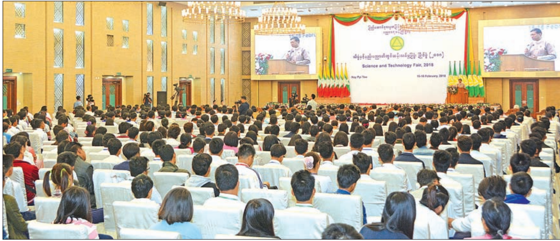
Union Minister for Education Dr. Myo Thein Gyi delivers a speech at the Science and Technology Fair- 2018 at MICC-2 in Nay Pyi Taw.

The Science and Technology Fair-2018 was held at the Myanmar International Convention Centre II in Nay Pyi Taw at 9 a.m. yesterday.