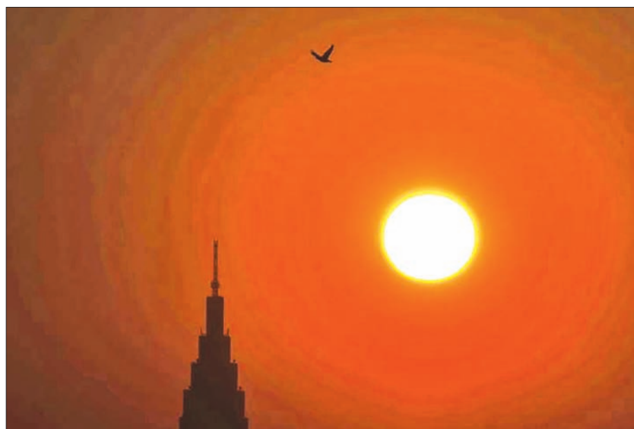
Japan's Minister for Economy, Trade and Industry Toshimitsu Motegi said the current expansion was solid.