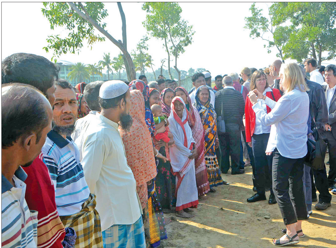
Diplomats and UN officials meet with local people at Ngakhuya Village.