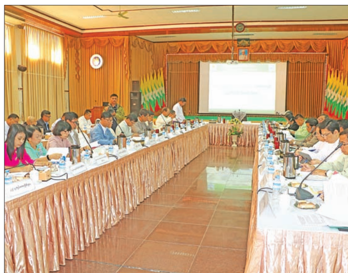
A meeting of Consumer Protection Central Committee is held at the Ministry of Commerce yesterday.

Consumer Protection Central Committee members and officials then discussed the status of departments and regions in implementing consumer protection works and to conduct consumer protection work processes more widely. —Myanmar News Agency ■