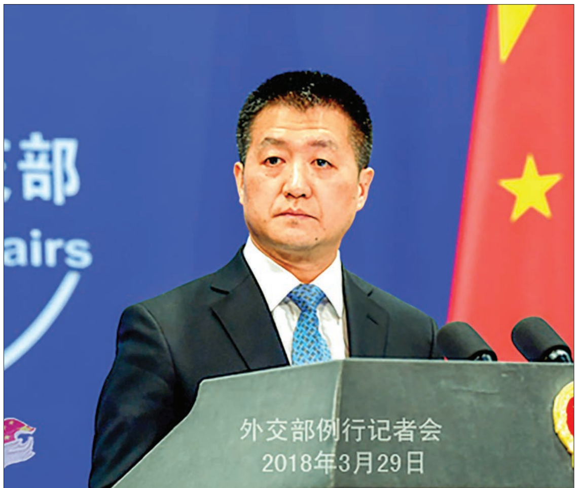
Foreign Ministry spokesperson Lu Kang.

The DPRK announced that it will hold a ceremony for the dismantling of the northern nuclear test ground between 23 and 25 May, depending on weather conditions, and journalists from China, Russia, the United States, Britain and the Republic of Korea will be allowed to conduct on-site coverage.—Xinhua ■