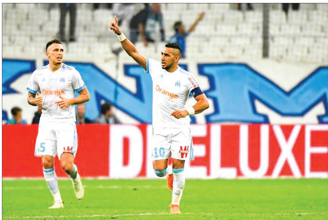
Dimitri Payet's quality and experience have helped spur Marseille's renaissance.

baker, you go to pick up your daughter, the city is like that, you don't need to be told that you represent something extraordinary. You experience it every day."