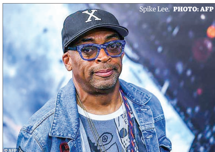
Spike Lee.

of his co-stars in the movie, described Lee as a "very strange, cerebral kind of cat."