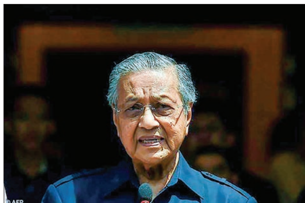
Malaysian Prime Minister Mahathir Mohamad.

ed in the 1MDB scandal when the Wall Street Journal broke the news in July 2015 that nearly $700 million was transferred from the fund into Najib's personal bank account in 2013.