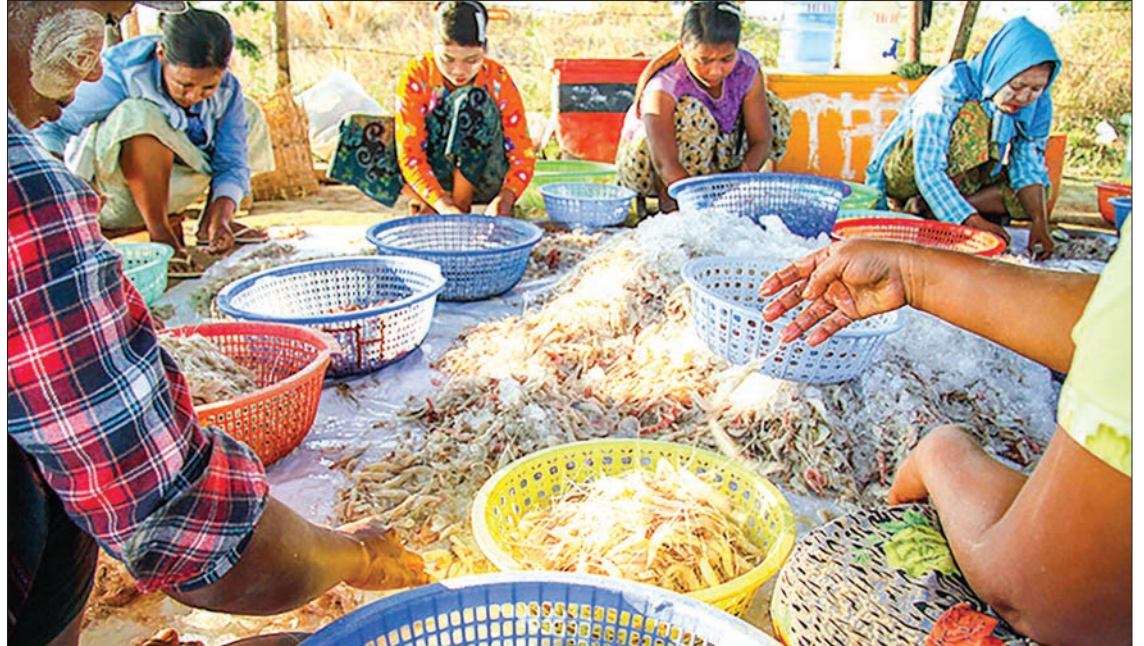
A file photo shows workers select shrimps in Kyauktan, Yangon Region.

Myanmar reinstated the US Generalised Scheme of Preference for more than 4,900 items, including 34 fishery products. Myanmar and the US signed the Trade and Investment Framework Agreement in 2013. —Zar Lin Thu (AMIA) ■