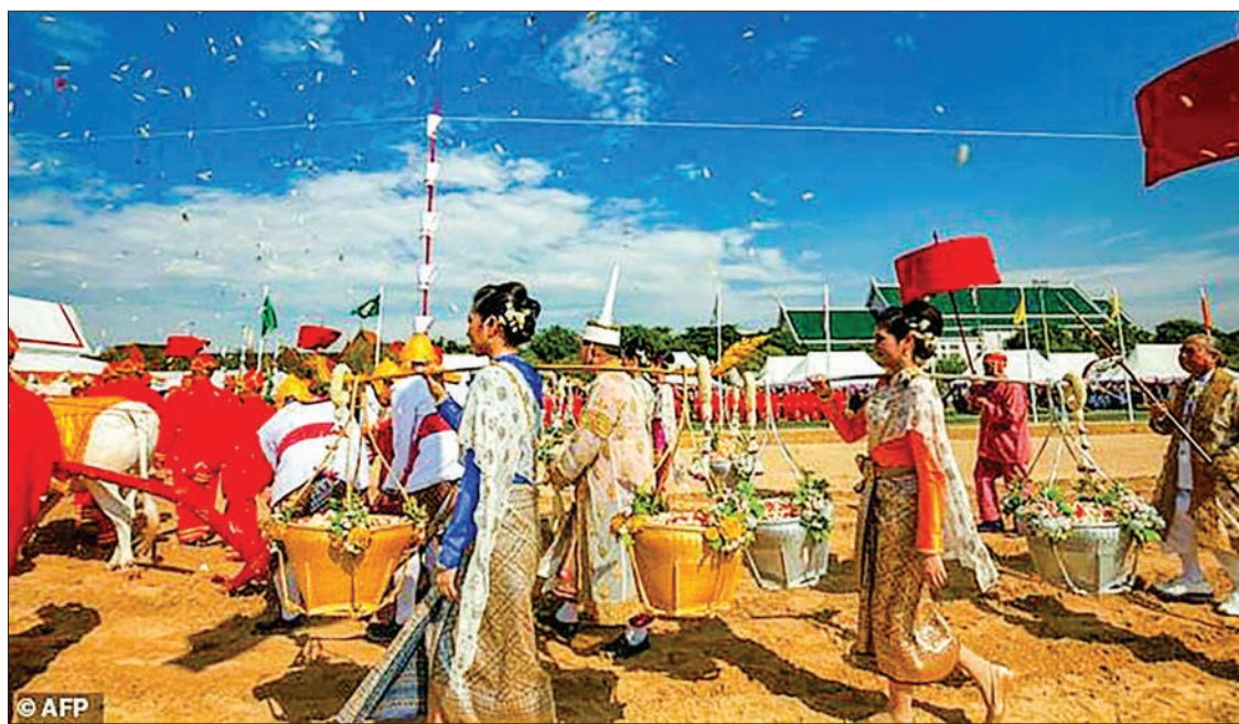
Thais believe the ceremony predicts what the year's harvest will be like.

After the ceremony crowds swarmed the field, as is tradition, to collect 'lucky' grains of rice that had been scattered