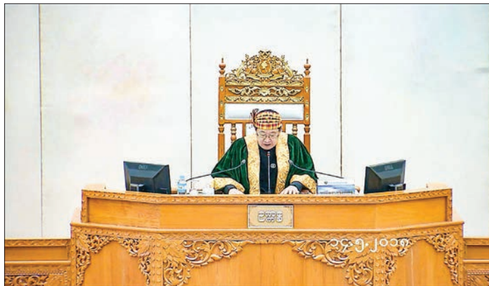
Pyithu Hluttaw Speaker U T Khun Myat.

“If we study the parliaments in the world, it can be seen that these are conducting post legislative scrutiny of the effects of the enacted laws. The Hluttaw representatives must