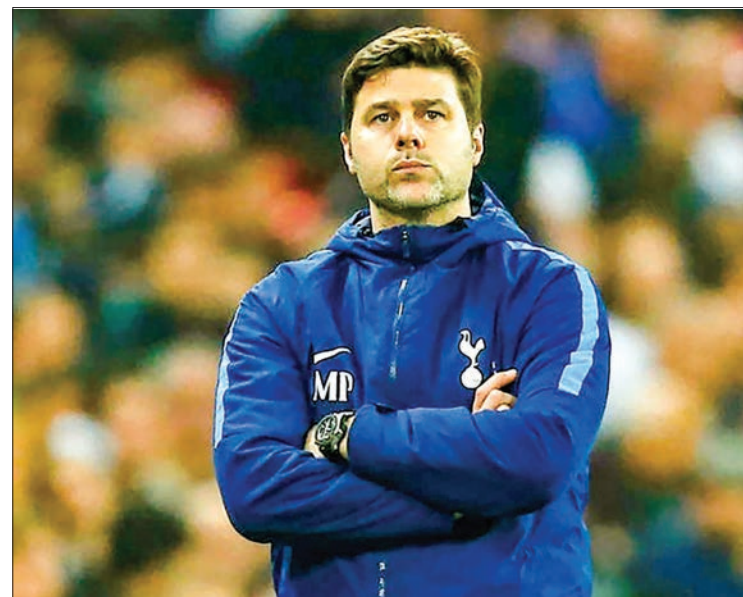
Tottenham's Mauricio Pochettino.

Wenger was forced to battle to keep Arsenal competitive