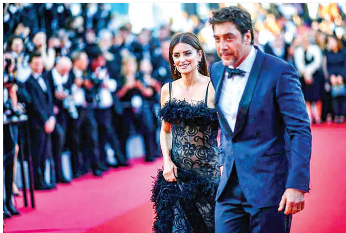
Spanish actress Penelope Cruz (L) and Spanish actor Javier Bardem have replaced Angelina Jolie and Brad Pitt as the smouldering A-list couple on Cannes' red carpet.

China's Zhao Tao, who influential movie website IndieWire last week called "one of the