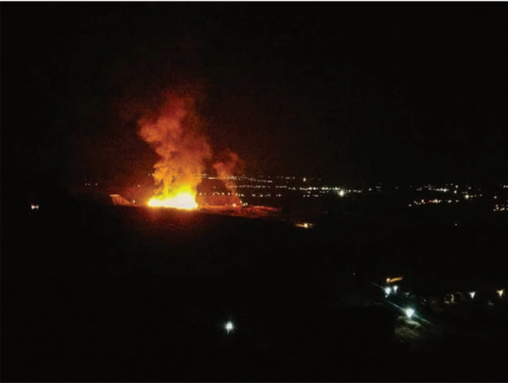
A fire broke out at Yadana Shwe Ate jade mining company in Phakant Township, Mohnyin District, Kachin Sate.

A torching incident occurs on the evening of 13 May at Yadana Shwe Ate gem mining company in Kachin Sate, Mohnyin District, Phakant Township, Lonkhin village tract. The incident occurs when company employees torched and destroy the company office building and living quarters after an unresolved wage rate dispute between the company and its employee resulting in the burning and destruction of the company office building, five living quarters, a backhoe, six 2,400 gallon oil storage tanks. The police force was reported to have detained 49 employees who involved in the event. On the afternoon of 13 May the company employee demanded the termination of the mining operation on 15 May and to receive overtime payments. They demonstrated after the negotiation break down.