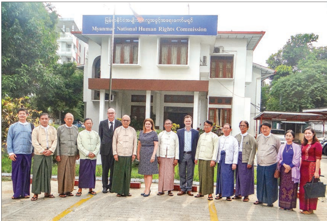
MNHRC members pose for a documentary photo together with UNDP's officials in Yangon.

(Excerpt from the speech by State Counsellor Daw Aung San Suu Kyi on the 2 nd Anniversary of NLD Government on 1 st April 2018)