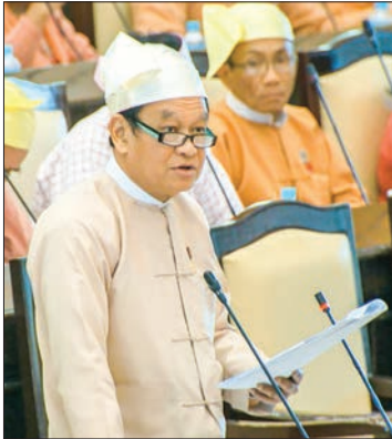
Union Minister for Health and Sports Dr. Myint Htwe. Dr. Zaw Lin Htut of Mon State constituency (9) on a plan to construct a modern sports ground and training centre in Mon State, Thaton Township, Thudham-

the Sub-Rural Health Centre in the Ayeyawady Region, Hinthada District, Zalun Township, Myitwa Village, to a Rural Health Centre. The union minister said the Myitaw Village Sub-Rural Health Centre is providing healthcare services to nearly 15,000 people from more than 3,350 households in 22 villages, and met the five basic requirements of a Rural Health Centre. Furthermore, the head of the Region Public Health Department had supported the upgrade in a report. Therefore, the upgrade will be made as soon as possible, said the union minister. In response to a question by