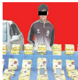
Sai Kyauk.

charges against all suspects under the Anti-Narcotic Drugs and Psychotropic Substances Law.—Myanmar Police Force ■