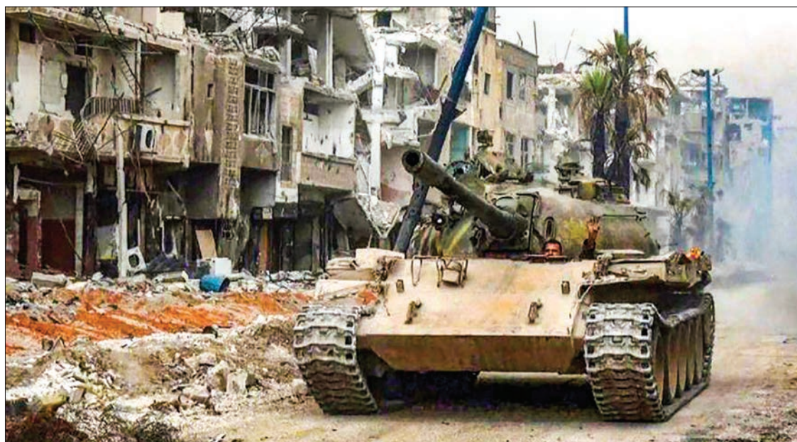
A Syrian army tank advances through a street in al-Hajar al-Aswad as they push against the Islamic State (IS) group in the area on the southern outskirts of Damascus.

There are growing concerns over Turkey's economic health, notably due to a wide current account deficit and fears the economy is overheating.—AFP ■