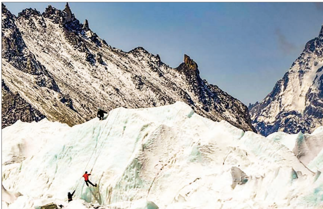
This picture taken on 24 April, 2018, shows climbers at Everest Base Camp practicing their techniques on the Khumbu glacier before trying to summit Everest, some 140km northeast of the Nepali capital Kathmandu.

"We are now resting at camp 4, for a few hours at least. Our plan is to set off this evening aiming to reach the top early tomorrow morning.