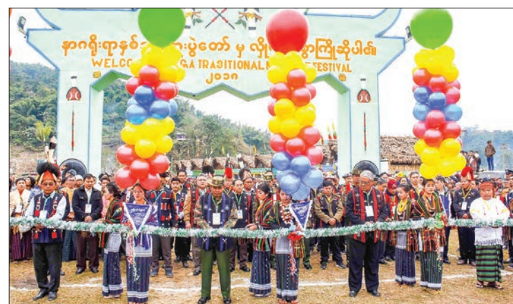
The opening ceremony of Naga New Year Festival in progress.