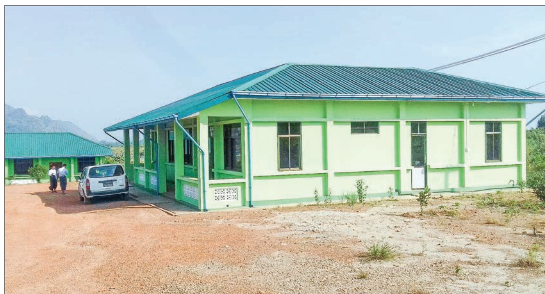
Photo shows one of the buildings of the Hpa-an home for the aged.

The newly-constructed home for the aged is first of its kind in Kayin State.—Min Yarzar (Myitkyina)