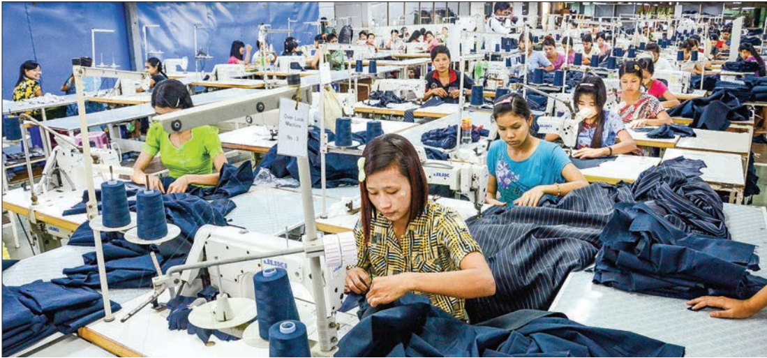
Employees work at the production line of a large garment factory in Hlinethaya Township.