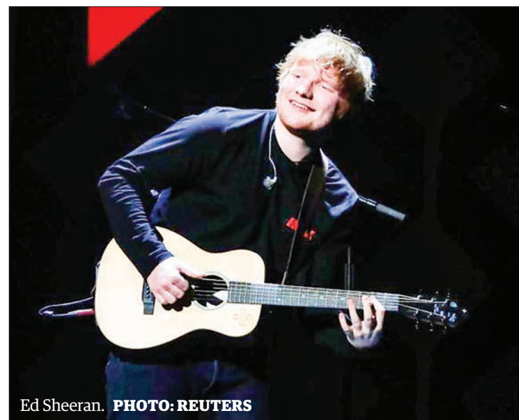
Ed Sheeran.

“Today isn’t about me. My fellow actresses stood by me and stood up for me, my activist friends taught me to use my voice, and the most powerful men in charge, they listened and they acted. If we truly envision an equal world, it takes equal effort and sacrifice.—PTI ■