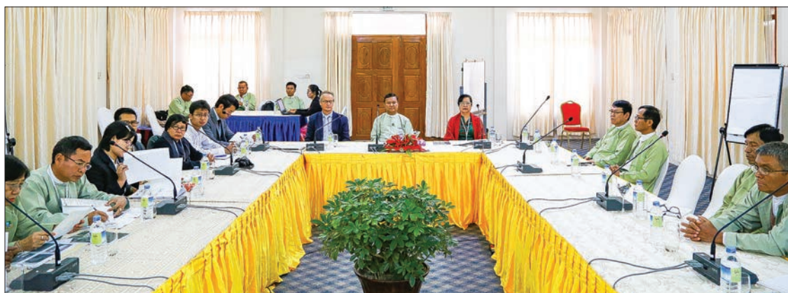
Ministry of Planning and Finance, Forestry Department hold a meeting with UNESCO on administrative planning of the nature tourism of Hkakabo Razi region, Kachin State.

MINISTRY of Planning and Finance, Forestry Department and UNESCO jointly launched a meeting on administrative planning of the nature tourism of Hkakabo Razi region, Kachin State yesterday in Nay Pyi Taw.