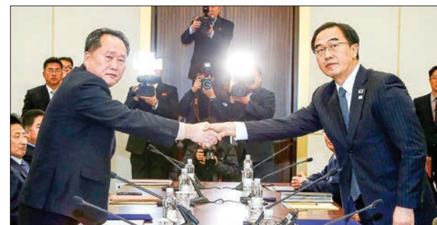
Head of the North Korean delegation, Ri Son Gwon shakes hands with South Korean counterpart Cho Myoung-gyon as they exchange documents after their meeting at the truce village of Panmunjom in the demilitarised zone separating the two Koreas, South Korea, on 9 January 2018.

first official dialogue in more than two years amid high tension over the North's weapons programme. South Korea had also said that it is seeking to form a combined women's hockey team with the North. The North Korea's International Olympics Committee (IOC) official said the committee is considering the proposal, while the two sides will also have talks hosted by IOC on 20 January. —Reuters ■