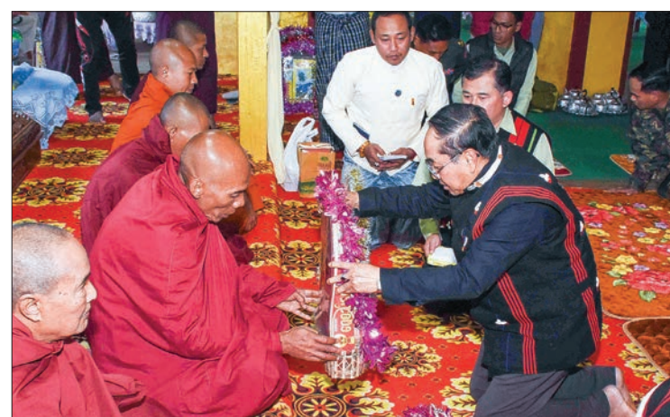
Vice President U Myint Swe presenting offertories to a Sayadaw.