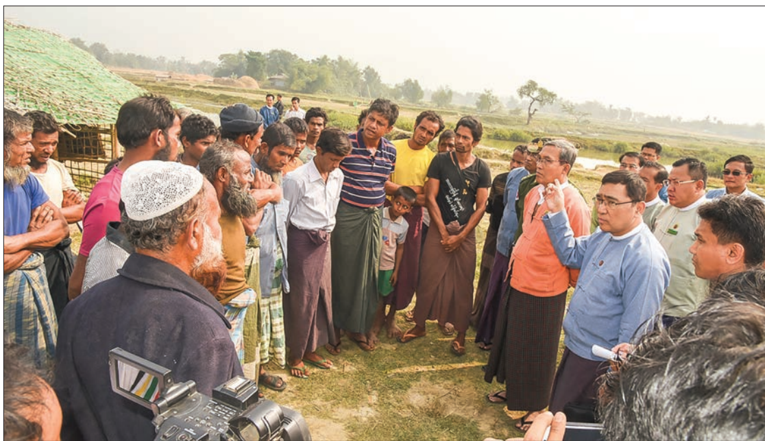
Union Minister Dr Win Myat Aye explains the resettlement program at Kyeeaganbyin Village in Maungta Township.

The Union minister and party met Islamic people temporarily living at a relief camp near Kyeeaganbyin village in Maungta Township. The Union minister told them that he and the party had come there to coordinate the rebuilding of homes for them since, despite their homes having been destroyed by fire during terrorist attacks, they had not fled to the other country. Resettlement will be carried out within the legal framework. Village-type homes will be rebuilt in the areas