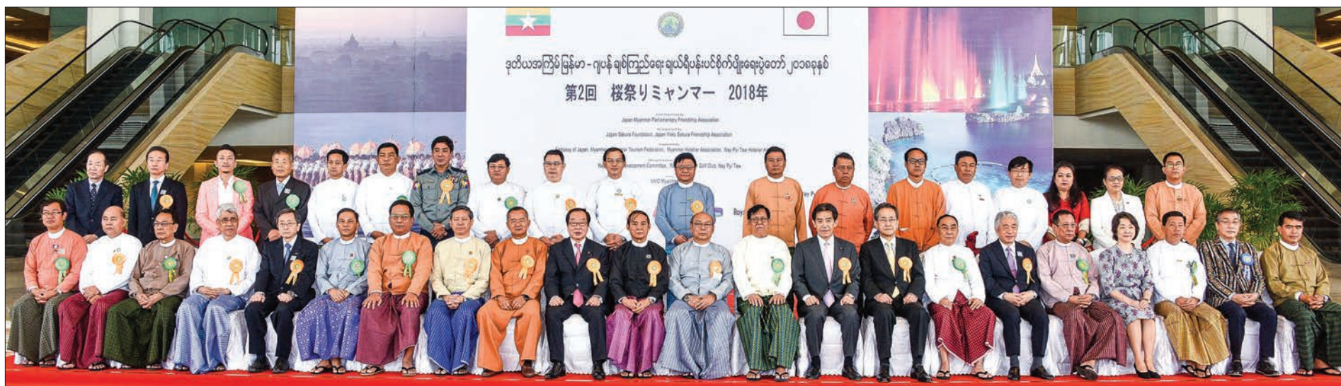
State-level officials from Myanmar and honoured Japanese guests pose for documentary photo at the second Sakura Festival Myanmar in Nay Pyi Taw on 14 January.