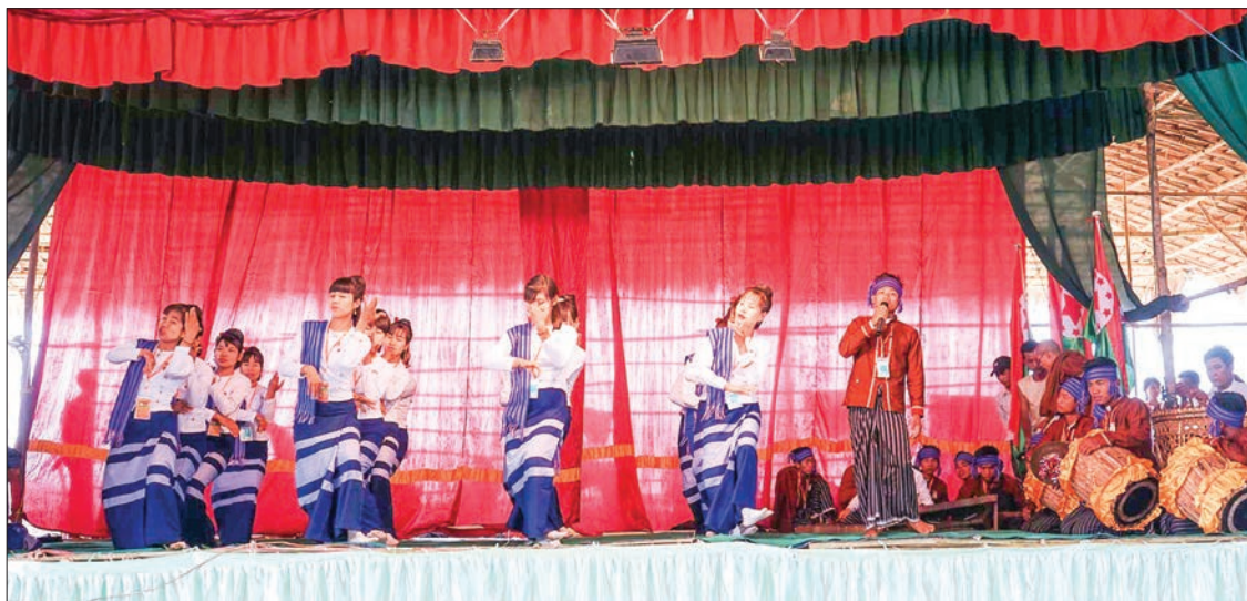
Performers entertain audience at the Kadu ethnic cultural festival.

the Kadu customs, promote the Kadu language and display its cultural heritage. Competitions in rice pounding with foot-operated wooden pounders, cross-bow matches and tugs-of-war, among others, will be held during the festival,” said Ethnic Kadu Chairman U Kan Aung. The festival will be held with Kadu ethnic people from various regions and states, as well as other ethnic groups.—Kyaw Thiha ■