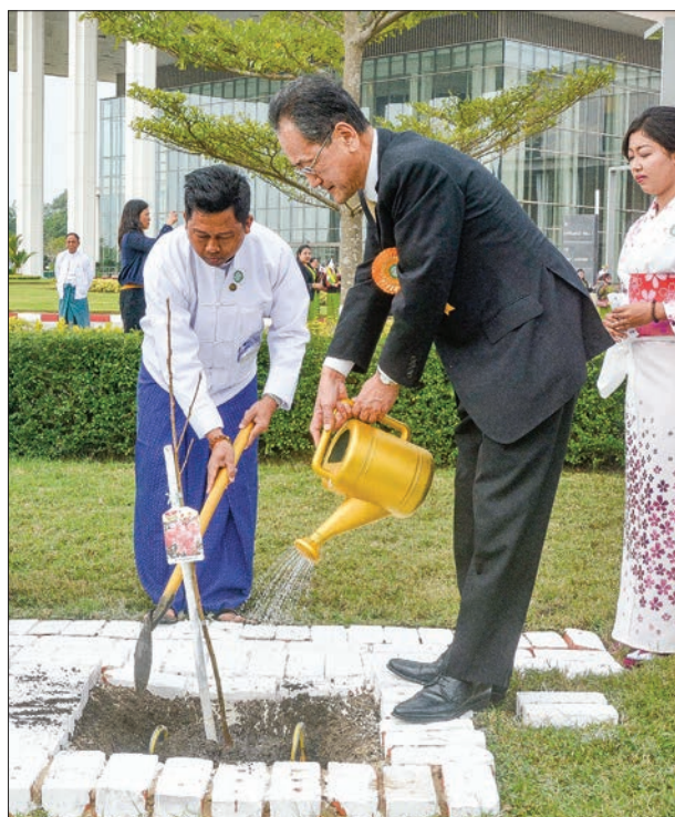
Japanese Ambassador to Myanmar watering the cherry plant in Nay Pyi Taw.