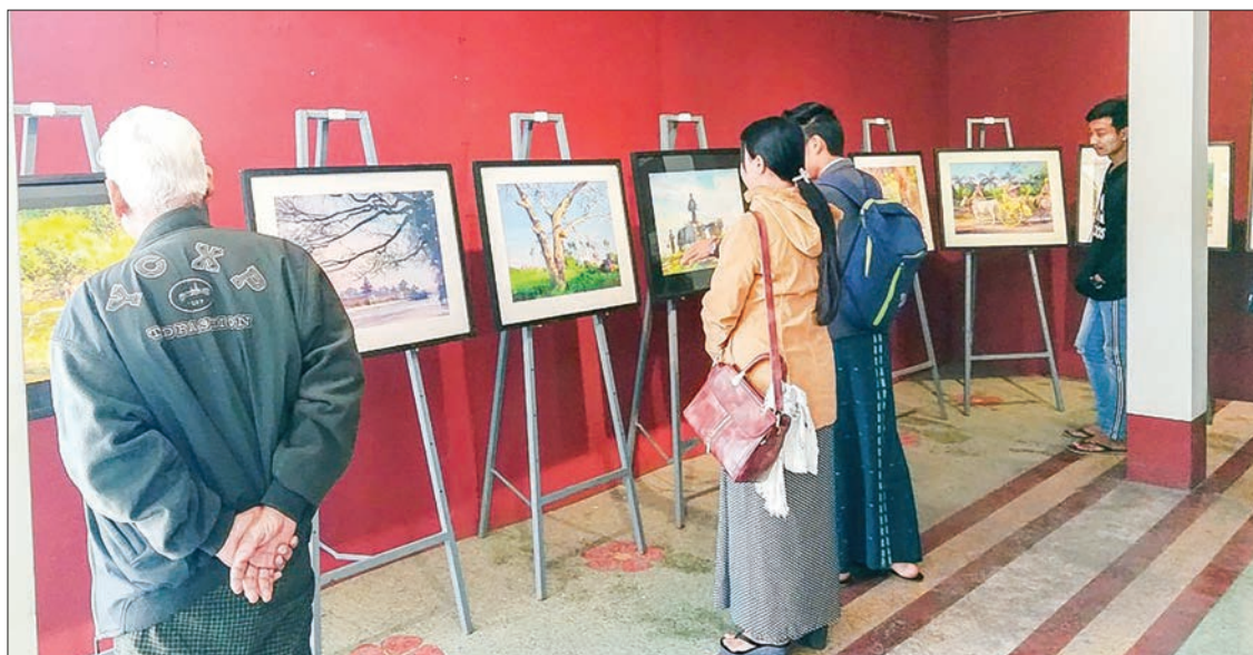
Painting onlookers observe the pictures displayed at the gallery.