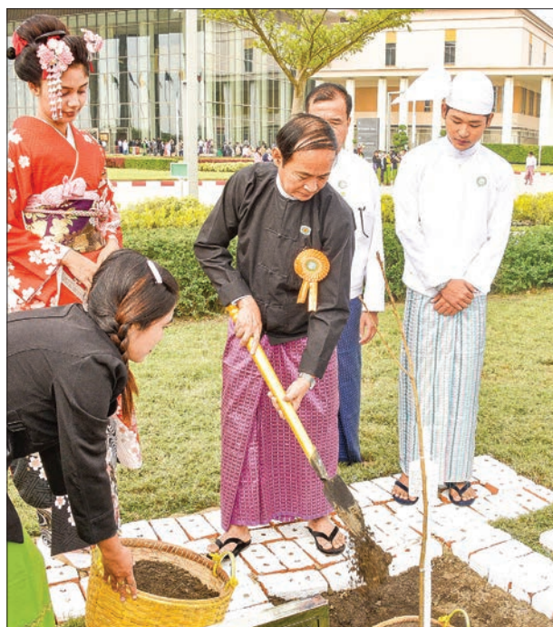
Pyithu Hluttaw Speaker U Win Myint plants a cherry in Nay Pyi Taw.

in Nay Pyi Taw on the evening of January 13. — Myanmar News Agency ■