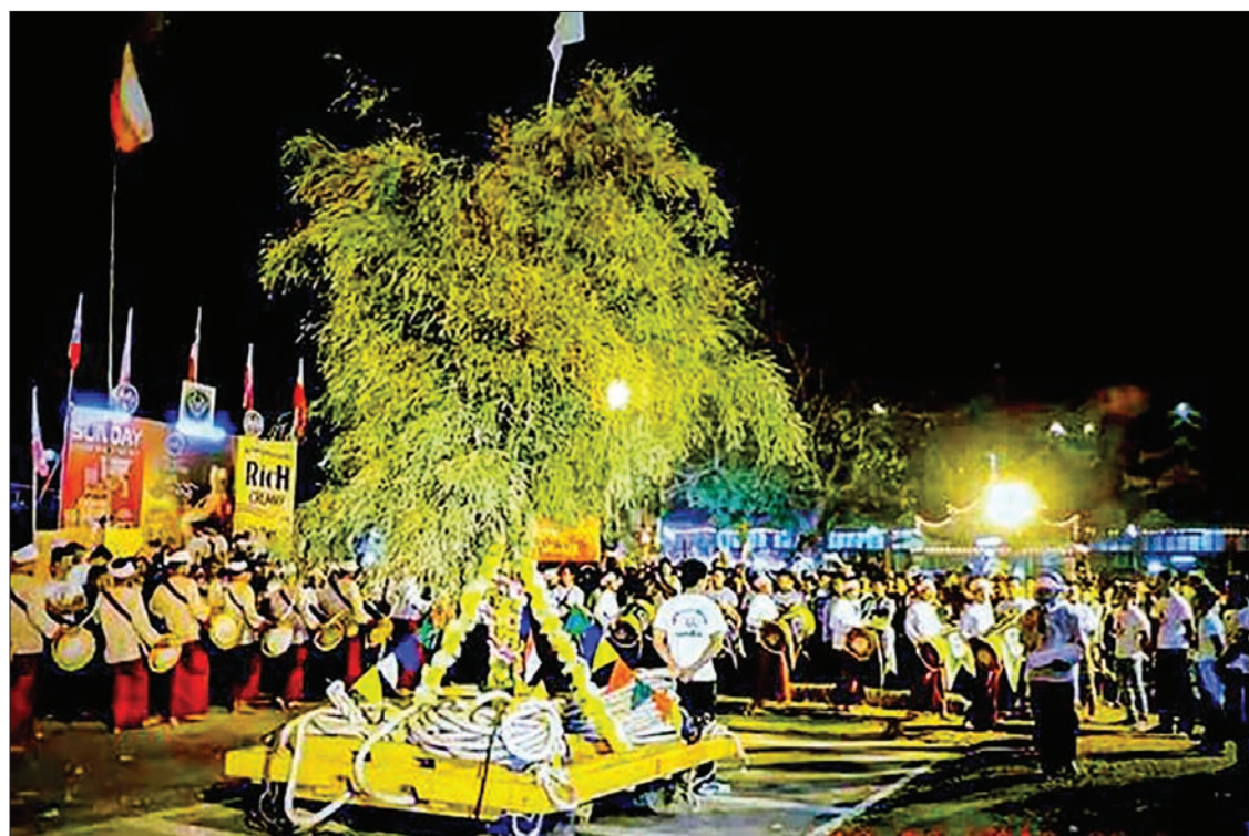
10 th Rakhine traditional carriage pulling ceremony will be held in Sittway.