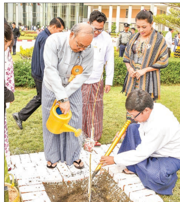
Amyotha Hluttaw Speaker Mahn Win Khaing Than watering cherry plant.