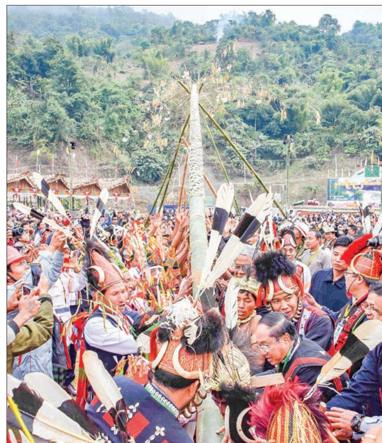
Vice President U Myint Swe and party erecting a new year banner mast.