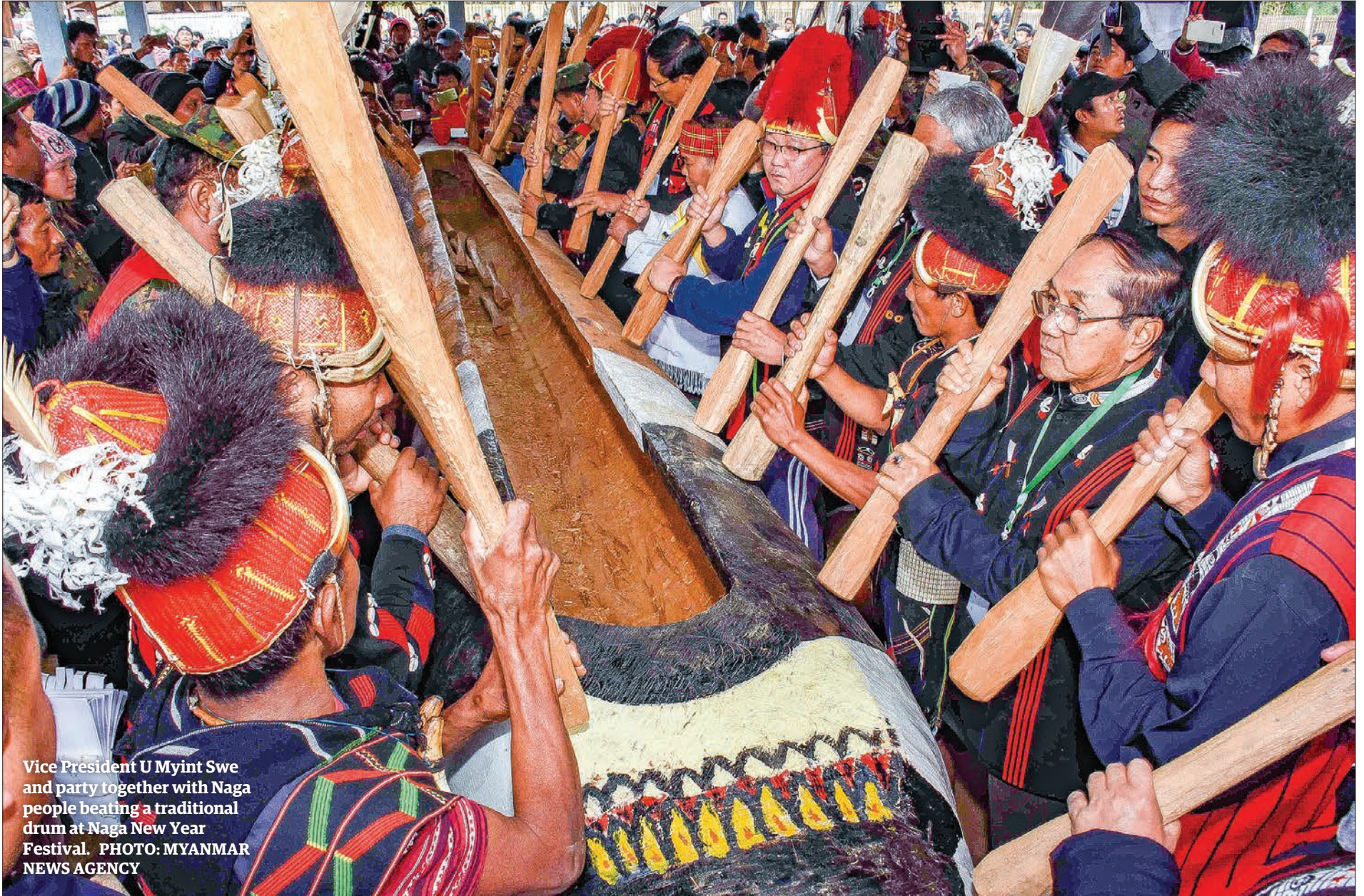
Vice President U Myint Swe and party together with Naga people beating a traditional drum at Naga New Year Festival.