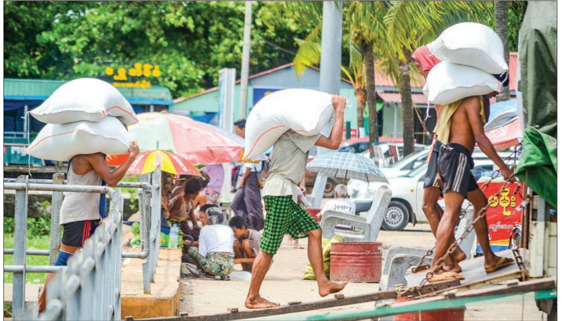
Workers loading sacks of rice into a lorry.