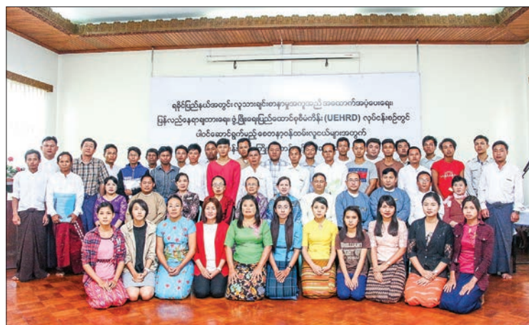
Trainees of fourth volunteers group pose for documentary photo.

Dr Daw San San Aye thanked the volunteers for their services in the interest of