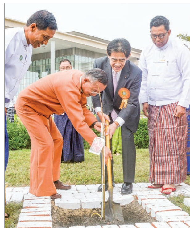
Union Minister U Ohn Maung and Mr. Ichiro Aisawa planting a cherry.