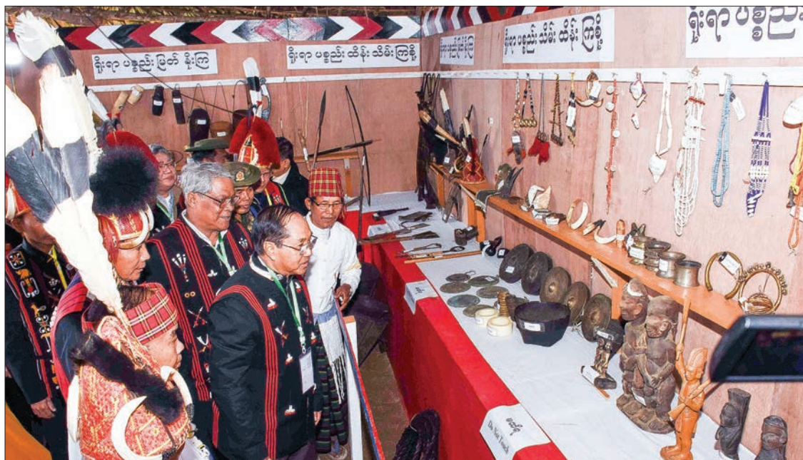
Vice President U Myint Swe viewing Naga traditional utensils at the New Year Festival.