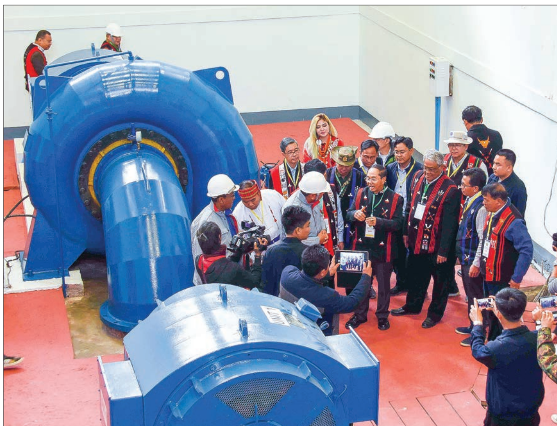
Vice President U Myint Swe and party inspect Taihkan hydropower station after attending the Naga New Year Festival in Nanyun in Sagaing Region in the north-west of Myanmar.