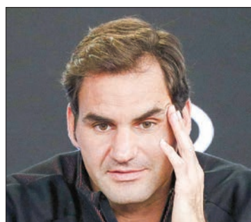
Roger Federer of Switzerland reacts during a news conference before the Australian Open tennis tournament in Melbourne, Australia, on 14 January 2018.

That unforgettable triumph ended a five-year hiatus in Federer's grand slam collection and a few months later, he took his tally to a record-extending 19