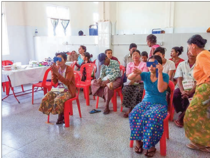
Local people of Thanbyuzayat and Bilin townships receive free healthcare service.

The team will give similar free healthcare to people in other regions and states as of January 2018.—Myanmar Digital News ■