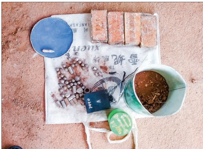
Parts of the discovered remote-controlled bomb.