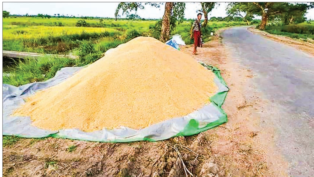
Harvested monsoon rice lying near a paddy field in Shwebo District.

ALTHOUGH farmers had a good yield from the monsoon paddy in the Shwebo District, rice prices have been on the rise in the domestic market, growers said.