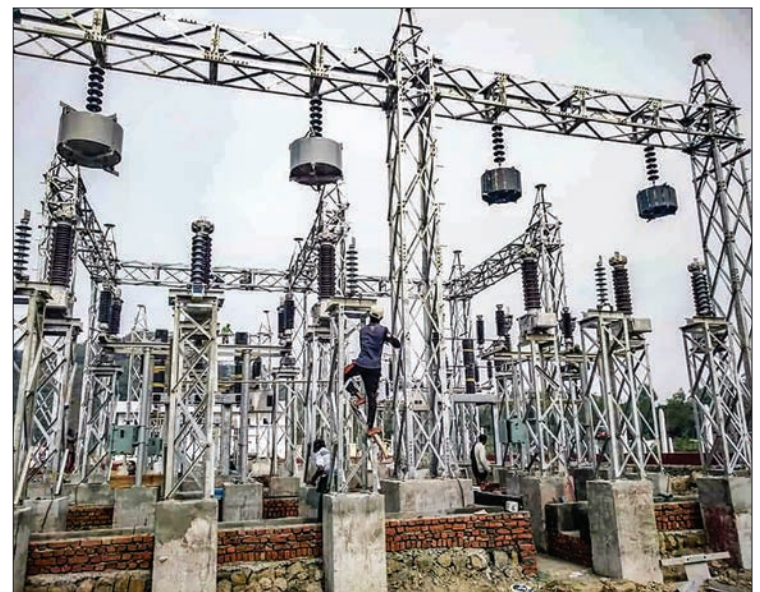
Electrician works at electrical power station in Rakhine.

If there is power failure or a blackout, be it day or night, rain or shine, they have to work on it. People from the region should work for the region's people, said the chief engineer.