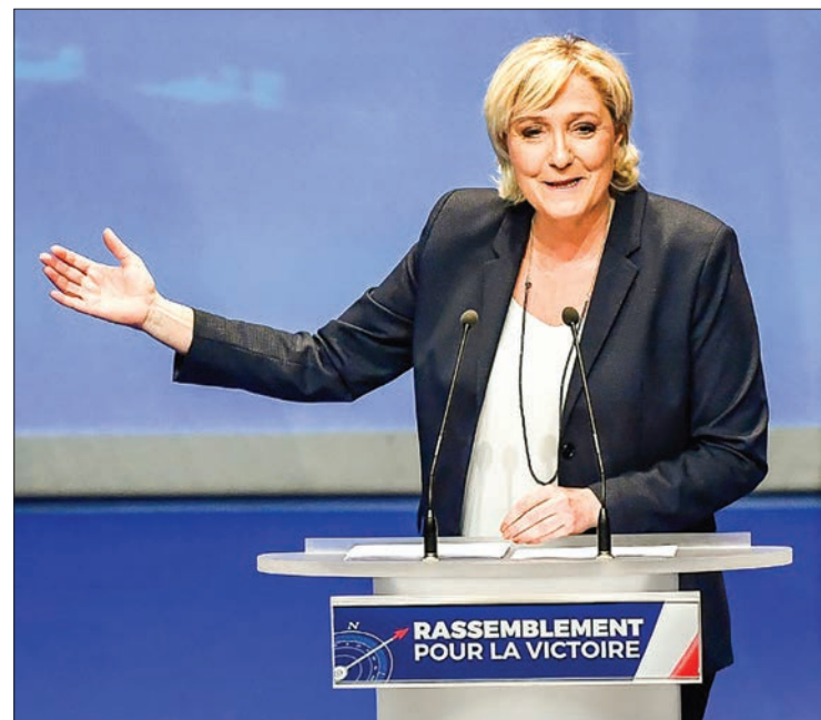
Marine Le Pen is trying to improve the French National Front's image.