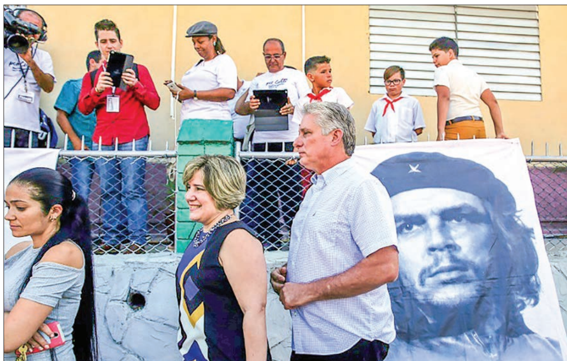
Cubans, including First Vice President Miguel Diaz-Canel (R) and his wife Lis Cuesta (L) stand in line to vote on a new National Assembly that will choose the country’s next president.

The new National Assembly selects a 31-member Council of