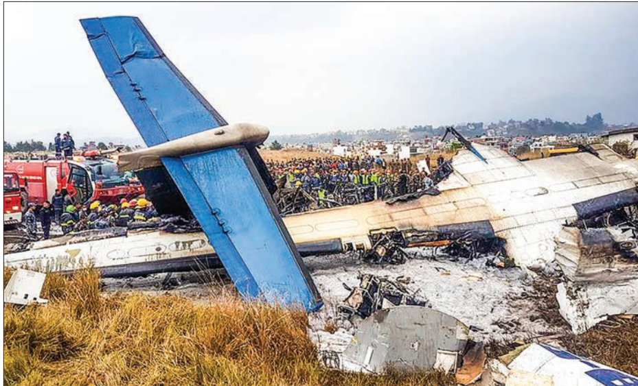
Photo taken on 12 March, 2018 shows the crash-landing site in Kathmandu, Nepal. A passenger plane of the US-Bangla Airlines crashed at Nepal's Tribhuvan International Airport (TIA) on Monday, with dozens feared dead and at least 17 people injured.

The Bombardier Dash Q-400 aircraft, with 67 passengers and four crew members onboard, crashed while landing. The UBG211 flight was en route to Kathmandu from