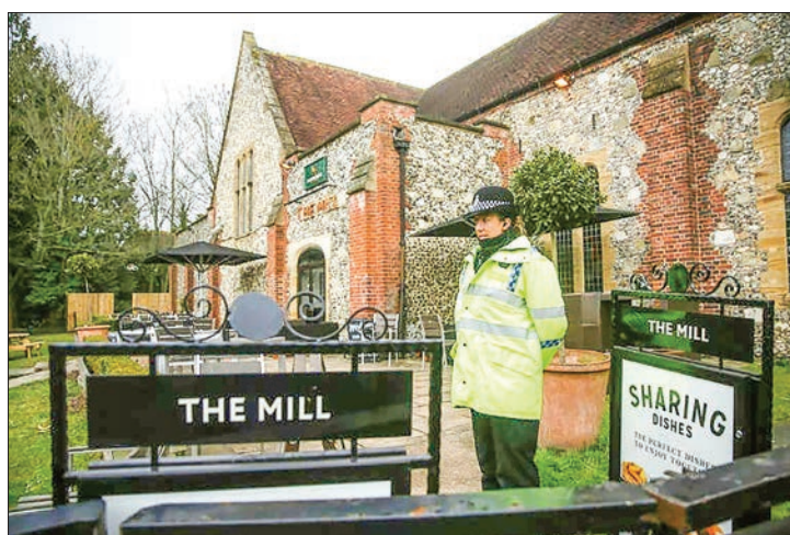
Traces of a nerve agent used to poison Russian ex-double agent Sergei Skripal have been found at The Mill pub and the Zizzi restaurant in Salisbury.

“I am therefore advising... the people who were in either the restaurant or the pub at 1:30pm last Sunday until evening closing on Monday should clean the clothes they wore and the possessions they handled while