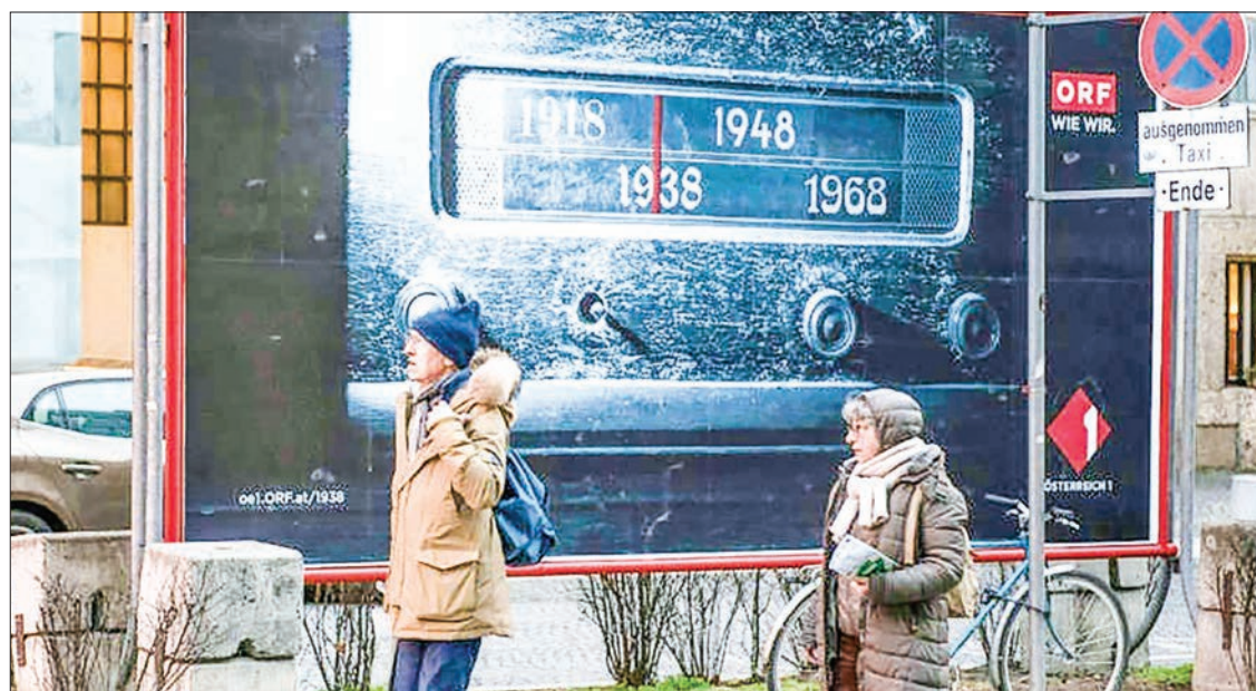
A billboard set up in Vienna as part of the commemorations of the 80th anniversary of Austria's annexation by Nazi Germany, or "Anschluss".

An artistic installation will be unveiled on Monday at the site where the dictator made his first speech after the annexation of the country. On Wednesday, Chancellor Kurz will ask his cabinet to approve a proposal for a memorial to the victims of the Holocaust to be erected in the centre of Vienna. ■