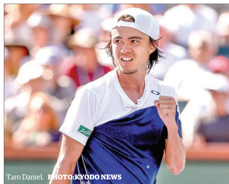
Taro Daniel.

"I think I came out playing a little more aggressive than the other two sets and that made him keep making more mistakes. Because he obviously wasn't playing his best tennis, so I was able to take advantage of that," Daniel said. Daniel, who reached the