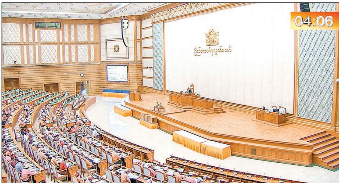
Pyidaungsu Hluttaw is being convened in Nay Pyi Taw.

In every IPU assembly, an emergency item on current international matters is usually included. Of the emergency items sent prior to the 137 th IPU Assembly, there was one submitted on Rakhine State by eight Organisation of Islamic Cooperation member countries, including Morocco. On learning about this, the Myanmar delegation prepared a counter-emergency item on Rakhine State to be submitted to the IPU Assembly.