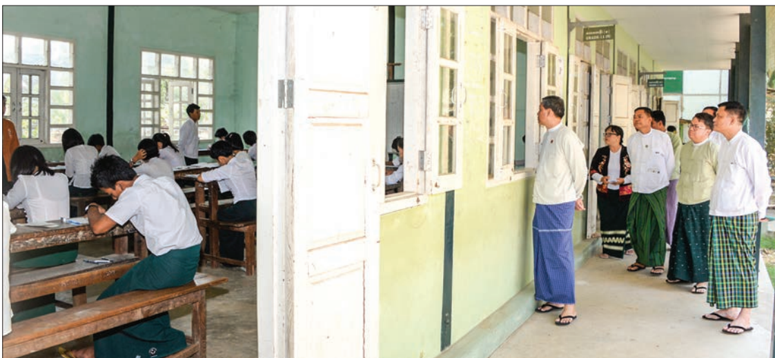
Union Minister for Education Dr. Myo Thein Gyi inspects the examination centres in Pinyinman Township Basic Education High School No. (3).

THE 2018 matriculation examinations are being held at 1,742 examination centres, including 21 foreign and 1,721 local centres, since 7 March.