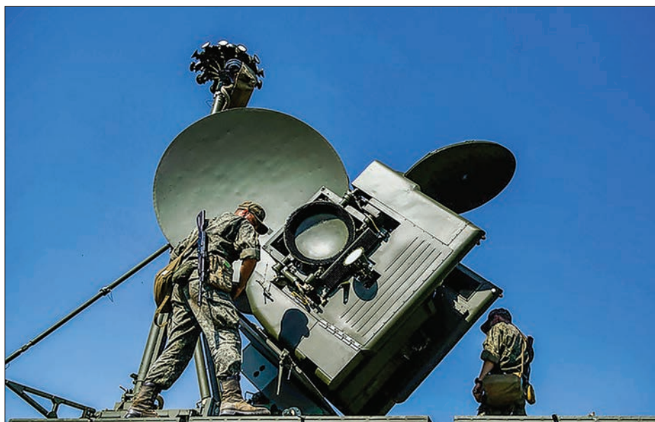
Krasukha-4 ground-based electronic warfare system.