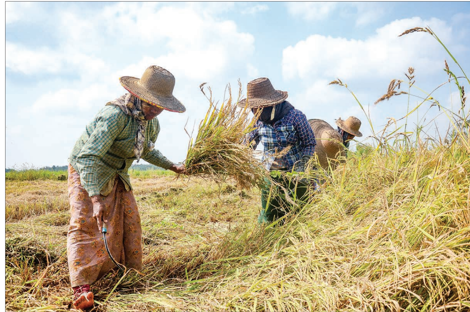
Farmers reap crops under the bright sun and hot weather. While rice is in high-demand in Myanmar and Southeast Asia, lack of modern technologies and equipment means that production cannot keep up with supply.

Growing rice in Myanmar depends on irrigated lowland, rain-fed lowland, deep-water, and upland. Rain-fed lowland and deep-water rice are confined to the delta region and coastal strip of Rakhine State. Nearly 60% of the delta region, including the Ayeyarwady, Bago, and Yangon region is