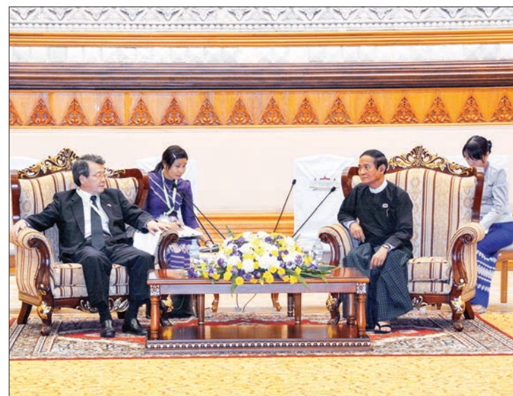
Pyithu Hluttaw Speaker U Win Myint holds talks with Japanese business Federation Vice Chairman in Nay Pyi Taw.