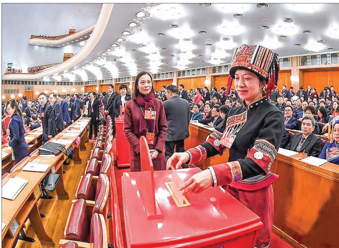
A deputy to the 13 th National People's Congress (NPC) casts her ballot on a draft amendment to the country's Constitution at the third plenary meeting of the first session of the 13 th NPC in Beijing, capital of China on 11 March, 2018.

He said the experience of the past 20 plus years showed that the "three in one" leadership system was a successful, effective and pivotal one for China. The "three" refers to general secretary of the CPC Central Committee, the chairman of the Central Military Commission and the state president — the