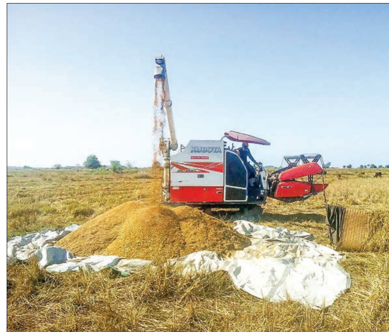
Use of machines quickens the process for farmers, but not all farmers can afford them yet.