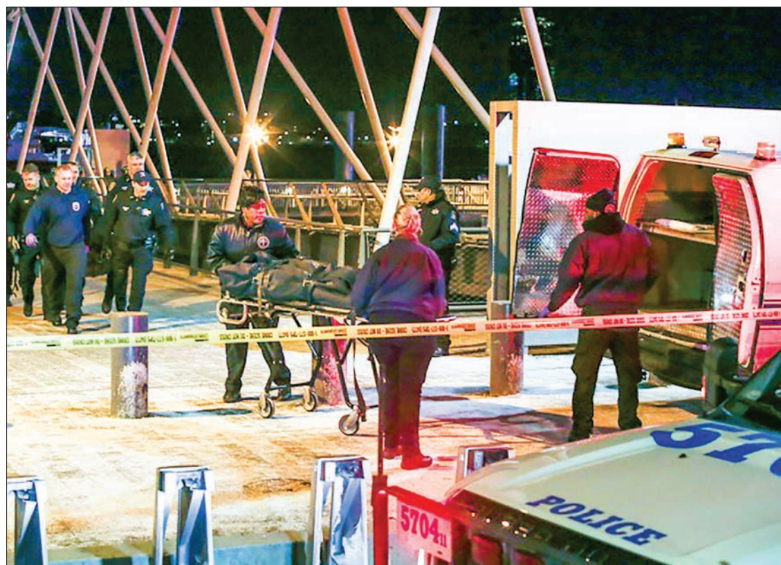
Police officers remove bodies from the scene of a helicopter crash in Manhattan’s East River that left five people dead.

“The citizens do not participate in the choice or the election of the president and we think it’s a decisive moment for the citizens to push a request” to change the electoral system, said Otro18 leader Manuel Costa Morua. —AFP ■