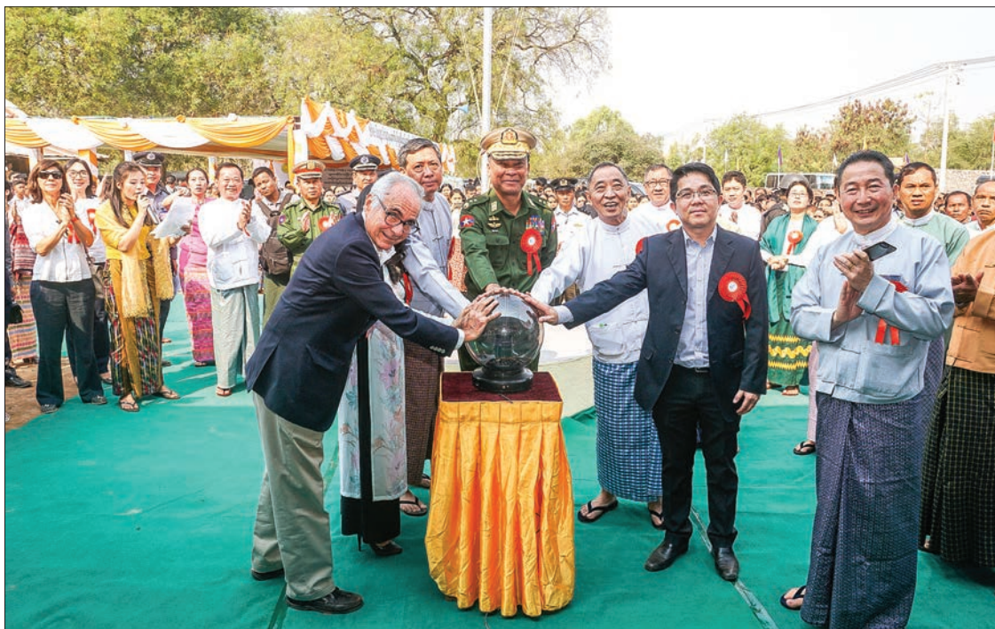
Union Minister Dr Myo Thein Gyi, Union Minister Lt-Gen Kyaw Swe and officials open Basic Education middle School in Nyaung-U Township, Mandalay Region.

Afterwards, the donors presented air-conditioners, computers, water treatment machine and other relevant materials for the school.—Myanmar News Agency ■