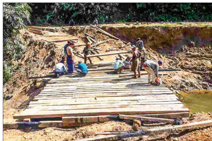
Construction workers repairing roads and bridges on the Myitkyina-Sumprabum-Putao road, Kachin State.

The Tatmadaw columns started clearing the area along the road from 16 February and