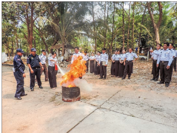
Firefighters perform a variety of duties as required fire prevention at Kayin State Immigration Office, Hpa-an District.

The department also provided awareness training courses in villages, markets, schools, fuel oil stations and