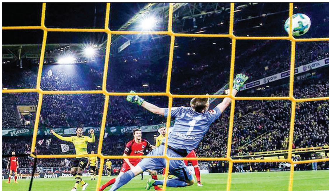
Michy Batshuayi (1st L) of Dortmund scores during the German Bundesliga soccer match between Borussia Dortmund and Eintracht Frankfurt in Dortmund, Germany on 11 March, 2018. Dortmund won 3-2.

The "Eagles" remained unimpressed and pressed forward with the result that Danny Blum snatched a late two-all draw after a low pass to the far post from Danny da Costa in the