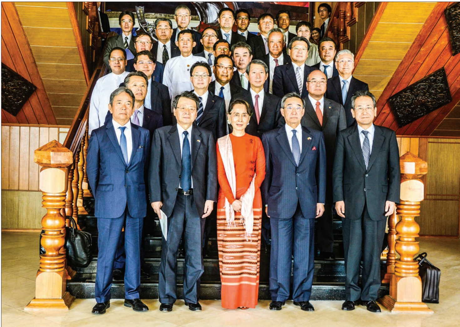
State Counsellor Daw Aung San Suu Kyi and Japanese business delegation pose for documentary photo.