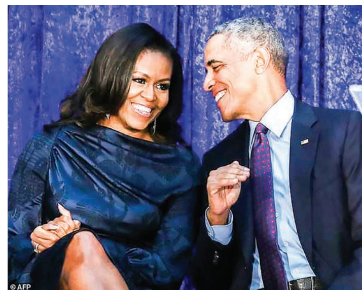
Barack and Michelle Obama would provide Netflix with exclusive content, with the format and number of shows yet to be determined, US media reported.