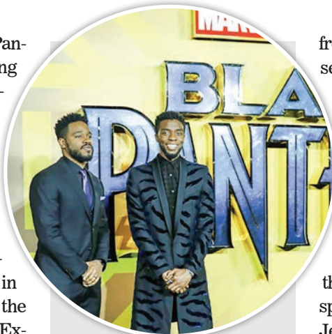
Director Ryan Coogler, left, poses with ‘Black Panther’ star Chadwick Boseman at last month’s London premiere of the movie, which is continuing to set box-office records.

“A Wrinkle in Time,” a science fantasy adventure that celebrates diversity and powerful women, took in $33.3 million for its opening weekend. Analysts said that was something of a