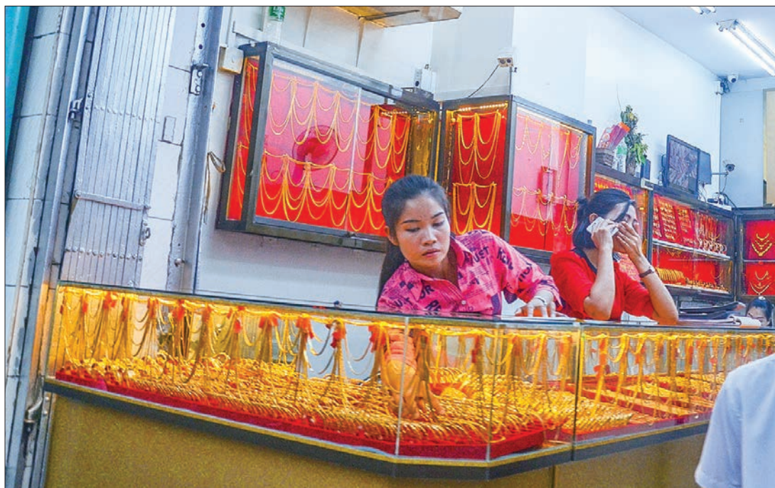
Gold being displayed at a jewellery shop.