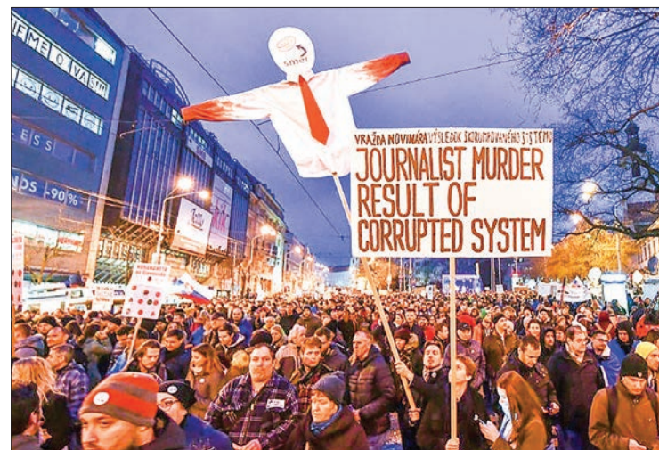
Following the journalist's murder, some 40,000 people gathered in Bratislava to protest against the government in Slovakia's biggest demonstration in nearly two decades.

On Friday, some 40,000 people gathered in Bratislava to protest against Fico and his government, making it Slovakia's biggest protest since the 1989 Velvet Revolution that toppled Communism in former Czechoslovakia.—AFP