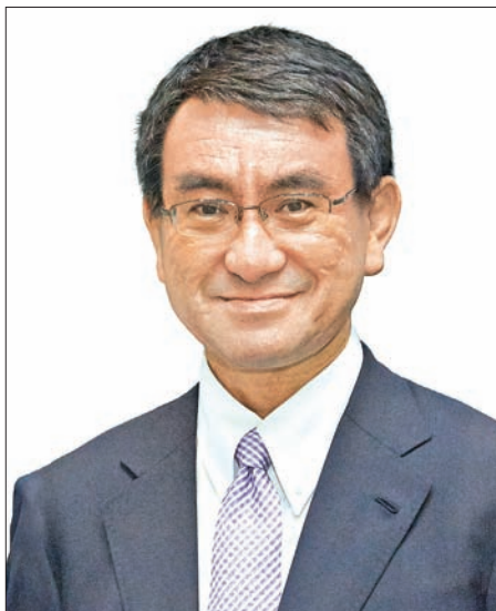
Japanese Foreign Minister Mr. Toro Kono

I am convinced that Japan's assistance will contribute to advancing the efforts of the Government and the people of Myanmar.—Myanmar News Agency ■