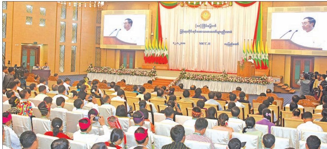
Vice President U Myint Swe delivers an opening speech at the 18 th Myanmar Traditional Medicine Practitioners Conference in Nay Pyi Taw yesterday.

Myanmar Traditional Medicine, which is the traditional heritage of the Myanmar people,