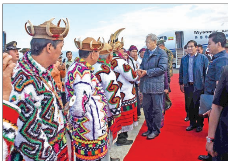
President U Htin Kyaw and First Lady Daw Su Su Lwin arrive at the PutaO airport, Kachin State.