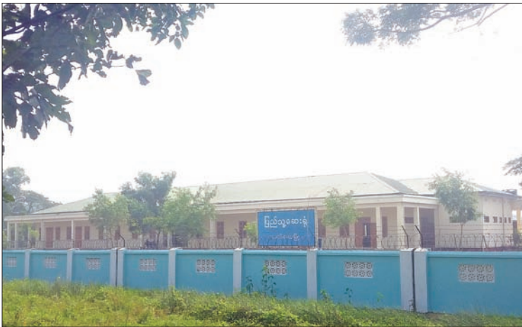
Maungtaw Town People's Hospital.