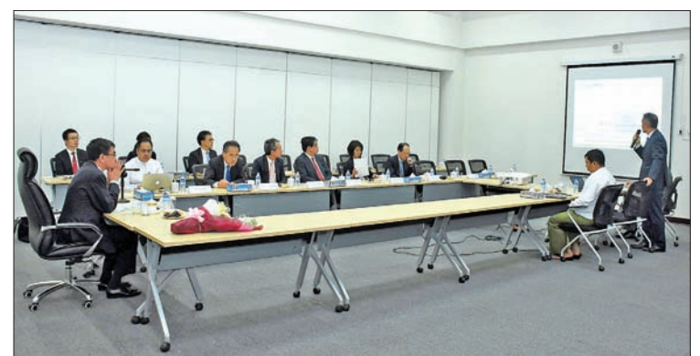
Japan Thilawa Development CEO explains to Japanese Foreign Minister Mr. Taro Kono about the Thilawa Project.

In the evening, the Japanese Foreign Minister and delegation arrived at Melia Hotel in Yangon and met with Japanese business groups. —Myanmar News Agency ■