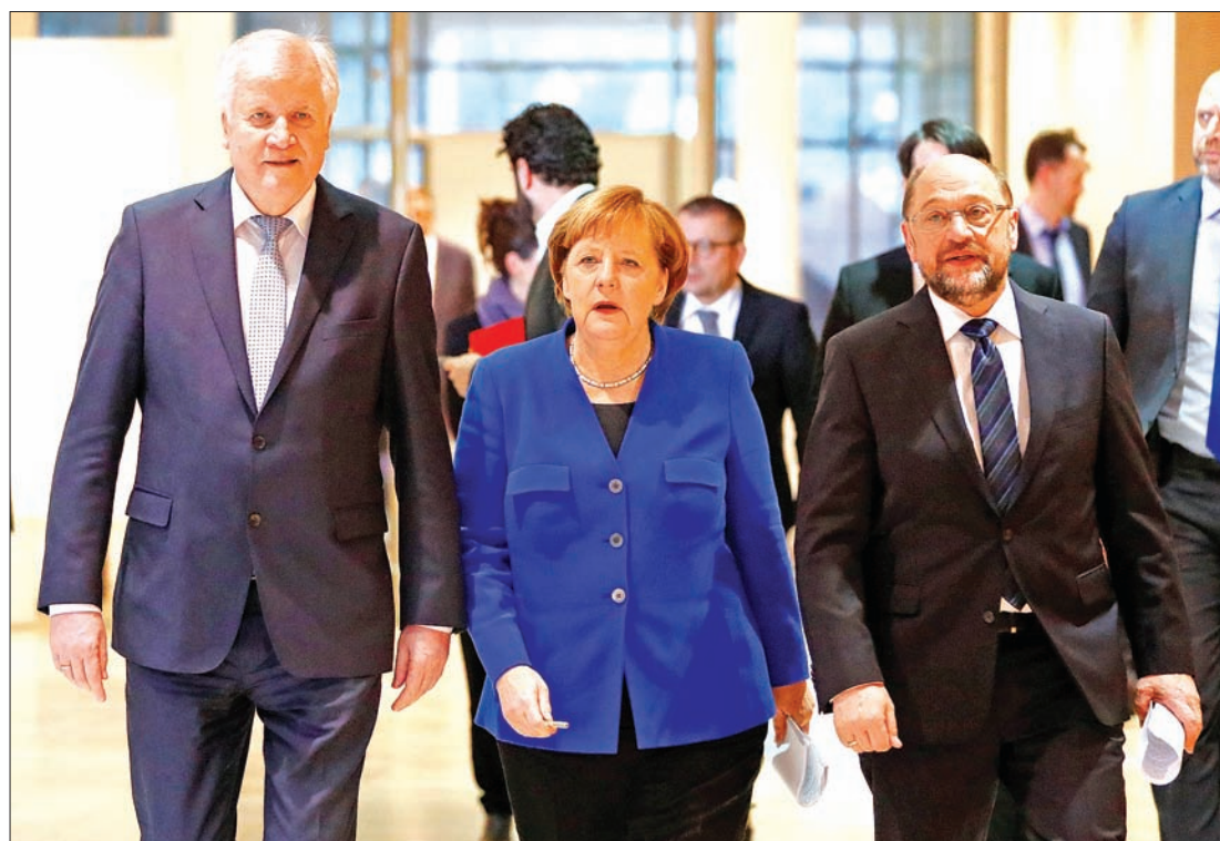
Acting German Chancellor Angela Merkel, leader of the Christian Social Union in Bavaria (CSU) Horst Seehofer and Social Democratic Party (SPD) leader Martin Schulz arrive for a press conference after exploratory talks about forming a new coalition government at the SPD headquarters in Berlin, Germany, on 12 January 2018.

"We have felt since the elections that the world will not wait for us, and in particular... we are convinced we need a new call for Europe," Merkel, who has played a central role tackling crises over the euro and refugees, said after exploratory talks that had run through the night. A 28-page blueprint pledged close co-operation with France to strengthen the euro zone. It also contained a promise, apparently targeting Saudi Arabia, a major buyer of German arms, not to export arms to countries involved in the war in Yemen.