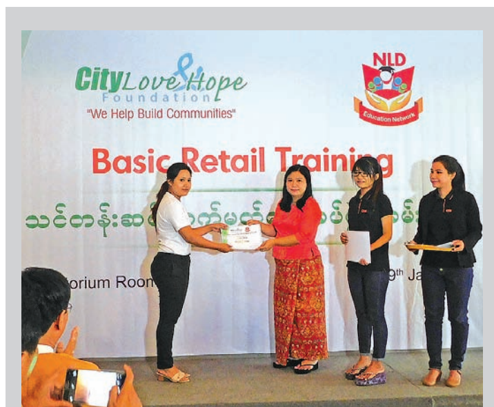
One hundred trainees received retail service and social skills at the 3 rd Basic Retail Training Course (3/2017) which concluded last month, according to City Mart Holding Co Ltd which conducted the training joining hands with City Love & Hope Foundation and NLD education Network. The training course started from 6 November 2017 and concluded on 9 December conferring certificates on qualified 100 trainees.