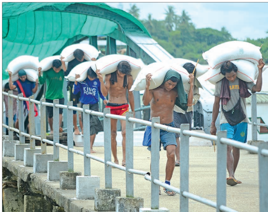
Workers unload sacks of rice from a ship at a jetty in Yangon.

The ministry is working to expand trade through regional and international cooperation, adopt export promotion measures and enhance trade by means of advanced ITCs, formulate trade policies in line with the market economic system, and improve the trade environment under its trade policy objectives.—Shwe Khine ■