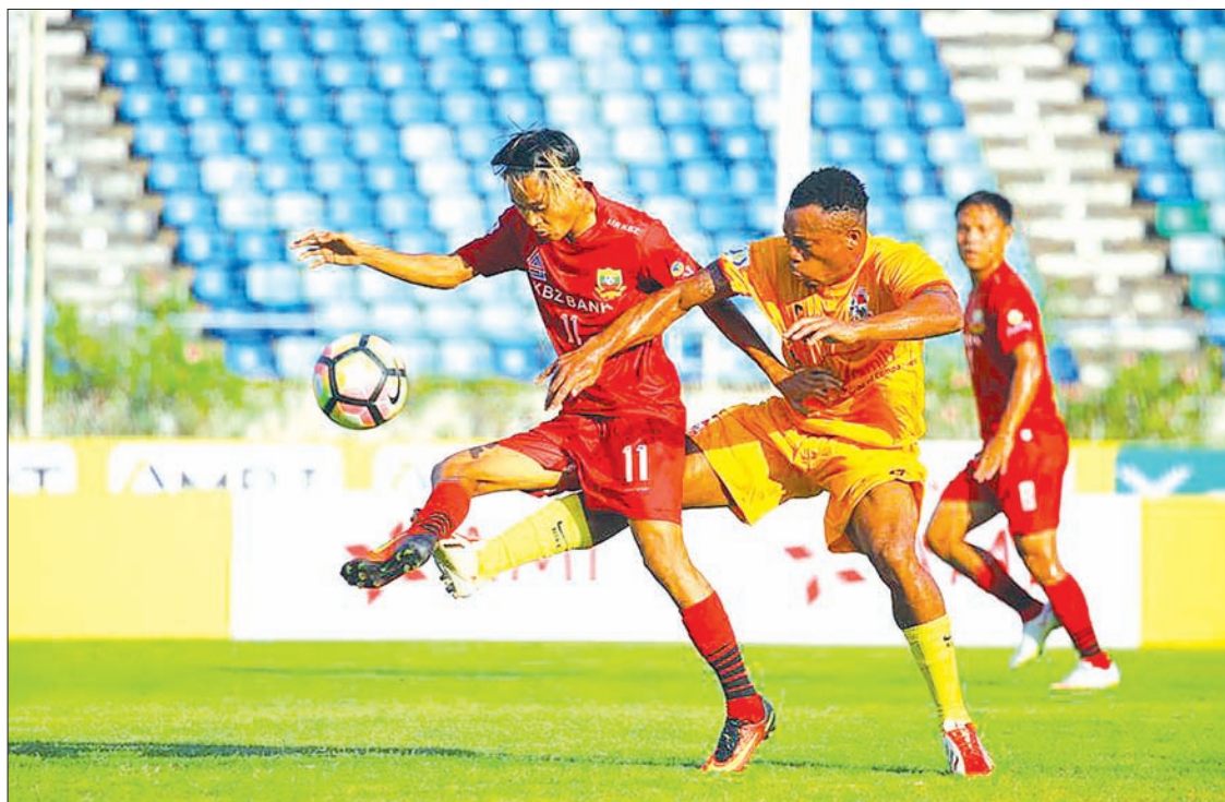
Players from Shan United and Zwegapin United vie for the ball at yesterday's match in Thuwunna Stadium.