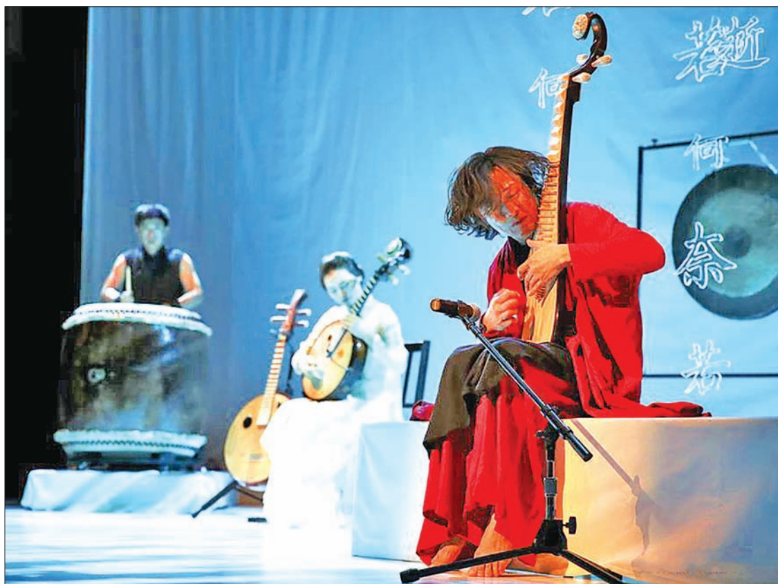
Yu Bing (R), a pipa (a four-stringed Chinese lute) player, performs Chinese music theater "Overload" at Asia Society in New York city, on 11 January 2018. Chinese music theater "Overload", a music-focused, interdisciplinary performance, was staged on Wednesday and Thursday at Asia Society in New York City.