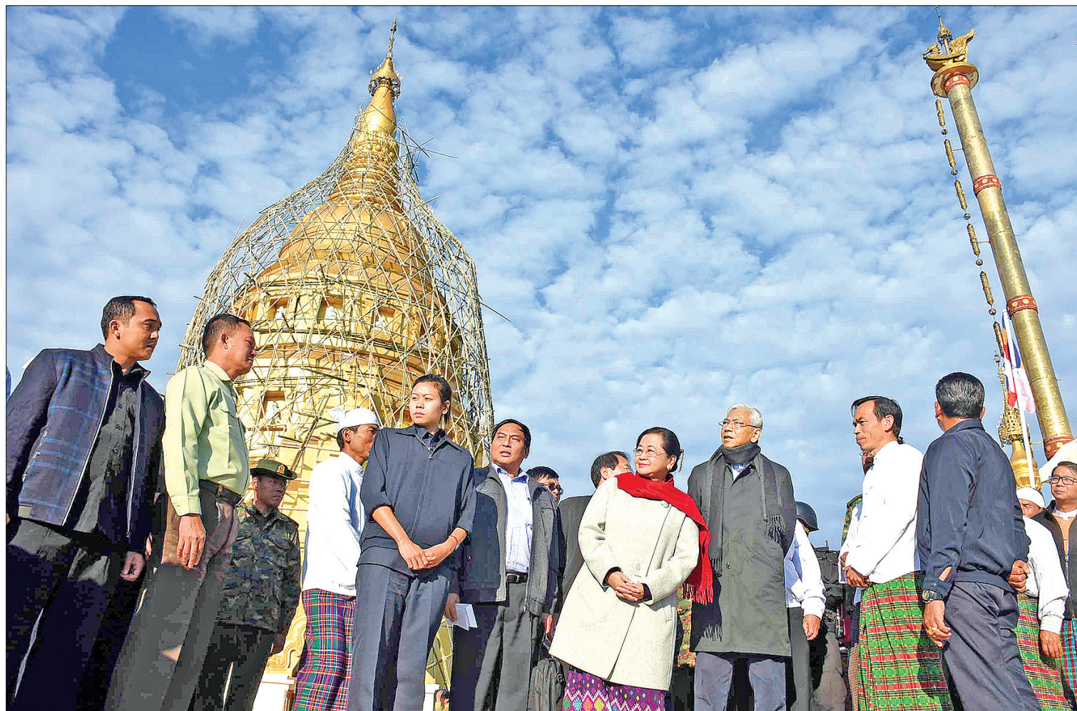
President U Htin Kyaw and First Lady Daw Su Su Lwin look around Kaunghmulon Pagoda in Machanbaw, Kachin State.