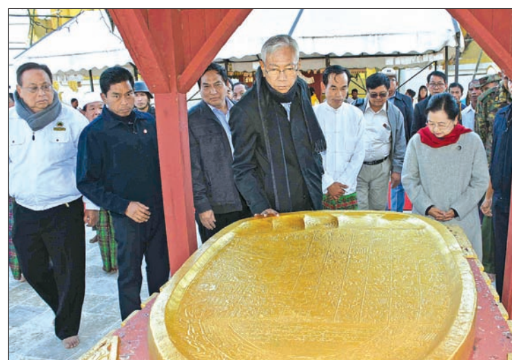
President U Htin Kyaw and First Lady visit Kaunghmulon (Shwe-Sat-Min) Pagoda, in Machanbaw.