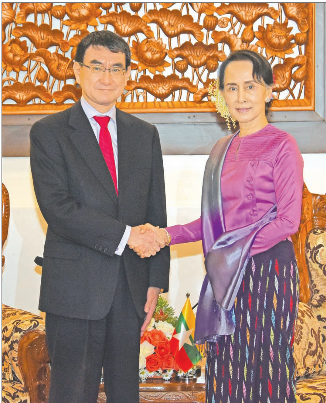
State Counsellor Daw Aung San Suu Kyi welcomes Foreign Minister of Japan Mr. Taro Kono in Nay Pyi Taw yesterday.