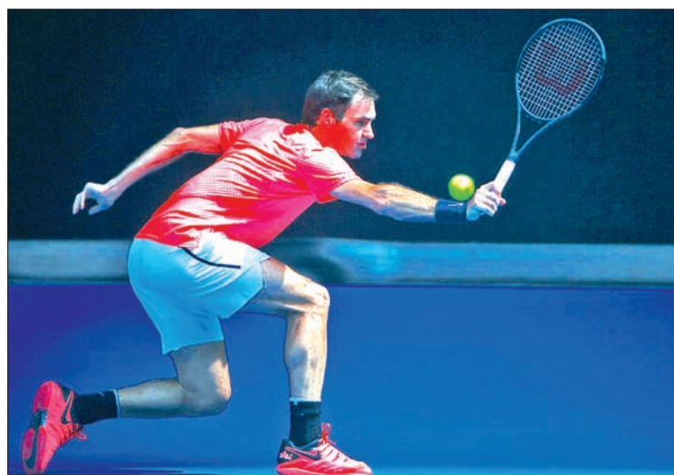
Switzerland's Roger Federer stretches to hit a shot during a practice session on Rod Laver Arena ahead of the Australian Open tennis tournament, Melbourne Park, Melbourne, Australia, on 11 January 2018.

On immediate form, few could argue. Federer, seeded second, arrives for a first round match against mid-ranked Slove-