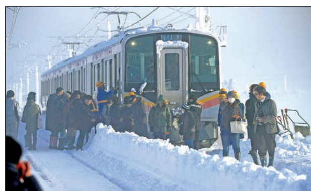
Passengers walk off a train on East Japan Railway Co.'s Shinetsu Line on 12 January, 2018, on which they spent the night after it was stranded between stations by heavy snowfall the night before in Sanjo, Niigata Prefecture.

NIIGATA, (Japan) — Around 430 passengers were forced to stay the night aboard a local train stranded since Thursday evening amid heavy snowfall in Niigata Prefecture on the Sea of Japan coast.