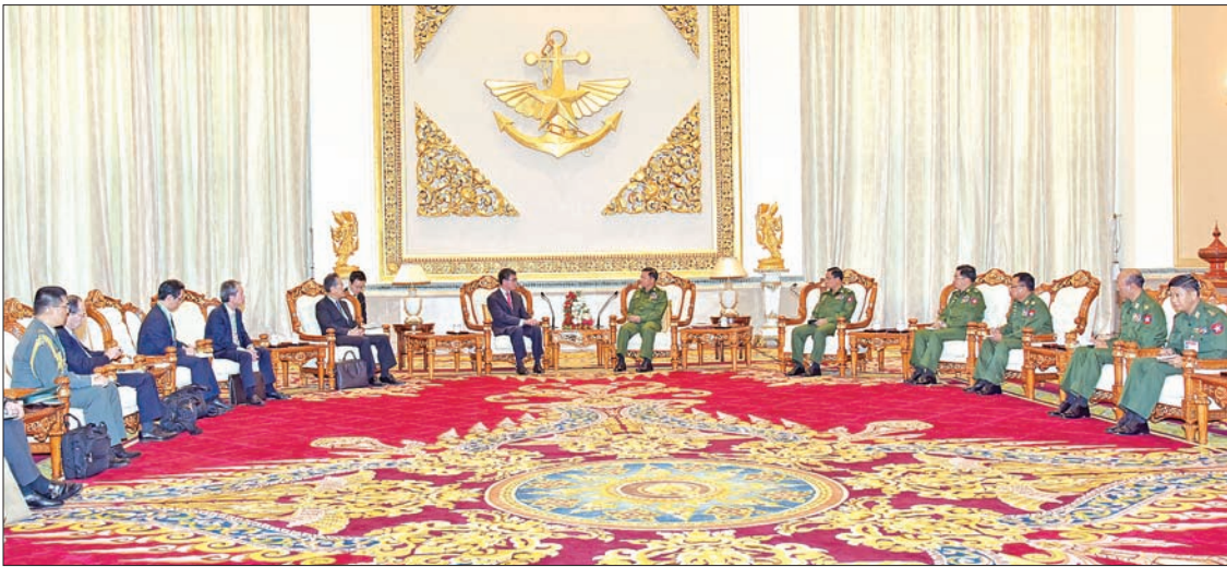
Senior General Min Aung Hlaing meets with Japanese Foreign Affairs Minister Mr. Taro Kono at Zayarthiri Beikman in Nay Pyi Taw yesterday.

On the occasion of the National Day of the Republic of the Union of Myanmar, I would like to convey to Your Excellency my congratulations and sincere wishes for your personal well-being and for the progress and prosperity of the people of Myanmar.