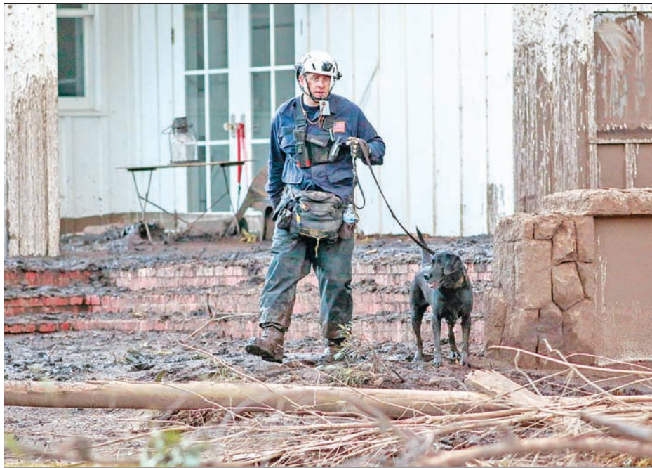
A search and rescue worker with a dog scours through properties after a mudslide in Montecito, California, US, on 11 January 2018.