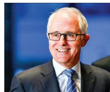
Australian Prime Minister Malcolm Turnbull had long resisted calls for an inquiry, but mounting political pressure forced his hand.

The issue, which China characterizes as a dispute between Washington and Pyongyang, is attracting international attention as a major security concern.—Kyodo News