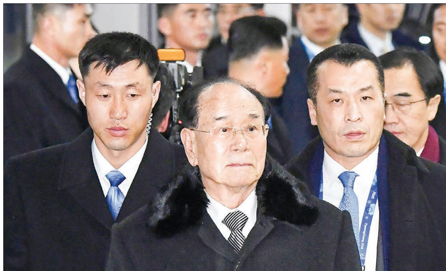
Kim Yong Nam (C), president of the Presidium of the Supreme People's Assembly of North Korea, arrives at Gangneung Station in South Korea on 10 February, 2018, to watch a women's preliminary round ice hockey game between the unified Korean team and Switzerland at the Pyeongchang Winter Olympics.

While it can authorise police to apply for search warrants and witnesses who fail to appear may be arrested, it is not able to order compensation to those affected by any wrongdoings.—AFP