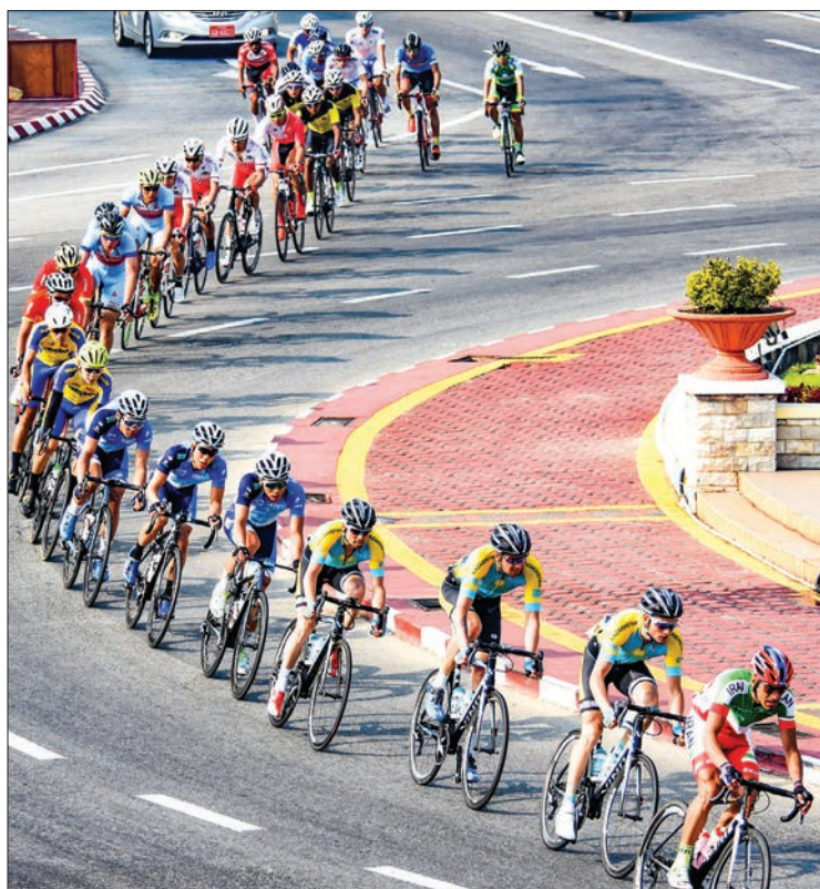
Cyclists compete in the Individual Road Race Men Elite competition at the 2018 Asia Road and Para Cycling Championships.

China came in second with 3 gold and 2 silver medals, while Hong Kong came in third with 2 gold, 5 silver and one bronze medal. ■