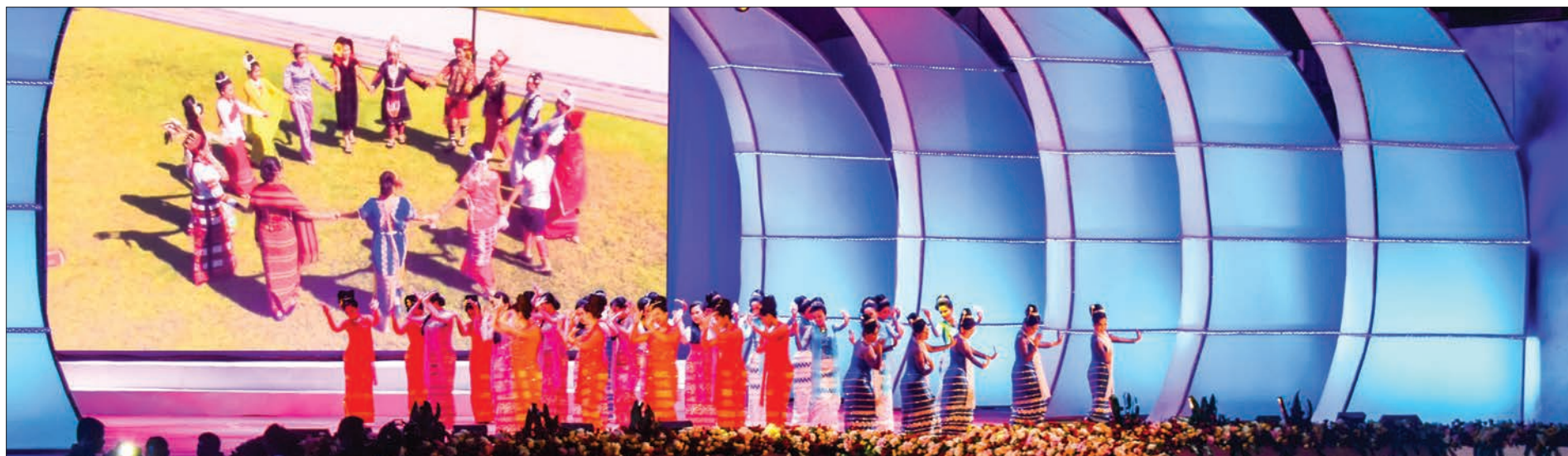
Cultural dance troupe performs at the dinner in commemoration of 71 st Anniversary Union Day in Nay Pyi Taw yesterday.