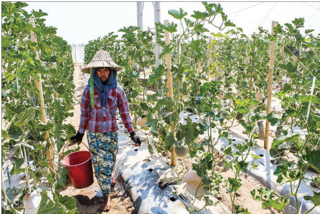
A farmer works in the muskmelon farm in Nay Pyi Taw.