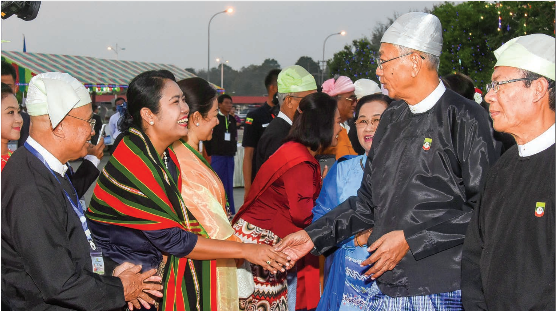
President U Htin Kyaw and wife welcome MPs who attend the dinner in commemoration of 71 st Anniversary Union Day in Nay Pyi Taw.