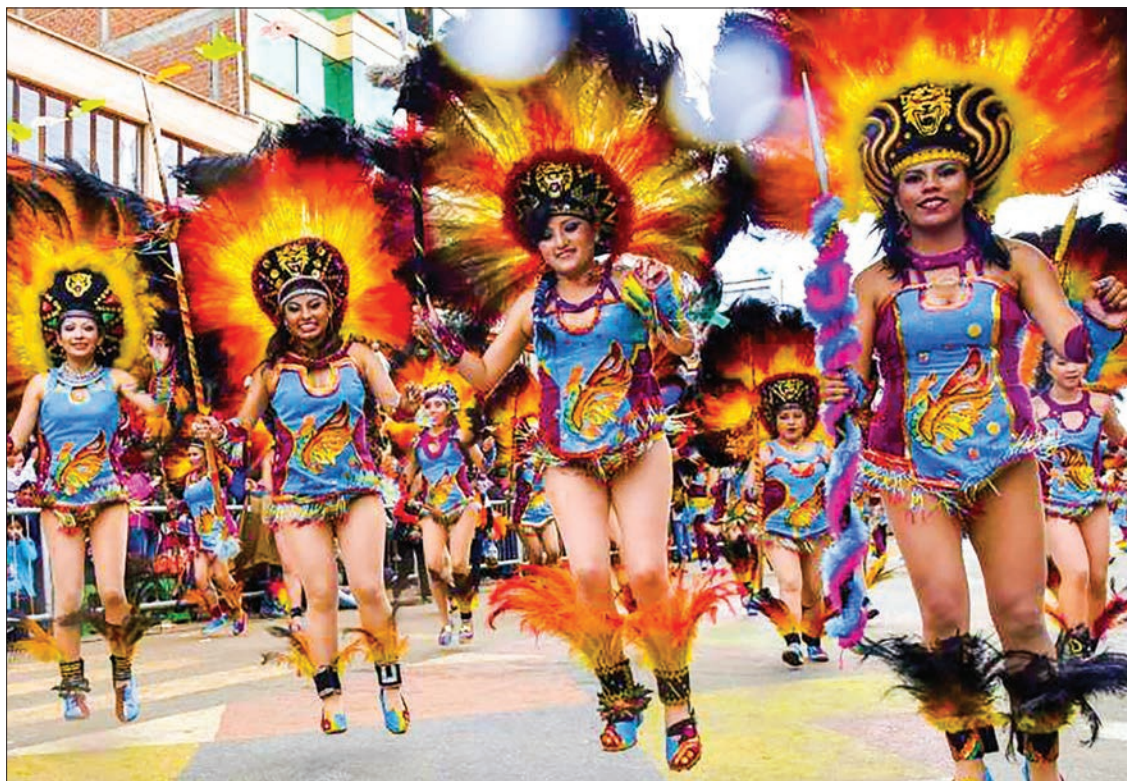
Dancers take part in Oruro Carnival.

In 2001, the UNESCO cultural organization declared the carnival an intangible cultural heritage of humanity.—AFP ■