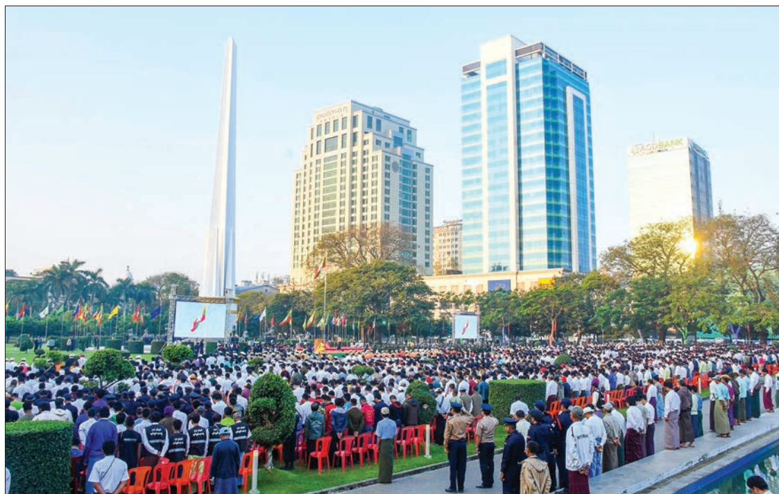
Attendees salute the State Flag at the 71 st Anniversary Union Day celebration in Yangon yesterday.

Present at the ceremony were Yangon Region Chief Minister U Phyo Min Thein, Yangon Region Hluttaw Speaker U Tin Maung Tun, Yangon Region Command Commander Maj-Gen Thet Pone, Yangon Region High Court Chief Judge U Win Swe, the Yangon Region Hluttaw Deputy Speaker, Yangon Region government members, Yangon Region Advocate, Yangon Region Auditor, high ranking Tatmadaw officers, departmental personnel, members of civil service organisations, ethnic nationals, students and members of the public numbering 3,090. ■