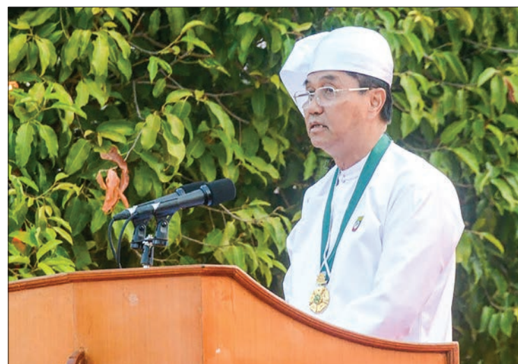
Vice President U Myint Swe reads the message sent from President U Htin Kyaw to 71 st Anniversary Union Day celebration.

Afterwards, the Vice-President and those in attendance saluted the state flag, while the