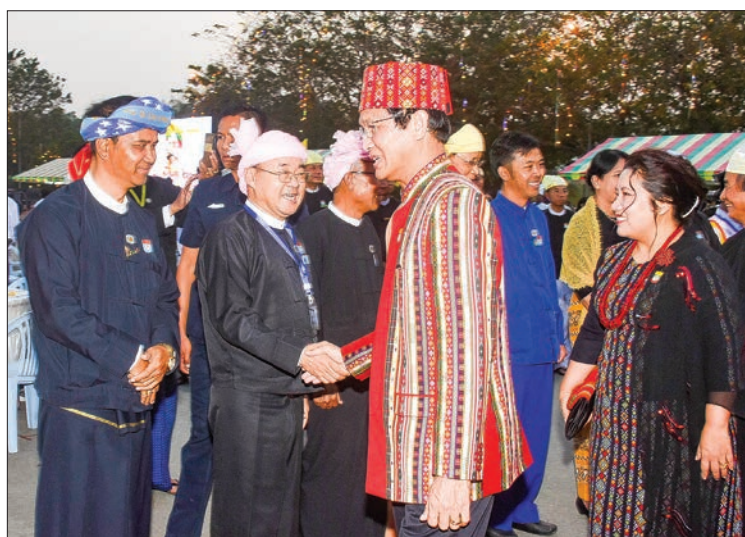
Vice President U Henry Van Thio greets ethnic people who attend the dinner in commemoration of 71 st Anniversary Union Day.