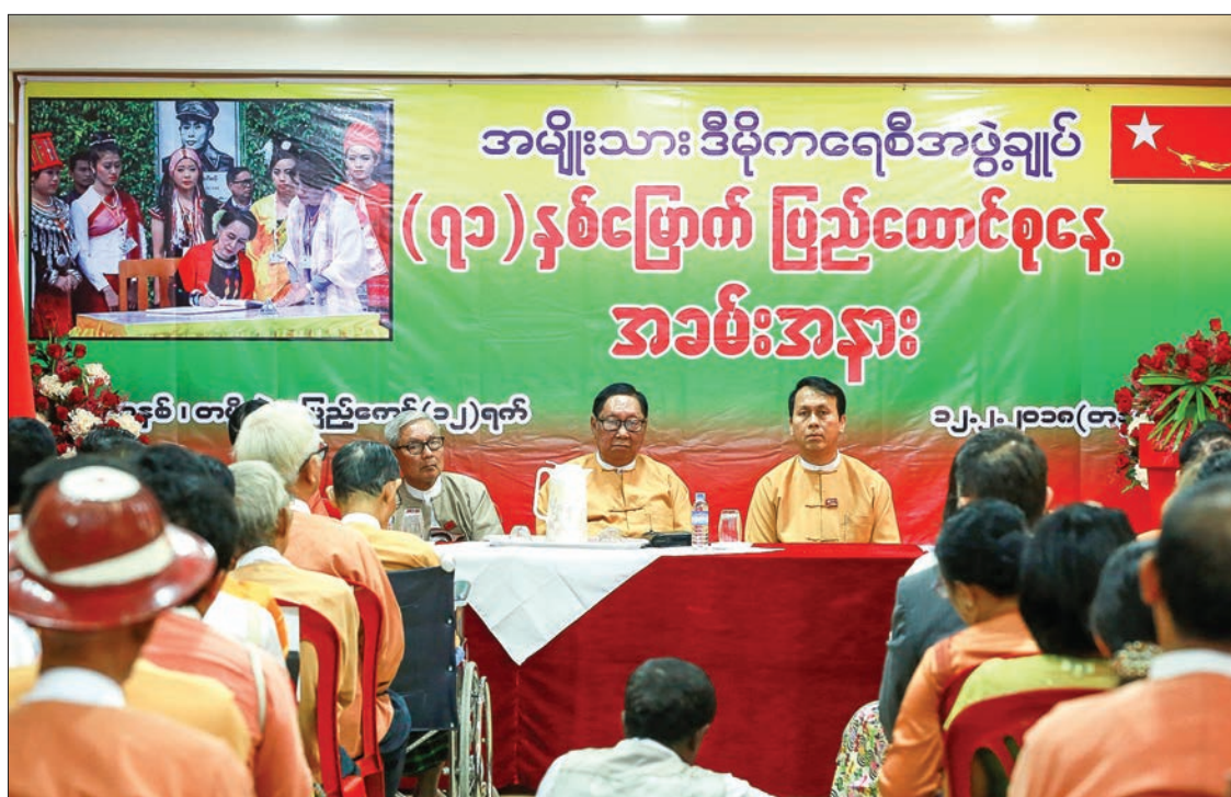
The 71 st Anniversary Union Day ceremony held at the National League for Democracy (NLD) headquarters yesterday.

Afterwards, a four-point 71 st Anniversary Union Day