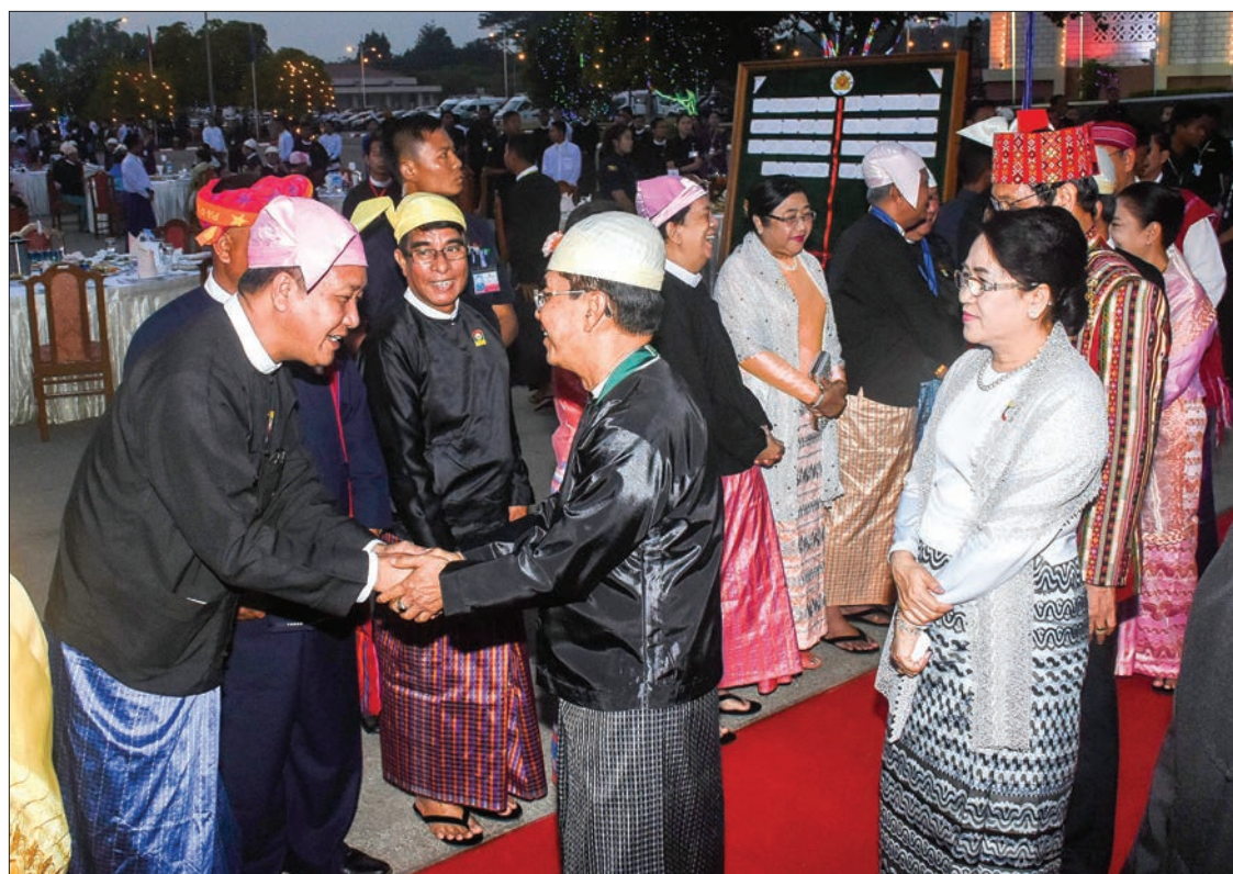
Vice President U Myint Swe greets dignitaries who attend the dinner in commemoration of 71 st Anniversary Union Day.