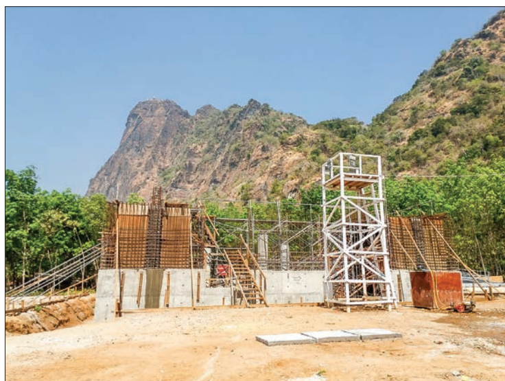
The construction site of Zwekabin cable car project in Kayin State.

He continued that "Zwekabin Mountain is located seven miles south of Hpa-an and is 2,734 feet above sea level.