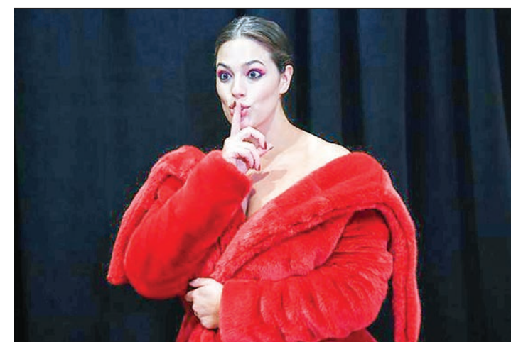
Model Ashley Graham. PHOTO: AFP

"We've been dressing women of shape since day one," Siriano told Fashionista.com in an interview ahead of his show.—AFP ■