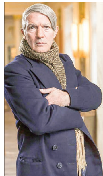
Antonio Banderas as Picasso.

"I cannot compare myself with the most important artist of the 20th century, it would be stupid and ridiculous," said Banderas, who plays the artist in his later years, spending five hours a day in makeup before he steps onto the set.—AFP ■