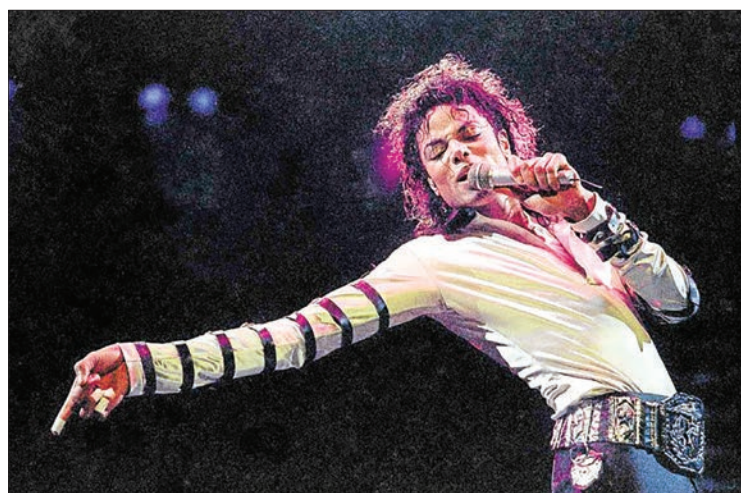
Michael Jackson's own music producer, Quincy Jones, says the late King of Pop plagiarized some of his hits.

"The notes don't lie, man. He was as Machiavellian as they come," the 84-year-old music veteran said. He specifically cited "Billie Jean" — a signature song off the Jones-produced "Thrill-