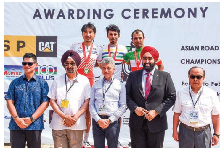
Winners and officials pose for a documentary photo.