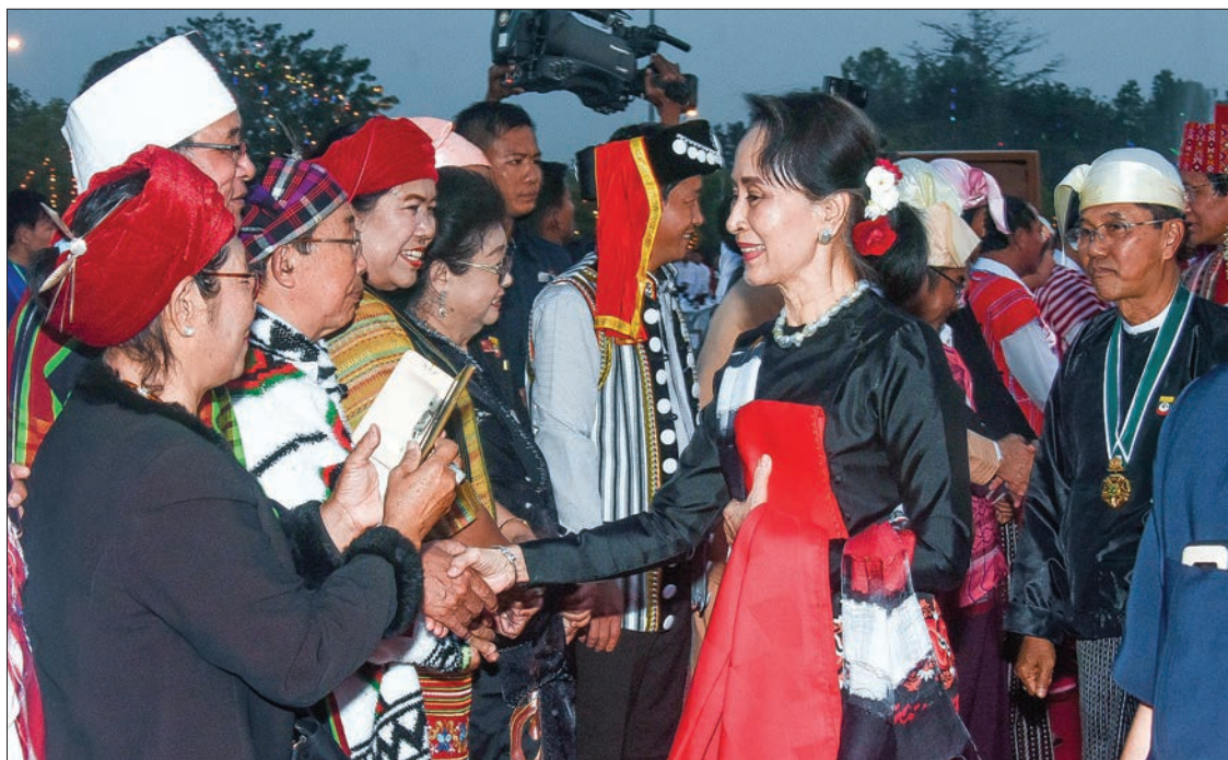
State Counsellor Daw Aung San Suu Kyi greets ethnic people at the dinner in commemoration of the 71 st Anniversary Union Day in Nay Pyi Taw yesterday.

After the dinner, the guests were entertained by artists from the Ministry of Religious Affairs and Culture, Department of Fine Arts and states/regions cultural dance troupes in the City Hall open-air stadium. —Myanmar News Agency ■