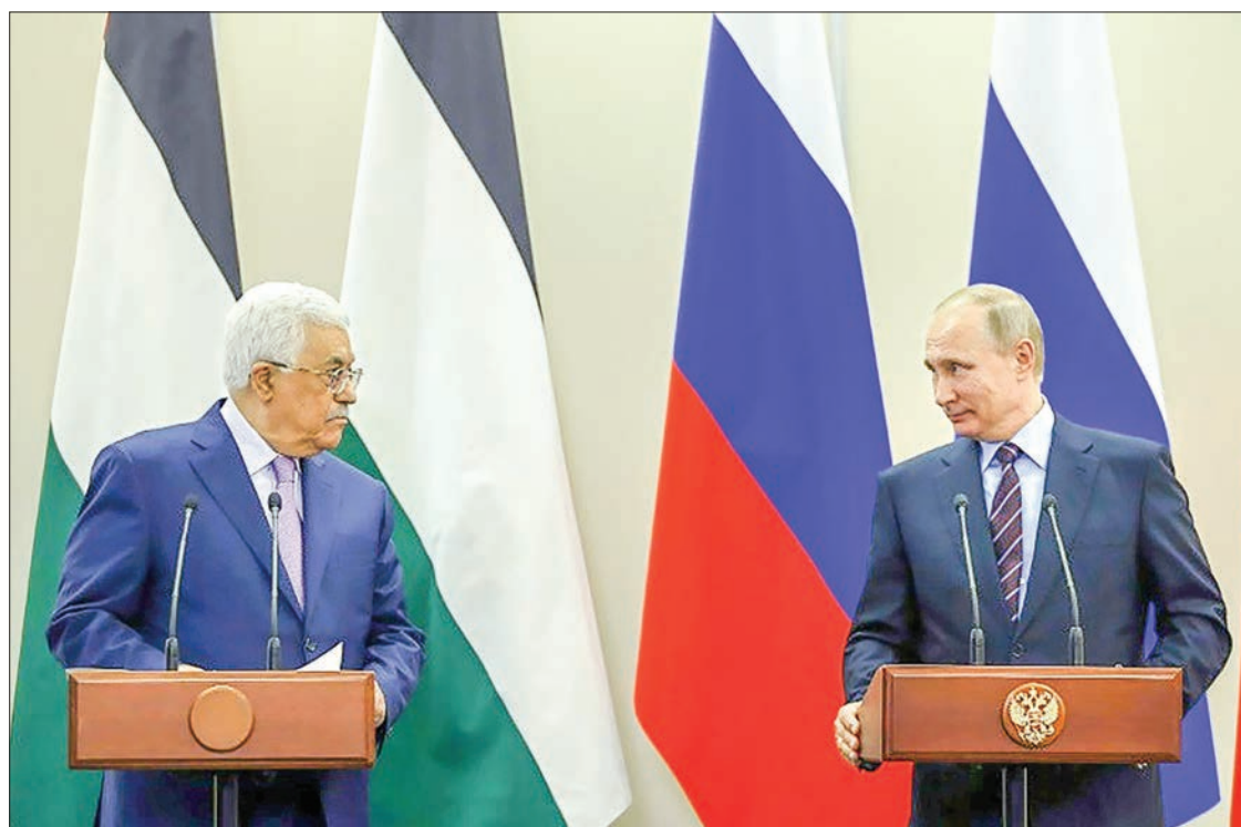
Palestinian leader Mahmud Abbas, pictured here with Vladimir Putin in May 2017, is seeking the Russian president's support following Washington's recognition of Jerusalem as Israel's capital.

The US Ambassador to the UN, Nikki Haley, has accused Abbas of lacking the courage needed to forge a peace deal with Israel.