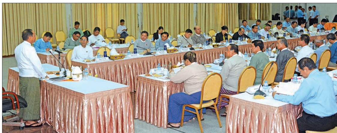
Vice President U Myint Swe delivers the speech at the fifth meeting of the Private Sector Development Committee in Nay Pyi Taw, on 11 October 2017.

The Vice President said advice given at regular meetings