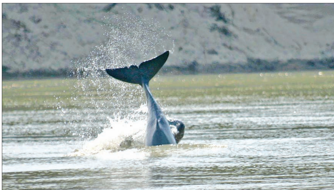
A dolphin is seen in the conservation area near Mandalay.

The extension area will start from the Ayeyawady River