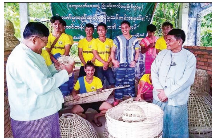
Head of rural development department observes at the closing ceremony of bamboo handicrafts vocational training in Kayin State.

A bamboo plant is purchased Ks 700 and can produce five bamboo chicken mesh covers. A family can make around 10 bamboo chicken mesh cover a day. A family can earn around Ks 13,000 a day as an item of bamboo chicken mesh cover is sold Ks 1300 at trade price. The wholesale buyers have also bought the bamboo products from this village and distributed and sold at the townships of Mawlamyine, Thaton and Kawkaireik. —Nay Myo Lwin (IPRD) ■