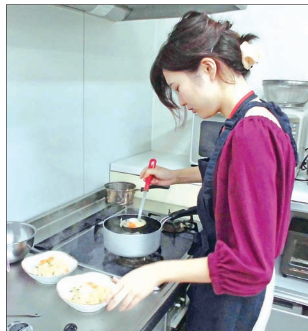
A woman cooks a meal at her home in the city of Shizuoka in central Japan on 11 September 2017, using a food ingredient and seasoning kit delivered by Yoshiike Kaihatsu KK, a Shizuoka-based meal kit delivery company mainly targeting beginners, seniors and homemakers who find it difficult to plan their everyday meals.

koku and Kyushu regions in the southwest. A Sharp official says the company aims at 20 billion yen in yearly sales by fiscal 2020. — Kyodo News ■