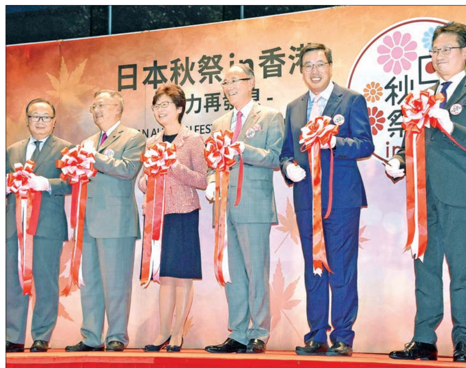
Hong Kong Chief Executive Carrie Lam (3 rd from L) and Japanese Consul General Kuninori Matsuda (3 rd from R) attend an opening ceremony for the second Japan Autumn Festival in Hong Kong on 10 October, 2017. The event is aimed at promoting Japanese popular art, entertainment and food culture in Hong Kong.