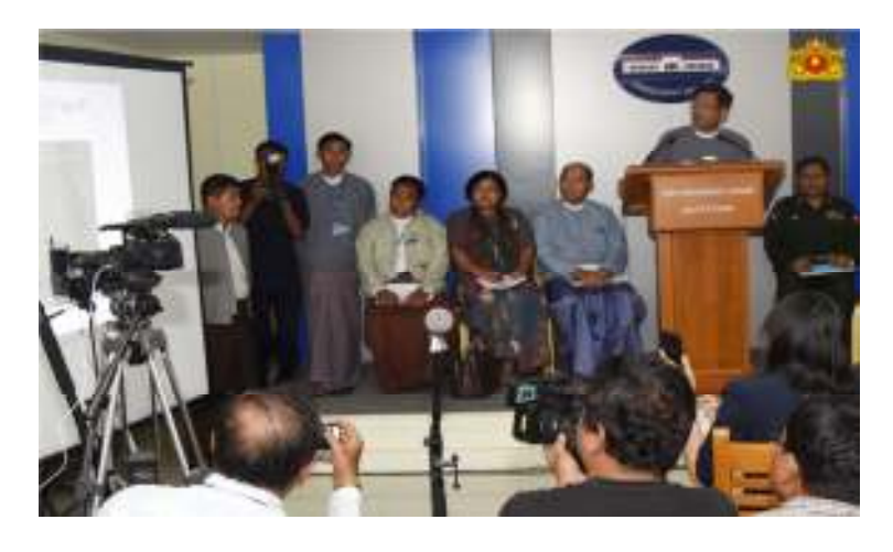
Special press conference was held at the Presidential Palace in Nay Pyi Taw

the actual numbers. Using the same tactic in previous occasion, the attackers set fire on huts in the fields and village houses to demonize the security forces, to deceive international media and community and thereby winning sympathy and assistance from outside.